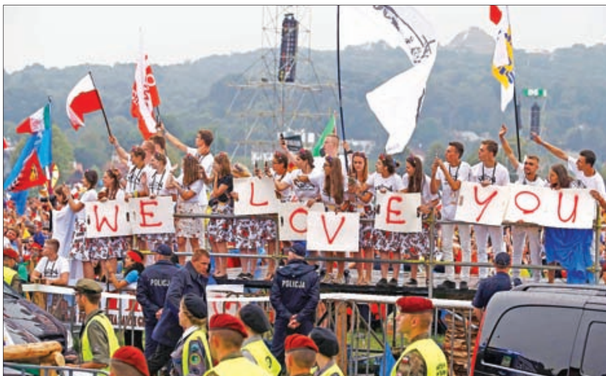
The faithful cheer as they welcome Pope Francis during World Youth Days at Blonia Park in Krakow, Poland, on 28 July 2016.

“A merciful heart opens up to welcome refugees and migrants,” he told the youths gathered in a large field near the city center. Despite being rooted in Christian values, Poland’s conservative