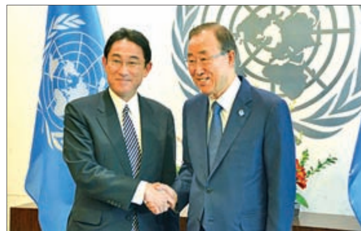
Japanese Foreign Minister Fumio Kishida (L) and UN Secretary General Ban Ki-moon shake hands at the UN headquarters in New York, on 28 July 2016.

Ban expressed his desire to help bring to a successful conclusion the next round of the Tokyo International Conference on African Development to be held in Kenya in late August, the officials said. Ban is scheduled to attend the leaders' summit between Japan