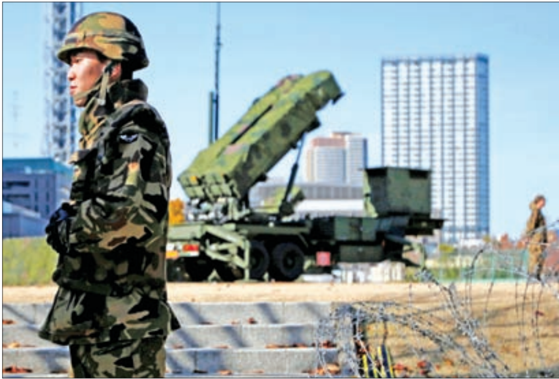
Members of the Japan Self-Defence Forces stand guard near Patriot Advanced Capability-3 (PAC-3) land-to-air missiles, deployed at the Defence Ministry in Tokyo in 2012.

It puts it one step closer to being able to lob a warhead that could plunge to its target at speeds of several kilometres a second,