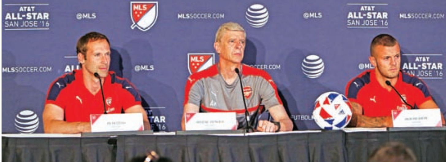
Arsenal head coach Arsene Wenger (middle) with his players Petr Cech (left) and Jack Wilshere (right) during the MLS All Star Game joint press conference at the Fairmont San Jose, in San Jose, CA, USA, on 26 July.

LONDON — Goalkeeper Petr Cech expects manager Arsene Wenger to bring in the right players necessary to improve Arsenal's bid to win a first Premier League title since 2004 without wasting money on panic buys.