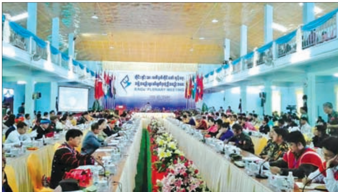
The fourth day meeting of the Ethnic Armed Organizations in Mai Ja Yang.