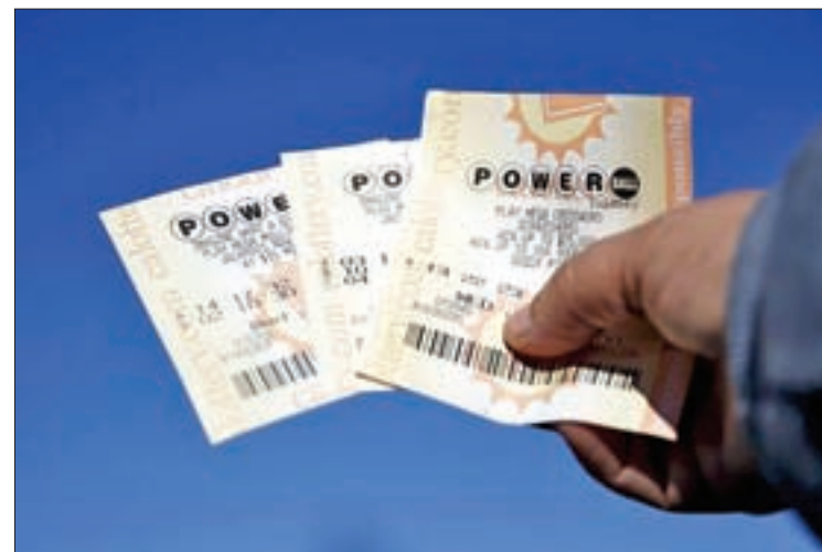
A woman holds Powerball lottery tickets outside Bluebird Liquor in Hawthorne, Los Angeles, California, United States, on 12 January 2016. The Powerball Jackpot has reached a record $1.5 billion. PHOTO: REUTERS

The largest all-time lottery prize offered in North America was a Powerball jackpot worth nearly $1.6 billion for winning tickets sold in California, Tennessee and Florida in January. —Reuters