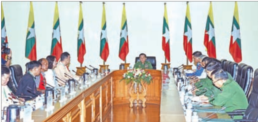
Senior General Min Aung Hlaing holds talks with delegations of Wa State Army (UWSA) and National Democratic Alliance Army-NDAA (Mongla).