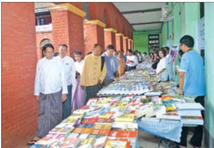
Union Minister Dr Pe Myint visits monsoon book fair.

The three-day reading event will have 18 papers on politics, with six a day, while there are over 160 bookshops at the monsoon book fair.— Ko Moe, Ye Ye Myint, and Ohnma Thant