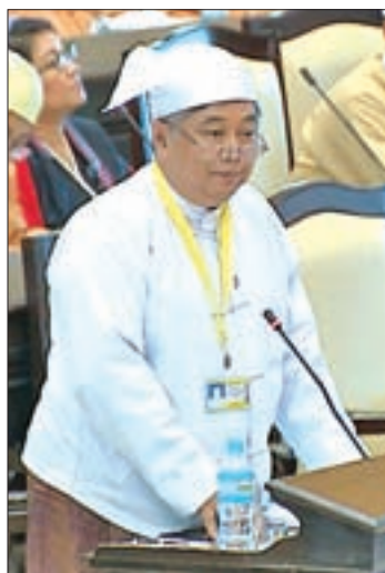
Union Minister U Pe Zin Tun.

SEVENTEEN of 18 villages in Salin, Magwe Region, were covered in the priority phase of the national electrification plan, Union Minister U Pe Zin Tun said yesterday in response to a query at the Amyotha Hluttaw, explaining that the villages were located within a distance of two