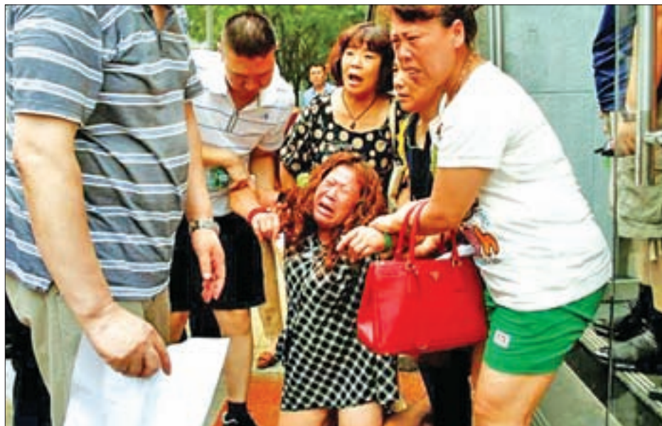
A family member of a passenger aboard Malaysia Airlines flight MH370 which went missing in 2014 reacts during a protest outside the Chinese foreign ministry in Beijing, on 29 July 2016.

"We oppose their decision. We don't recognise it at all. That decision has no reason behind it," said Bo-