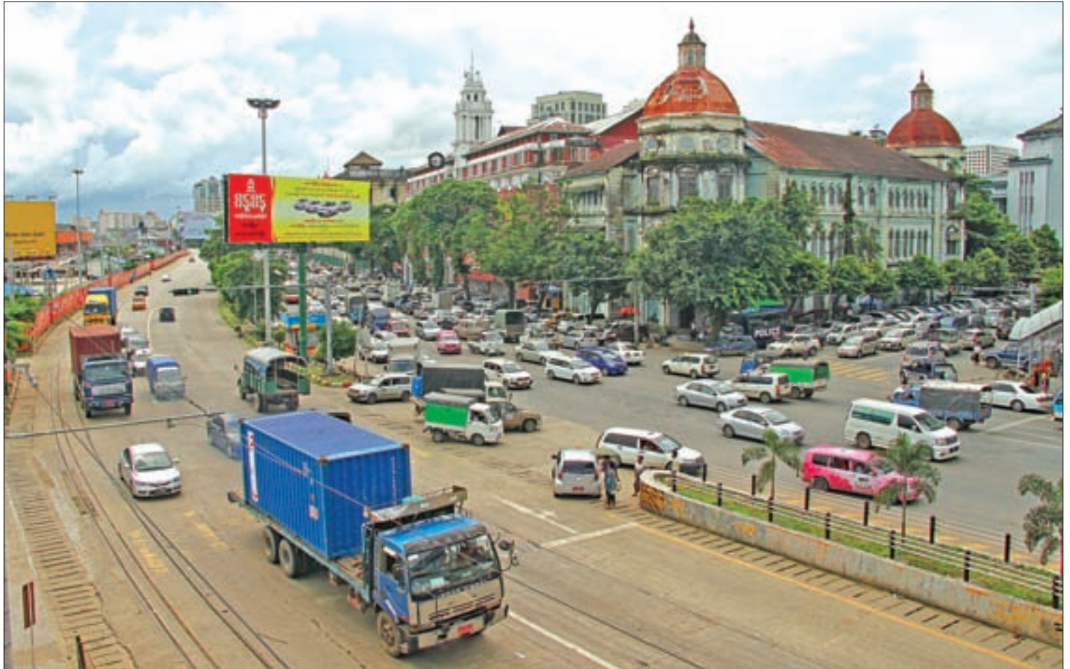
Vehicles being seen on Strand Road in downtown Yangon on 20 July, 2016.

The Internal Revenue Department has been collecting four kinds of taxes and duties, namely income tax, commercial tax, stamp duty and state lottery tax from the 2011-2012 fiscal year onwards.—GNLM