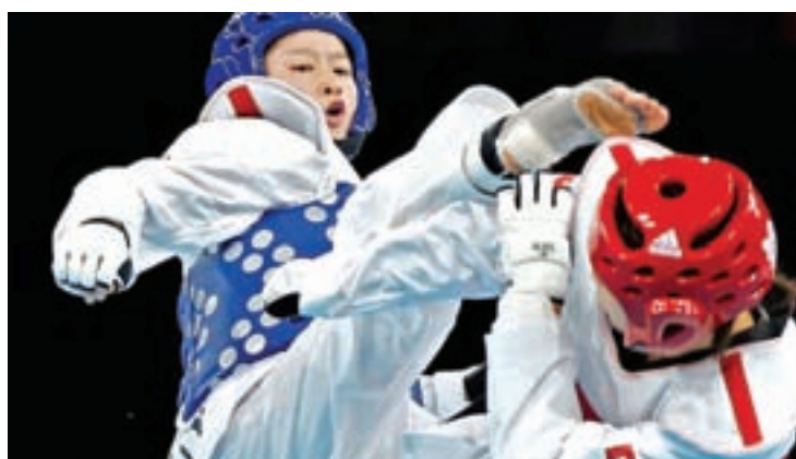
Japan's Erika Kasahara (R) fights against China's Jingyu Wu during their women's -49kg quarterfinal taekwondo match at the ExCel venue during the London Olympic Games, in 2012.

"The introduction of coloured pants for athletes will transform the look of competition, adding to the vibrant, carnival atmosphere in