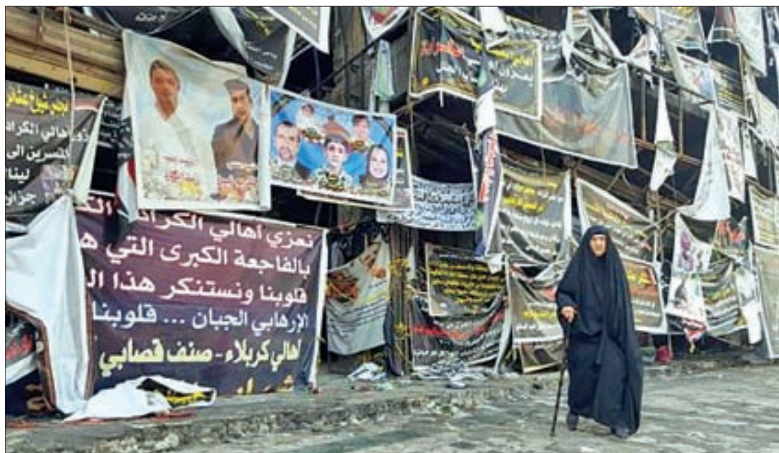
A woman walks past the site of the Karrada suicide bomb attack in Baghdad, Iraq, on 26 July 2016.