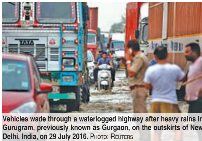
Vehicles waded through a waterlogged highway after heavy rains in Gurugram, previously known as Gurgaon, on the outskirts of New Delhi, India, on 29 July 2016.