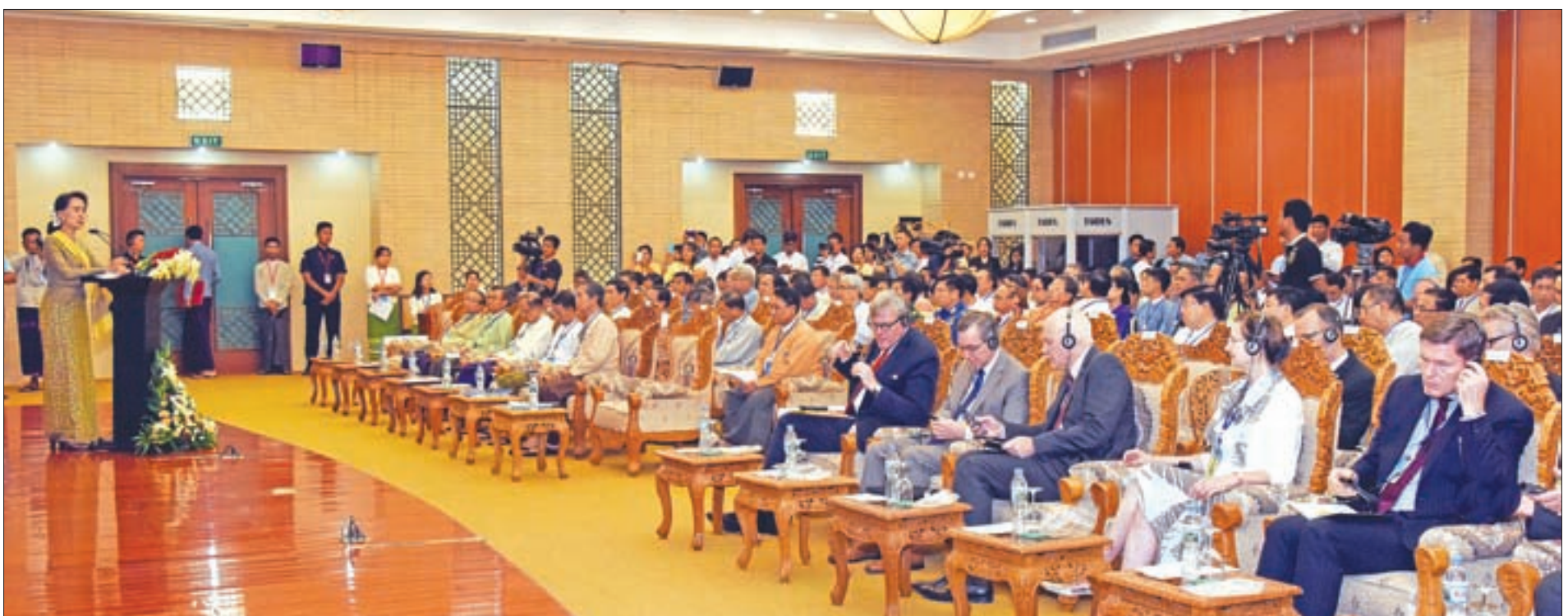
State Counsellor Daw Aung San Suu Kyi speaks at the ceremony to release the Economic Policy in Nay Pyi Taw.

THE Union government released its economic policy yesterday, highlighting national reconciliation and job creation as basic considerations for the policy which guarantees nationwide equitable development.