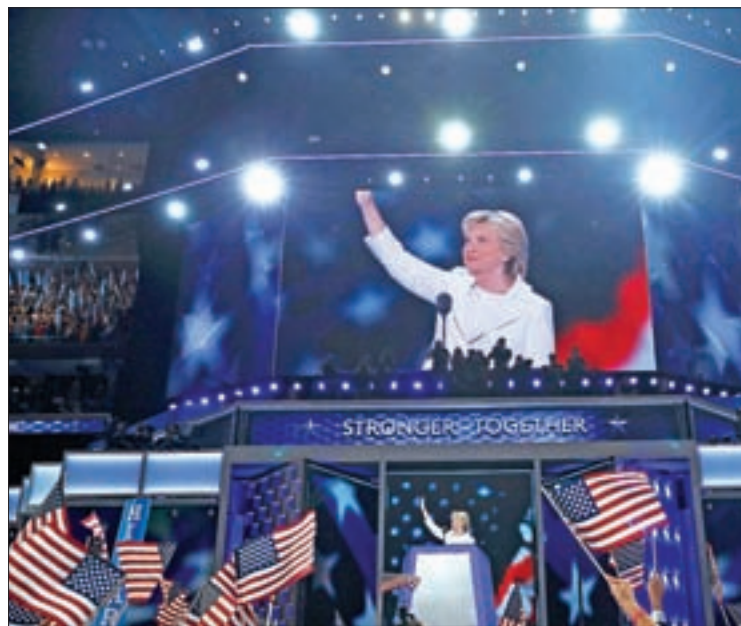
Democratic US presidential nominee Hillary Clinton accepts the nomination on the fourth and final night at the Democratic National Convention in Philadelphia, Pennsylvania, US, on 28 July, 2016.

But the problem is that "Mr. Trump doesn't know the facts of these relationships nor appreciates the degree to which state-