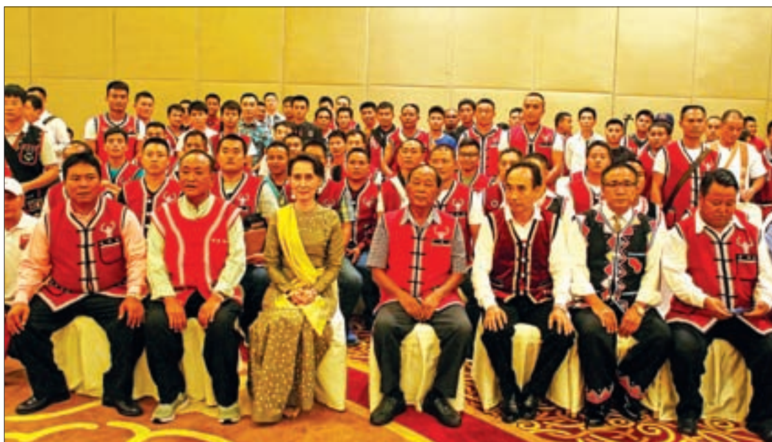
Daw Aung San Suu Kyi poses for photo with youths and leaders of Wa.