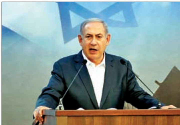
Israel's Prime Minister Benjamin Netanyahu speaks during a memorial ceremony for soldiers killed during the 2014 Gaza conflict, at a military cemetery on Mount Herzl in Jerusalem, on 26 July 2016.