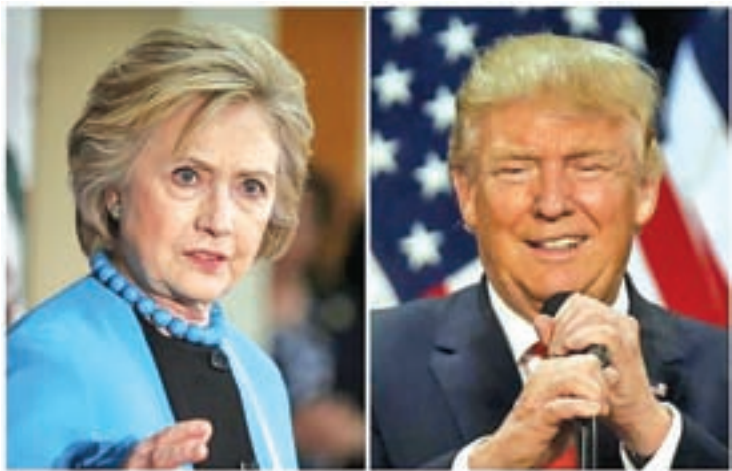
A combination photo shows US Democratic presidential candidate Hillary Clinton (L) and Republican US presidential candidate Donald Trump (R) in Los Angeles, California on 5 May 2016 and in Eugene, Oregon, US on 6 May 2016 respectively.