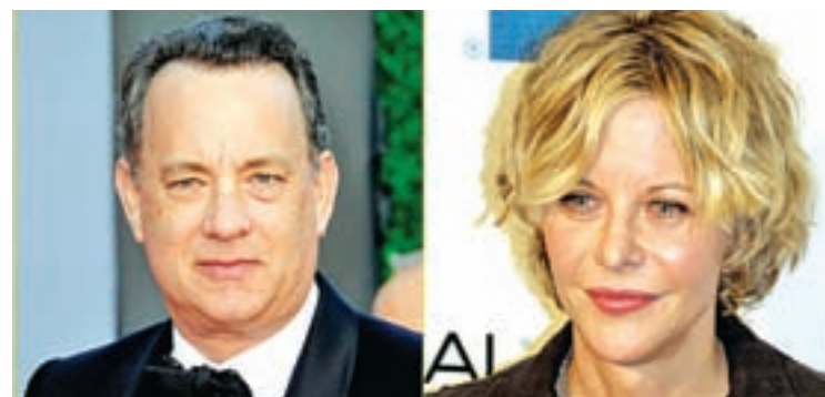
Tom Hanks and Meg Ryan.