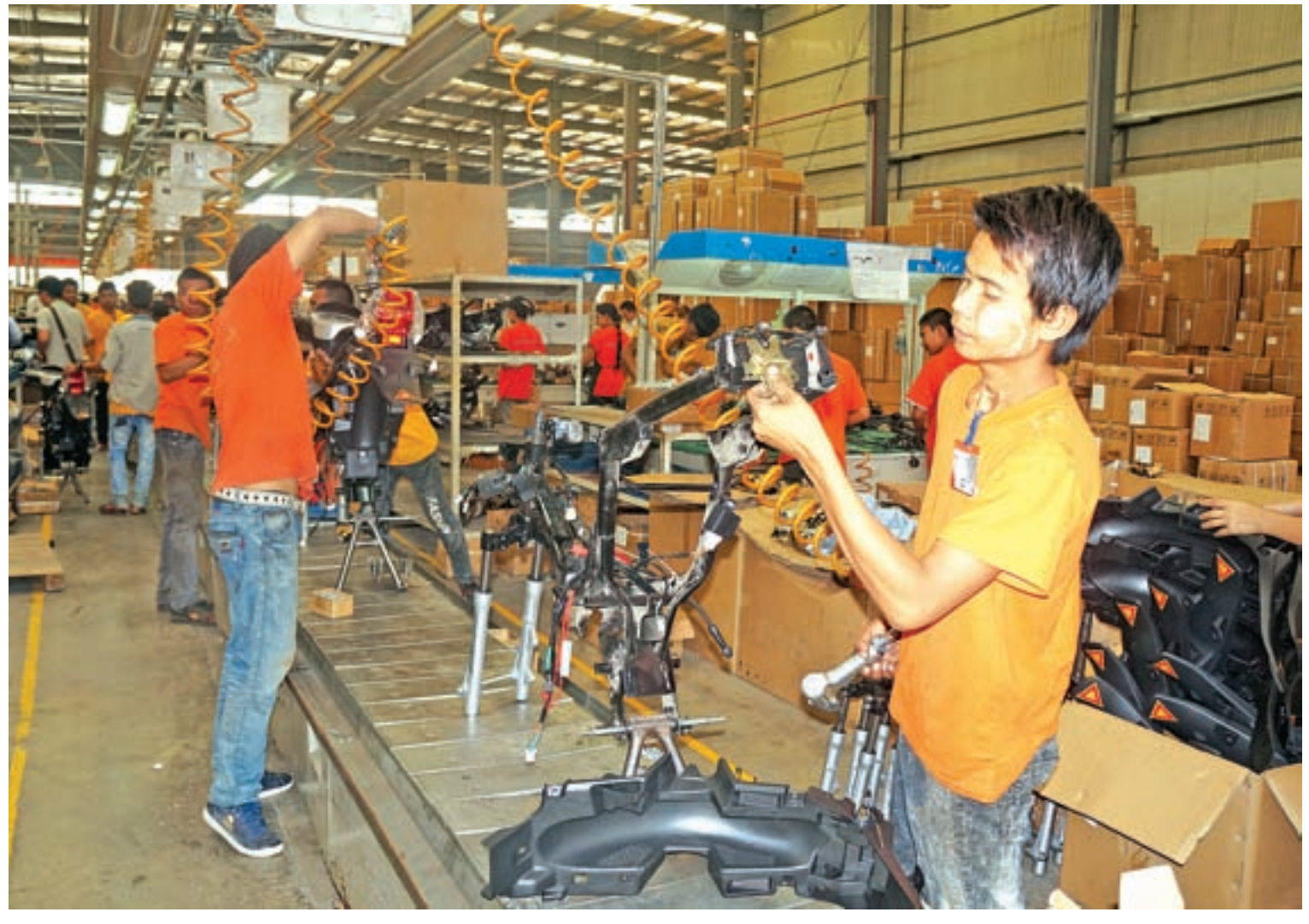
Workers install parts for the new motorbikes at a factory in Ruili, Yunnan Province, China.

Over 1,000 India-made motorbikes entered the country via Myanmar-India border town in the past three months. The number is less than the same period last fiscal year.