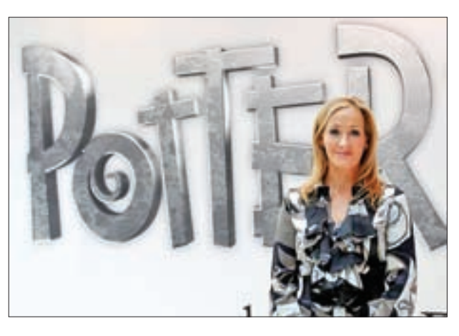
British author JK Rowling, creator of the Harry Potter series of books, poses during the launch of new online website Pottermore in London in 2011.

NEW YORK— Harry Potter is casting a spell, again, over the publishing industry.