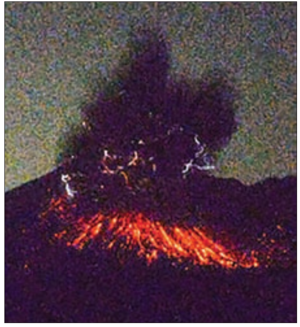
Photo taken on 26 July, by an unattended remote camera installed in the southwestern Japan city of Tarumizu shows the Sakurajima volcano having an explosive eruption to spew volcanic ash 5,000 metres into the sky.

KAGOSHIMA — The Sakurajima volcano in southwestern Japan had an explosive eruption early Tuesday, spewing volcanic ash 5,000 metres into the sky, the Japan Meteorological Agency said.