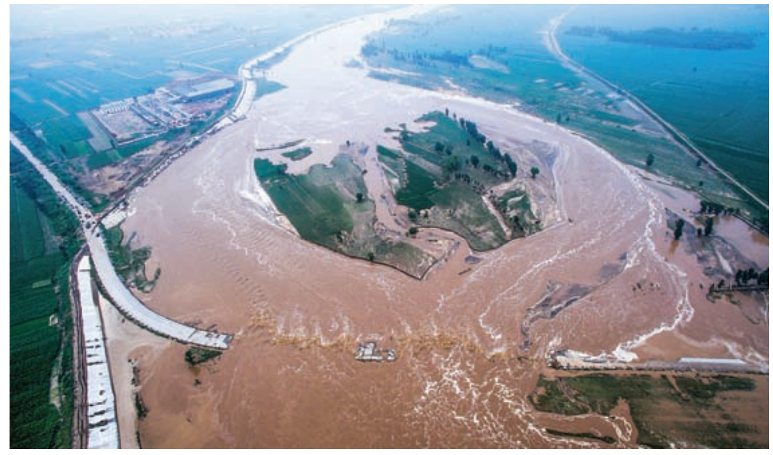
An aerial view shows that roads and fields are flooded in Xingtai, Hebei Province, China, on 21 July 2016.

Separately, the government on the southern island province of Hainan issued a typhoon warning for a tropical storm that is expected to hit in the early hours of Wednesday.—Reuters