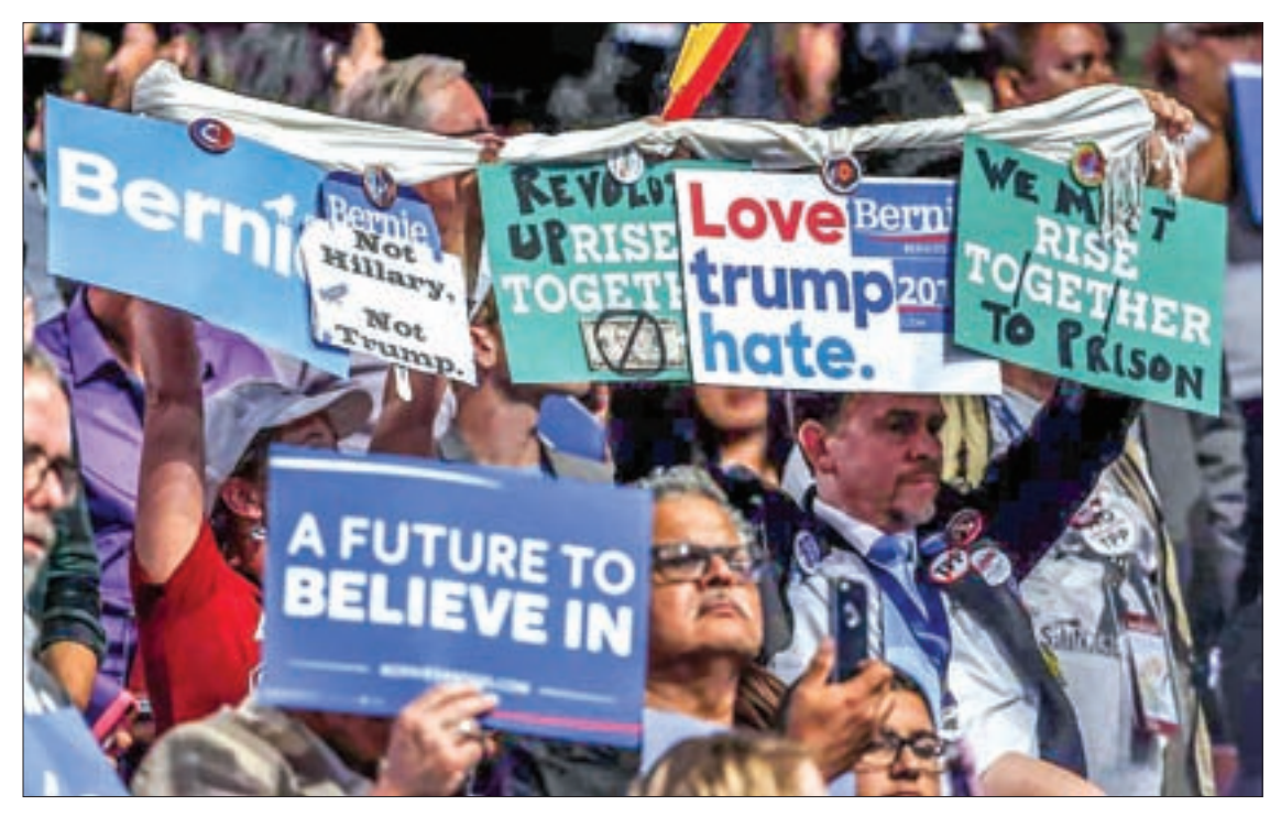
Delegates wave anti-Hillary Clinton signs while Senator Bernie Sanders (D-VT) addresses the Democratic National Convention in Philadelphia, Pennsylvania, US on 25 July, 2016.

PHILADELPHIA — The Democratic Party's deep divisions were on full display on a raucous first day of its convention on Monday, with Bernie Sanders portraying Hillary Clinton as a fellow soldier in his fight for economic equality while his supporters booed the mere mention of her name.