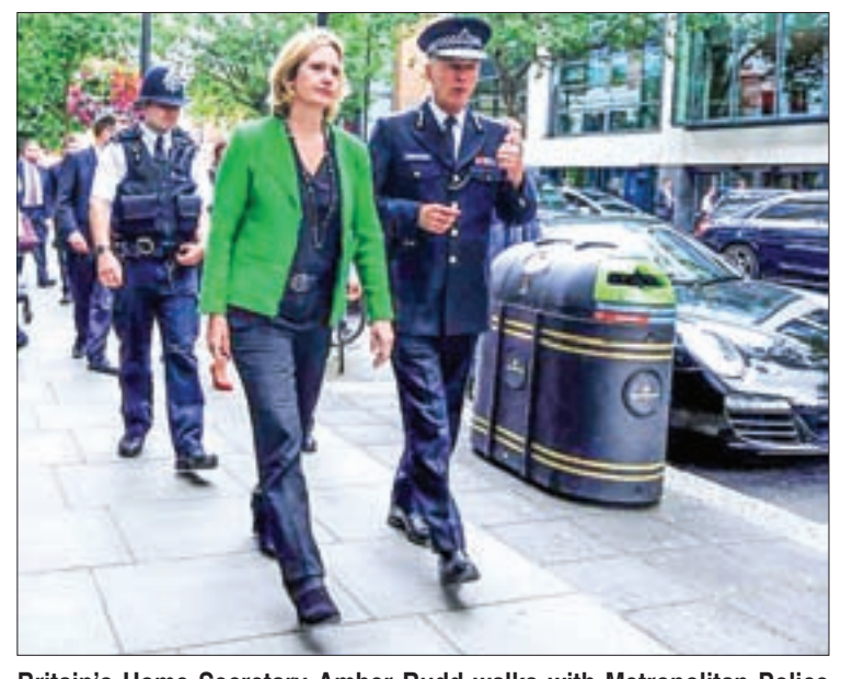
Britain's Home Secretary Amber Rudd walks with Metropolitan Police Commissioner Sir Bernard Hogan-Howe in Westminster, London, on 14 July, 2016.

The government will provide 2.4 million pounds ($3.14 million) of funding to provide security measures and equipment for places of worship that need increased protection, following concerns from religious communities over crimes from graffiti to arson attacks.-Reuters