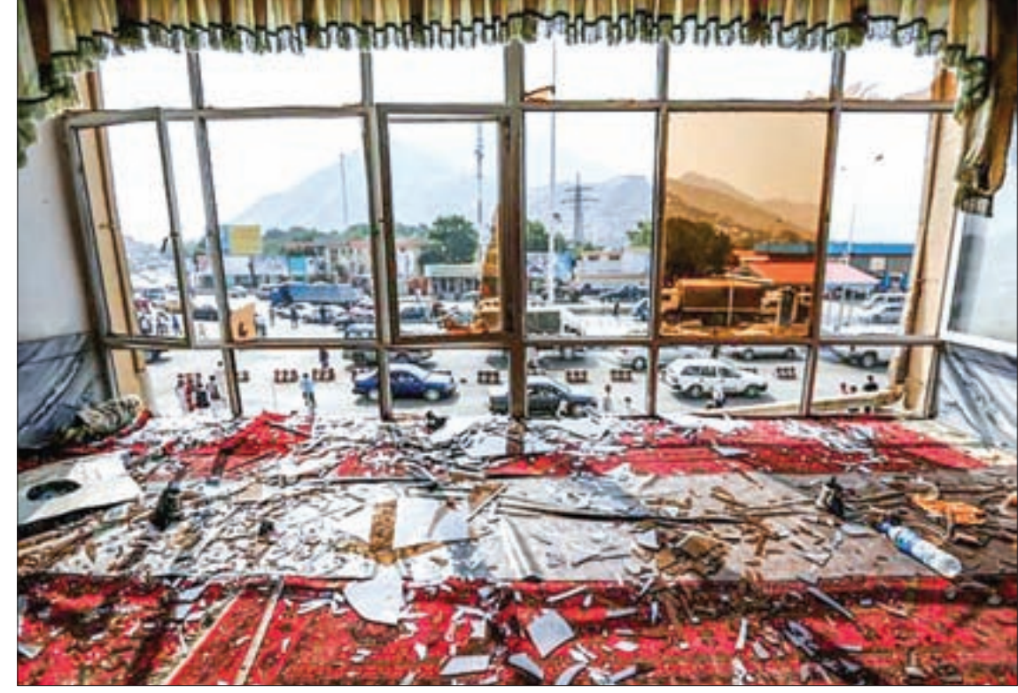
Broken glass and debris are seen inside a restaurant a day after a suicide attack in Kabul, Afghanistan.

"Unless they stop going to Syria and stop being slaves of Iran, we will definitely continue such attacks," he told Reuters via telephone from an undisclosed lo-