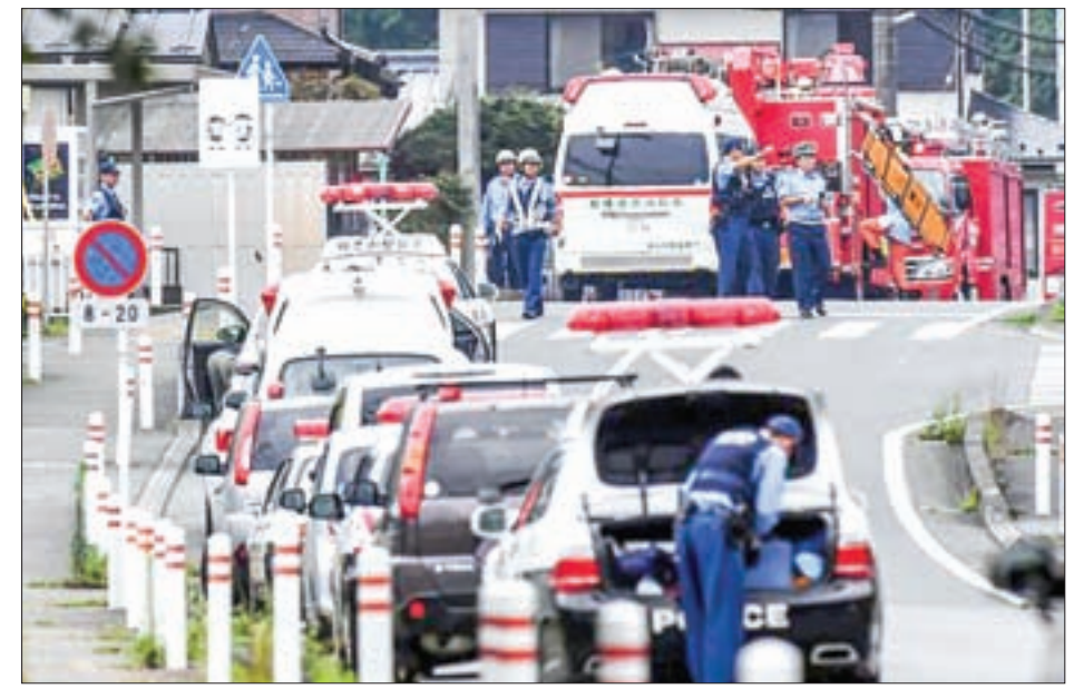
Police officers are seen near a facility for the disabled where at least 19 people were killed and as many as 20 wounded by a knife-wielding man, in Sagamihara, Kanagawa prefecture, Japan, in this photo taken by Kyodo on 26 July 2016.

The police arrested Uematsu, who is currently unemployed, on suspicion