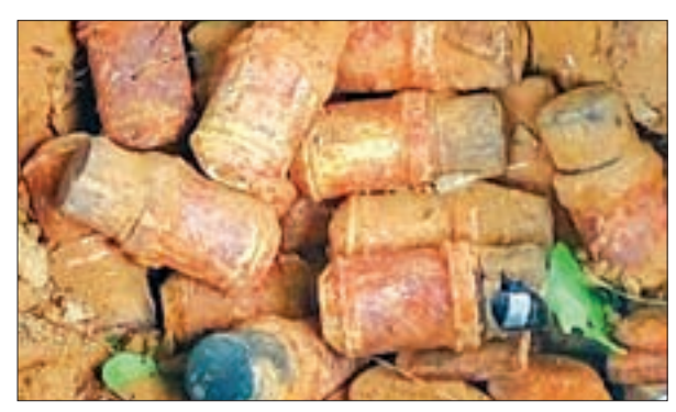
Hand grenades discovered on grounds of monastery being seen. PHOTO: 077