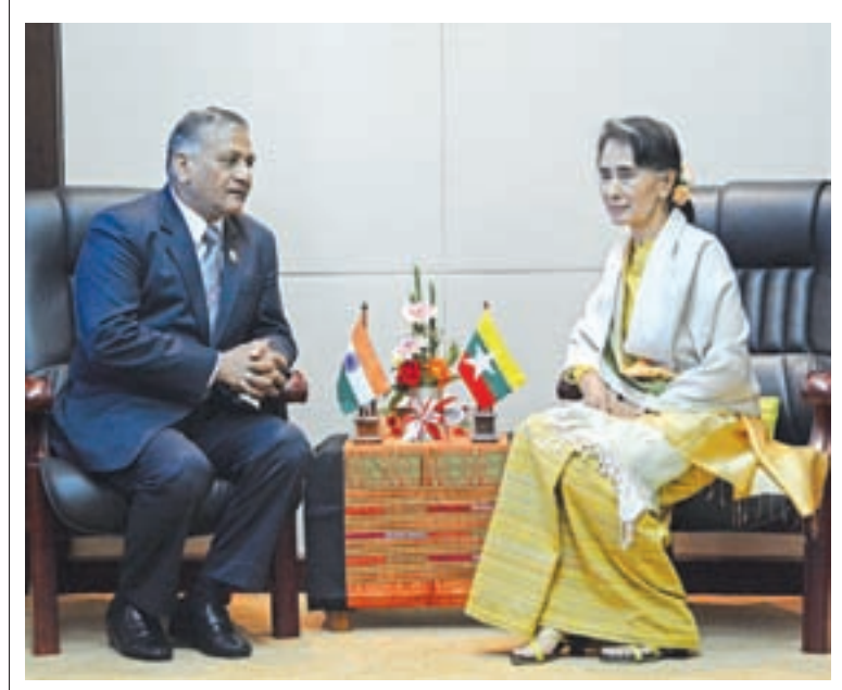
Union Minister for Foreign Affairs Daw Aung San Suu Kyi holds talks with Indian Minister of State for External Affairs Mr. V.K Singh at National Convention Center in Vientiane, Laos.

Sun Guoxiang, from the Chinese Ministry of Foreign Affairs, said that China will "continue supporting" Myanmar.