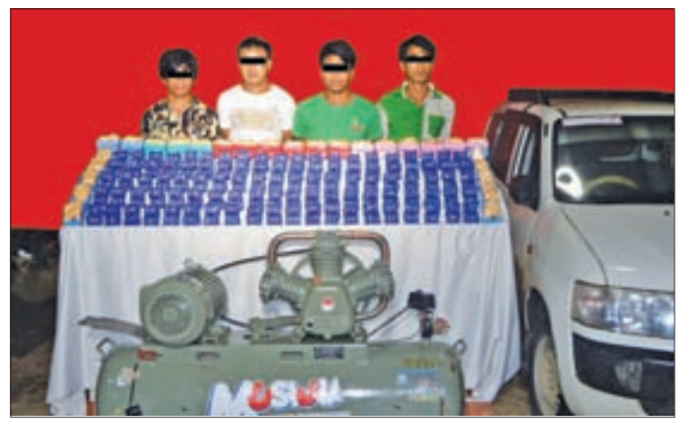
The criminal suspects the probox car and Yaba and heroin being seen.

All suspects have been charged under the Narcotic Drugs and Psychotropic Substances Law.— Myanmar Police Force