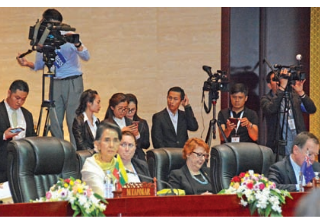
Union Minister for Foreign Affairs Daw Aung San Suu Kyi attends the 23rd ASEAN Regional Forum in Vientiane, Laos.

According to Yangon Region Police Force, the rule of law programme to ensure and reduce crimes in Yangon will be extended to the remaining townships except Cocogyun Township.