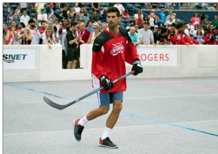
Novak Djokovic of Serbia participates during the Rogers Cup Sportsnet Ball Hockey Challenge during qualifying of the Rogers Cup tennis tournament at the Aviva Centre in Toronto Ontario, on 24 July.

"I had a bit more time because of the early loss at Wimbledon to spend some quality time with family, regroup a little bit