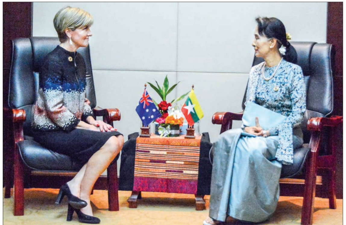
Daw Aung San Suu Kyi hold talks with Australian Foreign Affairs Minister Ms Julie Bishop MP.

UNION Minister for Foreign Affairs Daw Aung San Suu Kyi held separate talks with the Ministers for Foreign Affairs of Australia, Russian Federation and Democratic People's Repub-