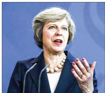
British Prime Minister Theresa May.

BELFAST — Prime Minister Theresa May visits Northern Ireland on Monday to discuss the implications of the United Kingdom's vote to leave the European Union and what Brexit will mean for the province's border with Ireland.