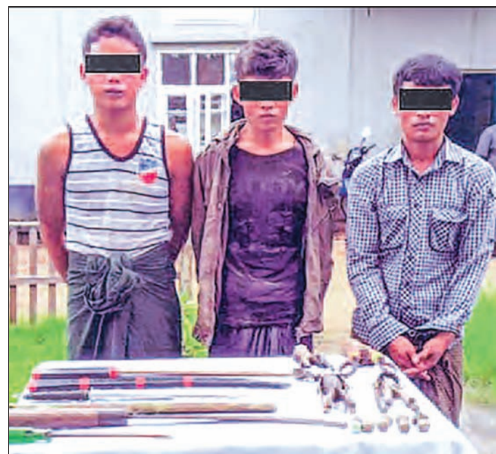
The armed robbery suspects being seen.

THE anti-drug squad in southern Shan State has raided an opium poppy farm in Pekhon township seizing k13m worth chemical substances and raw opium. They discovered chemicals used for heroin production including 160L of hydrochloric acid worth K12m and 48kg of ammonium chloride worth K1m and 24L of opium oil from the camp. No one was found at the site.—Kyemon