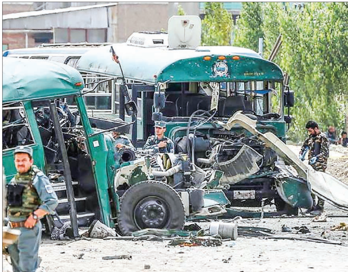
Afghan security forces inspect the damage caused by a suicide bombers at the site of the attack on the western outskirts of Kabul, Afghanistan, on 30 June 2016.

heard more commitments by both sides, but few effective actions to improve protection of civilians.