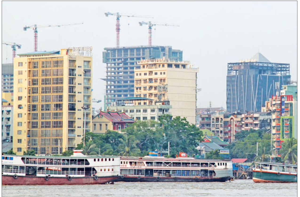
Houses are seen in this general view of Yangon City on 6 April 2016.

The process of approval for investment has to pass many stages. MIC will ask for the opinion of the regional and state governments concerned as well as ministries concerned regarding the proposal they have received. Only after obtaining their opinion, MIC will decide whether to grant permission for investment at a MIC meeting. —200