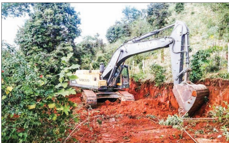
A construction site of Mandalay — Pyin Oo Lwin Road.

The road will be 20 miles long and 50 feet wide. Of them, the two-mile long asphalt road and four-mile long soil pavement have already been built in Patheingyi Township as well as