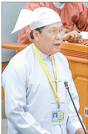
Union Minister U Thein Swe.