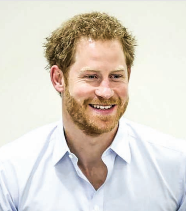
Prince Harry chats with staff during his visit to the Burrell Street Sexual Health Clinic in London, Britain, on 14 July 2016.

LONDON — Britain's Prince Harry has spoken about how he regrets not talking sooner about the impact of the death of his mother, Princess Diana. Diana died in a car crash in Paris in 1997, when Harry was 12 and his brother Prince William was 15. Harry, now 31 and fifth in line to the throne, said he had not discussed his mother's death until three years ago, the BBC reported. "I really regret not talking about it," he said. "For the first 28 years of my life, I never talked about it." He added: "It is OK to suffer, but as long as you talk about it. It is not a weakness. Weakness is having a problem and not recognising it and not solving that problem." Harry, who is the queen's grandson, was speaking last week at a barbecue he hosted for the mental health charity Heads Together, attended by sports stars such as former England footballer Rio Ferdinand and Olympic athlete Kelly Holmes. "I think the key message here is that everyone can suffer from mental health issues, whether you're a member of the royal family, whether you're a soldier, whether you're a sports star," said Harry, a former army officer who served in Afghanistan.—Reuters