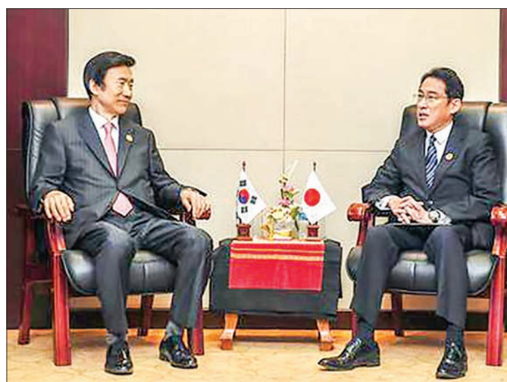
Japanese Foreign Minister Fumio Kishida (R) and his South Korean counterpart Yun Byung Se meet on 25 July 2016, in Vientiane. In December 2015, Japan and South Korea signed a landmark deal in December 2015 over Korean women forced into wartime brothels for the Japanese military.

After the setup of the fund, the focus will shift to when the Japanese government will disburse the 1 billion yen. Some lawmakers of the ruling Liberal Democratic Party have said the public funds should not be released unless a statue of a girl symbolizing "comfort women" in front of the Japanese Embassy in Seoul is removed. At the time of the deal, the Japanese and South Korean governments did not