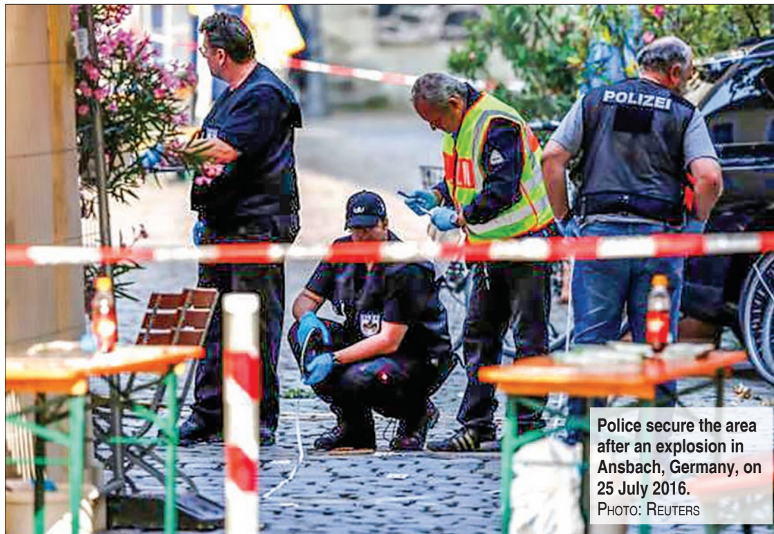
Police secure the area after an explosion in Ansbach, Germany, on 25 July 2016.

He told Reuters the recent attacks raised serious questions about Germany's asylum law