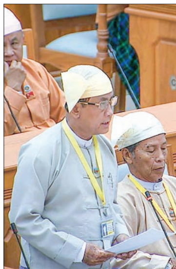
Deputy Minister for Planning and Finance U Maung Maung Win.