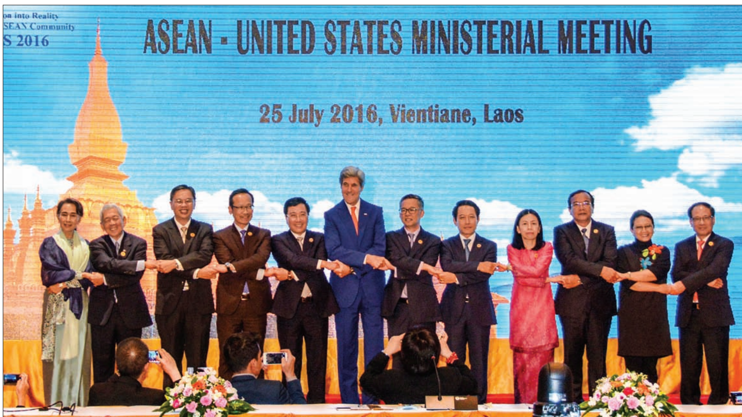
Foreign Ministers of ASEAN pose for the photo in ASEAN way together with US Secretary of state John Kerry.

Daw Aung San Suu Kyi attends ASEAN-Dialogue Partner meetings in Laos