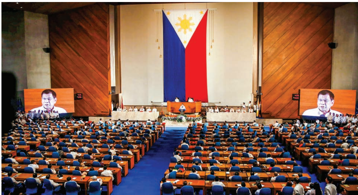
Philippine President Rodrigo Duterte speaks before the lawmakers during his first State of the Nation Address at the Philippine Congress in Quezon city, Metro Manila, Philippines, on 25 July 2016.

Scientists at the Indian Space and Research Organisation were using satellites in the search, while the navy scoured an area of about 14,400 square nautical miles. Difficulties have been compounded by stormy monsoon weather in the Bay of Bengal.— Reuters