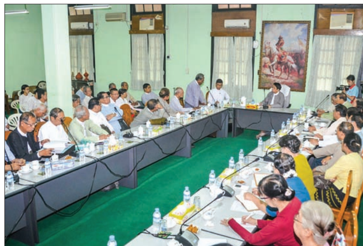
Union Information Minister Dr Pe Myint. PHOTO: MNA

In the evening, the Union minister held talks with an organizing committee for paper-reading session on political literature and monsoon book fair.—Yi YiMyint/Ohnmar Thant