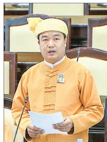
U Sai Wan Hlaing Kham.

During the Q & A session, Union Minister Dr Aung Thu elaborated on the flood mitigation measures in Yangon