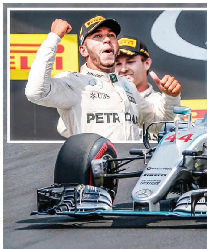
Mercedes' Lewis Hamilton celebrates after winning the race on 24 July 2016.