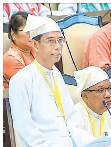
Union Minister Dr Aung Thu.

THE second Amyotha Hluttaw began in Nay Pyi Taw yesterday with a question and answer session and submission of a proposal calling for eradication of drug trafficking and illicit use of narcotic drugs and the establishment of drug rehabilitation centers.