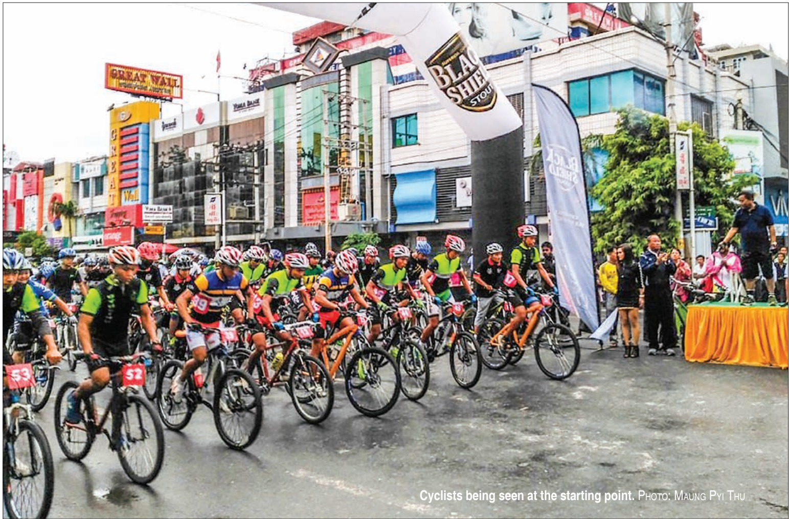
Cyclists being seen at the starting point.