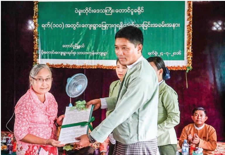
Land lease certificate being handed to a villager.

The Regional Chief Minister, the Regional administrator, the Py-ithuhlataw representative and the District Administrator gave the land lease certificates or land grants to the people in Moegaung and Tharyar-gon villages. On behalf of the people a villager spoke words of thanks.