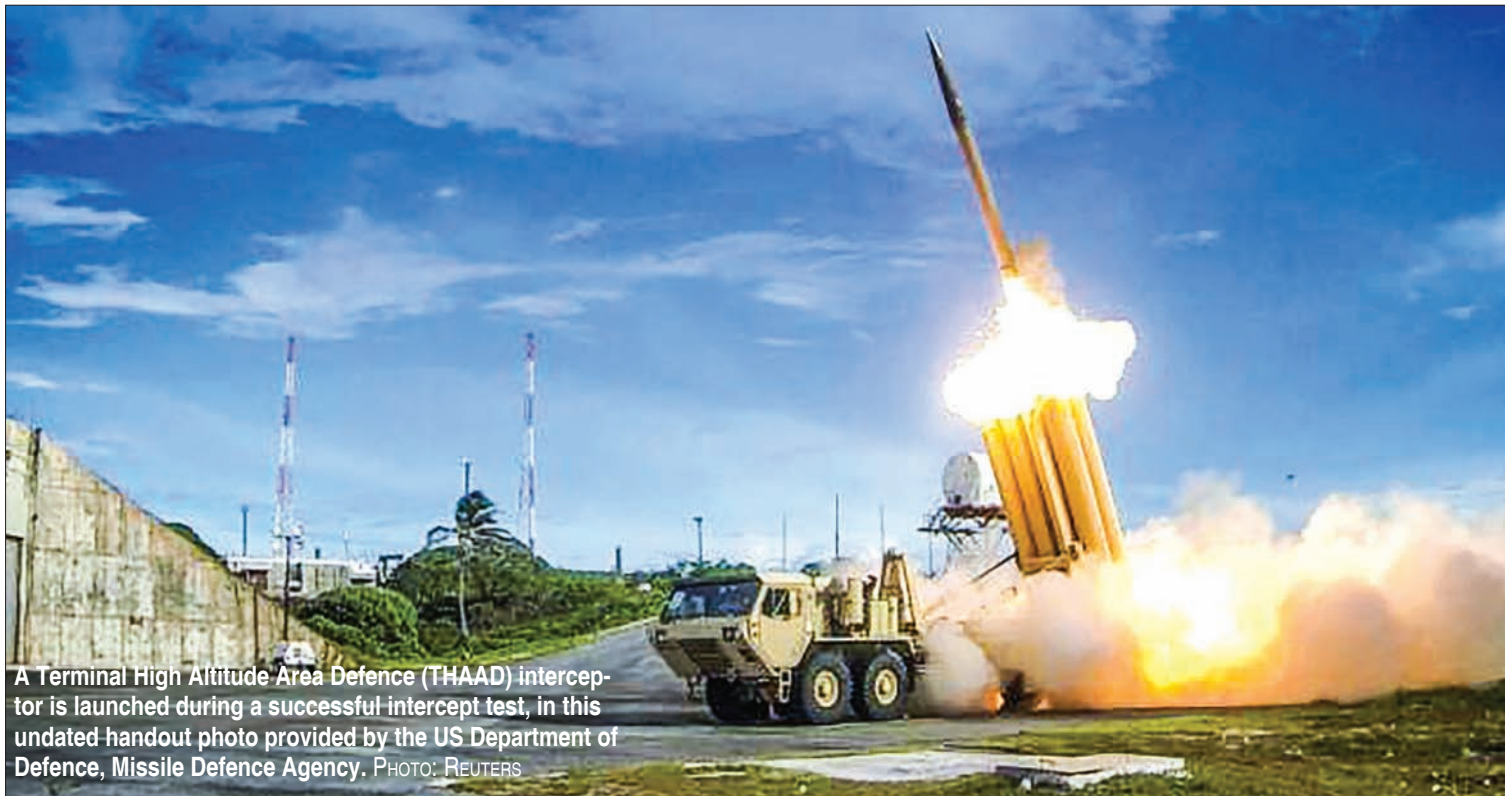
A Terminal High Altitude Area Defence (THAAD) interceptor is launched during a successful intercept test, in this undated handout photo provided by the US Department of Defence, Missile Defence Agency.