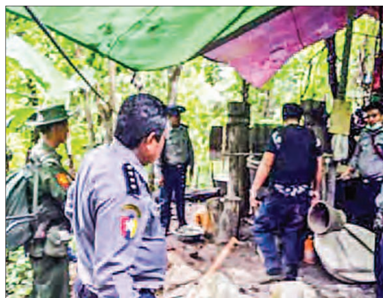
Police officers seen after raiding a poppy production camp in Pekhon in the Southern Shan State.

over 200 days has reached 115 across the nation. To reduce railroad accidents, railway police continue efforts to disseminate railroad safety knowledge to commuters and general public through seminars and pamphlets.—Ko Myo (Shwepaukkan)