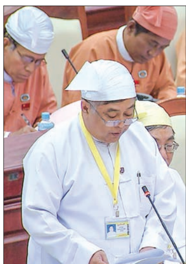
Union Minister U Pe Zin Tun.

THE second regular session of the second Pyithu Hluttaw began in Nay Pyi Taw yesterday with Pyithu Speaker U Win Myint requesting that MPs seek his approval before participating in meetings and training programs organised by local and foreign organisations.