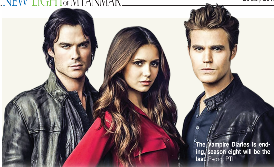
The Vampire Diaries is ending, season eight will be the last.

"Between the cardboard, the paint and the glue, it cost a fair bit, so I'm hoping to win the cosplay."—Reuters