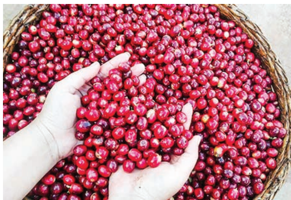
Coffee berries.