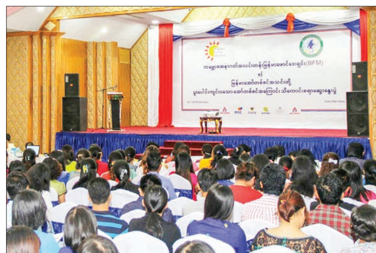
Educative Talks on autism in Mandalay in progress. PHOTO: THURA LWIN (ECO)

A documentary film on autism was shown to the public at the event.— Thura Lwin (Eco)