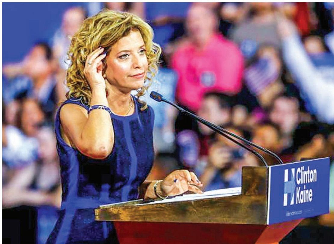
Democratic National Committee (DNC) Chairwoman Debbie Wasserman Schultz speaks at a rally, before the arrival of Democratic US presidential candidate Hillary Clinton and her vice presidential running mate US Senator Tim Kaine, in Miami, Florida, US, on 23 July 2016.