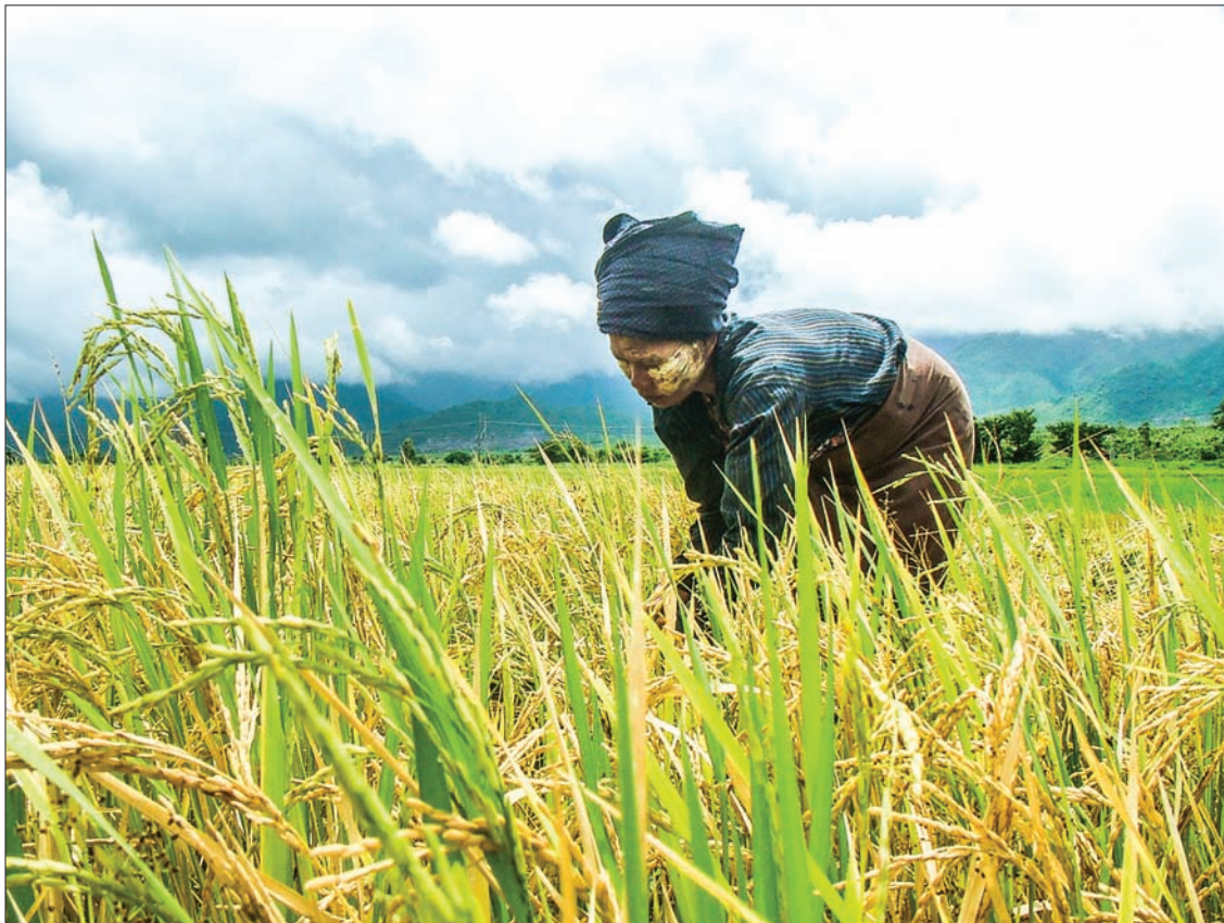
A farmer harvests rice in central Myanmar.