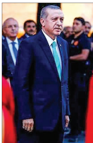
Turkish President Tayyip Erdogan reviews a guard of honour as he arrives to the Turkish Parliament in Ankara, Turkey, on 22 July, 2016.

The purges, carried out as Turkey faces attacks by Islamist State and a revived struggle with Kurdish militants, go beyond the more than 100 generals and 6,000 soldiers held, or the nearly 3,000 judges detained.