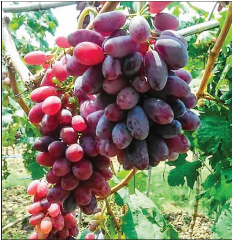
Grapes from Chin being seen.

In cooperation with the state authorities, the implementation of such production business aims to create more employment opportunities for locals. After the project is completed, quality grapes wine manufactured from local products is planned to be distributed in both local market as well as foreign countries. Native species of grapes will be grown in nine townships in Chin State for the new project. Among townships in Chin State, in Tiddim and Falam are famous as grapes growing areas, planting mostly common. Chin State is located in western part of Myanmar. It is bordered by Rakhine State in the south and Bangladesh in the south-west.—200