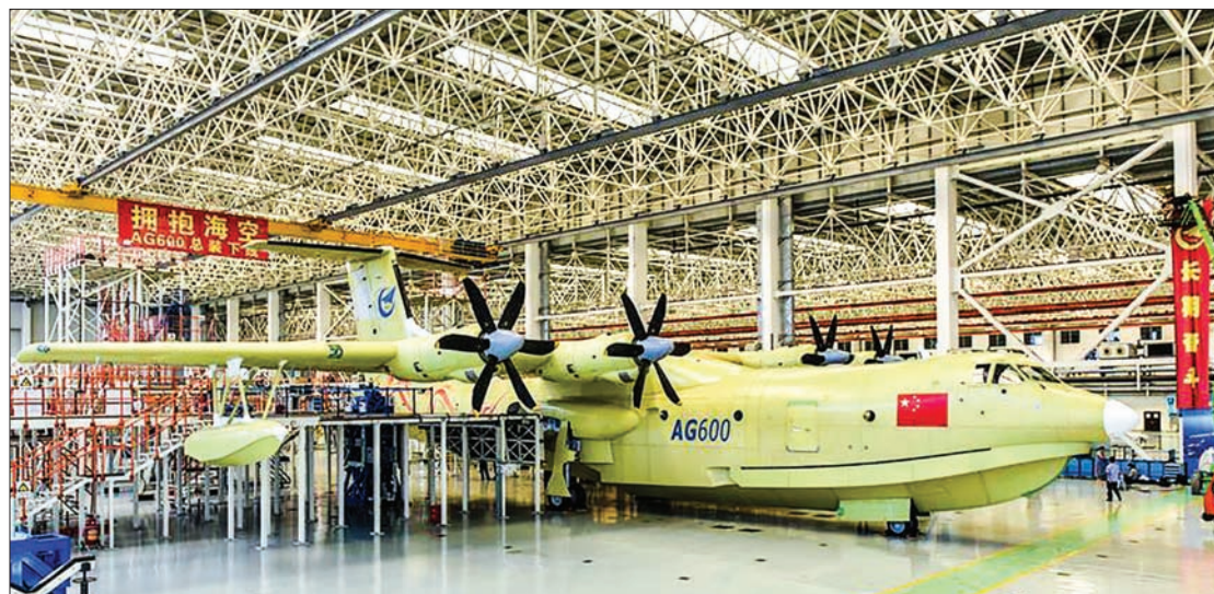
Amphibious aircraft AG600 rolls off a production line in Zhuhai, south China's Guangdong Province, on 23 July 2016. The aircraft, which has a maximum take-off weight of 53.5 tonnes and a maximum flight range of 4,500 km, will be used to fight forest fires and perform marine rescue missions. The AG600 is by far the world's largest amphibian aircraft, about the size of a Boeing 737.

The unveiling of the AG600 came shortly after Chinese heavy transport aircraft the Y-20 officially entered military service on 7 July and China's first large passenger aircraft, the C919, rolled off the final assembly line in November 2015. Geng described the AG600 as "the latest breakthrough in China's aviation industry, which demonstrates an overall improvement of China's national strength and research capacity."—Xinhua