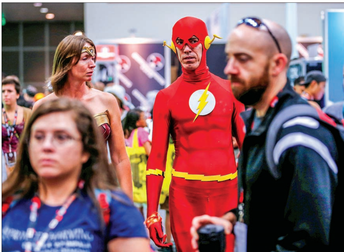
An attendee dressed as the Flash walks the convention floor at the pop culture event Comic-Con International in San Diego, California, United States on 22 July, 2016.

The cast of 2017’s “Wonder Woman” discussed exploring the origins of the Amazonian warrior heroine played by Israeli actress Gal Gadot, and bringing a strong female lead to the male-dominated superhero movie world. This year marks the 75th anniversary of Wonder Woman’s debut in comic books.