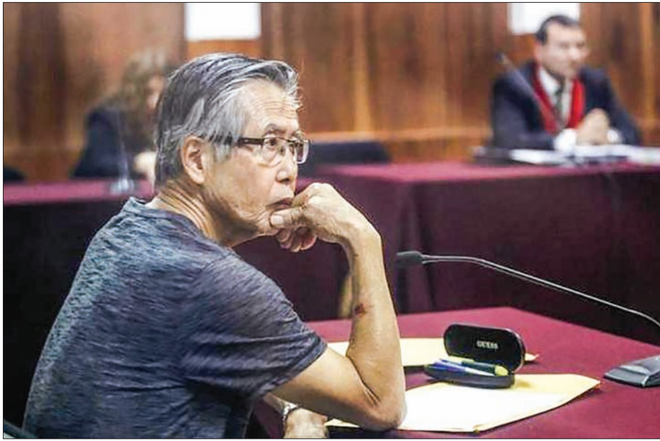
Peru's former President Alberto Fujimori sits in court during the sentencing in his trial on charges of embezzling state funds to manipulate the media during his tenure as president, in Lima on 8 January 2015.