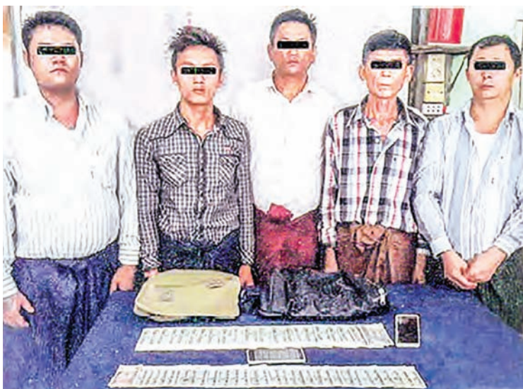
Five pickets being seen.

Police collected two handsets and nearly K60,000 from the suspects, who will face charges under the Criminal Law.—Myanma Alinn