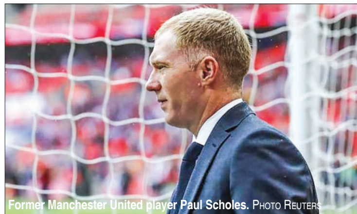
Former Manchester United player Paul Scholes.