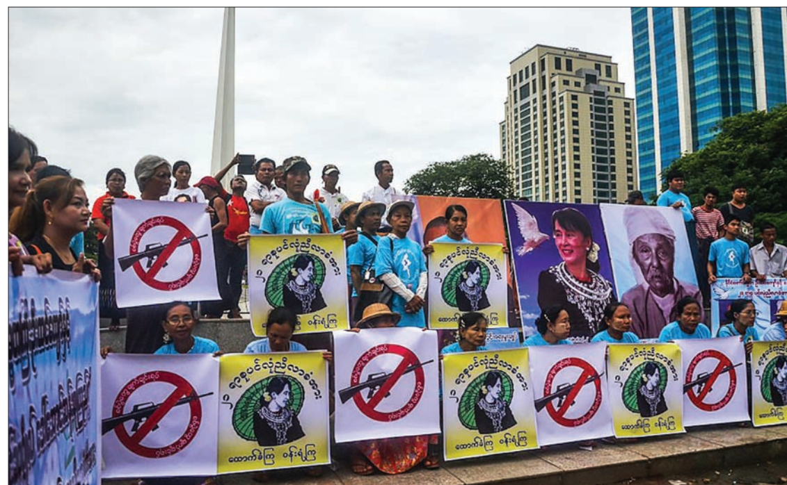
Peace activists seen participating in the mass rallies to support peace conference.

The government has scheduled the peace conference to be held in late August.—Myanmar News Agency