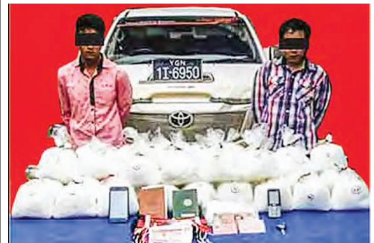
Two suspected drug dealers being seen.

All drug dealers have been charged under the Narcotic Drugs and Psychotropic Substances Law.—Kyemon