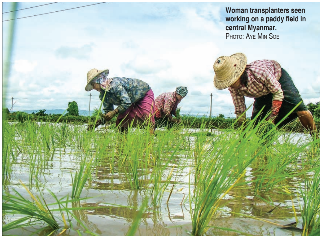
Woman transplanters seen working on a paddy field in central Myanmar.

"The prerogative is to first ensure quality of the rice grain and a