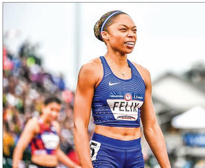
Allyson Felix reacts after placing fourth in the women’s 200m in 22.54 during the 2016 US Olympic Team Trials at Hayward Field, Eugene, OR, USA, on 10 July.