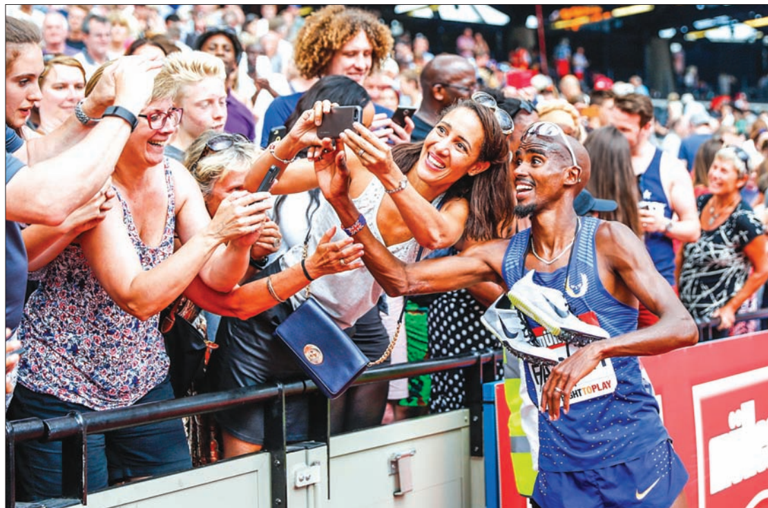
Great Britain’s Mo Farah poses for a selfie with spectators as he celebrates winning the men’s 5000m during the 2016 London Anniversary Games at Queen Elizabeth Olympic Park, Stratford, London, on 23 July.

In the 100m none of the trio of American big guns was present but Jamaican 2015 world cham-