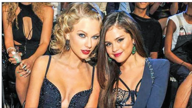
Amid her ongoing feud with Kim Kardashian and Kanye West, pop star Taylor Swift returned to Instagram to wish her longtime friend Selena Gomez a happy 24th birthday.

Animators recreated the Comic-Con panel setup in a short sketch that included a Lego version of panel moderator Conan O’Brien asking Lego Batman, Lego Joker and Lego Robin about the new film, in which Batman tackles fatherhood.—Reuters