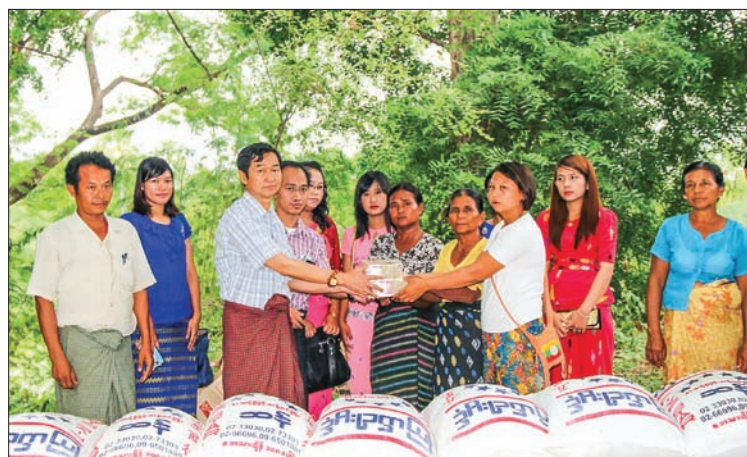
Personnel from Brighter Future Myanmar foundation presents aid to fire victims at Panya Village.

AID from Kanbawza Bank's Brighter Future Myanmar foundation (BFM) reached more than 100 fire victims in Tada U Township, Mandalay Region yesterday.