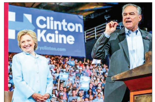
US Democratic presidential candidate Hillary Clinton and Democratic vice presidential candidate Senator Tim Kaine.

Trump was unimpressed, saying on Twitter he had watched the joint appearance and "ISIS and our other enemies are drooling.