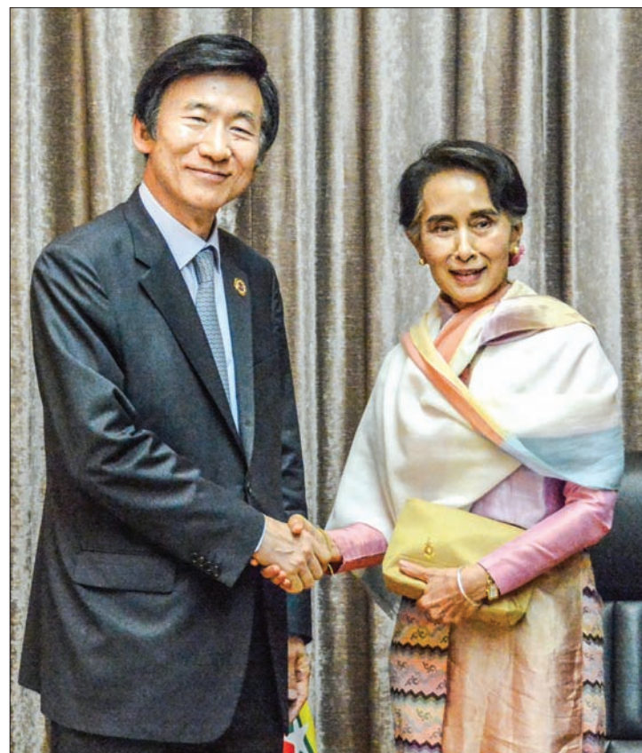
Daw Aung San Suu Kyi meets South Korean Foreign Minister Mr Yun Byung-se.

Union Minister for Foreign Affairs Daw Aung San Suu Kyi, who is attending the 49th ASEAN Ministerial Meeting and related meetings in Vientiane, Laos, yesterday met Norwegian Foreign Minister Mr Borge