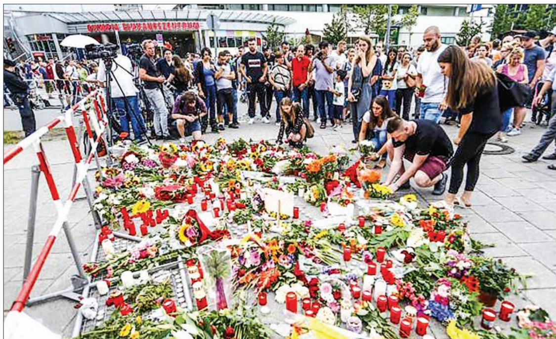
People lay flowers in front of the Olympia shopping mall, where yesterday's shooting rampage started, in Munich, Germany, on 23 July, 2016.

In the attack in Orlando, the perpetrator had viewed online jihadist propaganda, possibly produced by the Islamic State, the investigators said. But subsequent probes turned up no evidence the