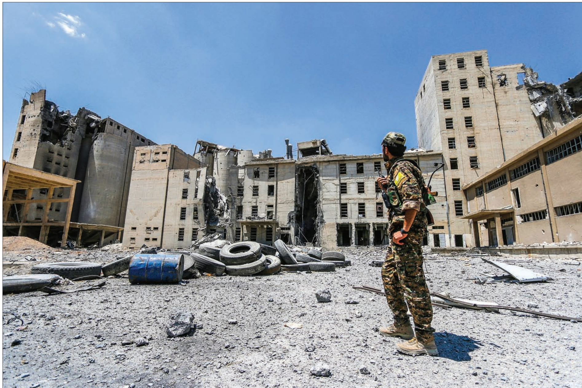
A Syria Democratic Forces (SDF) fighter walks in the silos and mills of Manbij after the SDF took control of it, in Aleppo Governorate, Syria, on 1 July 2016.