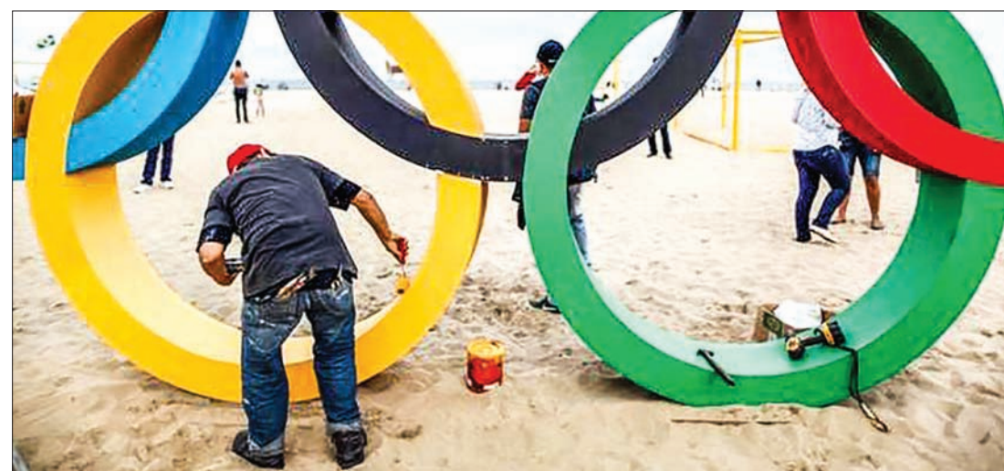
A worker applies a coat of paint to a set of Olympic rings on Copacabana beach in Rio de Janeiro, Brazil, on 22 July 2016.

"There are so many sports in the summer Olympics and some of them are so different. For example the music at gymnastics would be very different to BMX, or beach volleyball would be very different to fencing. So we wanted three different styles of ceremonies." Rio de Janeiro will become the first South American nation to host the Olympic Games next month. The Games run from 5 to 21 August.—Reuters