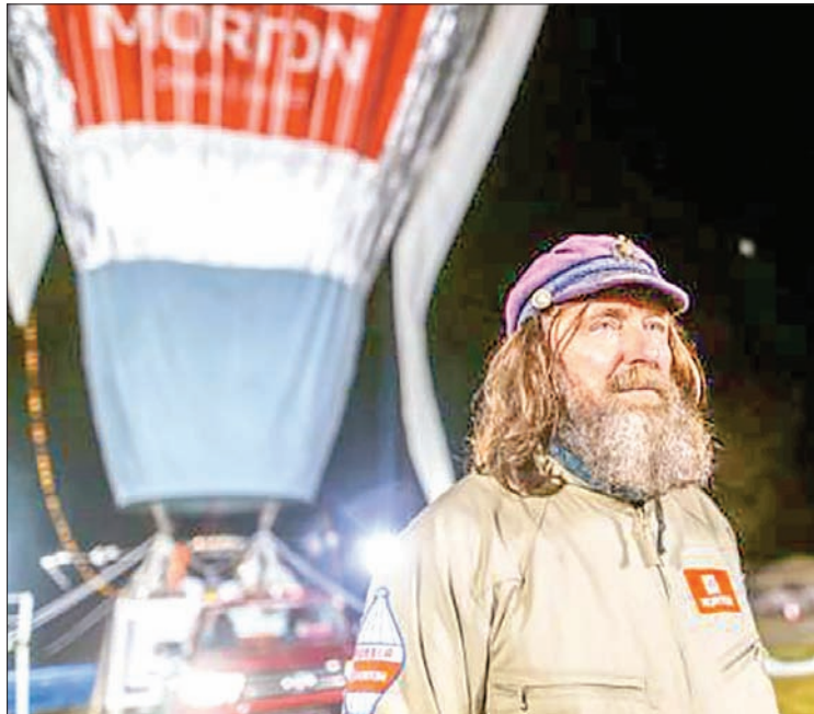
Russian adventurer Fedor Konyukhov is seen in front of his balloon as it is inflated before the start of his record attempt for a solo hot-air balloon flight around the globe near Perth, Australia, in this handout image received on 12 July 2016.

PERTH — Russian adventurer Fedor Konyukhov has landed safely in a field on a private property in West Australia after setting a world record for circumnavigating the world solo in a hot air balloon.