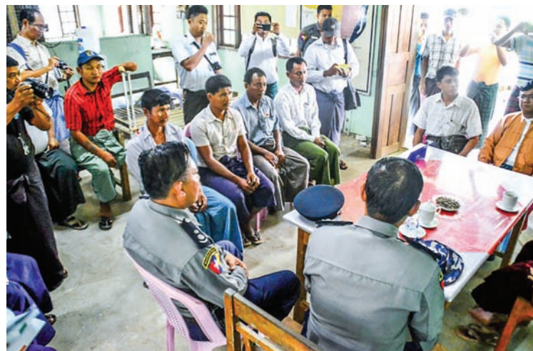
Police officers examining fugitives at the police station.