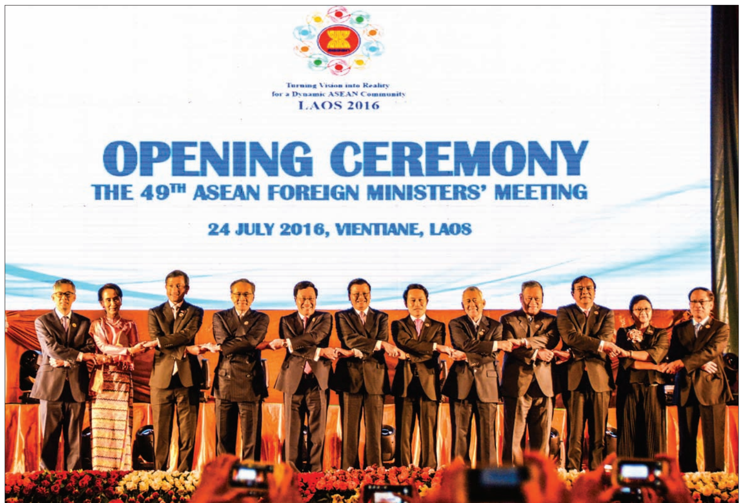
Foreign Ministers of ASEAN pose for photo in ASEAN way at a ceremony to open 49 th ASEAN Foreign Ministers' Meeting.

Chaired by Lao Foreign Minister Saleumxay Kommasith, the AMM comes following talks between the region's senior officials and diplomats in Vientiane since Thursday as representatives seek progress on regional and interna-