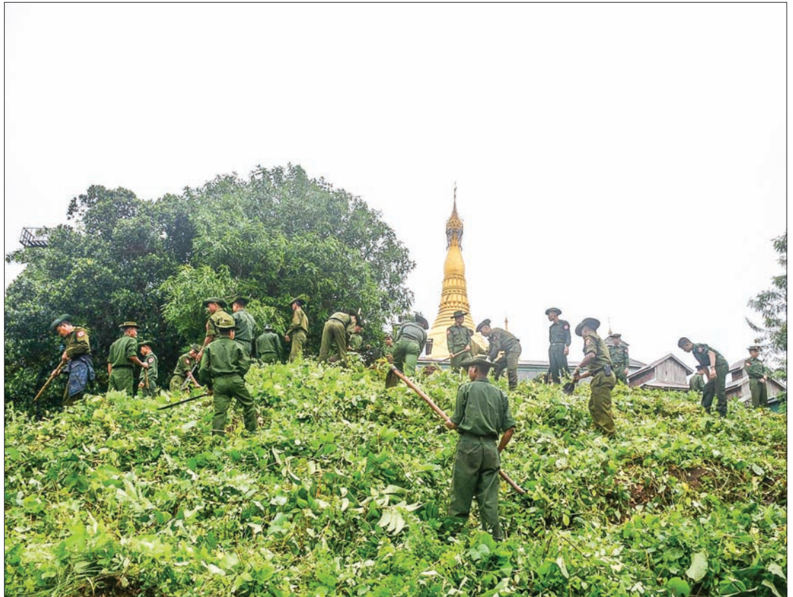
Tatmadaw members of Thanlyin Station and Yangon Station of Yangon Command clearing bushes.