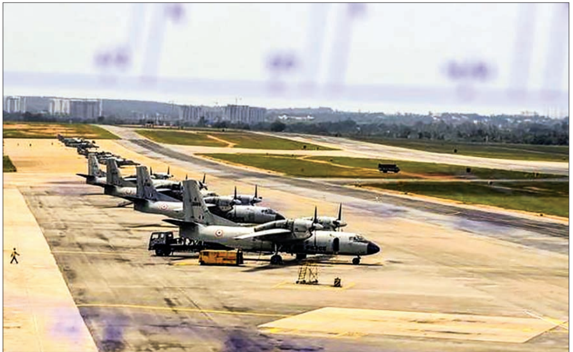
Indian Air Force's transport aircrafts Antonov An-32 (foreground) and Dornier Do 228 are seen from the air traffic control at the Yelahanka Air Force Station ahead of Air Force Day on the outskirts of Bengaluru, India, in 2015.

There were 21 military personnel on board the missing plane including six crew. The remainder were civilians and some family members of soldiers deployed on the islands.—Reuters