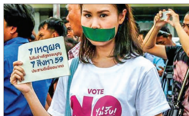
An activist of the Resistant Citizen, against the junta-backed constitution seals her mouth with duct tape and holds a placard reading “7 Reasons To Not Accept Constitution” during gathered to hold activities against the draft constitution, ahead of the August 7 referendum in front of the Election Commission Office in Bangkok, Thailand, on 15 June, 2016.

The referendum will be the first big test of the public's opinion of the military government since it came to power after a May 2014 coup. Critics, including major political parties, say the draft charter would give the military too much power over elected governments, and would not resolve differences between populist political forces and