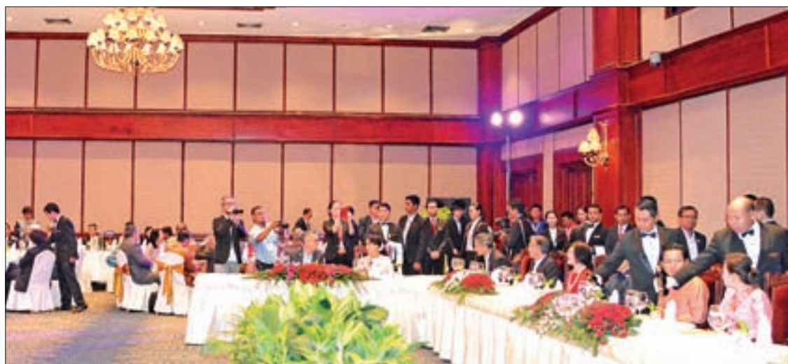
The dinner hosted by Laos Foreign Minister.