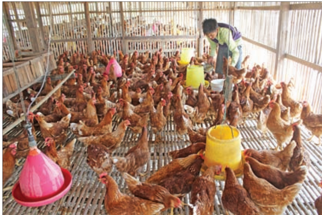
A worker seen feeding chicken at a farm in Tatkon.

LOCAL chicken farmers are investing more in broiler chicken which can be raised in 40 days and sent to market to broaden the Myanmar chicken industry, according to poultry farming entrepreneurs.