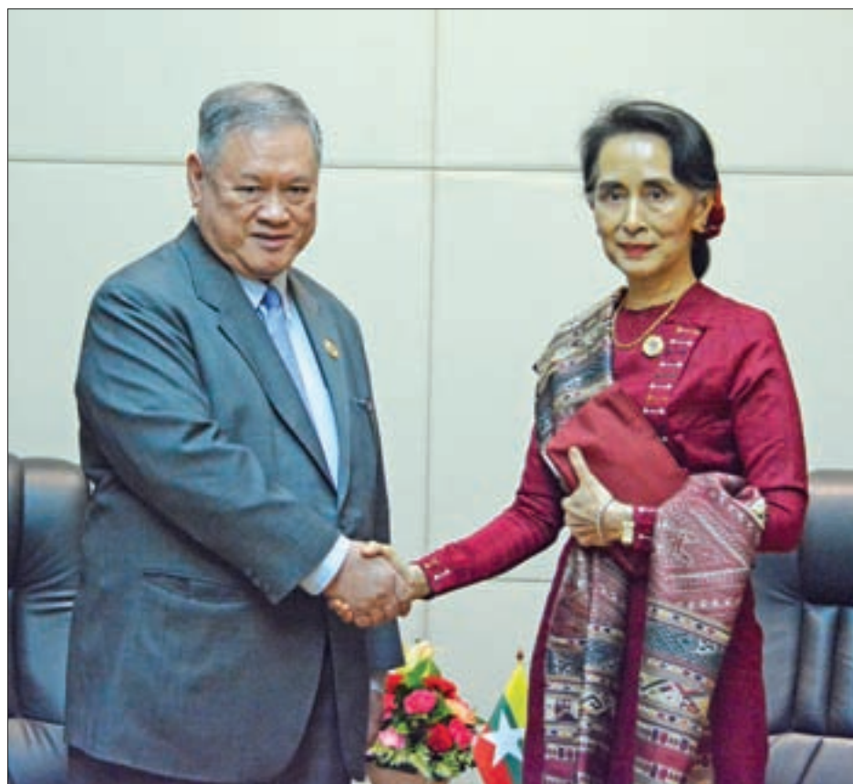
Daw Aung San Suu Kyi shaking hands with Foreign Minister of Brunei.