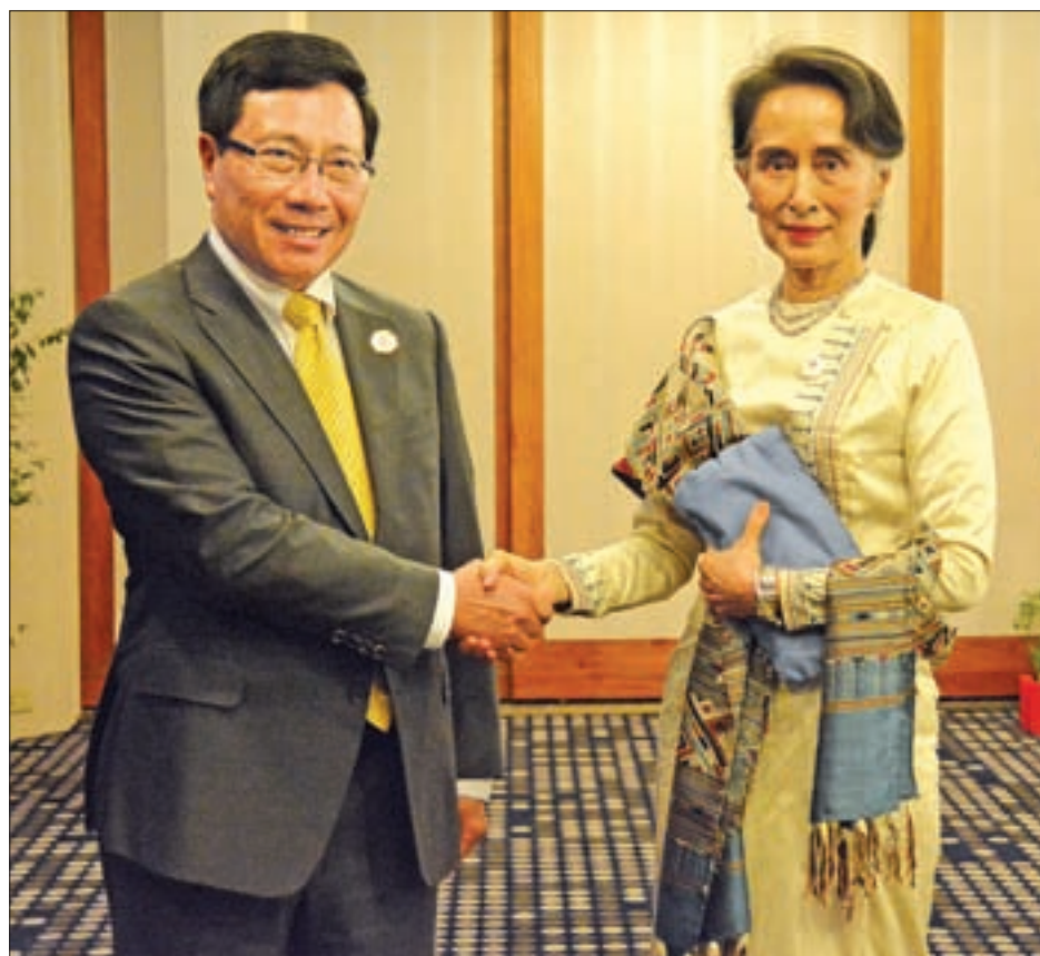
Daw Aung San Suu Kyi shaking hands with Foreign Minister of Viet Nam.

Daw Aung San Suu Kyi, the Union Minister for Foreign Affairs met with Mr Pehin Orang Kaya Peker-