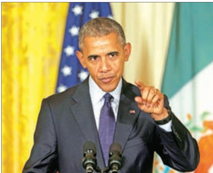
US President Barack Obama and Mexico President Enrique Pena Nieto (not pictured) hold a news conference at the White House in Washington, US, on 22 July 2016.

"He (Erdogan) needs to make sure that, not just he but everybody in his government, understands that those reports are completely false," Obama added. "Because when rumours like that start swirling around, that puts our people at risk on the ground in Turkey and it threatens what is a critical alliance and partnership between the United States and Turkey."