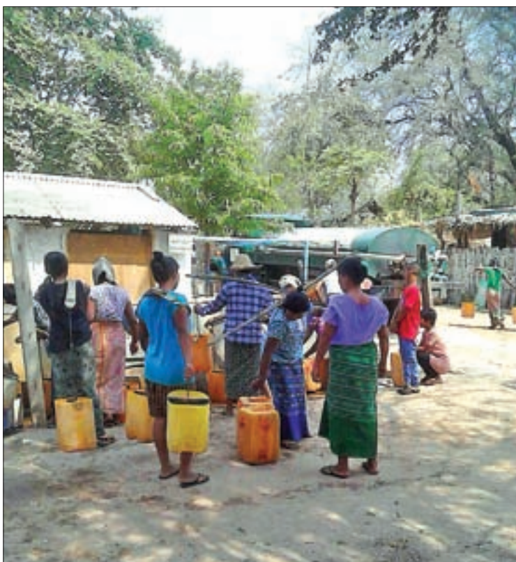
People seen falling in line as the water bowser arrives.

The provision of drinking water is the primary requirement within the Bagan/Nyaung-U re-