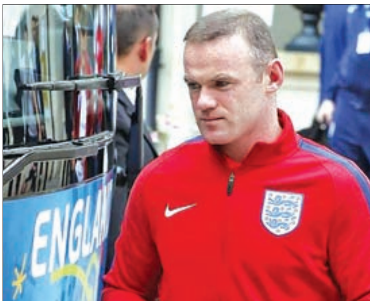
England's Wayne Rooney.

is also his country's highest goalscorer, said he had no intention of retiring from international duty.