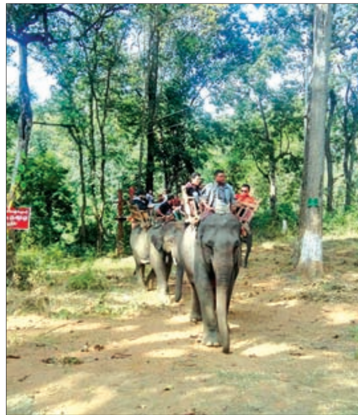
Pilgrims ride elephants on their way to Alaungtawakthapa Cave.

The Forestry Department is working in co-operation with the worldwide Fund for Nature (WFN), aims to reduce elephant-human conflict.