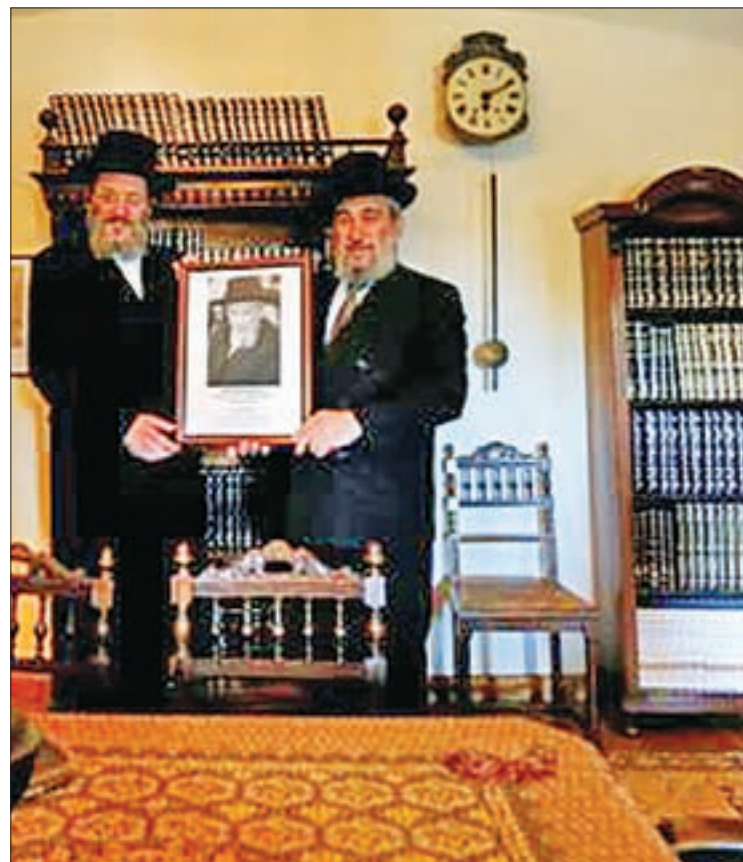
The two sons of a leading Hasidic rabbi hold up their father Rabbi Eliezer Ehrenreich's photo in the newly-restored rabbi house in the village of Mad, Hungary, on 21 July 2016.

"If we face this openly, and put up as many signs as possible to commemorate the really once flourishing Jewish winemakers and wine traders of the region, I think the region and the country