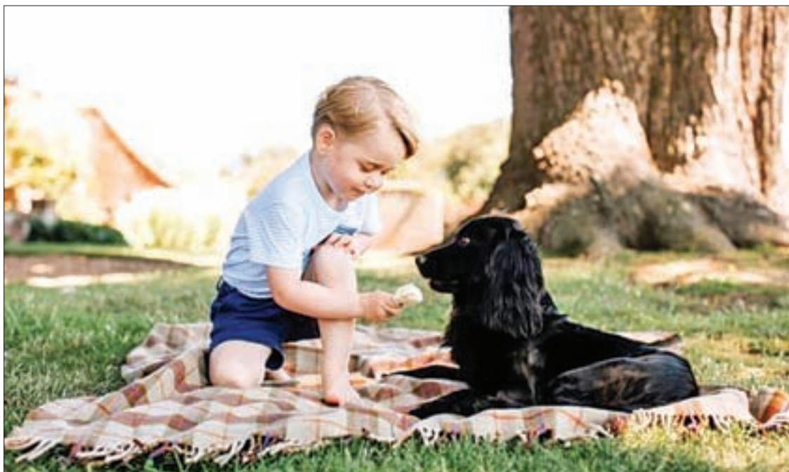
Britain's Prince George is seen with the family pet dog, Lupo, in this photograph taken in mid-July at his home in Norfolk and released by Kensington Palace to mark his third birthday, in London, Britain on 22 July, 2016.

"The Duke and Duchess hope that people will enjoy seeing these new photographs," William's office said in a statement. "They would like to thank everyone for all the lovely messages they have received as Prince George celebrates his third birthday."—Reuters