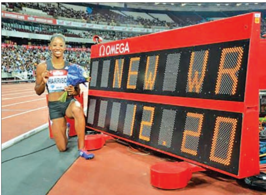
Kendra Harrison (USA) poses with scoreboard after setting a world record of 12.20 in the women's 100m hurdles in the London Anniversary Games during an IAAF Diamond League meet at Olympic Stadium in London, United Kingdom, on 22 July.

However, it was quickly corrected to 12.20, one hundredth of a second faster than the mark set by Bulgaria's Yordanka Donkova in 1988 — four years before Harrison was born.