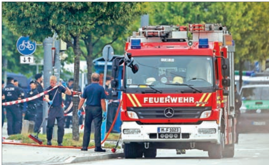
Members of the fire brigade attend the scene near the Olympia shopping mall, where yesterday's shooting rampage started, in Munich, Germany, on 23 July 2016.

Andrae said it was premature to say whether the Friday incident