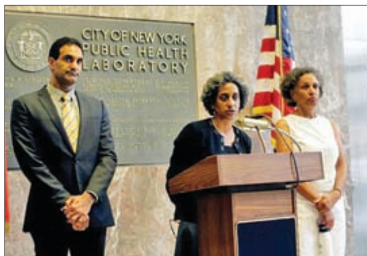
Deputy Mayor for Health and Human Services Dr. Herminia Palacio speaks at a press conference after a baby infected with Zika virus was delivered in New York City, US, on 22 July 2016. PHOTO: REUTERS

So far, 1,404 people in 46 US states have contracted Zika, including 15 cases that were sexually acquired. CDC is also investigating one possible case of person-to-person transmission of Zika in Utah.— Reuters