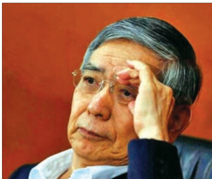
Bank of Japan (BOJ) Governor Haruhiko Kuroda attends a news conference in Tokyo, Japan, on 16 June 2016.

A majority of economists polled by Reuters expect the BoJ to ease policy next week, forecasting a combination of measures in another attempt to kick-start inflation. "If the economy's (recovery)