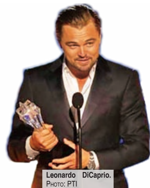
Leonardo DiCaprio.

LOS ANGELES — Oscar-winning actor Leonardo DiCaprio raised USD 45 million by throwing a star-studded fundraiser at St Tropez to support environmental awareness and research for climate change.