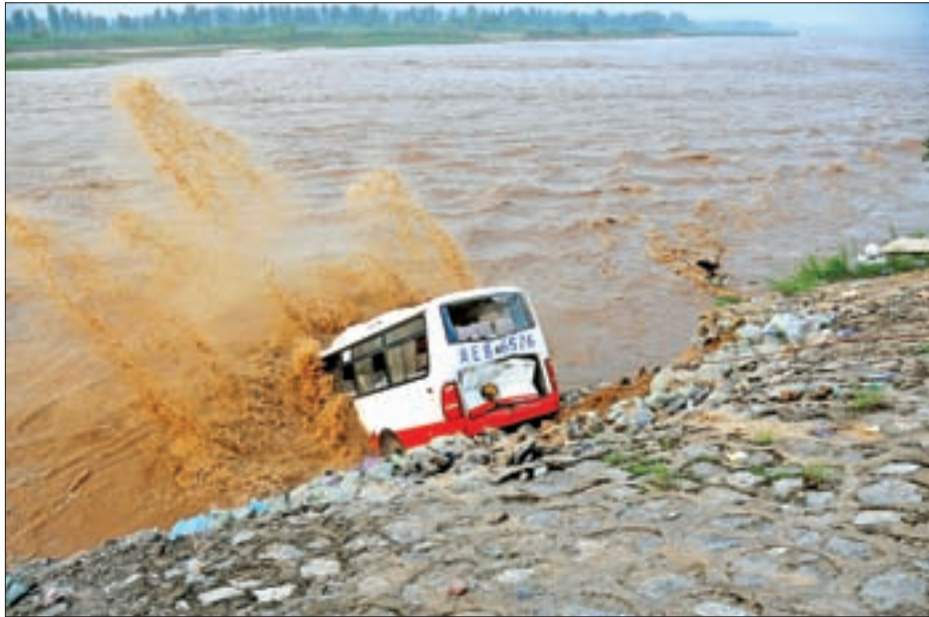
An abandoned bus filled with sand bags is used to build a makeshift dike at a flooded area in Xingtai, Hebei Province, China, on 21 July 2016.

Over 700,000 hectares of crops have also been destroyed, leading to direct economic losses of over 16 billion yuan (2.4 billion US dollars). —Xinhua