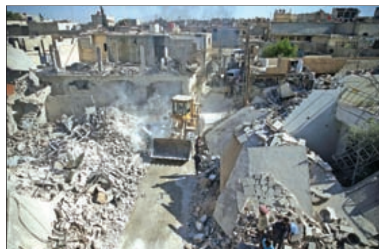
A front loader remove debris from a site hit by an airstrike in the rebel held Douma neighbourhood of Damascus, Syria, on 22 July 2016.

"I don't comment on internal negotiations" within the US government, Kerry said. "The place for these arguments to be argued