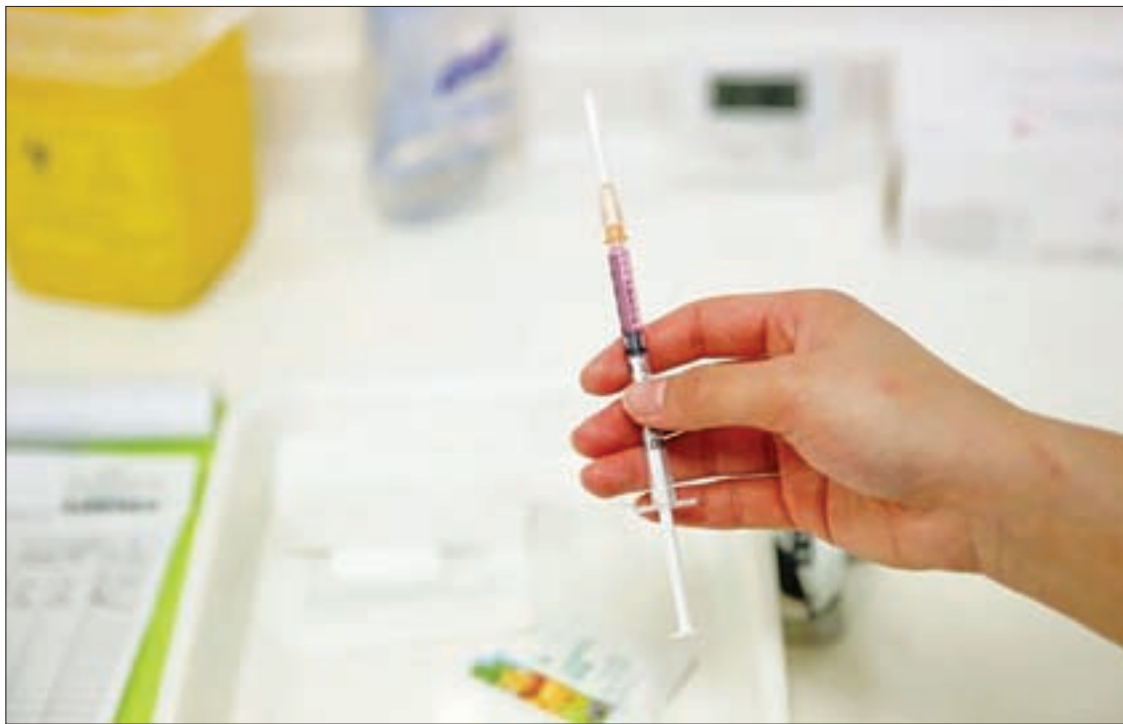
A nurse prepares a vaccine to be given to a child in a hospital in Beijing, China, on 13 April, 2016.