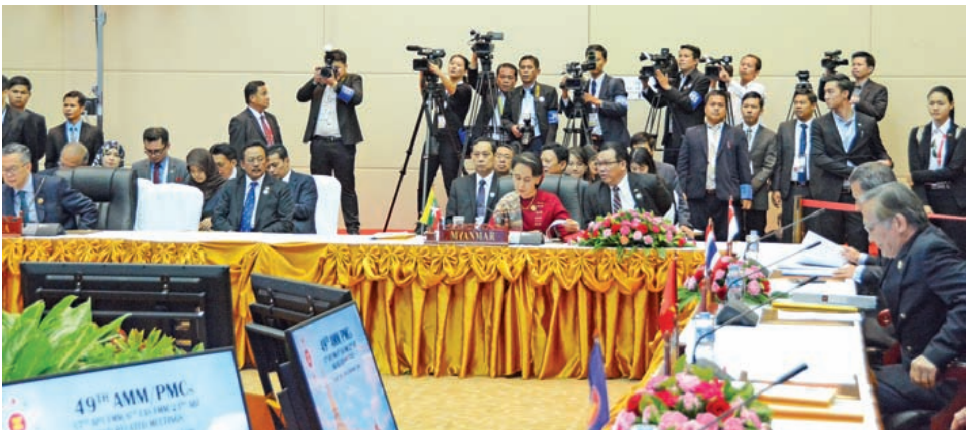
Foreign Affairs Union Minister Daw Aung San Suu Kyi attending the meeting of the Southeast Asia Nuclear Weapon-Free Zone Commission.

FOREIGN Affairs Union Minister Daw Aung San Suu Kyi attended the meetings of the Southeast Asia Nuclear Weapon-Free Zone Commission, the ASEAN Foreign Ministers' Meeting and the ASEAN Intergovernmental Commission for