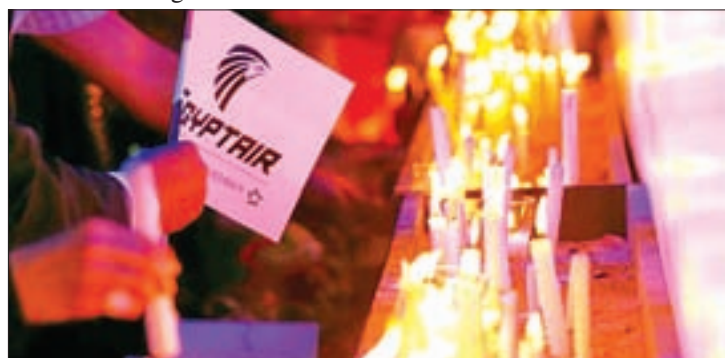
People light candles during a candlelight vigil for the victims of EgyptAir flight 804, at the Cairo Opera house in Cairo, Egypt, on 26 May 2016.