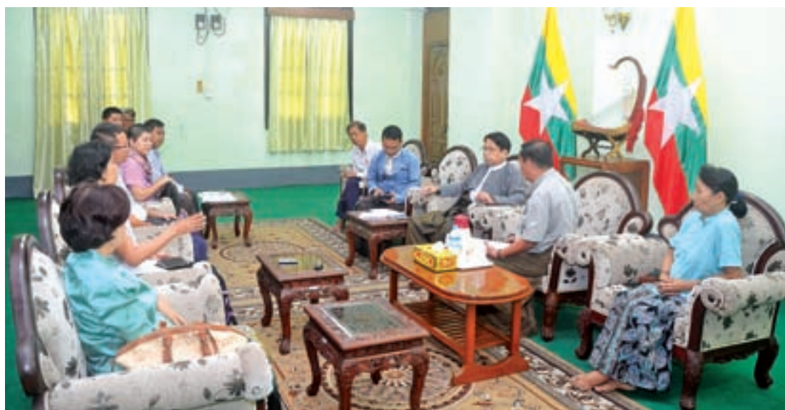
Union Minister for Information Dr Pe Myint meeting officials in Yangon.

INFORMATION Union Minister Dr Pe Myint met officials in Yangon yesterday to review progress in the effort to organise the country's first reading session of political literature in conjunction with a literary festival.