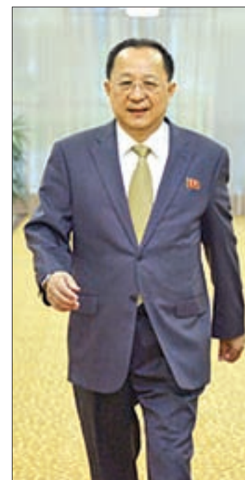
Ri Yong Ho, North Korea's new foreign minister, left the international airport in Pyongyang on 23 July 2016, heading for Laos where he is to make his overseas debut at a major security forum.

North Korea says the sanctions have impaired the dignity of its supreme leadership and it has already notified the United States that it will start dealing with all issues pertaining to the two countries from now on un-