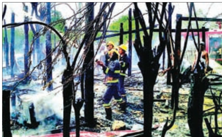
Firefighters seen extinguishing the fire.

According to an investigation, the fire broke out due to an overheated solar plate on the roof of a home owned by one U Kyaw Soe Min, 30. The fire quickly got out of control and damaged his own house and nineteen others. The fire was put out by firemen with 18 fire engines and the assistance of neighbours. Local police have filed charges against the man.—Ye Tint (IPRD)