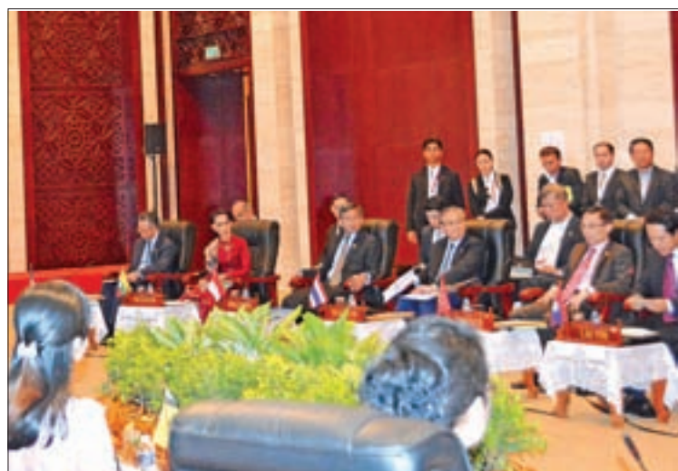
Daw Aung San Suu Kyi meets representatives of ASEAN Intergovernmental Human Rights Commission.

for Foreign Affairs of the Socialist Republic of Viet Nam at the Lao Plaza Hotel.—Myanmar News Agency