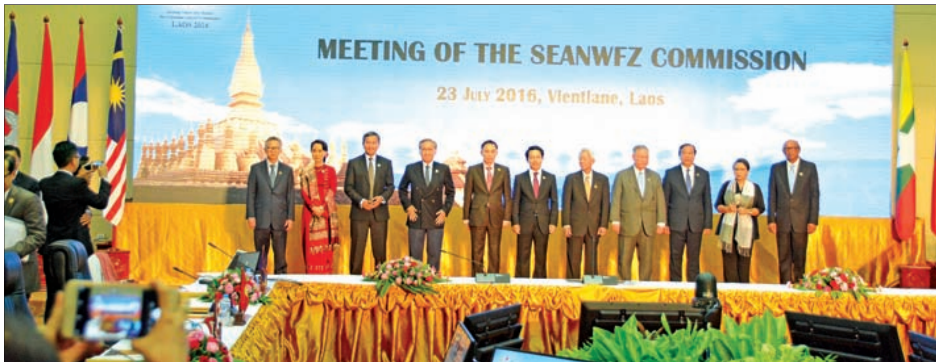
ASEAN Foreign Ministers pose for a group photo at the meeting of the SEANWFZ Commission.