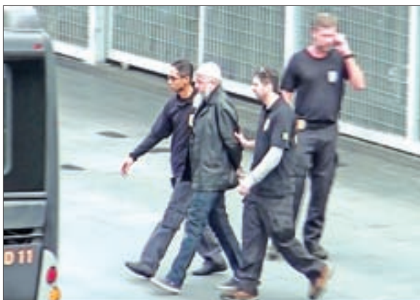
Brazilian Federal Police officers escort one of the 10 people they arrested on suspicions of belonging to a group supporting Islamic State and discussing terrorist acts during next month’s Rio 2016 Olympic Games, at the Guarulhos airport in Sao Paulo, on 21 July 2016.