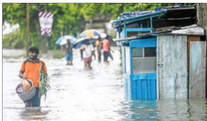
A man carries vegetables and cooking items as he walks through a flooded road during a wet day in Colombo, Sri Lanka on 16 May, 2016.

Of the 29,000 infections reported so far, 7,400 have been