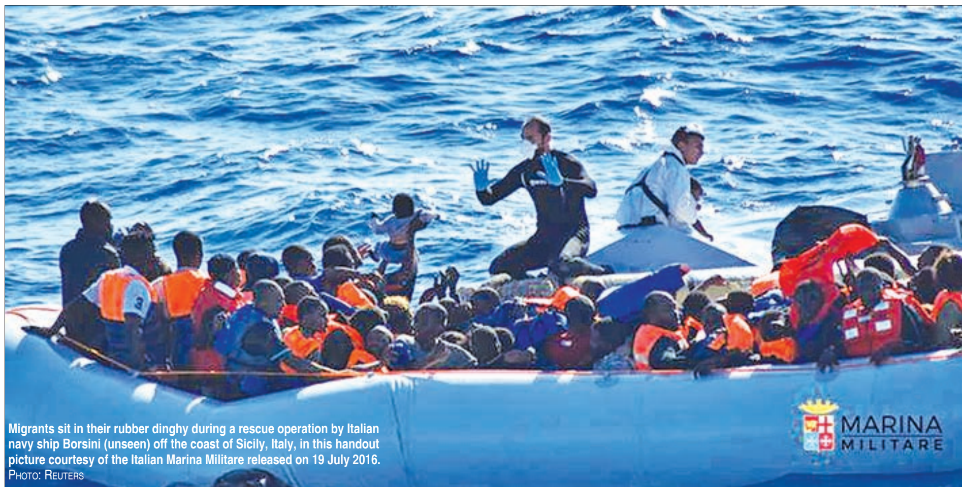
Migrants sit in their rubber dinghy during a rescue operation by Italian navy ship Borsini (unseen) off the coast of Sicily, Italy, in this handout picture courtesy of the Italian Marina Militare released on 19 July 2016. PHOTO: REUTERS