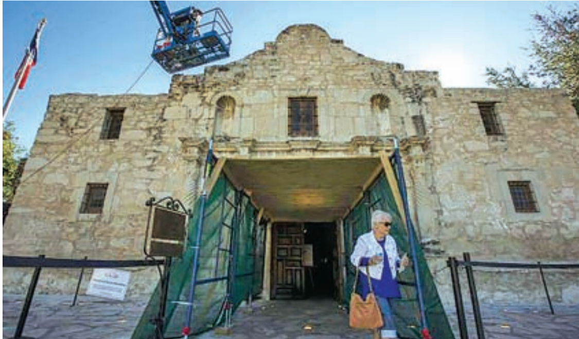
A woman walks past as men use a lift to repair and restore stonework along the curved facade of the Alamo in San Antonio, Texas on 26 October 2015.

SAN ANTONIO — The first systematic archaeological study of the grounds around the Alamo started on Wednesday, looking for artifacts at the former Catholic mission in downtown San Antonio that was the scene 180 years ago of a battle for Texas independence.