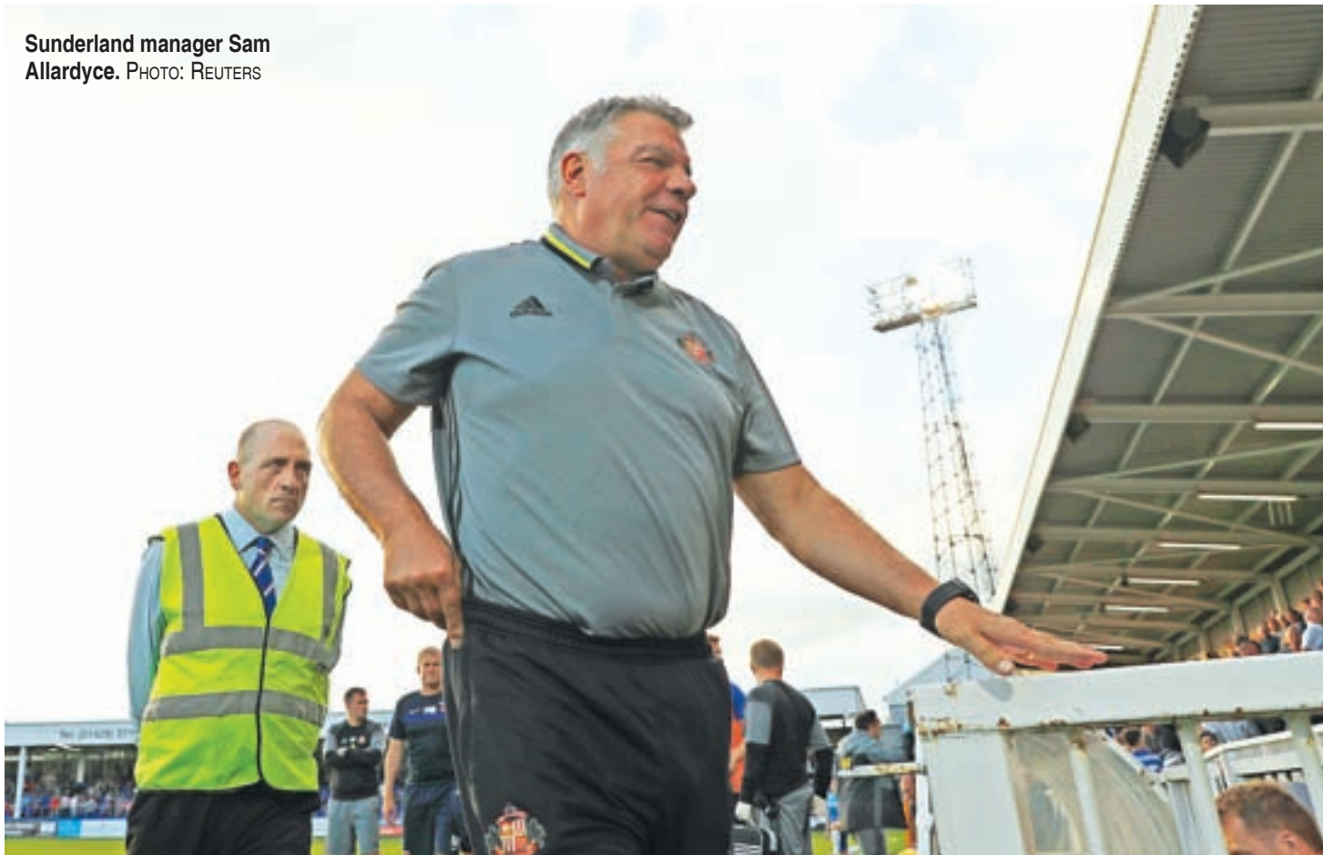
Sunderland manager Sam Allardyce.