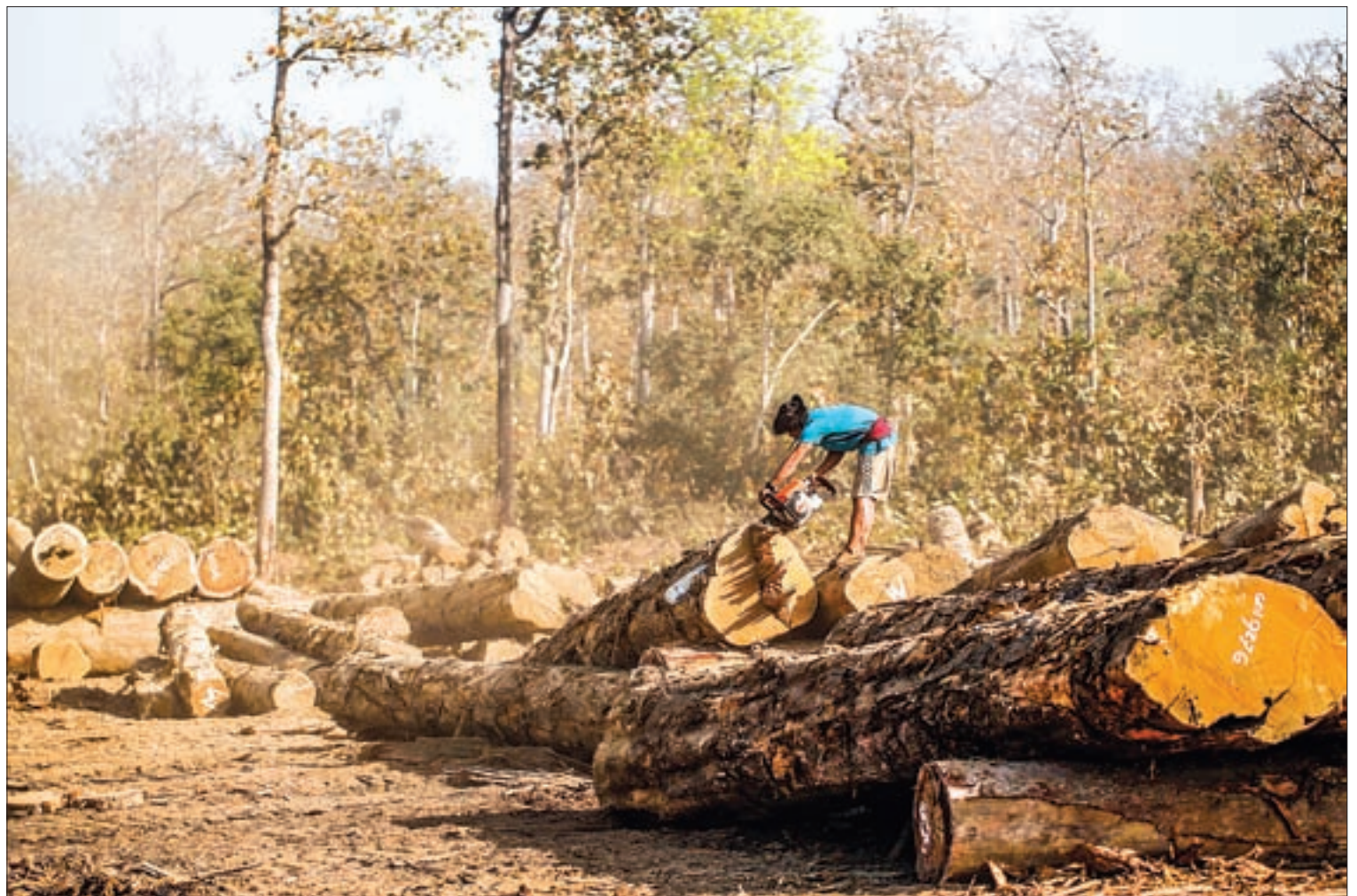
A man uses a chainsaw to cut teak logs in a logging camp in Myanmar in this picture taken on March 5, 2014.