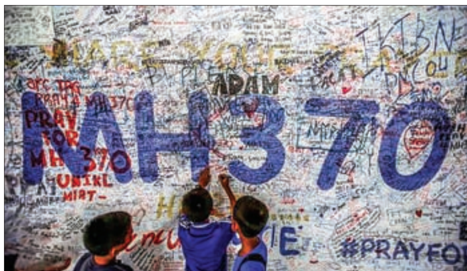
Children write messages of hope for passengers of missing Malaysia Airlines Flight MH370 at Kuala Lumpur International Airport (KLIA) outside Kuala Lumpur on 14 June 2014.

While Kennedy does not exclude extreme possibilities that could have made the plane impossible to spot