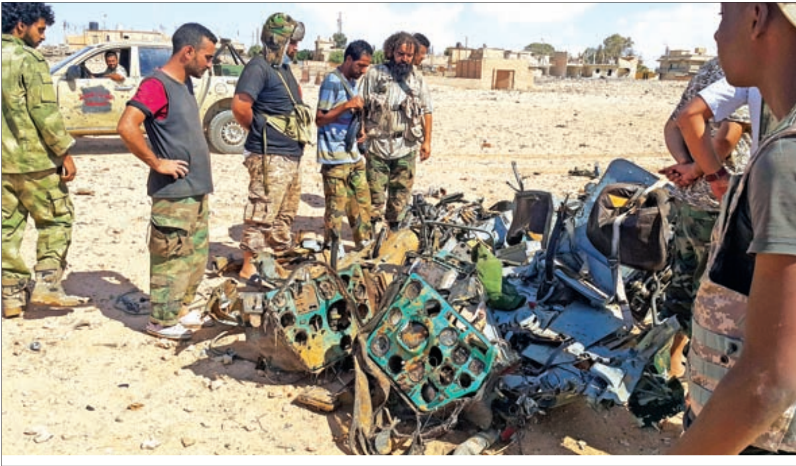
Libyans gather around the remains of a helicopter that crashed near Benghazi, Libya on 20 July 2016.