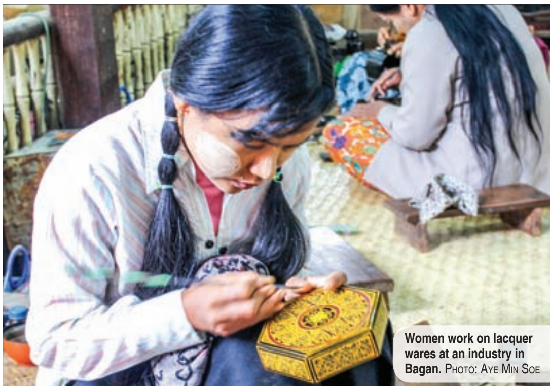
Women work on lacquer wares at an industry in Bagan.

A decrease of tourists to Bagan this wet season has forced lacquer ware dealers to rely solely on hotels as a point of sale, according to shopkeepers. Hotels not only sell them but also use them to serve food from.