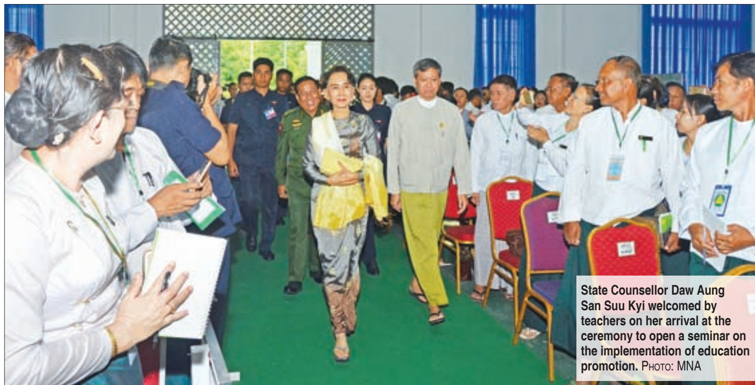
State Counsellor Daw Aung San Suu Kyi welcomed by teachers on her arrival at the ceremony to open a seminar on the implementation of education promotion.