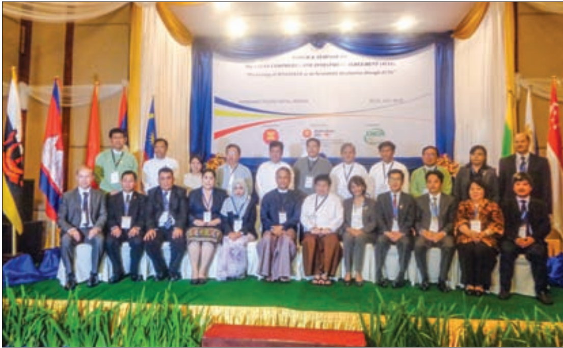
Attendees of ASEAN Comprehensive Investment Agreement-ACIA Forum and Seminar posing for a group photo.