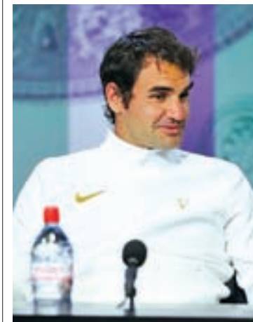
Switzerland's Roger Federer.

SYDNEY — Roger Federer will kick off his 20 th season as a professional at the Hopman Cup next year, returning to the international team tournament in Perth for the first time since he teamed up with his now wife Mirka in 2002.