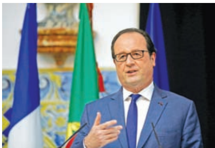
French President Francois Hollande attends a news conference at the Belem Palace in Lisbon, Portugal, on 19 July 2016.

The broader public has hardly been more sympathetic. A poll shows just a third consider the government up to the task of defending the nation against terrorism threats, compared to around half after the two attacks of 2015. On Monday, Prime Minister Manuel Valls was jeered by crowds at a commemoration for victims in Nice.