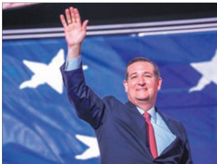
Former Republican presidential candidate Senator Ted Cruz arrives to speak during the third night of the Republican National Convention in Cleveland, Ohio, on 20 July 2016.

Some critics saw the appeal for people to vote their conscience as a vote of no-confidence in Trump. Republican strategist Eric Fehrnstrom, who is not affiliated with any campaign, tweeted: "Vote your conscience" was the