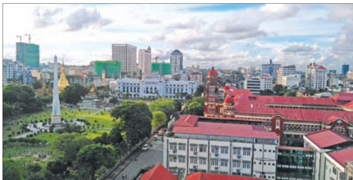
Developers have complained the against authorities for losing billions of kyats following the suspension of high-rise buildings in Yangon.

The Yangon region government formed a high-rise inspection committee on 17 June after ordering a temporary suspension of 185 high-rise projects across the city for review on 14 May. The Yangon City Development