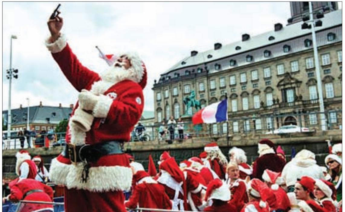
A participant takes a selfie at the 59 th World Santa Convention, which was attended by participants from different countries, in Copenhagen on 18 July 2016.

will be when is it Christmas Eve. Because everyone is talking about have you decided when that Christmas Eve will be or are you disagreeing like you used to? But the Danish guild is saying we