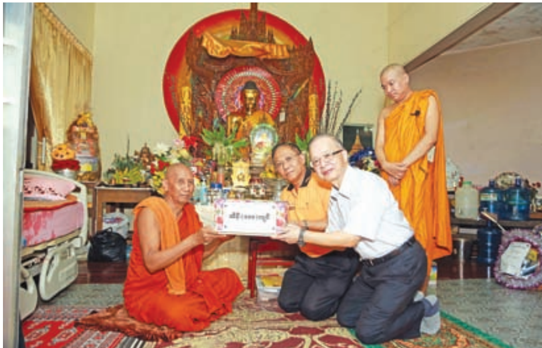
K10m being donated to the Sayadaw of monastic education school.

MTTK Trading Co, a subsidiary of Maxxis International has donated K10m (US$8454) to Yangon's Natmauk Pariyatti Monastery that educates 600 underprivileged students for free. This is the first time the compa-