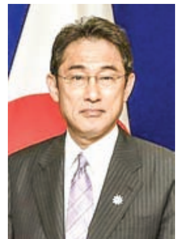
Undated photo shows Japanese Foreign Minister Fumio Kishida, who will visit Laos for three days from 24 July 2016, to attend a series of regional foreign ministerial meetings involving the 10 members of the Association of Southeast Asian Nations, his ministry said on 21 July.

process involves the 10 ASEAN member states — Brunei, Cambodia, Indonesia, Laos, Malaysia, Myanmar, the Philippines, Singapore, Thailand and Viet Nam — plus China, Japan and South Korea.