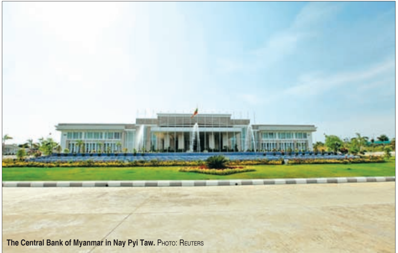
The Central Bank of Myanmar in Nay Pyi Taw.

With the foreign banks entering the local market, CBM is planning to practice online systems, while CBM will bid an auction to sell and purchase US dollars with foreign banks in September.—200