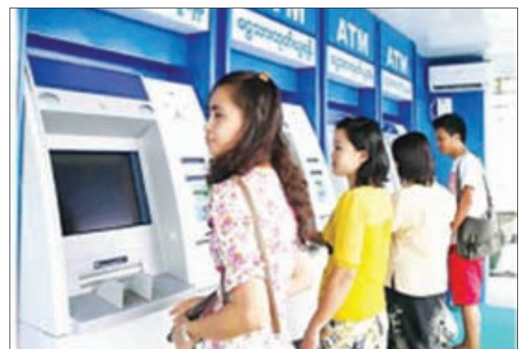
MPU users seen drawing the money. PHOTO: 200

Member banks include Myanma Economic Bank, Myanma Foreign Trade Bank, Myanma Investment and Commercial Bank, Kanbawza Bank, Yoma Bank, Ayeyawady Bank and Myanmar Apex Bank.—200