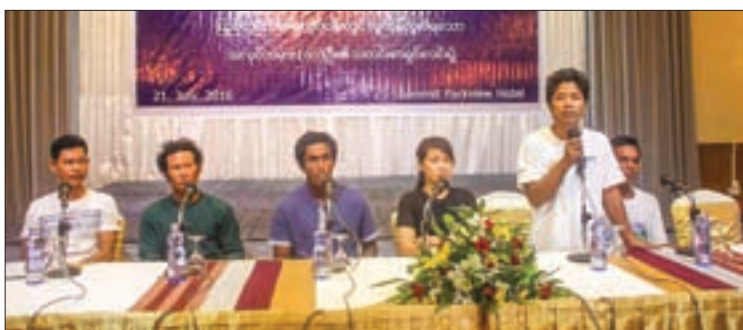
Rescued boat men give a press conference in Yangon.