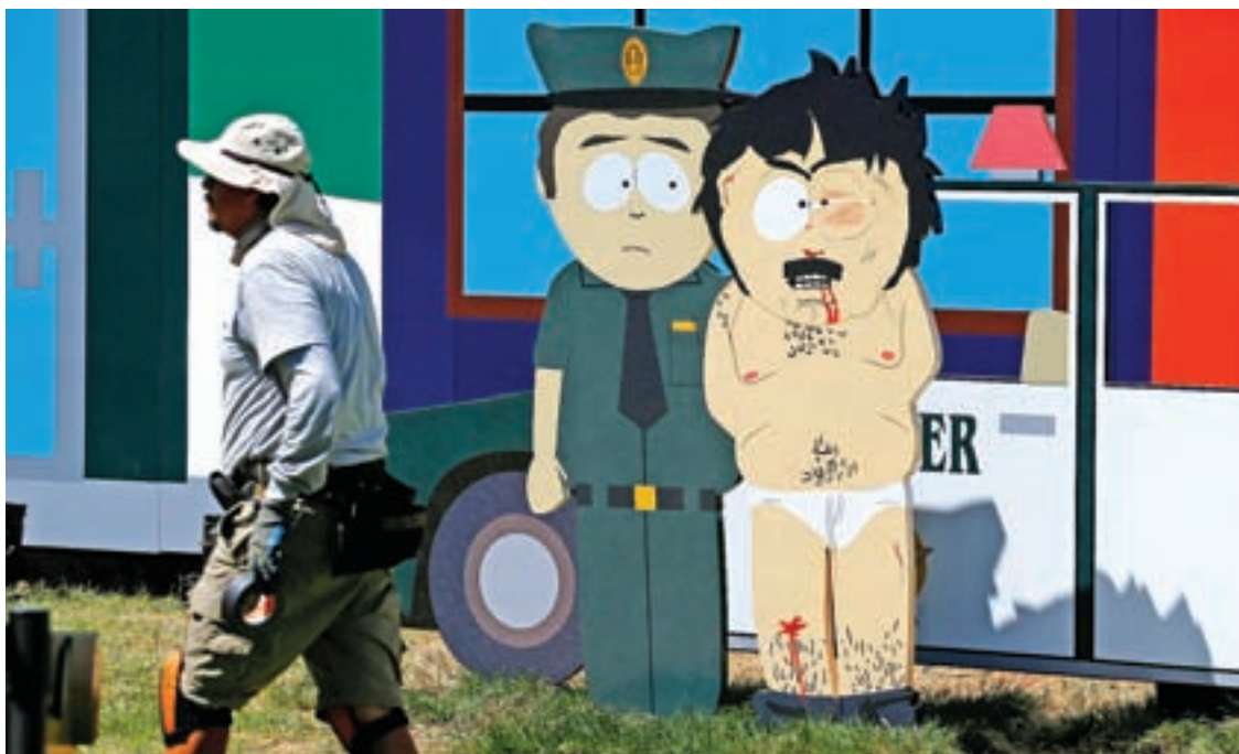
Workers finish off an outdoor display of the television show ‘South Park’ for the start of Comic-Con International in San Diego, California, United States, on 20 July 2016.

“I am excited to work with ‘World of Dance’, an organization that has had an immeasurable impact on the dance community, to give all dancers an enormous platform where their dreams can be realized.—PTI