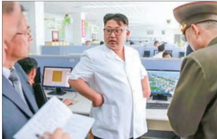
North Korean leader Kim Jong Un provides field guidance to the Paektusan Architectural Institute in this undated photo released by North Korea's Korean Central News Agency (KCNA) in Pyongyang on 14 July 2016.

The radio messages, also known as numbers stations, work