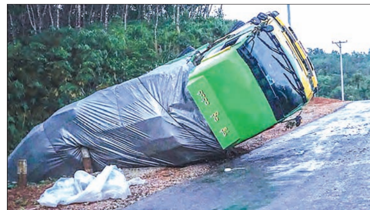
The 12-wheel truck overturned, blocking the road.

The driver, who resides in Zawkalay Strret-3, Kabyin Ward in Dawei Township, was deemed guilty of careless driving by local police.—Myint Oo (Myeik)