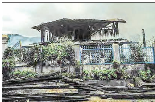
The house seen after outbreak of fire.

Action is being taken against the responsible