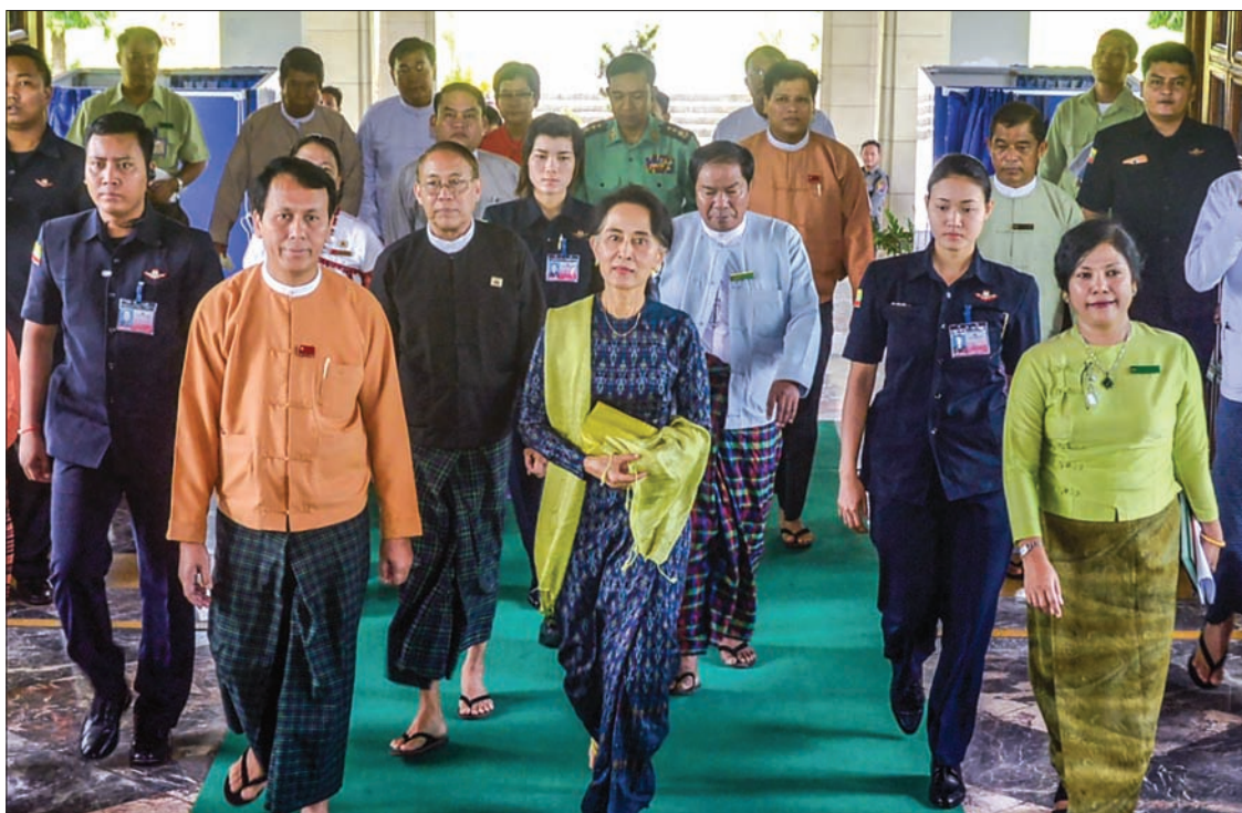
Daw Aung San Su Kyi arriving at the Yangon Region Government office.