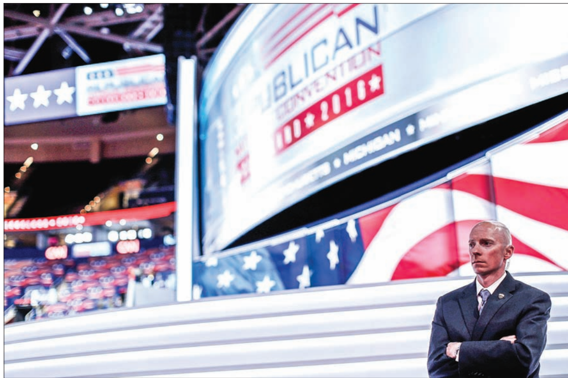
A US Secret Service agent stands on the floor of the Republican National Convention in Cleveland, Ohio, US, on 17 July 2016.