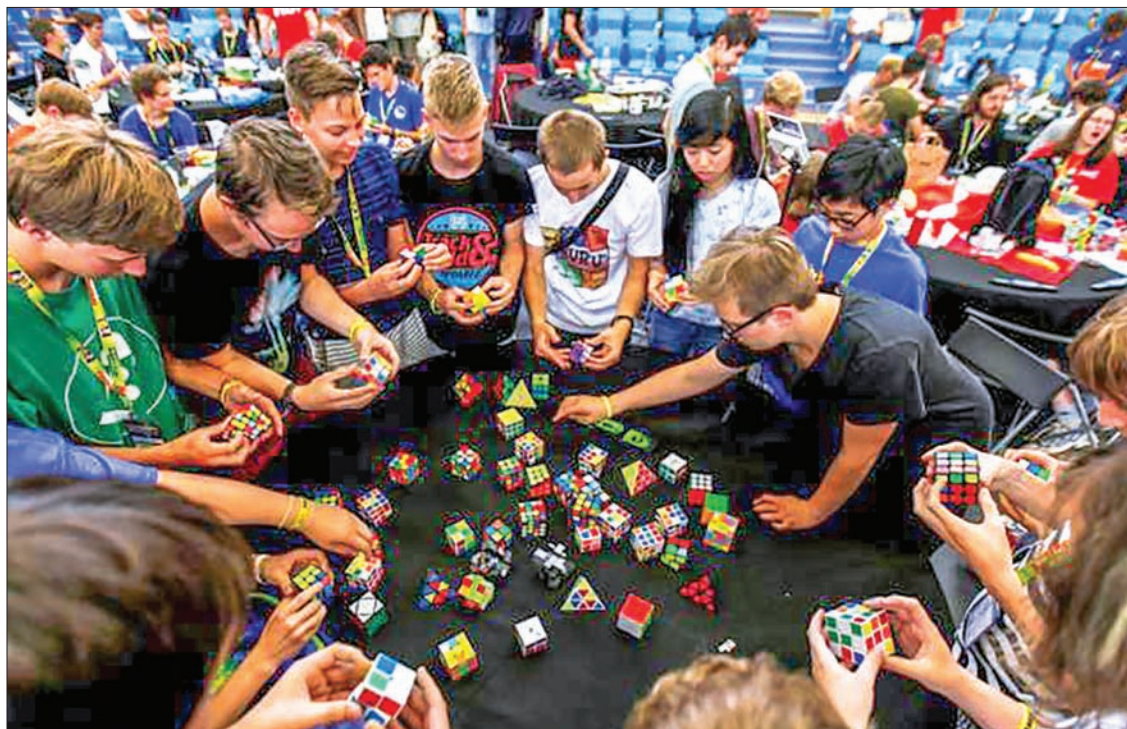
Competitors solve Rubik's cubes as they prepare for the Rubik's Cube European Championship in Prague, Czech Republic, on 17 July 2016.

The organisers said over 400 million Rubik's cubes had been sold globally.— Reuters