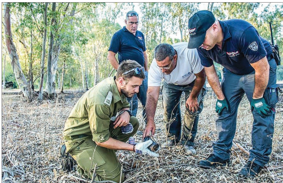
Members of Israeli security forces examine debris of Patriot air defense missiles in Ayelet Hashahar, northern Israel, on 17 July 2016. Israel launched two missiles in a failed attempt to down a Syrian unmanned aerial vehicle (UAV) over the Israeli-held Golan Heights on Sunday, the Israeli army said.

Israeli leaders have repeatedly stated in recent years the military would "know how to act" in case Israel's security interests are compromised.—Xinhua