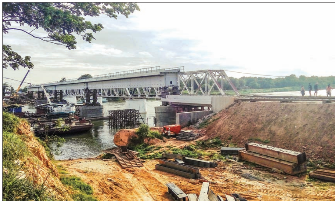
The new railroad bridge near Myitnge Railroad Bridge being seen.

A NEW railroad bridge on the Yangon-Mandalay Road is nearly finished and it is estimated that the construction will be fully completed later this month, according to its project manager.