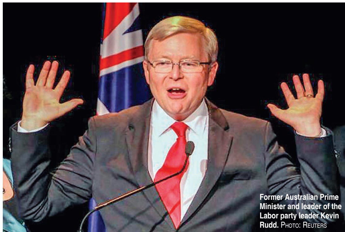
Former Australian Prime Minister and leader of the Labor party leader Kevin Rudd.