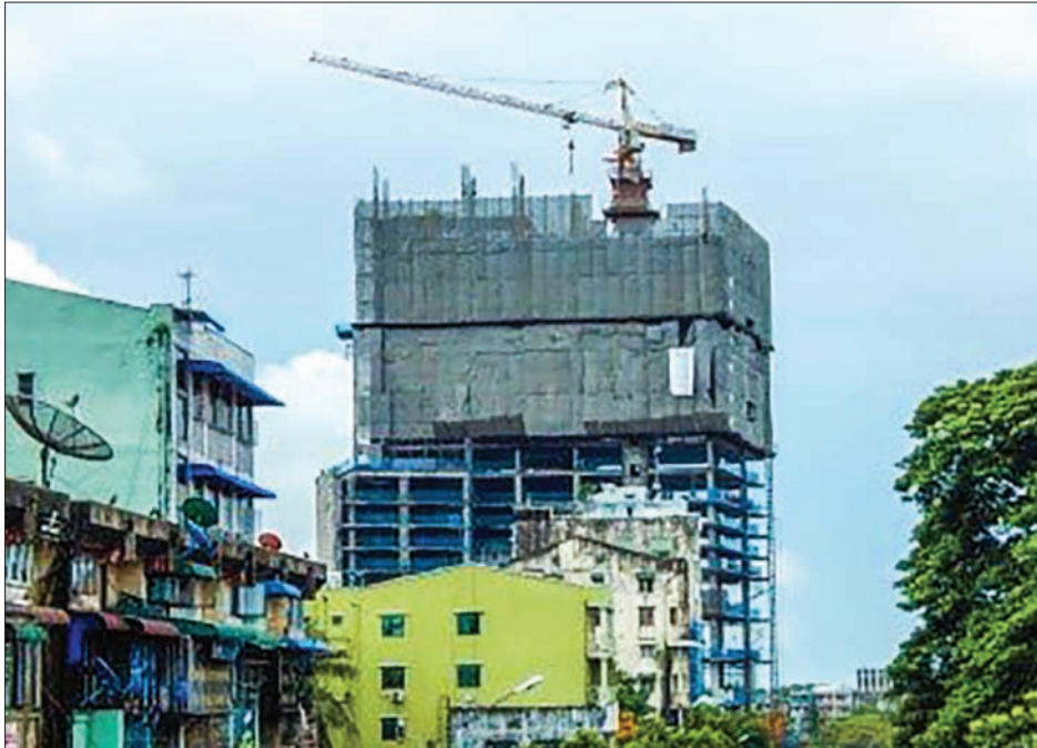
A high-rise building being seen unfinished .

DEVELOPERS are due to meet to discuss the suspension of high-rise building projects in Yangon before submitting complaints to the authorities and the