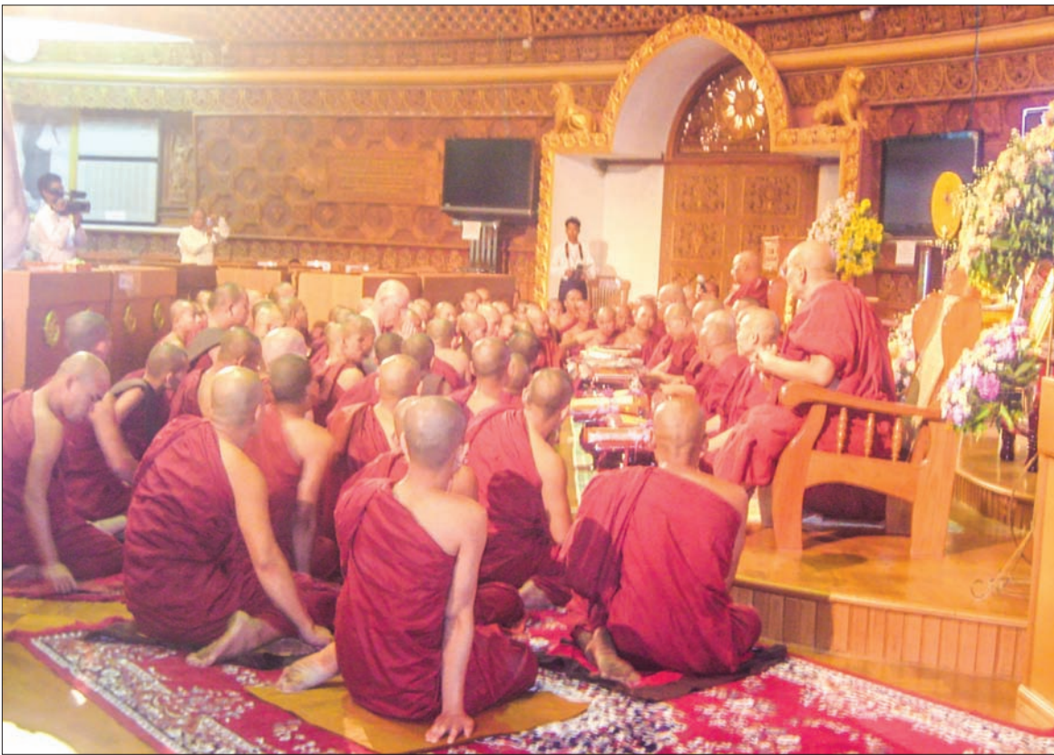
The ordination being held in the sima (ordination hall).

Waso-robe offering to make to, monks is not only religious event of this month but also the festive occasion of socio-cultural significance. Wet season needs spare robes for monks so donors, individually or in group hold Waso robe offering together with other offertories, food, dry ration, candles and flowers. While adolescents and adults devote to the religious aspects of the event, the younger generations are involves in socio-cultural activities such as going out into the nearly wood lands to gather wild flowers and