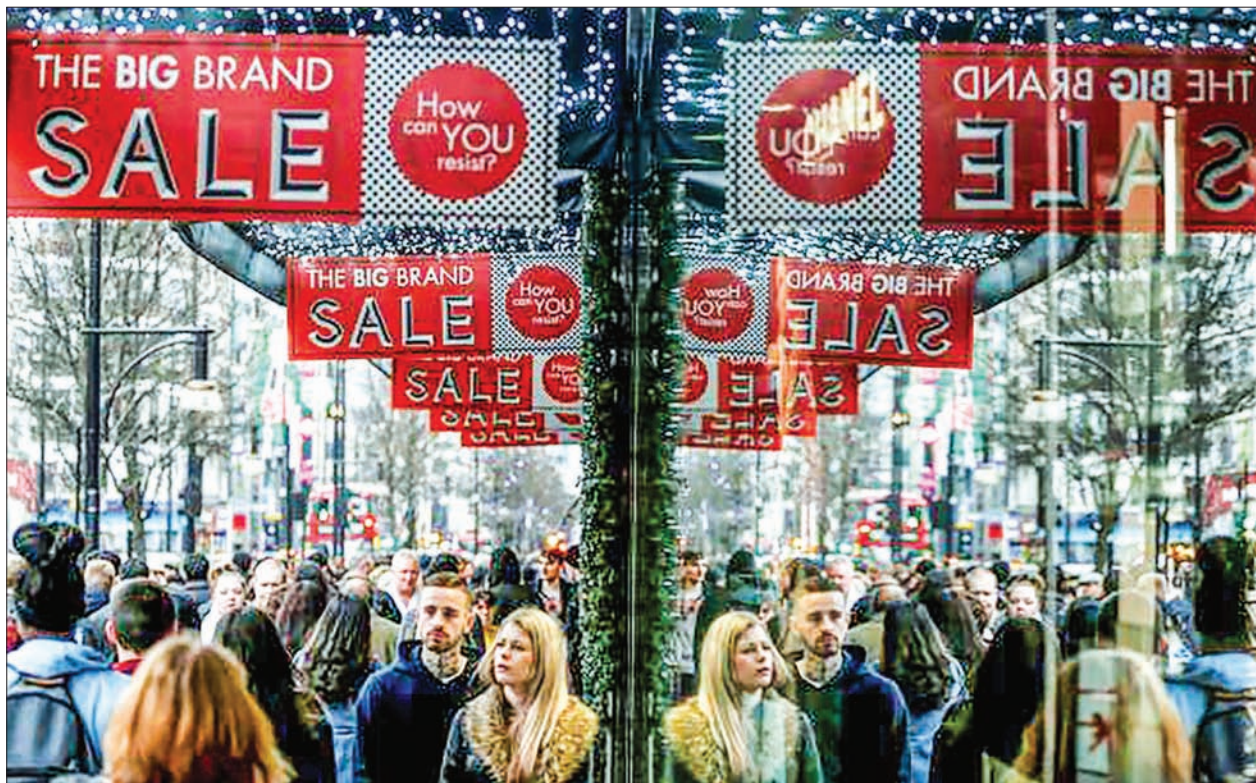
Shoppers are reflected in a store window as they pass sales advertisements on Oxford Street in London, Britain, in 2015.

Britain's shock vote on 23 June to exit the European Union has sent jitters