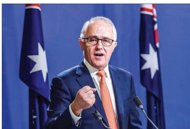
Australian Prime Minister Malcolm Turnbull speaks during a news conference in Sydney, Australia, on 10 July 2016.

Although Turnbull has formed a narrow majority government, his gamble in calling the election backfired badly, with a swing to the centre-left Labor opposition and a rise in the popularity of