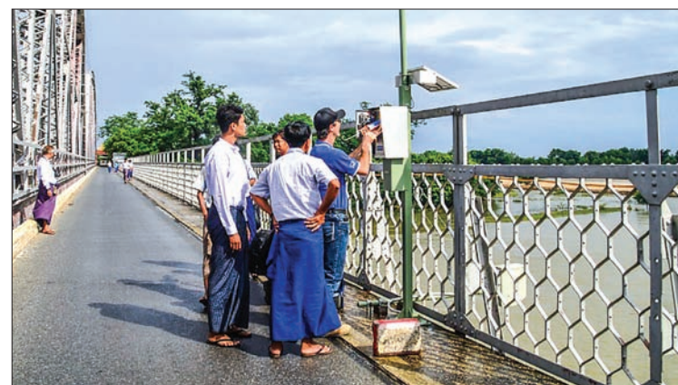
A sommer rader installed in Mandalay to measure water flow of Ayeyawady River.

The Meteorology and Hydrology Department normally conducts measurements of water flow on the river three times a day with the use of a manual system.—Aung Thant Khaing