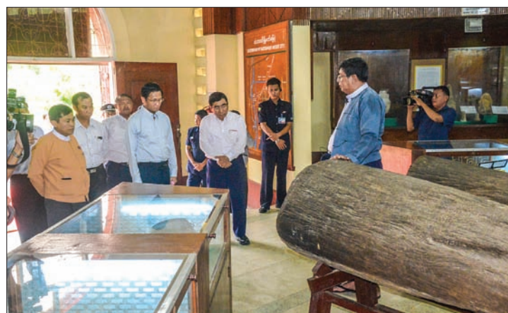
Vice President U Henry Van Thio visits Kanbawzathadi Palace museum during his tour of inspection to Bago.

According to sources, K1.7 billion had been distributed to the areas where natural disasters occur as of 17 July. Next, the Vice President inspected dredging works being undertaken along Bago River and Mazin and Gaunghsaykyun lake to protect Bago from flooding. He also visited Mazin Dam, Kambawzathadi Palace, Bago-Sittaung canal in Thanatpin, Kamase jetty and Ohnne-Walpayat canal in Kawa.— Myanmar News Agency