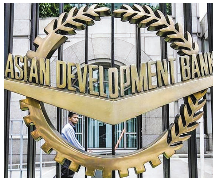
A worker walks past inside the Asian Development Bank (ADB) headquarters in Manila, in 2009.

Growth forecasts for Southeast Asia were also left unchanged at 4.5 percent this year and 4.8 percent next year.—Reuters