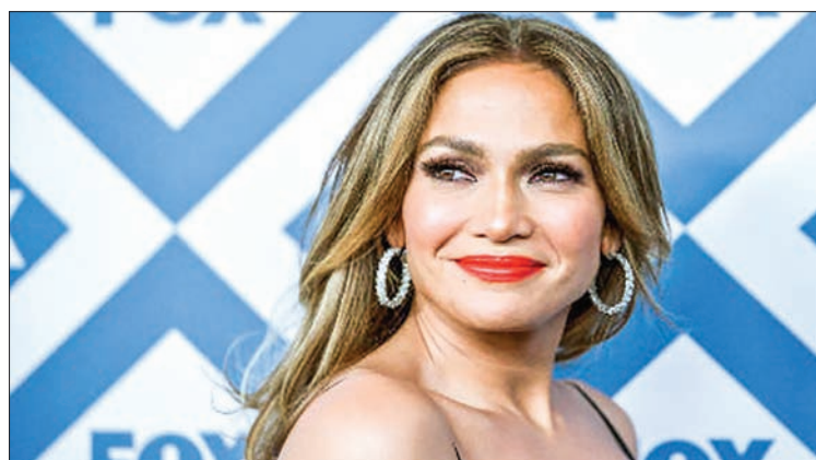
Jennifer Lopez, who will turn a year older on July 24, says she wants the world to resolve all differences and maintain peace.

Rounding out the top five, Fox's "Mike and Dave Need Wedding Dates" picked up $7.5 million, bringing the raunchy comedy's domestic receipts to $31.3 million. Just in time for the Republican National Convention, conservative director Dinesh D'Souza has struck a chord with far right audiences yet again, releasing "Hillary's America: The Secret History of the Democratic Party" to a $77,500 opening from just three theaters.— Reuters