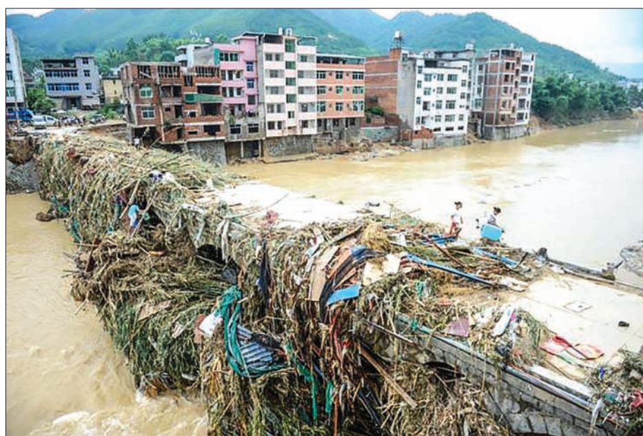
Residents walk on a bridge after Typhoon Nepartak in Fuzhou, Fujian Province, China, on 11 July 2016.

Minqing County, one of the worst-hit regions, saw cutoff of electricity power and telecommunication services in its 11 towns and townships. One third of the county's population were af-