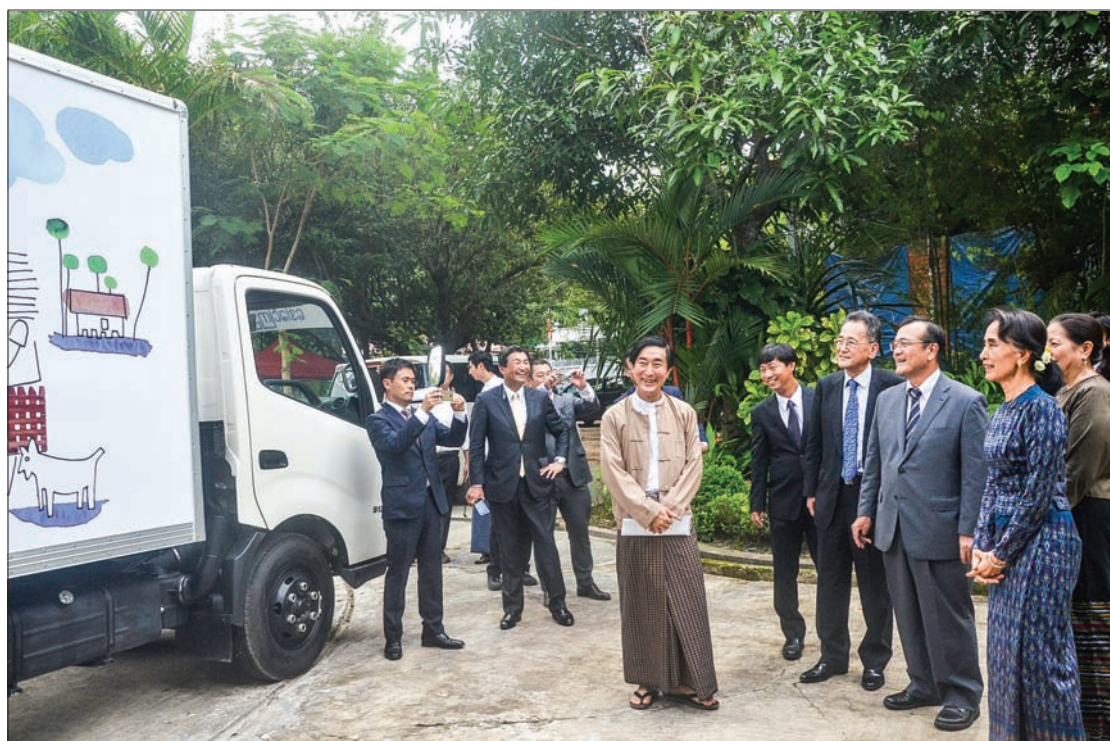
State Counsellor being seen observing the mobile library.

STATE Counsellor Daw Aung San Suu Kyi attended a ceremony to donate three vehicles worth over US$ 200,000 for Daw Khin Kyi Foundation's mobile library by Sumitomo Corporation Asia & Oceania Pte Ltd in Yangon yesterday.