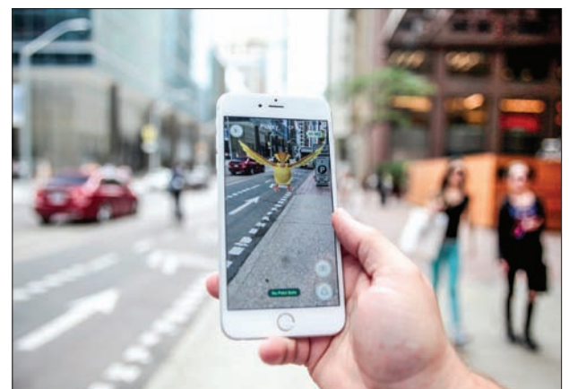
A "Pidgey" Pokemon is seen on the screen of the Pokemon Go mobile app, Nintendo's new scavenger hunt game which utilizes geo-positioning, in a photo illustration taken in downtown Toronto, Ontario, Canada, on 11 July 2016.

"When you sell $400 dedicated devices and you sell the gamer boxed software for $60 a piece — for them this is the gold stand-