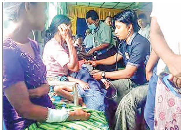
Poisoned victims receiving medical care.