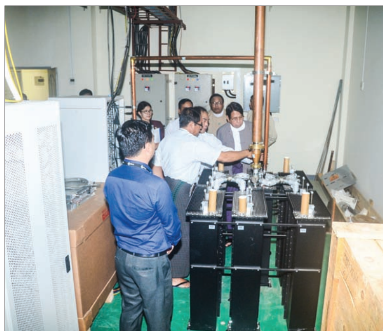
Union Minister Dr Pe Myint being seen in MRTV, Yangon.

UNION MINISTER for Information Dr Pe Myint called for bright ideas and cooperation among staff to develop Myanmar Radio and Television in meeting with members of MRTV in Yangon yesterday.