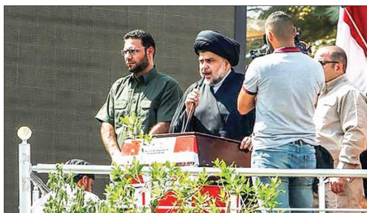
Iraqi Shi'ite cleric Moqtada al-Sadr speaks during a protest against corruption at Tahrir Square in Baghdad, on 15 July 2016.

The Mahdi Army was disbanded in 2008, replaced by the Peace Brigades, which helped push back Islamic State from near Baghdad in 2014 under a government-run umbrella, and maintains a presence in the capital and several other cities. Sadr, who commands the loyalty of tens of thousands of