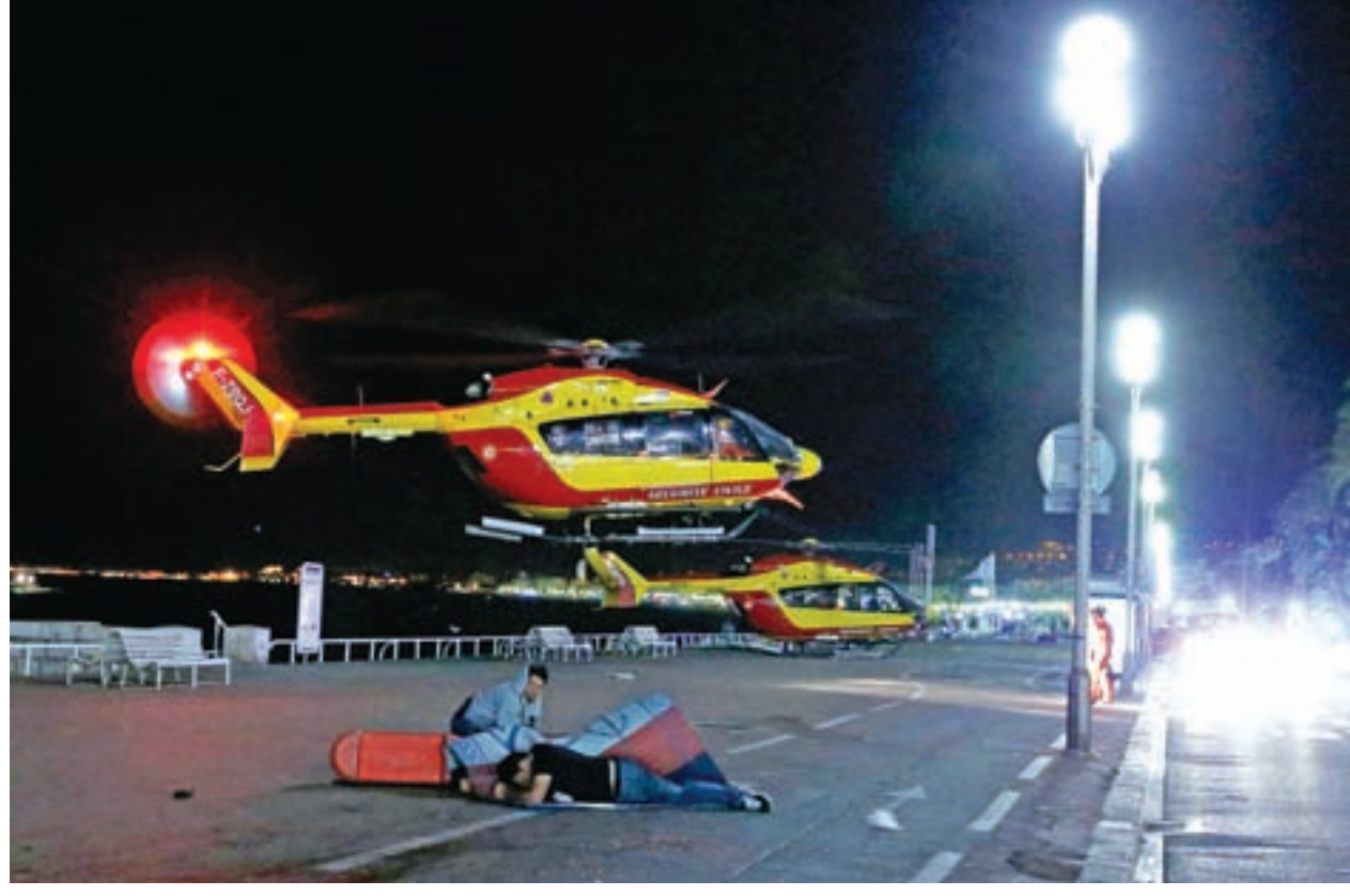
An injured individual is seen on the ground after a heavy truck ran into a crowd at high speed killing scores celebrating the Bastille Day on 14 July national holiday on the Promenade des Anglais in Nice, France, on 14 July 2016.

Hollande said in a predawn address that he was calling up military and police reservists to relieve forces worn out by enforcing a state of emergency begun in November after Islamic State gunmen and suicide bombers struck Paris enter-