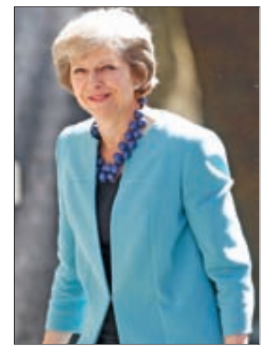
Britain's Prime Minister Theresa May arrives at 10 Downing Street, in central London on 14 July 2016.

Coalville, a former mining town now scattered with business parks and industrial estates, and