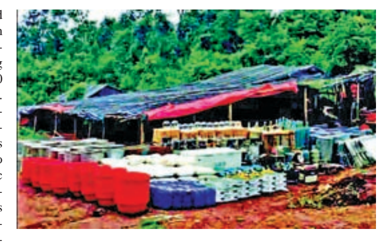
Precursory elements and ammunition seized in Lashio.

A COMBINED police squad comprising policemen from Lashio seized precursory elements used in opium refining near Mone Hlyan village on 10 July, according to a police report. The police discovered 70 gas cylinders, two generators, two stirring machines, 14 refrigerators and six dynamos. The police also seized 26,700 litres of sulfuric acid, sodium hydroxide weighing 2,500 kilograms, 9,400 litres of dimethyl sulphate, a hand grenade and ammunition. Local police have pressed charges.—MNA