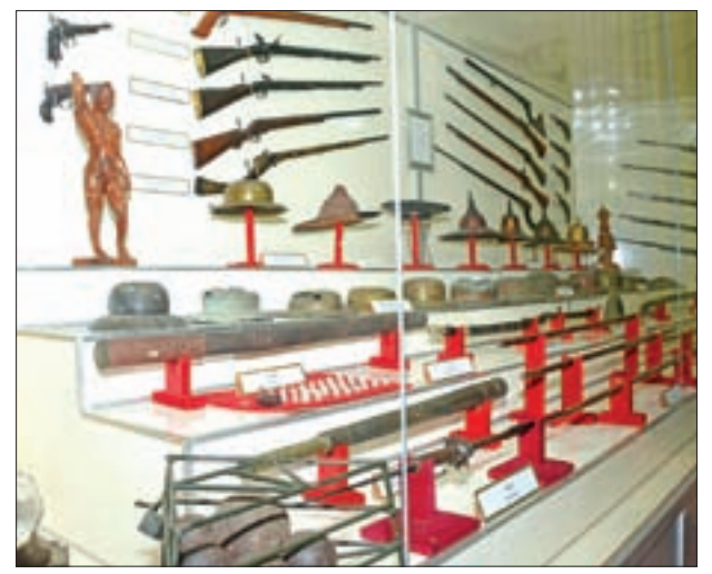
State Counsellor Daw Aung San Suu Kyi visits Defence Services Museum in Nay Pyi Taw.

STATE Counsellor Daw Hlaing, Deputy Commandthe Defence Services Museum in Nay Pyi Taw yes-