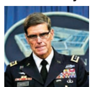
US Army General Joseph Votel, commander, US Central Command.

BAGHDAD — The US military expects to seek additional troops in Iraq, even beyond the hundreds announced this week, as the campaign against the Islamic State advances, the head of the US military's Central Command told Reuters.