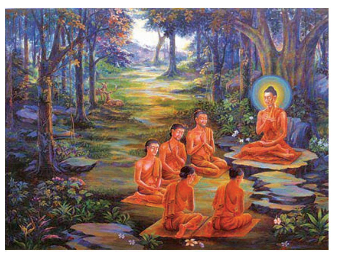
The first sermon at the deer park being delivered to Five Disciples.

During the three months of monsoon rains, Bhikhus go into