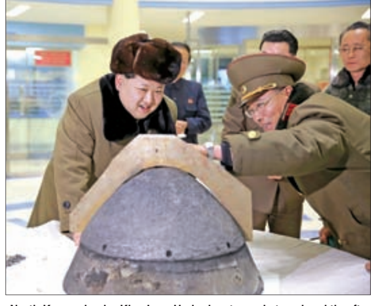
North Korean leader Kim Jong Un looks at a rocket warhead tip after a simulated test of atmospheric re-entry of a ballistic missile, at an unidentified location in this undated file photo released by North Korea's Korean Central News Agency (KCNA) in Pyongyang on 15 March 2016.

North Korea also said on Monday it was cutting off its only channel of communica-