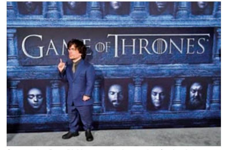
Cast member Peter Dinklage attends the premiere for the sixth season of HBO's 'Game of Thrones' in Los Angeles on 10 April 2016.

The show aired against a contemporary backdrop of rising tensions between minority communities and law enforcement over a series of killings of unarmed black men at the hands of novel series "A Song of Ice and police in cities across the coun- Fire," was named outstanding