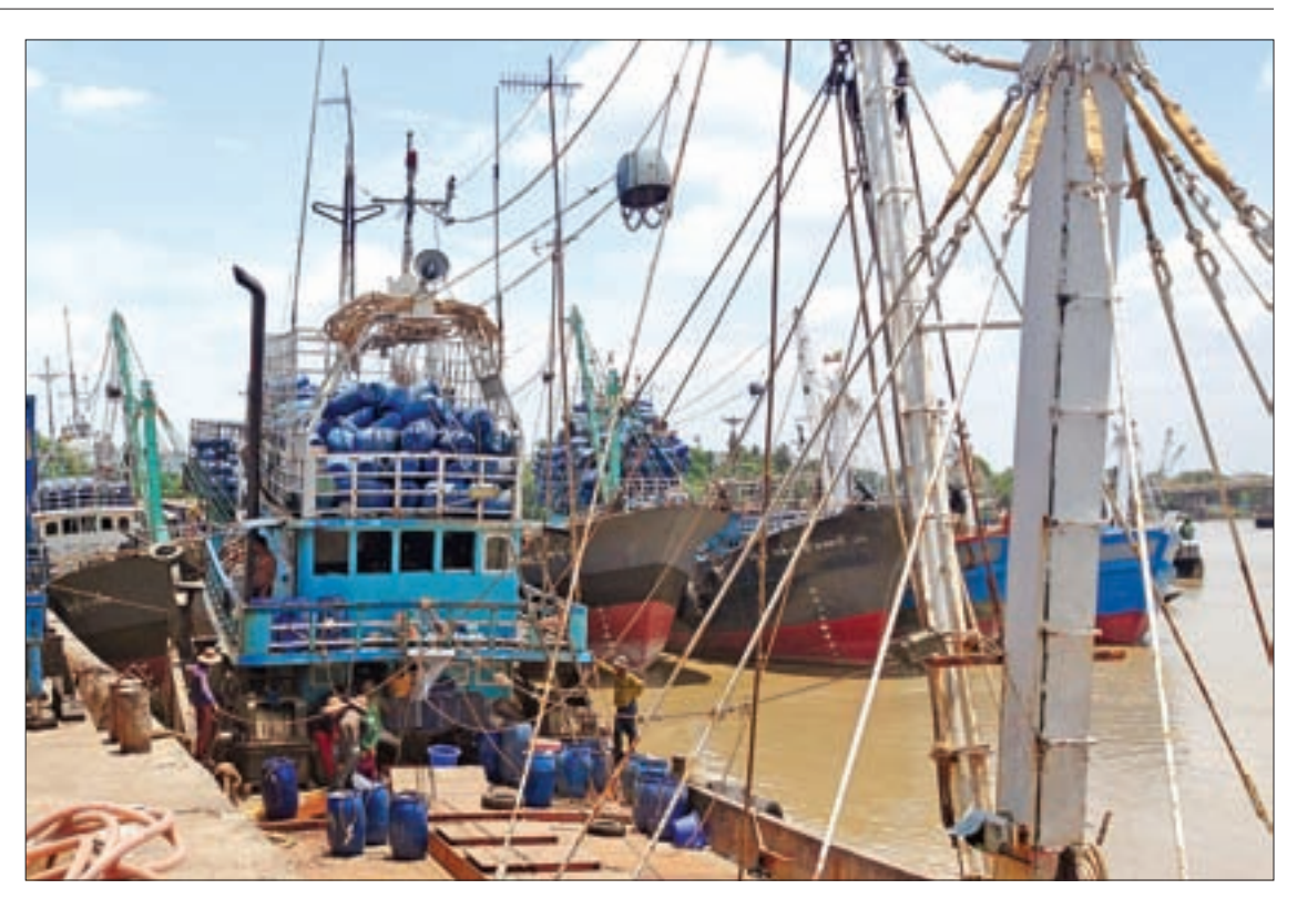
Fishing boats being anchored at Thidarseik Jetty in Yangon on 18 May.

Illegal fishing has been going on during the restricted period and so the authorities concerned and supportive locals will jointly take severe actions against those disobedient owners of the illicit fishing vessels in those restricted areas.—200