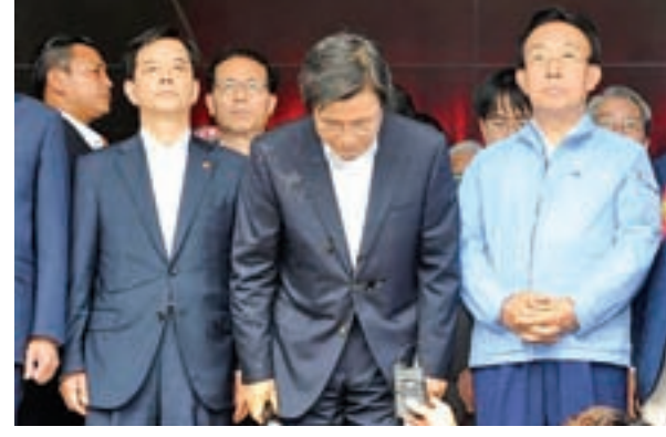
South Korean Prime Minister Hwang Kyo-ahn bows during a meeting with residents in Seongju where a US THAAD anti-missile defence unit will be deployed, South Korea on 15 July.

A senior official, however, refused to provide details of their discussions concerning maritime territorial disputes. Abe told Li "Japan's hitherto known position," according to the official. While acknowledging remaining thorny issues, Abe and Li agreed to step up cooperation to fight the rise of terrorism and to prevent the sluggish world economy from being hit hard by Britain's vote last month to leave the European Union, according to the official.—Kyodo News