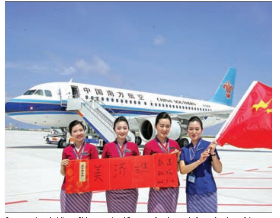
Crew members holding a Chinese national flag pose for pictures in front of a plane of the China Southern Airlines as the plane landed at a new airport China built on Mischief Reef of the Spratlys, South China Sea, on 13 July 2016.

"There is surprise at the extent of the sheer arrogance of these judges sitting (in Eu-