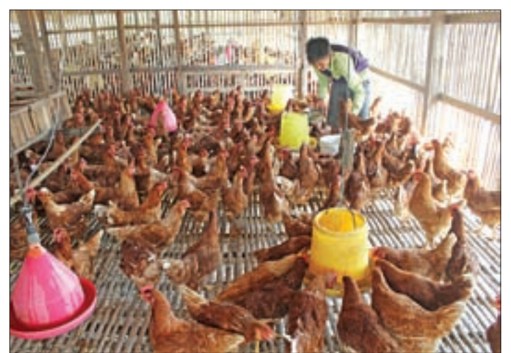
A worker seen feeding chicken at a farm in Tatkon.

That's a clucking big mark up! Live chickens are being imported from Thailand and are entering Yangon, raising fears about the outbreak of the infectious diseases. A laboratory to check the feedstuff is also required in Yangon, said Daw Thein Thein Hla, a breeder. —Zar Zar