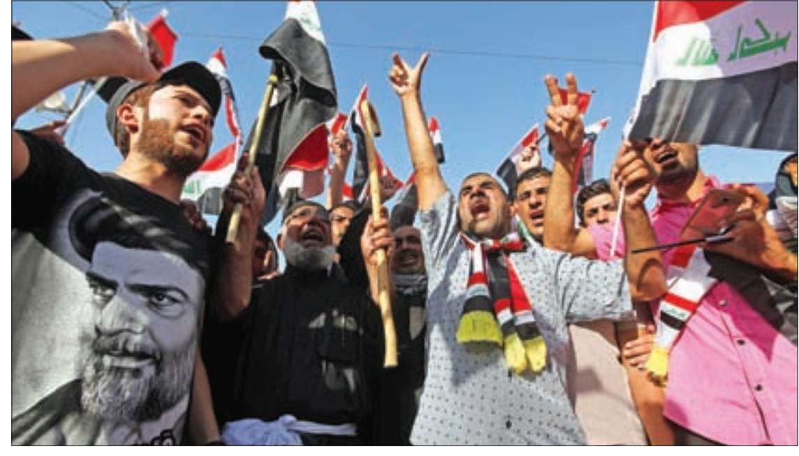
Supporters of Iraqi Shi'ite cleric Moqtada al-Sadr shout slogans during a protest against corruption at Tahrir Square in Baghdad, on 15 July 2016.

Activity in much of Baghdad crawled to a halt overnight as se-