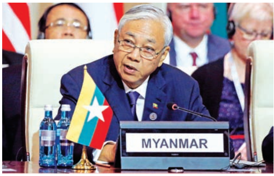
President U Htin Kyaw speaks during the opening session of the Asia-Europe Meeting (ASEM) summit in Ulaanbaatar, Mongolia, on 15 July, 2016.

Before concluding speech, the President reaffirmed Myanmar's commitment to host the next ASEM Foreign Ministers' Meeting in the second half of 2017, saying that the meeting