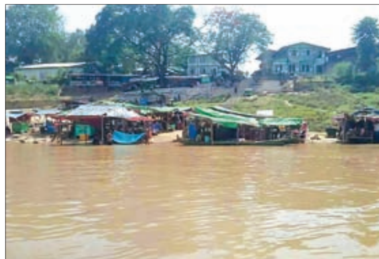
Swollen Chindwin River threatens people living near it with floods.

The department advised people settled near the river bank and low-lying areas along the Ngawun River to take precautionary measures.— Myanmar News Agency