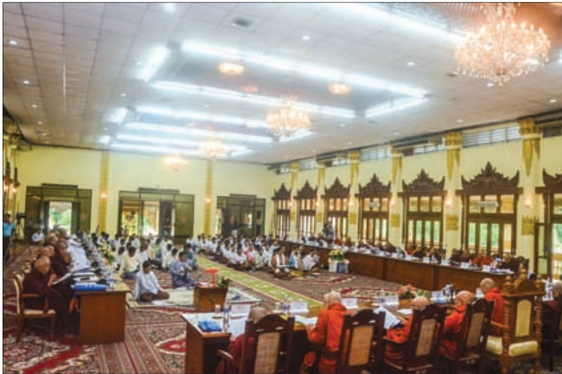
47-member SSMNC meeting in progress.

THE State Sangha Maha Nayaka Committee held the second day of its 47-member plenary session at the Wizaya Mingala Dhamma Hall on Thiri Mingala Kaba Aye Hill yesterday.