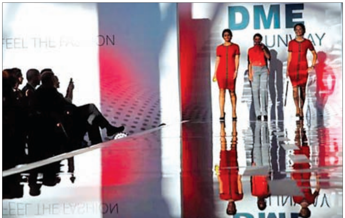
Flight attendants from various airlines perform during a show at Domodedovo International Airport outside Moscow, Russia, on 12 July 2016.

Tuesday's fashion show was timed to mark Flight Attendant Day celebrated in Russia on 12 July. —Reuters