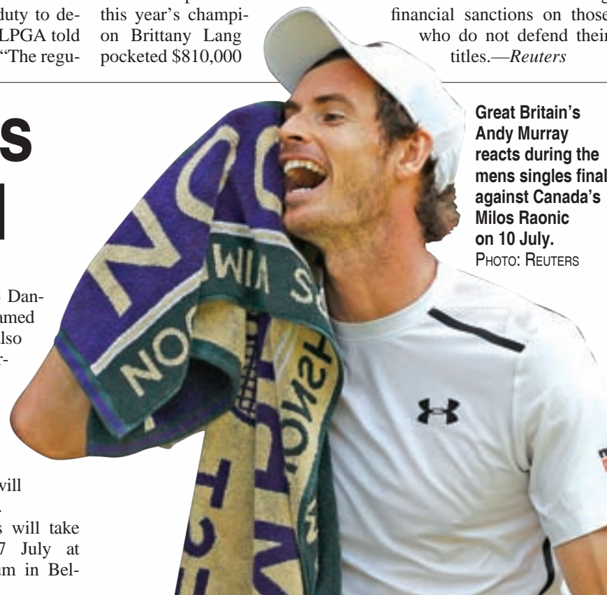
Great Britain's Andy Murray reacts during the mens singles final against Canada's Milos Raonic on 10 July.

The quarter-finals will take place between 15-17 July at the Tasmajdan Stadium in Belgrade.—Reuters