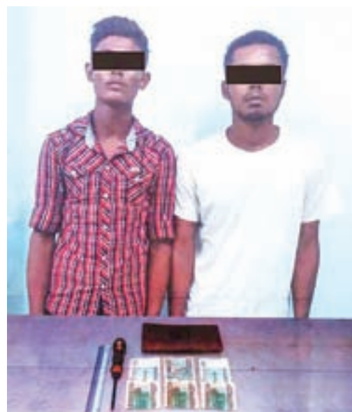
Two snatchers being seen.