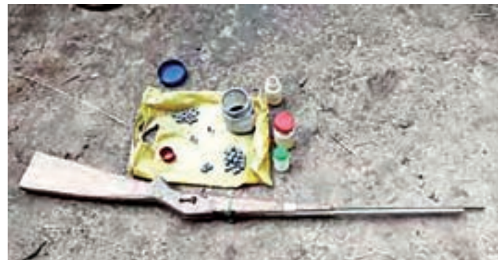
The firearm that misfired the victim.

He struck his daughter with the butt of his gun which misfired and shot him dead. Police are still investigating.