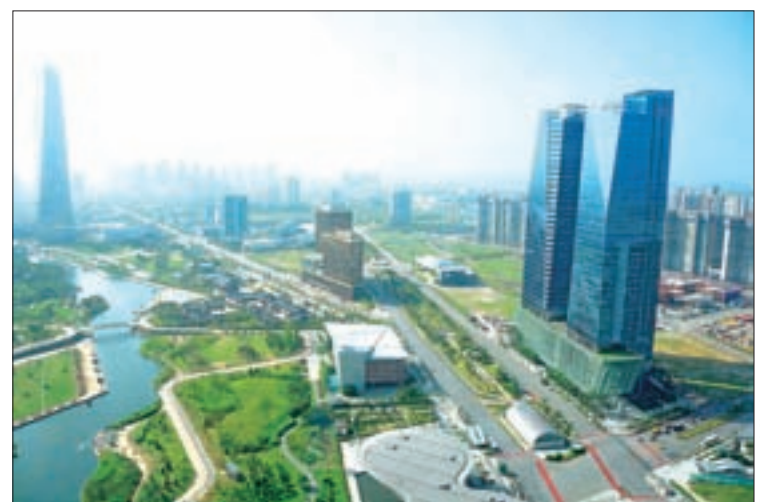
Panoramic view of Incheon Free Economic Zone.