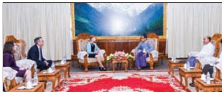
Union Minister U Kyaw Tint Swe receives Adviser to the US Secretary of State Ambassador Kristie Kenney.

UNION Minister for the Office of the State Counsellor U Kyaw Tint Swe met with Adviser to the United States Secretary of State Ambassador Kristie Kenney at the President's Office in Nay Pyi Taw yesterday.