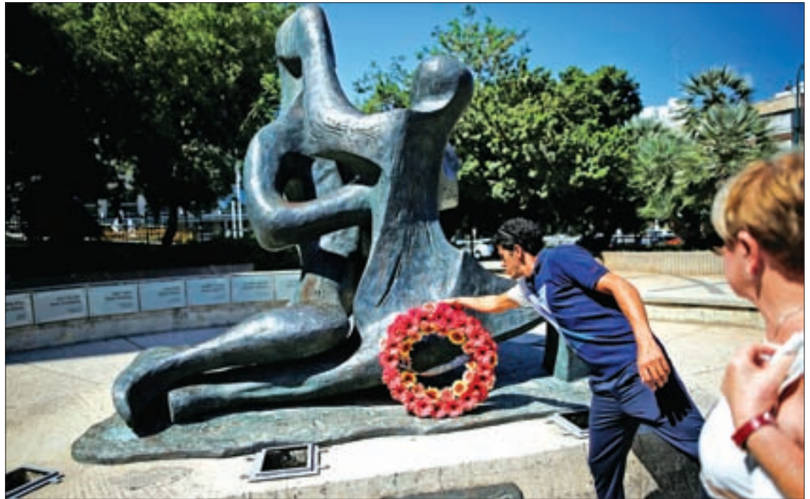
Israeli windsurfer Shahar Tzuberi, who will represent Israel at the 2016 Rio Olympics, lays a wreath during a memorial ceremony for the 11 Israeli team members who were killed by Palestinian gunmen during the 1972 Summer Olympics in Munich, in Tel Aviv, Israel, on 13 July 2016.

Within 24 hours, 11 Israelis, five Palestinians and a German policeman were dead after a standoff and subsequent rescue effort erupted into gunfire. —Reuters