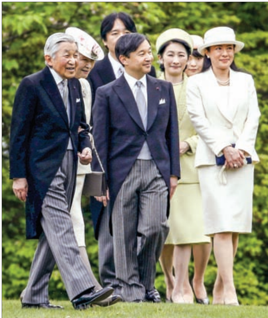
Japan's Emperor Akihito (L), flanked by Empress Michiko (2nd L), leads his royal family members Crown Prince Naruhito (4th R), Crown Princess Masako (R), Prince Akishino (behind Naruhito), Princess Kiko (behind Masako) and their daughter Princess Mako to greet guests during the annual spring garden party at the Akasaka Palace imperial garden in Tokyo, Japan, on 27 April 2016.