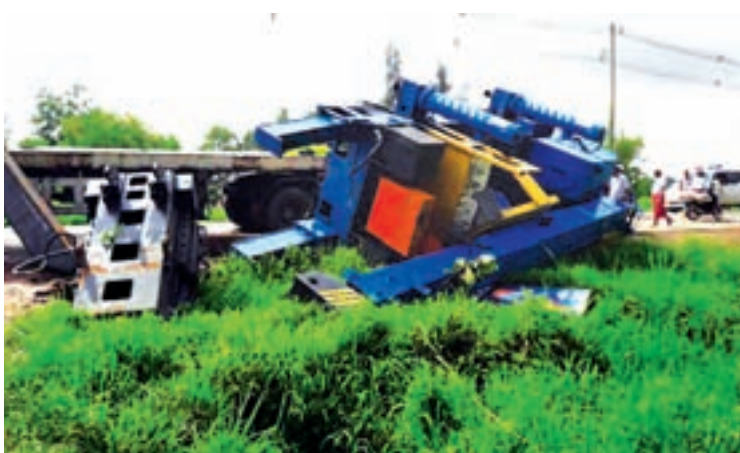
The V-pile being seen after falling.

One man succumbed to his injuries at the scene while five others were injured seriously. The injured are undergoing medical treatment at Insein