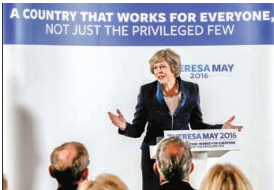
Britain's Home Secretary Theresa May speaks during her Conservative party leadership campaign at the Institute of Engineering and Technology in Birmingham, England, Britain on 11 July 2016.

Just over an hour after entering her new office, she started naming ministers, appointing the steady and experienced foreign minister Philip Hammond to take charge of the finance ministry. He replaces George Osborne, whose determination to balance Britain's