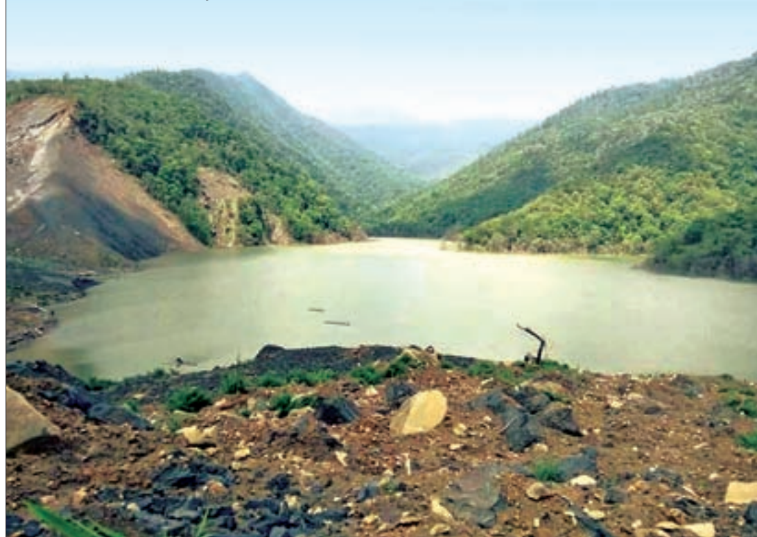
The natural dam caused by landslide in Chin State.

or lake caused by the landslide on the border between Sagaing Region and Chin State, Ministry of Agriculture, Livestock and Irrigation dealt with possible risks of the lake before the rainy season.— Min Thit