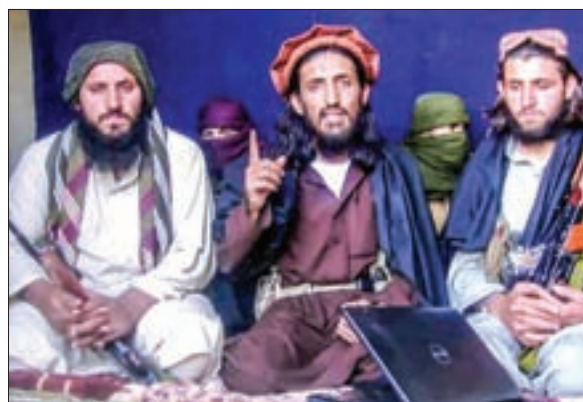
In this file image taken from a video recording, Omar Khalid Khorasani (C), a top Pakistan Taliban commander, gives an interview in Pakistan's Mohmand tribal region on 2 June 2011.

In May, Mullah Mohammad Akhtar Mansour, leader of the Afghan Taliban, was killed by a drone on the Pakistani side of the border. The Pakistani Taliban is waging war against the Pakistani state and is separate from the Afghan Taliban. It claimed responsibility for the attack on the Army Public School in Peshawar, in northwest Pakistan, in December 2014, in which at least 132 children, nine staff and several attackers were killed. —Reuters