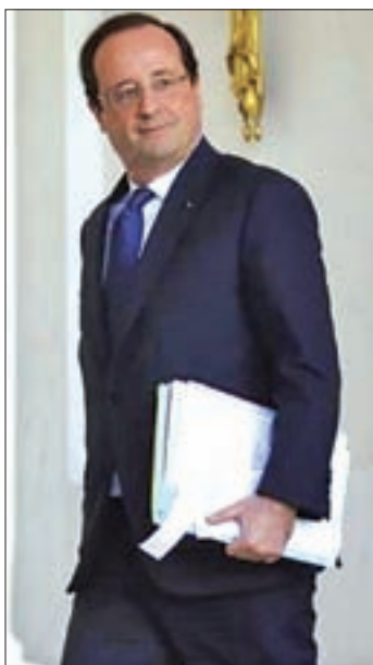
French President Francois Hollande leaves after the weekly cabinet meeting at the Elysee Palace in Paris, on 13 November 2013.

PARIS — French social media was abuzz with suggestions of novel haircuts for Francois Hollande on Wednesday after it emerged that the French president's receding hairline was maintained by a costly,