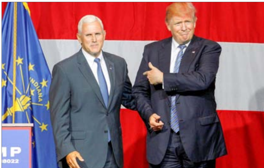
Republican presidential candidate Donald Trump (R) and Indiana Governor Mike Pence (L) wave to the crowd before addressing the crowd during a campaign stop at the Grand Park Events Centre in Westfield, Indiana, on 12 July 2016.