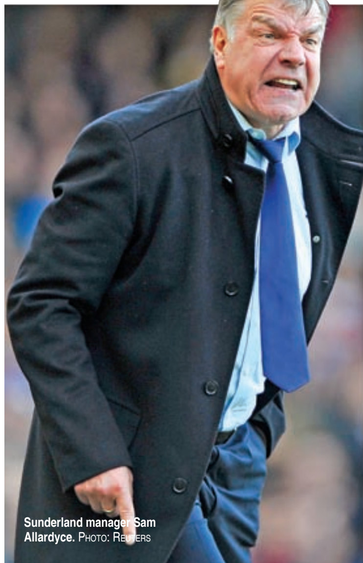
Sunderland manager Sam Allardyce.