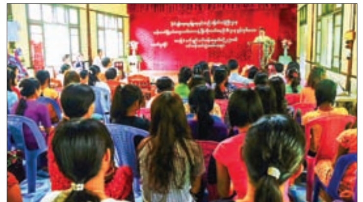
Closing ceremony of basic tailoring course being held.