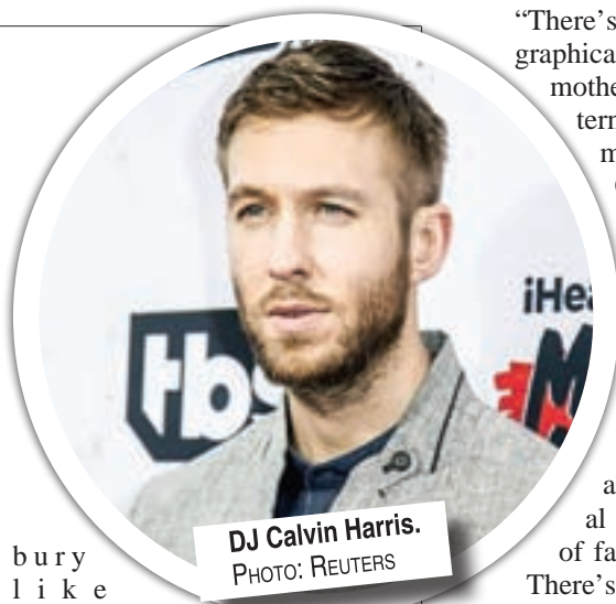
DJ Calvin Harris.

Harris also hinted at a long-suspected feud between Swift and pop star Katy Perry, saying "I know you're off tour and you need someone new to try and