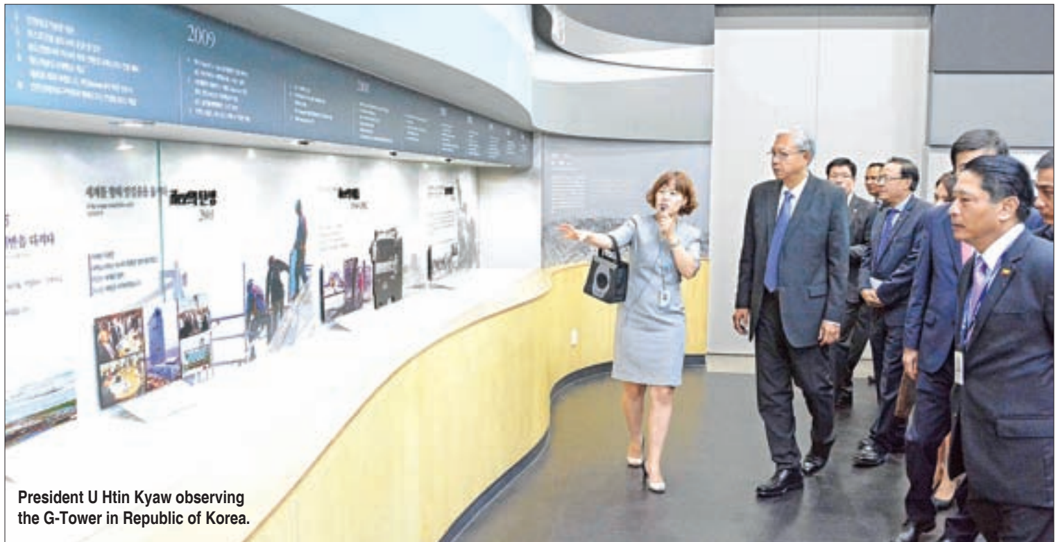
President U Htin Kyaw observing the G-Tower in Republic of Korea.

The President and party left for Mongolia in the afternoon and arrived at Chinggis Khaan International Airport in Ulaanbaatar, Mongolia in the evening.— Myanmar News Agency