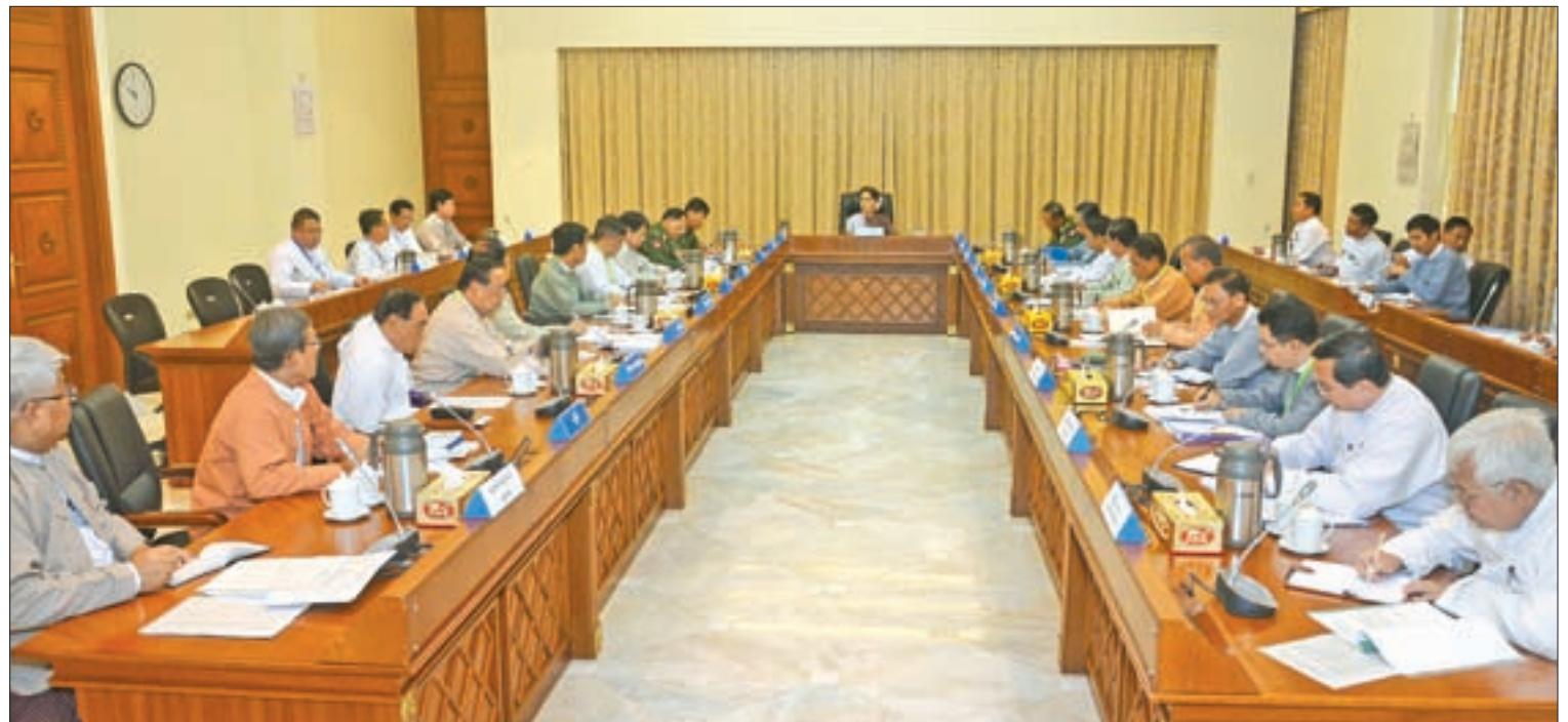
Daw Aung San Suu Kyi chairs meeting of the central committee for the implementation of peace, stability and development in Rakhine State.

Next, Union Minister for Border Affairs Lt-Gen Ye Aung, vice chairman of the central committee, elaborated on ongoing works and progress in developmental undertakings for townships in Rakhine State and work