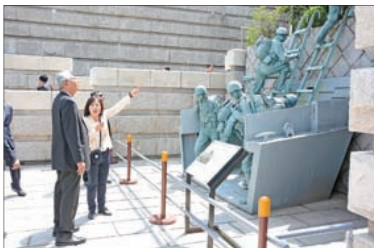
President U Htin Kyaw visits memorial place for Incheon Landing Operation.