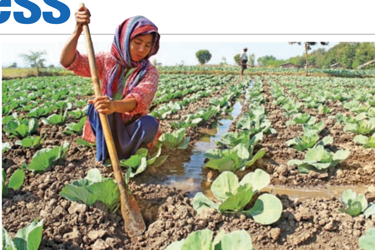
A farmer digging in soil with a hand shovel at a cabbage farm outside Nay Pyi Taw.

In the breeding stage the birds are chosen and then injected with single dose of hormone which comes from the pituitary gland of rohu. Seven or nine milligrams of hormone dose are used for female climbing perch while four or five milligrams of hormone are used for male climbing perch. The growth of the birds is monitored once a week, according to the ministry.—City News