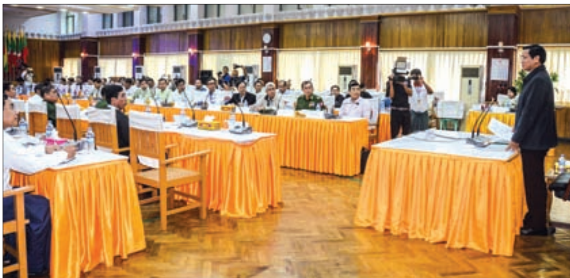
VICE-President U Henry Van Thio holds talks with authorities in Rakhine State on relief and resettlement works to aid flood victims in the state.

Next, the Union Minister Dr Win Myat Aye elaborated on disaster preparedness measures and pointed out that peace and stability are key to socio-economic development in Rakhine State.