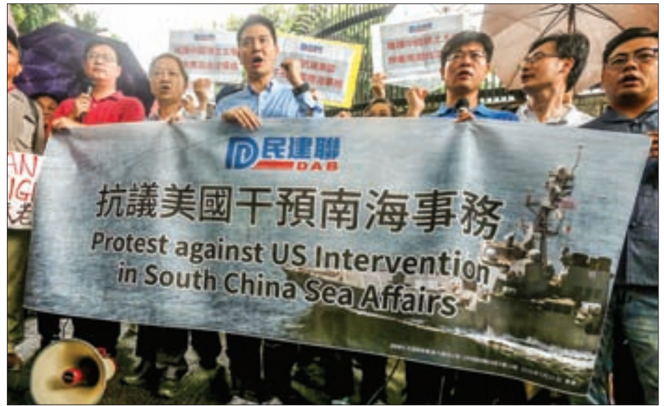
Protesters from a local pro-China party chant slogans against the United States supporting an international court ruling that denied China's claims to the South China Sea, outside US Consulate in Hong Kong, China on 14 July 2016.

The ruling is binding for Beijing and Manila, but it also set a legal precedent by determining that UNCLOS rules take precedence over China's historic claims. That bolsters the treaty's standing in international law, experts said. "It will have enormous impact on future jurisprudence and on the perceived legitimacy of other claims in the South China Sea and around the world," said Gregory