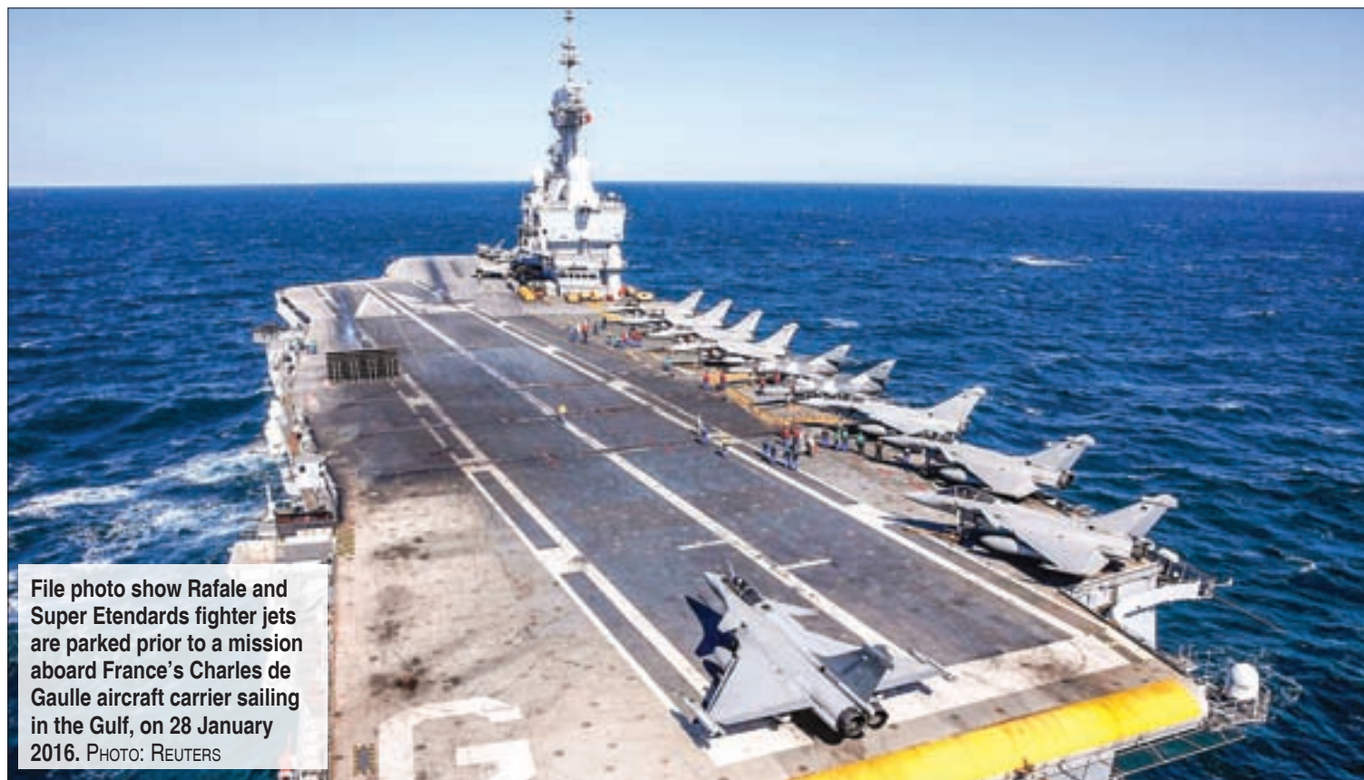
File photo show Rafale and Super Etendards fighter jets are parked prior to a mission aboard France's Charles de Gaulle aircraft carrier sailing in the Gulf, on 28 January 2016.