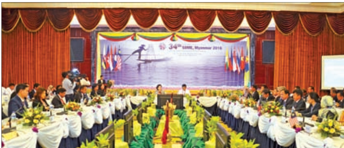
ASEAN senior officials meeting on energy being held in Nay Pyi Taw.

THE ASEAN Senior Officials Meeting on Energy took place in Nay Pyi Taw, attracting senior officials from Australia, China, India, Japan, South Korea, New Zealand, Russia and the United States.