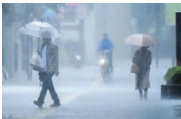
Pedestrians brave a downpour in the southwestern Japan city of Fukuoka in Kyushu on 13 July 2016. The area was hit by "heavy rain seen once in 50 years," a local observatory said.

A downpour of 300 millimetres was logged in 48 hours through Wednesday morning in Tsushima, Nagasaki Prefecture, while the city of Dazaifu in Fukuoka Prefecture and the city of Yamaguchi recorded