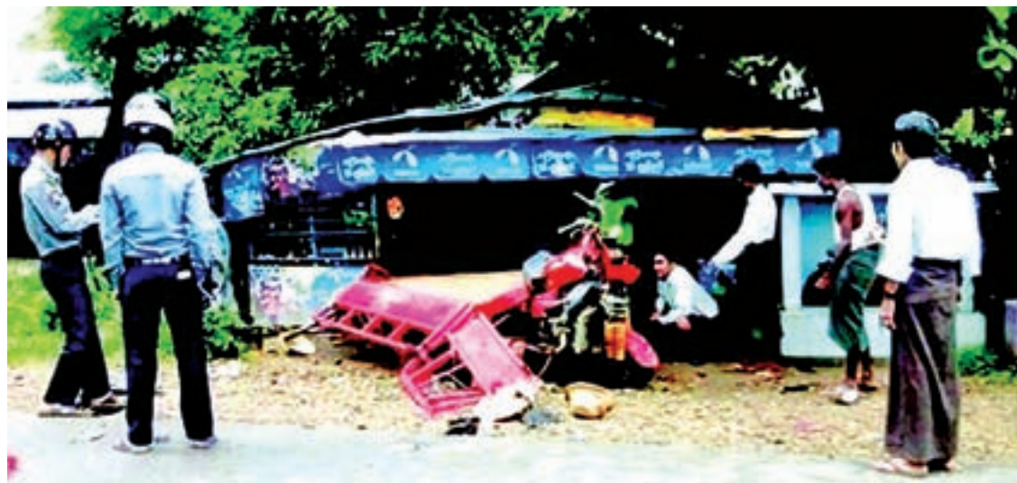
The three-wheeler being seen after the accident.

A THREE wheeled motorcycle collided head on with a 12 -wheel vehicle on the Yangon-Mandalay road, near Nunneera village, Kyaukdaga Township, Bago region, on Tuesday, leaving five dead and