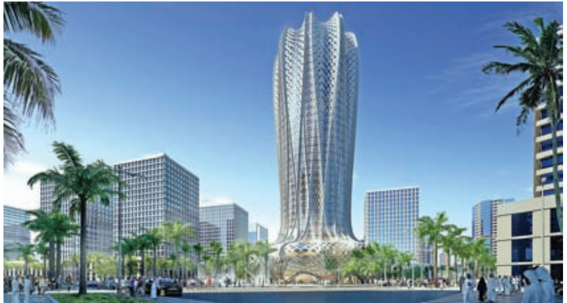
A computer generated image shows one of two project's designed by Zaha Hadid – a 70,000sqm building featuring a hotel and residential apartments – which is scheduled for completion in 2020 in Qatar's Lusail City Marina District.

In April, the firm said it would complete 36 projects that had been started or were under contract before Hadid's death including an "oyster-like" ferry terminal in Salerno, Italy, the King Abdullah Petroleum Studies and Research Center in Riyadh, and the Mathematics Gallery at London's Science Museum. —Reuters