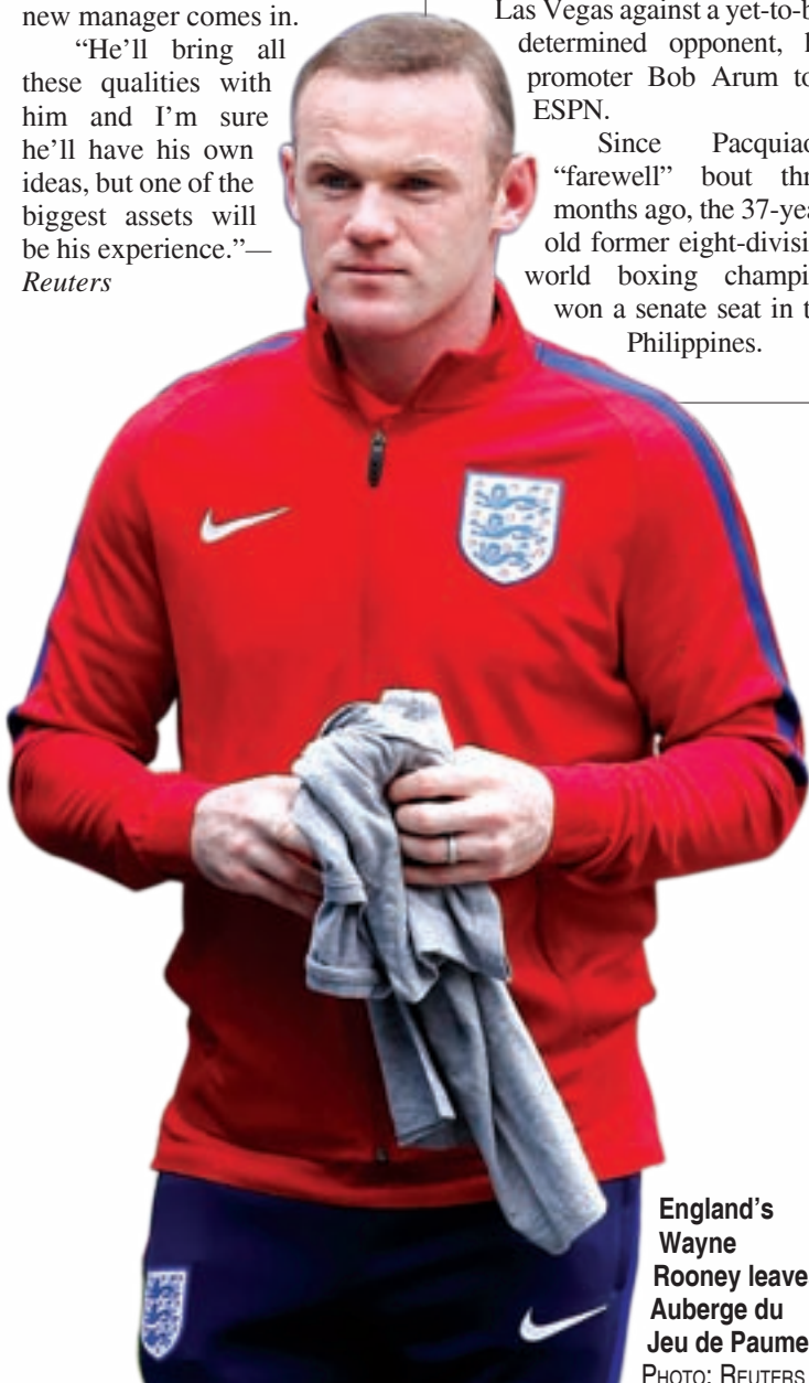
England's Wayne Rooney leaves Auberge du Jeu de Paume.

"He'll bring all these qualities with him and I'm sure he'll have his own ideas, but one of the biggest assets will be his experience." — Reuters