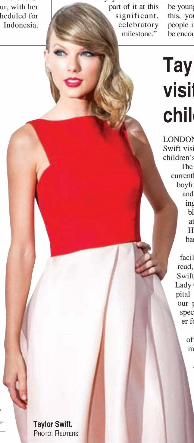
Taylor Swift.

During her visit — which was co-ordinated by the Starlight Children's Foundation, a charity which supports teenagers through illness — Swift happily posed for selfies with the patients.