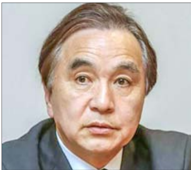
Undated photo shows House of Councillors member Tatsuo Hirano, who was reconstruction minister in 2012 under the government led by the then Democratic Party of Japan.

Hirano's switch to the LDP could give Abe more power to push his "Abenomics" monetary policies and achieve his ultimate goal of revising Japan's 70-year-old Constitution for the first time. Along with other lawmakers supportive of revising the postwar Constitution, the LDP and its junior