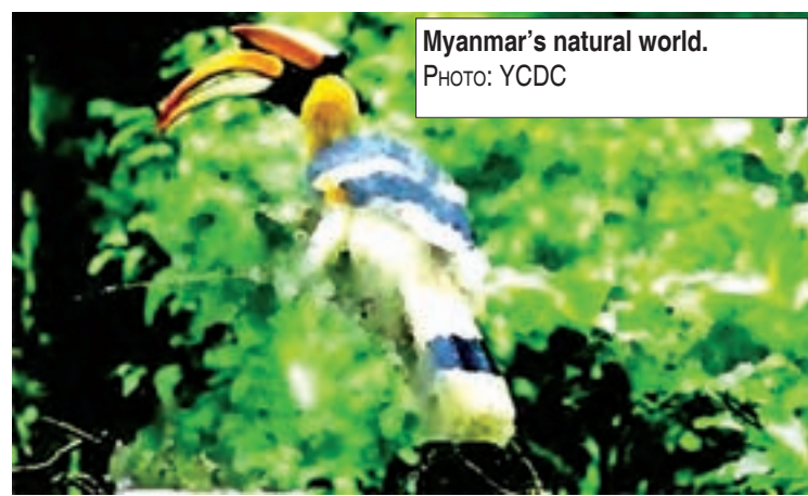
Myanmar's natural world.

The organiser invites enthusiastic photographers to showcase their own works. All works will be displayed for sale during the two-day event. According to a survey, Myanmar has more than 1,000 recorded bird species, seven of which are endemic birds, 114 bird species are globally threatened or near-threatened and 186 bird species are waterbirds.— YCDC