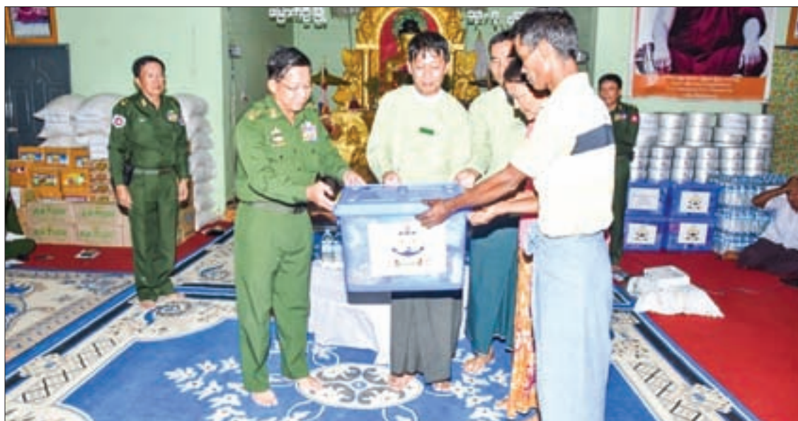
Senior General Min Aung Hlaing preseting relief aid to a flood victim.

COMMANDER-in-Chief of Defence Services Senior General Min Aung Hlaing encouraged flood victims from Myauk U and Kyauktaw townships in Rakhine State yesterday, calling for overcoming the challenges posed by the current disaster with the unity between them and the Tatmadaw.