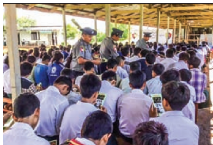
Anti-Human Trafficking Police giving education pamphlets to the attendees.

The police force gave out education pamphlets to 3,210 students, 100 trainees from the course for anti-narcotic drugs and members of the public who attended the ceremony. — Myanmar Police Force