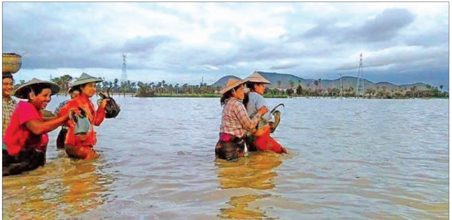
Local people wade through the flood in the field in Salingyi.

The waters of the Chindwin surpassed the dangerous 1,000cm level on Sunday, with water