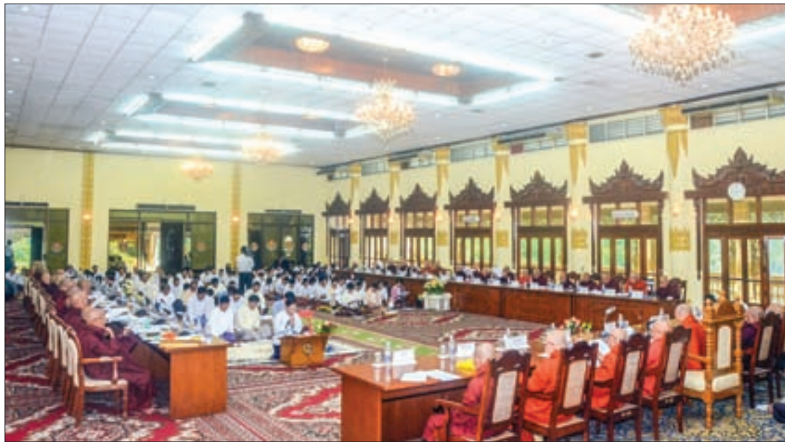
47-member SSMNC meeting in progress.