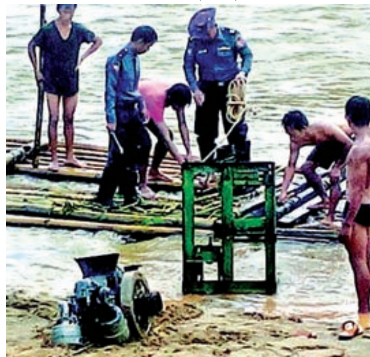
Ownerless illegal gold digging machines seized on the raft. PHOTO: SHAW LA MON (IPRD)

The police are investigating the case.— Shaw La Mon (IPRD)