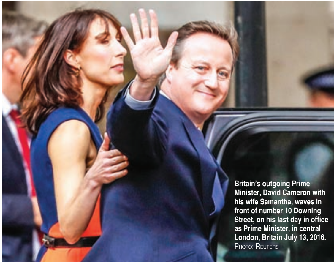
Britain's outgoing Prime Minister, David Cameron with his wife Samantha, waves in front of number 10 Downing Street, on his last day in office as Prime Minister, in central London, Britain July 13, 2016.