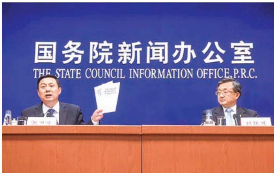
Deputy head of the State Council Information Office Guo Weimin (L) speaks at a press conference on the white paper titled “China Adheres to the Position of Settling Through Negotiation the Relevant Disputes Between China and the Philippines in the South China Sea” in Beijing, capital of China, on 13 July, 2016. The Chinese government on Wednesday issued the white paper.

The white paper, consisting of more than 20,000 Chinese characters, also explained that Nansha Zhudao (the South China