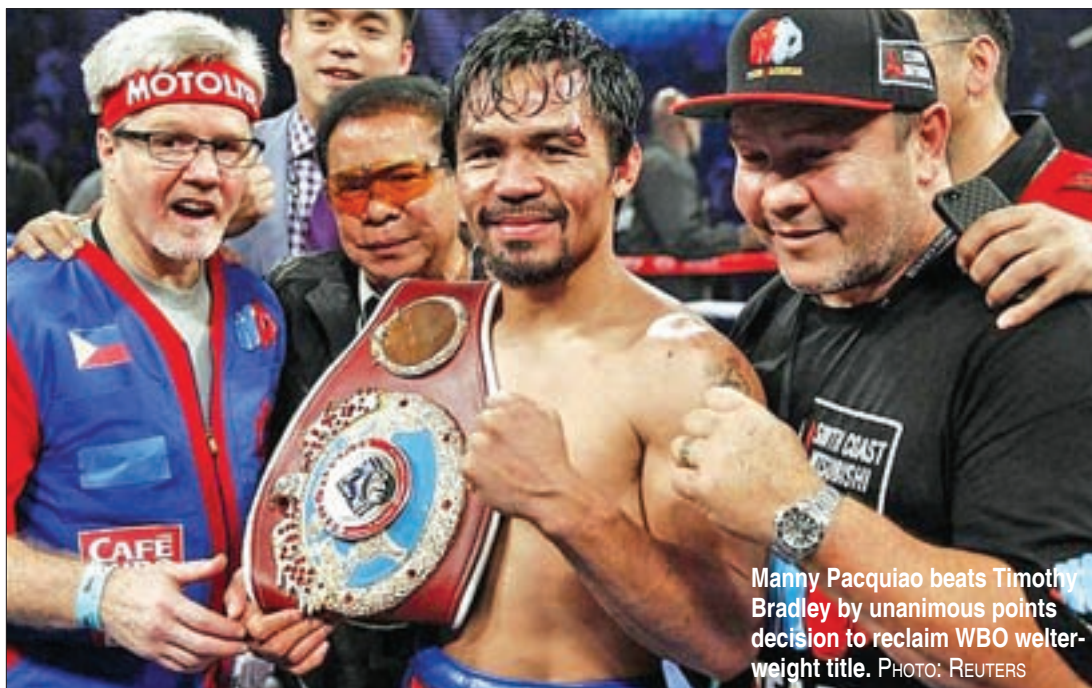
Manny Pacquiao beats Timothy Bradley by unanimous points decision to reclaim WBO welter-weight title.