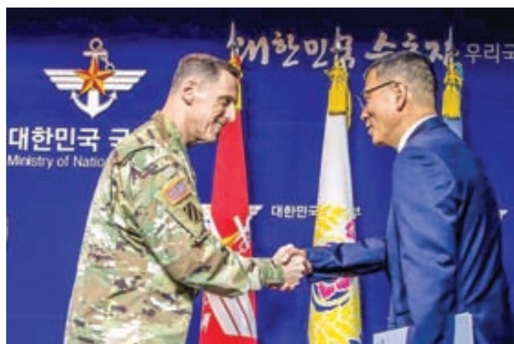
South Korean Defense Ministry’s Deputy Minister Yoo Jeh-seung (R) shakes hands with the commander of US Forces Korea’s Eighth Army Lieutenant General Thomas Vandal after a news conference about deploying the Terminal High Altitude Area Defence (THAAD) anti-missile system, at the Defence Ministry in Seoul, South Korea, on 8 July, 2016.

SEOUL — Seongju County in South Korea’s North Gyeongsang Province has been chosen as the site for deployment of an advanced US antimissile defence system, South Korean Deputy Defence Minister Ryu Je Seung said Wednesday.