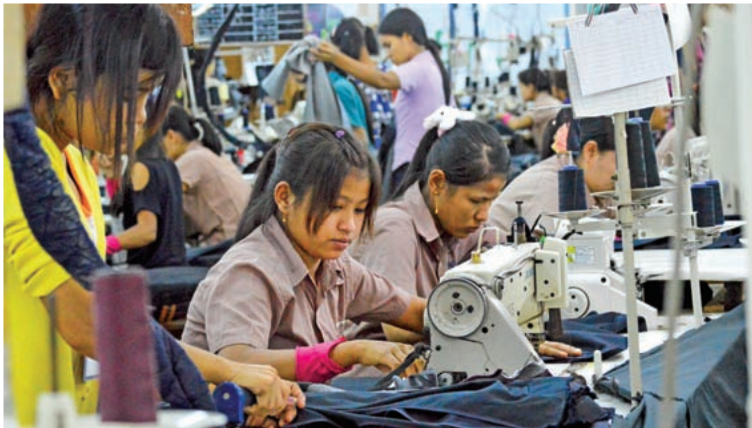
Employees work at a production line of a garment factory in Hlinethaya Industrial Zone.

Myanmar garment industry earned US$912m in 2012. The industry is expected to earn US$8-10 bn this decade.— Myawady