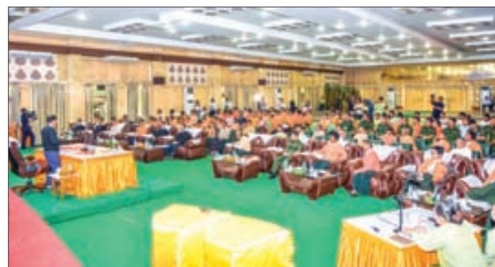
Pyithu Hluttaw Speaker U Win Myint talking to the MPs.

Then, the Speaker answered queries raised by parliamentarians at the meeting.