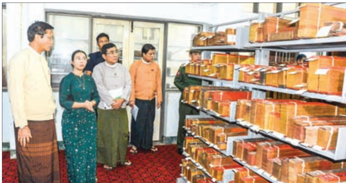
Vice president U Henry Van Thio seen observing the Parabaits.

VICE President U Henry Van Thio, who chairs the Central Committee for Myanmar National Culture, went on an inspection tour of the National Museum and the National Library in Yangon yesterday.