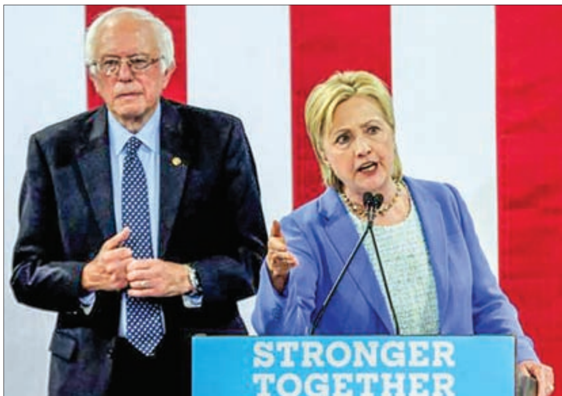
Democratic US presidential candidate Hillary Clinton speaks as Senator Bernie Sanders looks on after he endorsed her during a campaign rally in Portsmouth, New Hampshire, US, on 12 July, 2016.

PORTSMOUTH — Democrat Bernie Sanders endorsed former rival Hillary Clinton for president in a display of party unity on Tuesday, describing her as the best candidate to fix the United States' problems and beat Republican Donald Trump in the 8 November election.