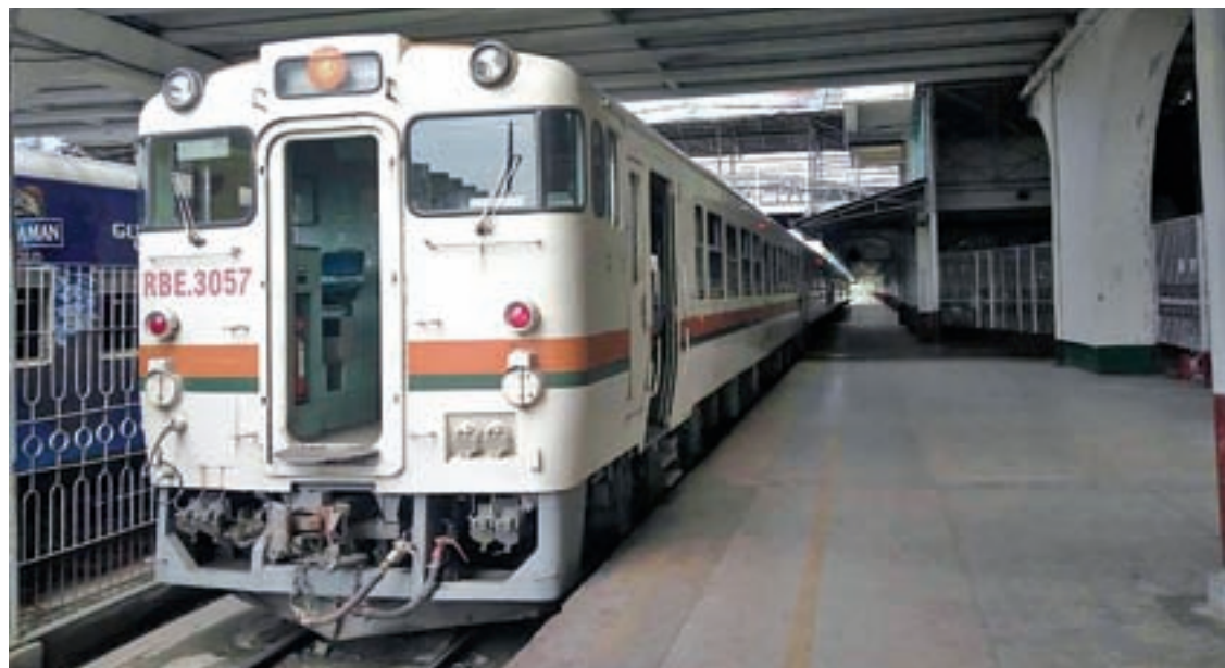
One of the new RBE coaches which will run between Taikkyi and Insein stations this month being seen.

NEW RBE railway coaches will begin running along the Taikkyi-Insein-Taikkyi train route in Yangon this month with the aim of providing better and faster transportation services for Yangon commuters, according to Myanmar Railways.