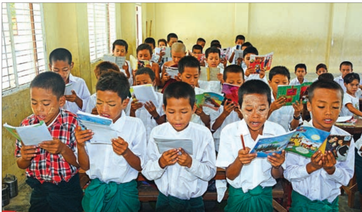
School children reading during lecture time at a school in TadaU, Mandalay Region.

Under the school grants program, a school with 50 students will receive K400,000 while K800,000 is set for a school with 100 students, K1 million for a school with 200 students, K1.2 million for a schools with 300 students, K1.4 m for a school with 400 students, K1.6m for a school with 500 students, K1.8 m for a school with 700 students, K2.2 m for a school with 900 stu-