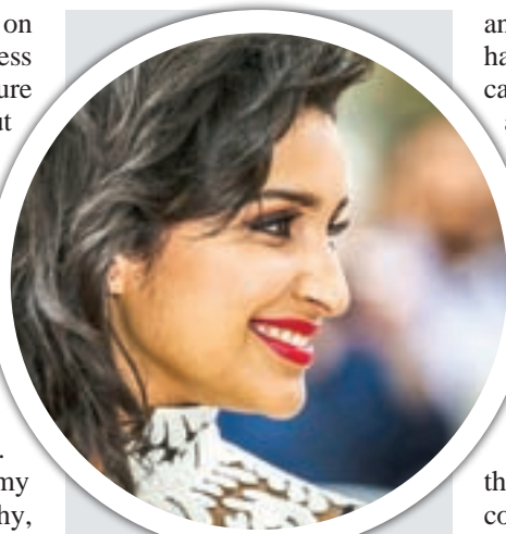
Actress Parineeti Chopra.

ing on screen). When I entered the film industry I did four films back-to-back as everyone was used to seeing me on screen. I am not filmy as these (star kids) guys. I come from a different discipline and I have lived my life in a different way. I needed that emotional break. I wanted to settle down."