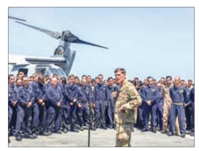
General Joseph Votel, the head of the US military's Central Command, speaks aboard the USS New Orleans, an amphibious dock ship, as it travels through the Strait of Hormuz, on 11 July 2016.

"We don't always have a lot of time to deal