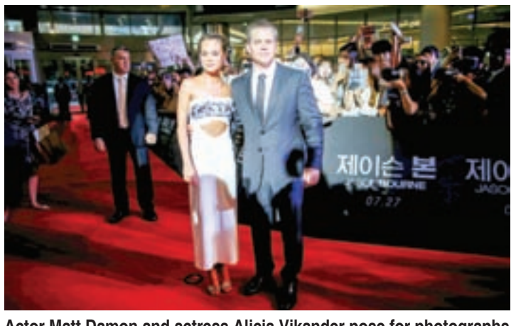
Actor Matt Damon and actress Alicia Vikander pose for photographs during the red carpet event promoting their new film "Jason Bourne" in Seoul, South Korea on 8 July 2016.

"You start off as the Bond girl and then you think it's just the girlfriend and then you're like, 'She's actually [Bond]'," she said. "In the trailer, it's him and then [a] bait and switch."—PTI