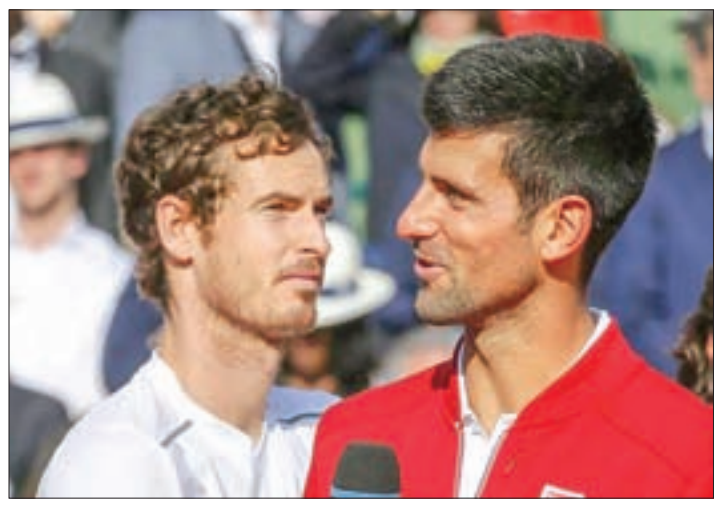
Andy Murray of Britain and Novak Djokovic of Serbia.

Djokovic arrived in London as the holder of all four grand slams and the Serb had not been beaten on the big stage since losing to Switzerland's Stan Wawrinka in the 2015 French Open final. "Novak is still clearly number one in the world right now. He is not just going to go away because he has had one bad tournament. You can't forget what he has done in the last 18 months or so — it has been incredible," Mur-