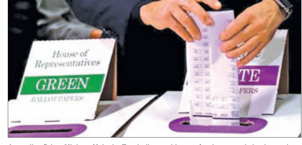
Australian Prime Minister Malcolm Turnbull casts his vote for the general election at the Double Bay Public School in Sydney, Australia, on 2 July 2016.

Shorten said on Sunday, after already more