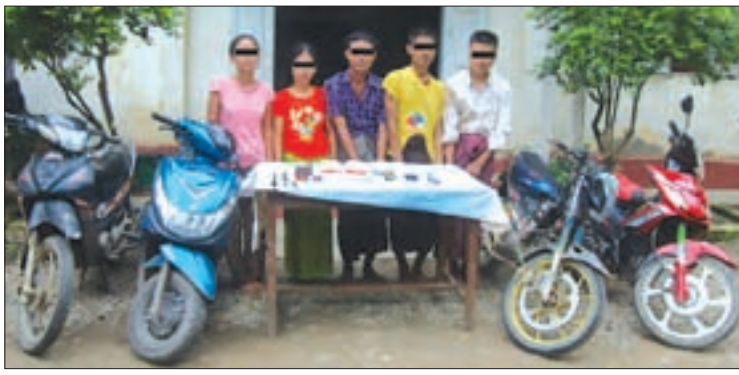
Five suspected drug dealers arrested in Gangaw being seen. Photo: 101