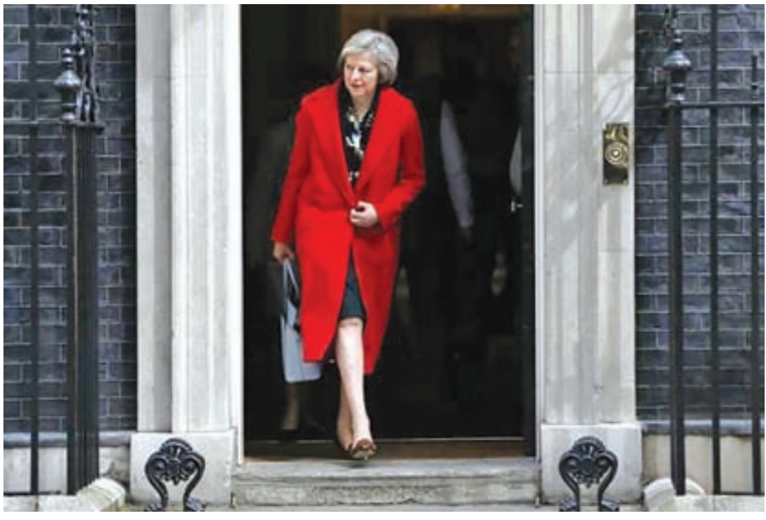
Britain's Home Secretary Theresa May leaves 10 Downing Street in London, Britain on 19 April 2016.

May has made clear she will respect the will of the British people, expressed in the referendum last month. "There will be no attempts to remain inside the EU, no attempts to rejoin it by the back door, and no second referendum. The country voted to leave the European Union and as Prime Minister I will make sure that we leave the European Union," she said during a speech on Monday.—Reuters