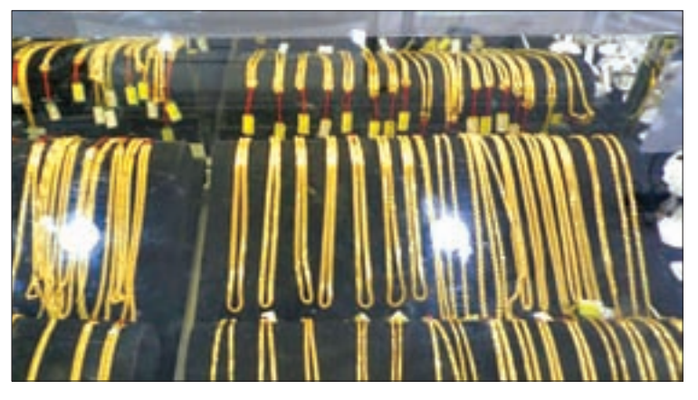
Gold jewelry displayed in Yangon.

20 rice mills will be built if there is interest. PATH is currently negotiating with rice mill owners in Ayeyawady Region, also continuing cooperation with rice millers in Mandalay and Sagaing regions. Fortified rice mills will be built within three months after negotiations. It takes about six months to construct rice mills.