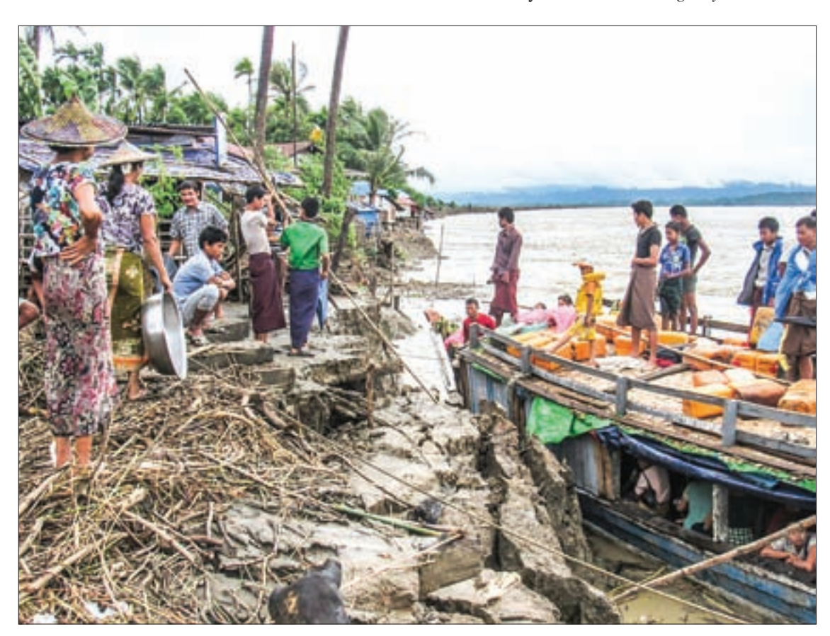
The banks of the Laymyo River collapses every year during the rainy season.

Residents have voiced that between 20-50 feet of the banks of the Laymyo River collapse annually during the rainy season, while heavy deluges and flooding reportedly only succeeded in exacerbating the erosion.—Myitmakha News Agency