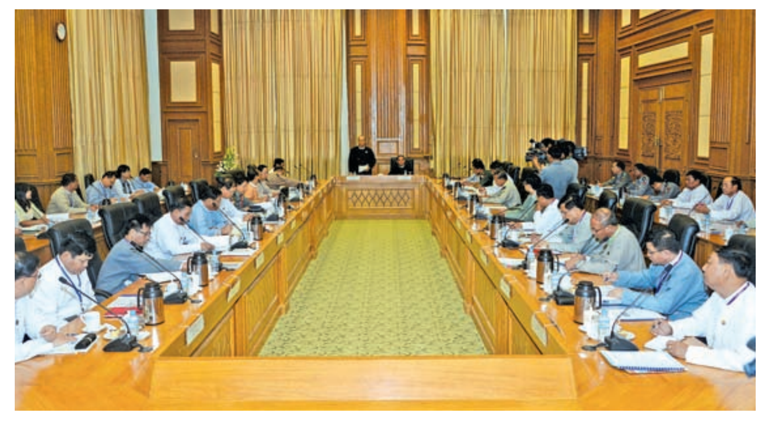
Speakers Mahn Win Khaing Than and U Win Myint co-chair the meeting of central committee and work committees for holding second Hluttaws.

Also present at the meeting were deputy speakers, departmental heads and officials of Hluttaw Offices.