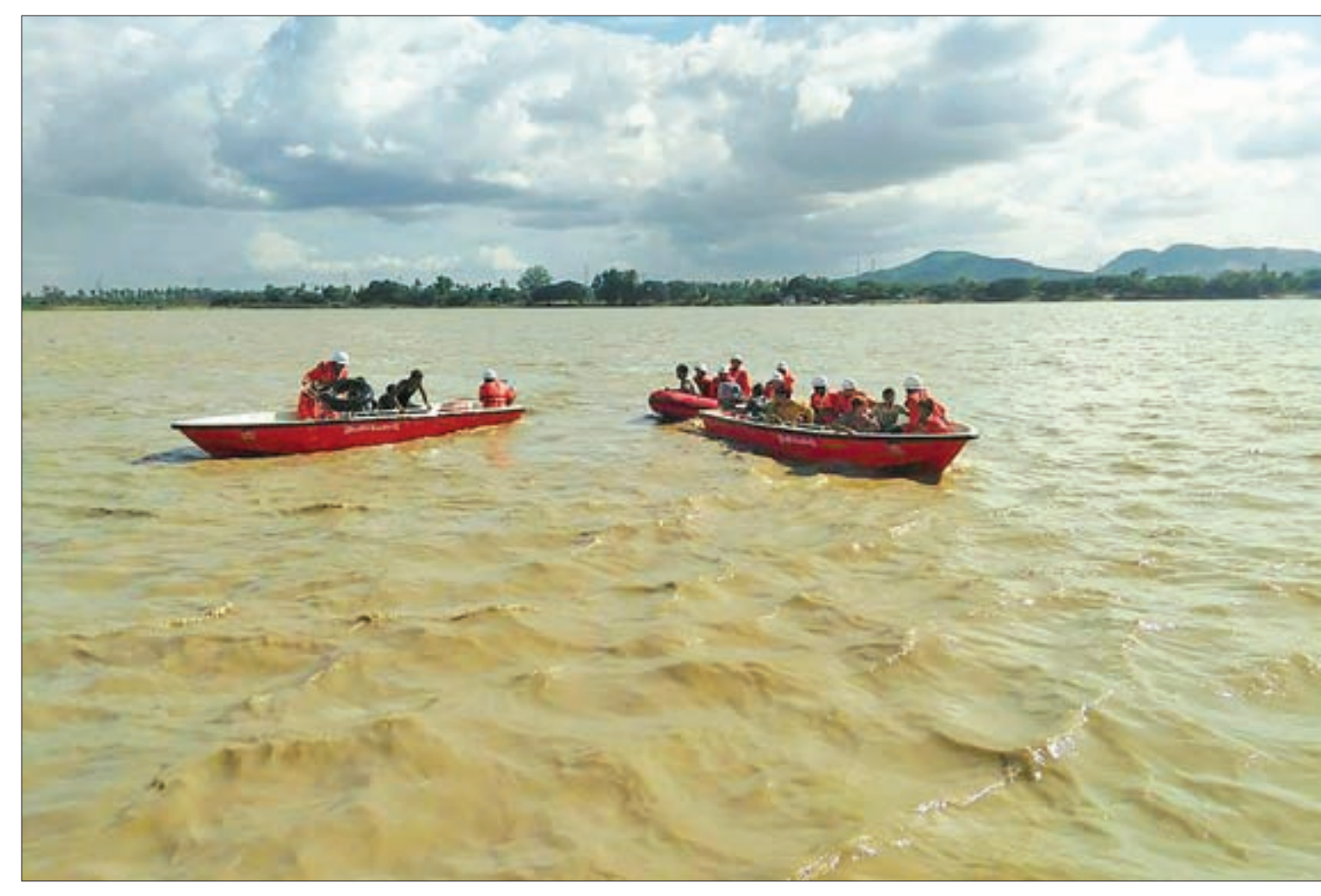
Local fire service departments in flood-prone areas are on alert and have urged people in high risk areas to cooperate with the authorities by following instructions calmly and carefully.

The Sagaing Region government has temporarily suspended high-speed ferries operating along the Chindwin River according to the Monywa Independent Highspeed Ferry Committee. Meanwhile, local fire service departments across the nation are on full alert.—Aye Min Soe