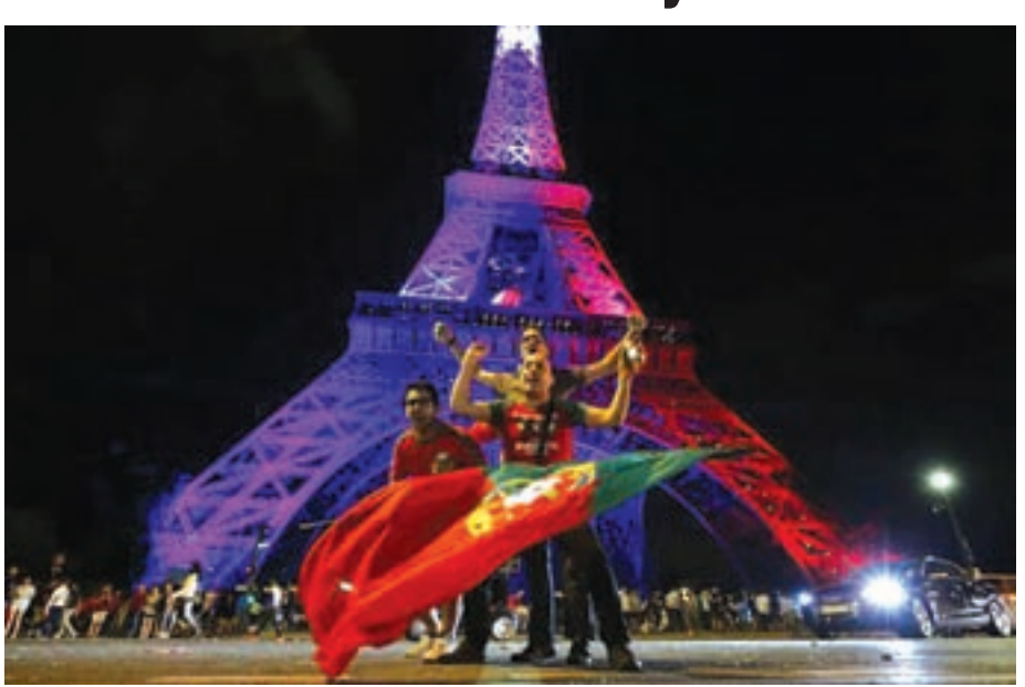
Portugal fans react near the Eiffel Tower after their team won in the Portugal v France EURO 2016 final soccer match in Paris, France, on 11 July 2016.

PARIS — The Eiffel Tower was closed for safety reasons on Monday as workers cleared up the "fan zone" at its base amid official relief that the competition had ended without any serious security incidents.