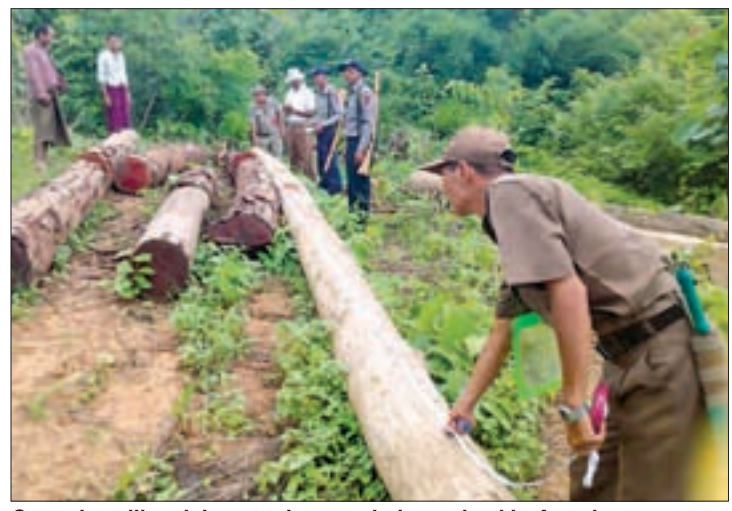
Ownerless illegal logs and sawn timber seized in Aunglan.

timber were seized near Thanon Sunday. Acting on a tip-off total, police report. a combined team comprising police and officials from the Aunglan township forest department inspected a forest area near Thanbula outpost, one and half miles away from Nga Lauk village. The team found two teak logs weighing 1.45 tonnes, one Pyinkado sawn timber weighing 1 tonne, one Na Be sawn timber weighing 0.16 tonnes, two Kyun Darshwe planks weighing 0.3