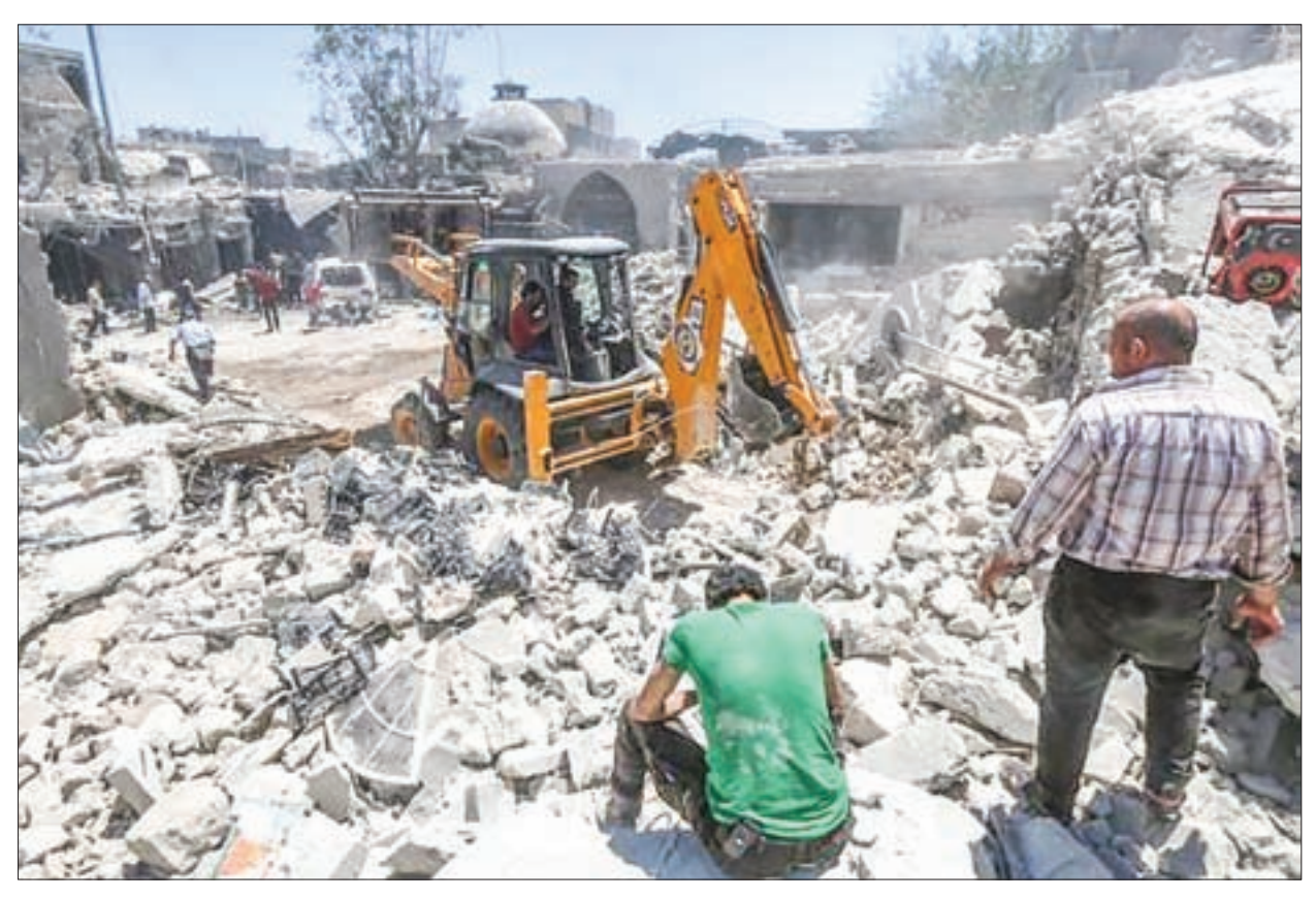
Civil defence members work at a site hit by a barrel bomb in the rebel held area of Old Aleppo, Syria, on 11 July 2016.