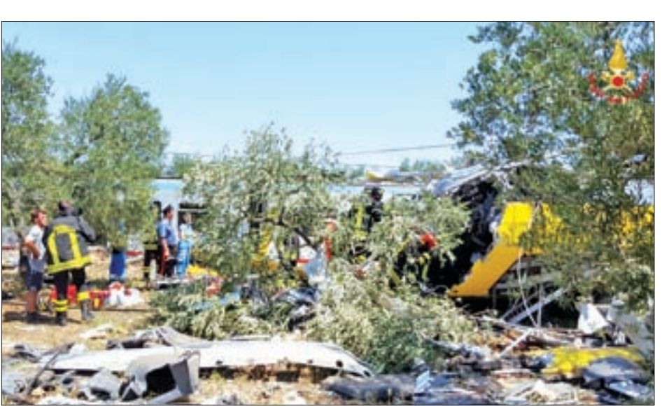
Firefighters work at the site where two passenger trains collided in the middle of an olive grove in the southern village of Corato, near Bari, Italy, on 12 July 2016.

There was no immedi- in northern Italy to return to caused the two trains to be travelling towards each other on the same line and the Transport Ministry said it was dispatching two investigators to the region of Puglia to look into the disaster.