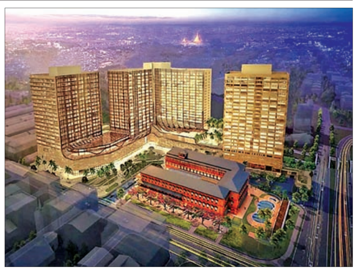
Image of completed redevelopment project in Yangon.

Japan Overseas Infrastructure Investment Corporation is for Transport & Urban Development (JOIN). The Project will be JOIN's first equity participation project in the field of overseas urban development. The Japanese Partners will work with Yoma and FMI to establish a local project company. The Asian Development Bank (ADB) and the International Finance Corporation (IFC) will also make equity contributions, and the Local Project Company will borrow project funds from these two financial institutions to finance the Project.—GNLM