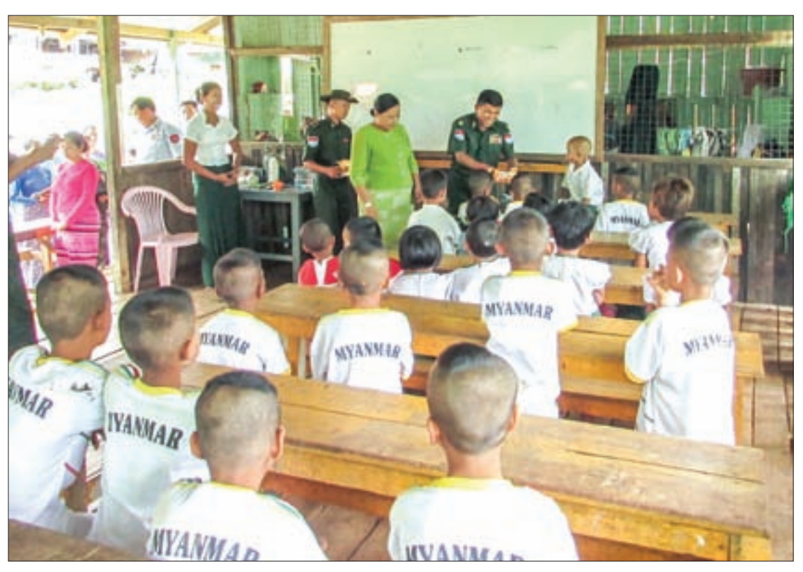
Taninthayi Coastal Region Military Command makes donation in Kawthaung Township.

THE Commander of Taninthayi Coastal Region Command and party made a donation in Maliwon village of Khamauk-Kawthoung Township,