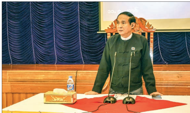
Pyithu Hluttaw Speaker U Win Myint speaks at meeting with lawmakers in Sagaing Region.

U Win Myint called on Hluttaw representatives to represent the people of their constituencies in a dutiful way and to respond