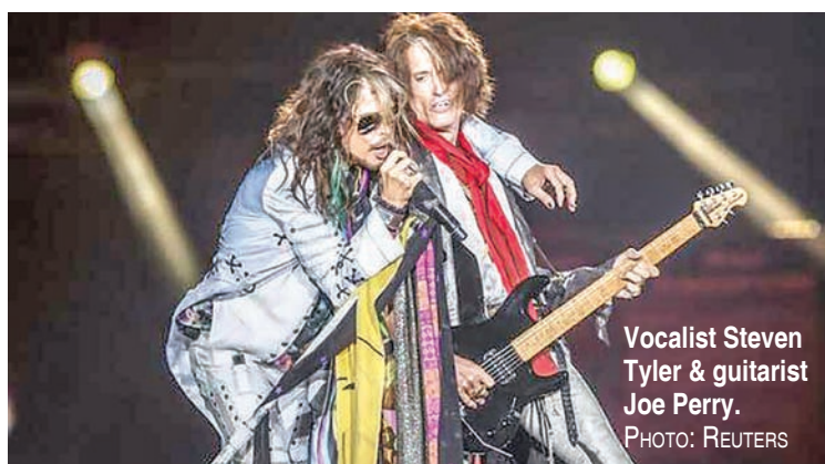
Vocalist Steven Tyler & guitarist Joe Perry.