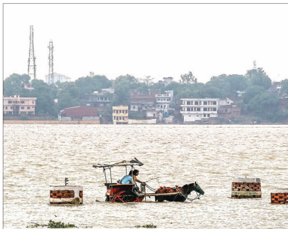
People travel on a horse drawn carriage through a flooded road on the banks of river Ganga in Allahabad, India, on 10 July 2016.

"Thousands of people will be evacuated today. We are working on a war footing mode to set up relief camps," additional home secretary Basant Singh said