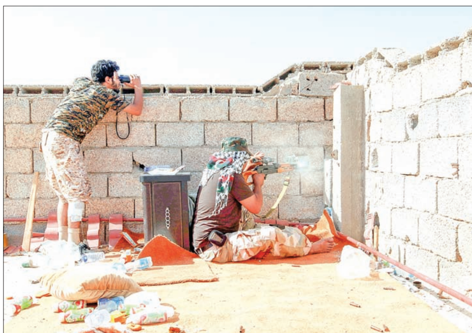
A sniper from forces aligned with Libya's new unity government shoots while his comrade uses binoculars to scan the area looking for an Islamic State position in the Zaafran area in Sirte, Libya, on 30 June 2016.

The Misrata's brigades, at the front of the