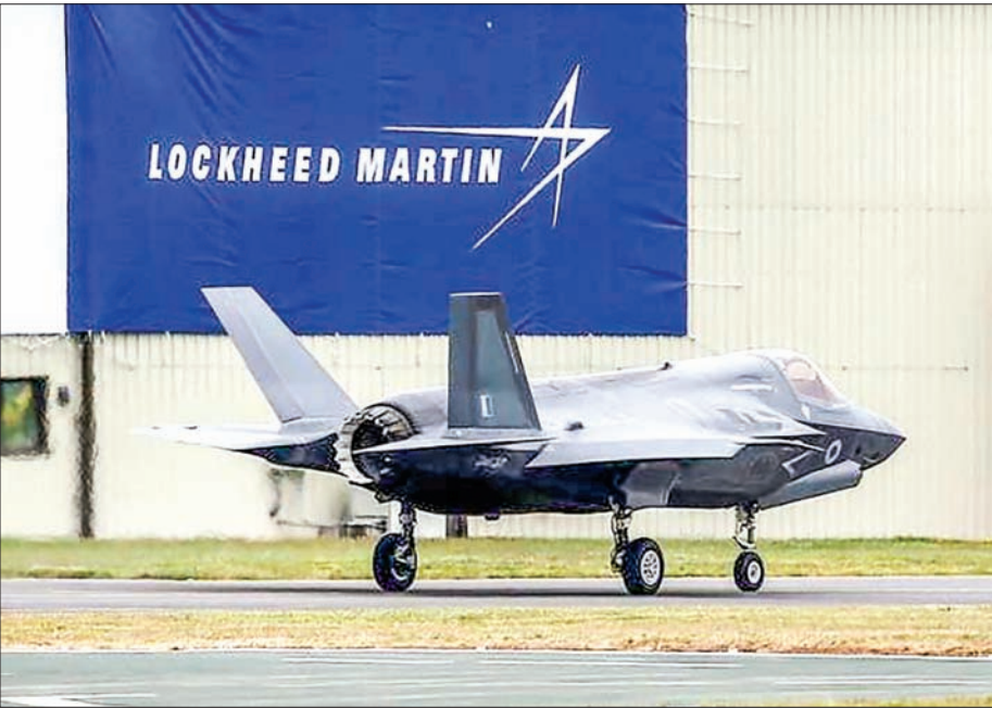
A RAF Lockheed Martin F-35B fighter jet taxis along a runway after landing at the Royal International Air Tattoo at Fairford, Britain, on 8 July 2016.