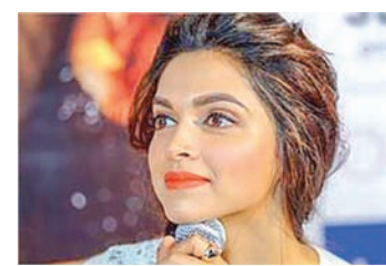
Deepika Padukone.

Appealing to the young minds, the actress wrote “every