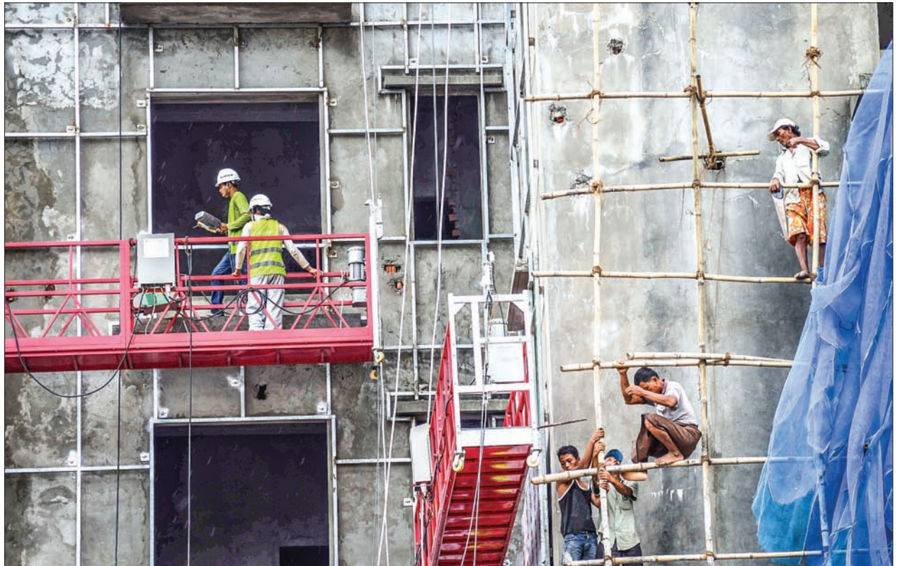
Workers seen at a worksite in Yangon.

However, the list of construction materials that are permitted to local-foreign joint ventures would be adjusted depending on local demand and the situation of market and local businesspeople, according to the announcement.—GNLM