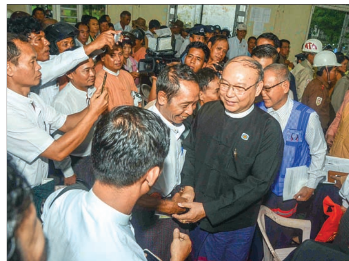
Speaker Mahn Win Khaing Than welcomed by lawmakers in Ayeyawady Region.

Mahn Win Khaing Than later went to Yaykyi where he held talks with responsible persons of political parties and social organizations, officials concerned and local people. — Myanmar News Agency