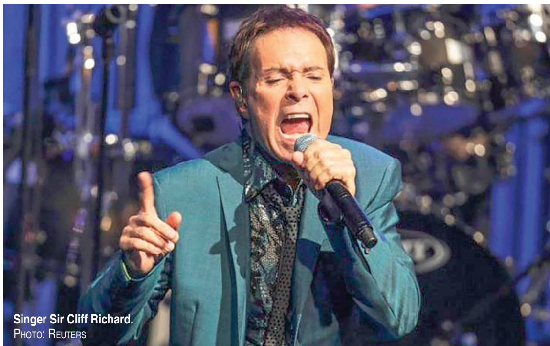
Singer Sir Cliff Richard.