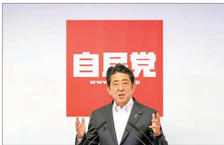
Japan's Prime Minister and leader of the ruling Liberal Democratic Party (LDP) Shinzo Abe attends a news conference following a victory in the upper house elections by his ruling coalition, at the LDP headquarters in Tokyo, Japan, on 11 July 2016.

"With Japan's pacifist constitution at serious stake and Abe's power expanding, it is alarming both for Japan's Asian neighbours, as well as for Japan itself, as Japan's militarisation will serve to benefit neither side," the Xinhua