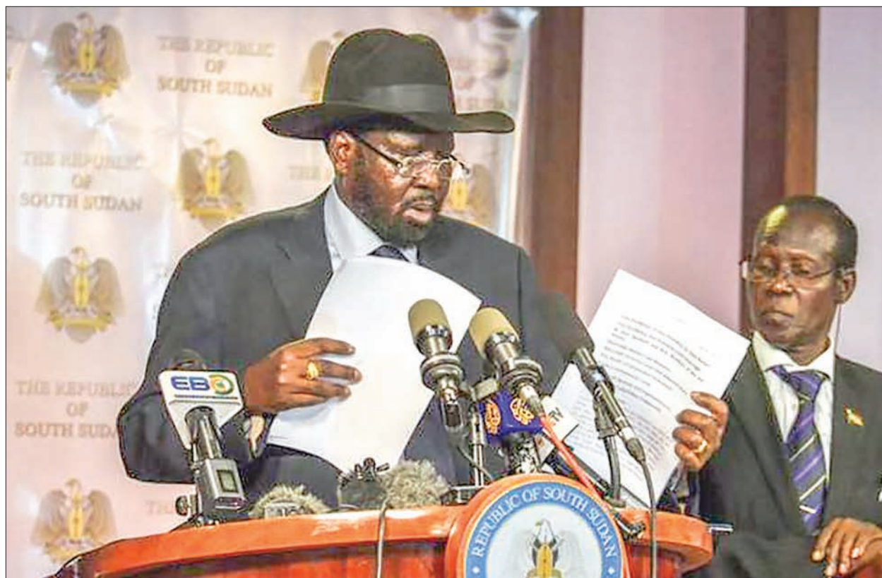
South Sudan President Salva Kiir (L) flanked by Second Vice President James Wani Igga address a news conference at the Presidential State House following renewed fighting in South Sudan's capital Juba, on 8 July 2016.

There has been no official death toll but at least five