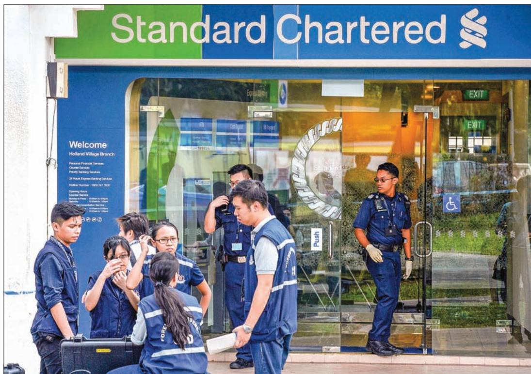
Police officers work at scene of a robbery at Standard Chartered Bank branch in Holland Village, Singapore, on 7 July 2016.

Local newspaper Straits Times said the last bank robbery