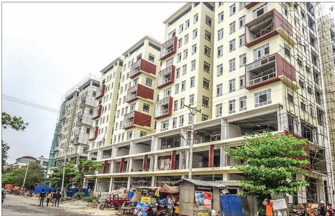
A housing estate being seen in Mandalay.