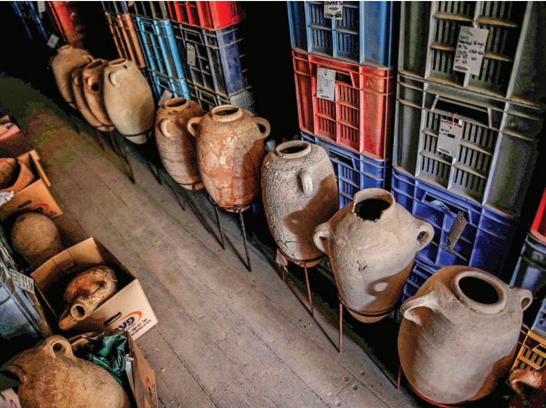
Clay jars are seen in a container after they were unearthed during excavation works at the first-ever Philistine cemetery at Ashkelon National Park in southern Israel, on 28 June 2016.