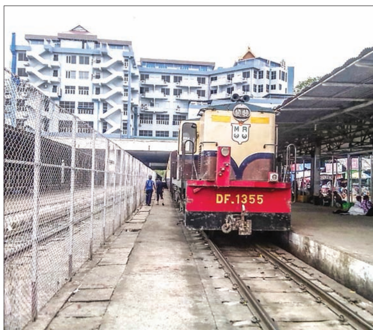
Mandalay-Myitkyina train is seen at Mandalay Station before departing for Myitkyina.

There are six Mandalay-Myitkyina trains running between the two cities.— Aung Thant Khaing