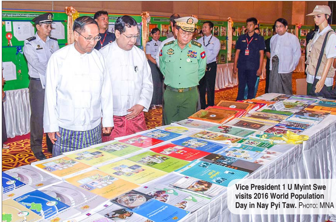
Vice President 1 U Myint Swe visits 2016 World Population Day in Nay Pyi Taw.