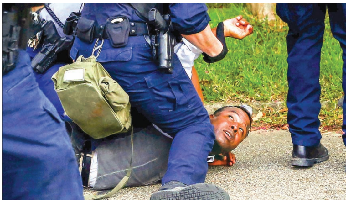
A demonstrator is detained during protests in Baton Rouge, Louisiana, US, on 10 July 2016.