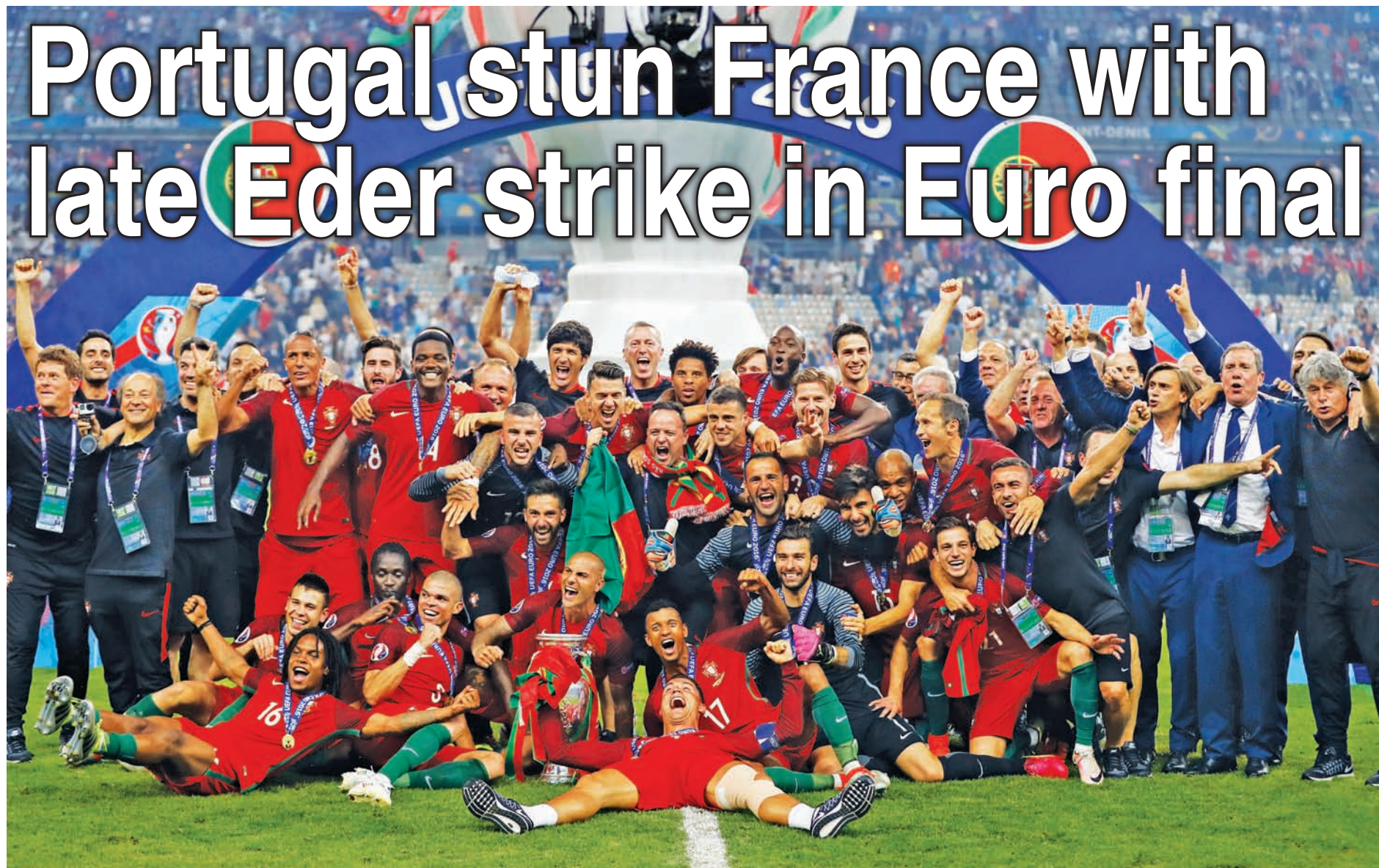
Portugal celebrate with the trophy after winning Euro 2016 at Stade de France, Saint-Denis near Paris, France on 10 July.

PARIS — Portugal found an unlikely hero as Eder's thunderous finish deep into extra time secured their first European Championship title after they overcame the early loss of Cristiano Ronaldo to snatch a 1-0 victory over hosts France on Sunday.