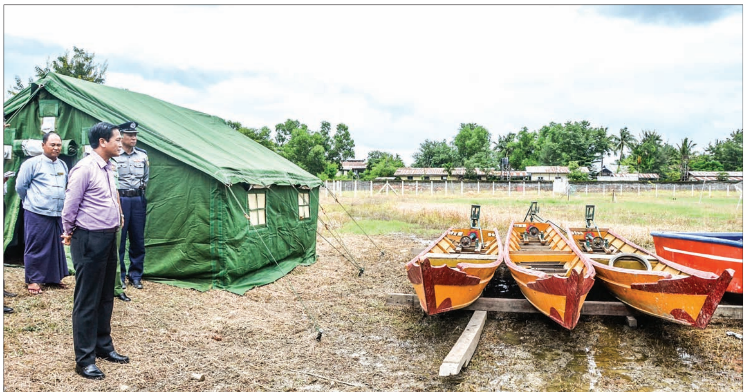
Vice President 2 U Henry Van Thio inspects relief aid including tents and boats at the township stadium in Kalay.

U Henry Van Thio wants projects to benefit the country and local people, calling for further feasibility studies in coop-