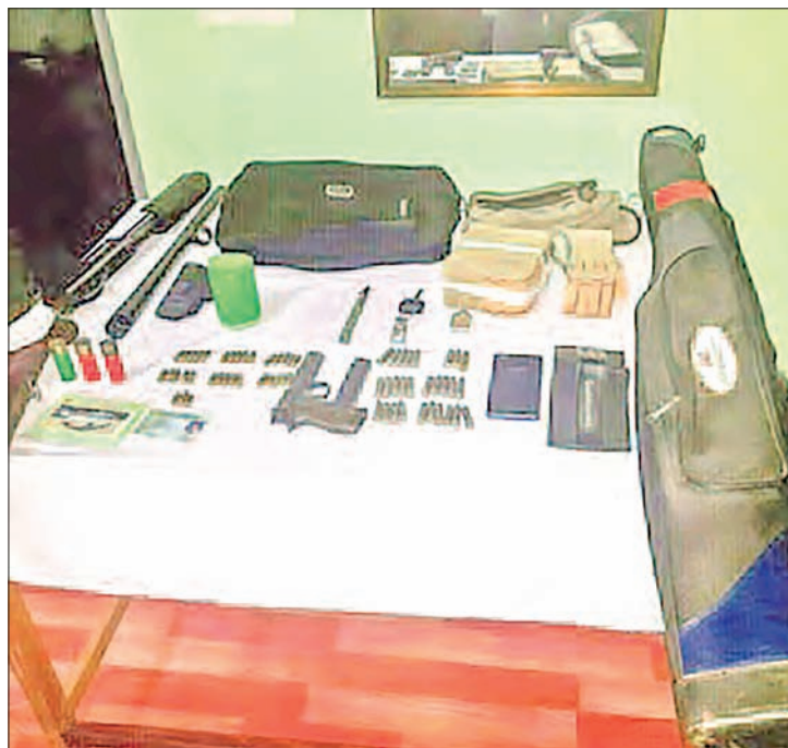
The illegal weapons seized being seen.

The man arrested was not only caught with the weapons but was unable to prove that he owned the vehicle. Action is being taken against the suspect by the police who are investigating the case.—District IPRD