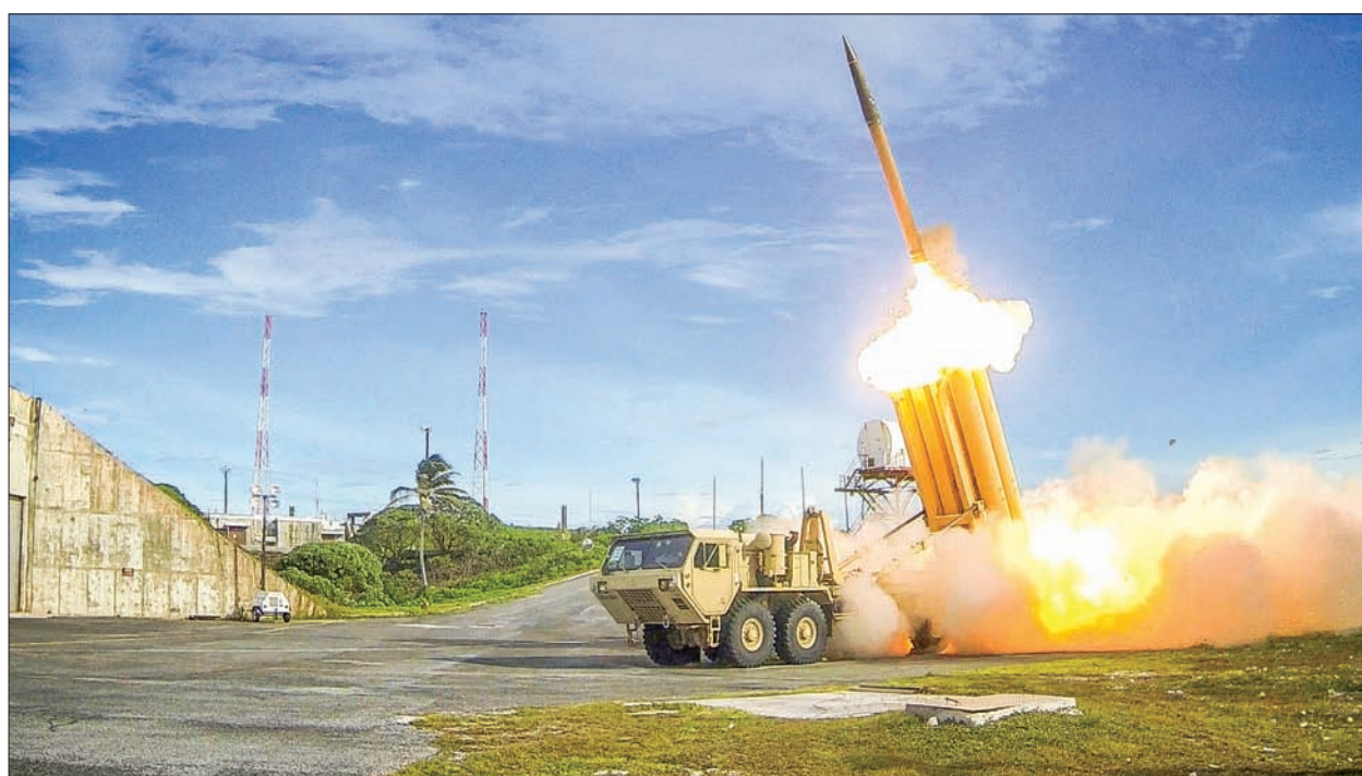
A Terminal High Altitude Area Defence (THAAD) interceptor is launched during a successful intercept test, in this undated handout photo provided by the US Department of Defence, Missile Defence Agency. PHOTO: REUTERS

"It is the unwavering will of our army to deal a ruthless retaliatory strike and turn (the South) into a sea of fire and a pile of