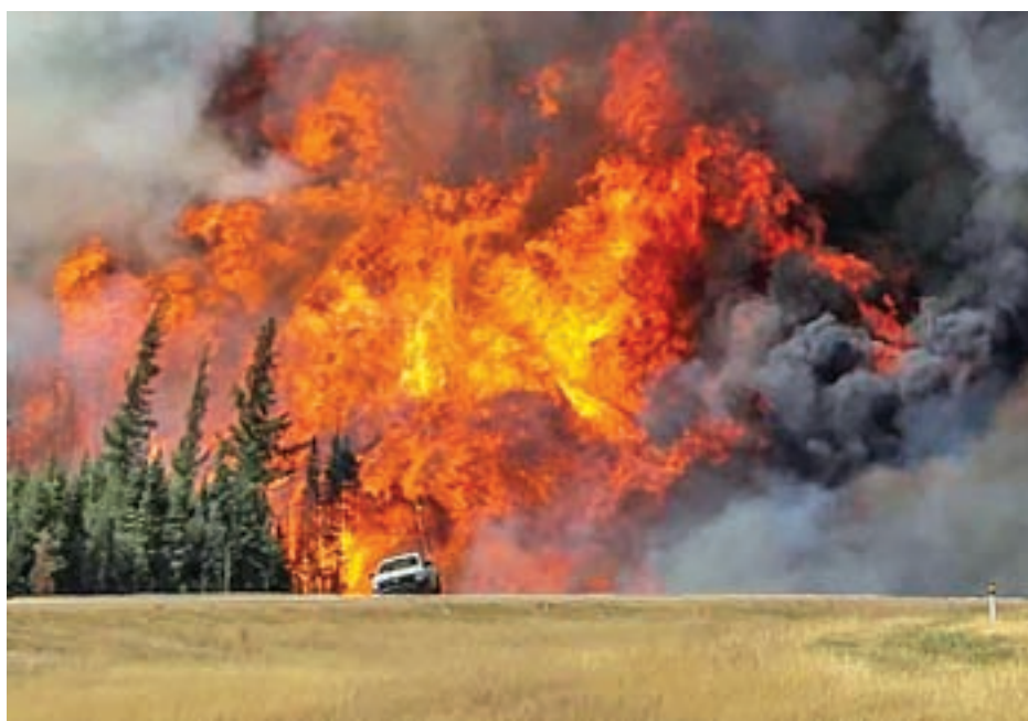
Smoke and flames from the wildfires erupting behind a car on the highway near Fort McMurray, Alberta, Canada, on 7 May 2016.

While most of the oil sands operations have returned to normal rates, rebuilding efforts for thousands of homes in Fort McMurray, along with the insurance payout, are expected to take months or