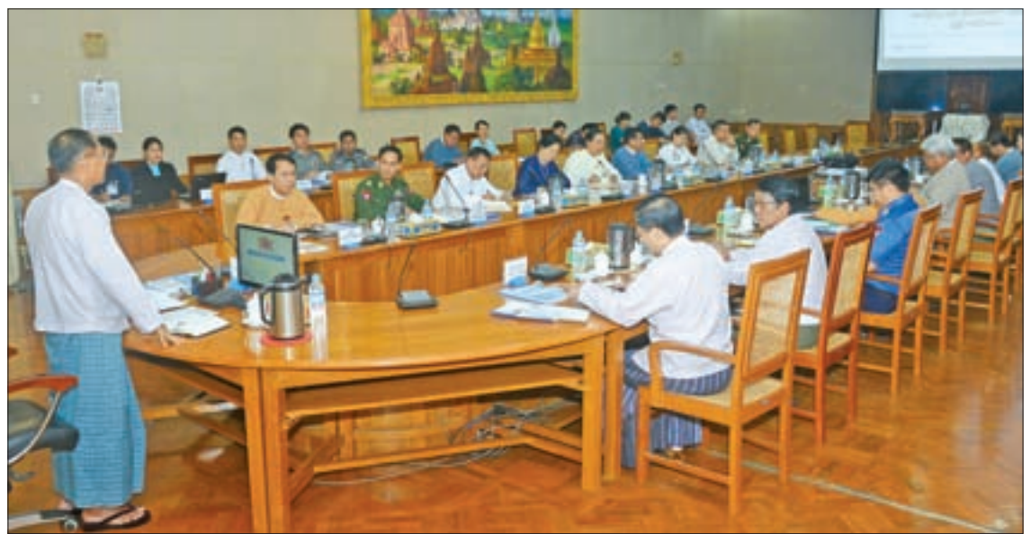
Vice President U Myint Swe addressing the meeting for holding 69th Anniversary Arzani Day (Martyrs' Day).

Next, Union Minister for Religious Affairs and Culture Thura U Aung Ko, chairman of the organising central committee, Yangon Region Chief Minister U Phyo Min Thein, vice-chairman of the committee, Yangon Mayor