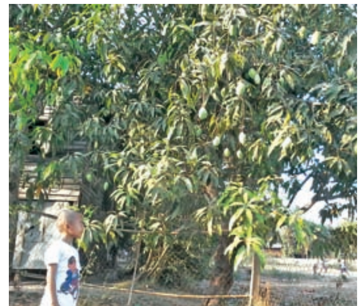
Mango trees with luxuriant growth being seen.

Those kinds of perennial crop originate in some townships in Mandalay Region including Myittha and Kyaukse townships.—Zar Zar