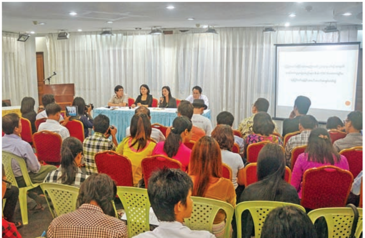
CSOs discuss terms of reference for the Union Peace Conference — 21st Century Panglong.

The CSOs have sent the copies of the terms of reference to the Preparatory Committee for 21st Century Panglong Peace Conference, the United Nationalities Alliance (UNA) and the eight eth-