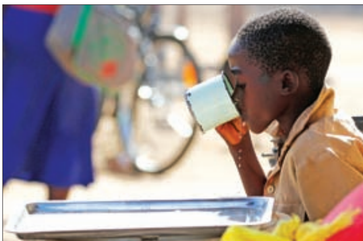
A child drinks water from a cup in drought-hit Masvingo, Zimbabwe, on 1 June 2016.

In Malawi, WFP said it needed $288 million but had only sourced $43 million, while in Zimbabwe — where drought has exacerbated an economic meltdown which has led to unrest — $228 million was required but only a tenth of that has been