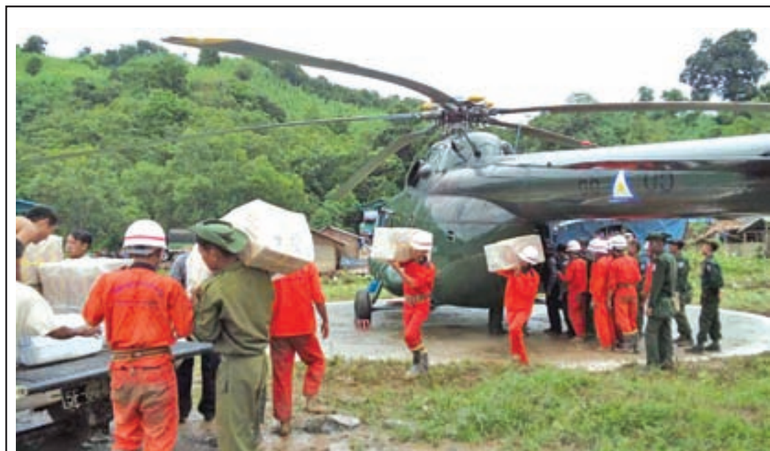
Firemen unloading relief aid off a military helicopter to send them to the people in flooded areas in Ann, Rakhine State on 7th July, 2016.

According to the country's latest census, an infant mortality rate of 62 deaths per 1,000 live births and an under-five mortality rate of 72 deaths per 1,000 live births.—Zar Zar