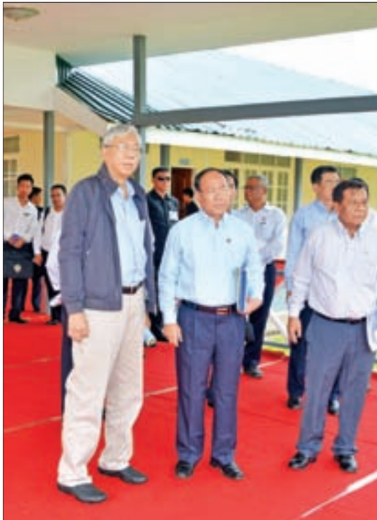
President U Htin Kyaw inspects Yeywa Hydropower Plant in Mandalay.