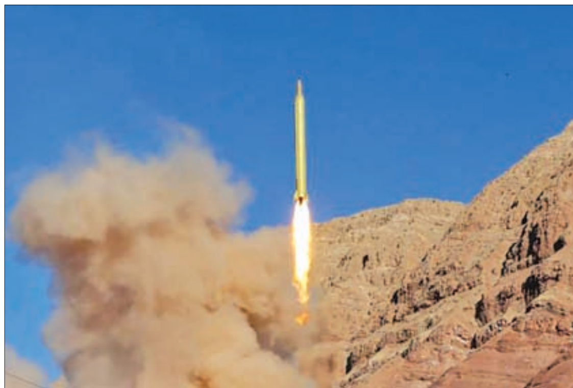
A ballistic missile is launched and tested in an undisclosed location, Iran, on 9 March 2016.

Under the UN resolution, Iran is "called upon" to refrain from work on ballistic missiles designed to deliver nuclear weapons for up to eight years. Critics of the deal have said the language does not make it obligatory.