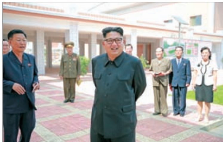
North Korean leader Kim Jong Un gives field guidance to Pyongyang Orphans’ Secondary School in this undated photo released by North Korea’s Korean Central News Agency (KCNA) on 3 July 2016.

South Korea, which cut all political and commercial ties with its own sanctions against the North in February, welcomed the US move, saying it will encourage greater international pressure on the North to improve its human rights record.—Reuters