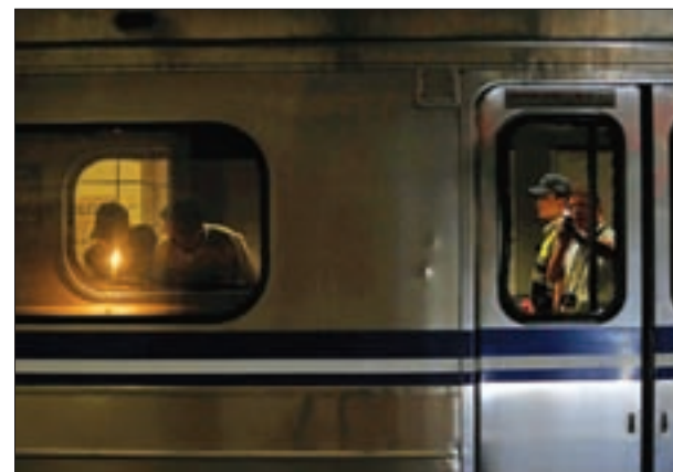
Policemen check a train after an explosion at the Songshan train station in Taipei, Taiwan on 7 July 2016.

seeing a man leaving a long black device on the train just before the explosion. Premier Lin Chuan told Taiwanese television the blast appeared to be a deliberate "act of malice". Police and the Taipei fire department said a "steel pipe" was the origin of the blast.—Reuters