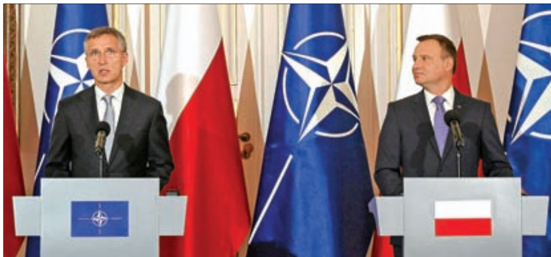
NATO Secretary-General Jens Stoltenberg and Poland's President Andrzej Duda speak during a news conference during their meeting at Belvedere Palace, a day ahead of the NATO Summit in Warsaw, Poland, on 7 July 2016.

WARSAW — NATO leaders will display their resolve towards a resurgent Russia at a summit in Warsaw on Friday despite what many see as a weakening of the West due to Britain's vote to leave the European Union.