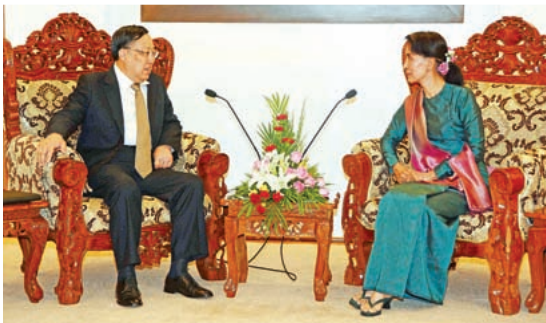
Union Minister for Foreign Affairs Daw Aung San Suu Kyi holds talks with Mr Geng Huichang, Minister of State Security of China in Nay Pyi Taw.

FM Daw Aung San Suu Kyi receives Chinese Minister of State Security