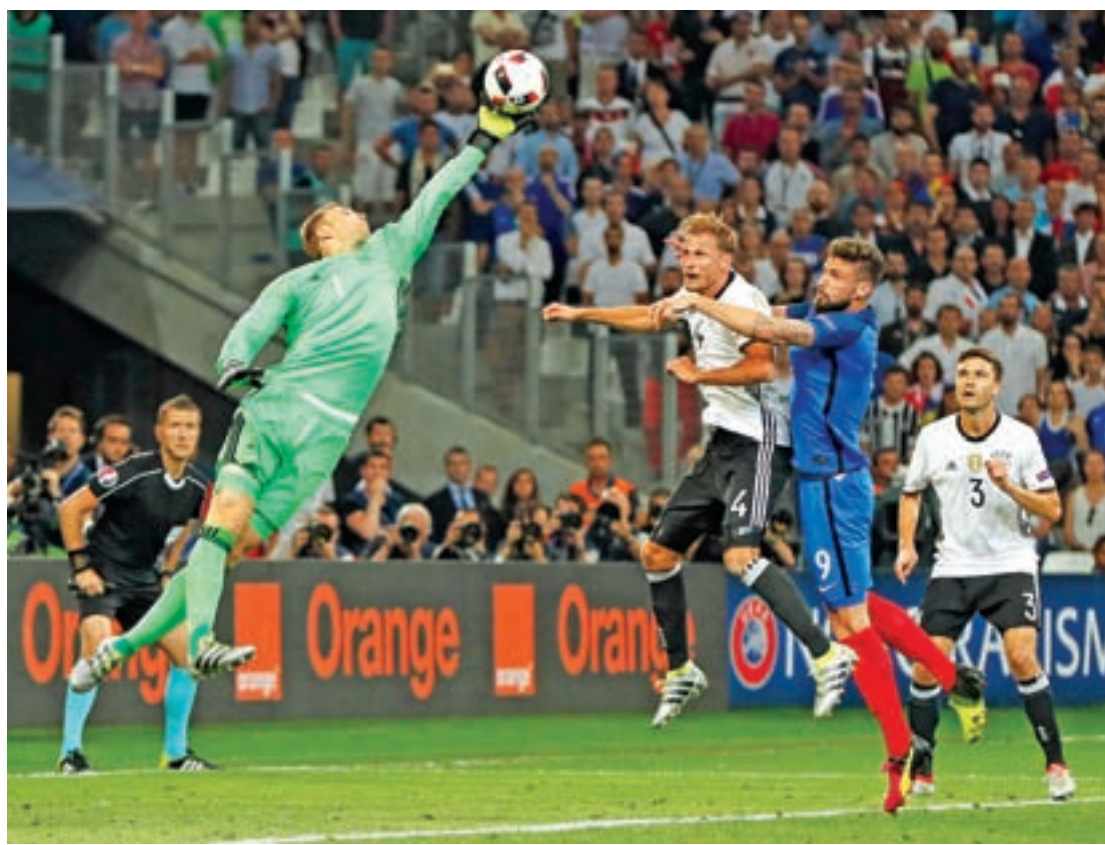
Germany's Manuel Neuer attempts to claim the ball ahead of France's Olivier Giroud during EURO 2016 Semi Final at Stade Velodrome, Marseille, France on 7 July 2016.

most of them on the pitch. Now I'm on the bench," said France coach Didier Deschamps, captain of the victorious 1998 squad.