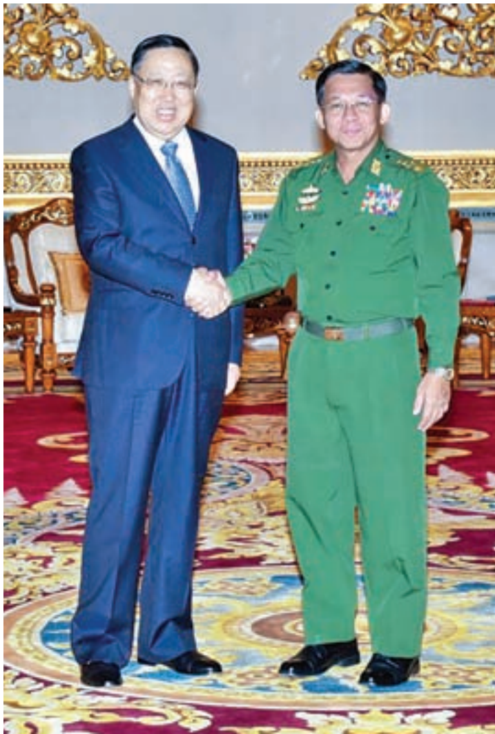
Senior General Min Aung Hlaing greeting Chinese Security Minister.