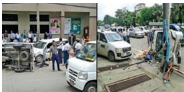
The scene of car accident. PHOTO: SOE WIN (MLA)

The driver and passenger were taken to Thingangyun general hospital where the passenger, identified as one U Win Naing Tun, later died. The police have filed charges against the driver.— Soe Win -MLA