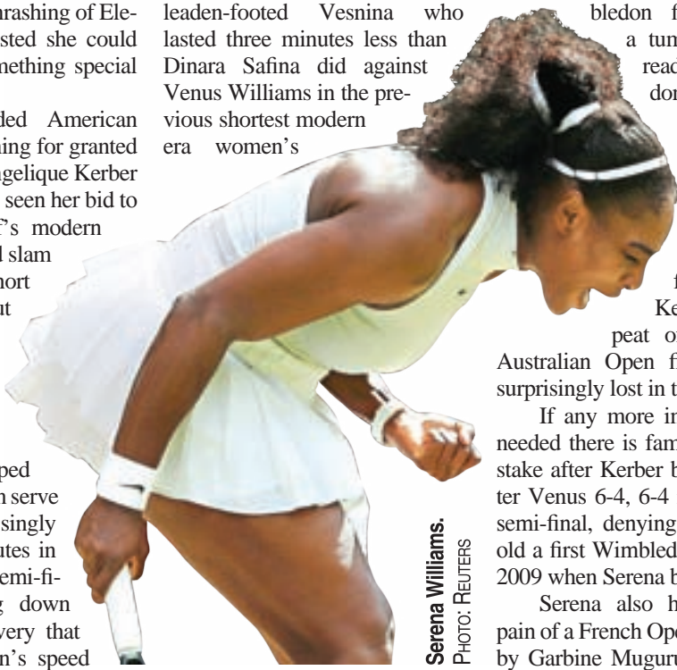
Serena Williams.

"I felt like the score was going fast," Vesnina, the first unseeded woman to contest a Wimbledon semi since 2011, said. — Reuters