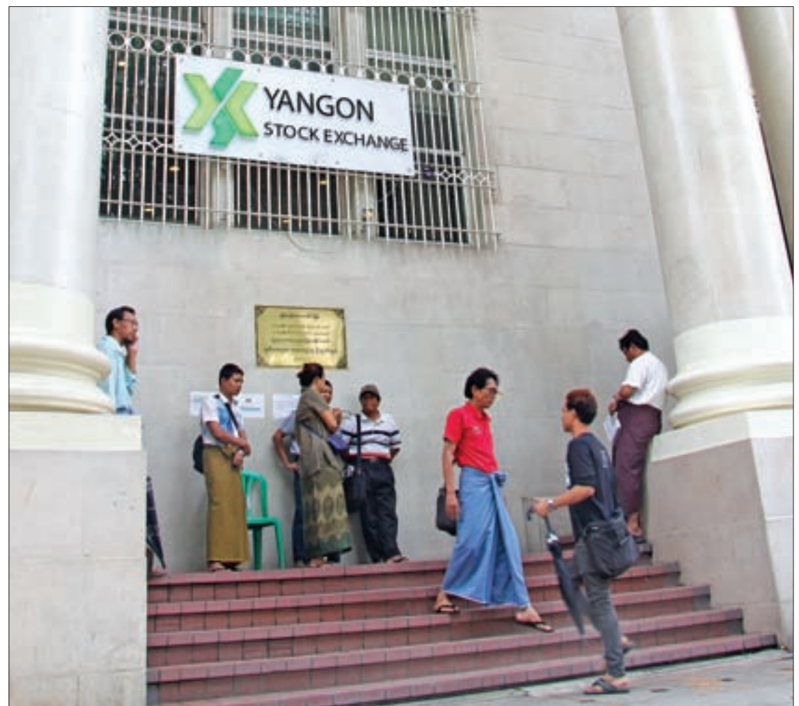
Visitors are seen outside the Yangon Stock Exchange.

previously used as an airfield during the Second World War. The airport is in Bago township, Bago Region. The government expects the upcoming airport to become the primary gateway to Myanmar, hosting millions of passengers annually. The new airport is going to become the fourth international airport in Myanmar after Yangon, Mandalay and Nay Pyi Taw International Airport. It is expected to be the largest among the four. The project is anticipated to be completed in 2019. —200