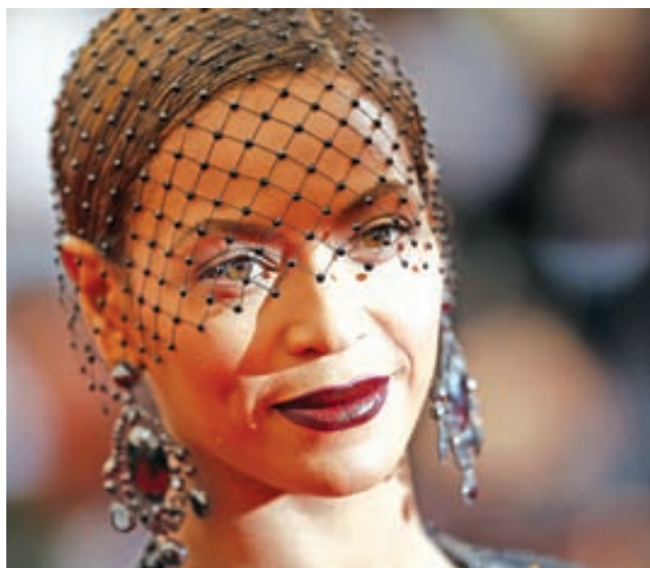
Pop star Beyonce.

In a statement on her website, she wrote: “We are sick and tired of the killings of young men and women in our communities. It is up to us to take a stand and demand