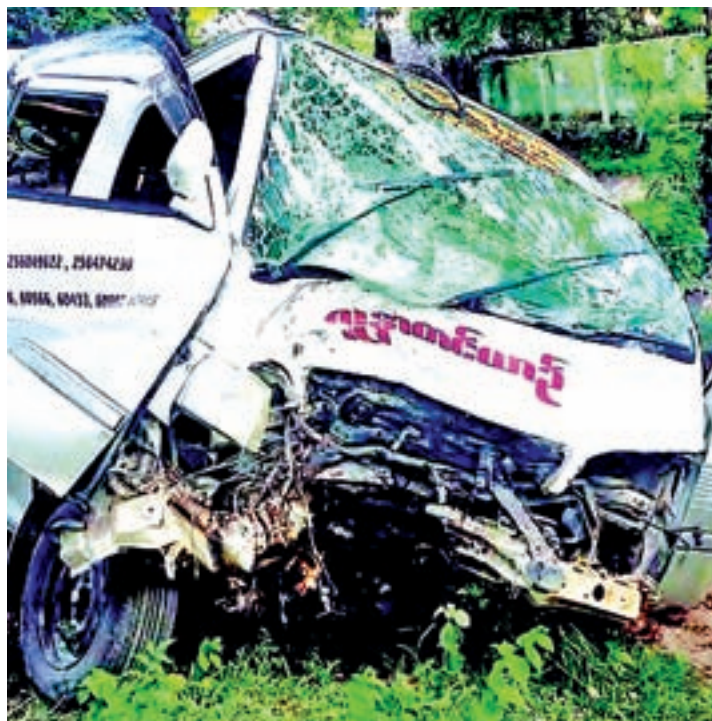
Ambulance being seen after the crash.

The accident killed Daw Thandar Myint on the spot while the other three sustained minor injuries. The injured are undergoing medical treatment at Mandalay general hospital. The police have filed charges against the driver.— Ko Naing (Indaw)