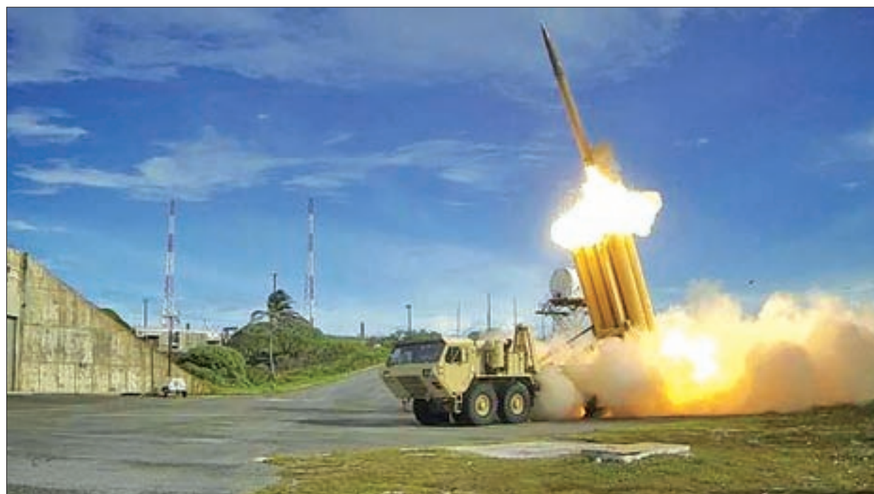
A Terminal High Altitude Area Defence (THAAD) interceptor is launched during a successful intercept test, in this undated handout photo provided by the US Department of Defence, Missile Defence Agency.

Japan has said it is considering another layer of ballistic missile defence, such as THAAD, to complement ship-borne missiles aboard Aegis destroyers in the Sea of Japan and its ground-based Patriot missiles.—Reuters