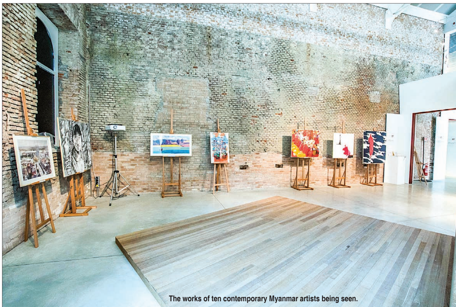
The works of ten contemporary Myanmar artists being seen.