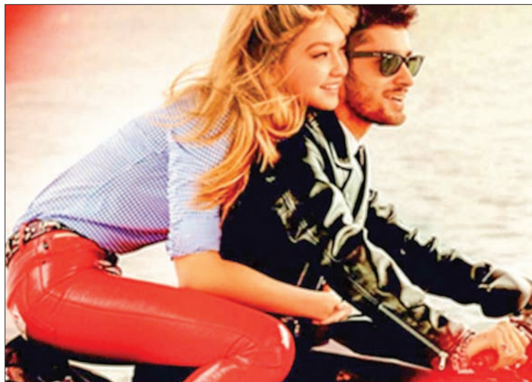
Insiders say that Zayn Malik is feeling better after spending time with girlfriend Gigi Hadid.

"I would just hang out and do nothing. That is still my favorite thing to do."—Reuters