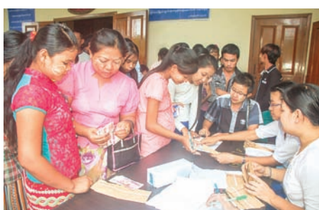
Workers of Unipolar garment factory receive their compensations.

U Khet Htein Nan, member of subcommittee 2, used the meeting for future works, saying that a political dialogue structure presented by the subcommittee 1 is quite similar to a structure approved by ethnic sides at Law Khee La conference.—Myo Myint