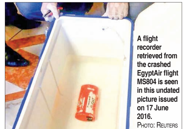
A flight recorder retrieved from the crashed EgyptAir flight MS804 is seen in this undated picture issued on 17 June 2016.

brought to Cairo airport last week, where investigators will try to reassemble part of the frame to help establish what might have caused the disaster. No explanation for the disaster has been ruled out. But current and former aviation officials increasingly believe the reason lies in the aircraft's technical systems, rather than sabotage.—Reuters