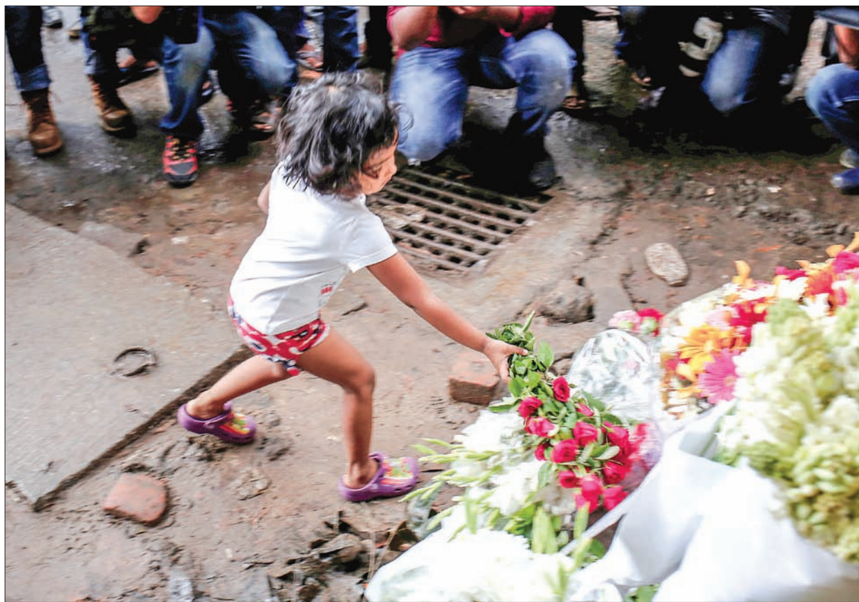
A child place flowers at a makeshift memorial near the site, to pay tribute to the victims of the attack on the Holey Artisan Bakery and the O'Kitchen Restaurant, in Dhaka, Bangladesh, on 3 July, 2016.

Whoever was responsible, Friday's attack marked a major escalation