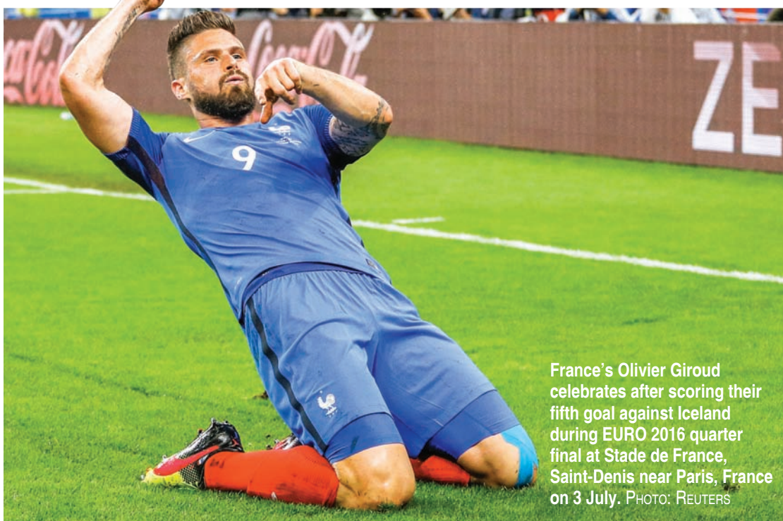
France's Olivier Giroud celebrates after scoring their fifth goal against Iceland during EURO 2016 quarter final at Stade de France, Saint-Denis near Paris, France on 3 July.

France, who had not been past the quarter-finals since they won the tournament in 2000, eased off and cruised home and will no doubt feel they are warm-