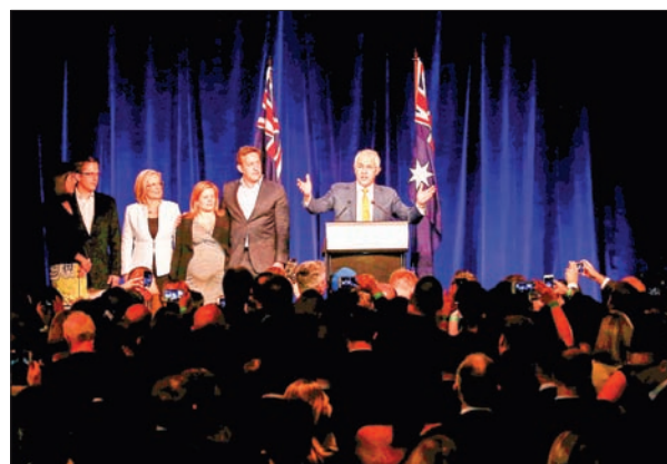
Australian Prime Minister Malcolm Turnbull reacts as he speaks next to members of his family during an official function for the Liberal Party during the Australian general election in Sydney, Australia, on 3 July, 2016.

SYDNEY — Independent candidates who will likely determine a cliff-hanger Australian election shot to prominence on Monday, one of them renewing anti-Asian rhetoric first heard 20 years ago, with Prime Minister Malcolm Turnbull under fire for a failed political gamble.