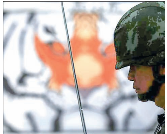
A soldier is silhouetted against the wall of Dusit zoo as he provides security near the Parliament during the National Legislative Assembly meeting in Bangkok in January, 2015.

Last month junta chief Prayuth Chan-ocha and opposition supporters of ousted populist premier Thaksin Shinawatra both contacted the United Nations after an upsurge in political tension, just a day after police shut down an electoral monitoring centre of the "red shirt" anti-government movement. The red shirts say the centres are needed to prevent fraud. Thanawut Wichaidit, a spokesman for the red shirt move-