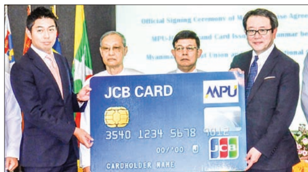
JCB and MPU agreed in March to issue cards in Myanmar.

JCB International is cooperating with Myanmar Payment Union banks to issue JCB cards by the end of 2016 or as soon as next year, according to a press release from the group. As well as this partnership JCB is establishing a branch in Yangon under the subsidiary JCB International (Thailand) Co. Ltd.