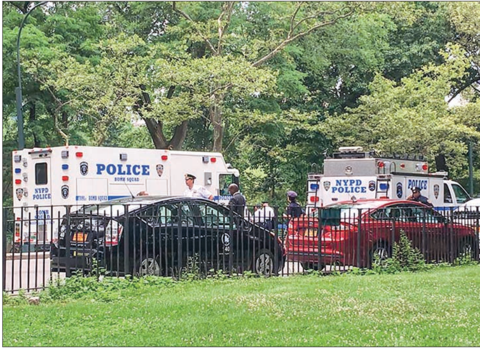
Police stand guard at Central Park in New York, the United States, on 3 July, 2016. An explosion happened early on Sunday at New York's Central Park, leaving one man seriously injured.