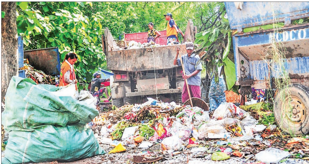
MCDC workers sweep garbage from which electricity will be generated.

Preparations for constructing the new bridge are being made so that the construction of the new bridge can be completed as soon as possible.—200