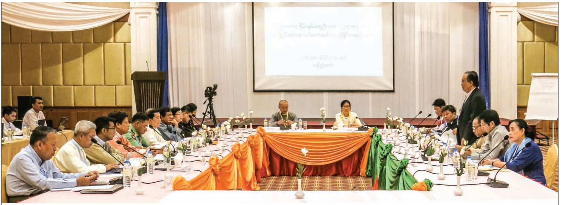
Participants discuss at the second coordination meeting of the preparatory subcommittee 1 for preparing 21 st Century Panglong Union Peace Conference in Nay Pyi Taw.

Preparatory subcommittee-1 gears up for 21 st Century Panglong Union Peace Conference