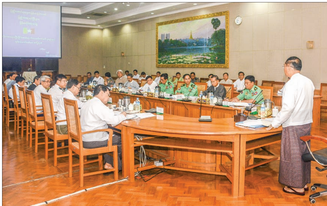
Vice President U Myint Swe addresses at the meeting of "taking care of foreigners".

A supervisory committee for "taking care of foreign visitors" commissioned by the President's office met in Nay Pyi Taw yesterday. Vice President 1, U Myint Swe, chairman of the committee, spoke at the committee's first meeting.