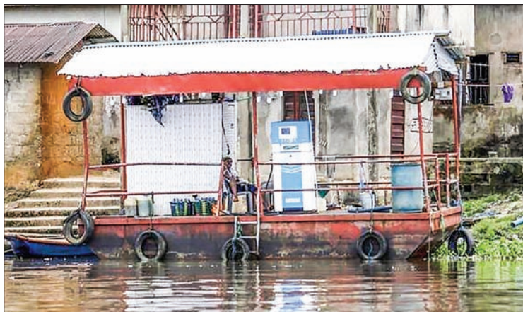
A petrol attendant sits on a floating fuel station on the banks of the Nun River on the outskirts of the Bayelsa state capital, Yenagoa, in Nigeria's delta region 2015.

In messages posted on Twitter in the early hours of Sunday, the Avengers said they had attacked a pipeline connected to the Warri refinery operated by NNPC on Friday night.