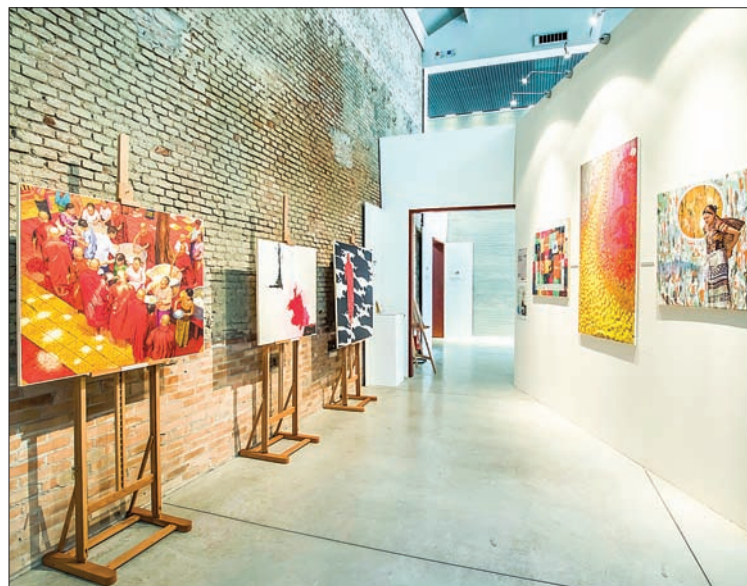
Some of the Myanmar artists's paintings shown in Milan.