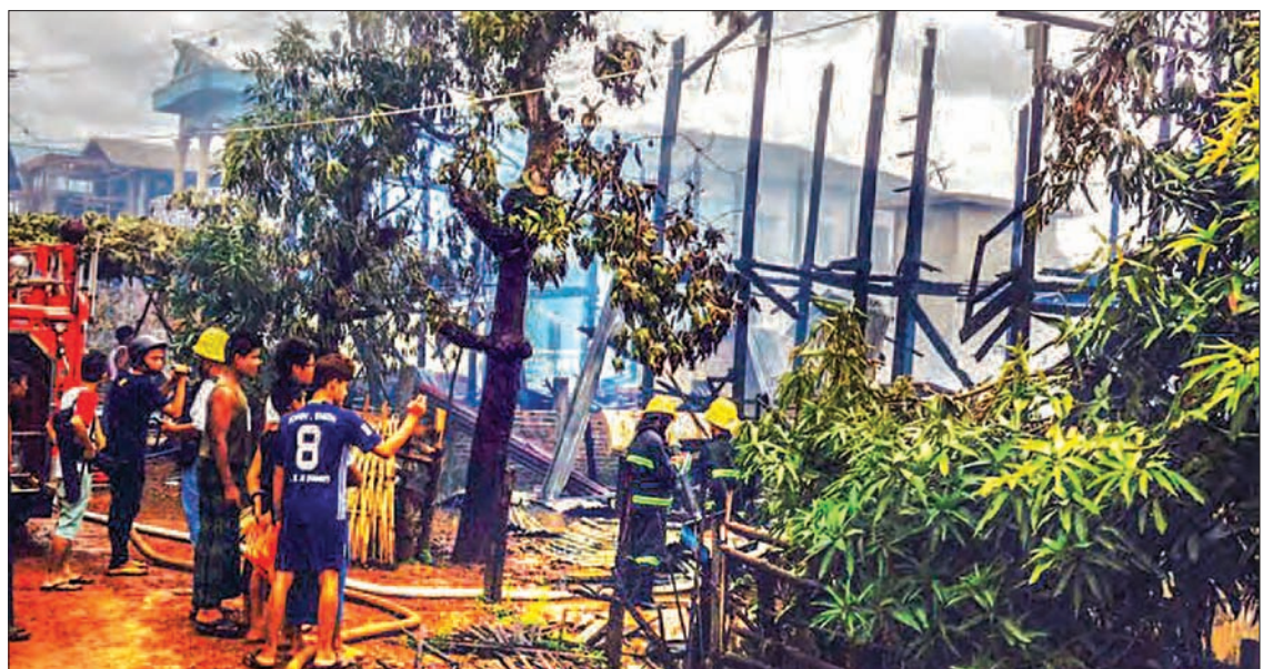
The house seen after being devoured by the fire.