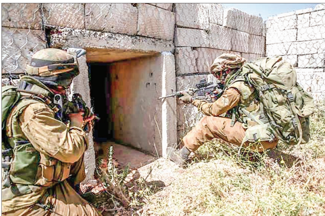
Israeli soldiers from the 605 Combat Engineering Corps battalion take part in a training session on the Israeli side of the border between Syria and the Israeli-occupied Golan Heights, on 1 June 2016.

The Israeli military has also responded in the past with shelling and air strikes to mortar bombs that have landed in the Golan during battles in the Syrian conflict.—Reuters