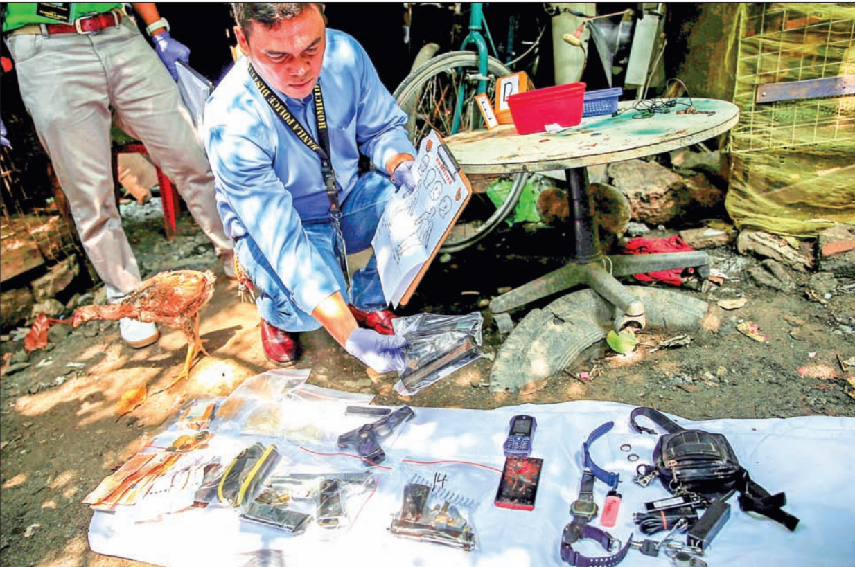
A member of the Philippine National Police (PNP) investigation unit shows illegal firearms along with confiscated methamphetamine, known locally as Shabu and Philippine pesos, seized from suspected drug pushers during an operation by the police in Quiapo city, metro Manila, Philippines on 3 July.