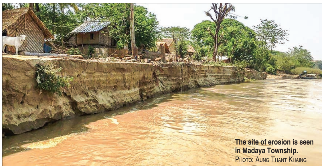
The site of erosion is seen in Madaya Township.

The seven villages are Ywa-thayar Village in Singu Township, Aidai Village in Madaya Township, Simikhon Village in Myingyan Township, Inn-wa on the Myitnge River, Zaycho Village in TadaU Township and Ohtoketan Village and Ushitpho Village on the Panlaung River.— Aung Thant Khaing