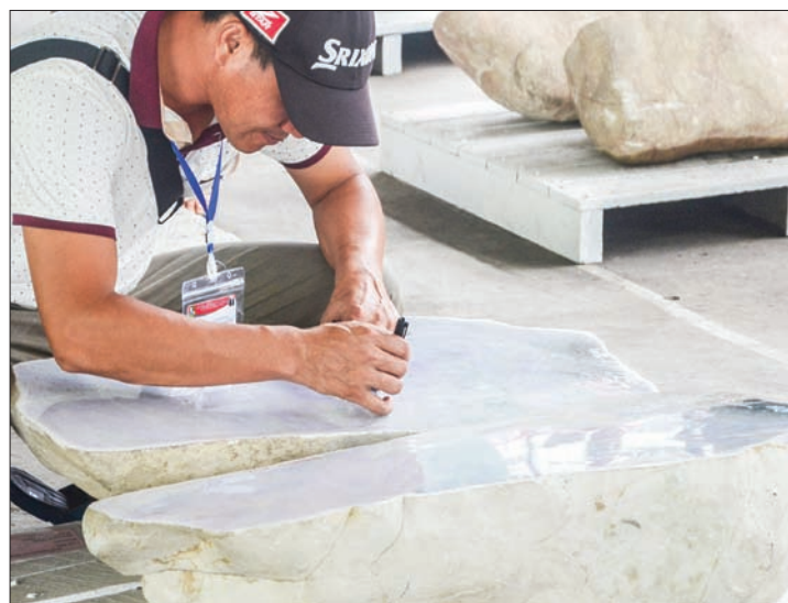
A merchant checks a jade stone during the 53rd Myanmar Gems Emporium in Nay Pyi Taw. PHOTO: MNA

Myanmar uses the Euro at the jade emporium because of US sanctions against the industry.— Myanmar News Agency