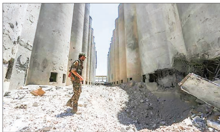
A Syria Democratic Forces (SDF) fighter walks in the silos and mills of Manbij after the SDF took control of it, in Aleppo Governorate, Syria, on 1 July, 2016.