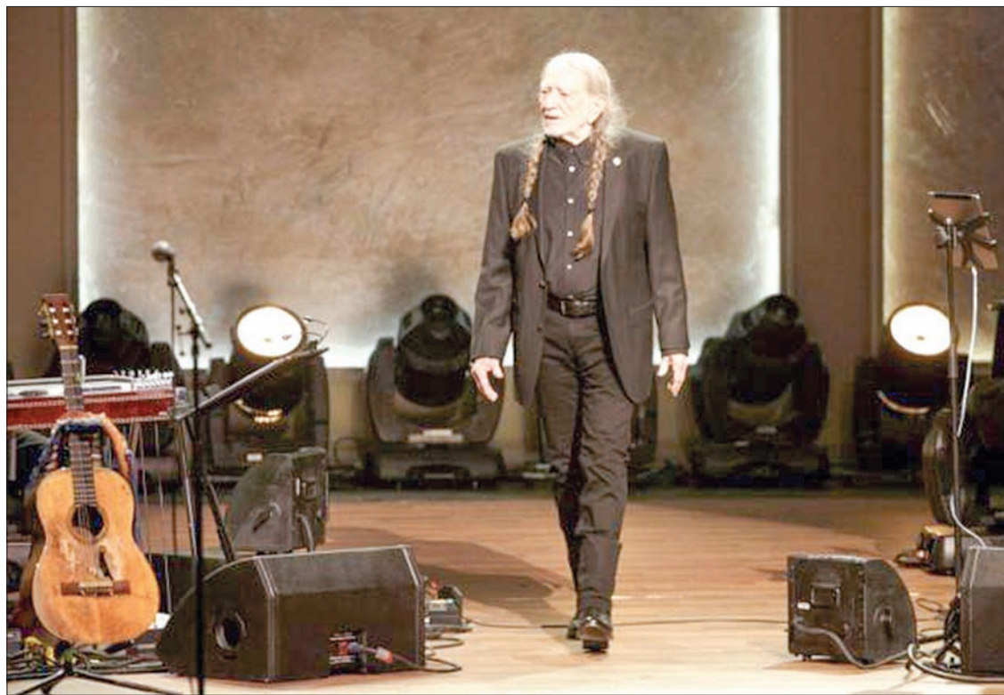
Singer Willie Nelson walk on the stage during a concert honoring him as the recipient of the Library of Congress' Gershwin Prize for Popular Song in Washington, US in November 2015.

"I was looking at (Woodstock) and was realizing the same thing might happen in Texas if it were promoted right and had the right talent," Nelson said in an in-