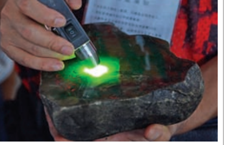
A trader checks a jade stone at 53rd Myanmar Gems Emporium in Nay Pyi Taw.

Business entrepreneurs from Mekong region nations reportedly paid a visit to the Thilawa Special Economic Zone, which lies on the southern outskirts of Myanmar's commercial capital yesterday. To date, Myanmar has seen a total investment of US$3 million since the coming to office of the new Nation League for