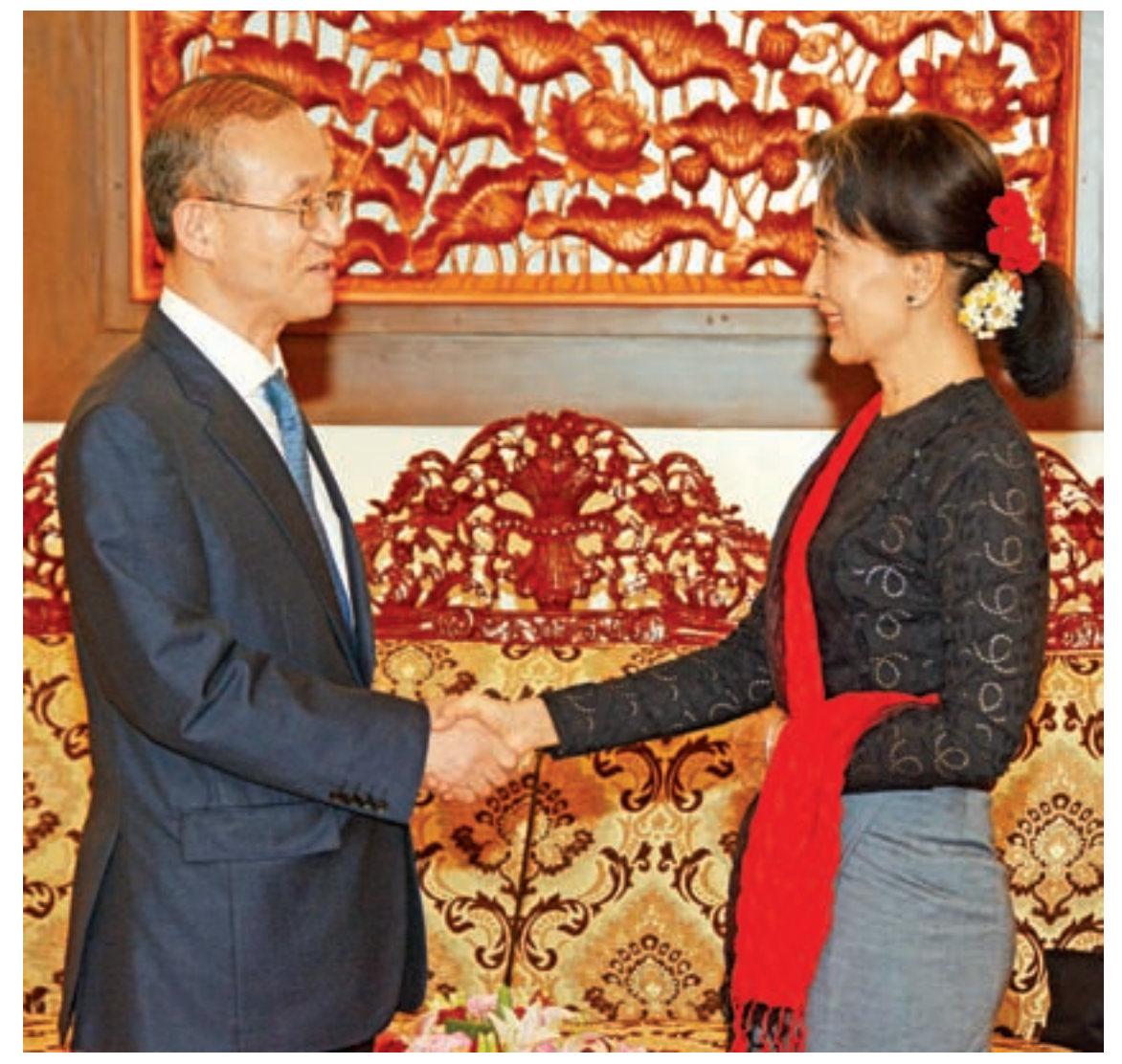
State Counsellor Daw Aung San Suu Kyi welcomes Vice Minister of Foreign Affairs of the Republic of Korea Mr. Lim Sung-nam in Nay Pyi Taw.

further bilateral relations and countries and exchanged views on regional and international issues.—Myanmar News Agency