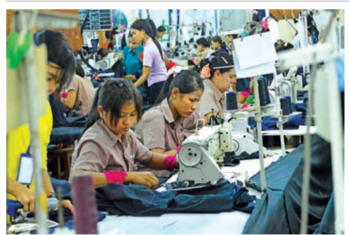
Workers at a production line of a garment factory in Hlinethaya Industrial Zone.