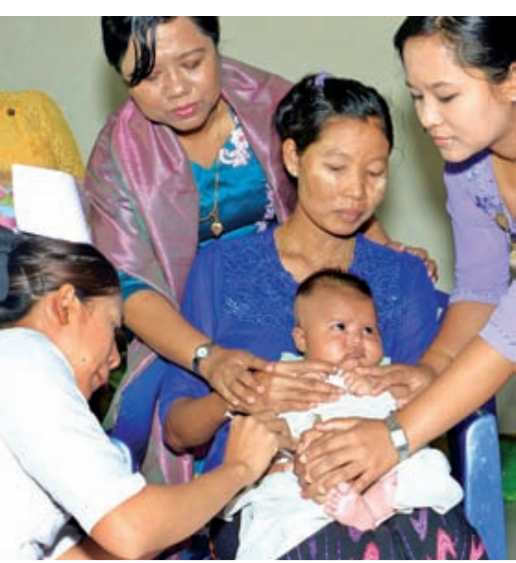
A baby receives Pneumococcal Conjugate Vaccine (PCV) at a ceremony to launch the vaccination programme in Nay Pyi Taw.

The government is set to spend US$1.18million on the pneumococcal immunisation program, said the Union minister, adding that the cost for the immunisation of chil-