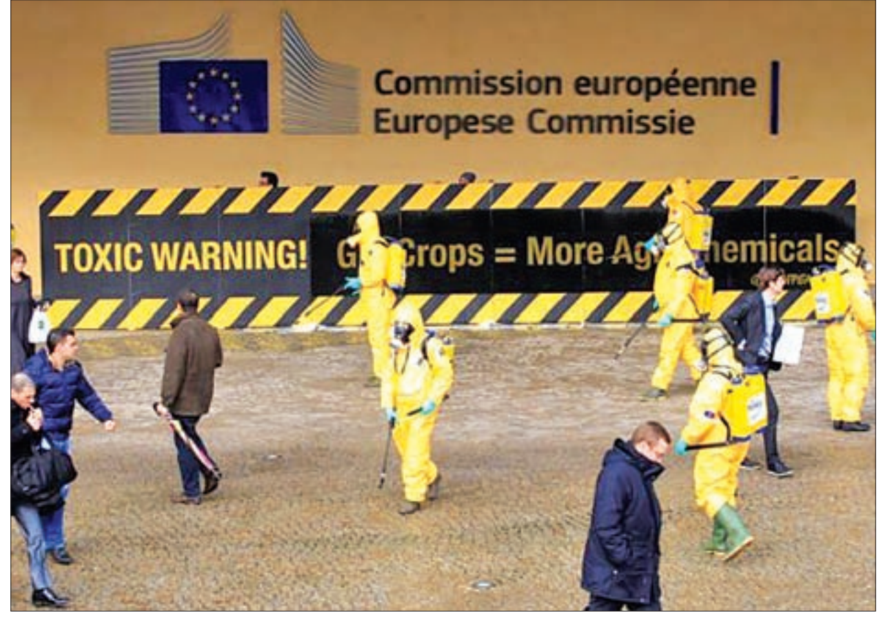
Activists of environmental group Greenpeace wear masks and protective clothing while protesting outside the European Commission headquarters in Brussels in 2012.

"The time has come that we now know these things are safe," Nobel laureate Sir Richard Roberts said. "The basic method does not lead necessarily to a bad thing."