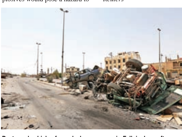
Destroyed vehicles from clashes are seen in Falluja, Iraq, after government forces recaptured the city from Islamic State militants, on 30 June 2016. PHOTO: REUTERS

Riyadh is worried that a landmark nuclear deal reached between Iran, the United States and five other major powers in 2015 will help Tehran gain the upper hand in their regional standoff.-Reuters