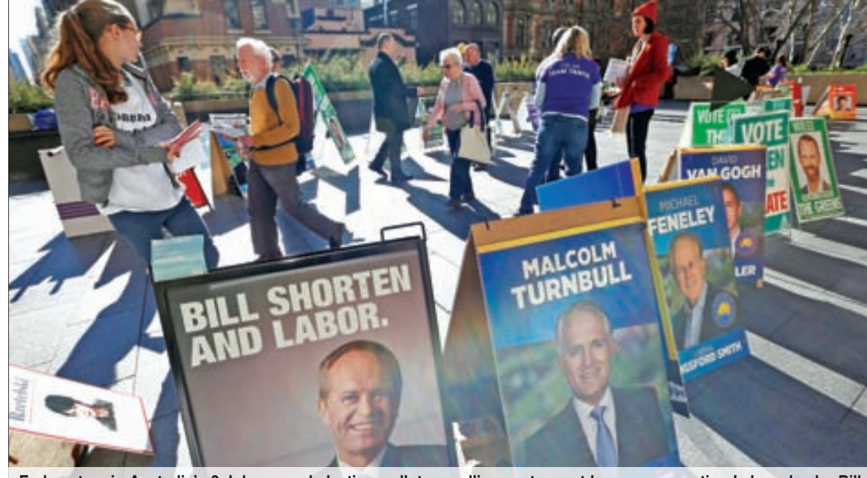
Early voters in Australia's 2 July general election walk to a polling centre past banners promoting Labour leader Bill Shorten (L) and Liberal Party Prime Minister Malcolm Turnbull at Sydney's Town Hall, on 29 June 2016.

make a protest vote. This is a time to treat your vote as though that is the single vote that will determine the next government," he told reporters in Sydney.