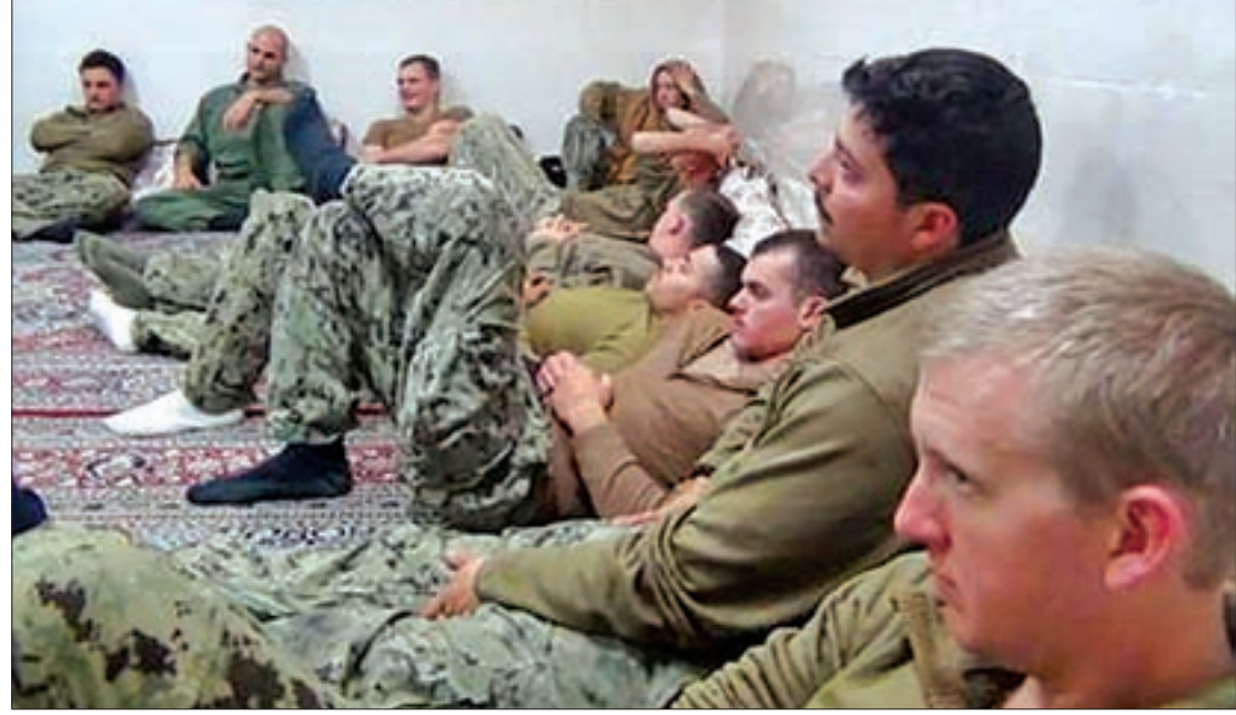
An undated picture released by Iran's Revolutionary Guards website shows American sailors sitting in an unknown place in Iran.

At one point, the crew members did not realise they were near Farsi Island because none of them zoomed into their navigation system's map. — Reuters