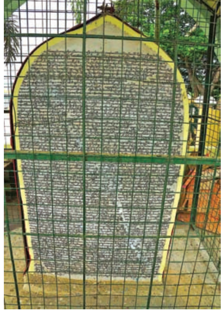
dipa] King Thumondarit of Sre sister wept and fell dead. They be- Stone Inscription at Loka Hteikpan Zedi.

Today Meikhtilar Lake is to the west of Meikhtilar Town. It measures 7 miles long 1/2 mile wide, covering an area of 31/2 square miles. It is now composed of two Lakes-north Lake and south lake and a rail line crosses between them. But they are connected. In monsoon, water flowed into North Lake stays until it is silted and clear before if flows into South Lake. There are 11 sluices and a 30 feet wide water gate. It supplies water for human consumption and irrigation. Many monuments, stone inscriptions and Nat spirit shrines surround the Lake, recording its long history.