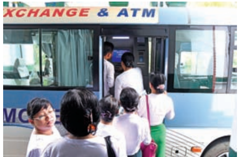
Teachers line up to draw salary with the use of ATM card.

AN ATM card payment system Ministry of Education in Yanhas been introduced to employees including teachers of the enabling employees, especially