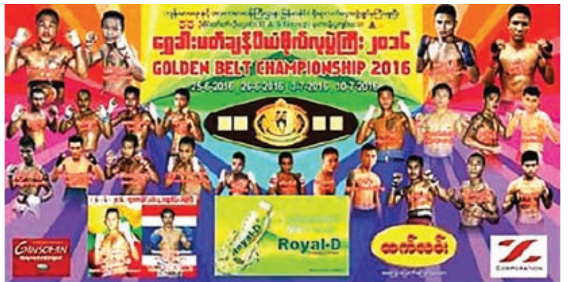
The Wall Poster of Golden belt championship being seen. PHOTO: 200

GTG Group will award K500,000 (US$422) each to golden belt champions who seized the belt for each weight class at the 8th Myanmar traditional lethwei's Golden Belt Championship.