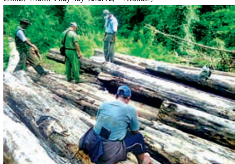
Sixteen tonnes of unclaimed logs seen after seizure.