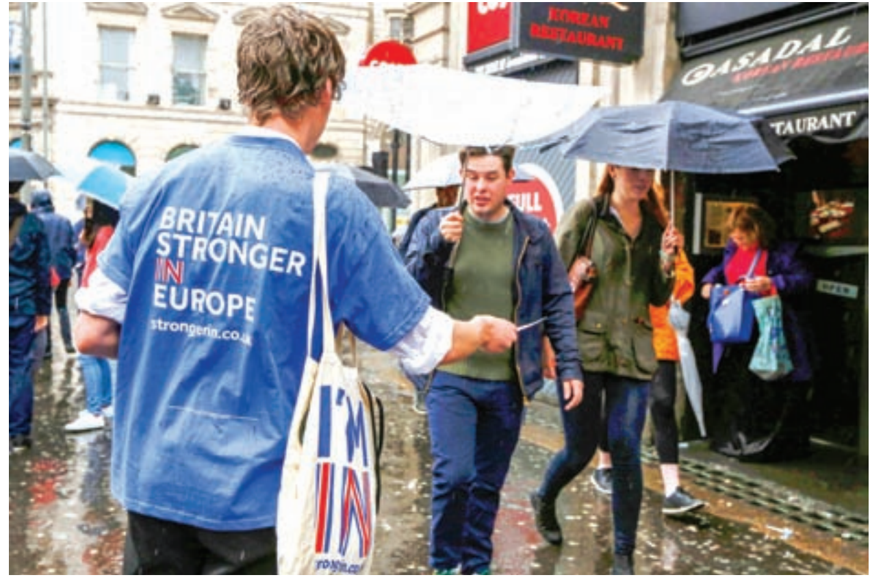
A supporter of the "Britain Stronger IN Europe" campaigns in the lead up to the EU referendum at Holborn in London, Britain on 20 June 20, 2016.

"She worried about the tone of the debate" that focused increasingly on immigration and "about the tone