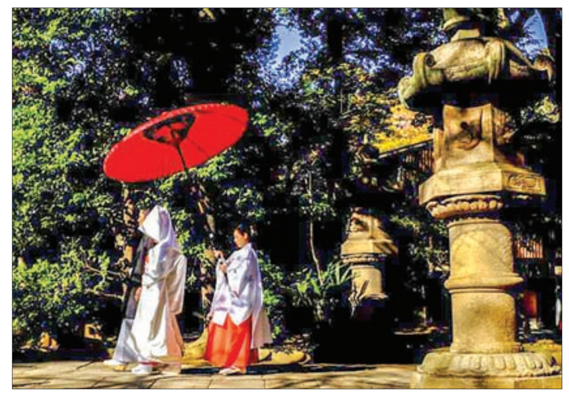
A couple walk in the garden of the Hikawa shrine during their traditional Shinto wedding ceremony in Tokyo in 2015.

Japan's population is projected to fall around a third to 87 million in 2060, the National Institute of Population and Social Security Research says.—Reuters