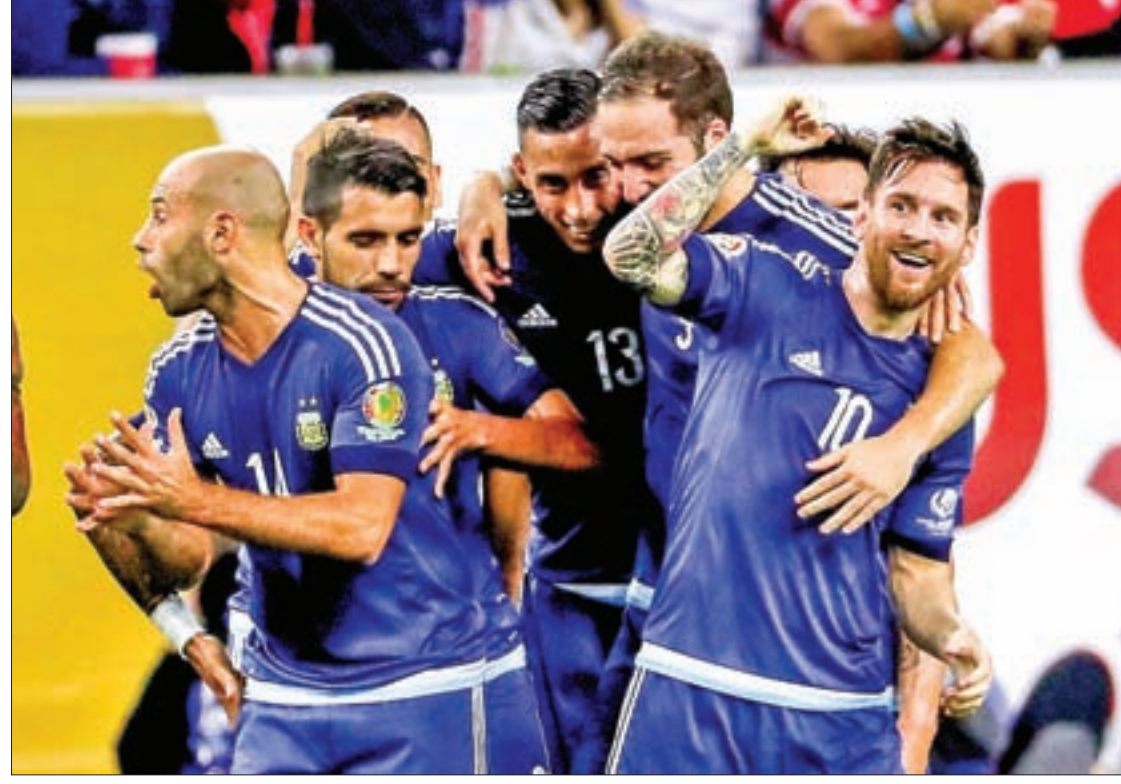
Argentina midfielder Lionel Messi (10) celebrates with teammates after scoring a goal during the first half against the United States in the semifinals of the 2016 Copa America Centenario soccer tournament at NRG Stadium, Houston, TX, USA, on 21 June 2016.

'We needed to get back in a final but we can never get ahead of ourselves," Argentine coach