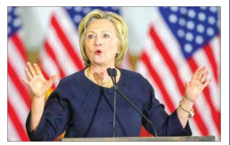
Democratic US presidential candidate Hillary Clinton speaks at a campaign rally in Cleveland, Ohio on 13 June, 2016.

Trump has focused much of his energy in recent days on the mass shooting in Orlando, Florida by a US-born gunman pledging allegiance to Islamic State militant group. Trump vowed to ban people from entering the United States from countries with links to terrorism against America or its allies. Hardline national security proposals have help Trump win in-