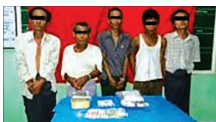
Criminals seen together with yaba and marijuana seized.

Police further discovered marijuana weighing 168 grams. Police have filed charges against all suspects under the Narcotic Drugs and Psychotropic Substances Law.— Soe Win