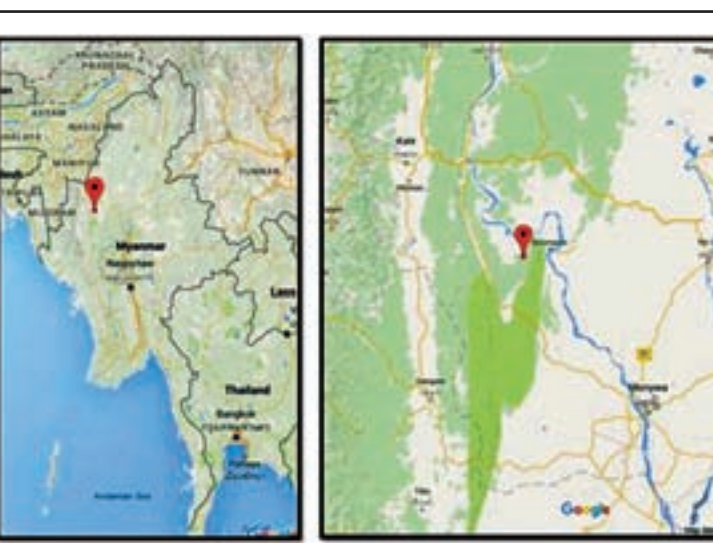
A map shows location where 4.7 Richter scale earthquake occurred.

Experts have warned that the faultline is currently active and that Myanmar should prepare for a large earthquake in the future. A quake in Shan State in 2011 registered 6.9 RS at a depth of 10km, 151 were reportedly killed and 212 injured in Myanmar and Thailand.