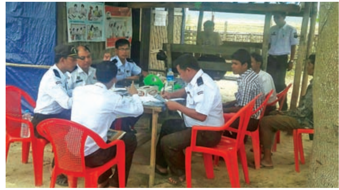
Immigration officers are working to issue National Verification Cards to locals in Rakhine State.

NATIONAL Verification Cards (NVC) were handed out to 164 people in Sittwe recently, NVCs are the current government's answer to identification cards, also known as 'green cards.' These cards are recognised under the Myanmar's 1982 Citizenship Law.