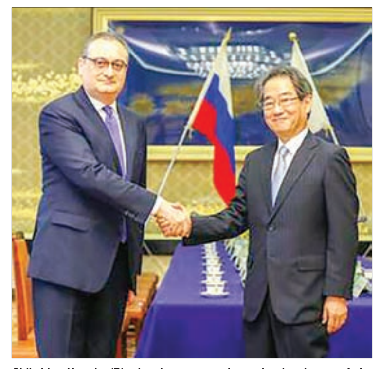
Chikahito Harada (R), the Japanese ambassador in charge of Japan-Russia relations, and Russian Deputy Foreign Minister Igor Morgulov shake hands before their meeting in Tokyo on 22 June, 2016. The two countries had negotiations for concluding a post-World War II peace treaty for the first time since October.

The officials' meeting is also expected to lay the groundwork for a visit by Putin to Japan. A visit was tentatively scheduled for 2014 but postponed after Moscow annexed Ukraine's Crimean peninsula region in March 2014, souring relations with Western countries and Japan.— Kyodo News