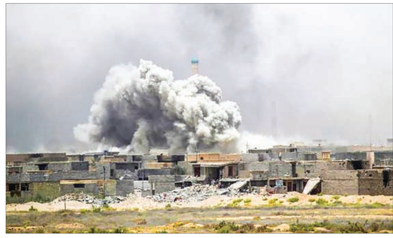
Smoke rises from clashes with Islamic State militants in Falluja, Iraq, on 10 June, 2016.

WASHINGTON — President it will turn increasingly to less Barack Obama and some administration officials have hailed recent military gains against Islamic State in Iraq and Syria, but other US officials and outside experts warn that the US-backed air and ground campaign is far from eradicating the radical Islamic group, and could even backfire. While Islamic State's defeats in Iraq and Syria have erased its image of invincibility, they threaten to give it greater legitimacy in the eyes of disaffected Sunni Muslims because Shi'ite and Kurdish fighters are a major part of the campaign, some US intelligence officials argue.