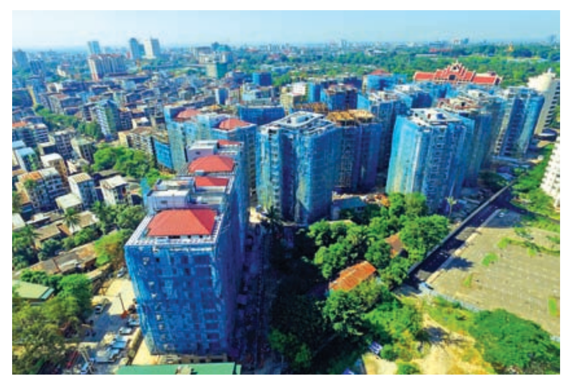
Myanmar's construction industry is expected to see boom over five years.