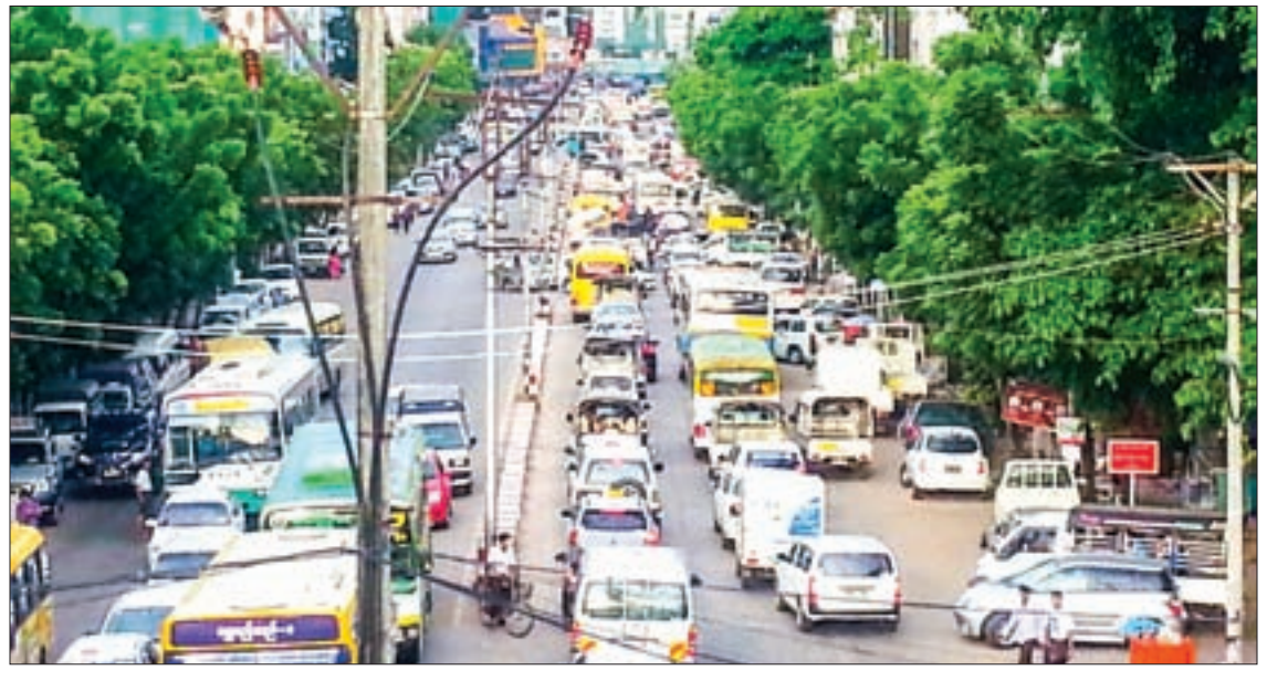
drivers. Some even don't know the Traffic jam on the ThaMeinBaYan Road in Tamwe.

For example, building multi-storey car parks, erecting double-decker roads instead of flyovers, improving the existing city circular railway system, strengthening the BRT force and operations, extending the roads where and when possible, enforcing traffic rules and completing the renovation works of underground conduits and cables that involve parts of roads in time can also do the job.