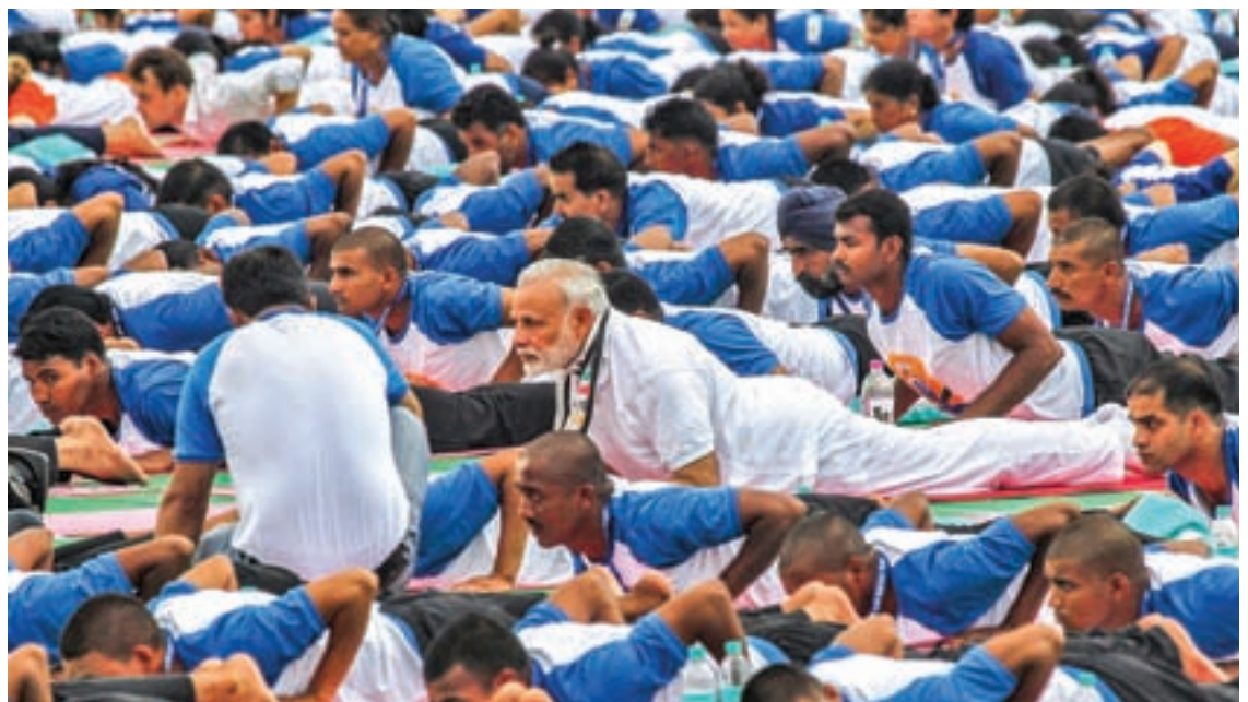
India's Prime Minister Narendra Modi (C) performs yoga during World Yoga Day in Chandigarh, 21 June, 2016.

sessions across India, with several of them posting tweets and pictures. "Extremely happy to be amongst you all to participate and practice yoga," tweeted Urban Development and Housing Minister Vekaiah Naidu.