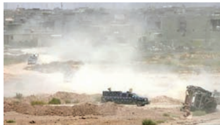
A military vehicle of Iraqi security forces is seen in Falluja, Iraq, on 20 June.

The militants seized Falluja in January 2014, six months before they declared a "caliphate" over part of Syria and Iraq.—Reuters