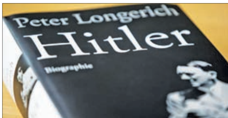
The cover of Peter Longerich’s new book “Hitler” is pictured in Berlin, Germany, in 2015.

The bidder from Argentina told Bild he was purchasing the objects for a museum whose name he did not disclose.—Reuters