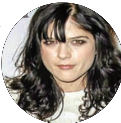
Selma Blair has been hospitalised following a bizarre incident on board a plane bound for Los Angeles.

Blair was 39 when she gave birth, and while she acknowledges it was quite late in life to have a first child, she wouldn't have had things any other way.