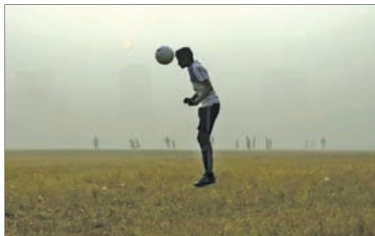
A man jumps to head a ball during his soccer practice in a public park on a foggy morning in Kolkata in 2014.