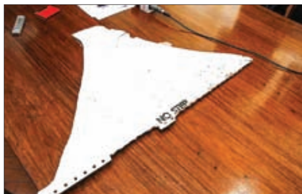
A piece of an airplane displays during a news conference in Maputo, capital of Mozambique, on 3 March.

CANBERRA — An Australian support group for family members of passengers who were aboard missing Malaysia Airlines flight MH370 has released photographs of personal