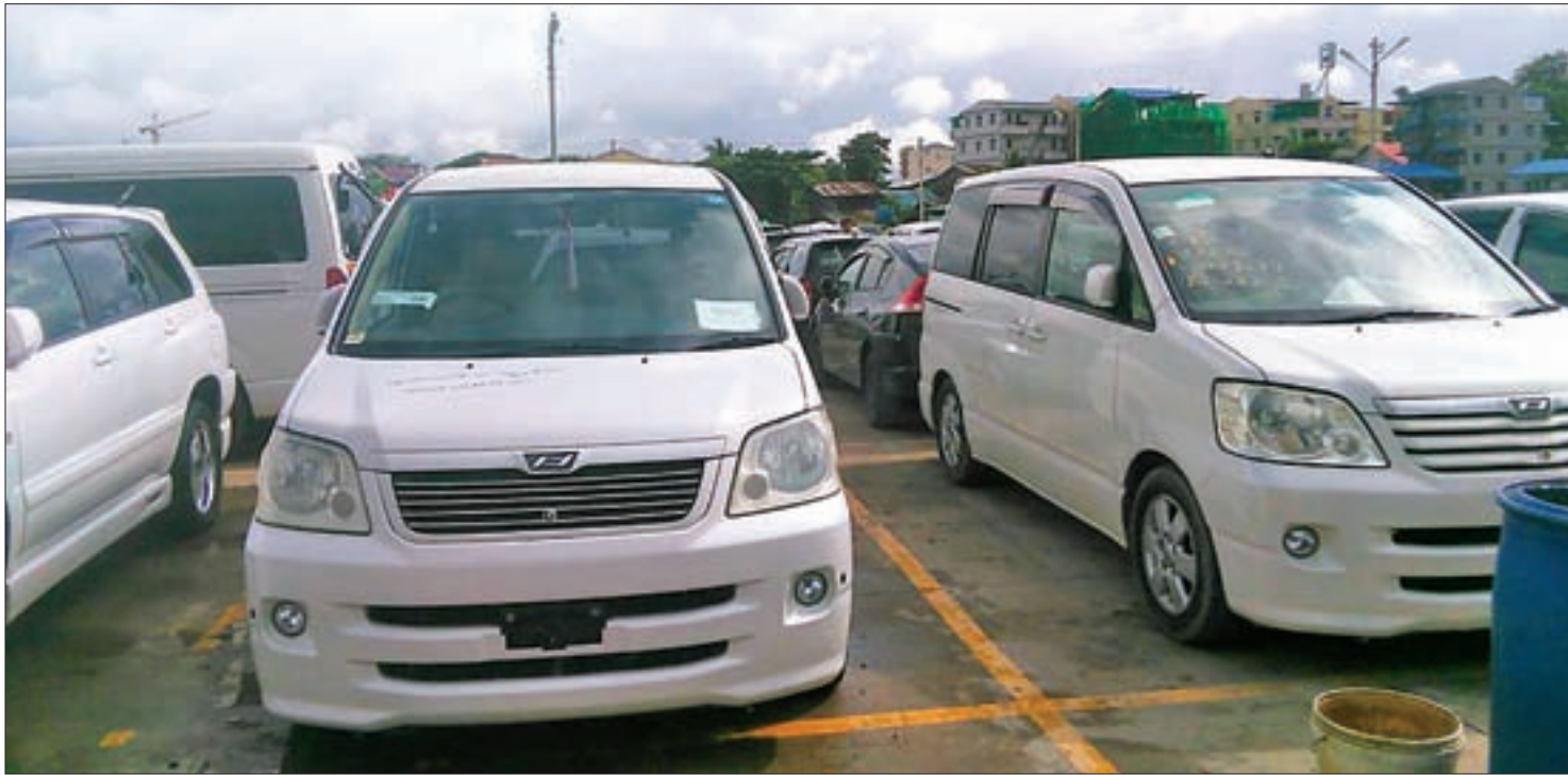
Cars are displayed at a trade centre in Yangon.