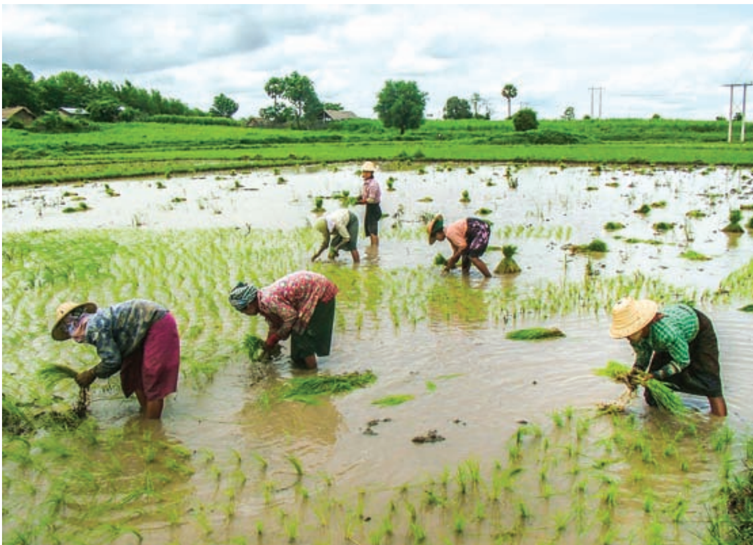
Farmers transplant paddy in Bago.

The aforementioned Mandalay DICA Office was established in May 2014 in a bid to ease the lives of business entrepreneurs who had to travel from the countryside to the DICA based in Naypyidaw in order to submit an application for company registration or extend an existing registration.