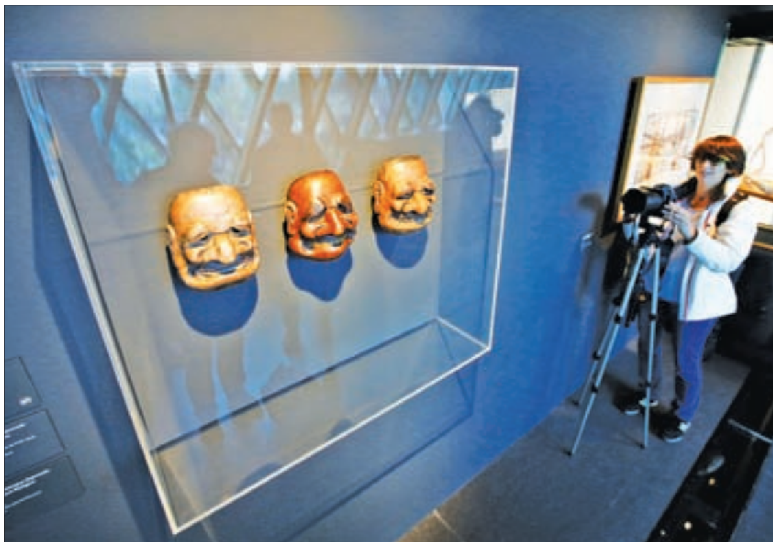
Buaku Japanese masks from traditional Kyogen comic theatre are seen during a press visit of the exhibition ‘Jacques Chirac ou le dialogue des cultures’ at the Musée du quai Branly in Paris, France, on 20 June, 2016.

Chirac, a center-right politician who was a prominent figure in French politics for decades, was president from 1995 to 2007.—Reuters