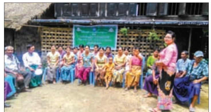
Vocational training opening ceremony in progress.

Trainers from the Small Industries Department and 15 female trainees are attending the 7-day course which will run until 26 June.— Shwe Win (Pyay)