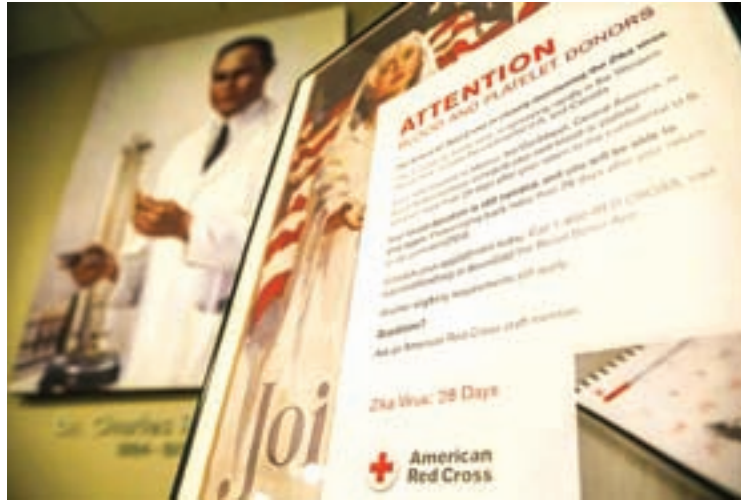
A sign explaining the parameters concerning the Zika virus and blood donations is seen at the American Red Cross Charles Drew Donation Centre in Washington, on 16 February, 2016.

Cerus's shares rose as high as $6.37 in morning trading on Nasdaq before slipping back to $6.20, or up 8.8 per cent, at midday.— Reuters