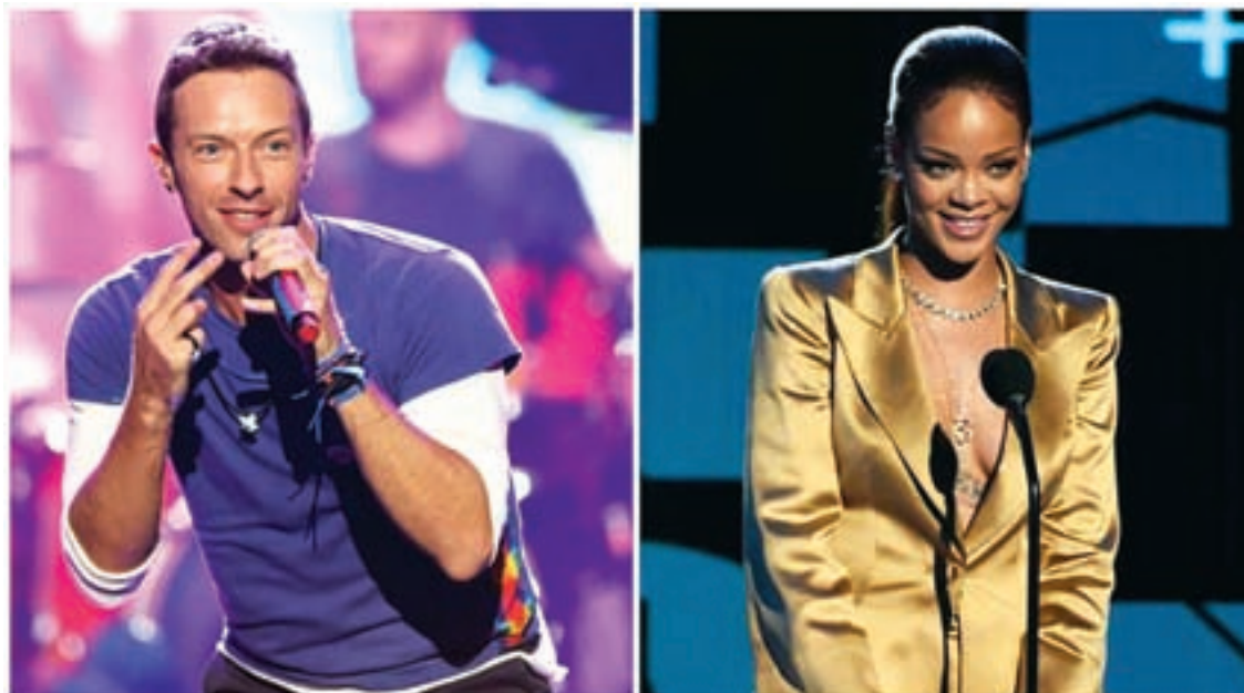
Rihanna and Coldplay are set to headline Made in America Festival.