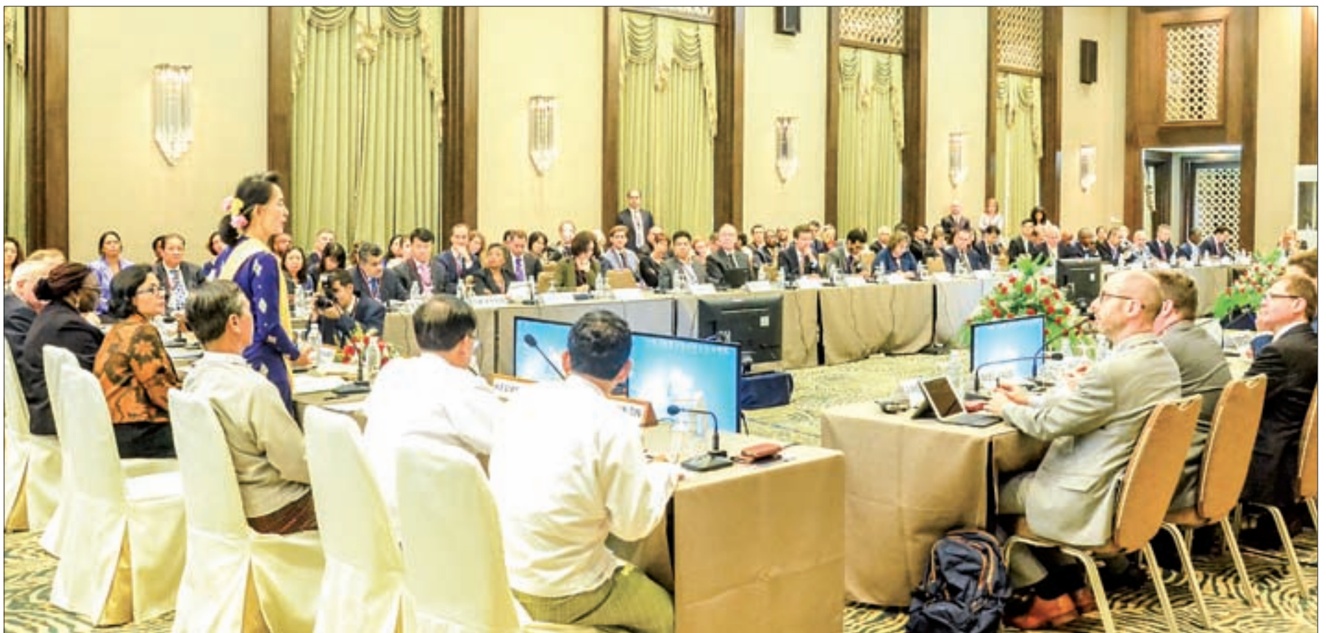
State Counsellor Daw Aung San Suu Kyi delivers the opening address at the opening ceremony of the Second IDA 18 Replenishment Meeting.

State Counsellor Daw Aung San Suu Kyi addresses Second IDA 18 Replenishment Meeting