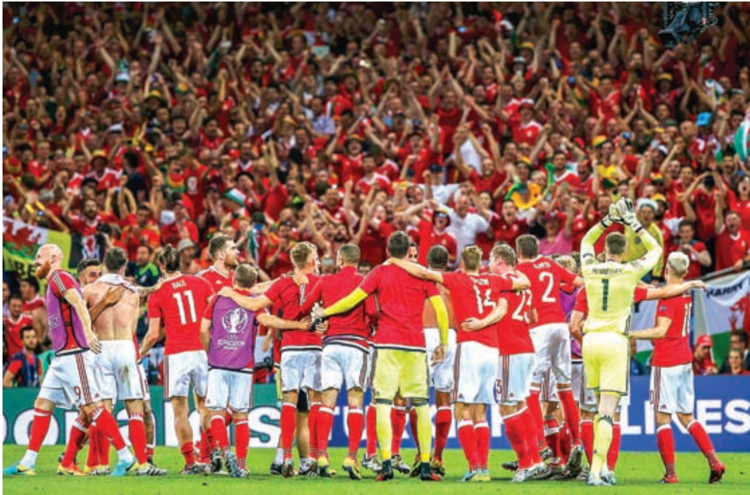
Wales' players celebrate after the match at Stadium de Toulouse, Toulouse, France, on 20 June.