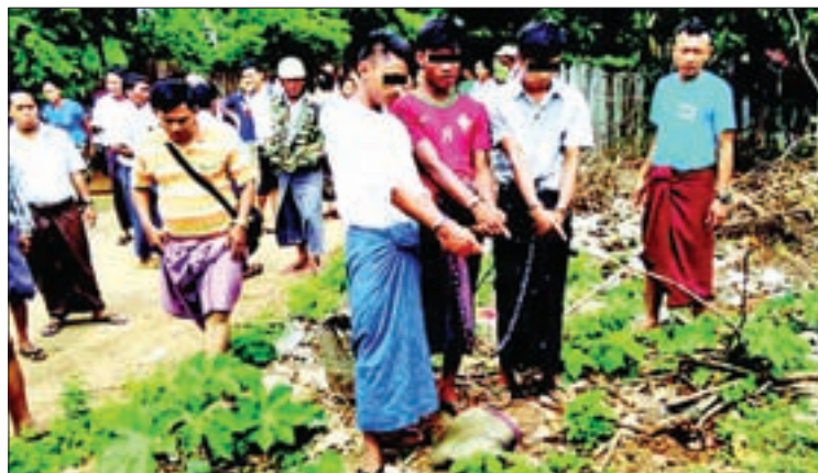
The criminals being seen after arrest.