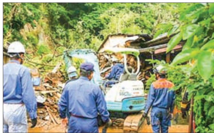
A rescue team tries to determine if there are any people trapped inside a damaged house, hit by a landslide triggered by torrential rain, in the southwestern Japan city of Uto on 21 June 2016. Heavy rain fell across Kumamoto Prefecture, where the ground was already unstable from massive earthquakes that shook the region in mid-April.