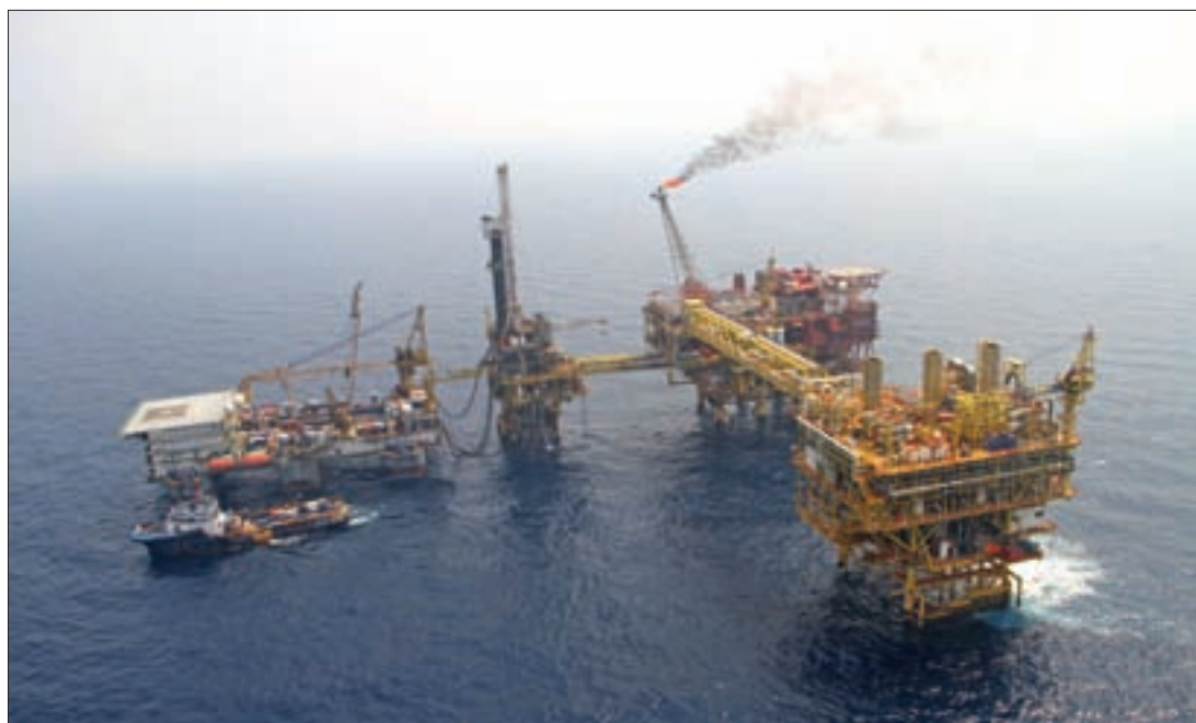
Yedagun offshore natural gas rig.

in the post-election period, as the first quasi-civilian government's first term ended. The second NDP will be led by the new National League for Democracy party.