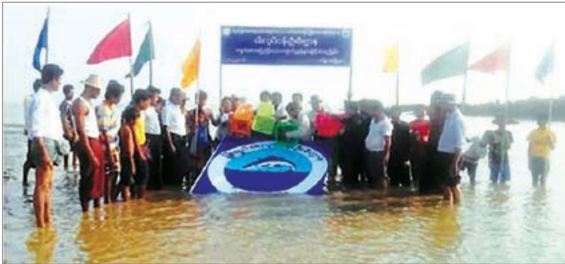
Fish are being introduced to Ayeyawady River. PHOTO: 200

OVER three million fish will be introduced into the Ayeyawady River to improve water recourses which have been adversely effected by deforestation and un-disciplined fishing. The project will be jointly implemented by the Ayeyawady West Development Organisation (AWDO) and civil