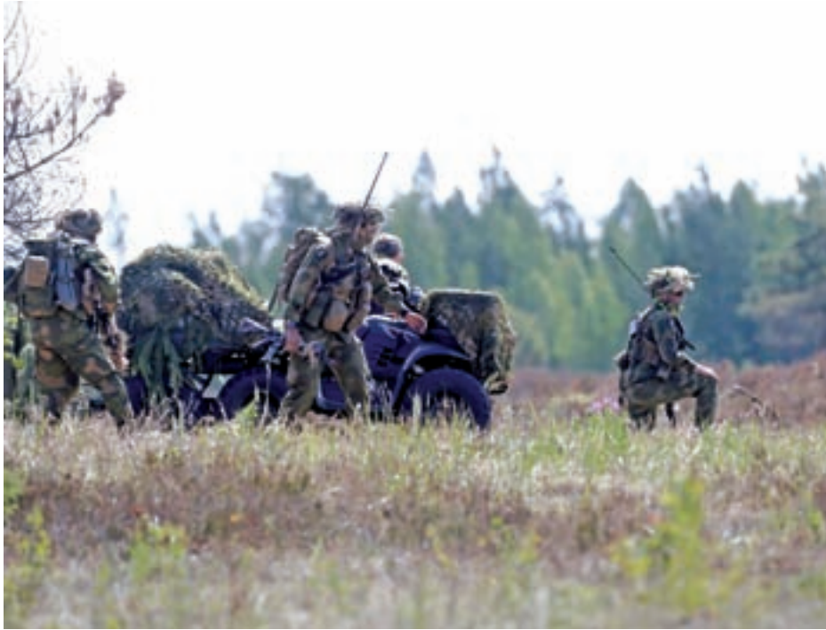
Norwegian army soldiers take part in the “Sabre Strike” NATO military exercise in Adazi, Latvia, on 13 June 2016.

He said Russian surveillance ships did shadow US ships during the exercise, and Russian jets and helicopters flew over US