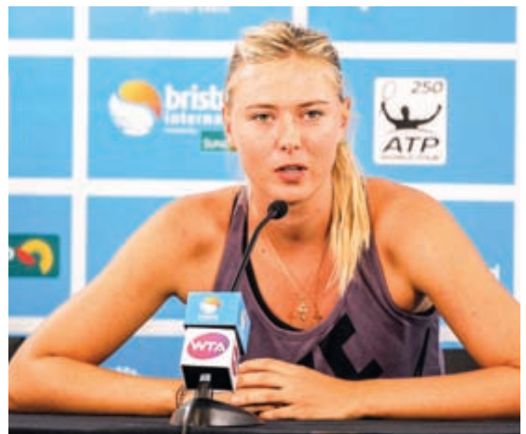
Maria Sharapova of Russia.