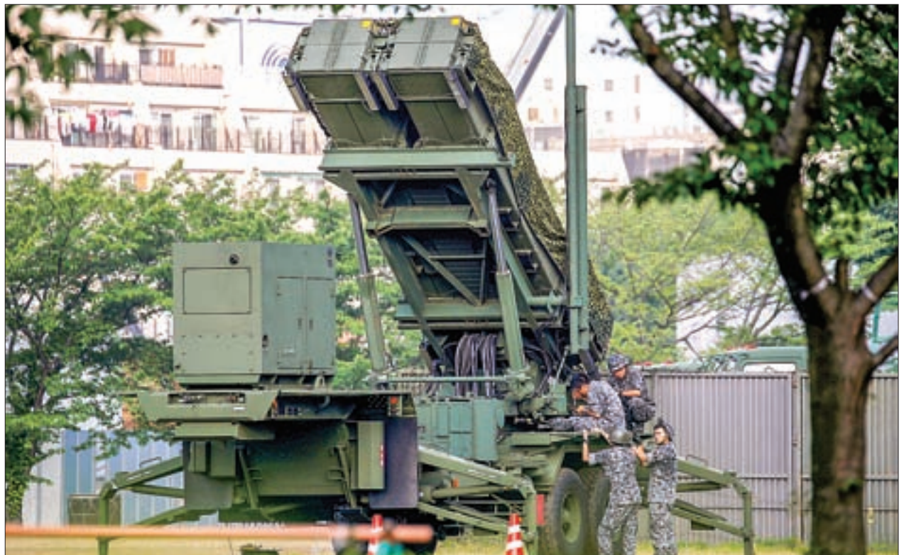
Japan Self-Defence Forces soldiers are seen next to a unit of Patriot Advanced Capability-3 (PAC-3) missiles at the Defence Ministry in Tokyo, Japan, on 21 June.

South Korea's Foreign Ministry said if the North goes ahead with a launch it would again be in violation of UN resolutions and de-