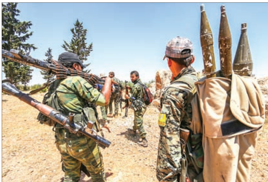
Fighters of the Syria Democratic Forces (SDF) carry their weapons as they walk in the western rural area of Manbij, in Aleppo Governorate, Syria, on 13 June, 2016.

forces succeeded in repulsing the militant attack and remained positioned on the outskirts of the city, most of whose residents remain trapped inside due to mines planted by the militants, who have dug in to defend it.