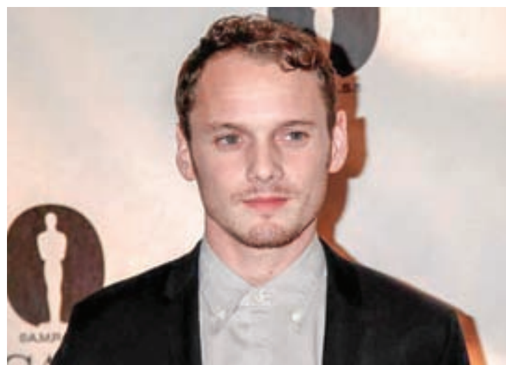
Actor Anton Yelchin.

WASHINGTON/LOS ANGELES — Fiat Chrysler Automobiles NV said on Monday it would investigate a crash that killed "Star Trek" actor Anton Yelchin in his recalled 2015 Jeep Grand Cherokee.