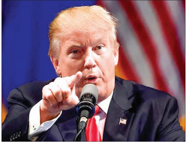
Republican US presidential candidate Donald Trump speaks during a campaign rally at the Treasure Island Hotel & Casino in Las Vegas, Nevada, on 18 June 2016.

Hillary Clinton, the presumptive Democratic nominee, has said the comments show Trump is unfit to be president. The Flori-