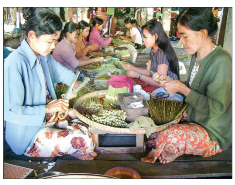
Women make traditional cheroots in Bago.

According to WHO, tobacco signatory to the International kills approximately 6m people Convention on Tobacco Control Office released a statement on 19 May this year calling for necessary measures to be taken to reduce chewing of betel quid and recklessly spitting betel juice in