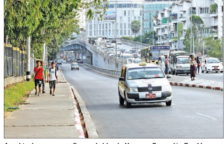
A red taxi seen near a flyover bridge in Yangon.

Currently, Singapore Airlines (SIA) and Tiger Air have no plans to extend their flights. Visa exemption will be effective commencing on 1 December, allowing citizens holding ordinary passport to stay 30 days in either country.—200