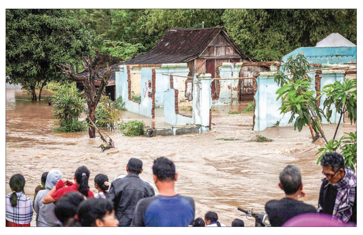
People stand in front of a flooded area in Kampung Sewuresidential area in Solo, Central Java province, Indonesia, on 19 June.

"We still see this as campaign strategy. Campaigning is one thing and realisation is another thing," he said.—Reuters