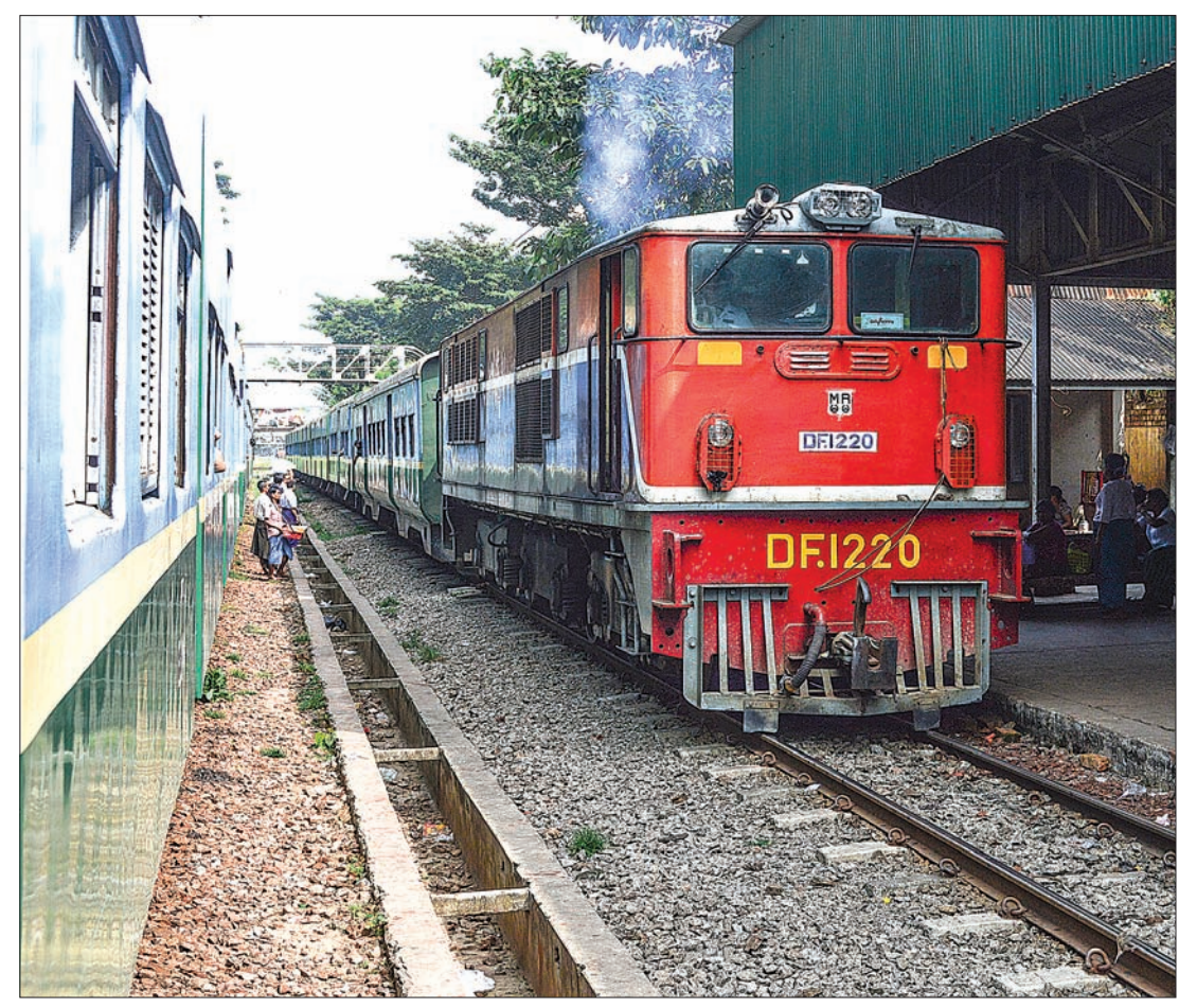
The fare rate for circular trains will be set depending on the miles travelled.