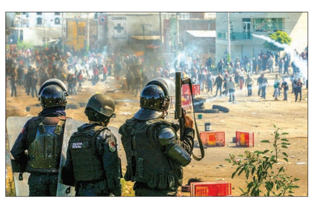
Protesters from the National Coordination of Education Workers (CNTE) teachers' union clash with riot police officers during a protest against President Enrique Pena Nieto's education reform, in the town of Nochixtlan, northwest of the state capital, Oaxaca City, Mexico, on 19 June 2016.

"These kinds of radicalised protests generate violence," he told a news conference in the state cap-