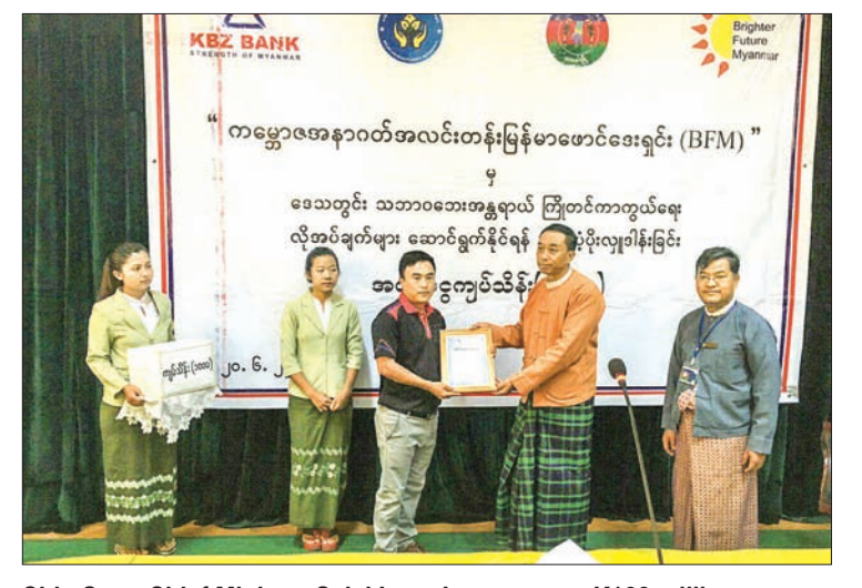
Chin State Chief Minister Salai Lyan Lwe accepts K100 million presented by U Ye Thwe Oo of KBZ.

When floods and landslides hit nationwide last year, KBZ worked on evacuating and sending relief aid to the disasters-hit areas as well as working with local volunteers and NGO groups. The foundation was established after Cyclonic Nargis hit the country in 2008.—Thiha Tun