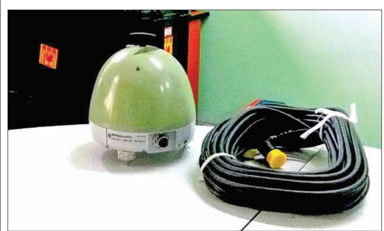
Equipment to be used for seismoters.