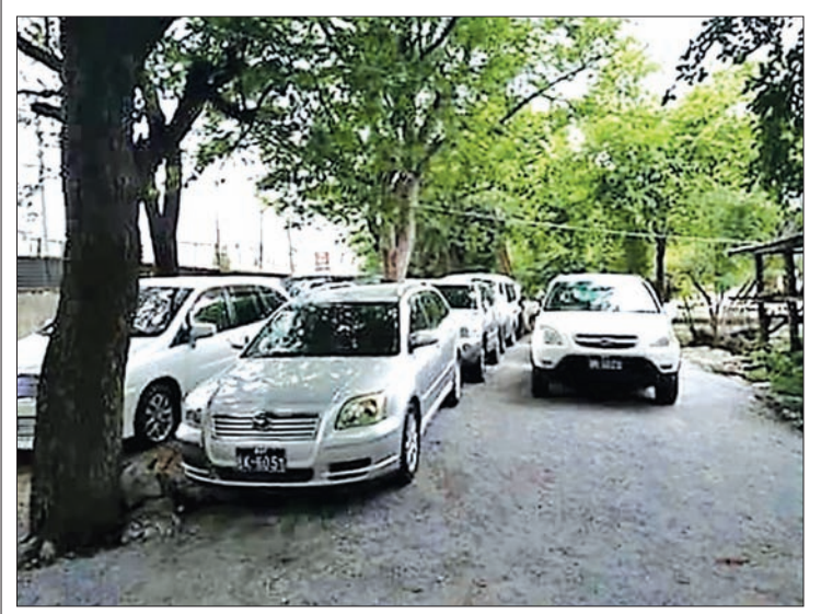
Seized unlincensed cars are seen in Mandalay.

Township and nine at another monastery, said police. According to the police, the seized vehicles were found unregistered with the Road Transport Administration Department, known by its Myanmar initials Ka-Nya-Na. Cases have been filed at the police station and two men were found with the unlicensed cars, said police.