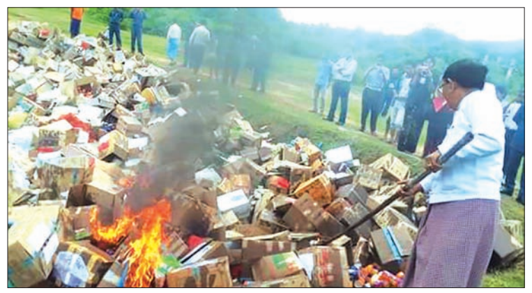
Unsafe foodstuff being destroyed.

THE Public Health Department (Yangon Region) will conduct a new campaign to raise food safety-related awareness amongst small-and-medium-scale manufacturers (SMEs), said its spokesperson.