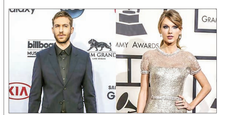
Taylor Swift and Calvin Harris.