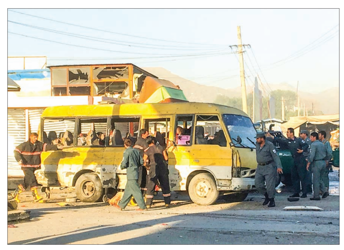
Police and fire fighters are seen at the site of a blast in Kabul, on 20 June.