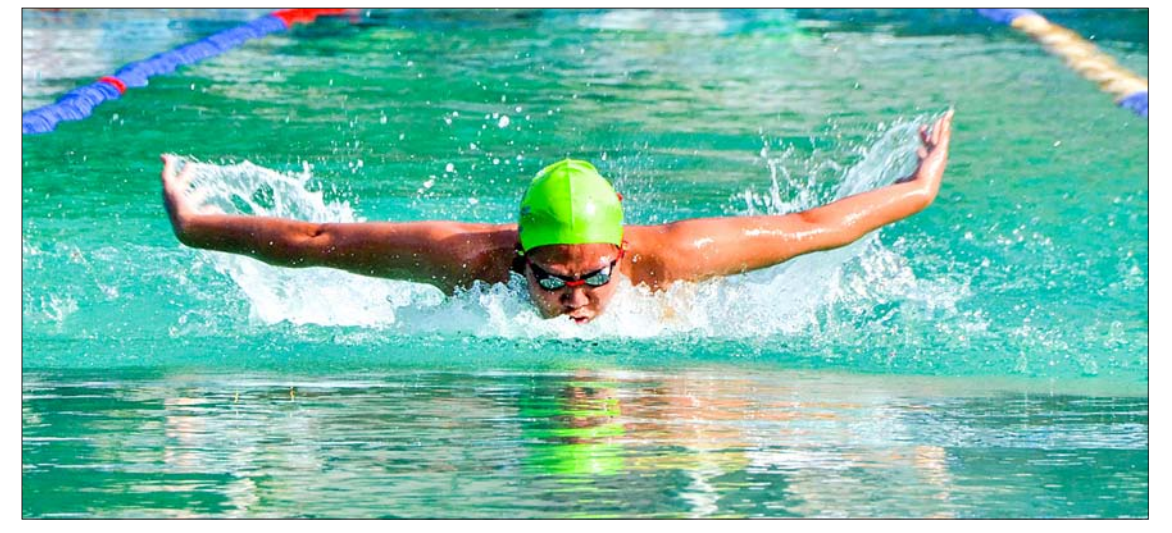
A swimmer participates in an event to mark Olympic Day 2016.

participating contestants. Officials presented prizes to