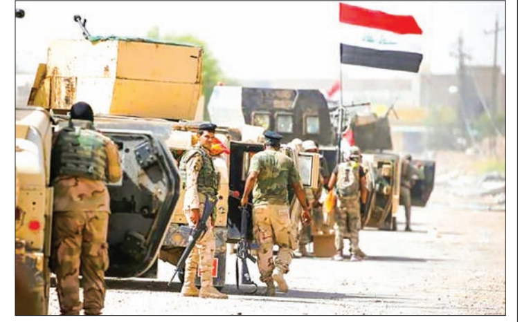
Iraqi army soldiers carry their weapons as they gather in the centre of Falluja, Iraq, on 17 June.

The government had also authorized troops to train other Iraqi forces such as the police, who were tasked with securing cities once they had been freed from Islamic State, the defence minister said.—Reuters