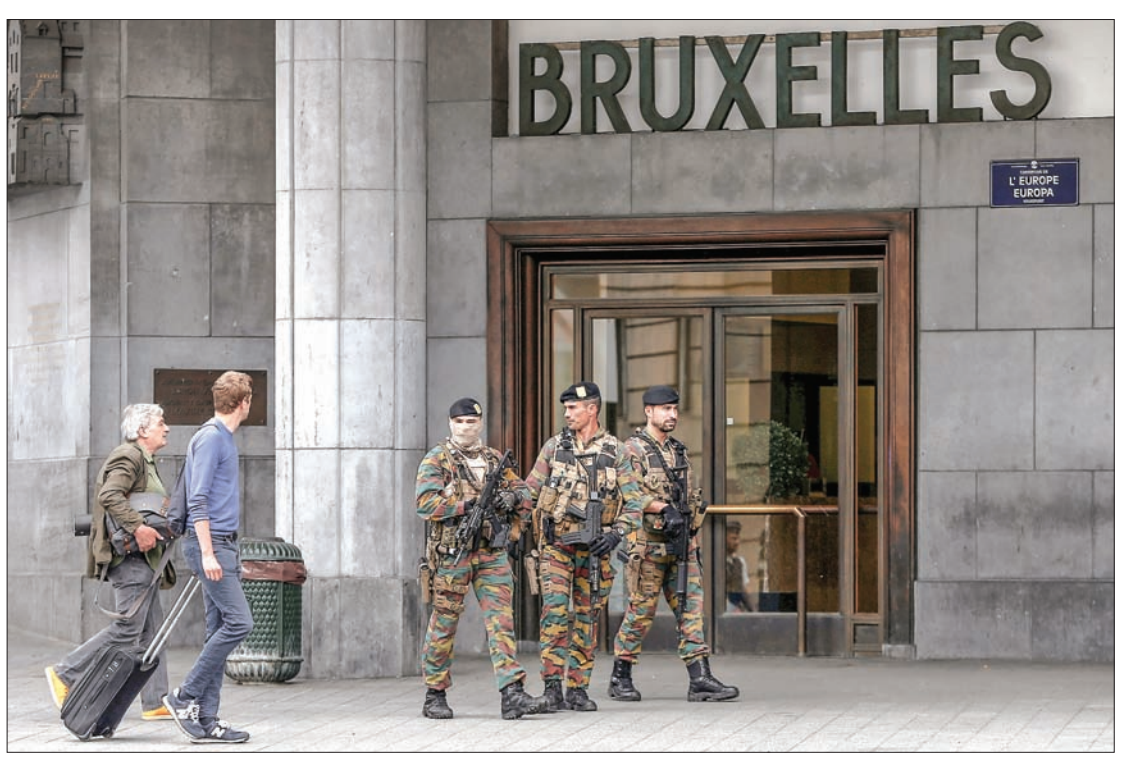
Belgian soldiers patrol outside the central train station where a suspect package was found, in Brussels, Belgium, on 19 June, 2016.