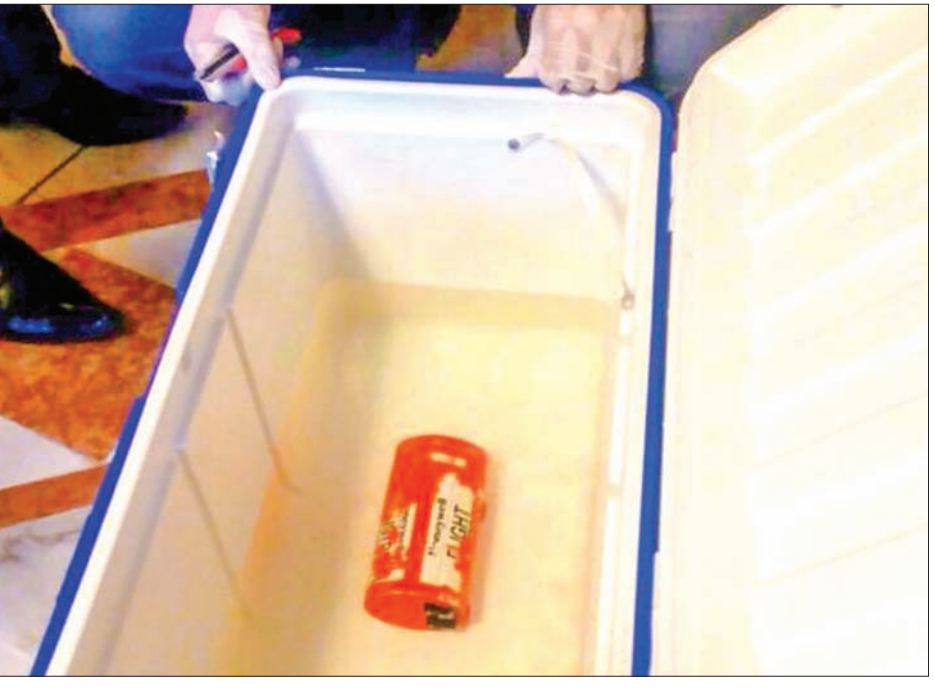
A flight recorder retrieved from the crashed EgyptAir flight MS804 is seen in this undated picture issued on 17 June, 2016.

There has been a series of airplane accidents at high altitude blamed on a cocktail of technical and pilot flaws.