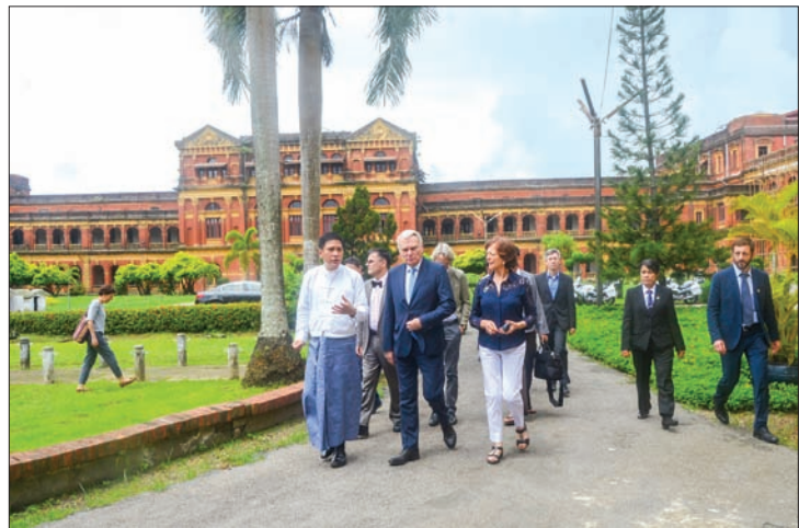
Minister for Foreign Affairs and International Development Mr Jean-Marc Ayrault visits the Old Secretariat in Yangon.

Secretariat on Theinbyu Road, where they observed the stone plaque erected to the fallen heroes and the room in which General Aung San and his cabinet members were assassinated. The French delegation also visited the Armenian Apostolic Church, buildings with blue plaques installed by the Yangon Heritage Trust, the office of the Yangon Heritage Trust and Shwedagon pagoda. The French delegation left Yangon last night.— Myanmar News Agency