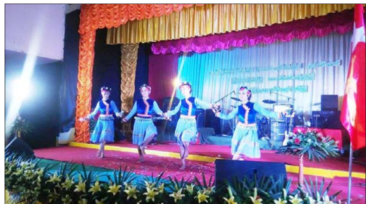
Ethnic dancers perform at a ceremony to support the 21st Century Panglong Peace Conference.

The 88' Generation Peace and Open Society showed support for the Daw Aung San Suu Kyi-led peace conference, saying that the assembly would further cement the existing bonds among ethnic groups and pave the way for national prosperity.— Aung Thant Khaing