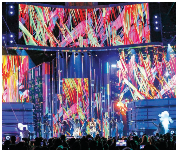
Justin Bieber (C) performs a medley of songs at the 2016 Billboard Awards in Las Vegas, Nevada, US, on 22 May 2016.

LOS ANGELES — Pop star Justin Bieber fell through a hole in the stage during a concert in Saskatoon, Canada.