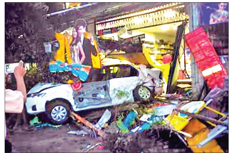
The car being seen damaged after the crash.

A BUS crash in Yangon’s Tamwe township on Saturday evening has seriously injured two people as police search for the driver who fled the scene.