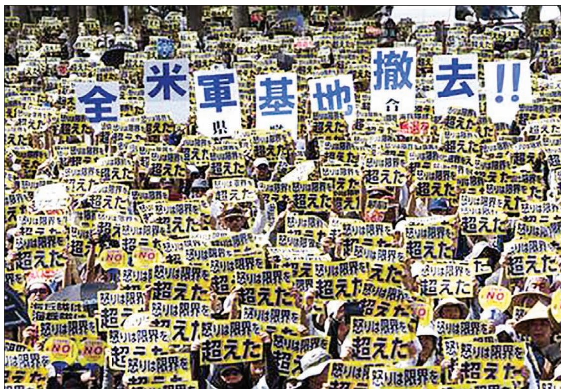
Thousands of residents carry signs saying “Marines, Withdraw” (centre) and “Our anger has reached the limit,” as they rally in Naha in Japan’s southernmost island prefecture of Okinawa on 19 June 2016.