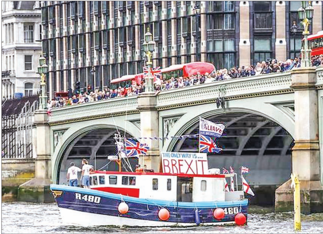
Part of a flotilla of fishing vessels campaigning to leave the European Union sails under Westminster Bridge towards Parliament on the river Thames in London, Britain on 15 June 2016.