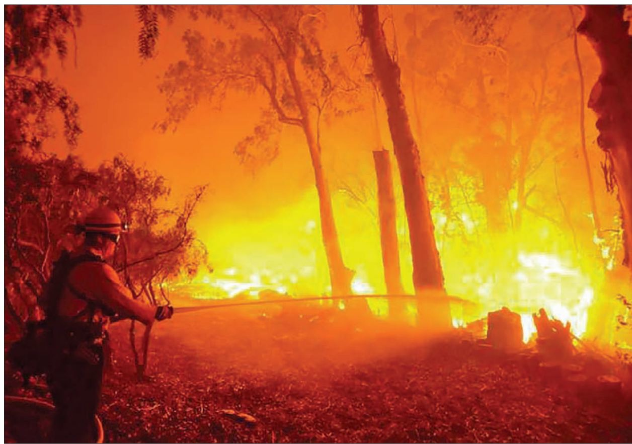
A firefighter battles flames from the Sherpa Fire in Santa Barbara, California, on 16 June 2016.

“Now is the time to gather your family mem-