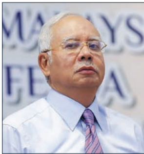
Malaysia's Prime Minister Najib Razak attends an event in Kuala Lumpur, Malaysia, on 14 March 2016.

Najib's party won the Sungai Besar and Kuala Kangsar parliamentary seats on Saturday with increased margins compared with those in 2013 general elections, the election commission said. Both ar-