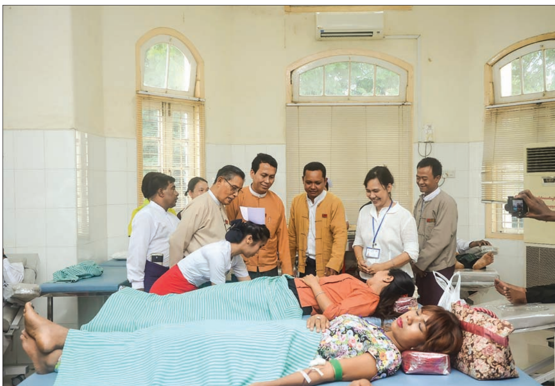
Patron of NLD U Tin Oo and Yangon Region Chief Minister U Phyo Min Thein visit National Blood Centre where people donate blood to celebrate the 71st Anniversary Birthday of Daw Aung San Suu Kyi.

MEMBERS of the ruling National League for Democracy (NLD) and supporters celebrated State Counsellor Daw Aung San Suu