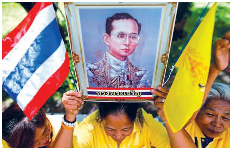
Well-wishers hold a picture of Thailand's King Bhumibol Adulyadej at the Siriraj hospital where he is residing, in Bangkok, Thailand, on 9 June 2016.

BANGKOK — Thailand's 88-year-old King Bhumibol Adulyadej, the world's longest reigning monarch, has shown signs of improvement following treatment for "water on the brain", the Royal Household Bureau said in a statement