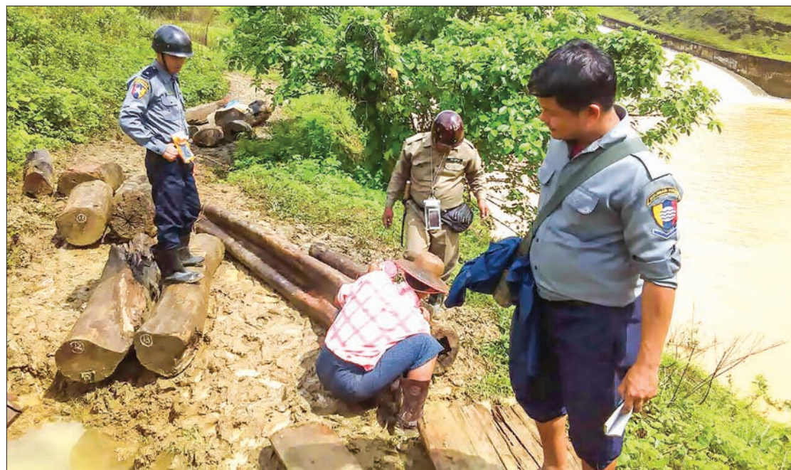
Illegally harvested teak seized in Kyankhin.

OWNERLESS teak with an estimated worth of Ks250,000 (US$211) was found by local police in Kyankhin Township in Ayeyawady Region on Saturday.