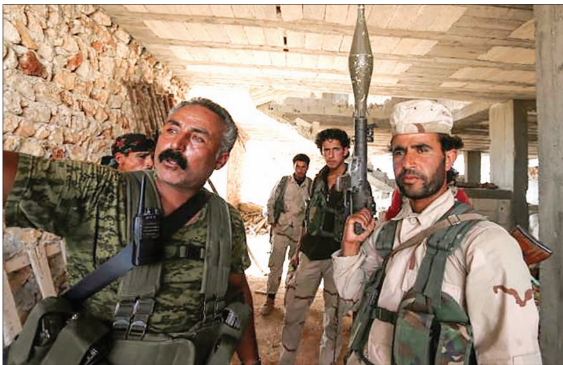
Fighters of the Syria Democratic Forces (SDF) stand inside a building near Manbij, in Aleppo Governorate, Syria, on 17 June 2016.

Russia, which has been bombing opposition-held areas, is blamed by the opposition and rights activists for causing hundreds of civilian deaths and targeting hospitals, schools and