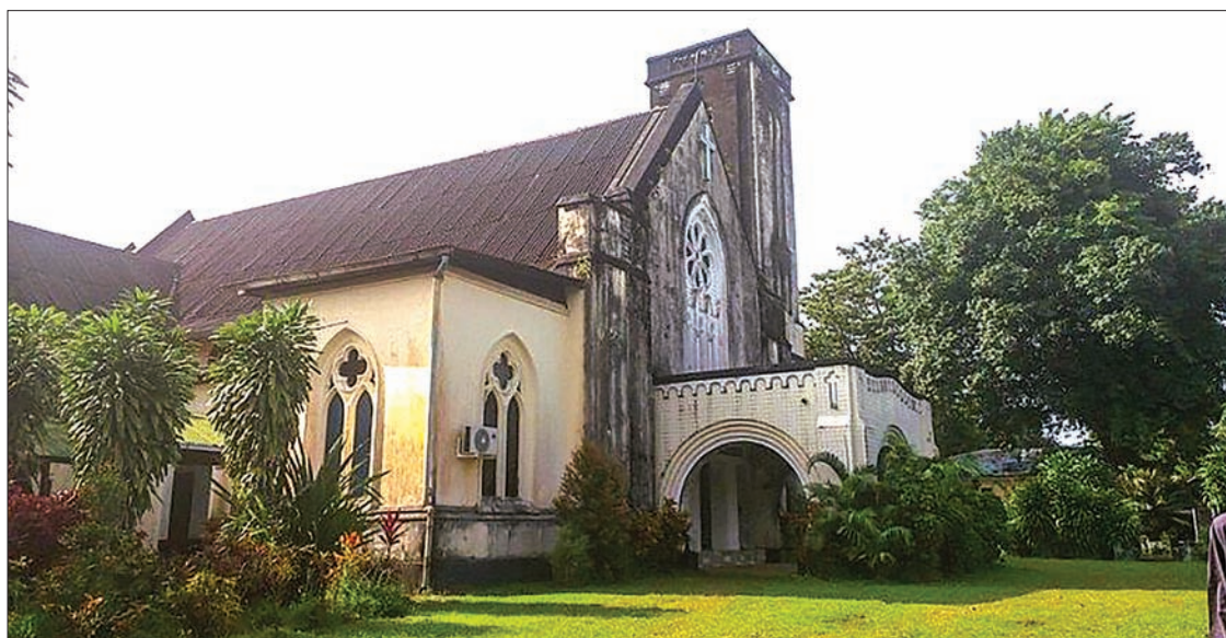
Judson's First Baptist Church in Mawlamyine.

AFTER conducting an early preliminary study on the World Heritage Site listed 188 year-old First Baptist Church, located in the Mon State capital of Mawlamyine, a proposal for building restoration will be submitted to the American Embassy to Myanmar this coming December, it is reported.