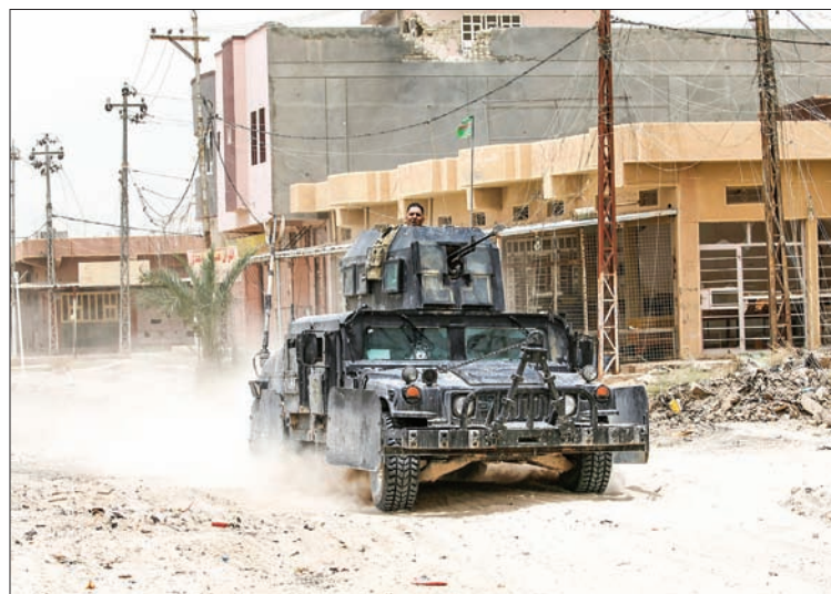
An Iraqi security forces vehicle is seen on a street in the centre of Falluja, Iraq, on 18 June 2016.