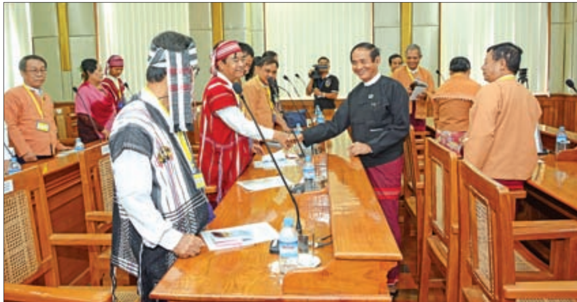
Speaker U Win Myint greeting lawmakers in Kayin State.

MEMBERS of parliament are to meet voters in their respective constituencies and brief them on what has been done while the parliament is in recess, Pyithu Hluttaw Speaker U Win Myint told representatives in Kayin State yesterday.