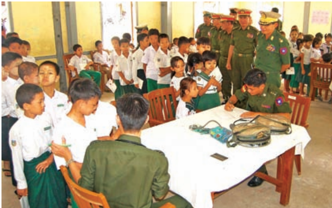
Army doctors being seen providing healthcare to students in Mandalay Region.

ARMY medical specialists provided physical examinations and treatment for 1,150 students from BEHS 18, Mandalay who reported having trouble with their eyes, ears, noses and throats. The military medical