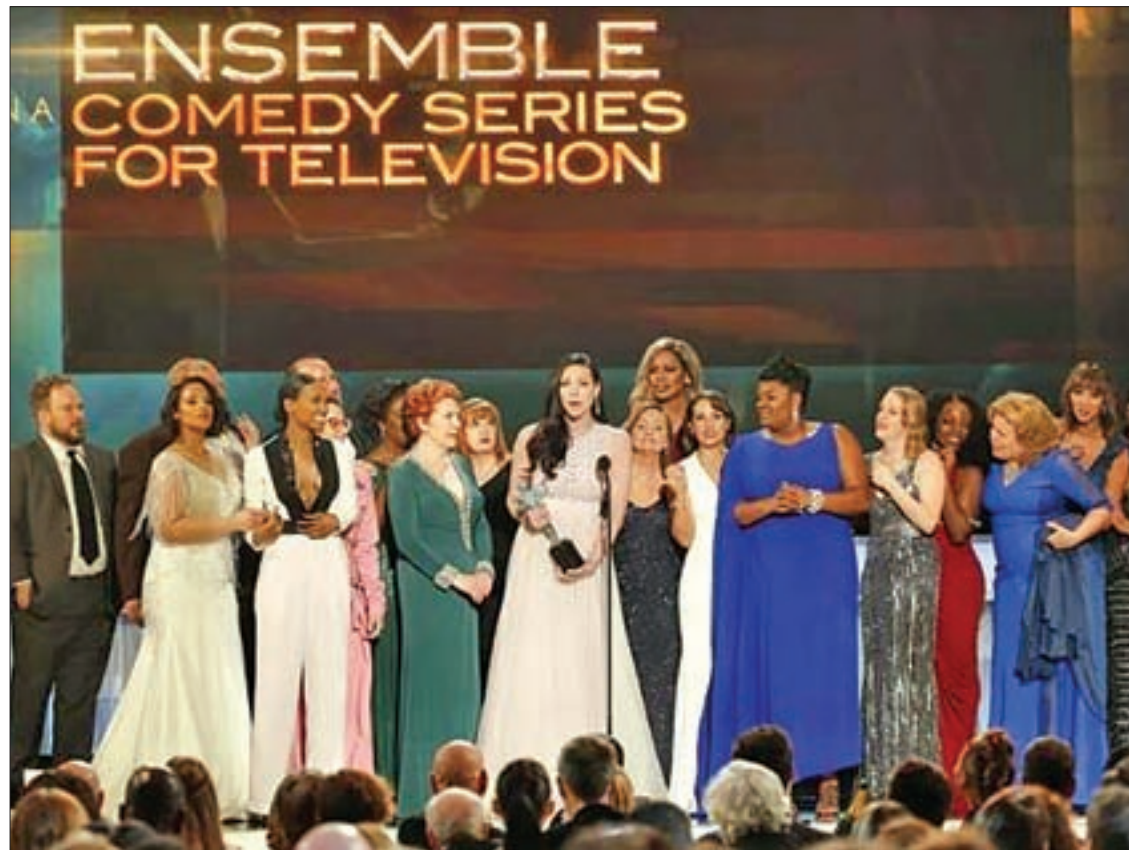
Actress Laura Prepon (C) accepts the award for Outstanding Performance by an Ensemble in a Comedy Series for “Orange is the New Black” at the 22nd Screen Actors Guild Awards in Los Angeles, California, in January 2016.

NEW YORK — A new season of the hugely popular women’s prison comedy “Orange is the New Black” launched on Friday on Netflix with cast members saying the show would dig deeper into issues of racism and the privatisation of prisons.