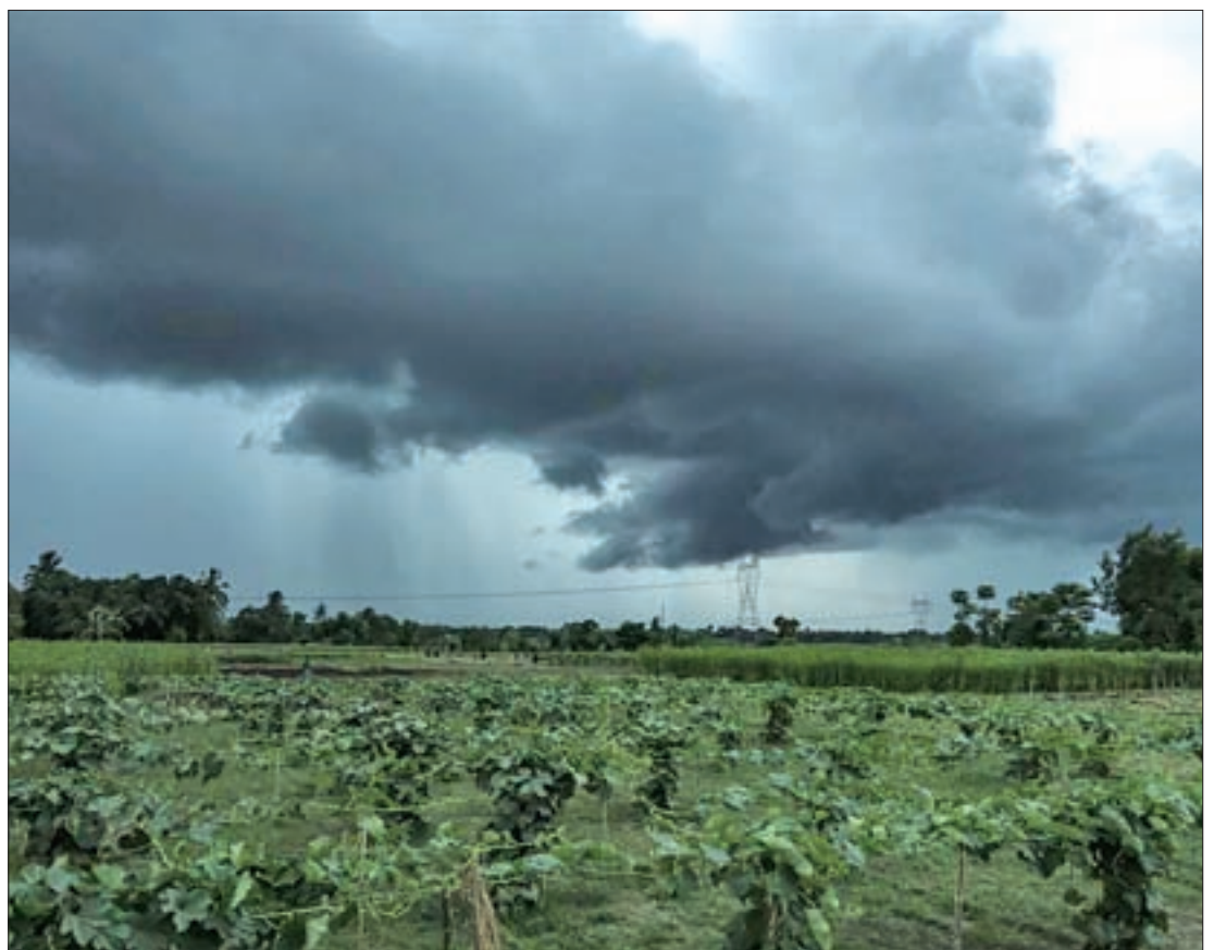
Monsoon clouds hover in the sky on the outskirts of Kolkata, capital of eastern Indian state West Bengal, on 17 June, 2016.

Takeshi Komatsu, a veterinarian with the municipal government of Kitaakita in Akita, said earlier that because the attacks appear to have occurred in a limited area over a short period of time, all four people were likely killed by the same bear. — Kyodo News