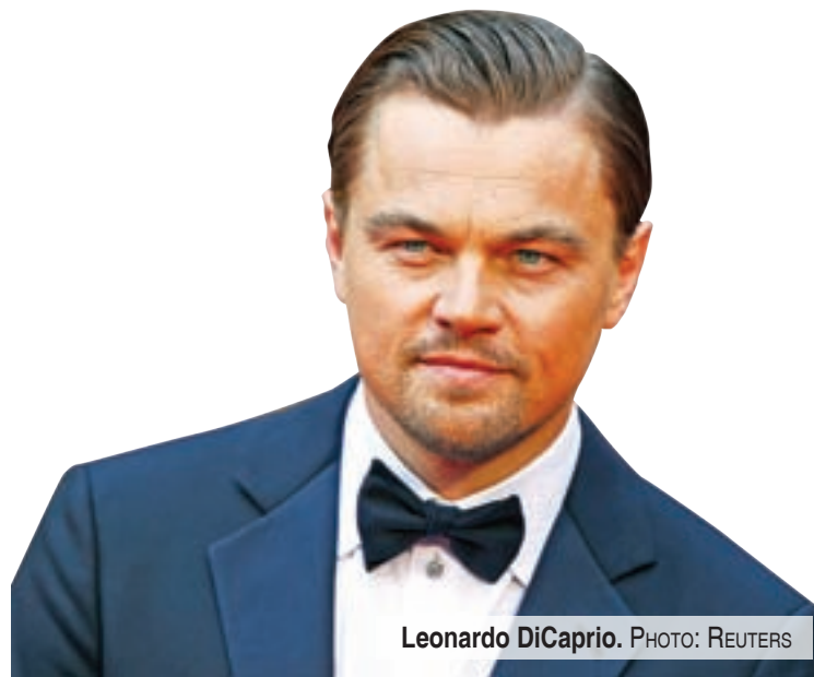
Leonardo DiCaprio.