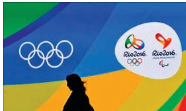
A journalist walks in front of a screen with olympics logos during the medal launching ceremony in Rio de Janeiro, Brazil, on 14 June 2016.

Brazil is also facing an outbreak of the Zika virus, which has been linked to the birth defect microcephaly in which babies are born with abnormally small heads frequently associated with developmental issues.—Reuters