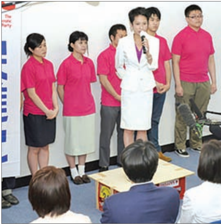
Democratic Party lawmaker Renho speaks in a ceremony marking the opening of her election office in Tokyo on 18 June 2016, ahead of the 10 July upper house election. The acting president of the main opposition party ruled out running in the 31 July Tokyo gubernatorial election to succeed scandal-hit Gov. Yoichi Masuzoe, saying, "There still are tasks I want to take on in national politics."

TOKYO — Democratic Party lawmaker Renho ruled out on Saturday running in the 31 July Tokyo gubernatorial election to succeed scandal-hit Gov. Yoichi Masuzoe.