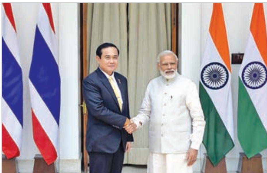
Indian Prime Minister Narendra Modi shakes hands with his Thai counterpart Prayut Chan-o-cha before their meeting at Hyderabad House in New Delhi, capital of India, on 17 June 2016. PHOTO: XINHUA

The two leaders also agreed to cooperate in tourism, cyberspace security and connectivity with neighbours like Myanmar.— Xinhua