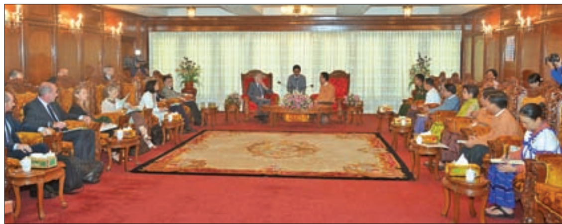
Yangon Region Chief minister U Phyo Min Thein holds talks with French Minister for Foreign Affairs and International Development Mr Jean-Marc Ayrault.

YANGON Region Chief Minister U Phyo Min Thein met French Minister for Foreign Affairs and International Development Mr Jean-Marc Ayrault in his office yesterday morning to discuss prospects of French in-