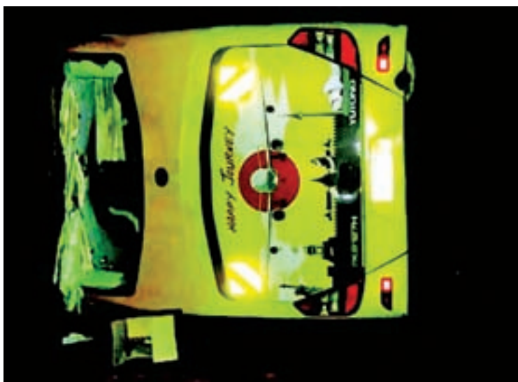
A bus from Aung Yadana Bus Line being seen overturned.