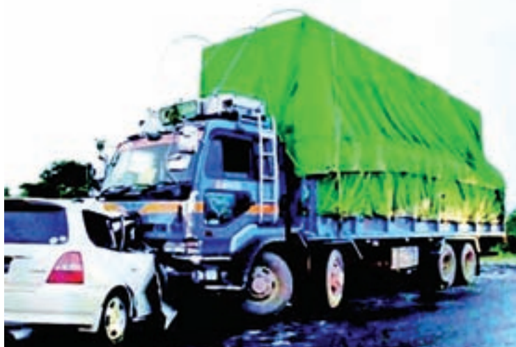
Head-on collision being seen.

The collision killed the Sayardaw at the scene of the accident. The monk was found to be guilty of careless driving said local police.— Ko Lwin (Swa)