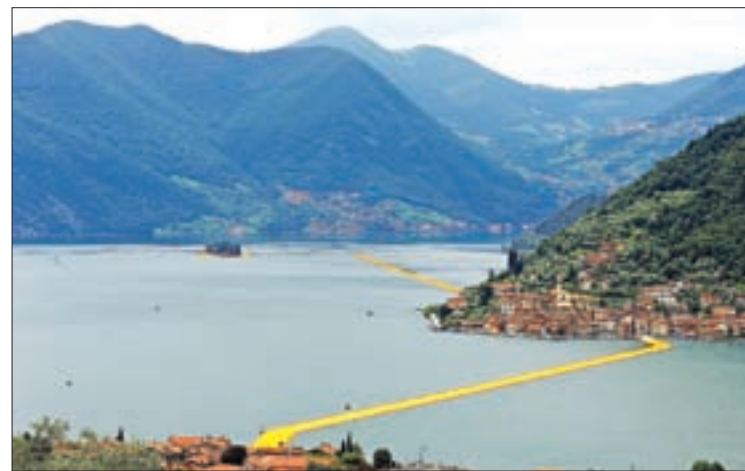
A general view of the installation 'The Floating Piers' by Bulgarian-born artist Christo Vladimirov Yavachev known as Christo, on the Lake Iseo, northern Italy, on 16 June, 2016.

They will be on display June 18-3 July, which the 81-year old artist said is all part of its beauty.