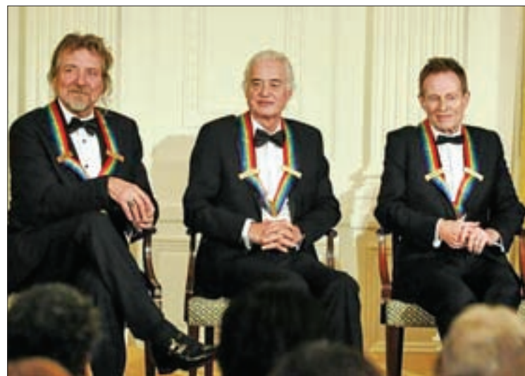
Led Zeppelin band mates (L-R) Robert Plant, Jimmy Page and John Paul Jones sit as US President Barack Obama (not pictured) hosts an event for the 2012 Kennedy Centre honorees in the East Room of the White House in Washington, in 2012.