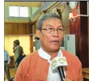
Rakhine State Chief Minister U Nyi Pu.