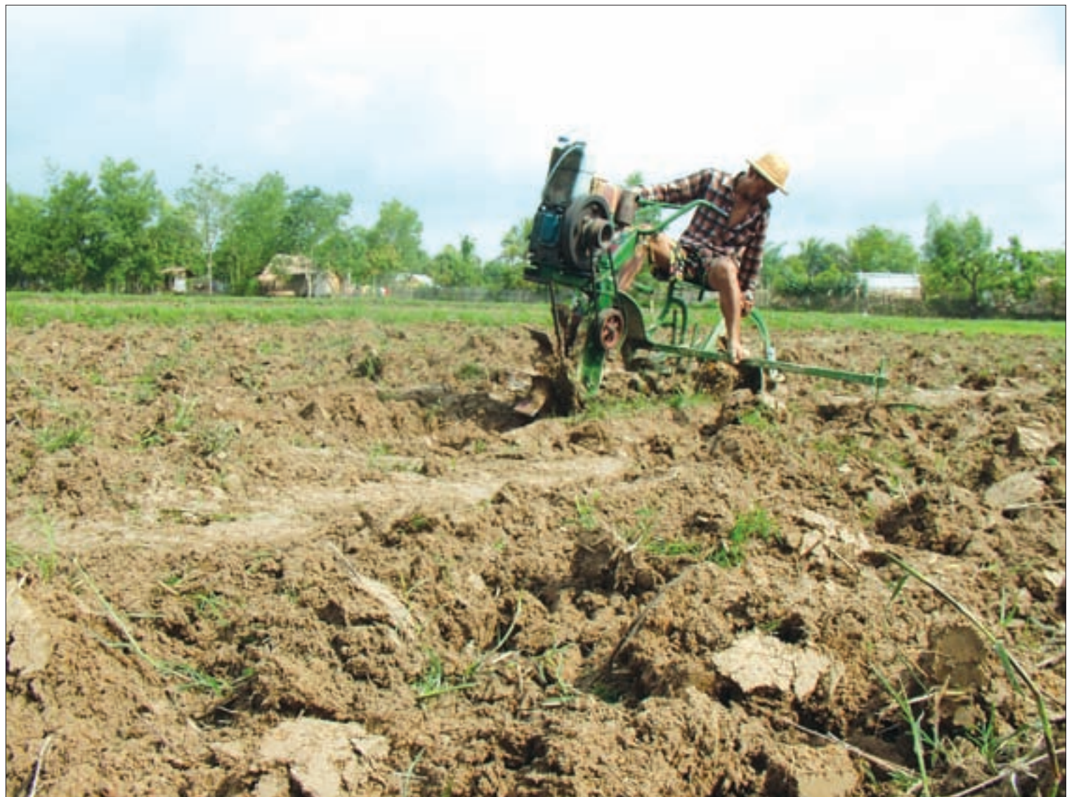
A farmer drives a tractor, ploughing land to grow rice.

According to the vice president, private companies and gov-