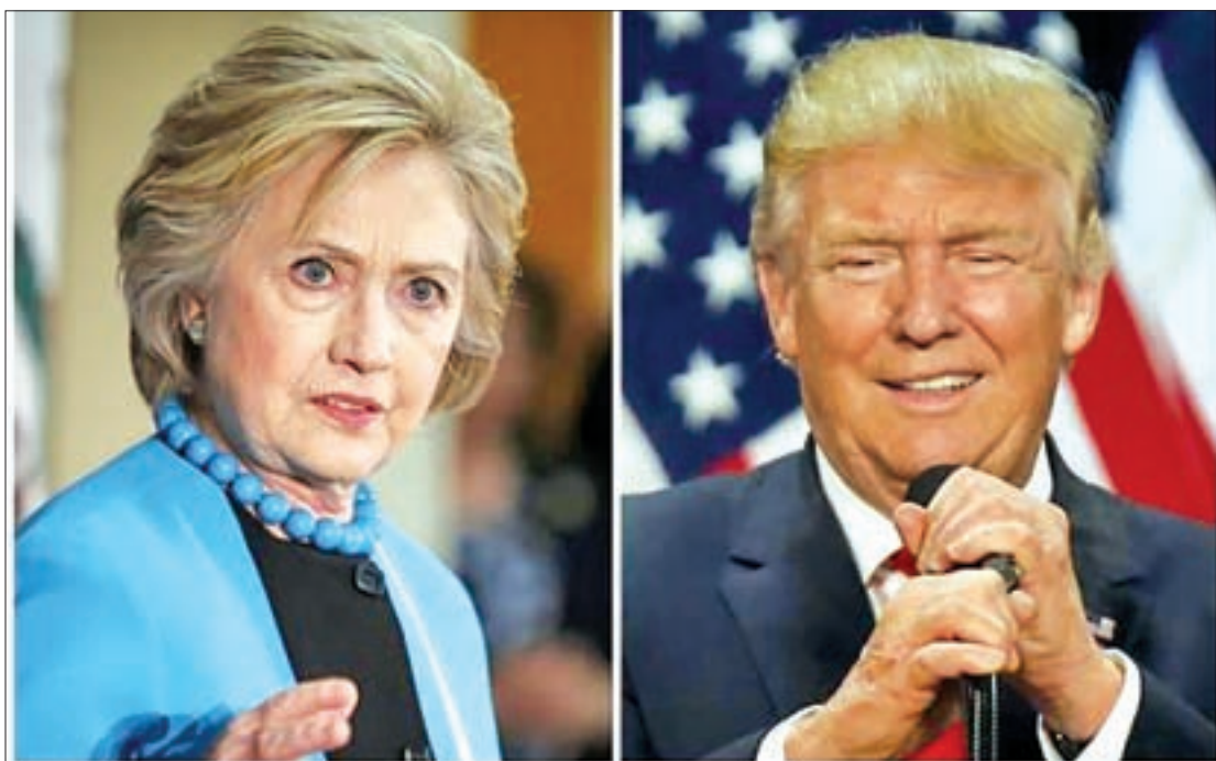
A combination photo shows US Democratic presidential candidate Hillary Clinton and Republican US presidential candidate Donald Trump in Los Angeles, California, on 5 May 2016 and in Eugene, Oregon, US, on 6 May 2016 respectively.

NEW YORK — Donald Trump chipped away at Hillary Clinton's lead in the presidential race this week, according to a Reuters/Ipsos poll released on Friday, as the candidates clashed over how to respond to the worst mass shooting in modern US history.