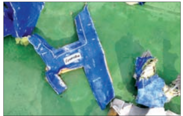
Recovered debris of the EgyptAir jet that crashed in the Mediterranean Sea is seen in this handout image released on 21 May 2016 by Egypt's military.

There has been a series of airplane accidents at