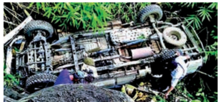
Vigo being seen upside down.