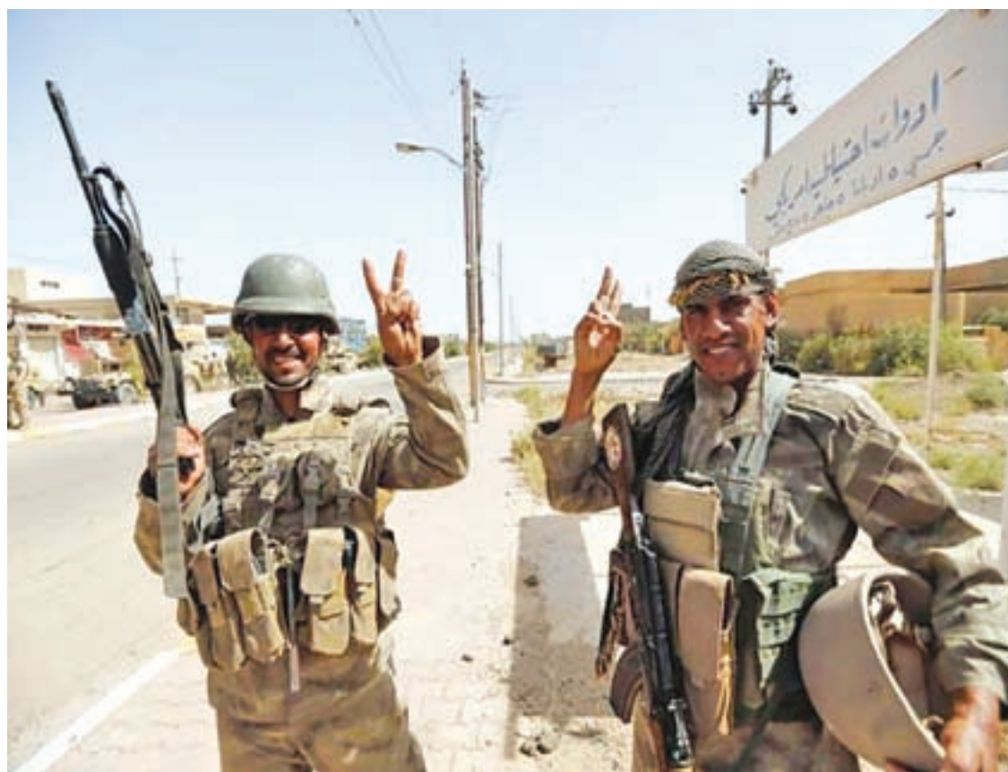
Iraqi soldiers gesture in centre of Falluja, Iraq, on 17 June 2016.

The participation of Iranian-backed Shi'ite militias in the battle alongside the Iraqi army raised fears of sectarian killings, and authorities are already inves-