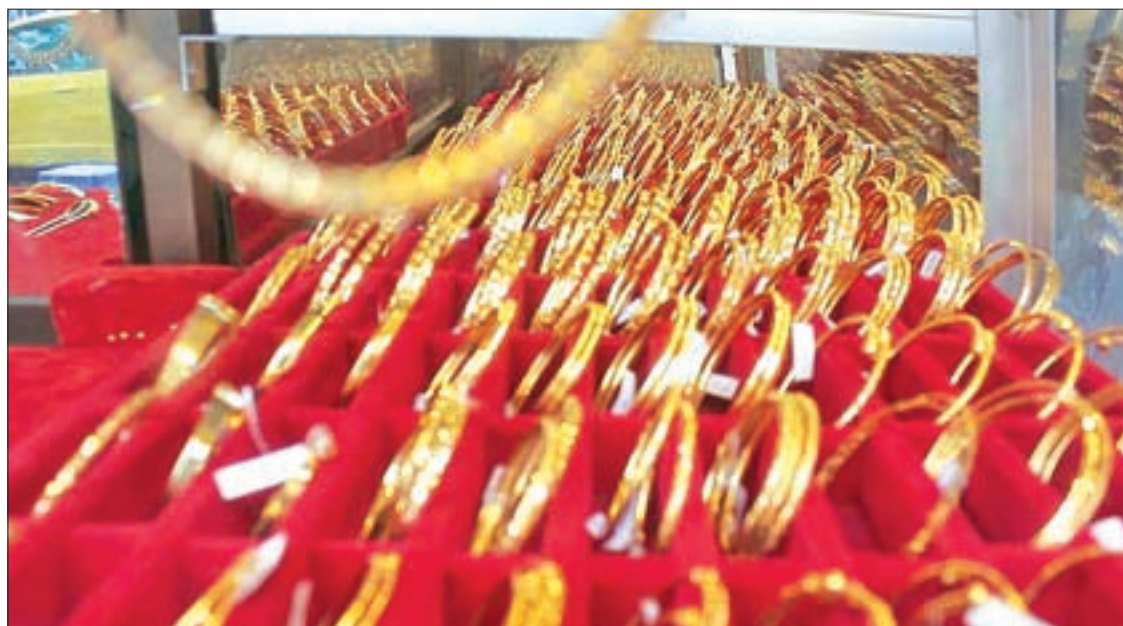
Golden jewellery are displayed at a shop in Yangon.

In regard to the position of the markets in the afternoon of 16 June 2016, a tical of Myanmar gold valued at K812,000; a tical of 15 carat gold fetched K760,000; an ounce of gold on the world market priced US$1,309 while the MMK — USD exchange rate valued approximately K1,190 to US$1. —Myitmakha News Agency