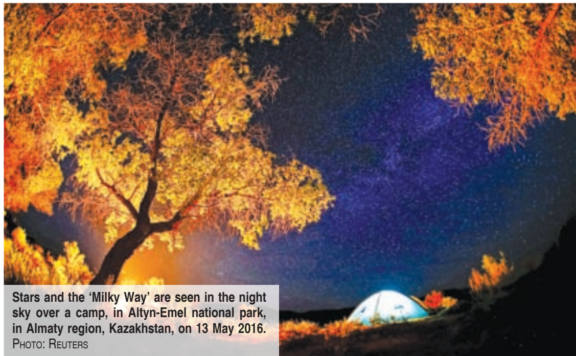
Stars and the 'Milky Way' are seen in the night sky over a camp, in Altyn-Emel national park, in Almaty region, Kazakhstan, on 13 May 2016.

ALMATY — Rising incongruously above the steppes of southeastern Kazakhstan is a structure as famed for the myths that surround as for the sound it produces — a single, singing dune.