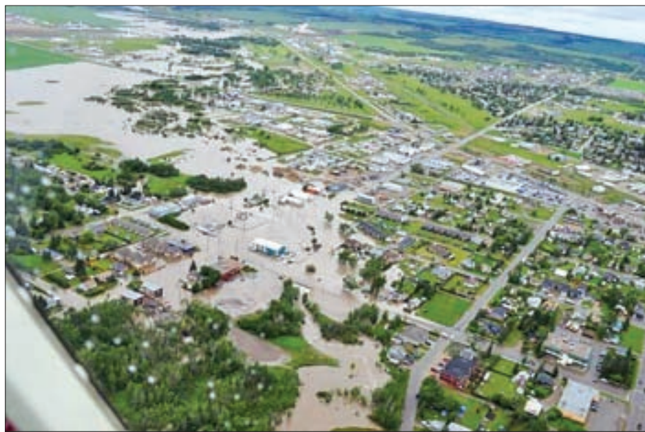
An aerial photo shows flooding in the City of Dawson Creek after heavy rain in this image posted on social media in British Columbia, Canada, on 16 June 2016.

Both communities are south of Fort St. John, the hub city for British Columbia's energy industry. Pembina Pipeline shut its crude-carrying Western Pipeline on Thursday, after rain and erosion exposed a portion of the line.