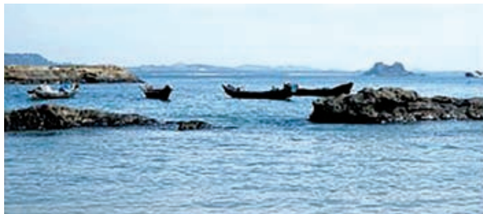
Rakhine Coast being seen recently.

A MARINE study along the Rakhine Coast is planned by Flora and Fauna International, the non-governmental organisation, to establish a marine conservation area managed by local people.