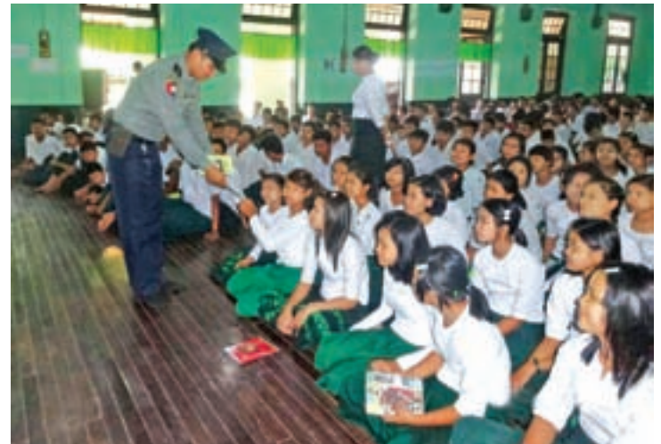
An anti- human trafficking awareness session in progress.

ik university, Kawthaung town, Chanmyathasi township, Mandalay region, Wine Maw township, Kachin state, Momauk town and Kengtung town, Shan state. All of those courses were conducted on Tuesday. The training courses and educative talks involve the definition of trafficking in person, migrant workers' problems and the relationship between human trafficking and migration, types of trafficking in persons and the ways in which traffickers operate.— Ye Zarni