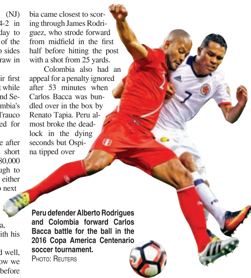
Peru defender Alberto Rodriguez and Colombia forward Carlos Bacca battle for the ball in the 2016 Copa America Centenario soccer tournament.