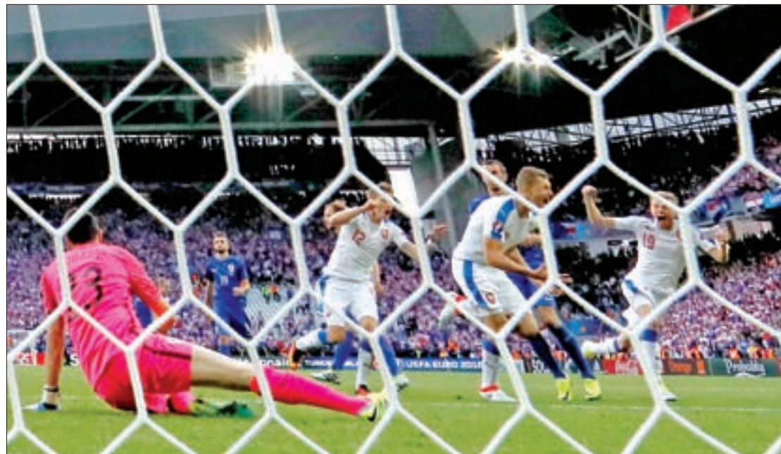
Czech Republic's Tomas Necid celebrates after scoring a penalty goal during EURO 2016 at Stade Geofroy-Guichard in Saint-Etienne, France, on 17 June 2016.

The Croats, on four points from two matches, have themselves and their fans to blame after a largely one-sided encounter,