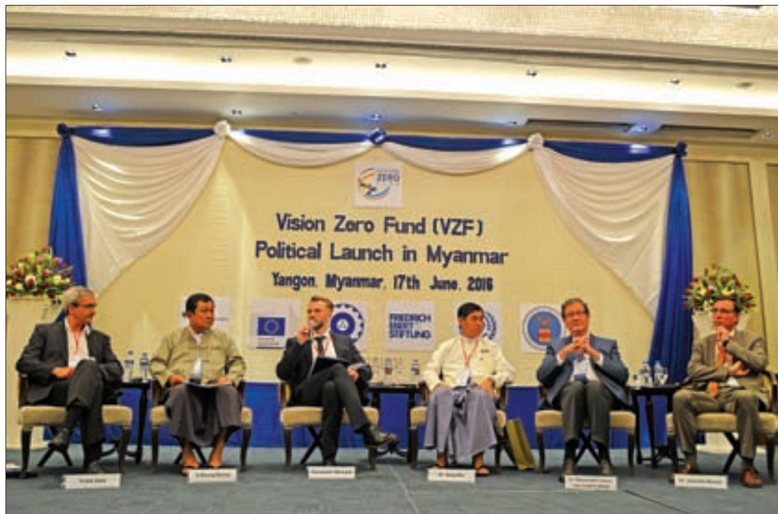
Local and foreign representatives from labour sector participate in dialogue of Vision Zero Fund.