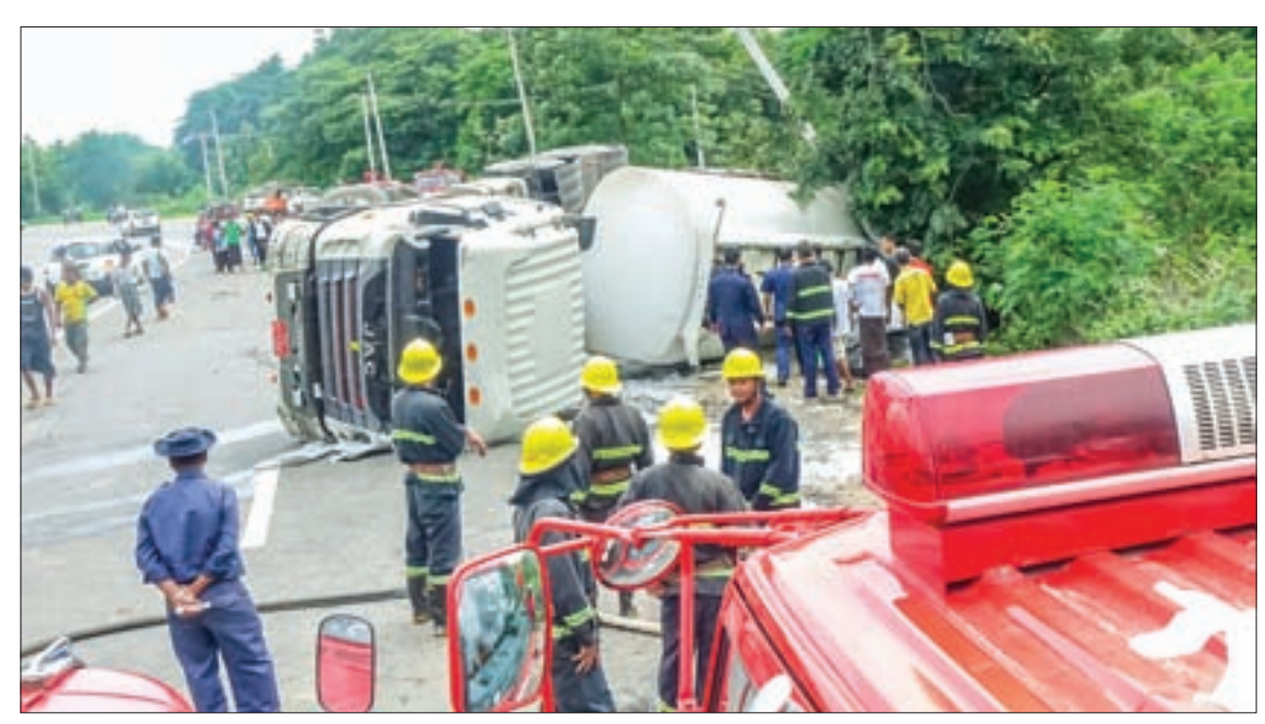
The fuel tanker being seen after turning over in Nay Pyi Taw.

Traffic police said that the driver was taken to the hospital.-Thein Ko Lwin