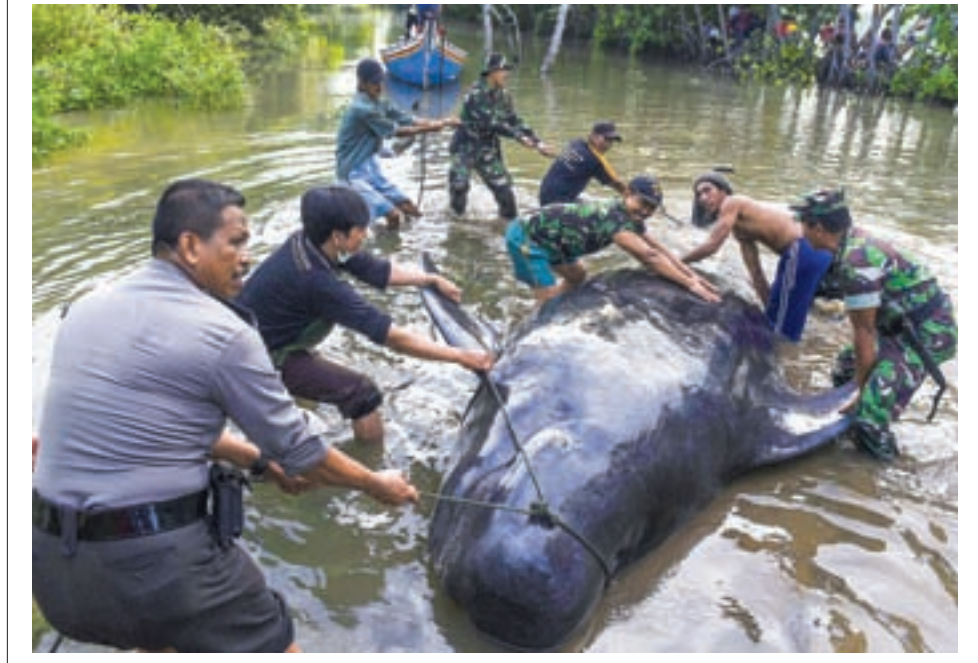
Indonesian soldiers, policemen and residents work to remove a dead whale stranded on the coast of Pesisir beach in Probolinggo, Indonesia, on 16 June 2016.

JAKARTA — Indonesian fisheries officials said. rescuers worked on Thursday to save a pod of the east of Java island were beached whales that got trapped in a mangrove swamp at low