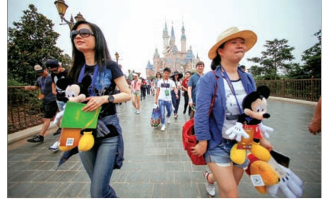
People walk at Shanghai Disney Resort during a three-day Grand Opening event in Shanghai, China, on 15 June 2016.

The opening gala — meant to be a bonanza of fireworks, live music and dance — was rained off on Wednesday night, while at Disney's park in Or-