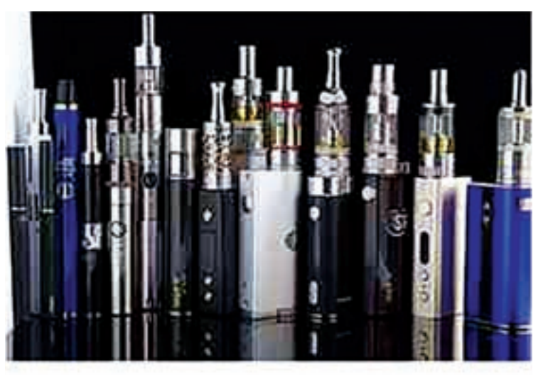
Various types of e-cigarettes.

I first got into the habit of smoking at an early age of sixteen. It was in my first year at the university when I was introduced to this bad habit. When I saw the