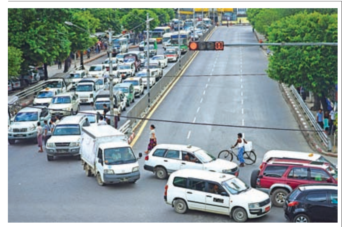
Despite price hike, cars are still being imported increasingly.