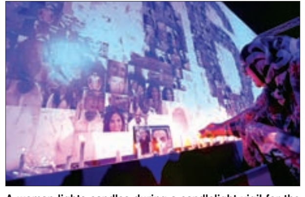
A woman lights candles during a candlelight vigil for the victims of EgyptAir flight 804 inside Cairo Opera house, Egypt, on 26 May.

It was not immediately known which parts of