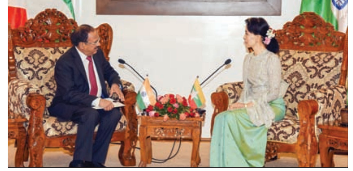
Union Minister for Foreign Affairs Daw Aung San Suu Kyi holds talks Mr. Ajit Doval.

Also present at the call were Minister of State for Foreign Affairs U Kyaw Tin and officials. - Myanmar News Agency