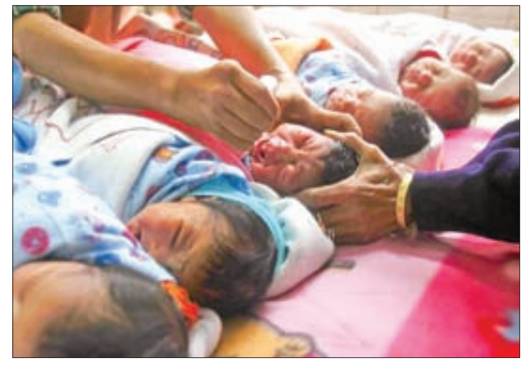
A medical worker administers polio drops to an infant at a hospital during the pulse polio immunization programme in Agartala, capital city of India's northeastern state of Tripura, in January 2015.

The statement said a recent survey of the area found 94 per cent of children had received at least three doses of the oral polio vaccine and therefore transmission was unlikely. However "as a precautionary measure" a special immunization drive would be held from 20 June in the high-risk districts of Hyderabad and Rangareddy, targeting around 300,000 children between the ages of six weeks and three years, it said.— Reuters