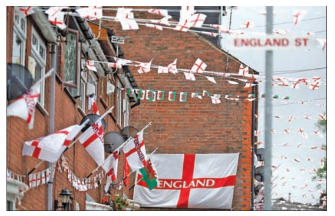
A solitary Welsh national flag flies amongst England national flags on Wales Street in Oldham, northern England , on 13 June, 2016.

England would be hit hardest by a vote for Brexit, the campaign to keep Britain in the European Union will say on Thursday, as it steps up its push to win over opposition Labour supporters seen as key to securing an 'In' vote.