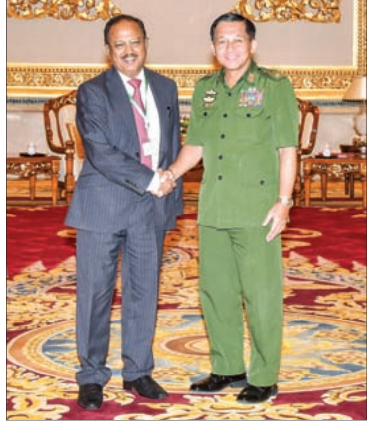
Senior General Min Aung Hlaing receiving a courtesy call by Special Envoy of Indian Prime Minister and National Security Advisor Mr Ajit Doval in Nay Pyi Taw.

Also present at the meeting were senior military officers of the Commander-in-Chief (Army)'s Office and diplomats and military attaché from the Indian embassy in Yangon.