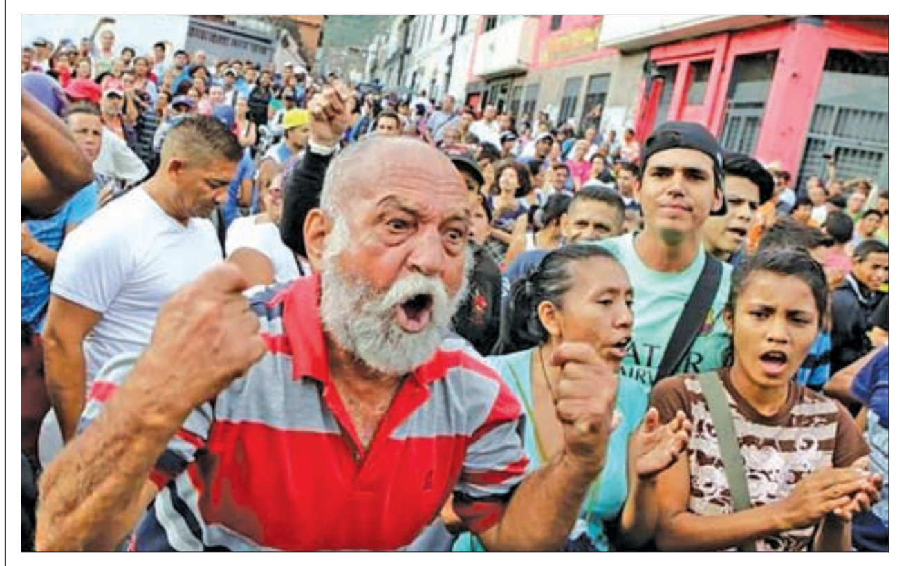
A man shouts during a protest over food shortage and against Venezuela's government in Caracas, Venezuela, on 14 June.