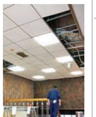
Photo shows damage to the ceiling of a fishery cooperative office in Hakodate on Japan's northernmost main island of Hokkaido on 16 June, 2016.

Power Co. and Hokkaido Electric Power Co. said no abnormalities were found with the Higashidori nuclear power plant in Aomori Prefecture, and Nos. 1 to 3 reactor units of the Tomari nuclear power plant in Hokkaido, respec-