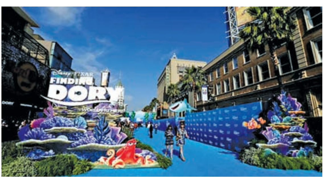
A general view at the premiere of "Finding Dory" at El Capitan theater. Photo: REUTERS

"To make the case for how this will increase opportunities for women, we needed an advocate who had the intellect and passion to tackle this complex issue. Within moments of meeting Anne, I realised that we had found ur wom-an," she our said.— Reuters