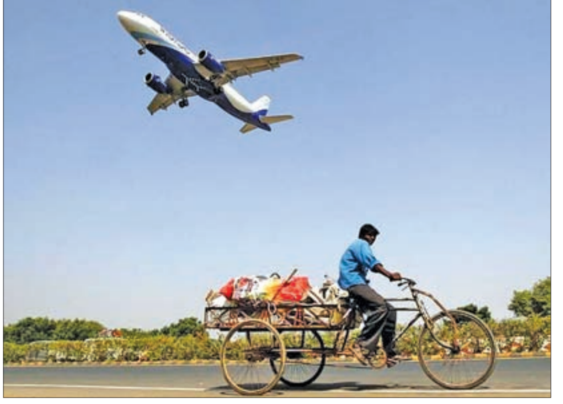
An IndiGo Airlines aircraft prepares to land as a man paddles his cycle rickshaw in Ahmedabad, India, in 2015.

Passenger numbers on domestic flights jumped 21 per cent in 2015 to more than 80 million. The government aims to increase that number to 300 million by 2022. International travel is grow-