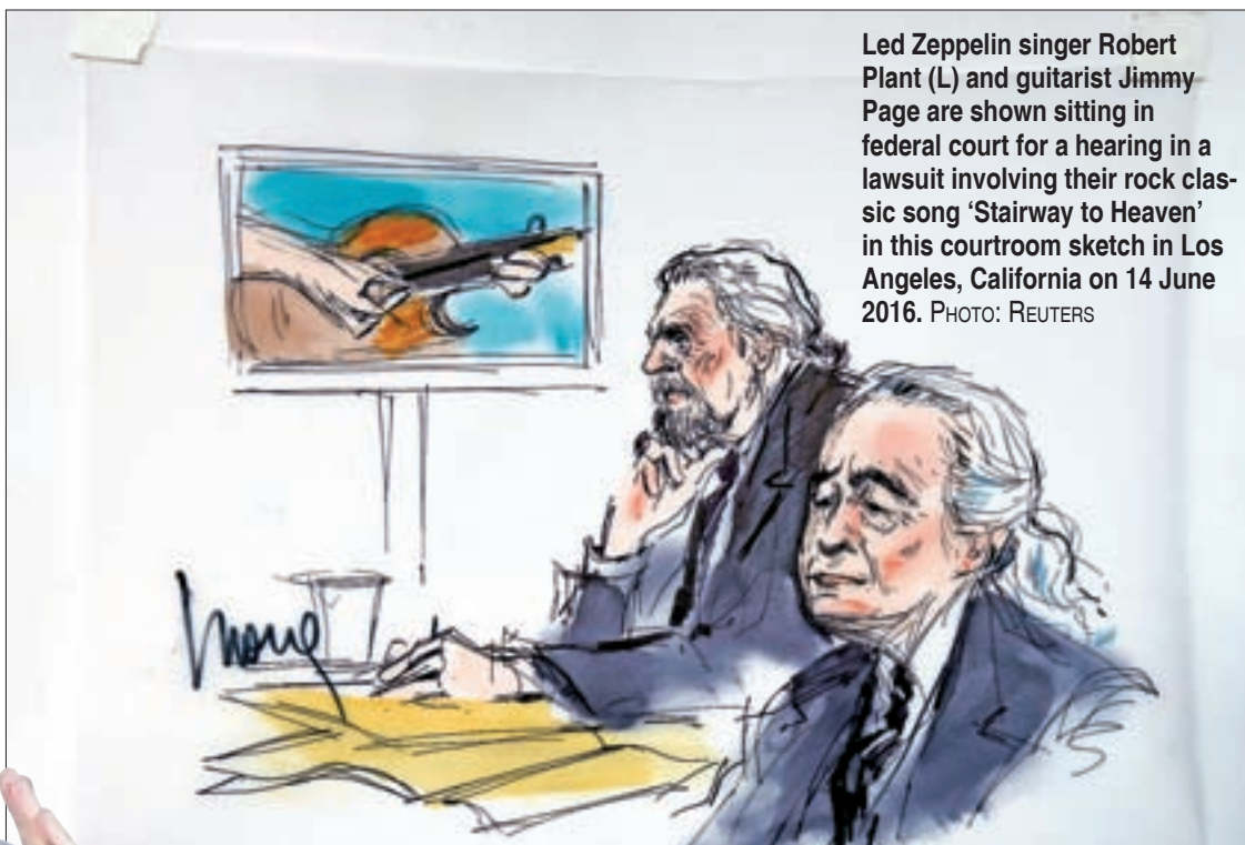
Led Zeppelin singer Robert Plant (L) and guitarist Jimmy Page are shown sitting in a lawsuit involving their rock classic song 'Stairway to Heaven' in this courtroom sketch in Los Angeles, California on 14 June 2016.