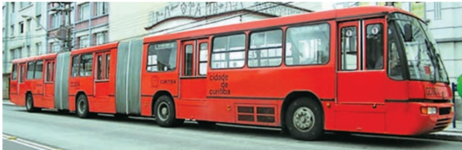
Triple coach extended bus.

In our country public buses in the big cities particularly in Yangon and Mandalay are in services for many years. But the commuters or customers of the public buses are not satisfied and even frustrated for many problems concerning the public bus