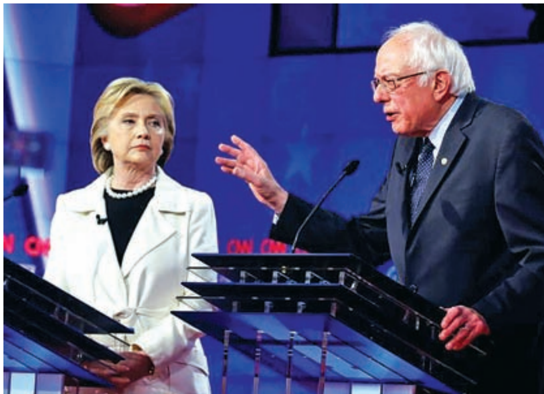
Democratic US presidential candidate Hillary Clinton (L) listens to Senator Bernie Sanders speak during a Democratic debate hosted by CNN and New York One at the Brooklyn Navy Yard in New York on 14 April, 2016.

WASHINGTON — Hillary Clinton formally concluded the US Democratic presidential race on Tuesday with a win in the District of Columbia primary, then turned her focus to uniting the party during a 90-minute private meeting with defeated rival Bernie Sanders.