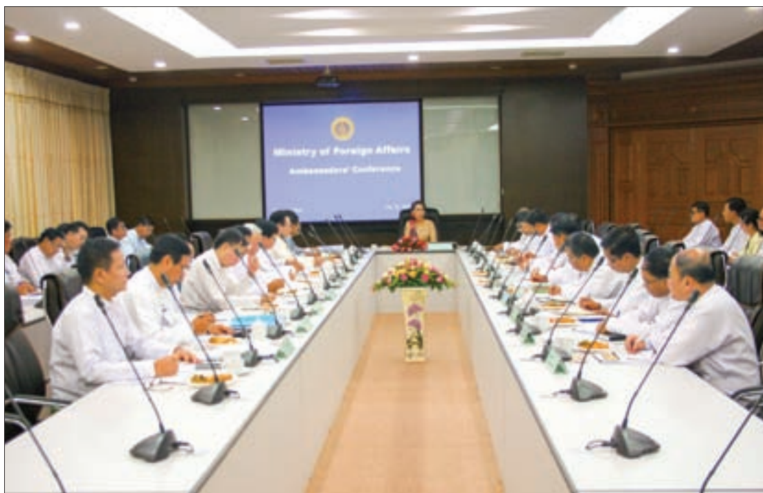
Union Minister for Foreign Affairs Daw Aung San Suu Kyi speaks to ambassadors.

The two representatives also discussed further cooperation in the sectors of natural resources and environmental conservation, mining, cultural heritage preservation and electric power in addition to the responsibilities and accountability of media in building democracy. Also present at the meeting were Union Ministers U Kyaw Tint Swe, Dr Pe Myint, Thura U Aung Ko, U Ohn Win and U Kyaw Win, the Mongolian Ambassador to Myanmar, delegation members and officials.—Myanmar News Agency