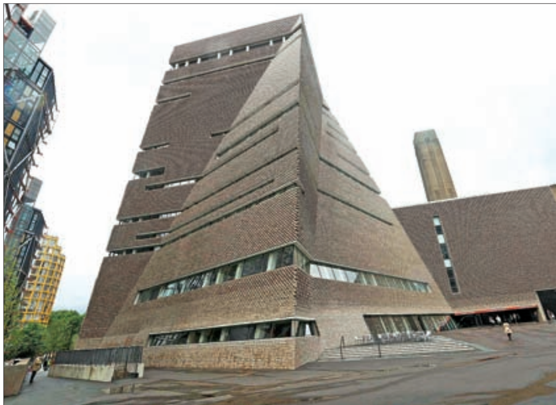
A man stands outside the Switch House during the unveiling of the New Tate Modern in London.