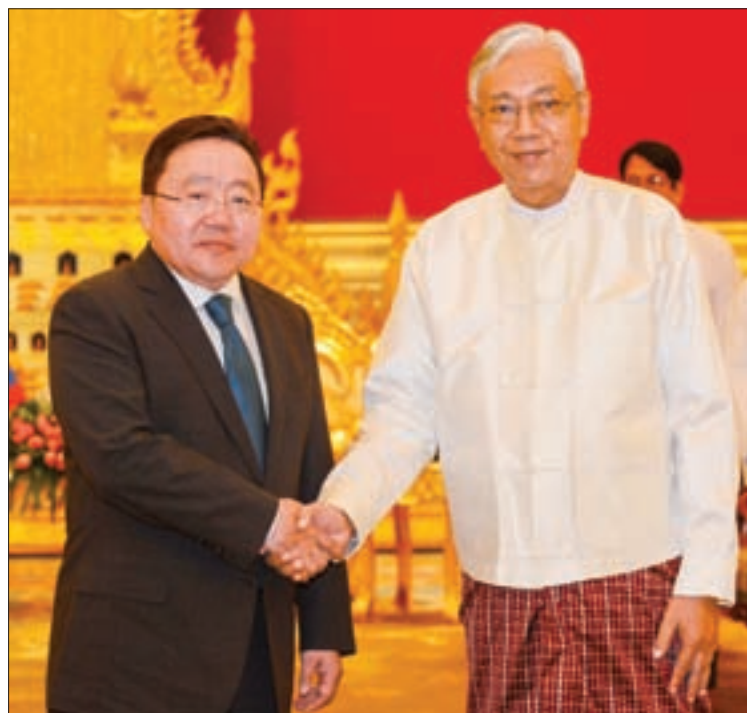
President U Htin Kyaw welcomes Mongolian President Mr. Tsakhiagiin Elbegdorj in Nay Pyi Taw.