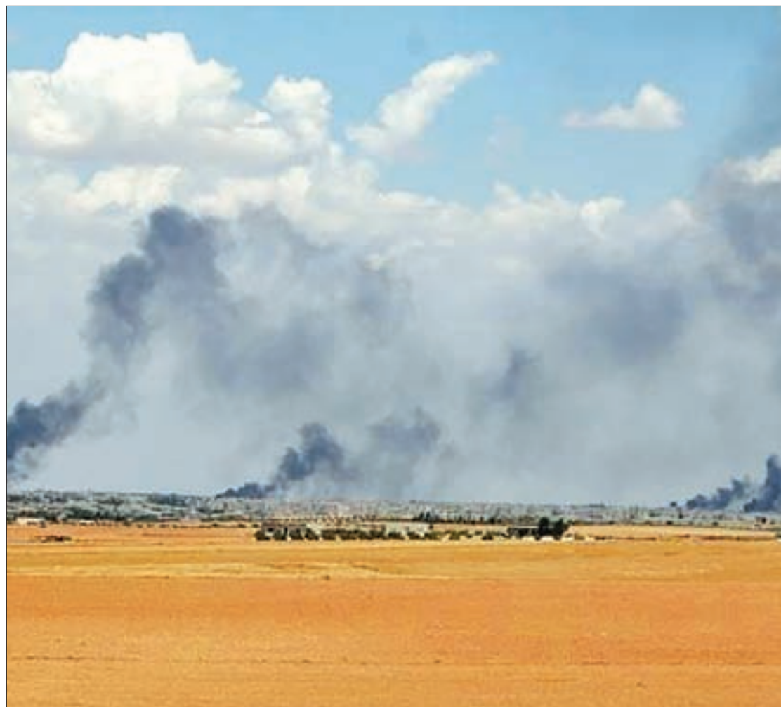
Smoke rises from Manbij city, Aleppo province, Syria on 8 June 2016.

Afghan officials say Pakistan backs the Taliban as a tool to limit the influence of its old rival, India, in Afghanistan. Pakistan says it is trying to encourage the Taliban to talk to the Kabul government but has limited sway over the militants.— Reuters