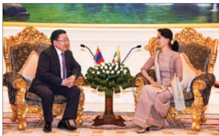
State Counsellor Daw Aung San Suu Kyi holds talks with Mongolian President Mr. Tsakhiagiin Elbegdorj.

STATE Counsellor Daw Aung San Suu Kyi held talks with Mongolian President Mr. Tsakhiagiin Elbegdorj on THE ongoing peace process and national reconciliation, the rule of law and democratic transition in Myanmar at the Presidential Palace in Nay Pyi Taw yesterday.