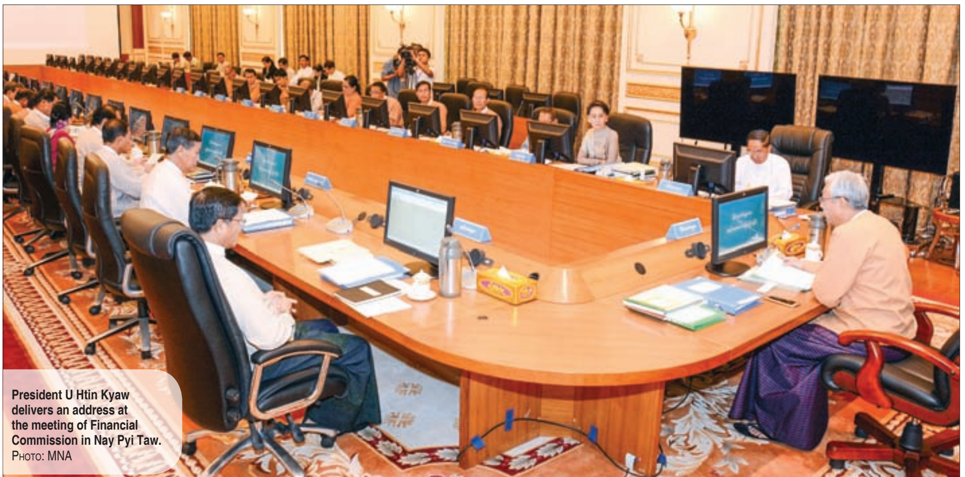
President U Htin Kyaw delivers an address at the meeting of Financial Commission in Nay Pyi Taw.

New budget to focus on development, U Htin Kyaw