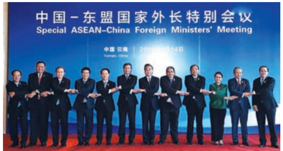
Chinese Foreign Minister Wang Yi (6 th R) and other participants pose for a group picture ahead of the Special ASEAN-China Foreign Ministers' Meeting in Yuxi, southwest China's Yunnan Province, on 14 June, 2016. Wang and Singapore's Minister for Foreign Affairs Vivian Balakrishnan co-chaired the meeting here Tuesday. Singapore serves as the country coordinator for China-ASEAN relations.

China lays historical claim to most of the South China Sea, with its Nine Dash line stretching deep into the maritime heart of Southeast Asia, covering