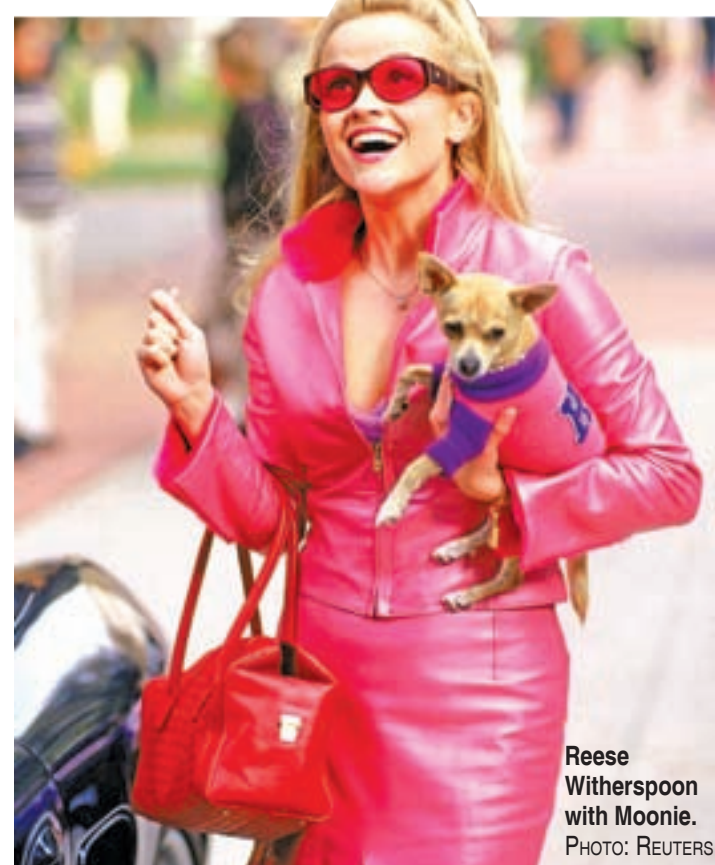
Reese Witherspoon with Moonie.

The "Fancy" crooner had previously pushed back "Digital Distortion" to include a collaboration with Zedd.—PTI