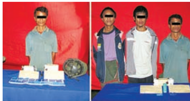
Yaba seized in Loikaw and Maisat.