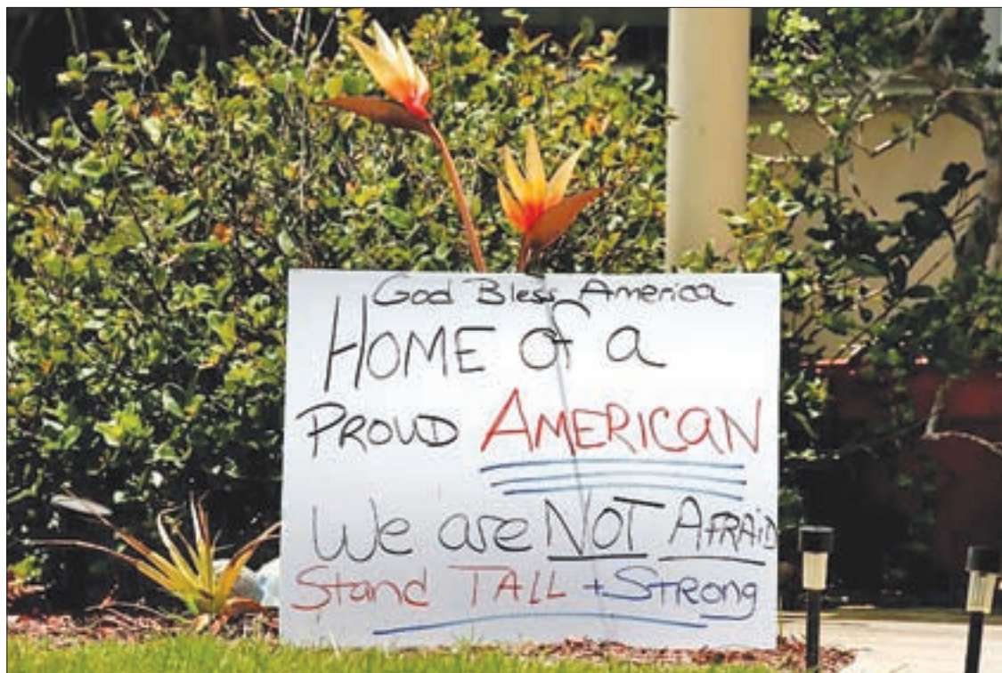
A sign is pictured in front of a house across the street from Omar Mateen's home in Port Saint Lucie, Florida, US, on 14 June 2016.

Obama denounced Donald Trump for his proposed ban on Muslims entering the United