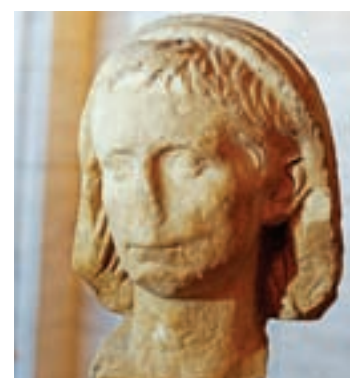
A marble head named the "Augusto di Nepi" and representing young emperor Augustus is seen during a ceremony for its restitution to Italy by Belgian authorities in Rome, Italy on 14 June 2016.

Visibly damaged by exposure to the elements and the passage of time, the head is believed to have formed part of a statue wearing a toga. Its likeness to another head in the Nepi