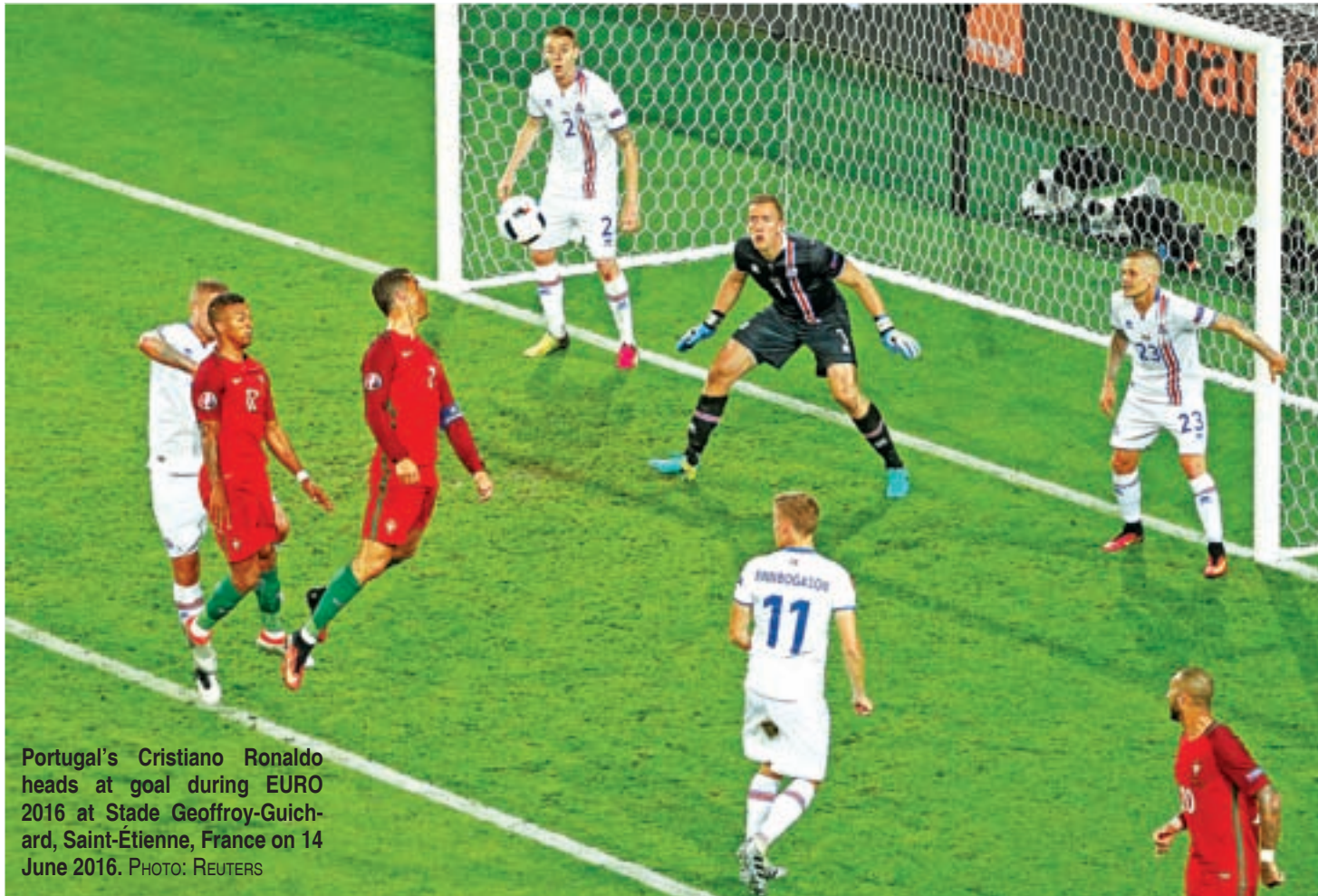
Portugal's Cristiano Ronaldo heads at goal during EURO 2016 at Stade Geoffroy-Guichard, Saint-Étienne, France on 14 June 2016.