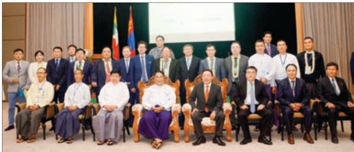
Mongolian President Mr. Tsakhiagiin Elbegdorj and participants of CEO Conference Mongolia-Myanmar Business Council pose for documentary photos.

MONGOLIA prefers an intimate relationship to a business-oriented relationship, said Mongolian President Mr. Tsakhiagiin Elbegdorj at the opening of the Mongolia-Myanmar CEO Conference in Nay Pyi Taw yesterday.