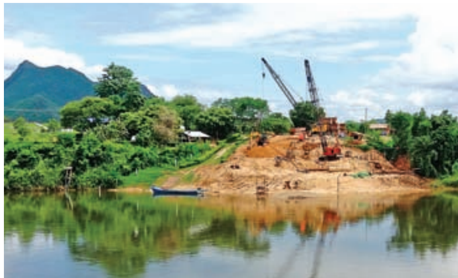
New Doakhtawady Bridge is being built.

"Normally, Kyaukse residents visit Pyin U Lwin through Mandalay. After completion the bridge, we will directly go to the scenic hill town in a short period of