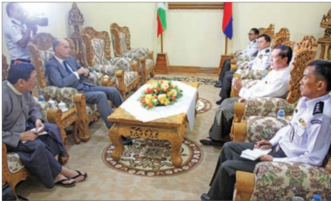
Union Minister for Labour, Immigration and Population U Thein Swe holding talks with resident representative of the UNHCR Mr Giuseppe Vincentiis.

UNION Minister for Labour, Immigration and Population U Thein Swe held talks with resident representative of the UNHCR in Yangon Mr Giuseppe de Vincentiis yesterday regarding efforts to bring about stabil-