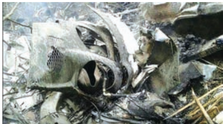
Debris from Mi-2 being seen at crash site.

heavy maintenance at Meikhtila Air Base left at 8.40 am yesterday and landed at Taungoo Air Base to refill fuel before it was meant to proceed to Hmawbi. The MI-2 was meant to eventually head to Myeik Air Base, in Myanmar's Tanintharyi region. A major, a captain and a sergeant were confirmed dead on site. Responsible Tatmadaw personnel inspected the crash site.— Myanmar News Agency