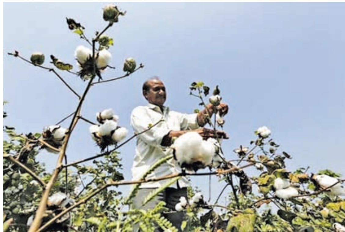
A farmer harvests cotton in his field at Rangpurda village in Gujarat, India, in 2015.

MUMBAI — Cotton planting in India, the world's biggest producer, is likely to fall to the lowest in seven years in the