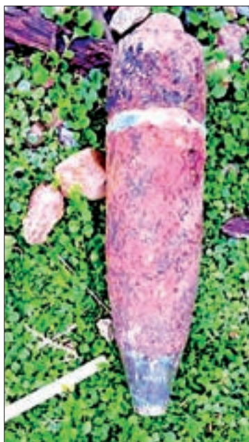
Explosive mortar round.

Similarly, a bomb measuring 21 inches in length and 13 inches in diameter was found on the sand bank of Sin Lin creek, Chaung Kway village on 6 June. The bomb was cleared by Than Min Htway, Inspector of police, Kawlin Police Station and the members of a local battalion.—Ko Ko Nyein (Kawlin)