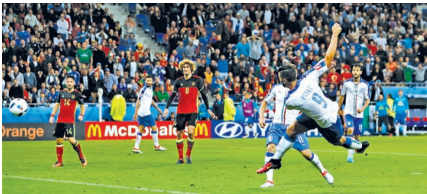
Italy's Graziano Pelle scores their second goal during the EURO 2016 Group E match at Stade de Lyon, Lyon, France on 13 June.

it." Although tactically outfoxed, Conte's opposite number Marc Wilmots — fielding the likes of Eden Hazard, Kevin De Bruyne and Romelu Lukaku — defended his talented but disjointed side,