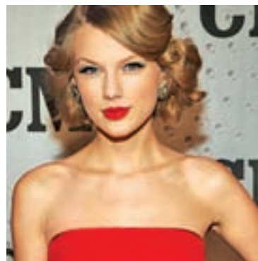
Pop star Taylor Swift.

LONDON — Pop star Taylor Swift has created her own new range of greeting cards.