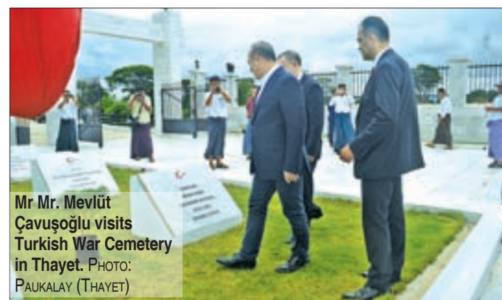
Mr. Mevlüt Çavuşoğlu visits Turkish War Cemetery in Thayet. PHOTO: PAUKALAY (THAYET)

TURKISH Minister for Foreign Affairs Mr. Mevlüt Çavuşoğlu and party visited the Turkish War Cemetery situated two-miles from Thayet, Magwe Region yesterday.