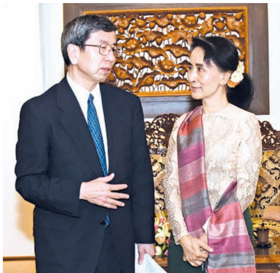
State Counsellor Daw Aung San Suu Kyi receives ADB President Takehiko Nakao.

Mr. Nakao welcomed Myanmar's initiatives to increase infrastructure investment through public-private