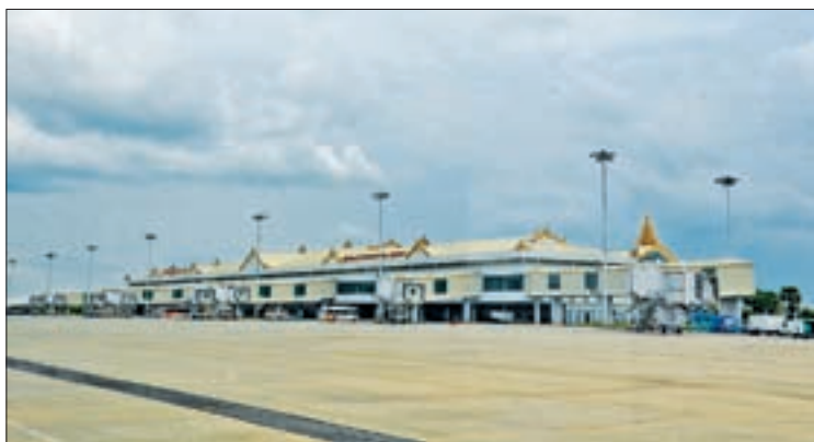
Mandalay International Airport.

UNION Minister for Transport and Communication U Thant Sin Maung inspected Mandalay International Airport yesterday.