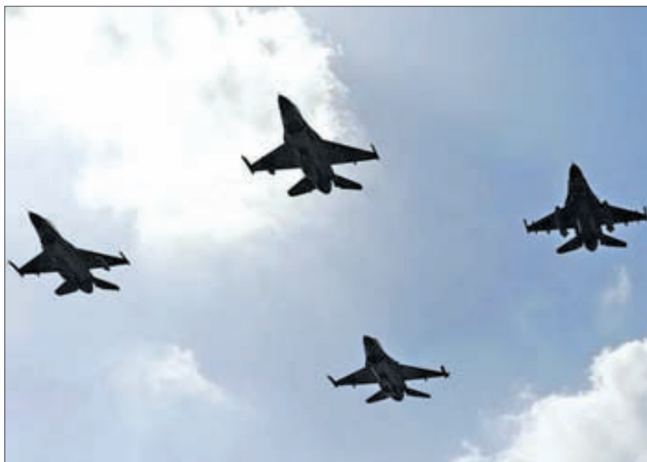
Jordanian F-16 fighter jets escorting the plane carrying Bahrain's King Hamad bin Isa Al Khalifa (not pictured) are seen at Amman airport, in 2015.

"We are now going for a third-party transfer of F-16s and have an offer from Jordan," Defence Sec-