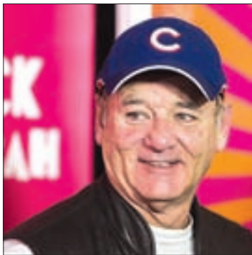
Cast member Bill Murray arrives for the premiere of the film "Rock the Kasbah" in New York in October 2015.

Murray, 65, is among the best-known stars to emerge from NBC's "Saturday Night Live." He performed on the groundbreak-