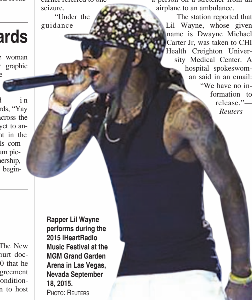
Rapper Lil Wayne performs during the 2015 iHeartRadio Music Festival at the MGM Grand Garden Arena in Las Vegas, Nevada September 18, 2015.

The station reported that Lil Wayne, whose given name is Dwayne Michael Carter Jr, was taken to CHI Health Creighton University Medical Center. A hospital spokeswoman said in an email: "We have no information to release."—Reuters