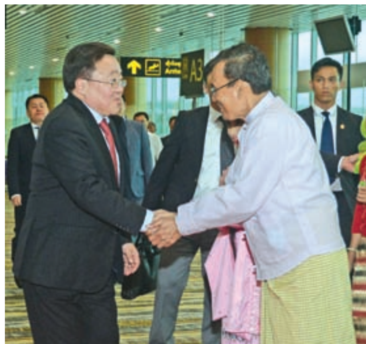
Union Minister U Ohn Win welcomes Mongolia President Mr. Tsakhiagiin Elbegdorj at Nay Pyi Taw International Airport.