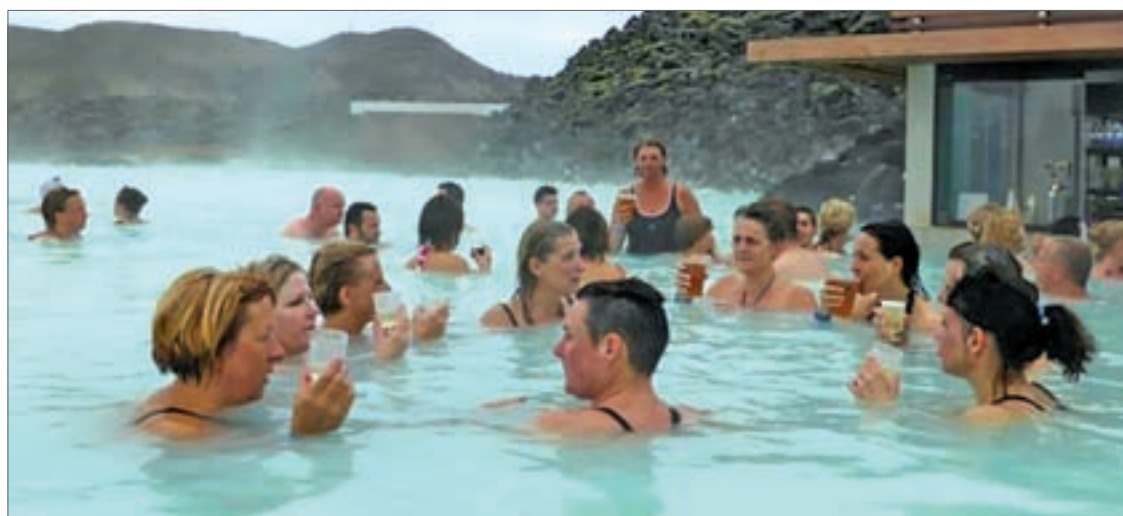
Visitors enjoy a drink in the Blue Lagoon geothermal spa in Grindavik, Iceland, on 25 May 2016.

The mistrust runs deep. Iceland suffered one of the first big financial implosions of the Euro-