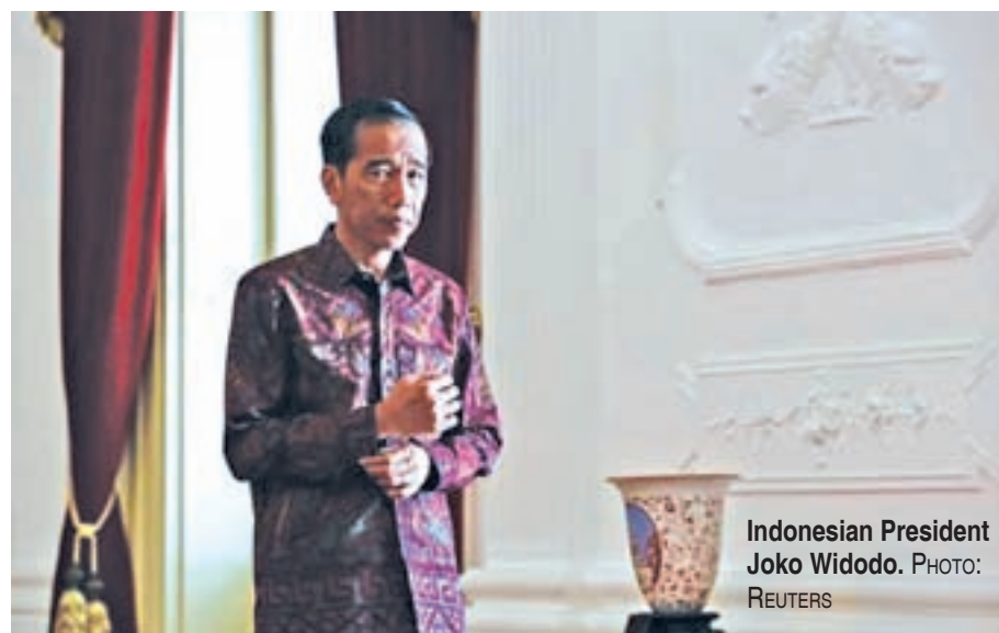
Indonesian President Joko Widodo.

JAKARTA — Indonesia plans to execute 16 prisoners after the Muslim Eid al Fitr holidays next month, and more than double that number next year, a spokesman for the attorney general's office said on Tuesday.