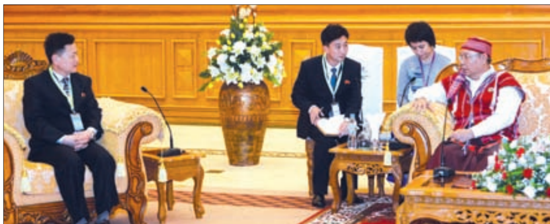
Speaker Mahn Win Khaing Than receives Ambassador of the Democratic People's Republic of Korea.