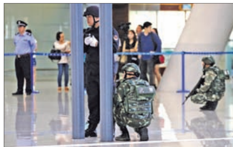
Paramilitary policemen take position behind pillars as a bomb disposal expert checks a luggage near the site of a blast at a terminal in Shanghai's Pudong International Airport, China, on 12 June.

Gui, a Swedish passport holder, disappeared in Thailand in October and was shown on Chinese state television in January saying he had voluntarily turned himself in to Chinese authorities. —Reuters