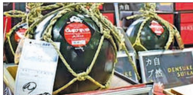
Photo taken on 14 June 2016, in the northern Japan city of Asahikawa shows fancy watermelons, known as "Densukesuika," a specialty of Toma town. During the season's first auction at a fruit and vegetable market in Asahikawa, the bidding price reached as high as 500,000 yen.

An agricultural cooperative in Toma said the peak season of this variety is July and that it plans to ship 70,000 of them this year. The watermelons are expected to retail for around 5,000 yen apiece.—Kyodo News