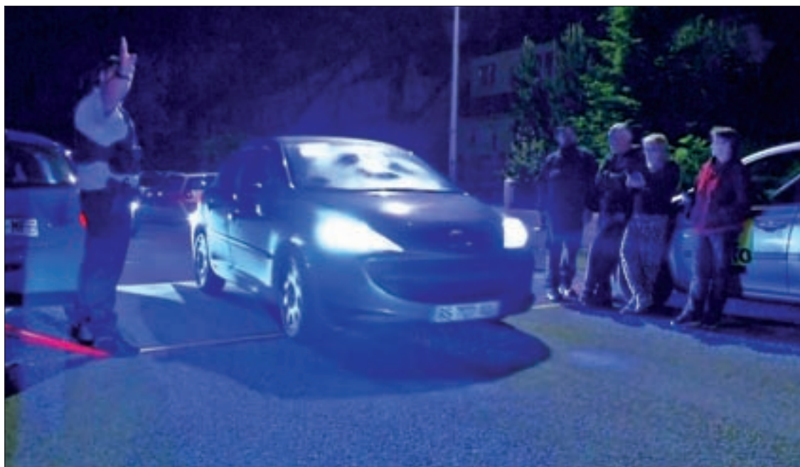
Still image taken from video shows Police vehicles at the scene near where a French police commander was stabbed to death in front of his home in the Paris suburb of Magnanville, France, on 14 June 2016.