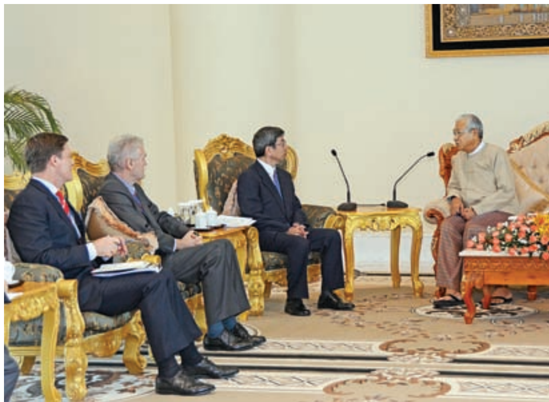
President U Htin Kyaw receives Mr. Takehiko Nakao, President of the Asian Development Bank (ADB) at the Presidential Palace in Nay Pyi Taw.

PRESIDENT U Htin Kyaw held talks with Mr. Takehiko Nakao, President of the Asian Development Bank (ADB), on present and future development undertakings funded by the lender in Myanmar yesterday.