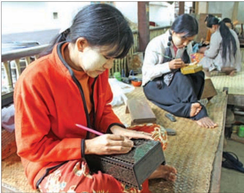
A handicraft business site being seen.

Lacquerware handicrafts are produced from the Bagan towns of Nyaung Oo and Monywa in Sagaing region in Myanmar.—200