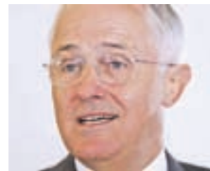
Australian Prime Minister Malcolm Turnbull.