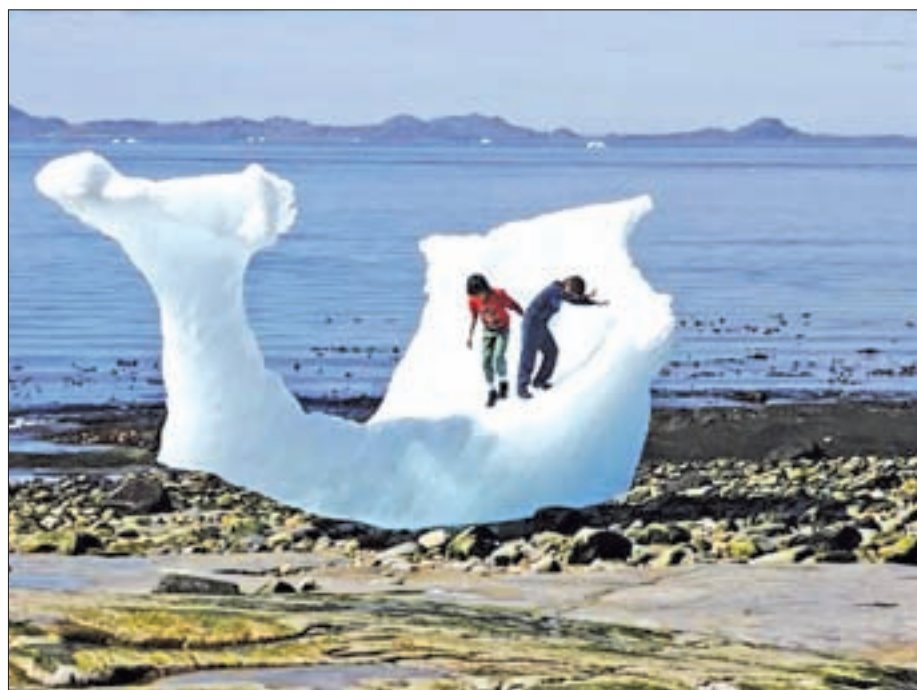
Children play amid icebergs on the beach in Nuuk, Greenland, on 5 June 2016.