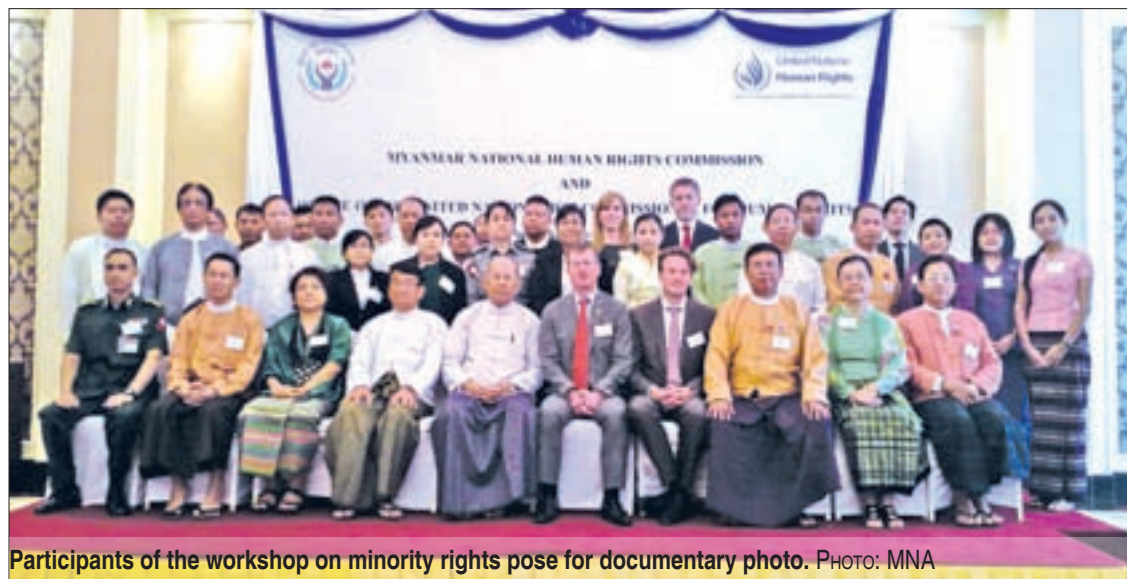
Participants of the workshop on minority rights pose for documentary photo.

ORGANISED by the Myanmar National Human Rights Commission (MNHRC) and the Office of the United Nations High Commissioner for Human Rights (OHCHR), a workshop on minority rights took place in