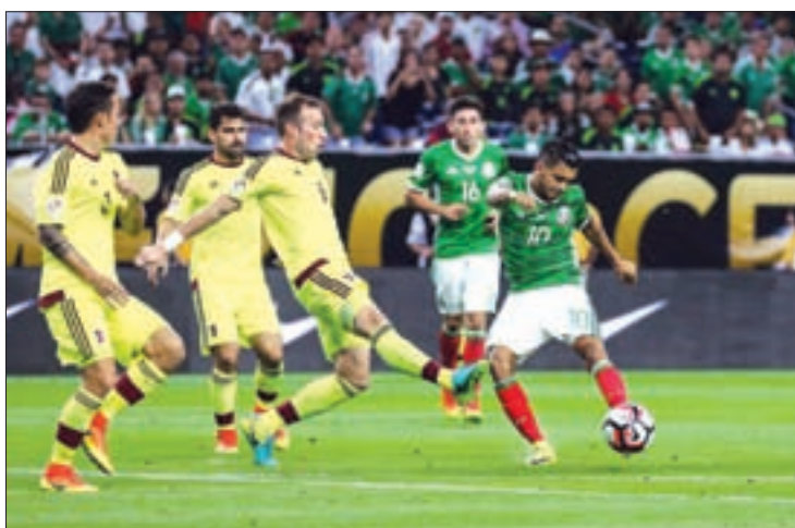
Mexico forward Jesus Manuel Corona (10) shoots the ball during the second half against Venezuela during the group play stage of the 2016 Copa America Centenario at NRG Stadium, Houston, TX, on 13 June. Venezuela and Mexico tied 1-1.

Venezuela's Josef Martinez came close to scoring with a bicycle kick but Mexico goalkeeper Jose de Jesus Corona saved well. Venezuela keeper Daniel Hernandez also produced a string of saves before conceding his first goal of