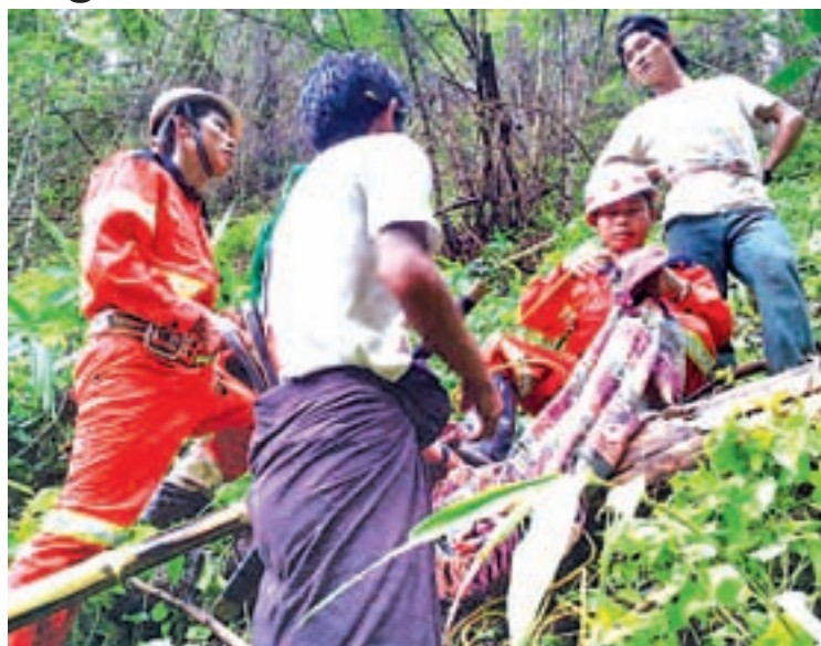
People seen in the ravine to get to the car.

The accident killed the Sayadaw and a monk on the spot while four other monks were seriously injured. They are undergoing medical treatment at the local General Hospital. Police from Namtu township have filed dangerous driving charges.—Sai (Hsipaw)