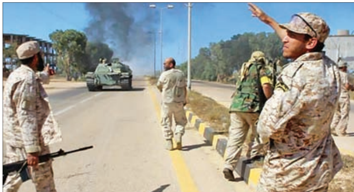
Soldiers from a force aligned with Libya's new unity government walk along a road during an advance on the eastern and southern outskirts of Sirte, on 9 June 2016.

Clashes in Sirte on Friday left 11 brigade members dead and