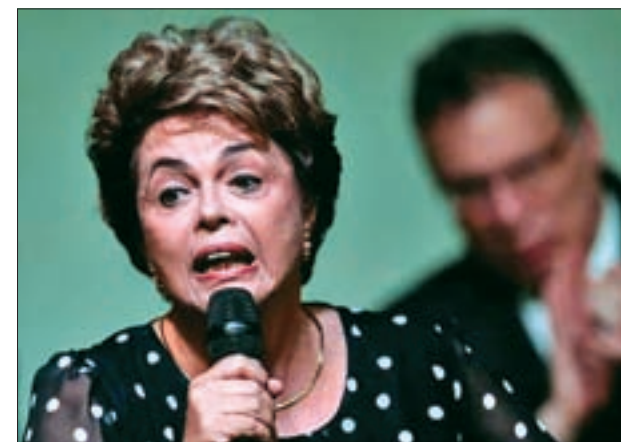
Suspended Brazilian President Dilma Rousseff in Brasilia, Brazil, on 30 May, 2016.

BRASILIA — Brazil's Dilma Rousseff said she would call a referendum on holding early elections if she is reinstated as president, an offer analysts saw as a bid to sway undecided senators to help clear her in an impeachment trial.