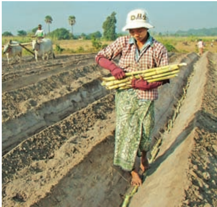
A woman farmer grows sugarcane in central Myanmar.

SINCE the beginning of June, the price of sugar has risen slightly in the local market due to increased demand from China, said merchants based in Mandalay.