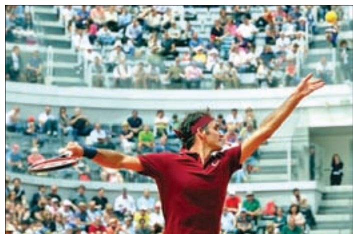
Roger Federer of Switzerland serves during Italy Open in Rome, Italy on 11 May 2016.