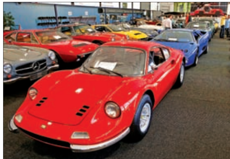
A 1973 Ferrari Dino 246 GT (front) is shown with other vintage cars during a preview of an auction by Swiss Oldtimer Galerie International in Zurich, Switzerland, on 10 June 2016.

"There is a big demand for vintage cars because they are tangible assets that are in limited supply," he said.