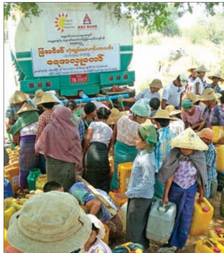
People collect drinking water from a water bowser of Brighter Future Myanmar.

has supplied more than 172,800 gallons of drinking water to people in villages in Sagaing in cooperation with local volunteers. The foundation has also supplied drinking water to people in villages in Yangon Region, Taunggyi, Nyaung Shwe, Magwe, Chin State, Haka, Ealam, Mandalay, Myittha, Kume, Natogyi and Kyaukse from early April to date. As part of its efforts to combat water scarcity problems, KBZ's Brighter Future Myanmar foundation has asked communities currently facing drought and/or a scarcity of fresh water to contact the foundation and arrange for fresh potable water to be delivered.—Thiha Tun