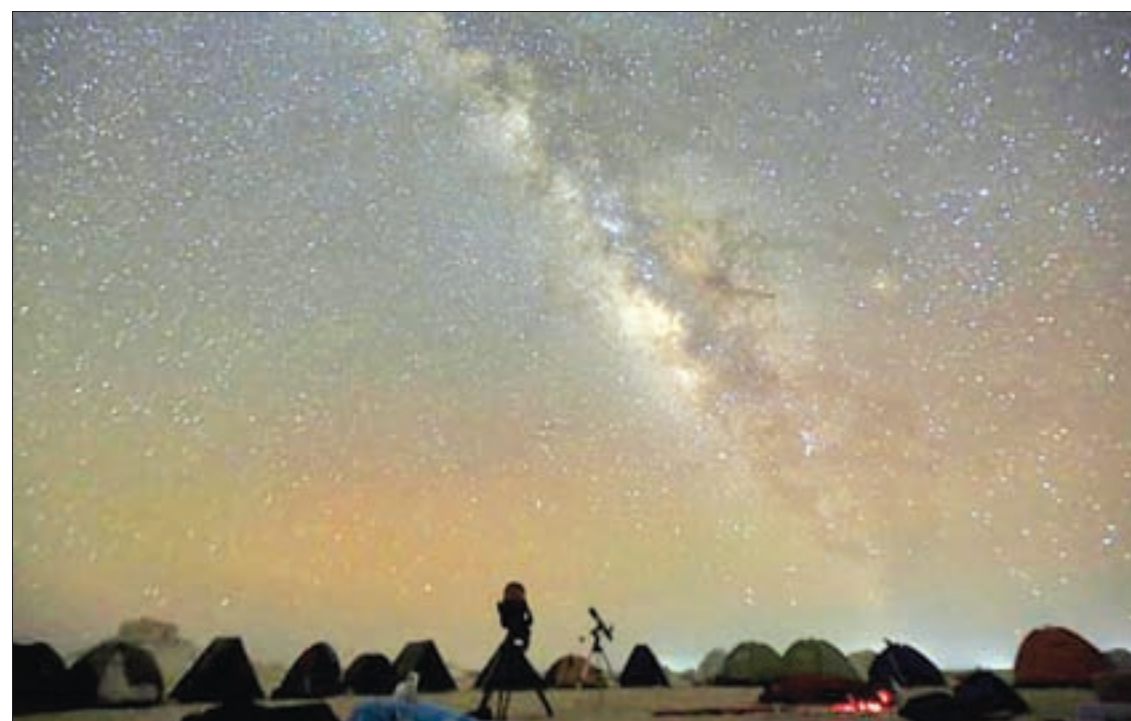
The 'Milky Way' is seen in the night sky around telescopes and camps of people over rocks in the White Desert north of the Farafra Oasis southwest of Cairo in May 2015.

Only small areas in western Europe remain relatively unaffected, mostly in Scotland, Sweden and Norway. Australia and Africa are least-affected among the populated continents.—Reuters