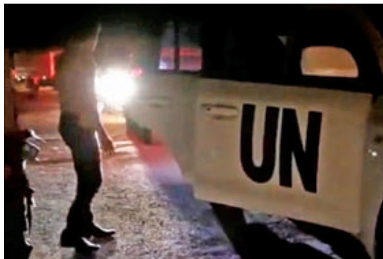
A still image from video released on 10 June 2016 shows vehicles from the United Nations and Syrian Arab Red Crescent delivering a month's supply of food to Daraya, a Syrian town under siege by government forces.

GENEVA/BEIRUT — International aid convoys have reached two Syrian rebel-held towns near Damascus, marking the first delivery of food supplies to Daraya since 2012, after the government granted permission for the trips, the United Nations said on Friday.