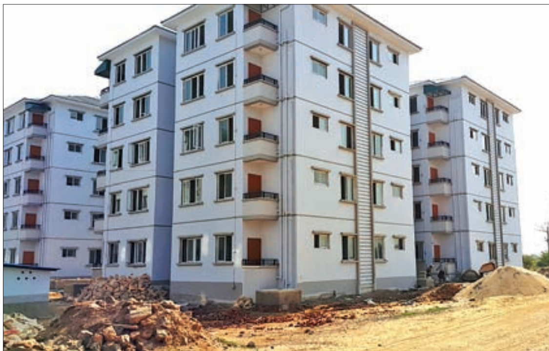
Affordable apartments in Mandalay awaiting their proprietors.

There is a total of 560 apartments and 14 five storied buildings which have been constructed on an 7.67 acre plot of land. The prices begin at K20.3 million for a ground floor flat, K20.8 million for a first floor flat, K19.3 million for a second floor flat, K17.8 million for a third floor flat and K16.3 million for a fourth floor flat, it has been learned.. The Mandalay Department of Urban and Housing Development constructed a total of 1,260 apartments for employees and 960 low-cost apartments in 2015.— Aung thant khine