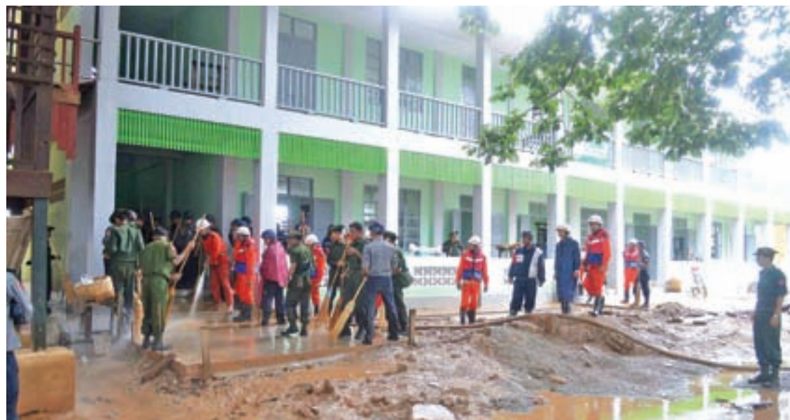
Army, Police and Fire Brigade members are doing the cleaning of the school compound.

THE Daung Myu creek became swollen by heavy torrential rain on Thursday with rising waters causing floods in six wards of Kawlin Township in Sagaing Region.