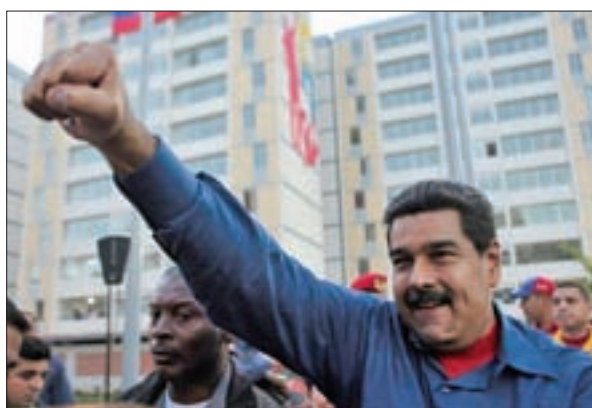
Venezuela's President Nicolas Maduro greets supporters as he arrives to an event for handing over houses in Caracas, Venezuela, on 9 June 2016.

If Maduro lost a recall vote this year, fresh elections would be held. But if the vote happens after 10 January, Maduro would be replaced by his vice president.—Reuters