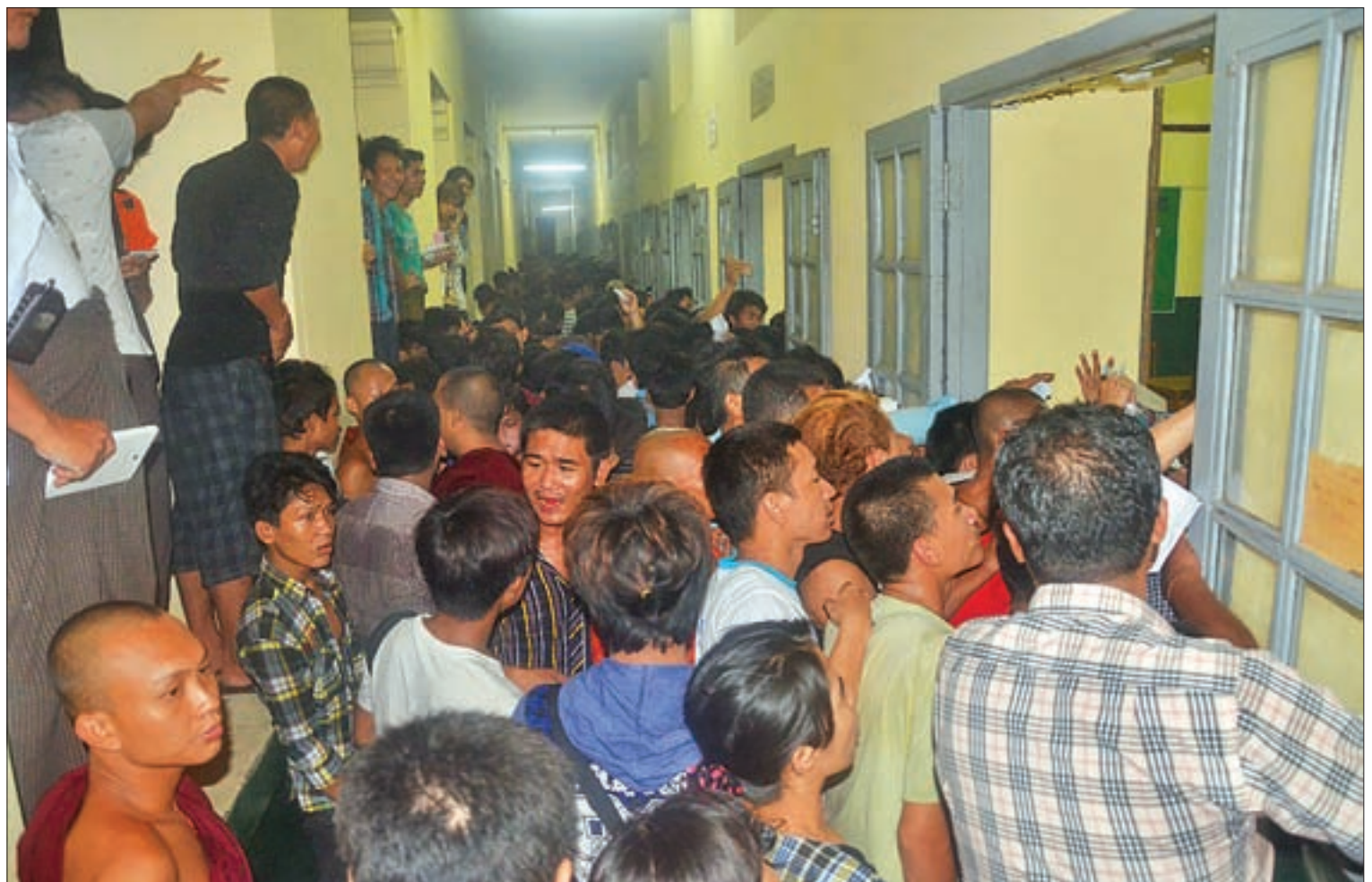
Students crowding the notice boards in Yangon in the small hours to check the exam results.