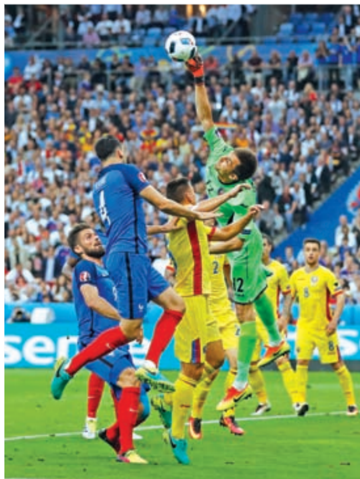
Romania's Ciprian Tatarusanu clears the ball during EURO 2016 at Stade de France, Saint-Denis near Paris, France on 10 June 2016.

"Had we won by two or three goals that might have misled us slightly whereas the fact we won late in the day, that shows there are going to be no easy matches," man-of-the-match Payet told reporters. —Reuters