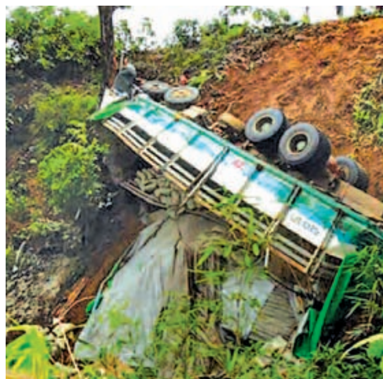
The 12-wheel truck seen overturned.