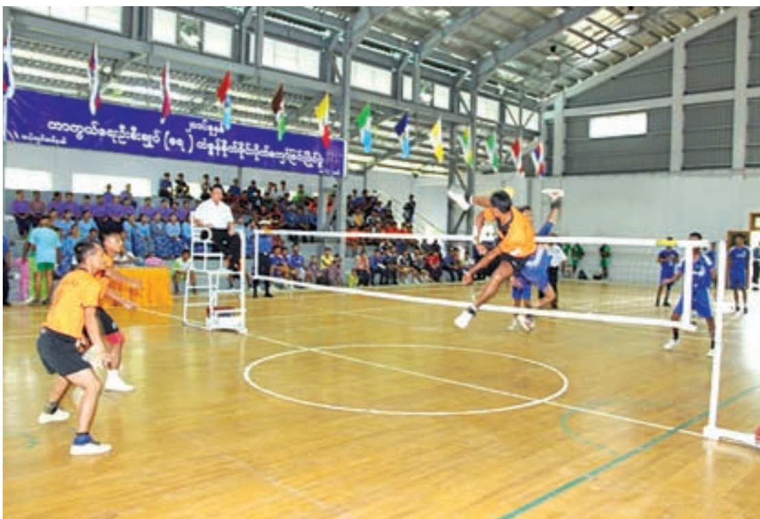
Sepak Takraw player flying in the air to smash the caneball.

THE Final matches of the Commander-in-Chief of Defence Service (Navy)'s Shield Sepak takraw championship tournament and prizes presentation ceremony was held in the hall of Thanlyin station area on Friday. On the behalf of the Command-