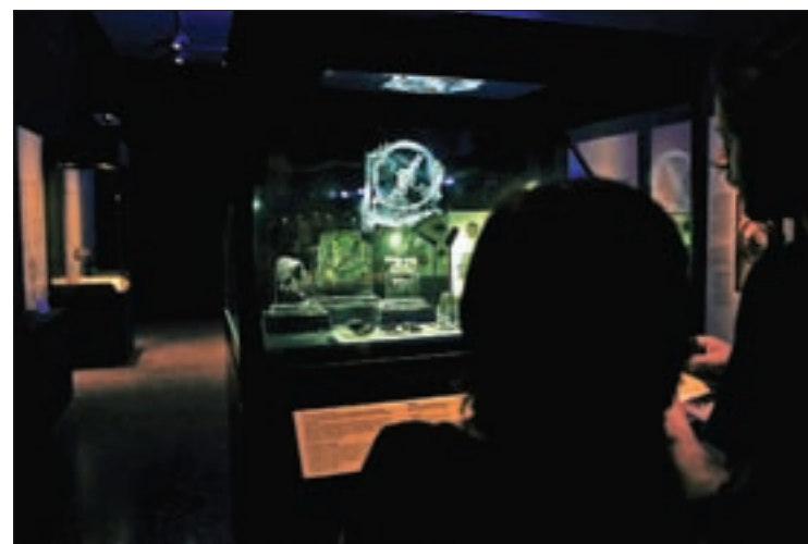
Visitors look at the displayed fragments of the ancient Antikythera Mechanism at the National Archaeological Museum in Athens, Greece, on 9 June 2016.

Nonetheless, the overriding objective of the mechanism was astronomical and not astrological, he said.