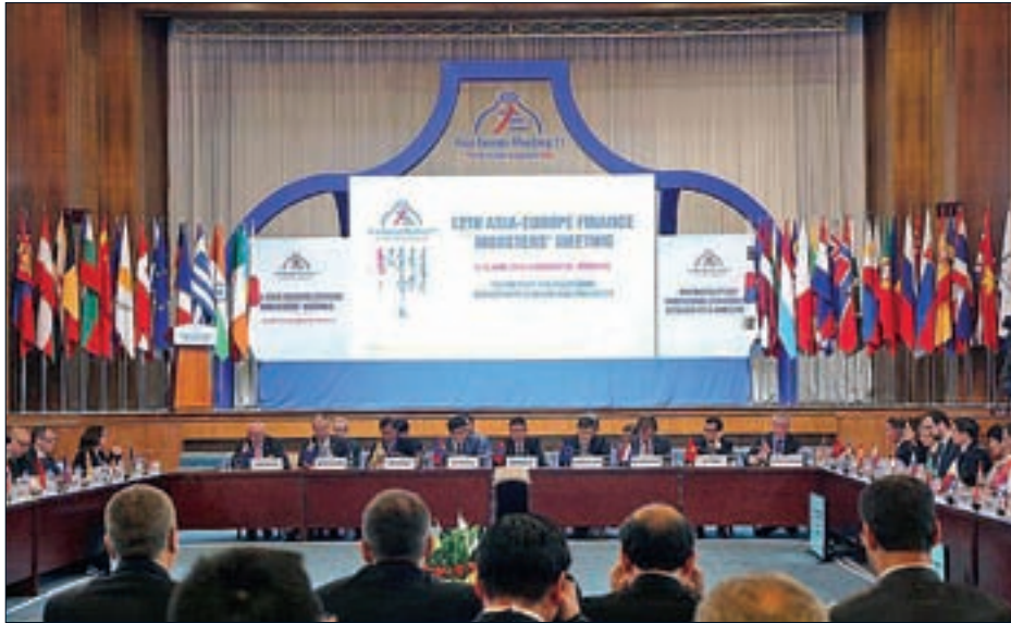
Participants attend the 12 th Asia-Europe Finance Ministers' Meeting in Ulan Bator, Mongolia, on 10 June, 2016.

Representatives conducted a comprehensive discussion on a range of issues of common interests based on the theme "Partnership for Prosperous