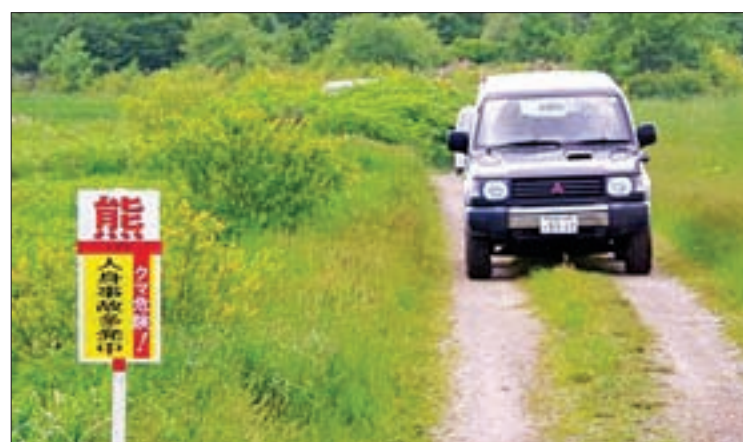
Photo taken on 10 June 2016, shows a forest in the northern Japan city of Kazuno, in which four bodies, apparently the victims of bear attacks, have been found since late May.

Later Friday, a hunter killed a bear in the forest in Kazuno, the police said. The police will look into whether it was the bear that likely assaulted some or all of the victims.—Kyodo News