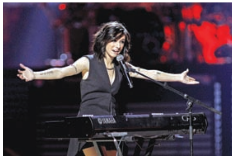
Macy’s iHeartRadio Rising Star Christina Grimmie performs during the 2015 iHeartRadio Music Festival at the MGM Grand Garden Arena in Las Vegas, Nevada in 2015.

ORLANDO — Singer Christina Grimmie, who gained fame as a contestant on television singing contest “The Voice,” died after being shot at a concert in Orlando on Friday, police said on social media.