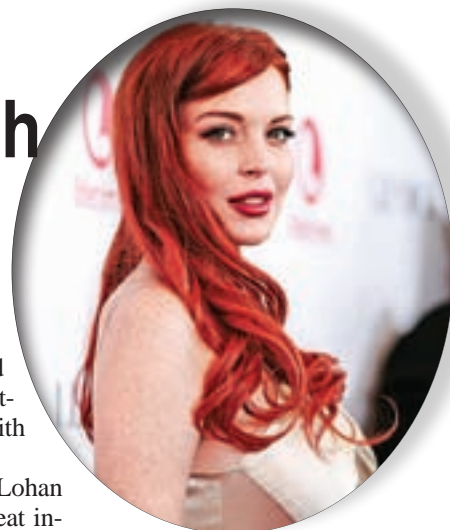
Actress Lindsay Lohan.