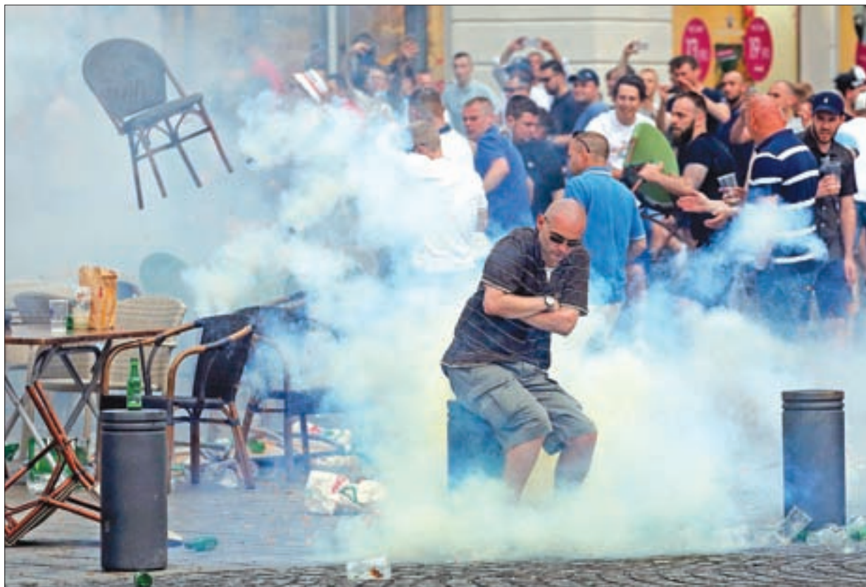
A teargas grenade explodes near an England fan ahead of England's EURO 2016 match in Marseille, France, on 10 June.

night, about 100 England fans and 50 local residents were involved in another fracas in the streets around the Vieux Port (Old Port) area, where several English and Irish bars are located. Chairs were hurled around and windows