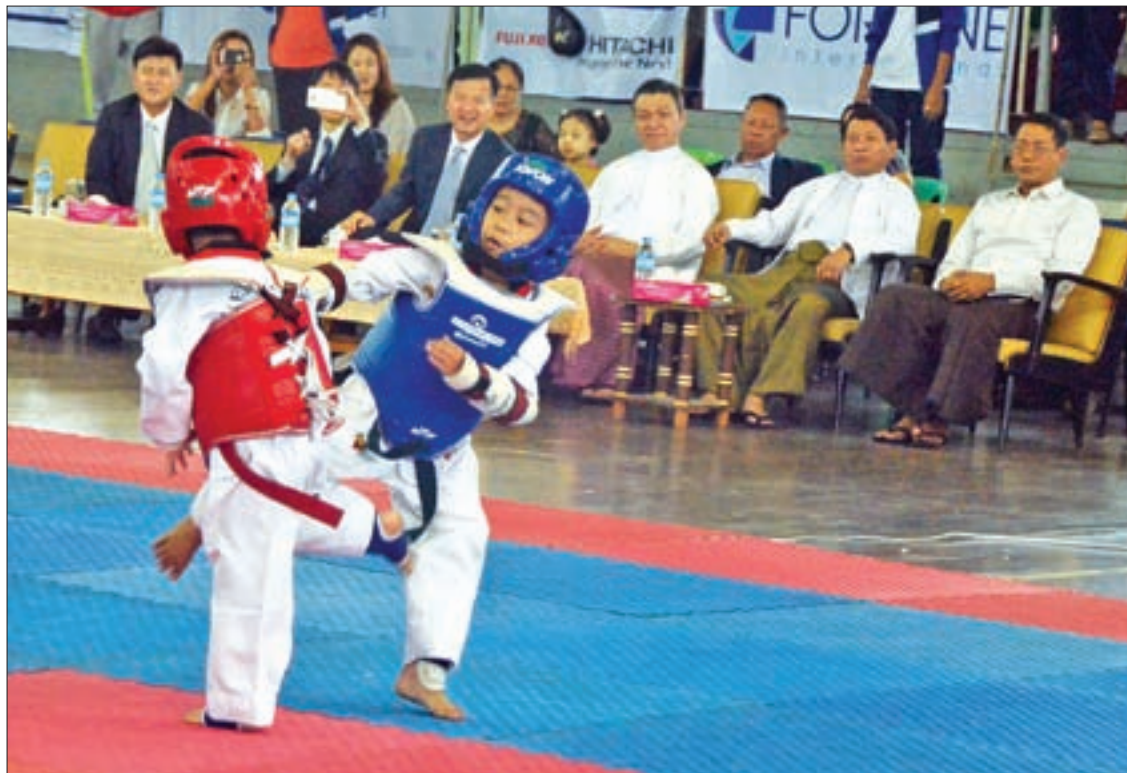
Two fighters compete in Myanmar Taekwondo Federation President's Cup 2016.

The two-day event will end today while its prize presentation ceremony will be held this evening. —Tin Soe (Myanma Alin)