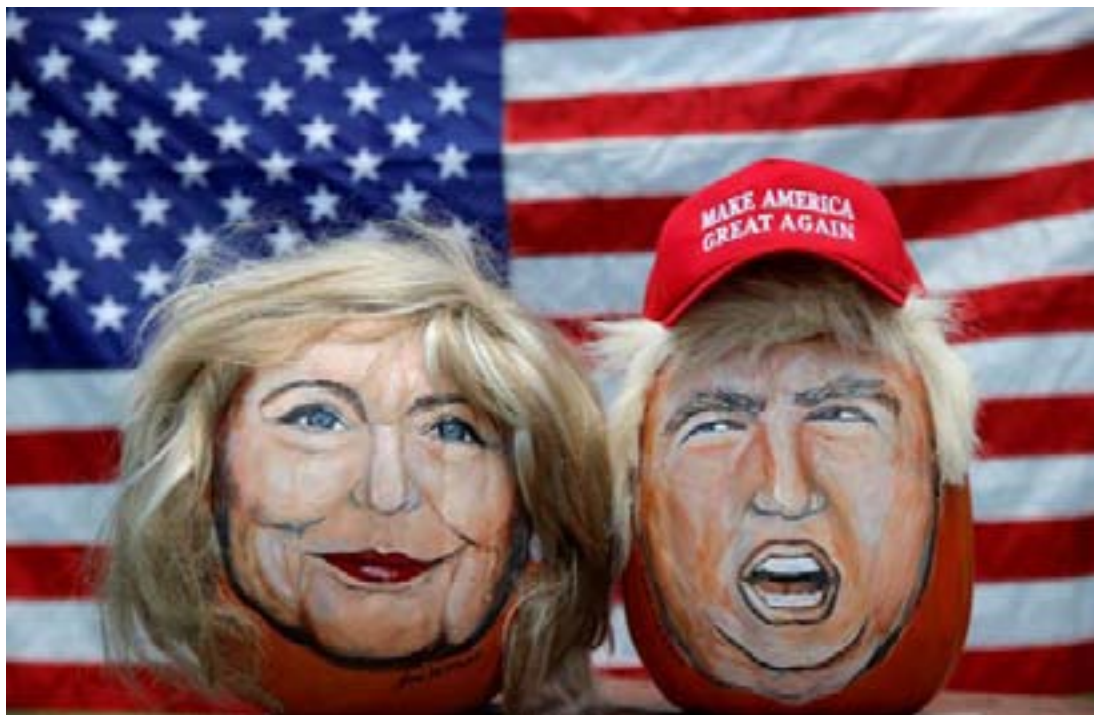
The images of US Democratic presidential candidate Hillary Clinton (L) and Republican Presidential candidate Donald Trump are seen painted on decorative pumpkins created by artist John Kettman in LaSalle, Illinois, US, on 8 June 2016.