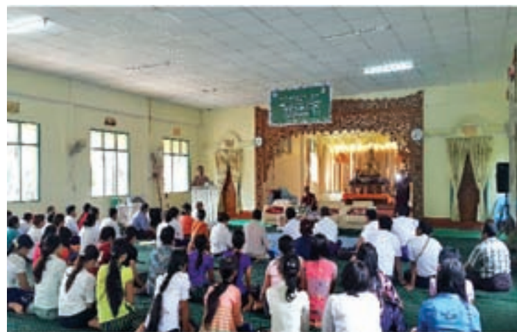
Vocational training course opening ceremony in progress. PHOTO: 017

AS part of the 100-day plan of the Ministry of Agriculture, Livestock and Irrigation, a fruit-based foodstuff-making course was opened in Waw Township, Bago Region on 8 June.