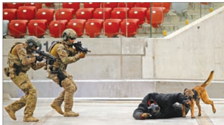
Soldiers demonstrate their skills during a military police exercise, ahead of the NATO summit in July in Warsaw, at the PGE National Stadium in Warsaw, Poland, on 24 May 2016.

The proposed amendment capping public spending growth is a centrepiece of Temer's plan to restore fiscal discipline and get a handle on Brazil's burgeoning debt load.—Reuters