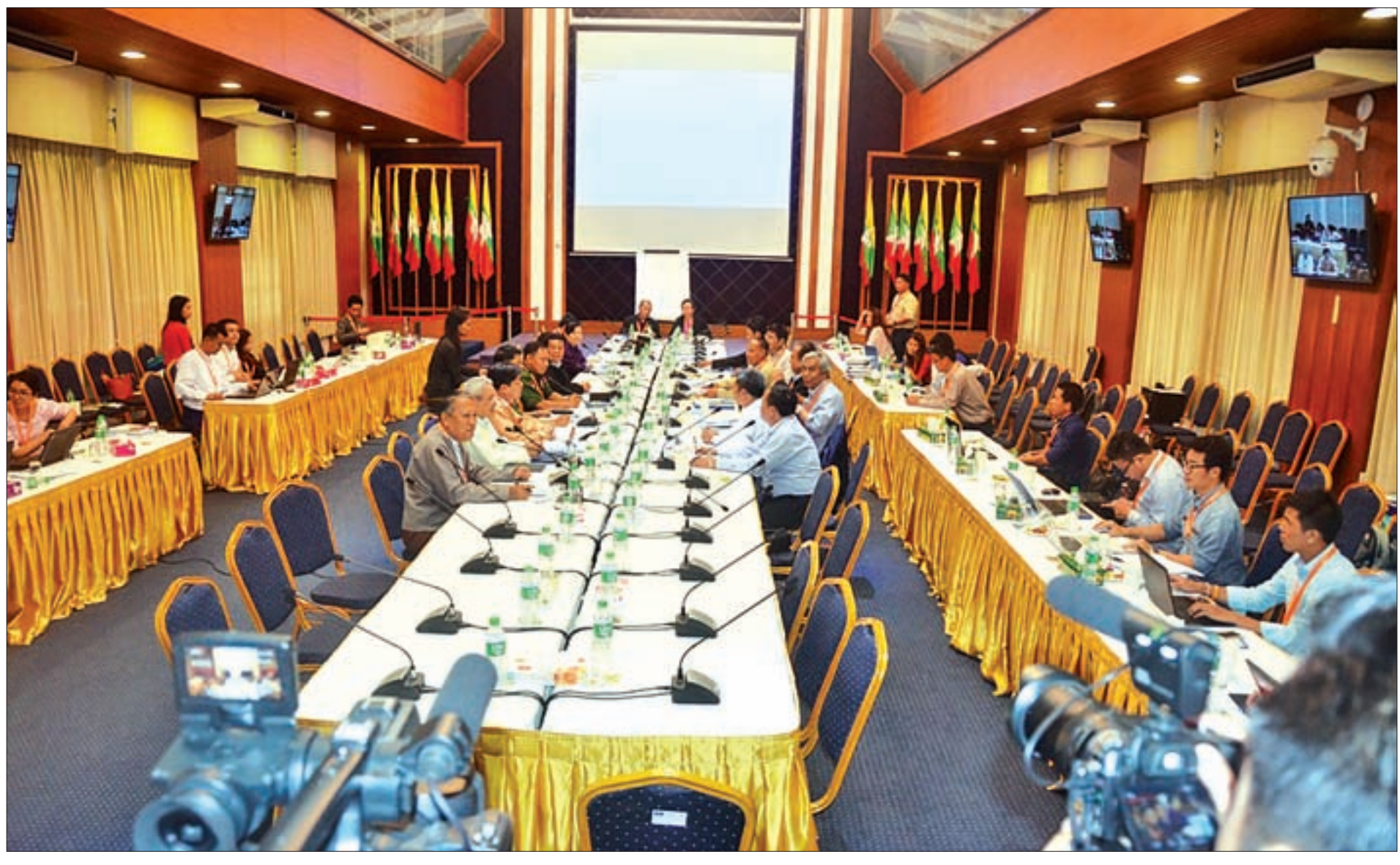
Representatives sit down for discussions regarding the 21st Century Panglong Peace Conference.

A COORDINATION meeting was held at the National Reconciliation and Peace Centre in Yangon yesterday to discuss the organisation of the 21st Century Panglong Peace Conference.