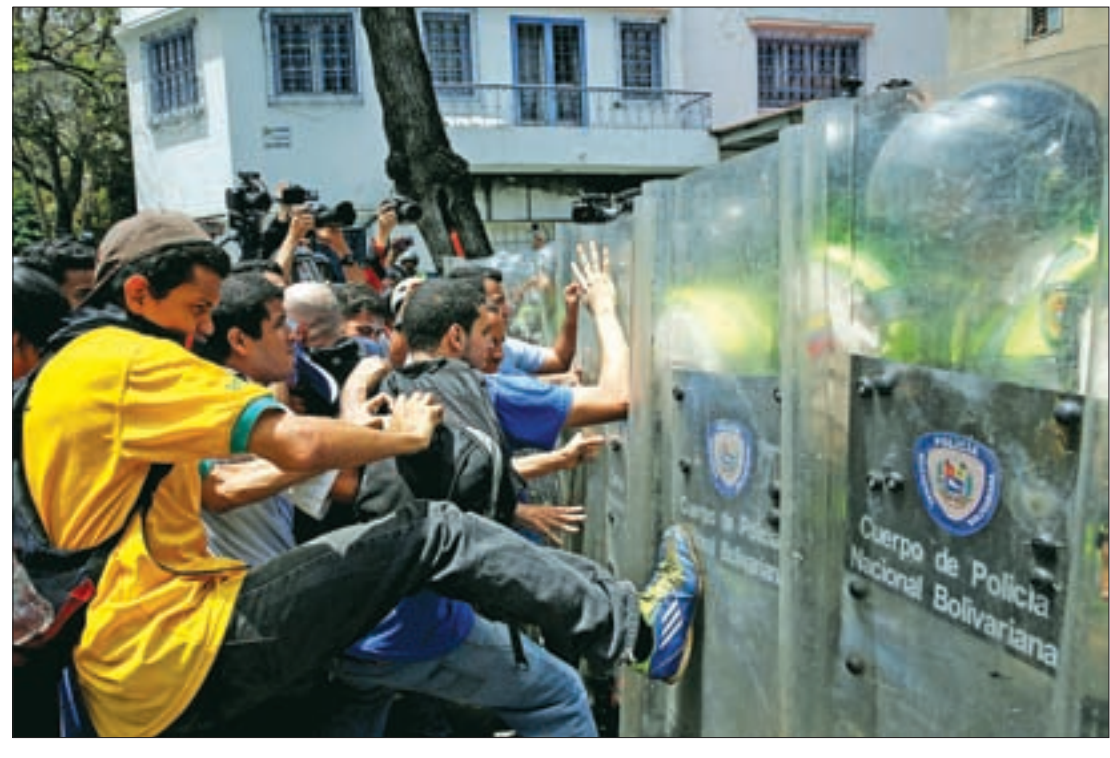
Demonstrators clash with riot police officers during a protest called by university students against Venezuela's government in Caracas, Venezuela, on 9 June.

total impunity — they had pipes, motorbike helmets, rocks, explosive artifacts, and they used them against us," Borges told journalists as blood dripped from his nose and mouth onto his shirt and jacket.