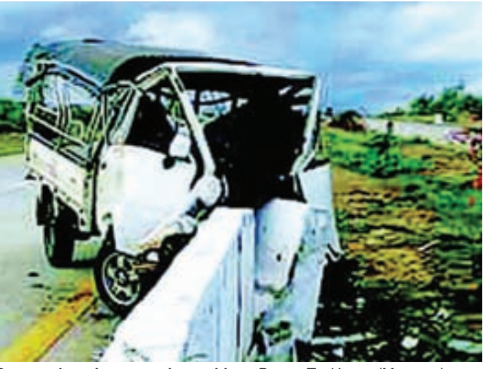
Damaged truck seen at the accident.

A PASSENGER vehicle being driven by one Paing Soe Thu, 26, with Tayoutpu, 43, and Mya Moe Oo, 22, on board crashed into road-dividing barriers after the driver lost control of the car near milepost 306/6 on the Yan-