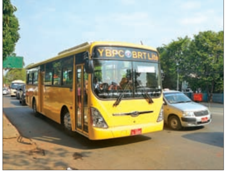
A BRT bus seen plying.

Currently, the company operates a fleet of 45 buses imported from foreign countries along