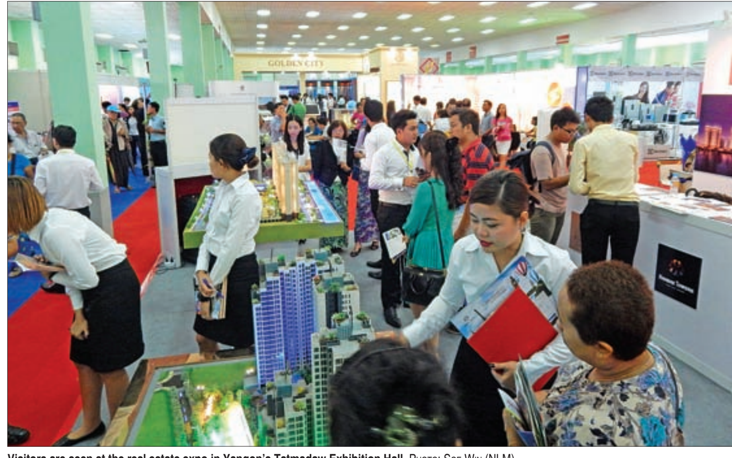
Visitors are seen at the real estate expo in Yangon's Tatmadaw Exhibition Hall.

The price of mung bean and pigeon pea have increased to around K40,000 per tonne. Mung bean are being sold for K1.73 million per tonne and pigeon pea for over K1.5 million in the current market.—Chan Chan