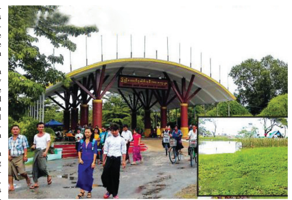
ficial from National Races vill- Visitors seen at the National Races village. PHOTO: 200

"The theme of the Salon home is the idea of Dr. Aung Thu of the Ministries for Agriculture, Livestock and Irrigation. He visited the National Races village on 24 April." said an official from National Races village.—200