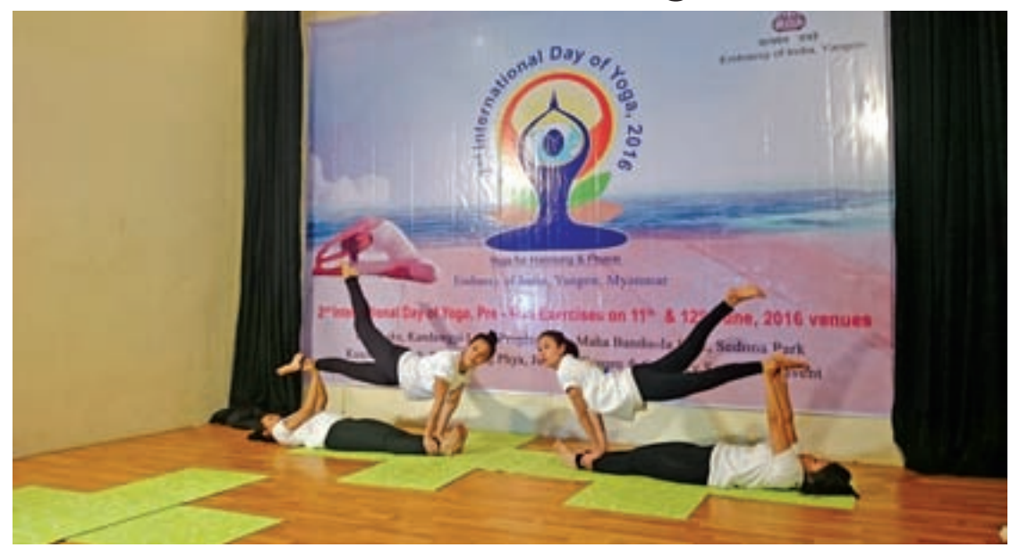
International Day of Yoga.

The 2<sup>nd</sup> International Day of Yoga is scheduled to be celebrated on 19 June 2016 from 8 AM Day of Yoga on Sunday, June to 10 AM at the Yangon University Diamond Jubilee Hall. AM to 10 AM. But, this year, we are organizing 2nd International gon on 11<sup>th</sup> & 12<sup>th</sup> June as curtain raiser events before our main event at various venues like Inya Lake, Kandawgyi Lake