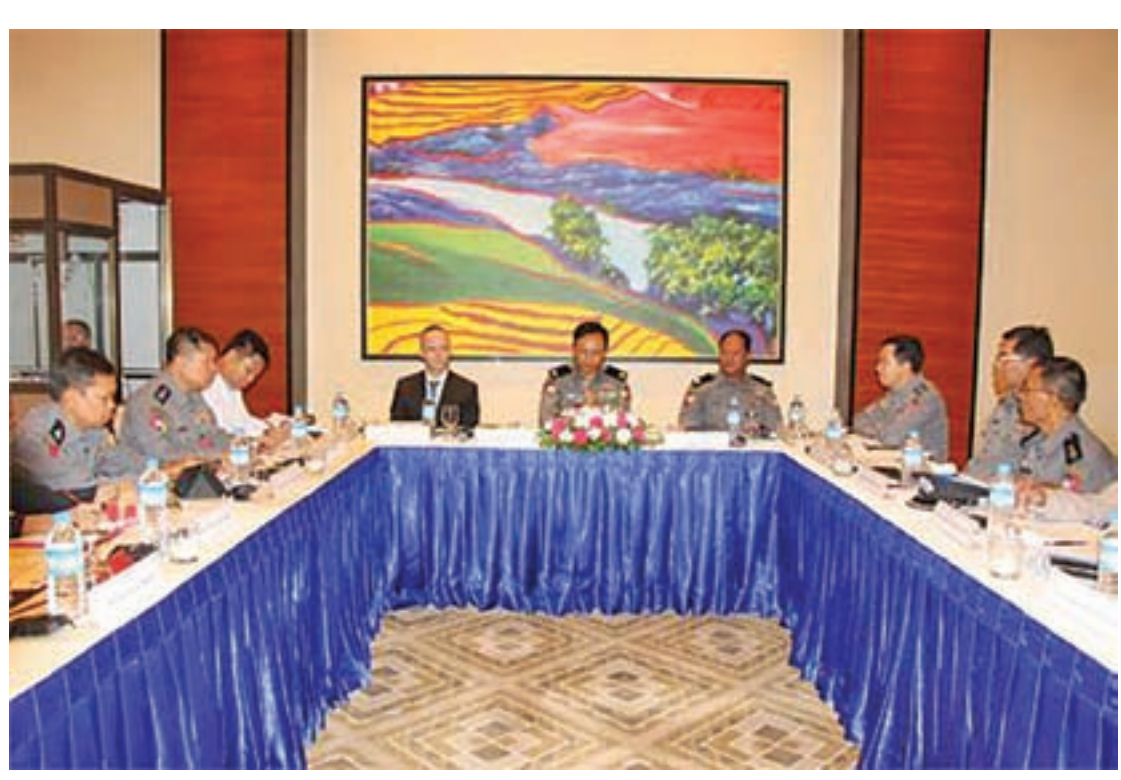
Workshop on combating wildlife and forest crimes in progress.

THE Myanmar Police Force and the United Nations Office on Drugs and Crime (UNO-DC) organised a national-level workshop on the prevention and combating of wildlife and forest crimes at the Park Royal Hotel in Nay Pyi Taw on Tuesday, 7 June