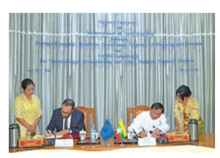
A signing ceremony between Ministry of Planning and Finance and GOPA Consultants in progress in Nay Pyi Taw.

mony were the country's deputy attorney-general, permanent secretaries, directors-general and deputy directors-general from the relevant ministries as well as a delegation from GOPA Consultants led by its