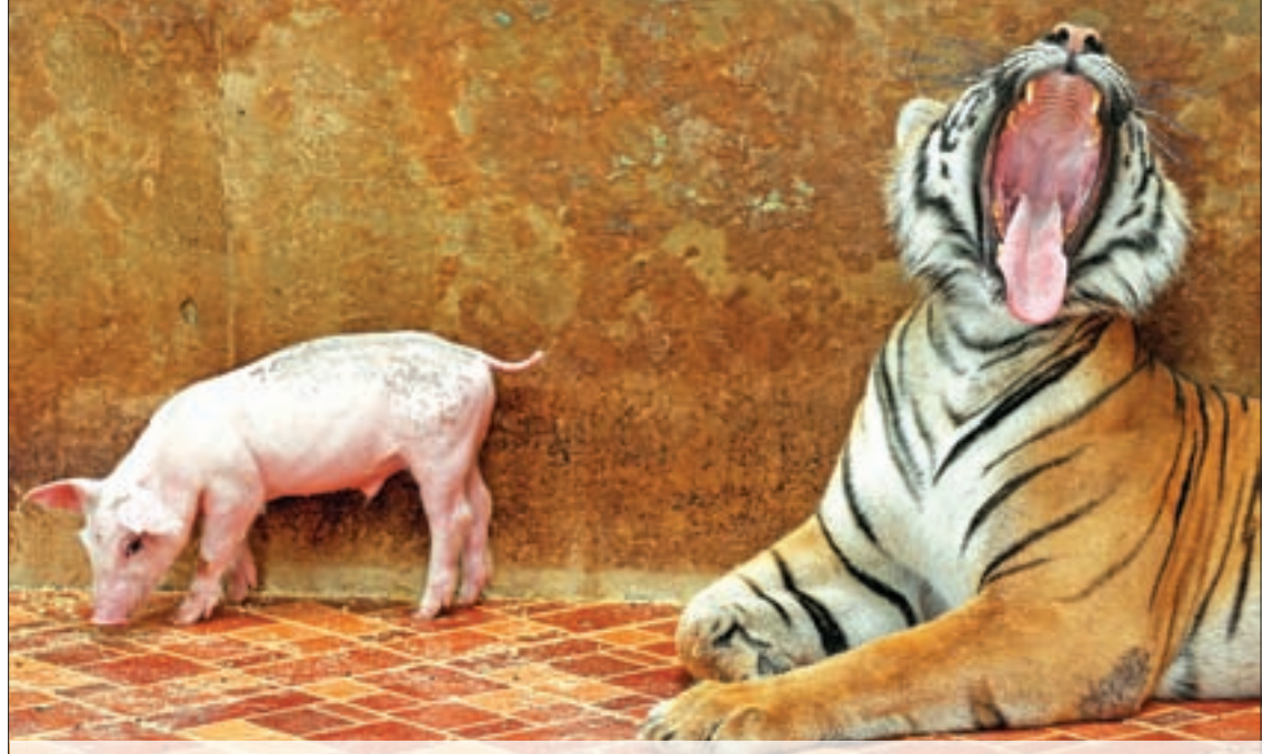
A tiger yawns next to a piglet at the Sriracha Tiger Zoo, in Chonburi province, Thailand, on 7 June 2016.

The authorities have filed complaints against 22 people, including six monks, whom police will investigate for illegal posses-