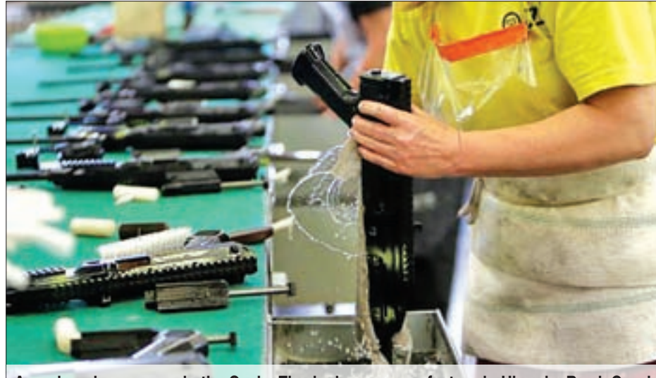
A worker cleans a gun in the Ceska Zbrojovka weapons factory in Uhersky Brod, Czech Republic, on 27 May 2016.

Since the attack on Charlie Hebdo magazine in January 2015 by men armed with Kalashnikov assault rifles apparently bought in central Europe, France has pushed for a crackdown. It redoubled its efforts after