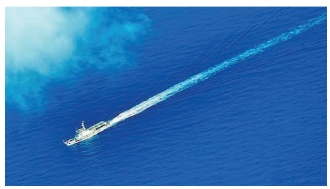
An aerial photo taken on 25 September, 2015 from a seaplane of Hainan Maritime Safety Administration shows cruise vessel Haixun 1103 heading to the Yacheng 13-1 drilling rig during a patrol in south China Sea.

Printed and published at the Global New Light of Myanmar Printing Factory at No.150, Nga Htat Kyee Pagoda Road, Bahan Township, Yangon, by the Global New Light of Myanmar Daily under Printing Permit No. 00510 and Publishing Permit No. 00629.