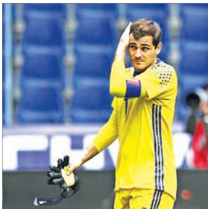
Spain's Iker Casillas. PHOTO: REUTERS

Asked if he thinks he will start at Euro 2016, Casillas said, "That is a question for Del Bosque."—Reuters