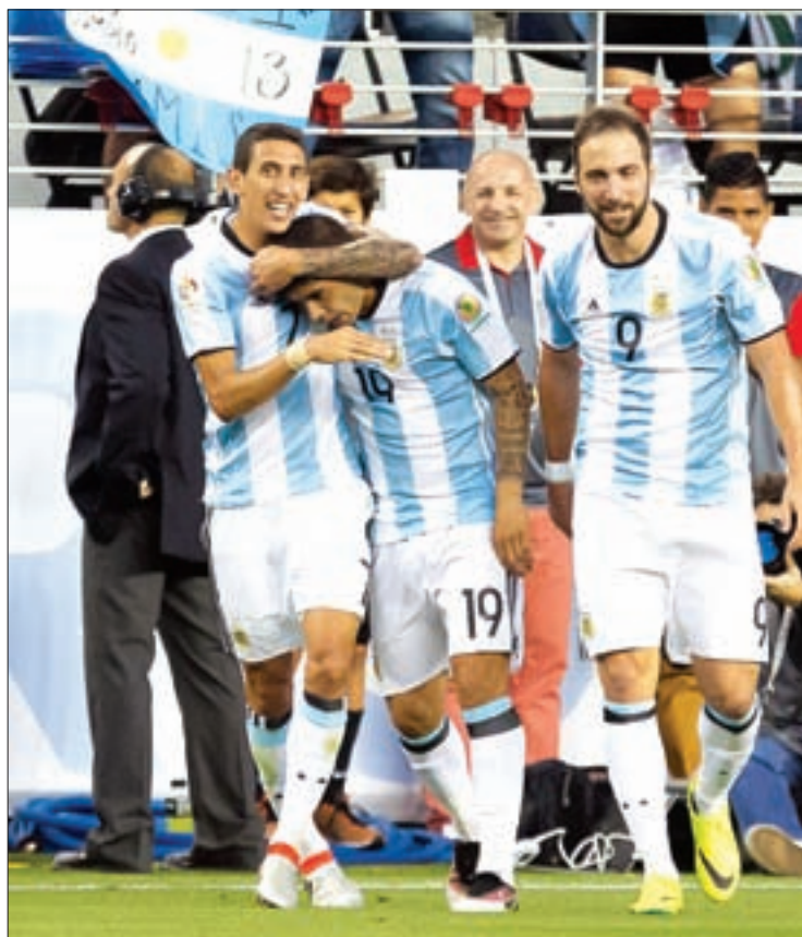
Argentina midfielder Ever Banega (19) celebrates with midfielder Angel Di Maria (7) after scoring a goal against Chile during the group play stage of the 2016 Copa America Centenario at Levi's Stadium, Santa Clara, CA, USA on 6 June.