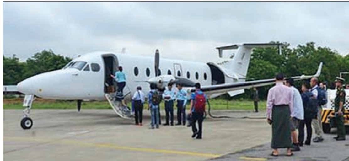
Passengers boarding the Aircraft.

FOR the convenience of government servants as well as local staff and families of Tatmadawmen who are assigned to Coco Island, Myanmar, the Tatmadaw has been arranging for the transport of passengers and