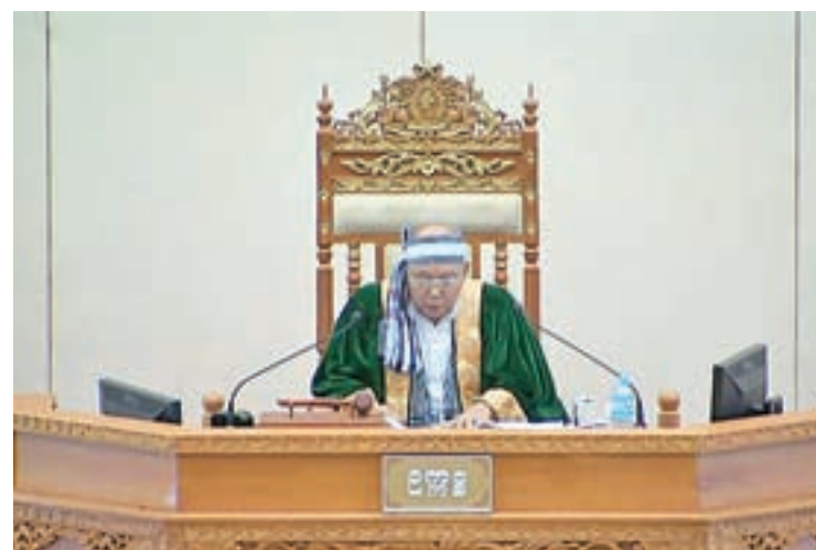
Amyotha Hluttaw Speaker Mahn Win Khaing Than.

organized crimes in connection with human trafficking. The deputy minister said that coordination and cooperation with Interpol is sought as well as with the police forces and embassies of the countries concerned through the Ministry of Foreign Affairs in the fight against transnational organized crimes in general and trafficking in persons in particular. —Myanmar News Agency