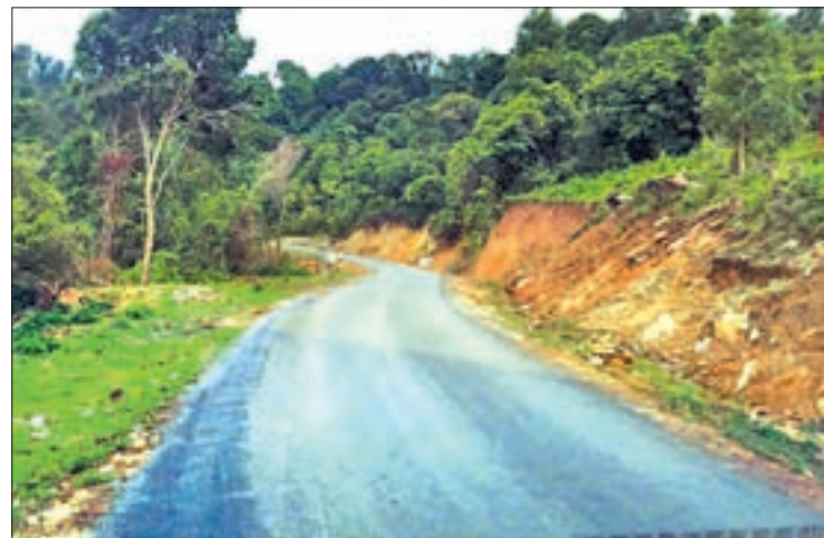
A section of Namkham-Lashio Road.