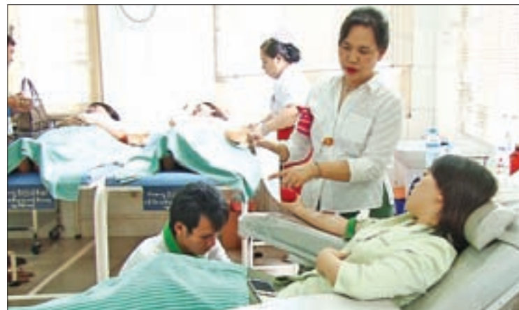
The chairperson and members of Brighter Future Myanmar Foundation donate blood in Yangon on 7th June, 2016.

The foundation's first donation was held in Yangon and Mandalay in November and December last year, with more than 900 participants including members of the foundation and employees of KBZ bank branches in the two cities. —GNLM