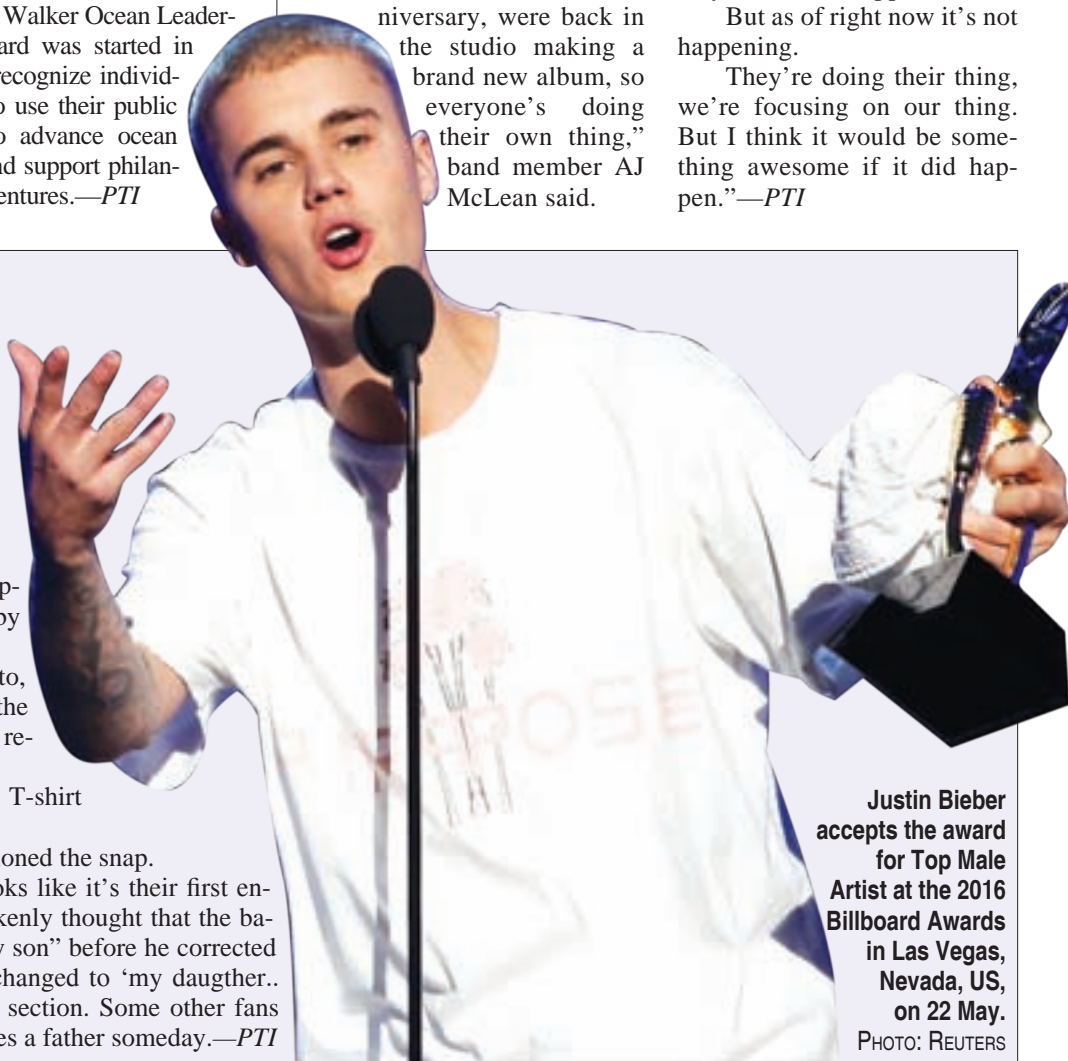
Justin Bieber accepts the award for Top Male Artist at the 2016 Billboard Awards in Las Vegas, Nevada, US, on 22 May.

It's not clear who the girl is, but it looks like it's their first encounter. One fan noticed that Bieber mistakenly thought that the baby's a boy. He initially called the baby "my son" before he corrected it. "He wrote first 'my son...jk' and then changed to 'my daughter..jk,'" "one fan commented in the comment section. Some other fans wondered how it would be if Bieber becomes a father someday.