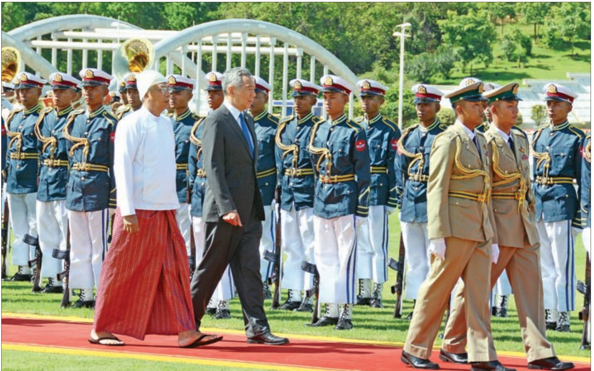
President U Htin Kyaw and Singaporean Prime Minister Mr. Lee Hsien Loong inspect the Guard of Honour at the Presidential Palace in Nay Pyi Taw.