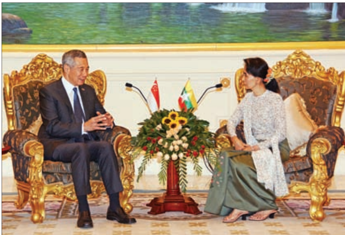
State Counsellor Daw Aung San Suu Kyi receives Mr. Lee Hsien Loong in Nay Pyi Taw.

After the ceremony both representatives witnessed the exchange of notes between the Minister of State for Foreign Affairs U Kyaw Tin and Singaporean Ambassador to Myanmar Mr. Robert Chua on the granting of a visa exemption to each other's citizens holding ordinary passports for a stay of 30 days. —Myanmar News Agency