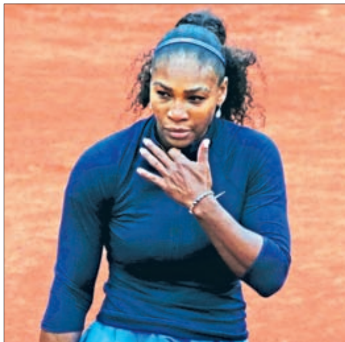
Serena Williams.

American mixed martial arts standout Ronda Rousey shot up to third on the list at $14 million from eighth place and $6.5 million, just ahead of compatriot and NASCAR driver Danica Patrick, who earned $13.9 million, according to www.forbes.com. The rest of the women's top 10 were also tennis players.—Reuters