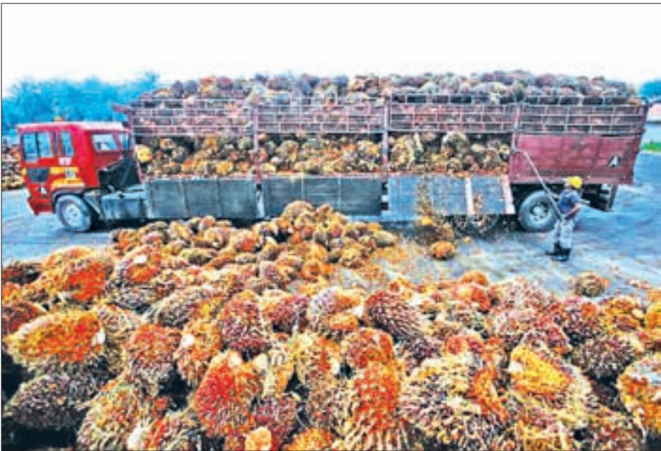
A worker unloads palm oil fruits from a lorry inside a palm oil factory in Salak Tinggi, outside Kuala Lumpur on 4 August, 2014.

and candy makers. The suspension of IOI’s green credentials caused Nestle, Unilever, Mars and Kellogg to drop IOI Group as a supplier. In response, IOI filed a lawsuit against the RSPO in Zurich, where RSPO is based, saying the move had “caused significant disruption” to its business in Europe and America. IOI withdrew the suit on Monday in the face of a barrage of criticism from its customers and activists, and announced it was voluntarily adopting a more stringent certification system the RSPO is putting in place by the end of the year. “Since the filing of the challenge proceeding, IOI has engaged with many of our stakeholders such as customers, NGOs and RSPO to resolve this matter,” IOI said in a statement. How the plantation firm and its overseer got into this situation may hold lessons for other companies in sensitive industries that are working with environmentalists to prevent deforestation and an increase in greenhouse gases, which most scientists say contribute to global warming. “This is a call to all indus-