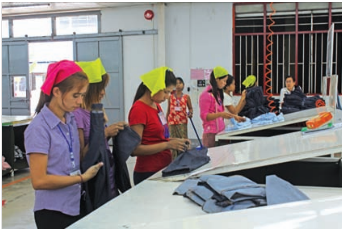
Workers at a garment factory in Hlaingthaya Industrial Zone, Yangon.

U Tun Tun Win said the construction of the road that connects Moo Dong Village and Myeik is 70 per cent completed. He said he expects the road to facilitate better trade between the two areas upon completion. Aside from trade and investment, the road will play an important role in the development of the travel and tours sector.— PPN/Union Daily