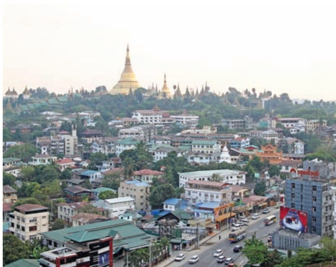
The real estate market in Yangon is stable and cool.

"The realty market will become active only when a large number of foreign direct investors enter the Myanmar housing market. We can do nothing but turn to renting. Still, there are not many clients to rent our flats and apartments," said Daw Myat Mo Mo, MD of Phoenix Lan, a real estate agency.