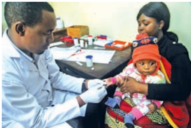
A doctor tests a child for malaria at the Ithani-Asheri Hospital in Arusha, Tanzania, on 11 May.

"If we continue with the interventions that we have been doing here relentlessly, we should