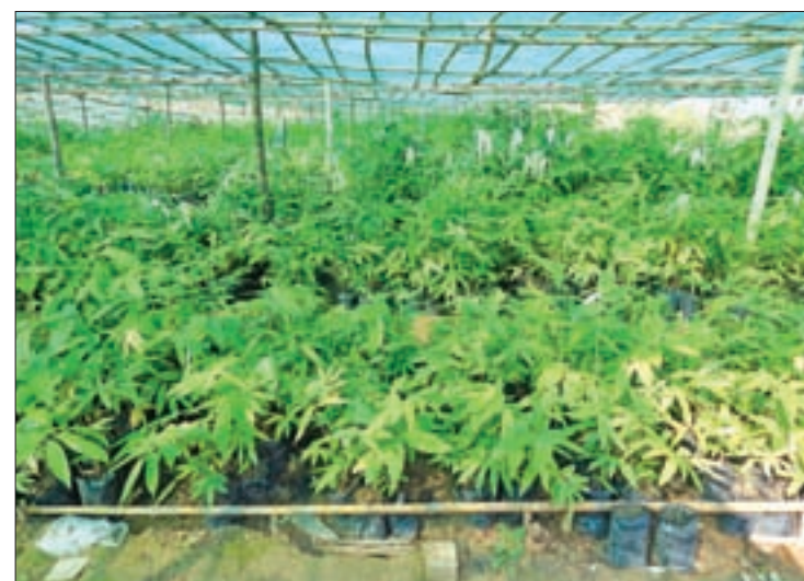
Bamboo saplings being seen at a nursery.

Several discussions have been made between Shwe Zanaka Co and the Myanmar Bamboo Lovers Network to discuss matters relating to establishment of the centre, said its chairwoman. Mon State is suitable for bamboo planting than other destinations. This is the reason why the network chose the state to implement its project.—200