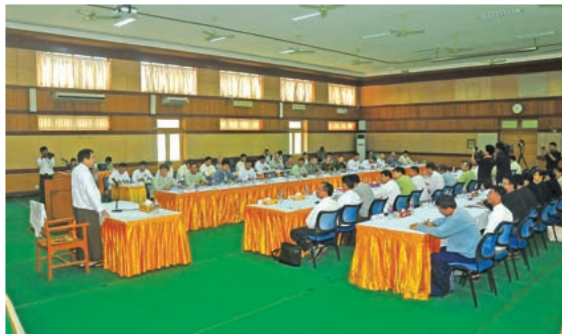
Union Minister for Information Dr Pe Myint delivers a speech at a workshop on media relations for ministerial spokespersons.

The workshop continues today. —Myanmar News Agency