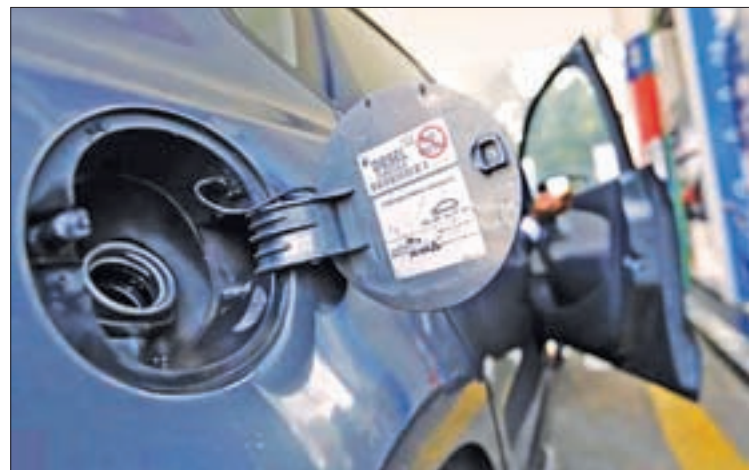
A vehicle waits to be filled up with diesel at a petrol station in New Delhi, India, on 5 January, 2016.

NEW DELHI — India's state refiners may halt diesel imports after working out a temporary mechanism to resume buying the fuel from private processors if