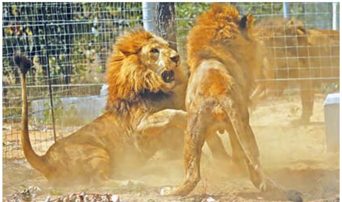
Some of the 33 lions rescued from circuses in Peru and Columbia are seen as they fight after being released at their final destination at the Emoya Big Cat Sanctuary, outside Vaalwater in South Africa's northern Limpopo Province, on 1 May, 2016.

The lions would not survive in the African wild as many have been declawed or have had teeth smashed or removed. One is almost blind and another is missing an eye. Four of the rescued lions recently required treatment at a veterinary hospital after exhibiting symptoms of botulism, according to ADI. Two have recovered and have been returned to the sanctuary.— Reuters