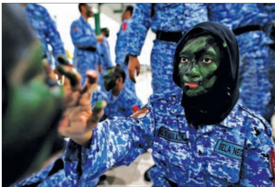
A female participant of the Bela Negara - 'defend the nation' - programme applies camouflage face paint on another participant's face at a training centre in Rumpin, Bogor, West Java, Indonesia on 2 June, 2016.

The concept of defending the nation in this way has