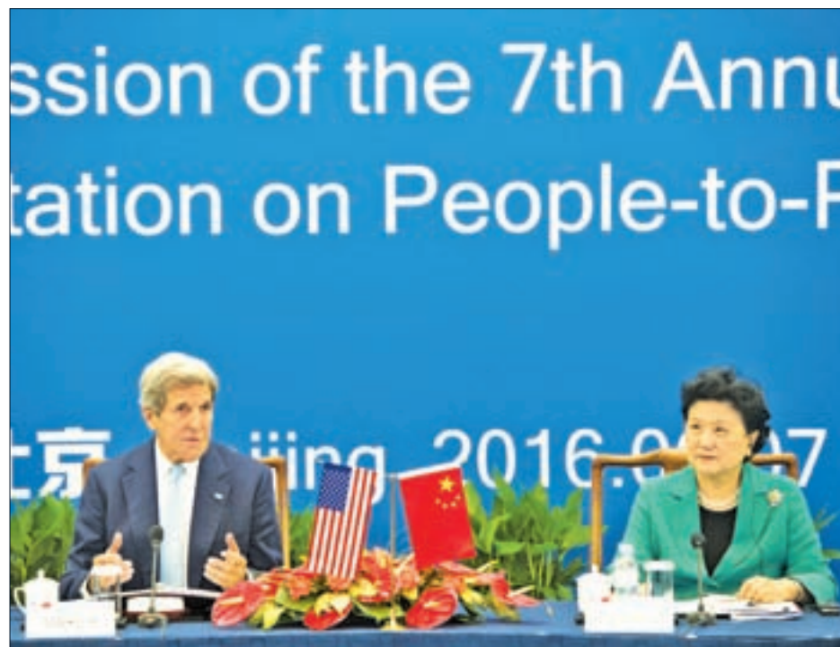
US Secretary of State John Kerry and Chinese Vice Premier Liu Yandong attend the US — China High Level Consultation on People to People Exchange at the National Museum in Beijing, on 7 June, 2016.

"China respects and protects the right that all countries enjoy under international law to freedom of