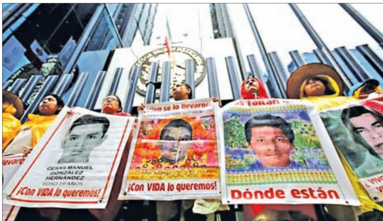
Relatives hold posters with images of some of the 43 missing students of Ayotzinapa College Raul Isidro Burgos as they protest to demand justice for the missing students, outside the Attorney General's Office (PGR) headquarters in Mexico City, during a march to mark the 20-month anniversary of their disappearance on 26 May 2016.

Consistent human rights abuses — including those committed by members of the Zetas drug car-