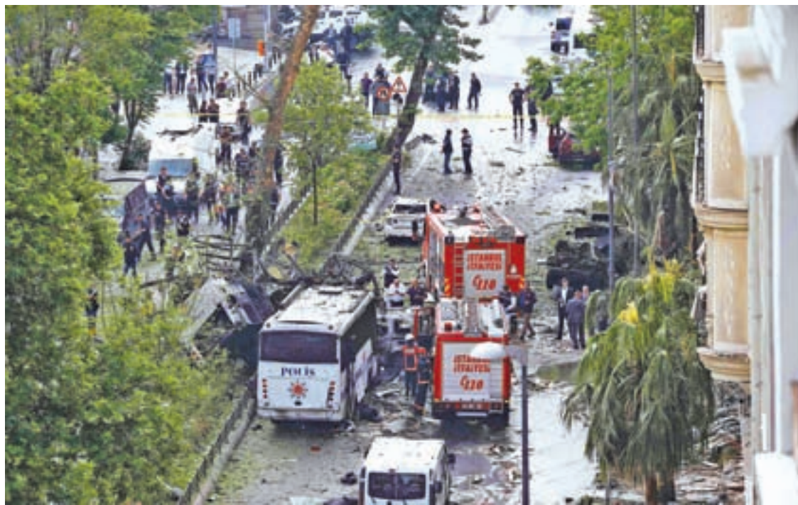
Fire engines stand beside a Turkish oplice bus which awas targeted in a bomb attack in a central Istanbul district, Turkey, on 7 June.

The blast hit the Vezneciler District, between the headquarters of the local municipality and the campus of Istanbul University, not far from the city's historic