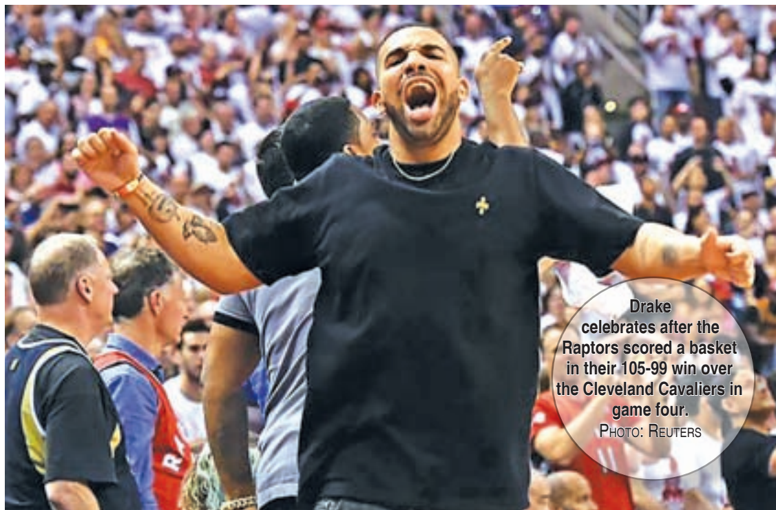
Drake celebrates after the Raptors scored a basket in their 105-99 win over the Cleveland Cavaliers in game four.