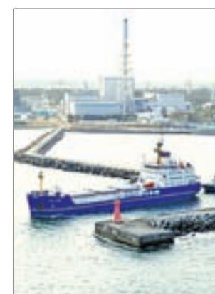
File photo taken in March 2016 shows the Pacific Egret transport vessel leaving a port in Tokaimura, northeast of Tokyo, for the United States with large amounts of plutonium and other nuclear materials aboard.

The plutonium material recovered from Japan