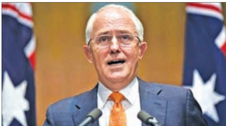
Australian Prime Minister Malcolm Turnbull speaks to the media during a news conference at Parliament House in Canberra, Australia, 8 May, 2016 after asking Australia's Governor-General Peter Cosgrove to dissolve both Houses of Parliament to call a double dissolution election for 2 July, 2016.

Emergency services were due to resume a search early Tuesday for a swimmer who