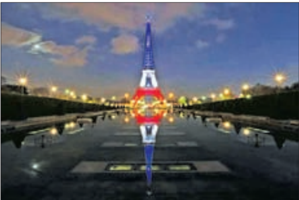
The Eiffel Tower lit with the blue, white and red colours of the French flag is reflected in the Trocadero fountains in Paris, France, on 23 November 2015, a week after a series of deadly attacks in the French capital.