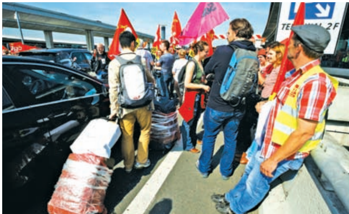
Passengers walk past striking employees of Roissy airport during a demonstration against the labour reforms law at the Charles de Gaulle International Airport in Roissy, near Paris, France, on 7 June.