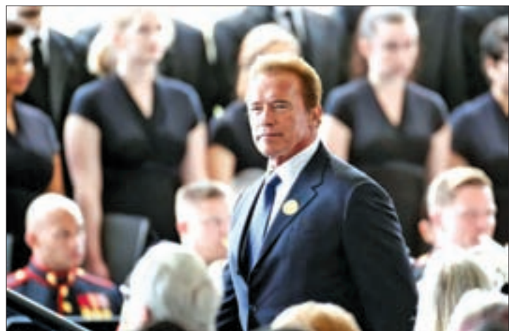
Former California Governor Arnold Schwarzenegger arrives for the funeral of Nancy Reagan at the Ronald Reagan Presidential Library in Simi Valley, California, United States, on 11 March 2016.