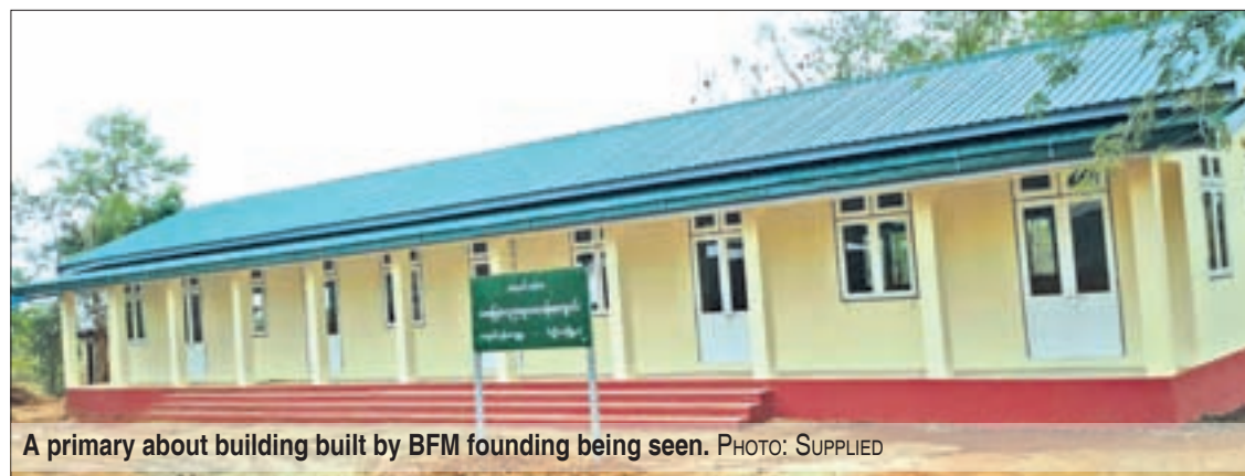
A primary school building built by BFM funding being seen.

THE KBZ Brighter Future Myanmar foundation (BFM) handed over a new school building and water tank to a primary school in Meiktila Township on Wednesday.