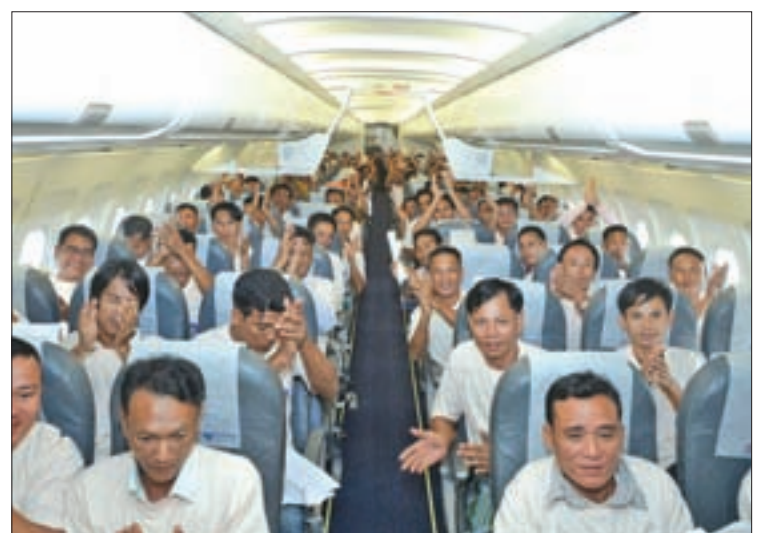
Fishermen are seen on the chartered flight on their way back home.

So far, a total of 262, in two batches, have been brought home as they finished serving their prison terms in India for illegally entering the country's territorial waters.