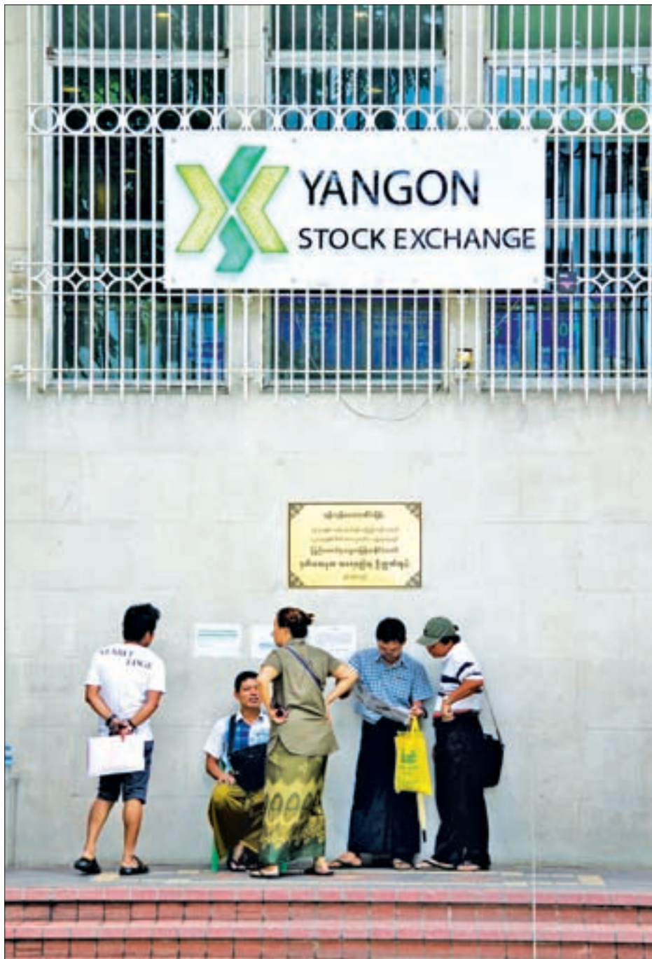
Visitors are seen outside Yangon Stock Exchange (YSX) in Yangon.

The shares currently being sold at the YSX have attracted the attention of more investors than expected. Thus, other companies that have been approved to be listed on the YSX have begun preparing for share trading.— NG/Union Daily