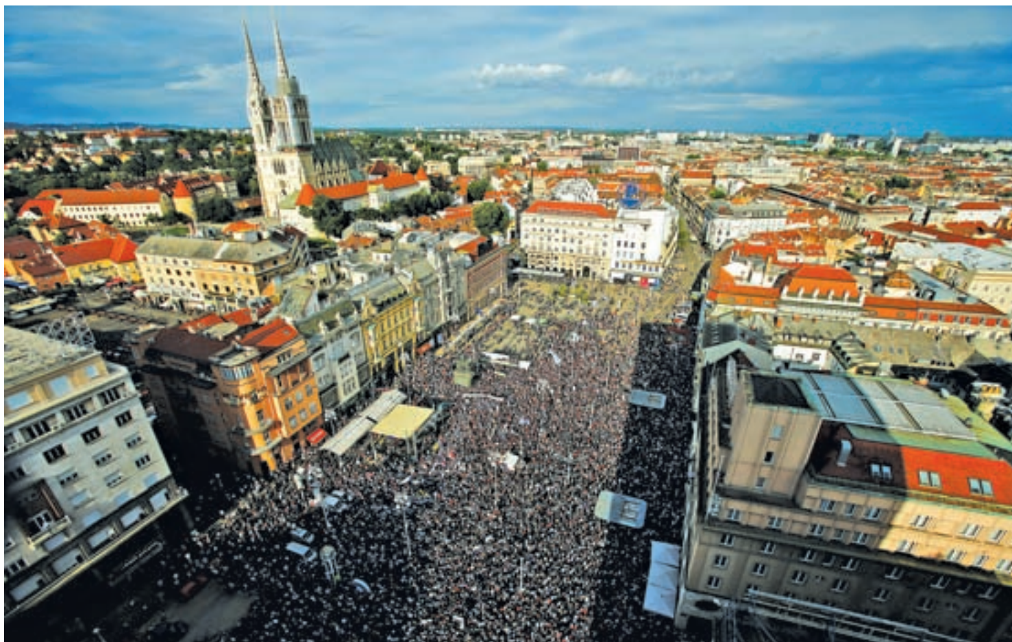
People take part in a protest 'Croatia can do better', against what the demonstrators say is political influence on education reform, on Zagreb's main square, Croatia, on 1 June 2016.

Earlier this week, three people were killed in floods in the southwestern German state of Baden-Wuerttemberg and a young girl was killed by a train as she took shelter from the rain under a railway bridge.— Reuters