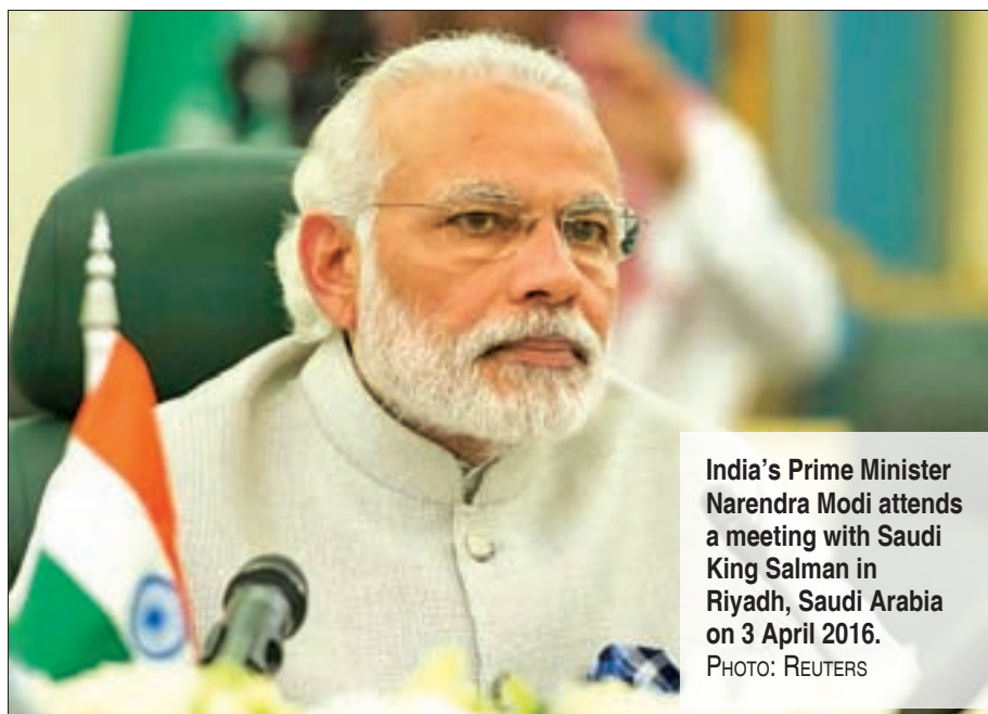
India's Prime Minister Narendra Modi attends a meeting with Saudi King Salman in Riyadh, Saudi Arabia on 3 April 2016.

WASHINGTON — Toshiba Corp's Westinghouse Electric and India are in "advanced discussions" for the company to build six nuclear reactors there, the country's ambassador to the United States said on Wednesday, ahead of Indian Prime Minister Narendra Modi's planned visit to Washington next week.