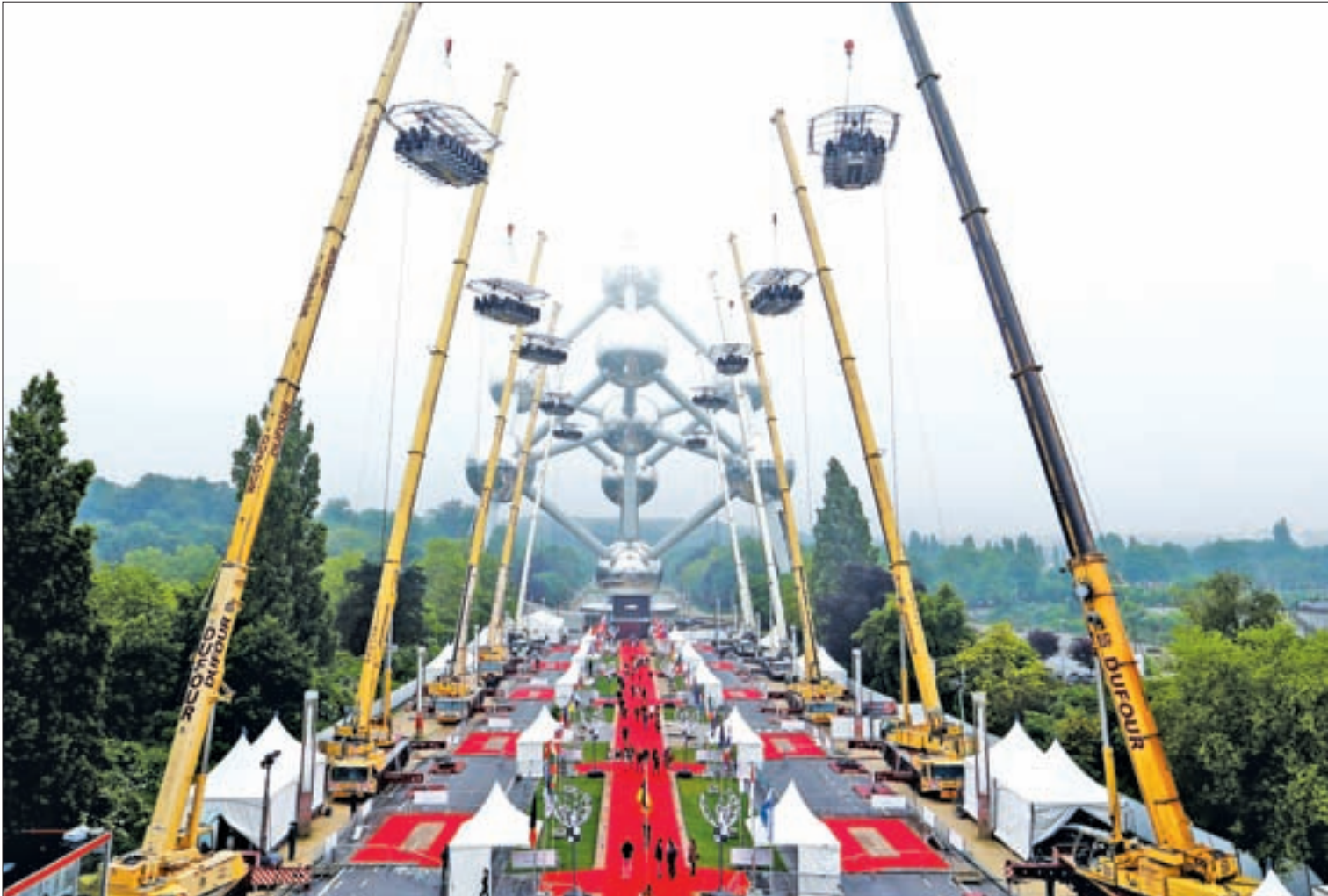
Ten tables, accommodating a total of 220 guests, are suspended from cranes at a height of 40 metres in front of the Atomium, a 102-metre (335 feet) high structure and its nine spheres, built for the 1958 Brussels World's Fair, as part of the 10 th anniversary of the event known as “Dinner in the Sky”, in Brussels, Belgium, on 1 June 2016.