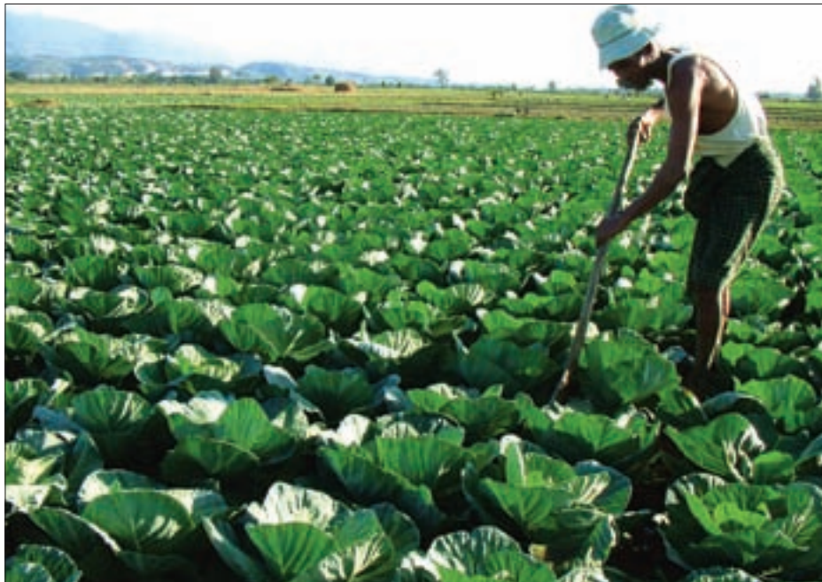
A farmer works in cabbage farm.

The objectives of the scheme are to provide insurance coverage to growers in the event of natural calamities and to help stabilise farm incomes, particularly in disaster years. The scheme also aims to protect farmers against the losses of their crops due to natural disasters.—200