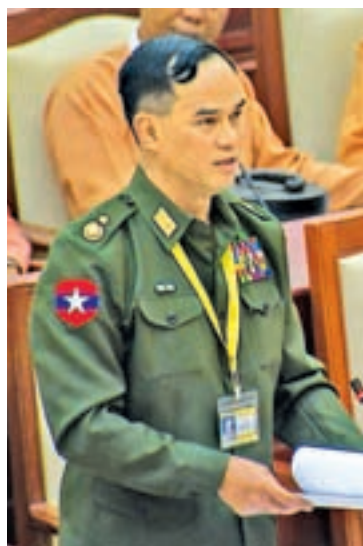
Union Deputy Minister Maj-Gen Aung Soe.