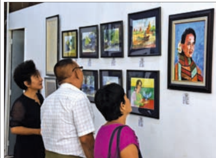
Paintings by Fine Arts School alumni. PHOTO: HTAY AUNG

Works of different medium like water colour, oil and acrylic are being displayed. — Htay Aung