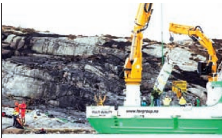
A helicopter has crashed west of the Norwegian city of Bergen with 13 people on board. A rescue vessel lifts up parts of the helicopter.

EASA said it was planning to issue another safety directive on