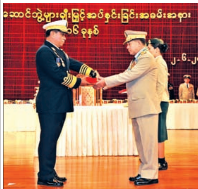
Senior General Min Aung Hlaing conferred the title of ‘Zeya Kyaw Htin’ on a senior military official at the honorary title presentation ceremony.

The title of Zeya Kyaw Htin is a title denoting outstanding performance in the military. The government announced a list of the title recipients with the release of Notification No (24/2016) on 1 March, 2016. The Commander-in-Chief also presented honorary titles and medals to Tatmadawmen on 4 January. — Myanmar News Agency