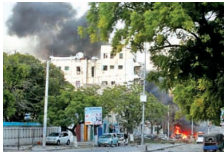
A general view shows the scene of a suicide car bombing outside Hotel Ambassador on Maka Al Mukaram Road in Somalia's capital Mogadishu, on 1 June, 2016.

One of the three dead fighters drove the car that rammed the hotel while the others stormed the hotel, al Shabaab said.— Reuters