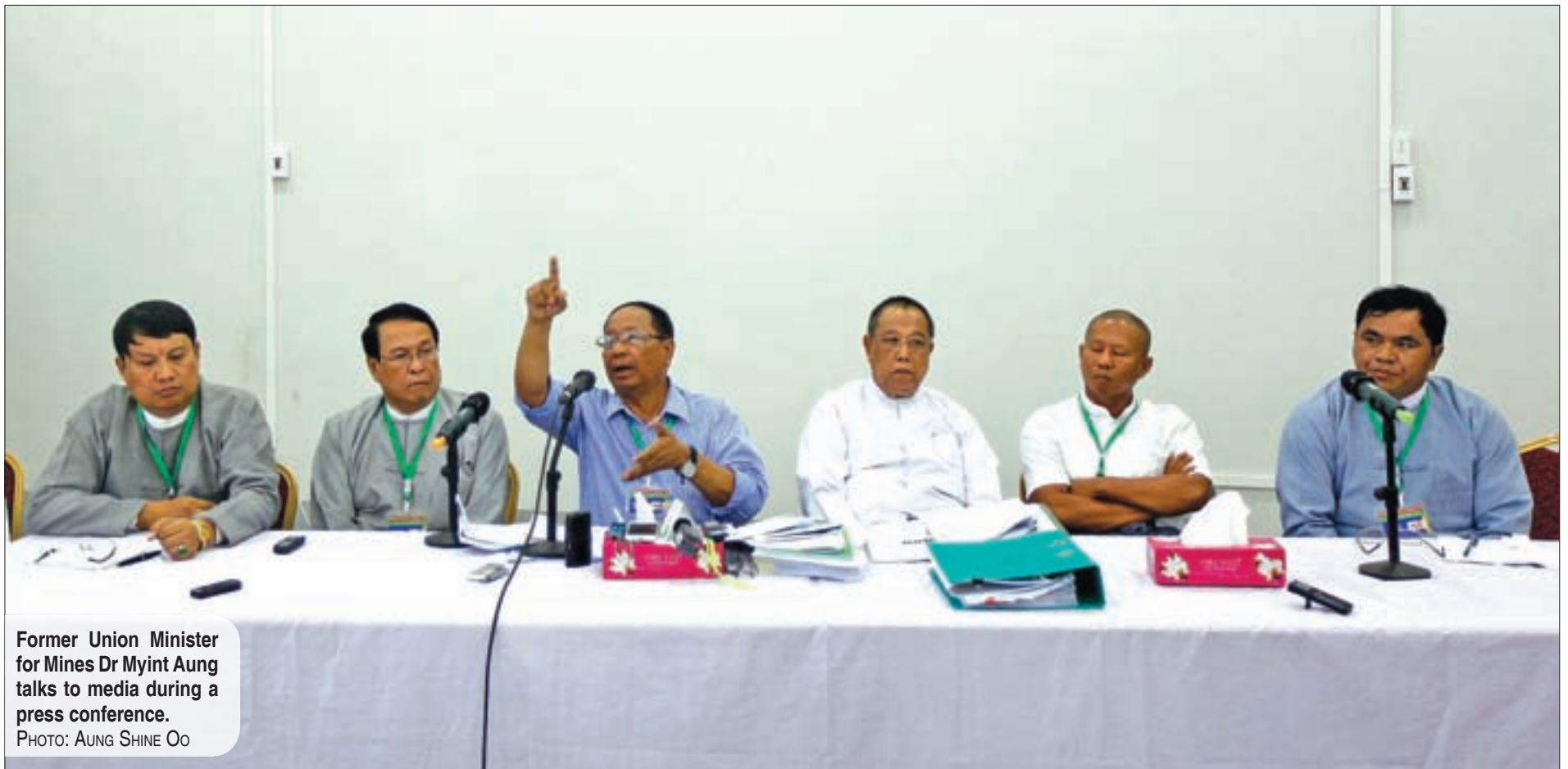
Former Union Minister for Mines Dr Myint Aung talks to media during a press conference.

Former cabinet members to retaliate against embezzlement accusations