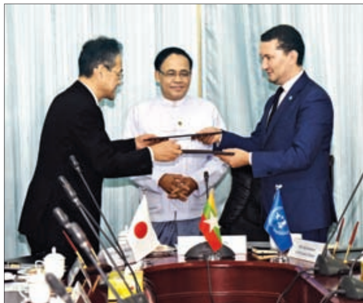
MoU on Improvement of Rule of Law Centres Project being exchanged.