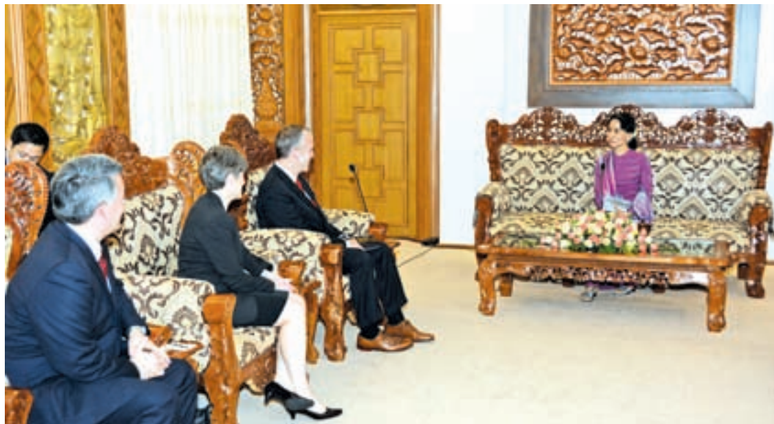
Union Minister for Foreign Affairs Daw Aung San Suu Kyi receives US Senator Mr. Daniel Sullivan.

UNION Minister for Foreign Affairs Daw Aung San Suu Kyi held talks with US Senator Mr. Daniel Sullivan on matters related to US Congress's develop-