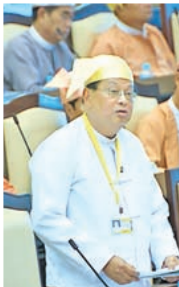
Union Minister U Win Khaing.

ARRANGEMENTS are being made to stop logging completely across the country during this fiscal year, the Amyotha Hluttaw was told during its 35th day session yesterday.