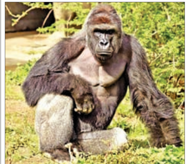
Harambe, a 17-year-old gorilla at the Cincinnati Zoo is pictured in this undated handout photo provided by Cincinnati Zoo. PHOTO: REUTERS