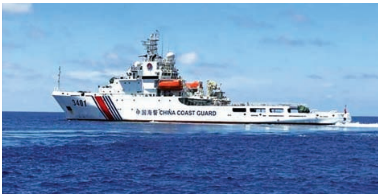
A Chinese Coast Guard vessel is pictured on the disputed Second Thomas Shoal, part of the Spratly Islands, in the South China Sea, on 29 March 2014.

China's top diplomat, State Councillor Yang Jiechi, will take this up