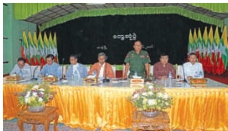
Union Minister for Border Affairs Lt-Gen Ye Aung speaks at the meeting with local authorities in Thandwe.

During their tour of Thandwe, Union ministers held talks with officials concerned and local people, clarifying matters to be undertaken by the subcommittees concerned to ensure peace, stability and development in Rakhine State.— Myanmar News Agency