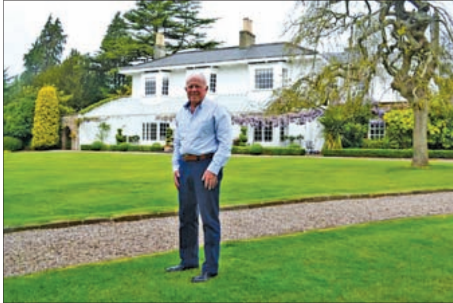
Peter Hargreaves, the co-founder of stockbroker Hargreaves Lansdown, poses at his home near Bristol, Britain, on 19 May 2016.

He is also at odds with Prime Minister David Cameron, the finance minister George Osborne and Bank of England head Mark Carney, all of whom argue Britain is better off inside the EU. "Let's give due weight