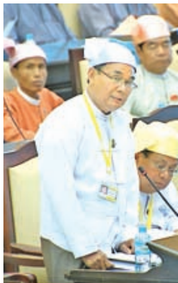
Union Minister U Ohn Win.