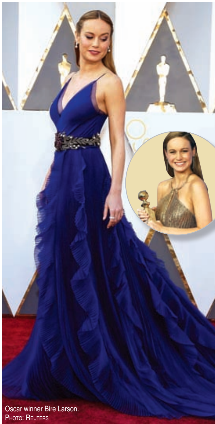
Oscar winner Brie Larson.

"She also paid for 20 friends on a week-long hen do in Ibiza last year — renting out a 2 million pounds villa. She's even paid off one mate's mortgage and bought another of her oldest friends a 60,000 pounds car when hers got written off.— PTI