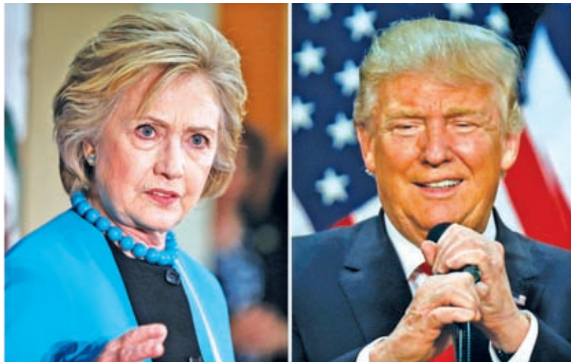
A combination photo shows US Democratic presidential candidate Hillary Clinton (L) and Republican US presidential candidate Donald Trump (R) in Los Angeles, California on 5 May, 2016 and in Eugene, Oregon, US on 6 May, 2016 respectively.

WASHINGTON — Democratic presidential front-runner Hillary Clinton will slam Republican Donald Trump for being too friendly with North Korea and too harsh on European allies during a foreign policy speech in California on Thursday, designed to paint the billionaire businessman as unfit for the White House.