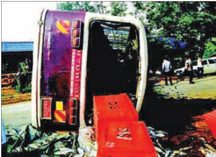
The passenger bus being seen overturned.

The car turned over between mileposts 8/4 and 8/5. The accident killed two women on the spot while 18 out of 22 total passengers were seriously injured. The injured were rushed to Ann Township General Hospital. The driver and conductor have been charged by police.— Township IPRD