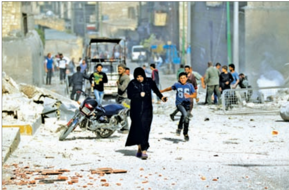
A woman runs holding a walkie-talkie towards a damaged site after an airstrike on the rebel-controlled area of Maaret al-Numan town in Idlib Province, Syria, on 31 May 2016.

The operation will also count on air power from the US-led coalition, which pounded Islamic State positions near Manbij with 18 strikes on Tuesday, including six militant tactical units, two headquarters facilities and a