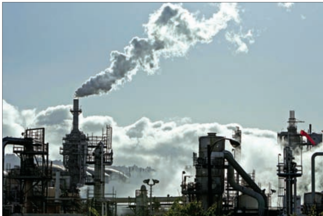
Smoke is released into the sky at a refinery in Wilmington in 2012.

The study found that for every 5 microgrammes per cubic metre higher concentration of PM2.5, or 35 parts per billion higher concentration of oxides of nitrogen, individuals had a 4 Agatston units/year faster rate of progression of coronary artery calcium scores.— PTI