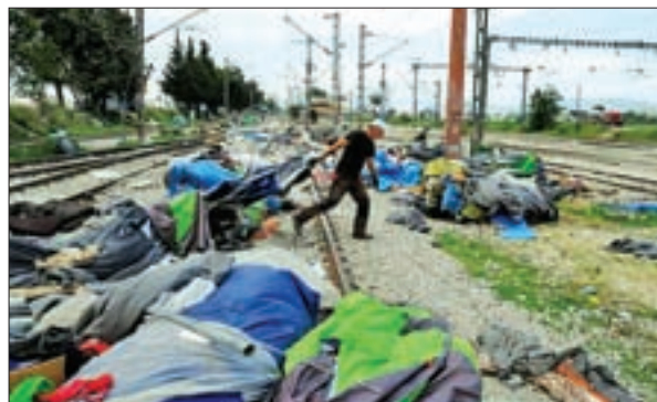
A worker removes tents used by migrants during a police operation to evacuate a migrants' makeshift camp at the Greek-Macedonian border near the village of Idomeni, Greece, on 26 May 2016.

"We urge the Greek authorities, with the financial support provided by the European Union, to find better alternatives quickly," UNHCR spokeswoman Melissa Fleming told a briefing.