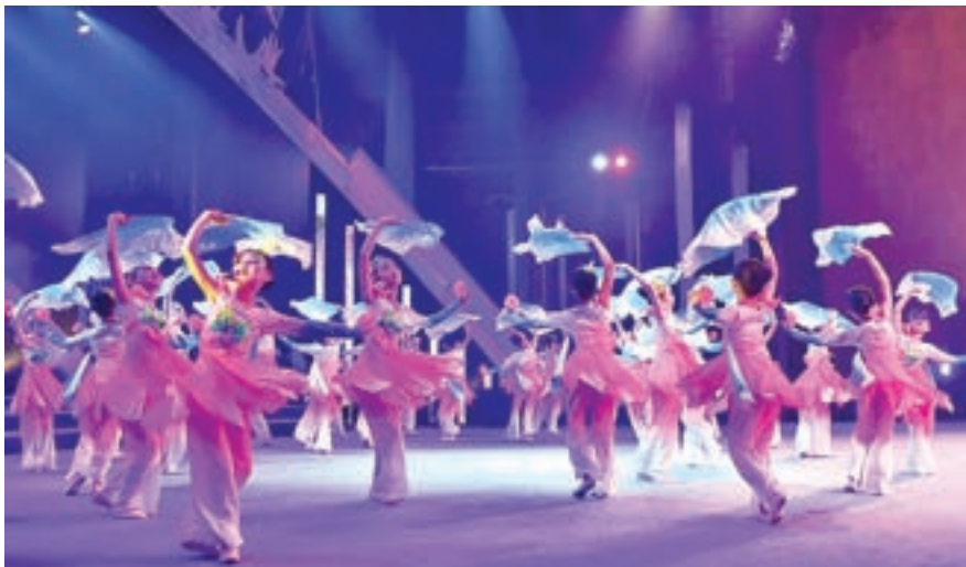
BEIJING — Students perform folk dance during a performance to celebrate the upcoming International Children's Day in Beijing, capital of China, on 27 May 2016.