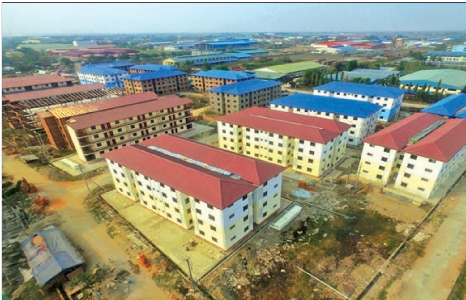
About 2,000 affordable rental apartments would emerge in the vicinity of industrial zones in Yangon.

tlements - such as the opening of liquor bars - to make themselves scarce in a timely manner, security and administration sectors will be ramped up in a bid to mitigate unexpected anarchical behaviour from arising during the surveying of squatter settlements, while submissions will be made to Union Government to allow for an increase in legal action to be taken, should it be deemed necessary.— Myitmakha News Agency