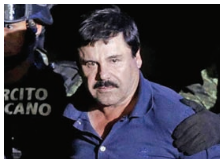
Recaptured drug lord Joaquin "El Chapo" Guzman is escorted by soldiers at the hangar belonging to the office of the Attorney General in Mexico City, Mexico, on 8 January 2016.

Mexico's Foreign Ministry approved Guzman's extradition to the United States earlier in May, and said it had received guarantees that the death penalty would not be sought against