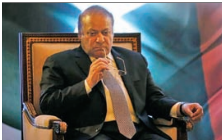
Pakistani Prime Minister Nawaz Sharif looks on during a lecture on Sri Lanka-Pakistan Relations in Colombo, Sri Lanka on 5 January, 2016.

Dawn newspaper quoted Defence Minister Khawaja Asif as saying Sharif would be hospitalised for a week after the surgery and would return to Pakistan when his doctors allowed it.