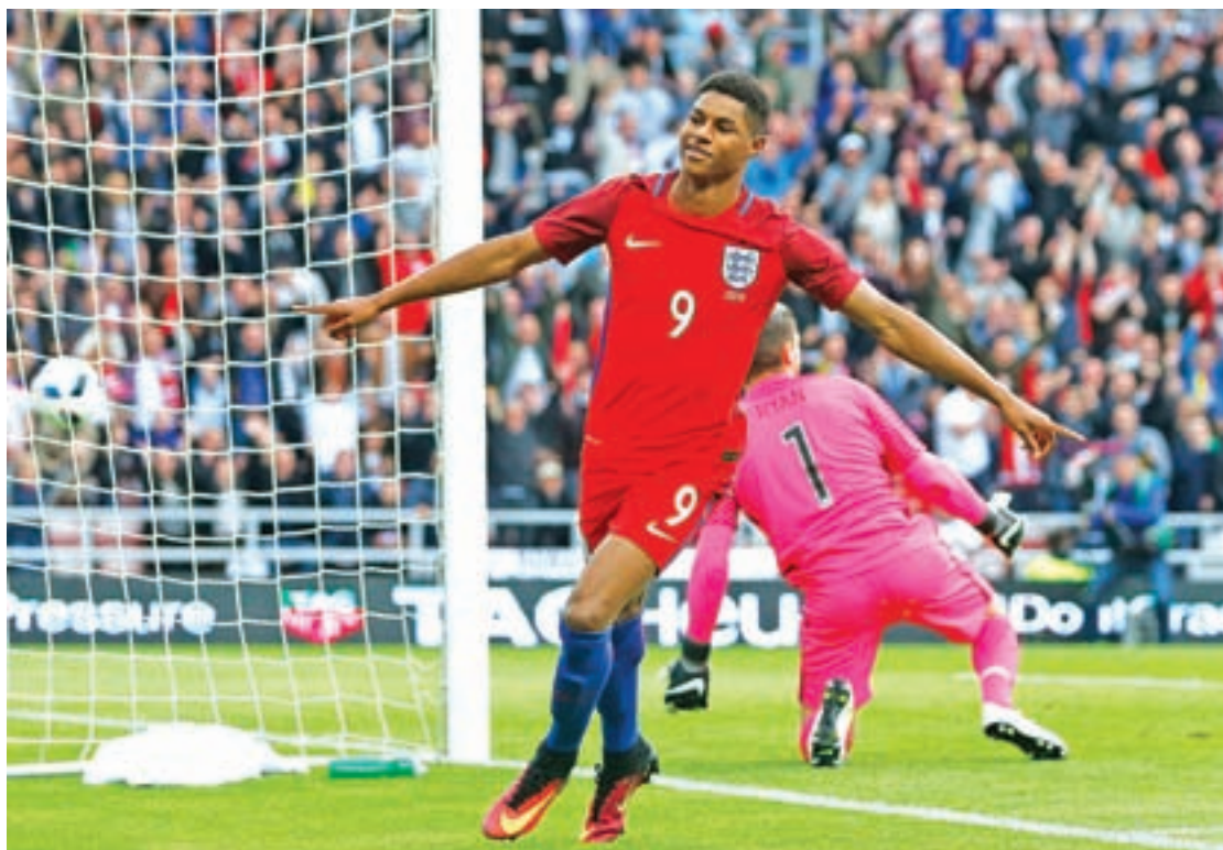
Marcus Rashford celebrates after scoring the first goal for England during International Friendly at Stadium of Light, Sunderland, on 27 May 2016.

Rooney scored a record-extending 52 nd goal for his country with a fine strike 10 minutes after the break.—Reuters