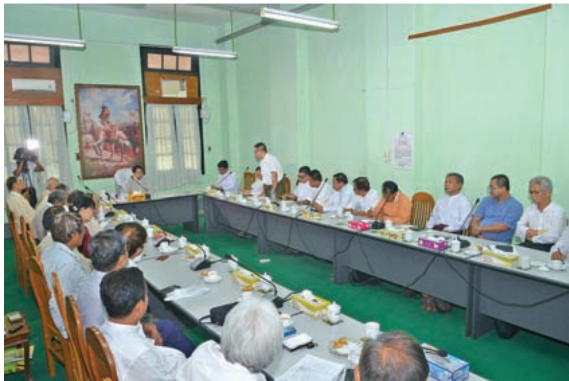
Union Minister Dr Pe Myint and officials discuss ways to organize political literature reading.

A COORDINATION meeting took place at the Printing and Publishing Department in Yangon yesterday to discuss ways to organise a political literature reading.