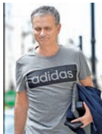
Jose Mourinho walks towards his house in London, Britain, on 27 May 2016.

LONDON — Jose Mourinho will forget what has gone on for the last three disappointing seasons at Manchester United, he said in his first interview after being installed as manager on Friday.