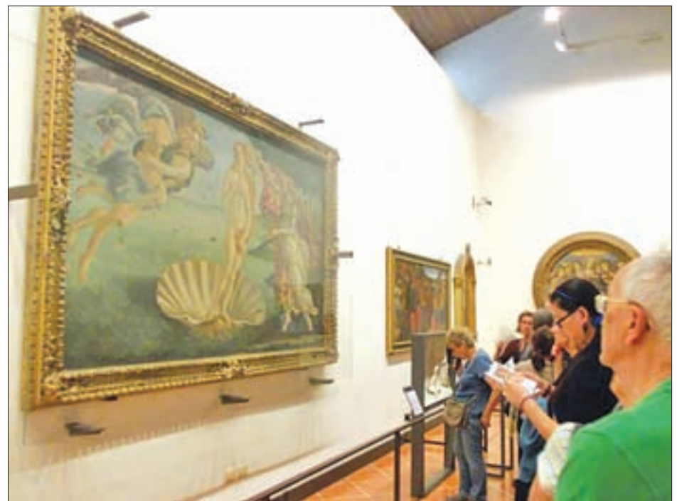
Visitors look the painting "The Birth of Venus", 1486, by Sandro Botticelli at the Uffizi Gallery Museum in Florence in 2014.

Last year, authorities in the capital Rome cracked down on the armies of people who hawk sightseeing tours, rickshaw rides, and photos with centurions around the Colosseum amphitheatre, prompting protests.—Reuters