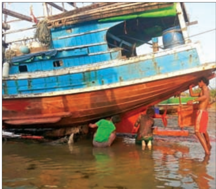
Workers repair a fishing boat in Kawthoung.