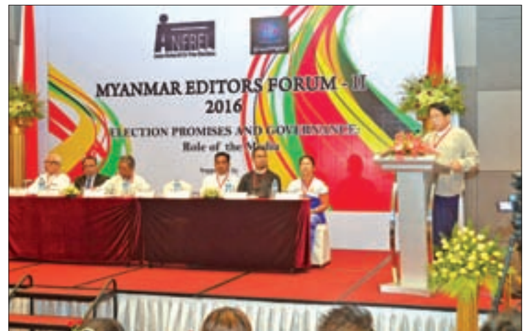
Union Minister for Information Dr Pe Myint delivers address at Myanmar Editors Forum in Yangon.

the government's 100-day plan and analyse what went wrong with the plan. "Now all the ministries have spokespersons you (journalists) are able to contact them for information when you want and evaluate how well they can respond to your queries," Dr Pe Myint said.