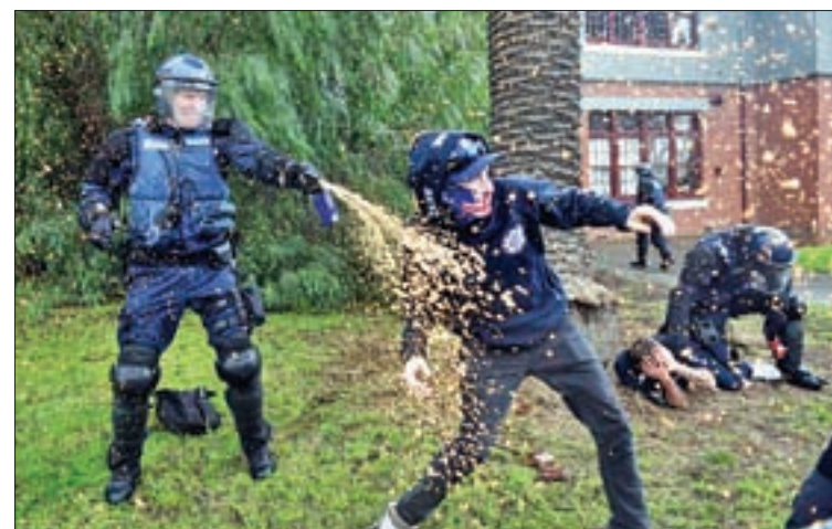
A policeman deploys capsicum spray towards a protester during clashes in the Melbourne suburb of Coburg, Australia, on 28 May 2016.

ABC said two people were arrested for weapons offences before the trouble flared despite a large police presence.—Reuters