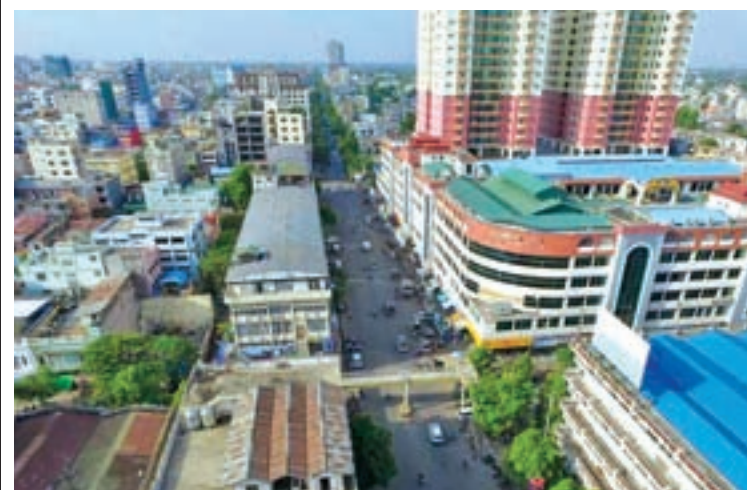
Mandalay is facing air pollution at night.

Mandalay has a population of more than 1.2 million population density increasing.— Aung Thant Khaing