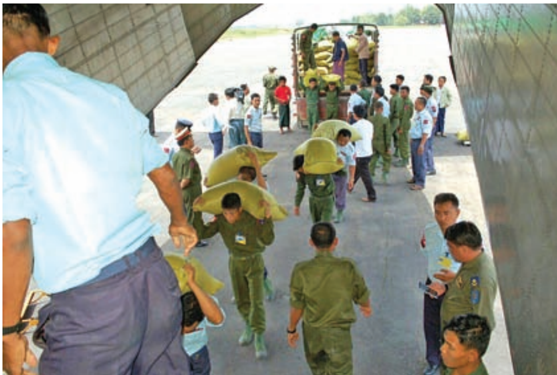
Tatmadawmen loading sacks of rice onto the aircraft. PHOTO: OFFICE OF THE COMMANDER IN CHIEF OF DEFENCE SERVICES

The rice is being delivered from Myitkyina to Putao with the use of Tatmadaw aircraft and from Putao to Metgayza village by land via Khaunglanphu.—Office of the Commander in Chief of Defence Services