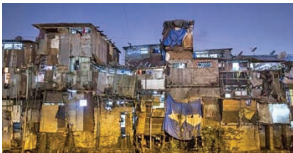
Windows of various shanties in Dharavi, one of Asia's largest slums, are seen in Mumbai on 28 January 2015.

The girls are building apps they hope will be used