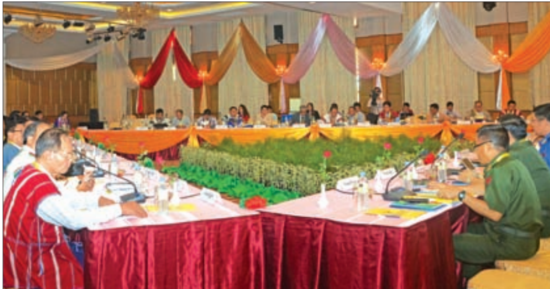
Participants discuss at Union Peace Dialogue Joint Committee (UPDJC) meeting.

The 21st Century Panglong conference will be convened based on the Nationwide Cease-fire Agreement (NCA), said State