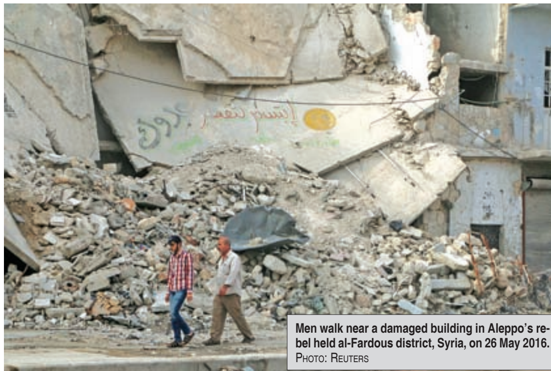
Men walk near a damaged building in Aleppo's rebel held al-Fardous district, Syria, on 26 May 2016.

The British-based Syrian Observatory for Human Rights said Friday's advance was the biggest by IS in Aleppo province for two years. It brought the jihadists to within 5 km (3 miles) of Azaz, a town near the border with Turkey through which insurgents have been supplied.