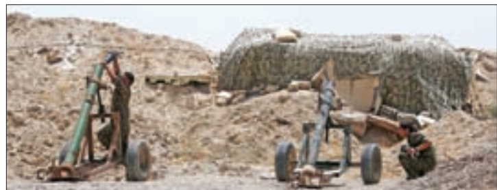
Fighters of the Syria Democratic Forces prepare to fire a mortar shell towards positions held by Islamic State fighters in northern province of Raqqa, Syria on 27 May 2016.

Syrian UN Ambassador Bashar Ja'afari questioned the accuracy of O'Brien's claims and blamed the bulk of the violence against civilians in Syria on Islamic State and Nusra Front militants. O'Brien told the council he stood by his claims. US Ambassador Samantha Power said the complaints from Syria were ironic given that it is "a government that pulls infant formula off of convoys, (as well as) anaesthetics and surgical equipment." —Reuters