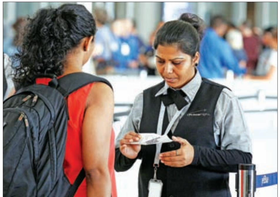
An airport private contractor prepares a passenger at a security checkpoint during the check-in process at JFK airport in the Queens borough of New York City, US, on 27 May 2016.

A US congressional panel heard this week that more than 70,000 American Airlines customers missed their flights this year and 40,000 checked bags failed to be loaded on scheduled flights because