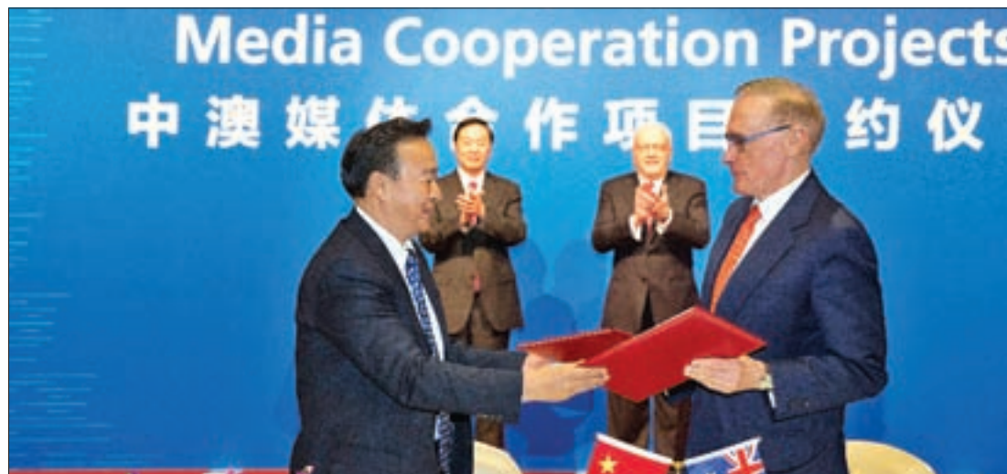
Representative of Chinese media and his Australian counterpart exchange a Memorandum of Understanding enabling greater information exchange after a signing ceremony for six China-Australia media cooperation agreements in Sydney, Australia, on 27 May 2016.