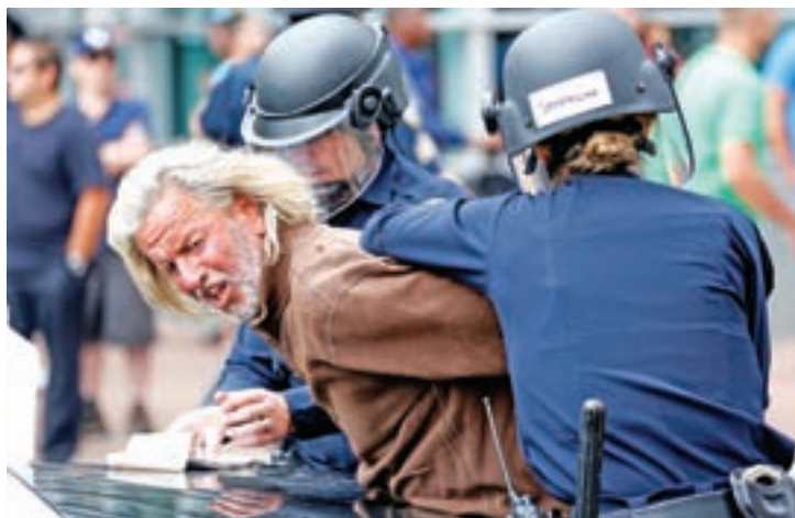
A man is arrested during a demonstration against Republican US presidential candidate Donald Trump outside his campaign event in San Diego, California, US, on 27 May 2016.

After the convention centre emptied, clusters of Trump supporters and anti-Trump demonstrators began to mix in the streets,