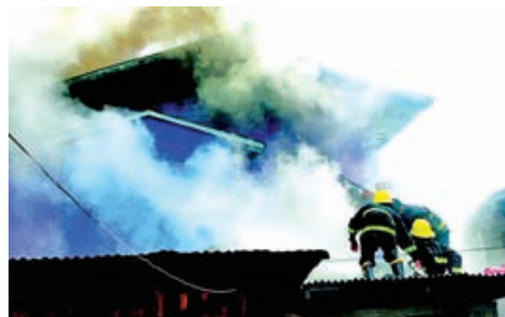
Firefighters extinguishing the blaze.