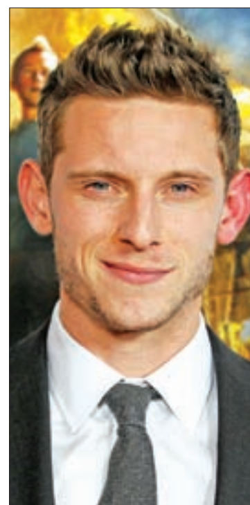
Actor Jamie Bell.

He is not the only one linked to the “Spectre” sequel. Idris Elba and Tom Hiddleston are among fans’ favourites while Gillian Anderson is campaigning to be the first female 007 Agent.—PTI