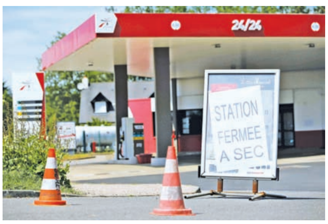
A placard which reads 'closed, dried up' is seen at a petrol station in Savenay, France, on 25 May.