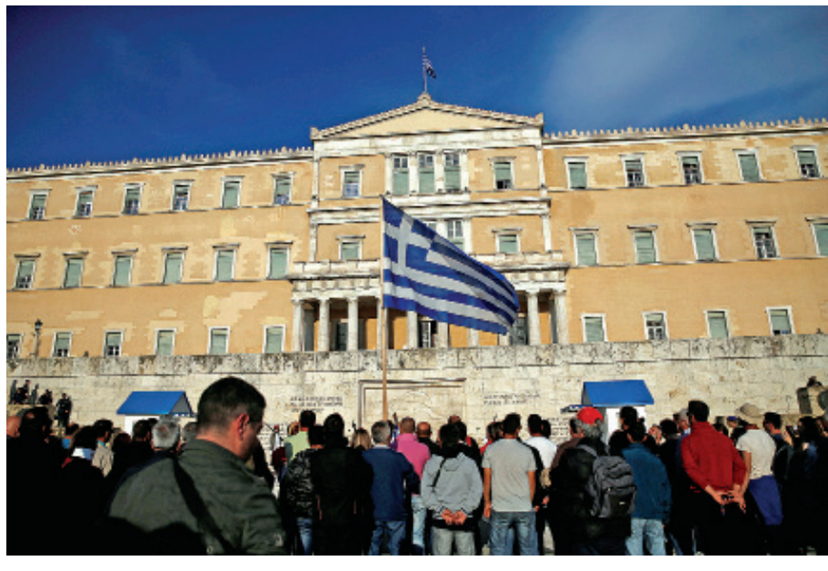
A protester waves a Greek flag during a demonstration outside the parliament building in central Athens, Greece where lawmakers were discussing controversial tax and pension reforms on 8 May.

But the bigger step forward was the debt relief deal because it provided investors with more certainty that their money in Greece