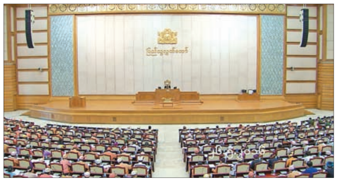
Pyithu Hluttaw is convened in Nay Pyi Taw.

Five bamboo bridges have been constructed in the areas as temporary replacements to ease