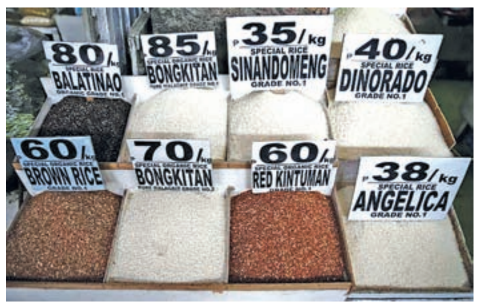
Different rice varieties are pictured at a food stall in the mountain resort of Baguio city in northern Philippines on 17 April, 2016.

"Now is the right time to import as prices are starting to trend up," said Bruce Tolentino, deputy director general for communication at the International Rice Research Insti-