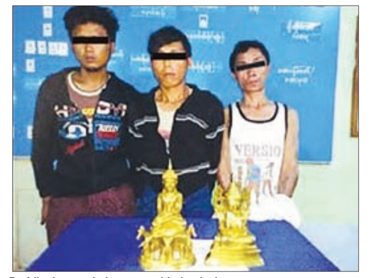
Buddha images being seen with the dealers. Photo: Thein Than (IPRD)

According to a connected investigation, the police searched the home of Tun Aung from Pan Maung village and seized two Buddha images. The police have taken action against them.— Thein Than (IPRD)