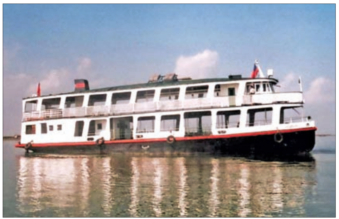
An old IWT vessel being seen cruising in the river.