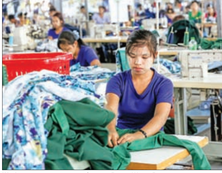
Workers seen at a garment factory.

Further telecommunications reforms and investment. Opening the telecommunications sector has helped attract foreign investment, and is connecting people and businesses through afforda-