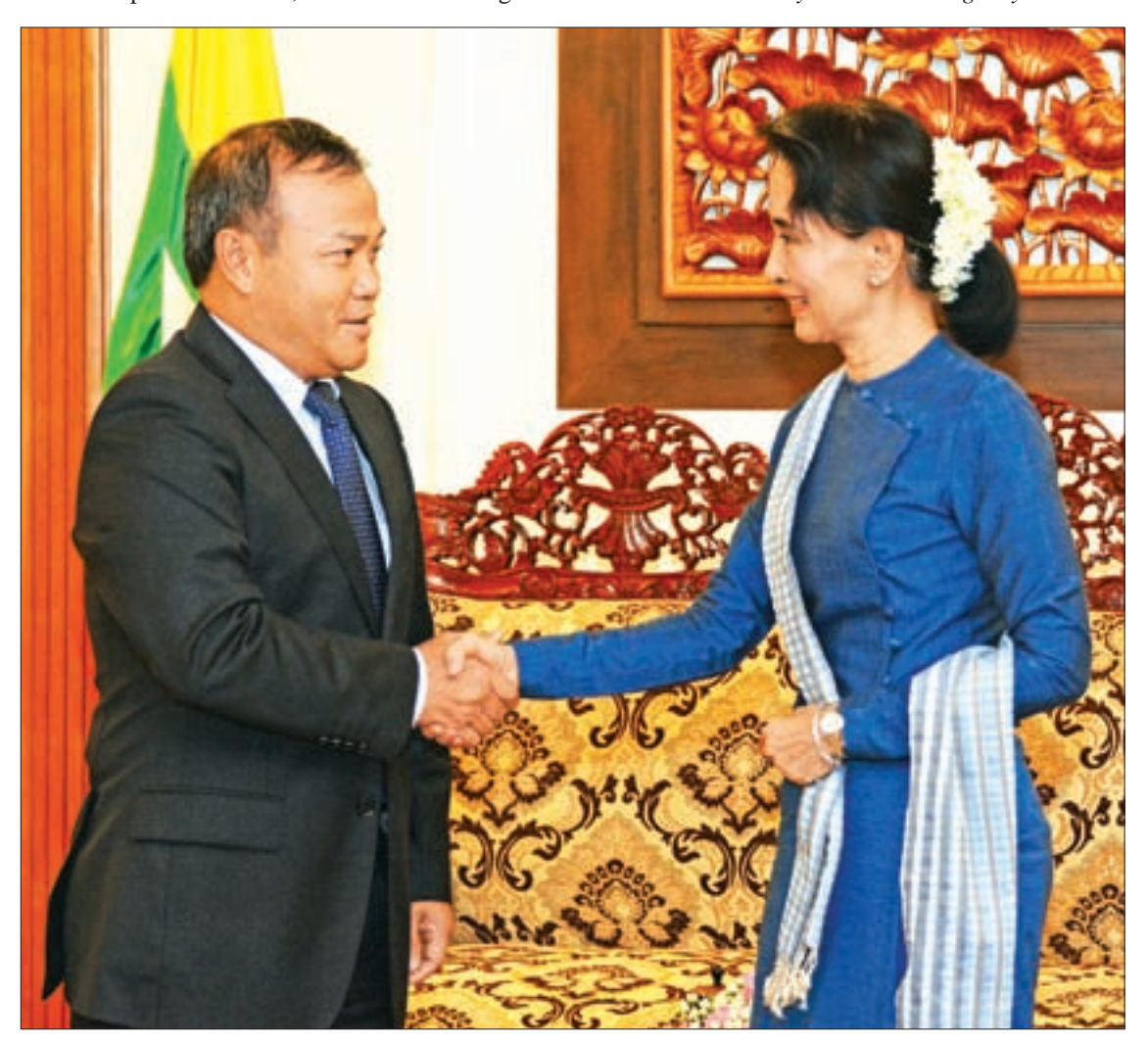
Union Minister for Foreign Affairs Daw Aung San Suu Kyi shakes hands with Mr. Vu Hong Nam, Deputy Minister of Foreign Affairs of Viet Nam.

ment and the hotels and tourism Pham Bình Minh to the Union minister to attend the 9th Myanmar-Viet Nam Joint Commission on bilateral cooperation scheduled to be held in Viet Nam.-Myanmar News Agency