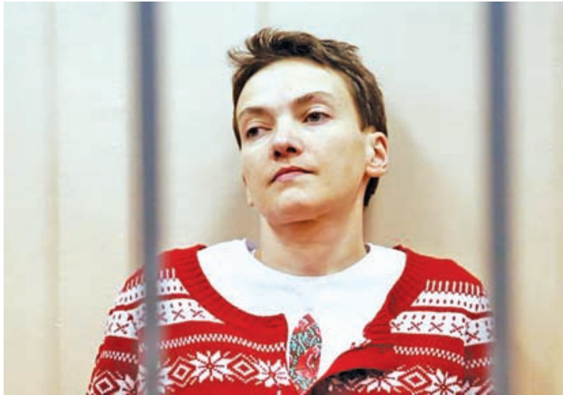
Ukrainian military pilot Nadezhda Savchenko looks out from a defendants' cage during a court hearing in Moscow, Russia, on 6 May, 2015.

MOSCOW — Ukrainian President Petro Poroshenko was flying to Russia on Wednesday to bring home detained Ukrainian servicewoman Nadiya Savchenko, in exchange for the release of two Russians held by Kiev, Russian media and a source close to the swap said.