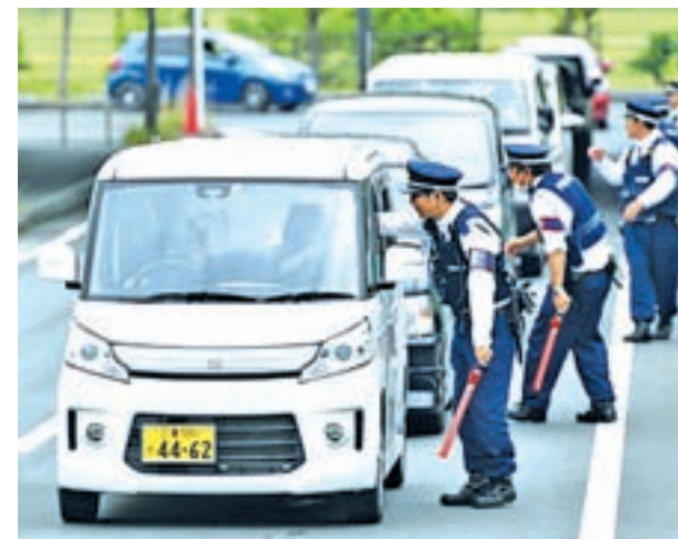
Police officers stop vehicles in the Japanese city of Ise on 25 May, 2016 near the international media center for the May 26-27 Group of Seven summit.

TOKYO — As Japanese authorities prepare for the two-day summit of Group of Seven leaders in central Japan from Thursday, travellers and commuters have begun to see a heightened level of vigilance in the capital with more uniformed officers on the streets and other security measures implemented.