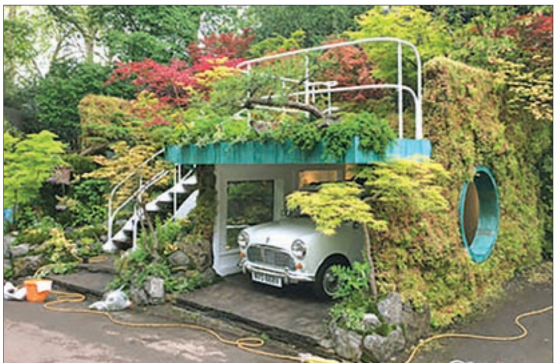
Supplied photo taken 21 May 2016, shows Japanese landscape artist Kazuyuki Ishihara's work, called "Senri-Sentei-Garage Garden." Ishihara won a gold medal at the Chelsea Flower Show in London on 24 May for his creation of the garden reflecting the changing of the seasons in Kyushu, southwestern Japan.