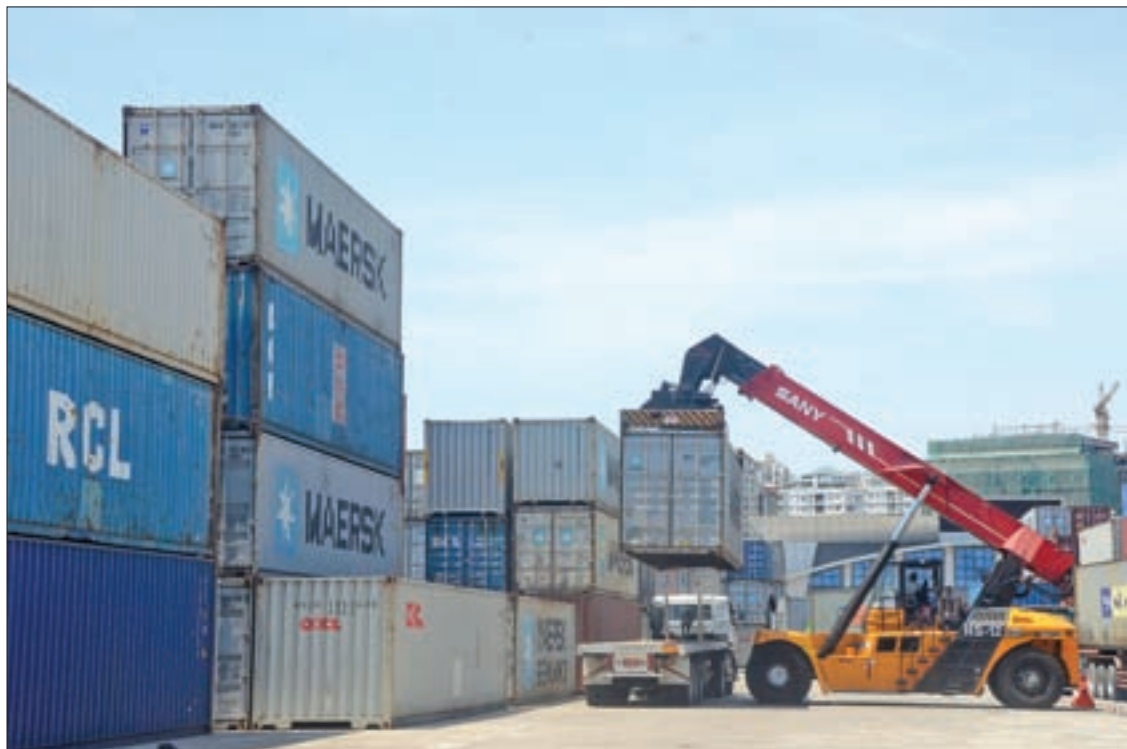
A container truck is being loaded at Asia World Port in Yangon.