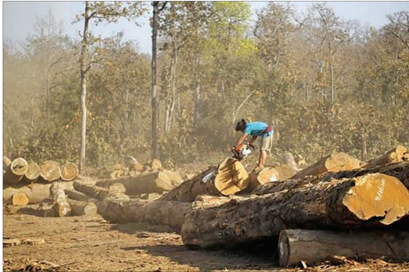
A man uses a chainsaw to cut teak logs in a logging camp in Pinlebu township, Sagaing, northern Myanmar, in this picture taken March 5, 2014.

The "industrialized" countries had already done enormous damage to our planet's environment in each of their attempt to supersede the other in industrial revolution and in terms of the size of economy. The same is happening in case of "young industrialized" economies and in case of the current "industrializing" economies.