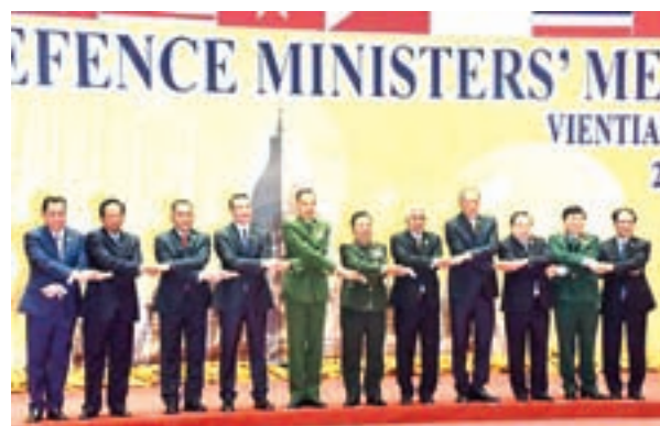
Defense ministers from the Association of Southeast Asian Nations pose for a commemorative photo in Vientiane on 25 May, 2016.

VIENTIANE — Issues relating to the South China Sea dispute were a highlight of the annual meeting of Association of Southeast Asian Nations’ defence ministers in the Lao-tian capital Vientiane on Wednesday, as China’s aggressive actions in pressing contested claims to territory in the water continues to raise tension in the region.