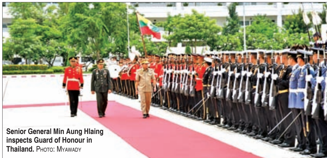
Senior General Min Aung Hlaing inspects Guard of Honour in Thailand.