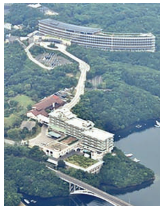
Photo taken on 25 May, 2016, from a Kyodo News helicopter shows Shima Kanko Hotel, the venue of the two-day summit of Group of Seven leaders from on 26 May, in the central Japan city of Shima.

Given uncertainties in the global economy, Abe has expressed eagerness to strike a G-7 accord on coordinated fiscal action to spur global demand. But due to Germany’s resistance to calls from Japan and the United States for boosting fiscal stimulus, the leaders are likely to settle on a vague agreement to use all policy tools — monetary, fiscal and structural — depending on conditions and resources in each country,