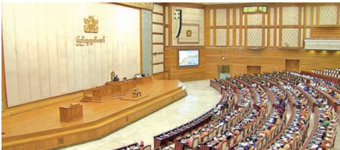
Pyithu Hluttaw is convened in Nay Pyi Taw.

He insisted that the 3,726-acre Wet Toe farmland was established by the government without confiscating any land from farmers. Regarding the conservation of Moegok lake, the deputy minister said that the lake's water storage capacity in-