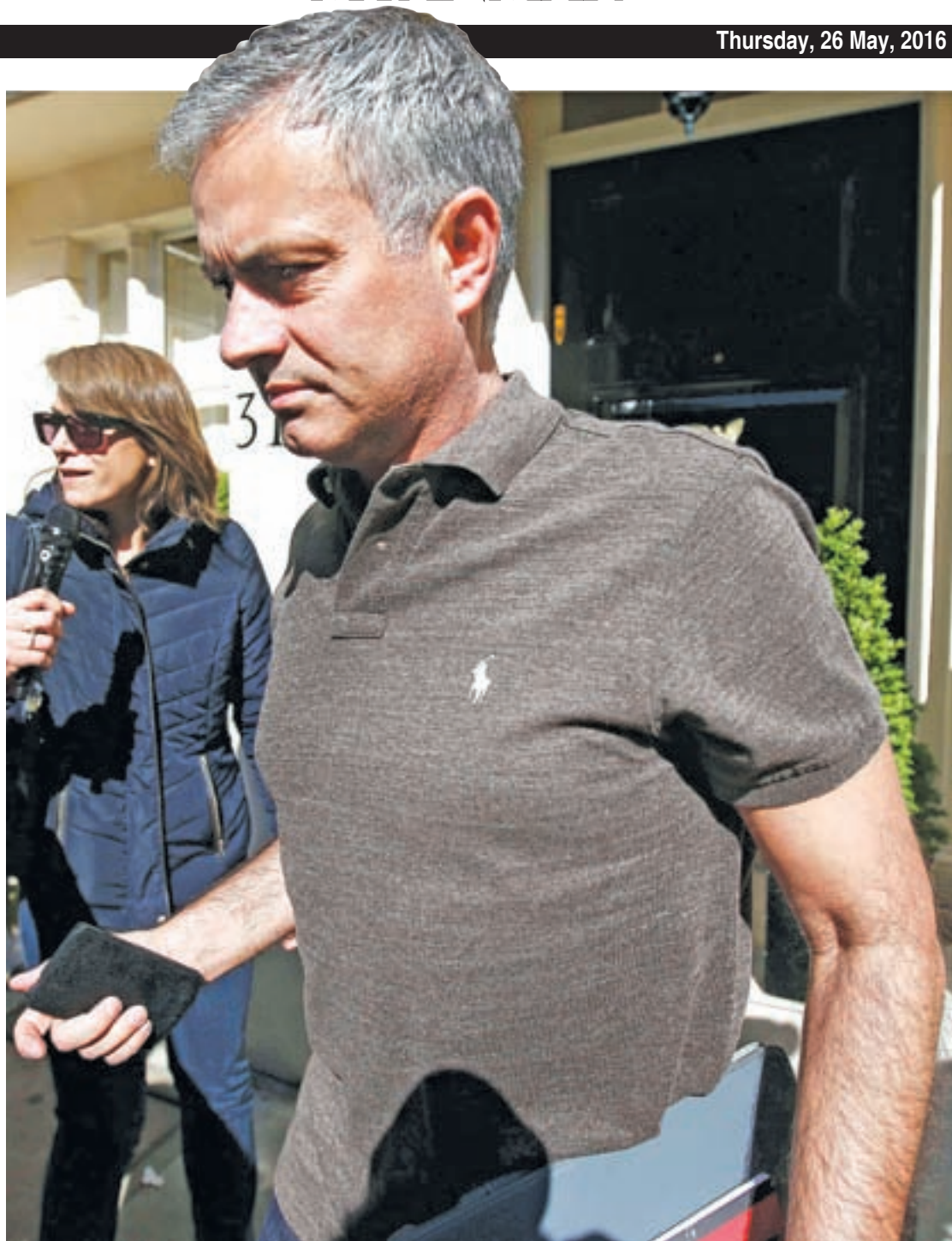
Former Chelsea manager Jose Mourinho leaves his home in London, Britain on 24 May 2016.

Mourinho helped Real to their first La Liga crown in four years and on returning to Chelsea, he again won the Premier League before an unexpectedly poor — and troubled — start to the 2015-16 season led to his sacking.—Reuters