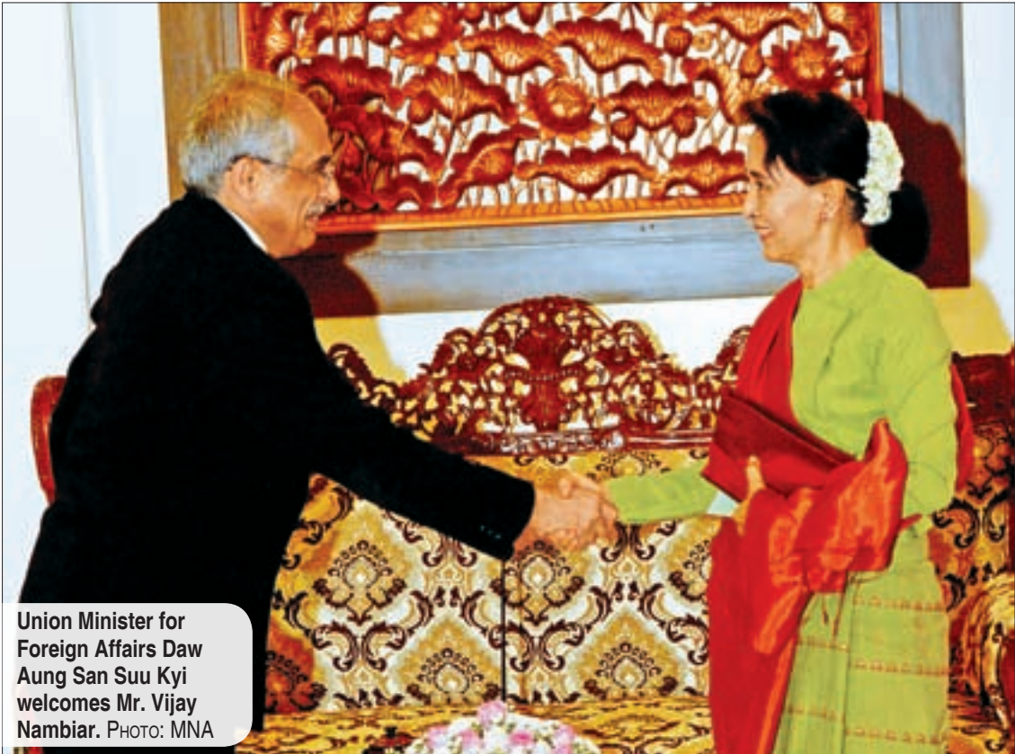
Union Minister for Foreign Affairs Daw Aung San Suu Kyi welcomes Mr. Vijay Nambiar.

UNION Minister for Foreign Affairs Daw Aung San Suu Kyi met Mr. Vijay Nambiar, United Nations Secretary-General's Special Adviser on Myanmar, at her office in Nay Pyi Taw yesterday. The two representatives talk on the ongoing peace process and matters related to present and future cooperation between Myanmar and the United Nations. — Myanmar News Agency