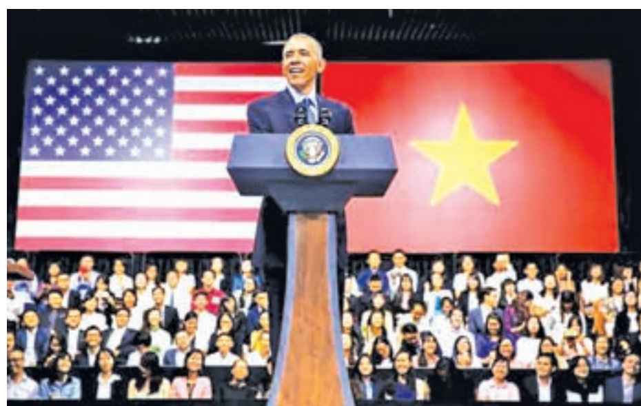
US President Barack Obama attends a town hall meeting with members of the Young Southeast Asian Leaders Initiative (YSEALI) at the GEM Centre in Ho Chi Minh City, Viet Nam, on 25 May 2016.

"Usually, eventually the voters make good decisions and democracy works," replied Obama, whose criticism of Trump