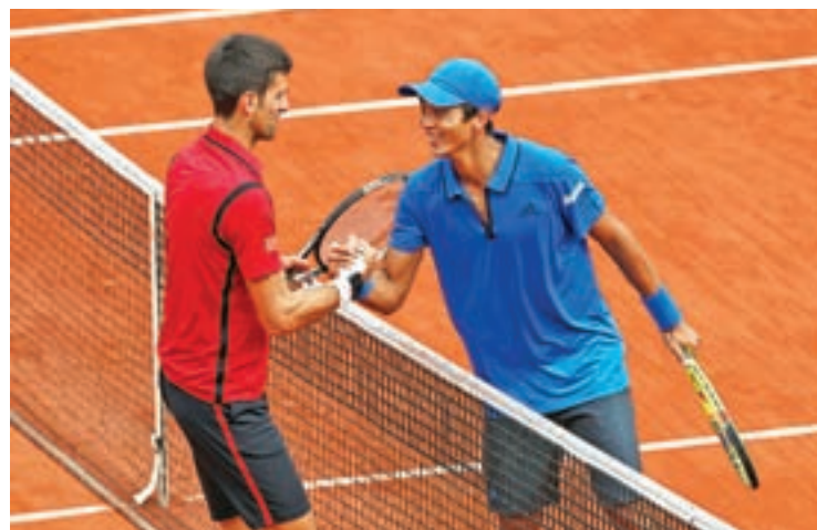
Novak Djokovic shakes hands after beating Yen-Hsun Lu at Paris, France on 24 May 2016.

"We should be considered among the best strikers in Europe. We're up there, we're confident, we're both scoring goals and long may it continue," Kane told British media.—Reuters