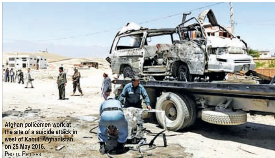
Afghan policemen work at the site of a suicide attack in west of Kabul, Afghanistan on 25 May 2016.