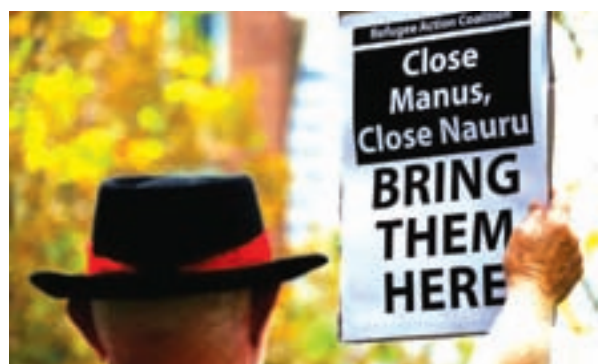
A protestor from the Refugee Action Coalition holds a placard during a demonstration outside the offices of the Australian Government Department of Immigration and Border Protection in Sydney, Australia, on 29 April 2016.

SYDNEY — Australian Prime Minister Malcolm Turnbull's election agenda focusing on jobs and growth is at risk of being hijacked by the country's harsh immigration policy and controversial network of offshore detention camps for asylum seekers.