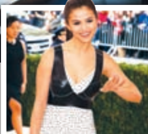
Singer Selena Gomez.

The winners will be announced on 14 August.—PTI