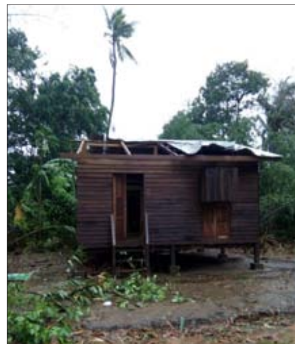
The house damaged by the strong wind in Hpa-an.