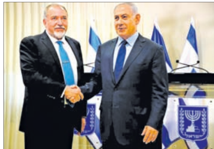
Avigdor Lieberman, head of far-right Yisrael Beitenu party, (L) and Israeli Prime Minister Benjamin Netanyahu shake hands after signing a coalition deal to broaden the government's parliamentary majority, at the Knesset, the Israeli parliament in Jerusalem on 25 May 2016.

Netanyahu has said the coalition deal, which prompted Moshe Yaalon, a Likud member and former general, to quit as defence minister in protest on Fri-