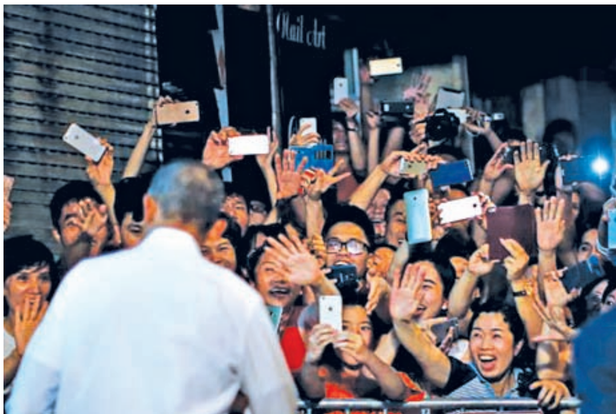
Local residents react as President Obama leaves after having a dinner with Anthony Bourdain at a restaurant in Hanoi.