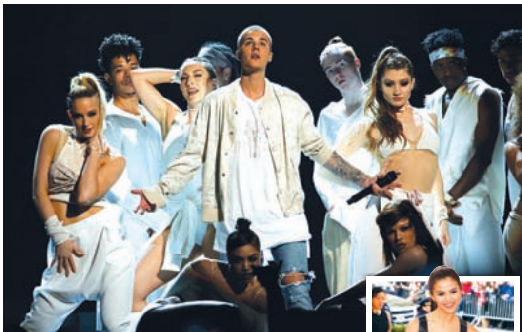
Justin Bieber performs a medley of songs at the 2016 Billboard Awards in Las Vegas, Nevada, US, on 22 May 2016.