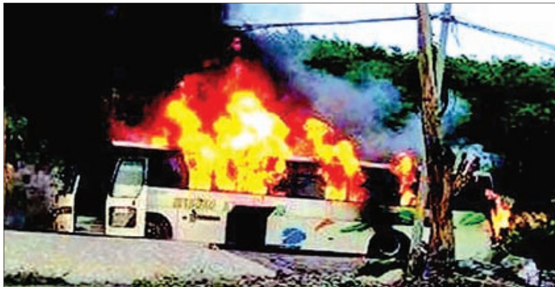
The passenger bus being seen on fire.

AN outbreak of fire caused by electric short circuiting destroyed a passenger vehicle carrying about 40 passengers on the Mandalay-Pyin Oo Lwin road on Monday.