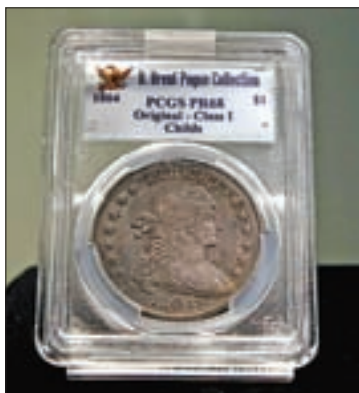
The Sultan of Muscat-Brands-Childs 1804 Silver Dollar.

One of the five most valuable coins in the world, the silver dollar features blue and gold tones and a portrait of America's Lady Liberty staring skyward, with stars bordering the coin's edges.