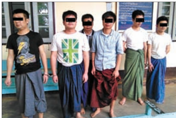
The six Chinese nationals who would be repatriated are seen outside a police station.

PREPARATIONS are currently being made for the repatriation of six Chinese nationals, for whom an order of deportation was issued in May at the Naypyidaw office of the Ministry of Immigration and Population, according to the Kengtung Township immigration department.