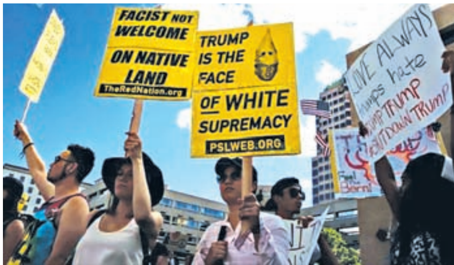
Protesters picket outside the event site before Republican US presidential candidate Donald Trump begins a rally with supporters in Albuquerque, New Mexico, US on 24 May.

Television footage showed officers responding by using pepper spray and smoke bombs to disperse the crowd.