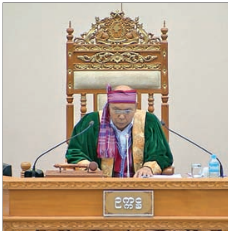
Amyotha Hluttaw Speaker Mahn Win Khaing Than.

THE Amyotha Hluttaw session continued for its 29 th day with a question and answer session and discussions on two bills yesterday.