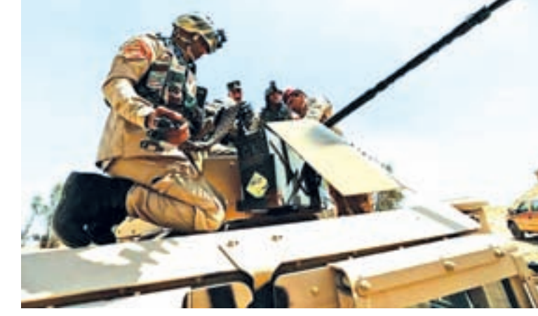
Members of the Iraqi security forces load a machine gun near Falluja, Iraq, on 23 May.

Islamic State claimed responsibility for bombs that killed nearly 150 people and wounded at least 200 in Jableh and Tartous on Syria's Mediterranean coast on Monday in the government-controlled territory that hosts a Russian military base.—Reuters