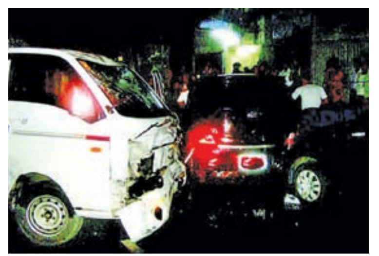
Cluster collision of four vehicles being seen.

A CLUSTER collision of four vehicles occurred in front of the Shwe Leikpyar Housing Estate on Lower Kyimyindine Road on Sunday at around midnight.