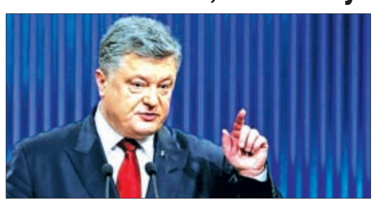
Ukrainian President Petro Poroshenko gestures during a news conference in Kiev, Ukraine, in 14 January, 2016.

"In the centre of the consultations were security questions and the preparations for local elections in the conflict areas in eastern Ukraine," said German government spokesman Steffen Seibert in a statement.