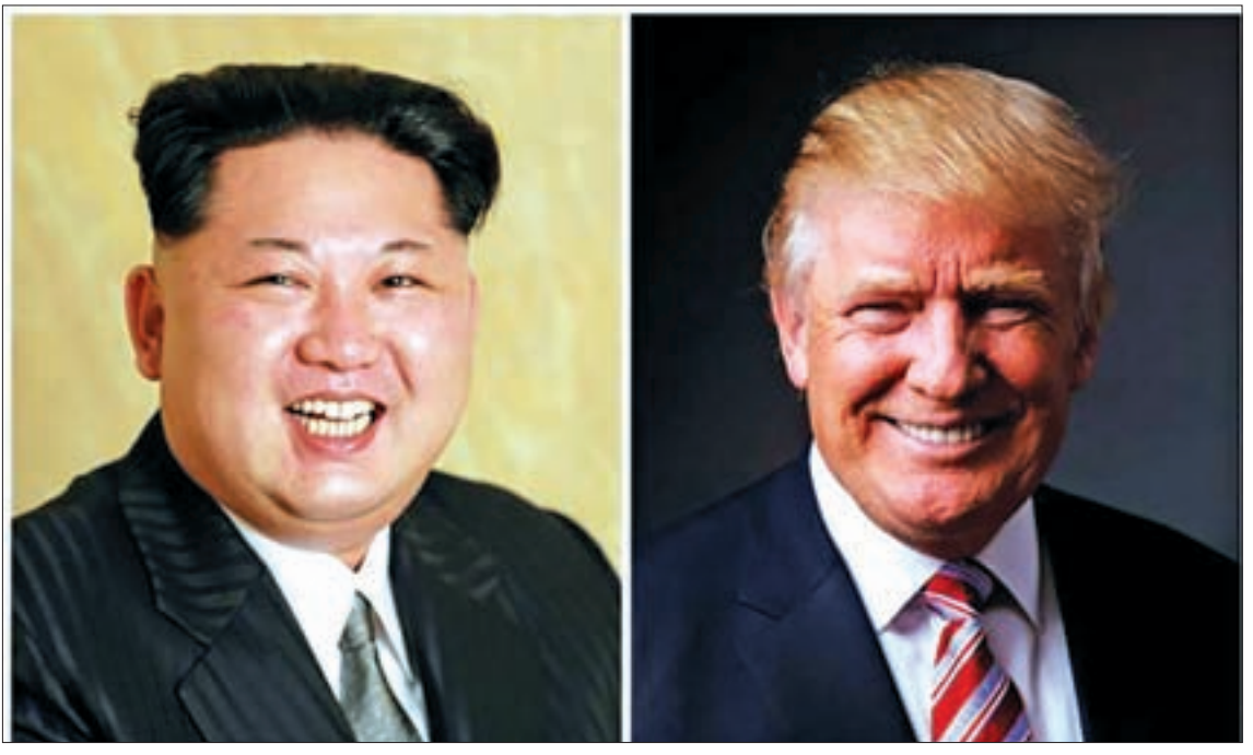
A combination photo shows a Korean Central News Agency (KCNA) handout of North Korean leader Kim Jong Un released on 10 May 2016, and Republican US presidential candidate Donald Trump posing for a photo after an interview with Reuters in his office in Trump Tower, in the Manhattan borough of New York City, US, on 17 May 2016.

North Korea conducted a fourth nuclear test in January and