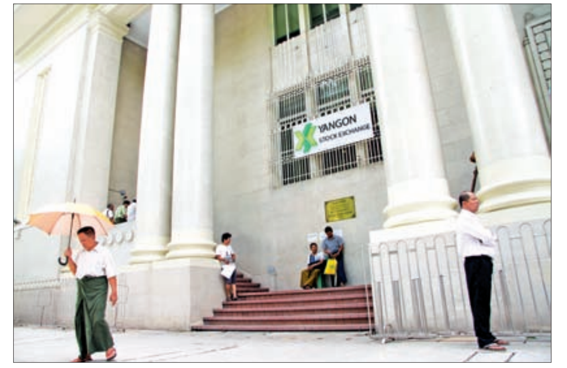
Visitors are seen outside Yangon Stock Exchange (YSX) in Yangon on 20 May.