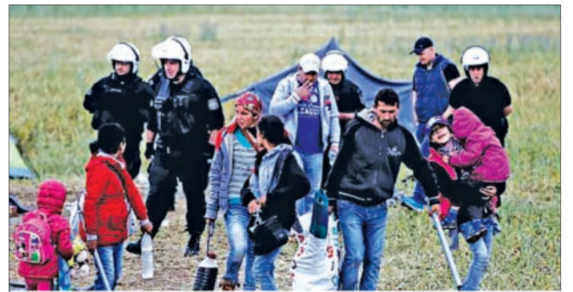
A refugee family carry their belongings during a police operation at a refugee camp at the border between Greece and Macedonia, near the village of Idomeni, Greece, on 24 May 2016.

IDOMENI, (Greece) — Greek police started moving migrants and refugees out of a sprawling tent camp on the sealed northern border with Macedonia on Tuesday where thousands have been stranded for months trying to get into western Europe.