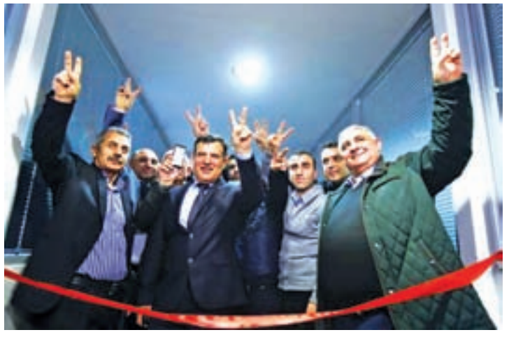
Participants pose for a picture during a ceremony opening a representative office of Syrian Kurdistan in Moscow, Russia, on 10 February 2016.

"The problem is not the fall of Assad or people that are ruling, but changing (the) system," Sinam Mohamed, a member of the Syrian Kurdish Democratic Union (PYD) told reporters in Paris.