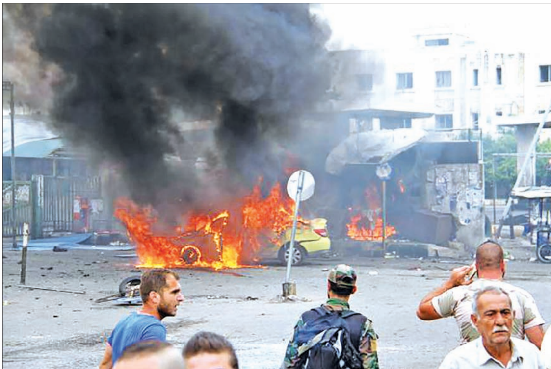
A Syrian army soldier and civilians inspect the damage after explosions hit the Syrian city of Tartous, on 23 May.

The interior ministry said in a statement more than 20 people had been killed, and one state media outlet put the death toll at 45 peo-