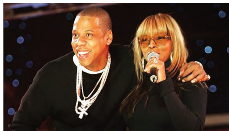
Rapper Jay Z and Mary J Blige surprised the audience at Sean Diddy Combs Bad Boy Family Reunion concert.