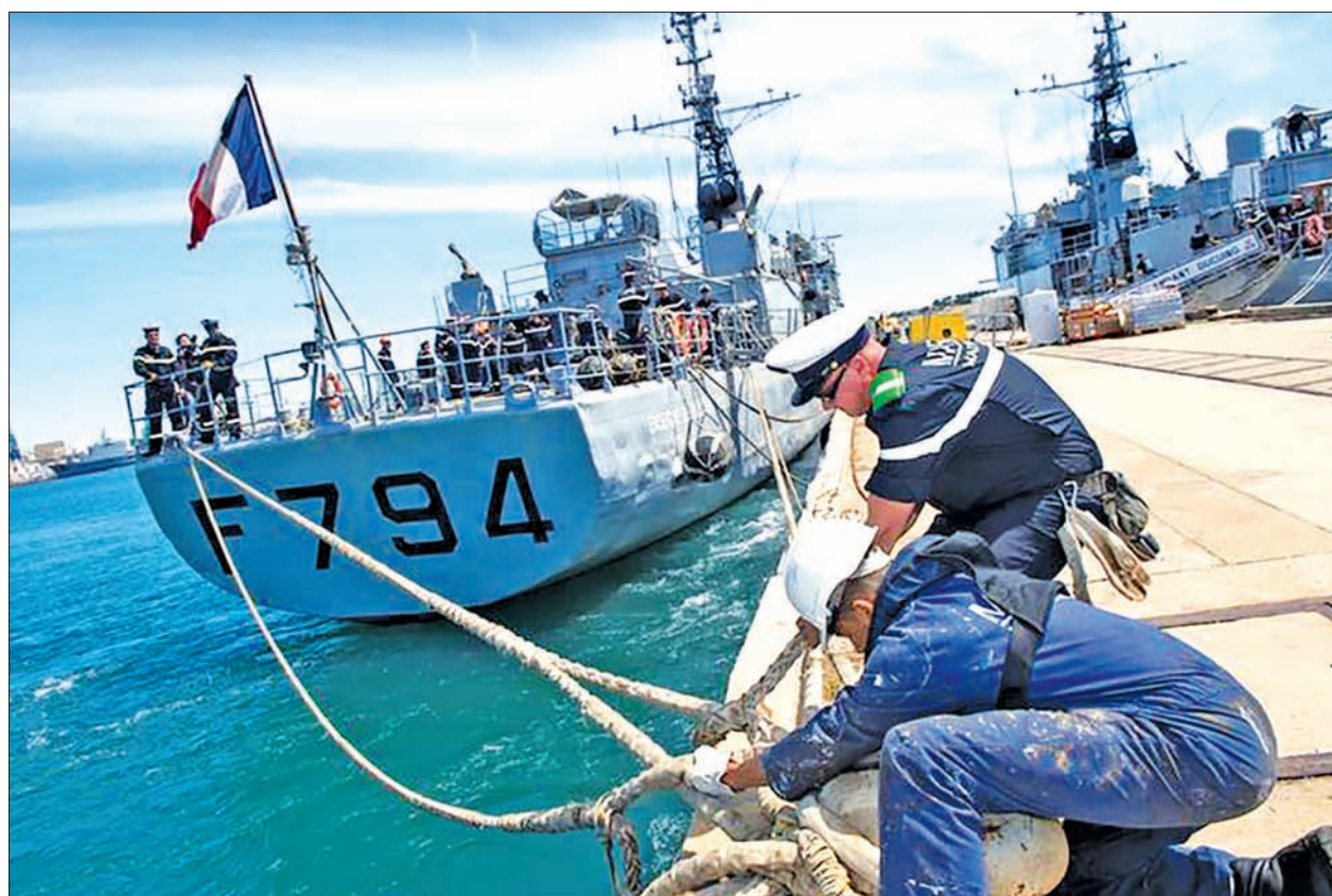
The French Navy's EV Jacoubet prepares to leave the Mediterranean port of Toulon, France, on 20 May 2016 in this picture taken and released on Friday by the French Navy SIRPA Marine, to take part in a search operation of the EgyptAir passenger plane.

It is the second time in little more than a year that sea search operations