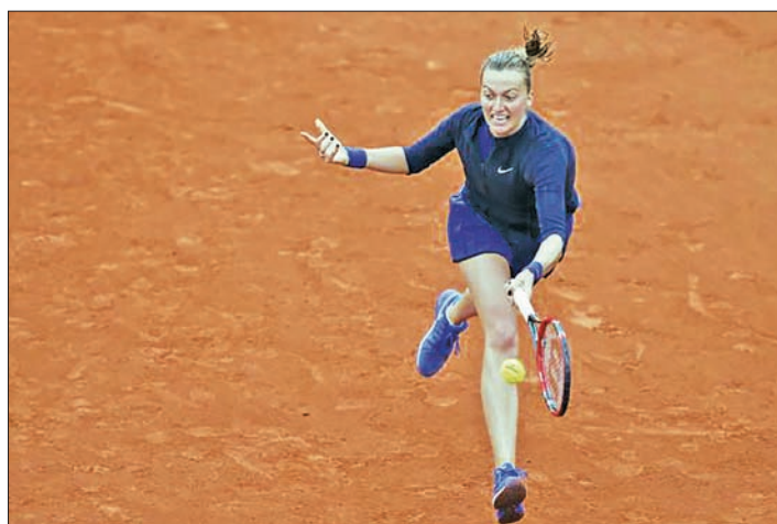
Petra Kvitova returns a shot to Montenegro's Danka Kovinic at French Open championships in Paris on 22 May.

Huge lines of fans formed outside Roland Garros as security was visibly beefed up in light of last year's terror attacks in the city, and once inside the historic grounds were hardly the idyllic