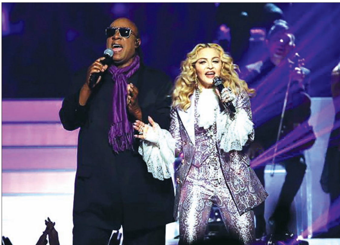
Stevie Wonder and Madonna perform ‘Purple Rain’ during the tribute to Prince at the 2016 Billboard Awards in Las Vegas, Nevada, US, on 22 May, 2016.

While several awards were handed out during the show, including to British singer Adele who won the big prize, top artist and accepted via a video segment, it was performances by the likes of Ariana Grande, Dion,