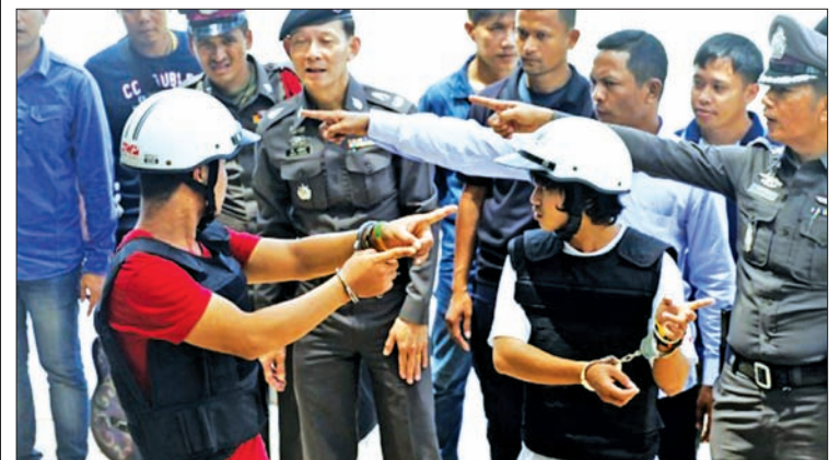
Lawyers filed an appeal on Monday against the conviction of two Myanmar migrant workers sentenced to death in Thailand.

domestic and international criticism for their handling of the case and the evidence. Protests erupted in neighbouring Myanmar after the verdict, with many people there believing the two workers were scapegoats.—Reuters