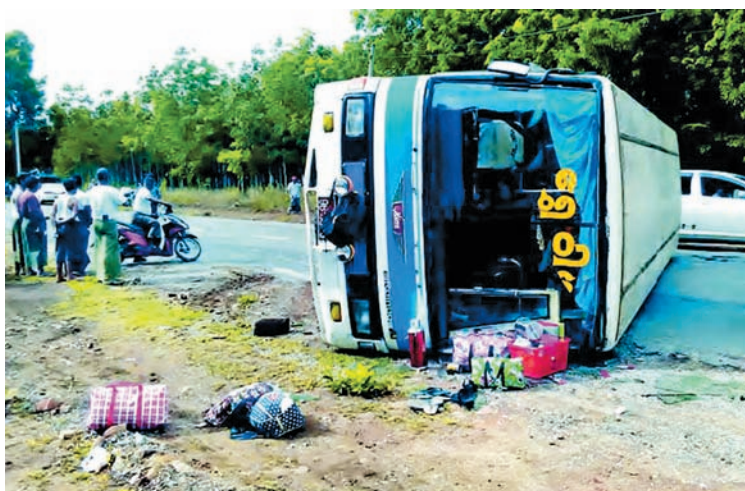
Eight people were injured when a bus overturned outside Mawlamyine yesterday.

A CAR accident occurred on the road between Mawlamyine and Ye on Saturday, leaving eight people injured.