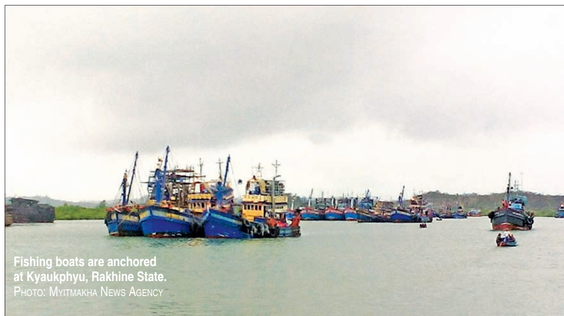
Fishing boats are anchored at Kyaukphyu, Rakhine State.

A total of six companies competed for a tender put out by the MCDC for construction of the high-quality bus terminal facility, which was one by the Myanmar owned M.D.C.M company. It is known the MCDC have had ownership over the current bus terminal, which covers an area of 14.2 acres, since 1997.—Myitmakha News Agency