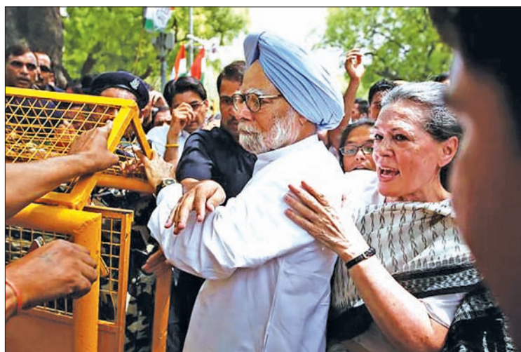
Congress party president Sonia Gandhi (R) and former Prime Minister Manmohan Singh (blue turban) cross a police barricade during what the party calls as a 'Save Democracy' march to parliament in New Delhi, on 6 May.

That, and the state of Punjab, will go a long way to defining who is the next prime minister; in