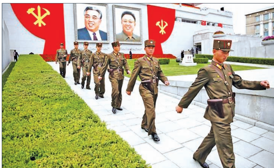
Soldiers walk under pictures of former North Korean leaders Kim Il Sung and Kim Jong Il at the capital's main ceremonial square after a mass rally and parade, a day after the ruling party wrapped up its first congress in 36 years by elevating him to party chairman, in Pyongyang, North Korea, on 10 May, 2016.

North Korea came under tougher international pressure with the March adoption of a UN Security Council resolution that was even backed by its lone major ally China, which disapproves of its nuclear arms programme. South Korea has also cut off all commercial contacts with the North. The two Koreas have remained in a technical state of war since their 1950-53 conflict ended in a truce, not a peace treaty.—Reuters