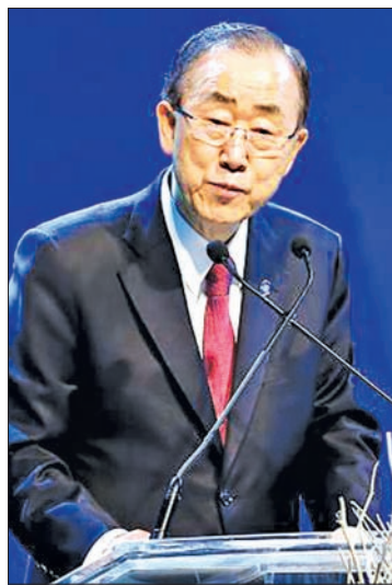
UN Secretary-General Ban Ki-moon speaks during the opening ceremony of the World Humanitarian Summit in Istanbul, Turkey, on 23 May, 2016.

The summit aims to mobilise funds and get world leaders to agree on issues ranging from how to manage displaced civil-