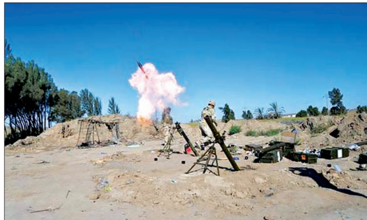
Iraqi soldiers fire a mortar toward Islamic State militants on the outskirts of Fallujah, west of Baghdad, on 20 April.

The Reuters witness saw about three hundred protesters waving placards reading "IEBC must go home now", a reference to the Independent Electoral and Boundaries Commission.—Reuters