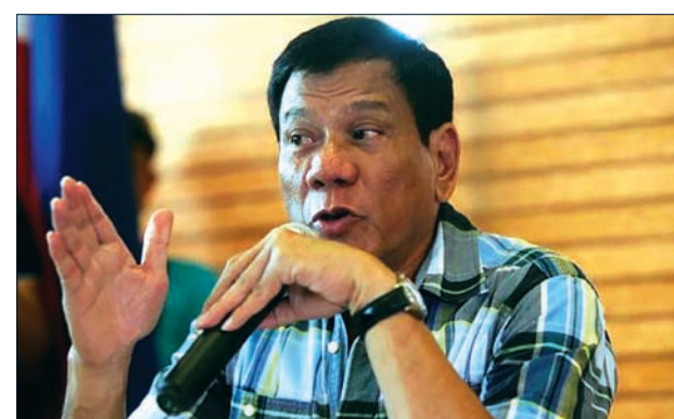
President-elect Rodrigo "Digong" Duterte speaks during a news conference in his hometown Davao City in southern Philippines, on 16 May.