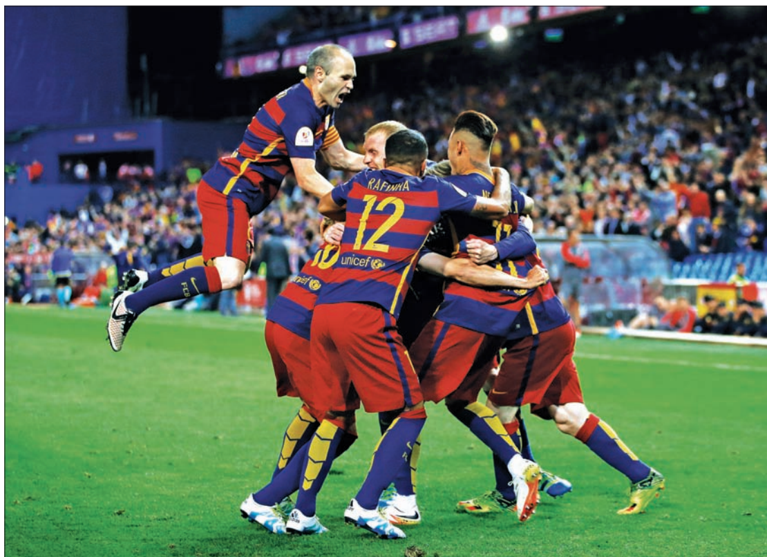
Jordi Alba celebrates with team mates after scoring the first goal for Barcelona during Copa del Rey Final at Vicente Calderon, Madrid, Spain on 22 May.

The game's dynamic changed drastically when Kevin Gameiro, whose pace troubled Barca all night, was brought down when Mascherano grabbed his shirt on the edge of the box.