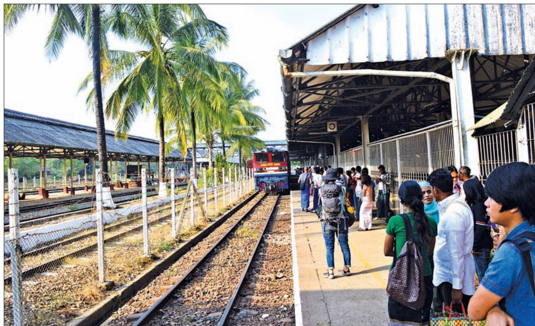
Passengers waiting to take a local train on the Yangon-Mandalay route.

The tenders will be put out transparently, said the general manager.