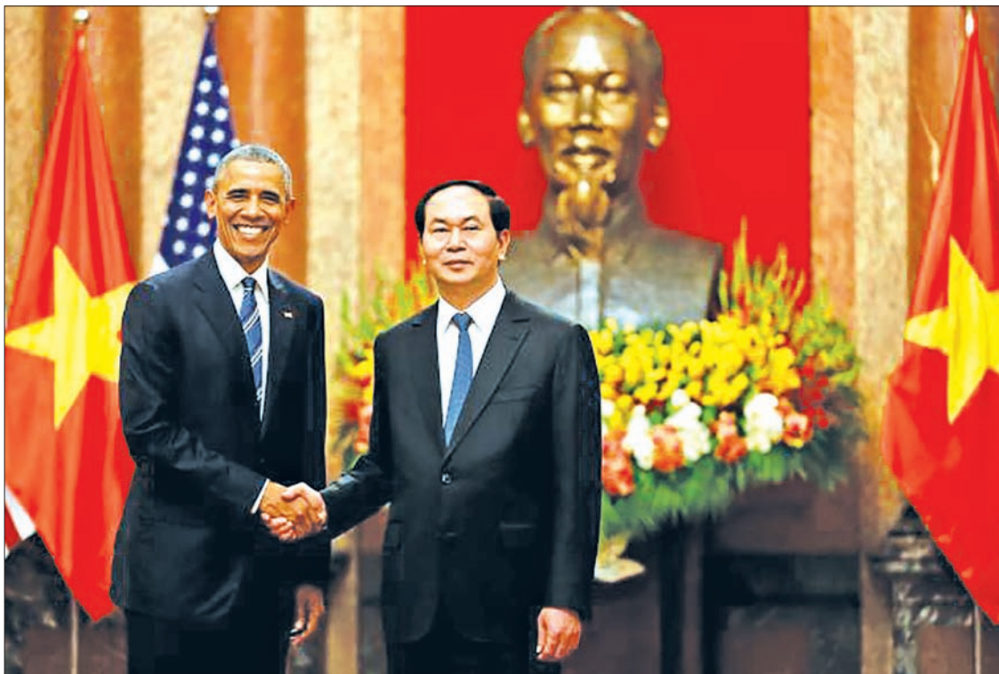
US President Barack Obama shakes hands with Viet Nam's President Tran Dai Quang after an arrival ceremony at the presidential palace in Hanoi, Viet Nam on 23 May 2016.

"The decision to lift the ban was not based on China or any other considerations, it's based on our desire to complete what has been a lengthy process of moving towards normalisation with Viet Nam," he said, adding later that his visit to a former foe showed "hearts can change and peace is possible". He said the sale of arms would depend on Viet Nam's human rights commitments, and would be made on a case-by-case basis.—Reuters