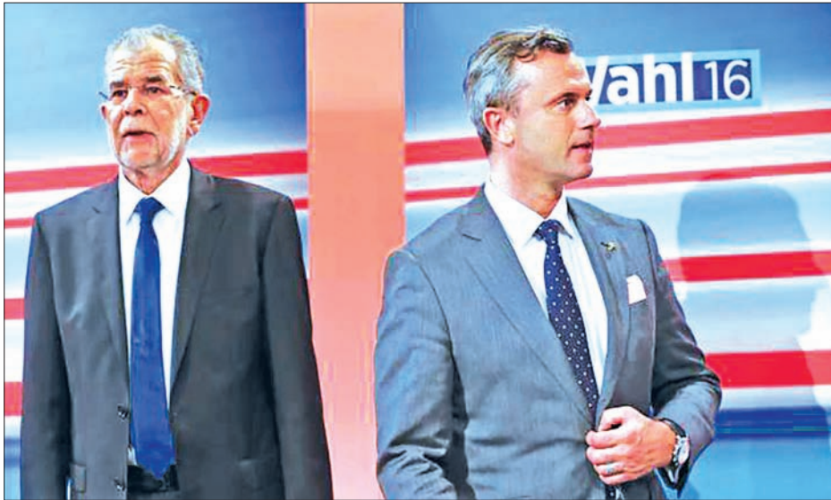
Presidential candidates Norbert Hofer of the Freedom Party (FPÖ) and Alexander Van der Bellen (L) who is supported by the Greens party, take part in a TV debate after the Austrian presidential election in Vienna, Austria, on 22 May 2016.

"The sovereign has spoken," Hofer's opponent, former Greens leader Alexander van der Bellen, told broadcaster ORF. "What exactly it has said — Hofer or van der Bellen — we will