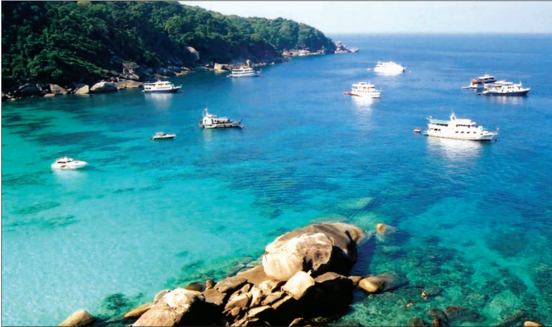
Cruise ships in the Myeik Archipelago.