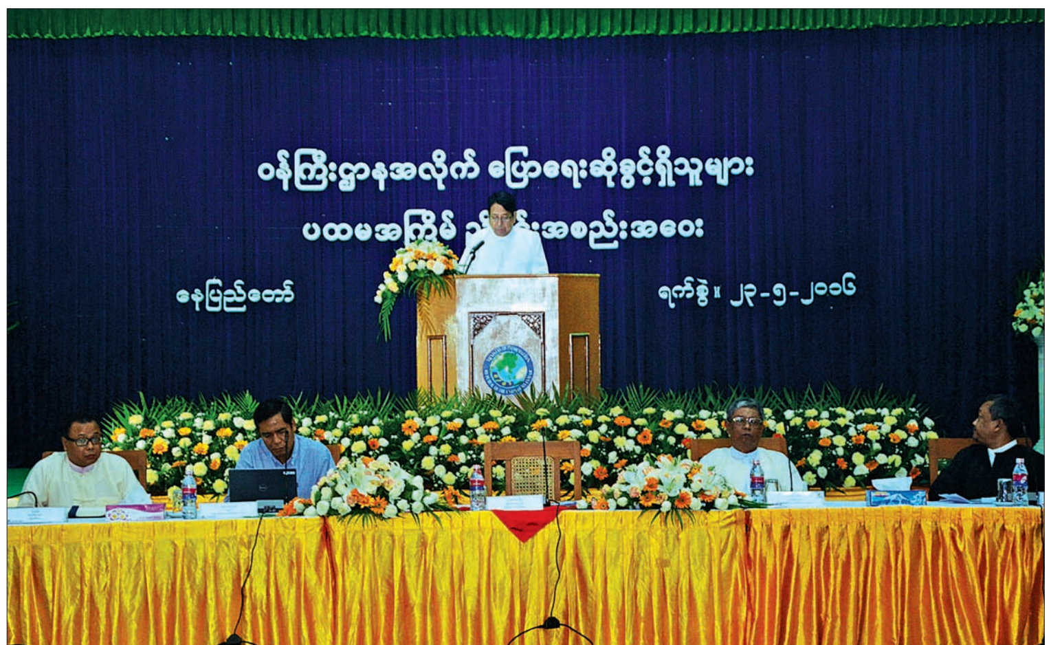
In his address at the first coordination meeting of ministry spokespersons in Nay Pyi Taw yesterday, Union Minister for Information Dr Pe Myint said qualified spokespersons will enhance the image of the ministries and the government, stressing the role of media in connecting people to the government by serving as a public voice.

U Thiha Saw said that before the Right to Information Law is introduced, ministries need to properly set up media departments in order to deal with information requested by the public and the media.