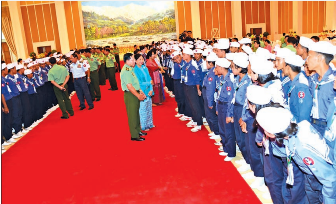
Senior General Min Aung Hlaing and wife greet trainees in maritime and aviation courses.

COMMANDER-in-Chief of Defence Services Senior General Min Aung Hlaing lectured trainees in basic and advanced maritime and aviation courses yesterday in Nay Pyi Taw.