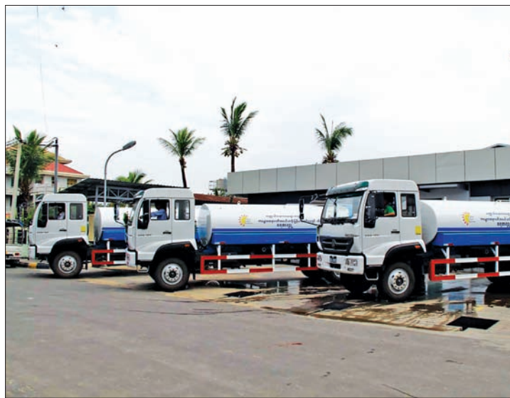
Water bowzers seen before departure.

KBZ’s Brighter Future Myanmar Foundation sent a fleet of water bowzers to Chin State yesterday to supply drinking water to residents. The fleet of three 3,000-gallon bowzers and volunteers from Kanbawza Bank will supply water to people in Kalay, Sagaing Region and Falam and Haka in Chin State. As part of its water supply project, the foundation has also provided a 3,000-gallon bowser to the Myittamon Parahita Association, which is carrying out social welfare services in Natogyi. Since early April 2016, the foundation has supplied more than 600,000 gallons of drinking water to a population of more than 50,000 in arid areas nationwide. The foundation plans to build its fleet up to 42 bowzers.—GNLM