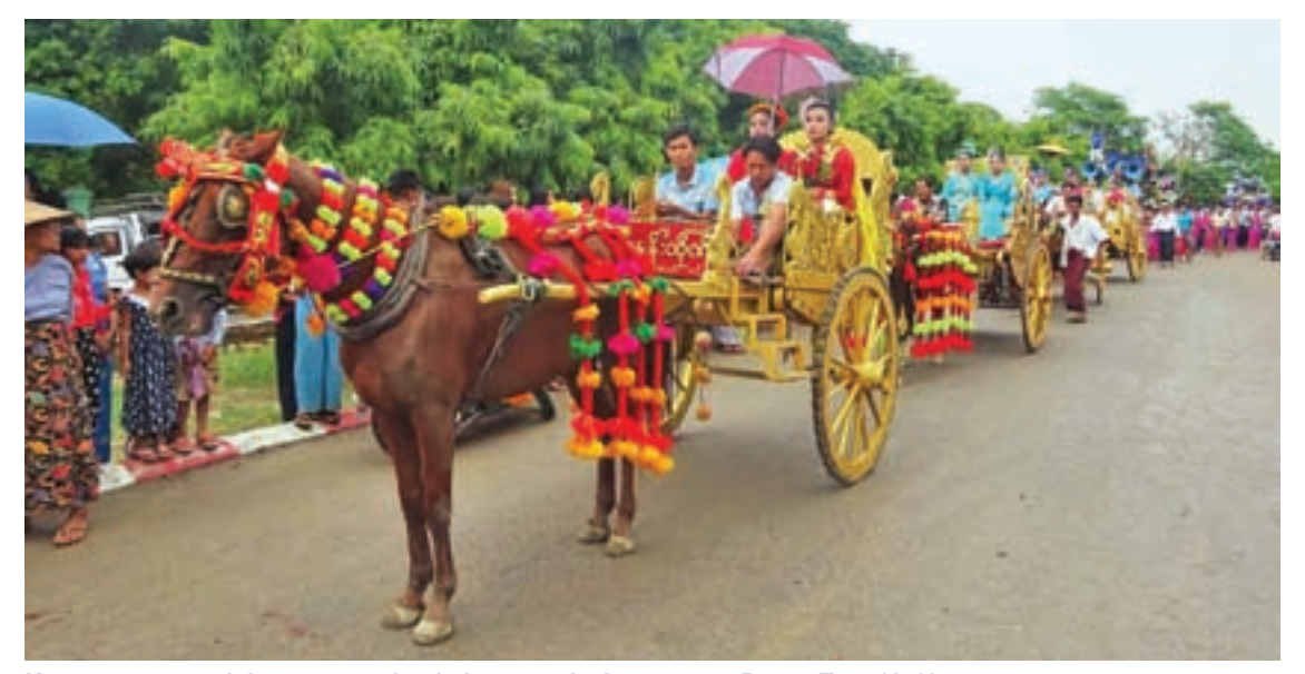
Kason nyaung yei thun procession being seen in Amarapura.

THE ceremony of the water pouring on the Sacred Bodhi Tree festival was held at Shwekyetyet pagoda in Amarapura Township of Mandalay Region on a grand scale on Friday. Local people from fifteen villages of Amarapura Township came together to organise the ceremony.