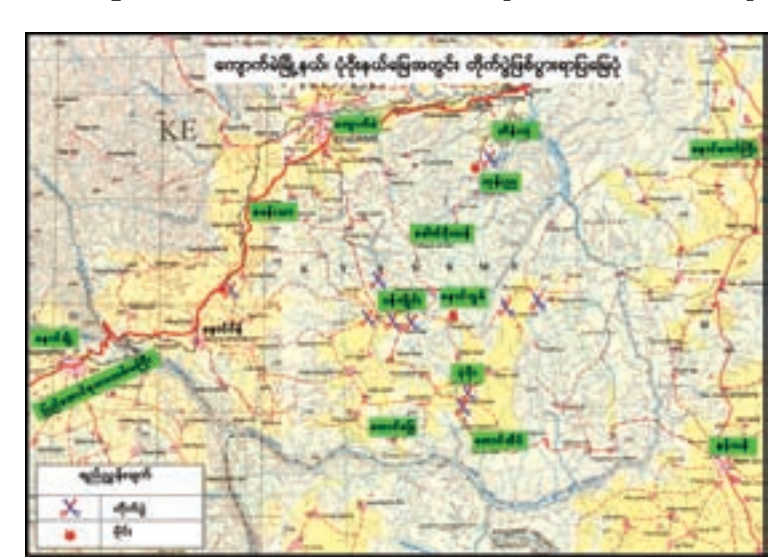
Map shows locations where fighting happened.

In the fighting on 5 May and on Friday some members of the Tatmadaw including a com-