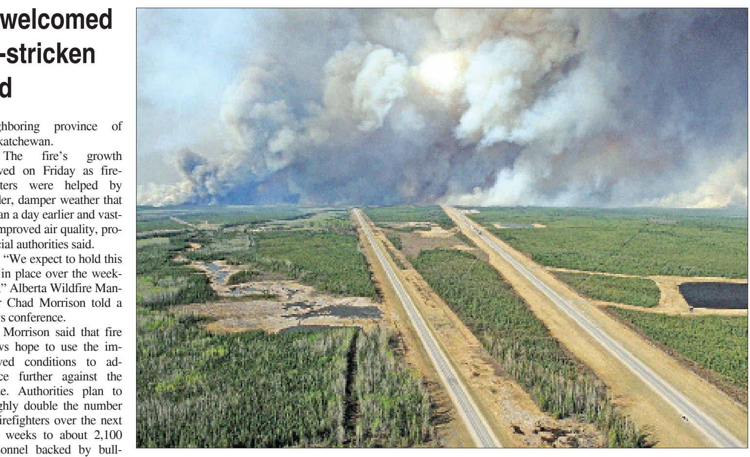
An aerial view of Highway 63 south of Fort McMurray, Alberta. Canada, shows smoke from the wildfires taken from a CH-146 Griffon helicopter, on 5 May 2016.

crews hope to use the improved conditions to advance further against the blaze. Authorities plan to roughly double the number of firefighters over the next two weeks to about 2,100 personnel backed by bulldozers and aircraft dumping flame retardant.—Reuters