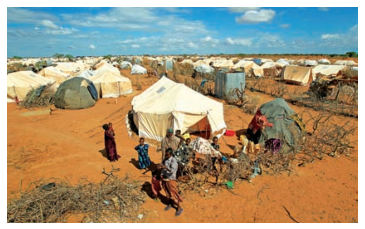
Refugees stand outside their tent at the Ifo Extension refugee camp in Dadaab, near the Kenya-Somalia border in Garissa County, Kenya, in 2011.

That episode led to the resignation of the Secret Service's director. In March 2015, two Secret Service agents capped off a night of drinking by driving into a White House barricade inches away from a suspicious package that investigators were examining. In 2011, a man hit the White House with automatic rifle fire, though damage to the building was not discovered for several days.— Reuters