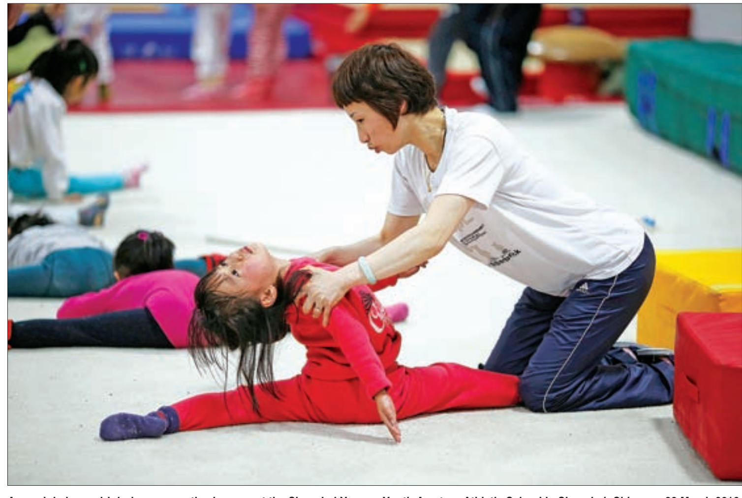
A coach helps a girl during gymnastics lessons at the Shanghai Yangpu Youth Amateur Athletic School in Shanghai, China, on 23 March 2016.

Fewer parents are willing to let their children endure gruelling training routines from as young as six years of age, leading to a fall in student numbers. Some schools have closed and others are adjusting the way they work. The number of sport schools is down from 3,687 in 1990, government num-