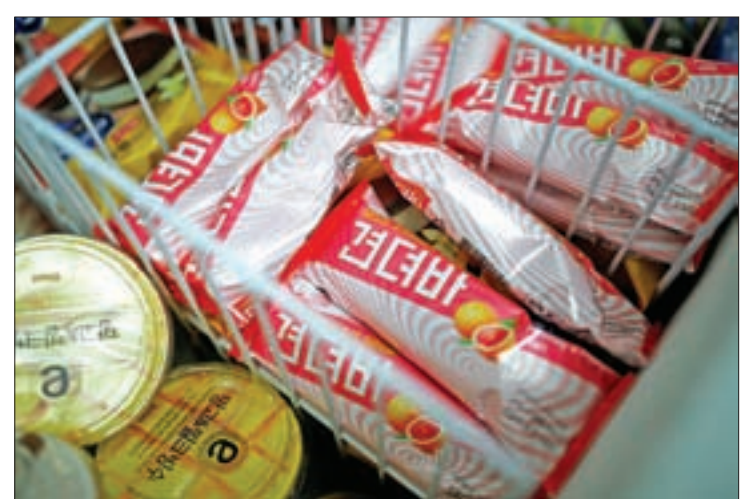
Ice cream bars named Gyeondyo-bar, which translates to "hang in there" are seen at a convenience store in Seoul, South Korea, on 20 May 2016.

nights of drinking", convenience store chain Withme FS, a unit of E-Mart Co Ltd, part of the Shinsegae Group conglomerate, said in a press release.