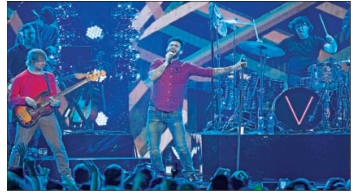
Adam Levine and Maroon 5 perform at the Z100's Jingle Ball 2014 at Madison Square Garden in New York on 12 December 2014.

The law, approved by the Republican-led legislature in a one-