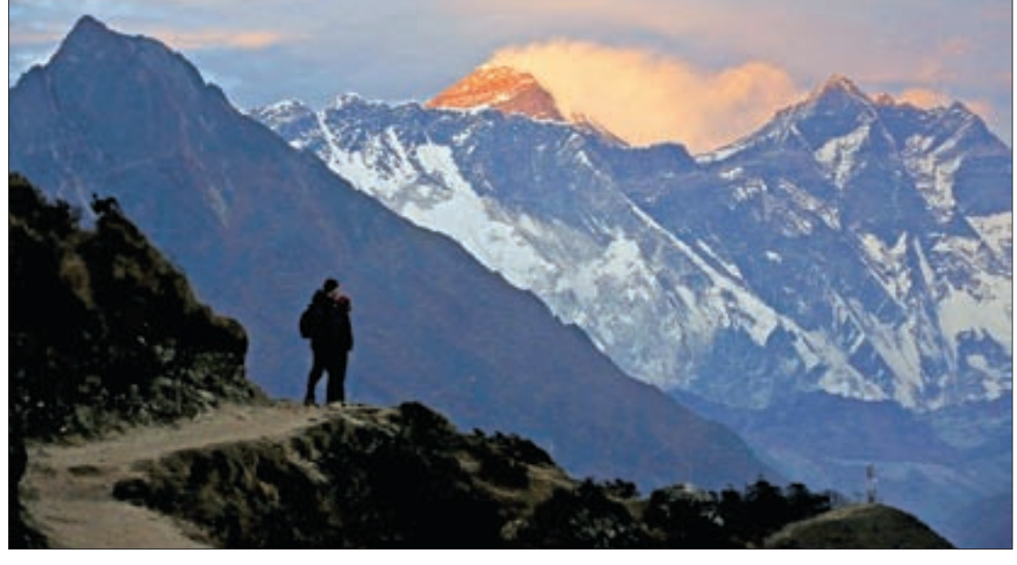
Light illuminates Mount Everest during sunset in Solukhumbu District, also known as the Everest region, in 2015.

In total, 9,000 people were killed across Nepal in the 7.8 magnitude quake, the worst disaster in the country's recorded history.—Reuters