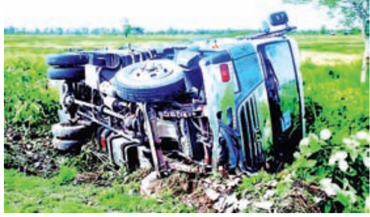
A six-wheel vehicle being seen overturned. Photo: Ko Lwin (Swar)

The driver has been charged by police.— Ko Lwin (Swar)