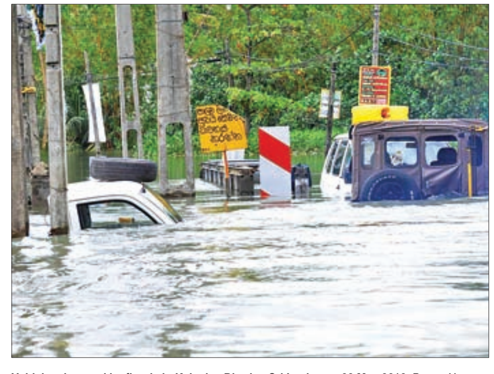
Vehicles drowned by floods in Kelaniya District, Sri Lanka, on 20 May 2016.

As several houses remained underwater, navy boats were patrolling the flooded areas distributing aid and water to the families who were residing in the upper floors of their houses.