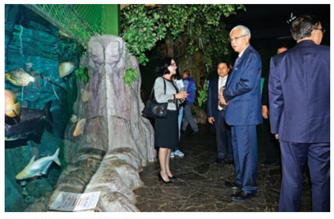
President U Htin Kyaw visiting (SDWA).

The summit was held in Sochi on Thursday and Friday with the aim of enhancing trade and forming strategic economic partnerships through the establishment of regional economic integration.-Myanmar News Agency