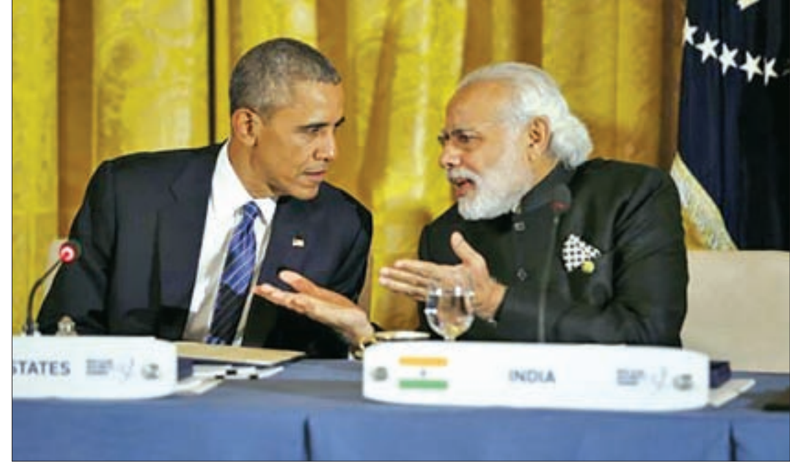
US President Barack Obama talks with Indian Prime Minister Narendra Modi (R) during a working dinner at the White House with heads of delegations attending the Nuclear Security Summit in Washington on 31 March 2016.

Modi will address a joint tweet. The invitation is a sharp meeting of the US Congress, an opportunity extended to few foreign leaders, the day after the White House meeting, US House