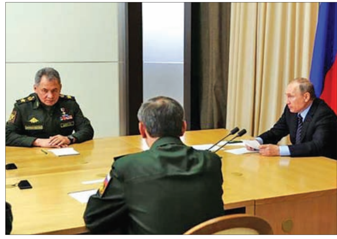
Russian President Vladimir Putin (R) and Defence Minister Sergei Shoigu attend a meeting with top generals at the Bocharov Ruchei state residence in Sochi, Russia, on 10 May 2016.

But the United States made clear on Friday it had little interest in the idea, noting Russia has floated similar proposals in the past and stressing that it expected Moscow to pressure its Syrian government ally and to avoid unilateral strikes.