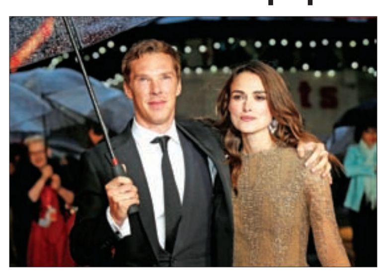
Actors Benedict Cumberbatch and Keira Knightley pose as they arrive for the European premiere of the film 'The Imitation Game' at the BFI opening night gala at Leicester Square in London in 2014.

LONDON — British actors Benedict Cumberbatch, Keira Knightley, Chiwetel Ejiofor and Helena Bonham Carter are among more than 250 celebrities from the arts world who have signed a letter urging Britons to vote to remain in the European Union.