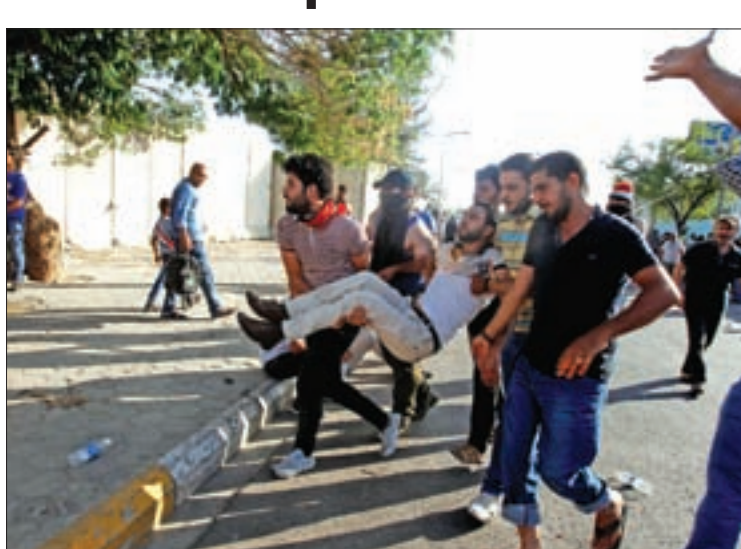
Anti-government protesters carry a man injured during the storming of Baghdad's Green Zone in Iraq 20 May, 2016.

Protesters included supporters of powerful Shi'ite Muslim cleric Moqtada al-Sadr and people from other groups upset with the government's failure to approve anti-corruption reforms and improve security against bombings by Islamic State mili-