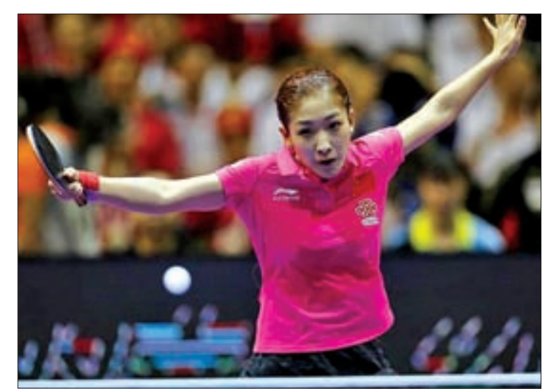
Liu Shiwen of China competes during 2016 World Table Tennis Championships, Women's Finals at Kuala Lumpur, Malaysia, on 6 March 2016.

SYDNEY - Women's world number one Liu Shiwen will not take part in the table tennis singles at the Rio Olympics after failing to secure one of China's two spots in the competition, the International Table Tennis Federation has an-