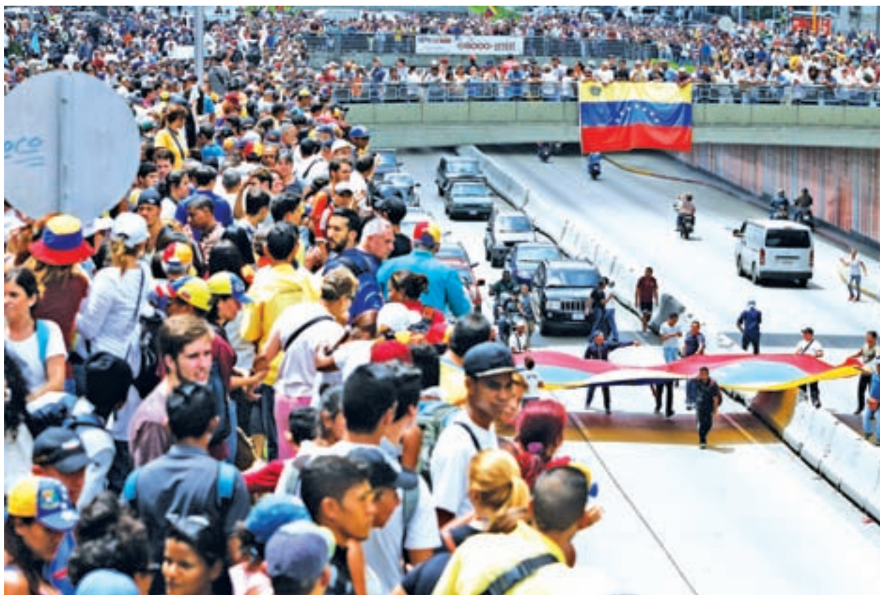
Opposition supporters carrying Venezuelan flags take part in a rally to demand a referendum to remove President Nicolas Maduro in Caracas, Venezuela, on 18 May 2016.

Opposition leaders have warned that Venezuela is a "time bomb" and have said blocking democratic avenues for Maduro's removal means people