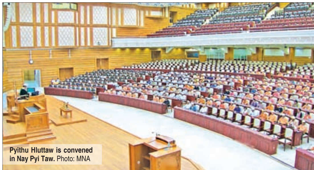
Pyithu Hluttaw is convened in Nay Pyi Taw.