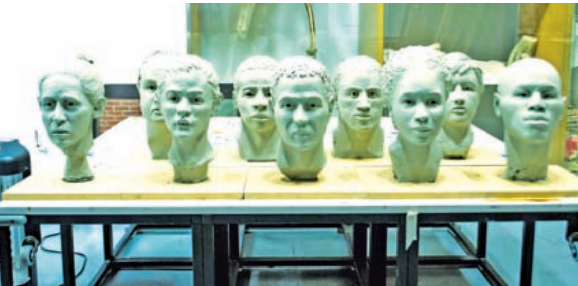
Clay sculptures of the faces of unidentified dead people in hopes of finding their identities in partnership with New York City’s Chief Medical Examiner are seen at a workshop at the New York Academy of Art in New York, New York, United States in January 2016.

graduate school is known for teaching the techniques of Leonardo da Vinci and other old masters who used anatomical studies to perfect their craft. At the school’s Lower Manhattan studios, it is not uncommon to see live horses, kangaroos and other animals serving as models for the students.