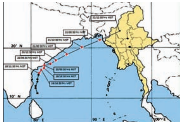
Observed and forecast track of Cyclone ROANU over Bay of Bengal.