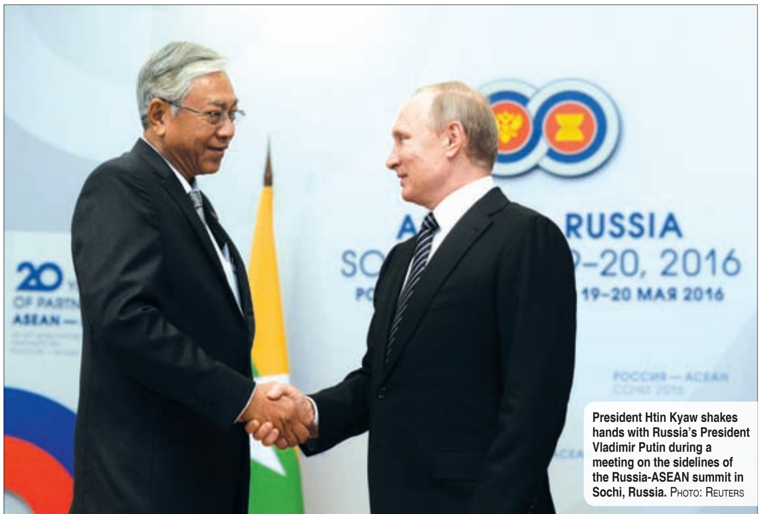
President Htin Kyaw shakes hands with Russia's President Vladimir Putin during a meeting on the sidelines of the Russia-ASEAN summit in Sochi, Russia.

The ministry has set a goal to increase the percentage of nationwide electrification to 99 per cent by 2030.