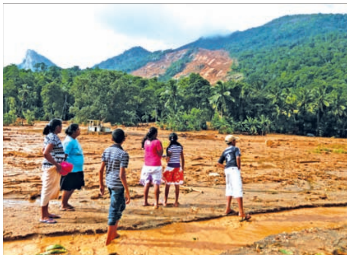
Villagers walk through the landslide site at Elangipitiya village in Aranayaka, Sri Lanka on 19 May 2016.

ARANAYAKA (Sri Lanka) — Hopes faded on Thursday for the survival of about 150 people trapped under the mud and rubble of two landslides in Sri Lanka, as heavy rain hampered rescue operations and the death toll from the disaster rose to 41.