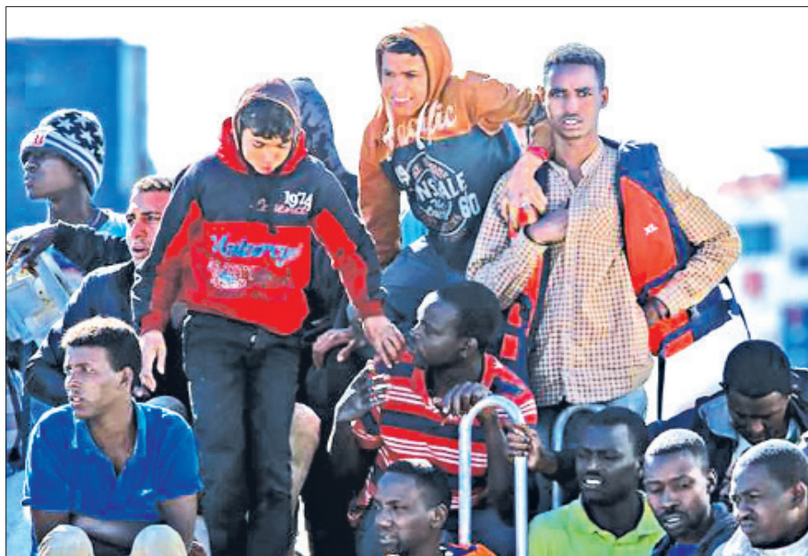
Migrants wait to disembark from the Italian coastguard vessel Peluso in the Sicilian harbour of Augusta, Italy, on 13 May 2016.

"We have a proverb - 'start off like a Turk and finish like a German'. But the reverse has happened here. It started off like a German and