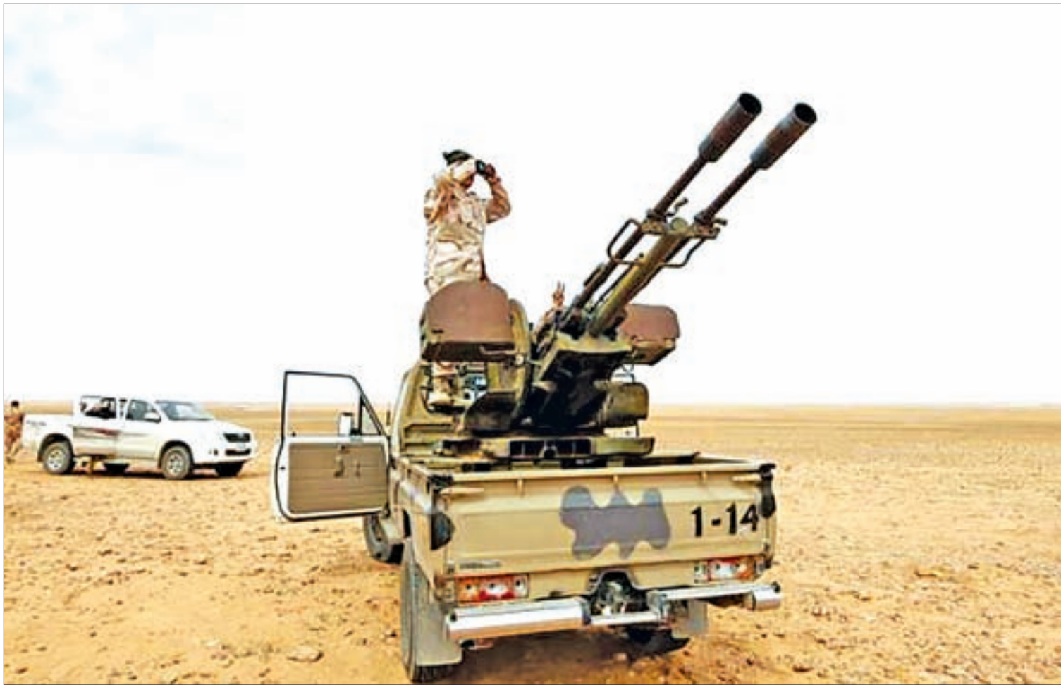
A Libyan soldier looks through binoculars at Wadi Bey, where troops are manning outposts, west of the Islamic State-controlled city of Sirte, on 23 February, 2016.