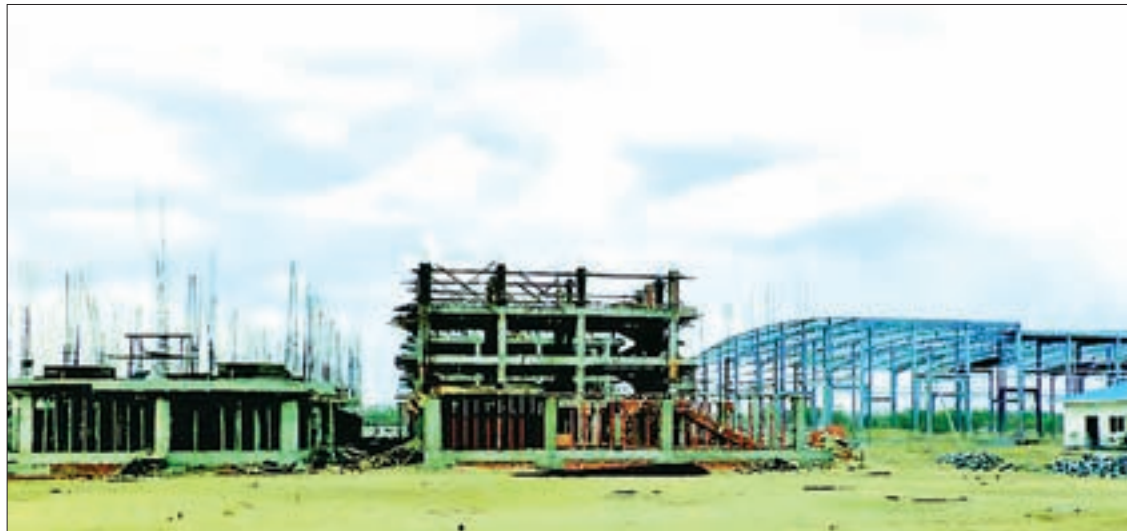
International standard vegetable wholesale market being seen under construction.

AN international standard vegetable wholesale market is being built on a 83.7-acre plot of land in Insein Township, Yangon Region.