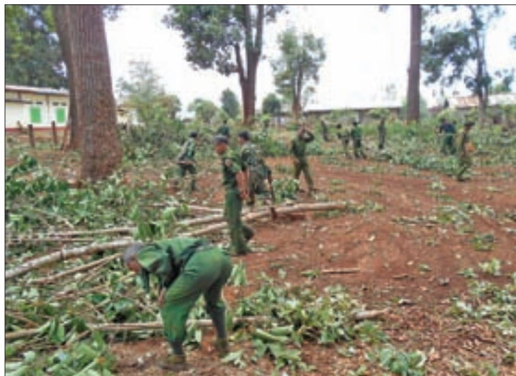
Soldiers seen clearing the tree to build houses.