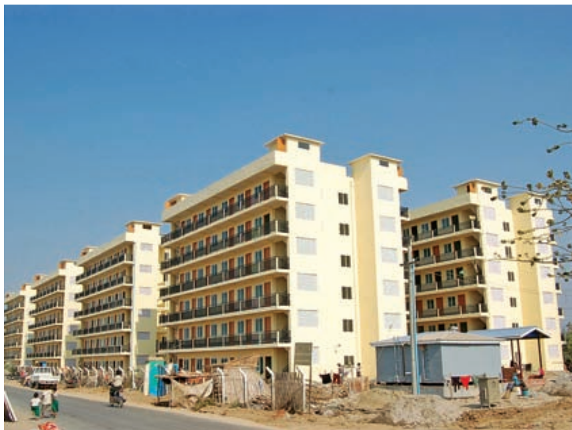
A newly constructed housing in Mandalay.