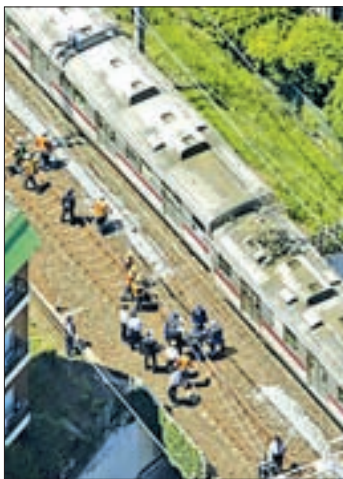
Photo taken on 18 May 2016, from a Kyodo News helicopter shows a derailed Tobu Railway Co. train in Tokyo. No injuries were reported, but around 400 passengers had to walk to a nearby station. PHOTO: KYODO NEWS

The police said they found evidence that the train had scraped railroad ties for a distance of about 200 meters from a point 50 metres away from Nakaitabashi Station.— Kyodo News