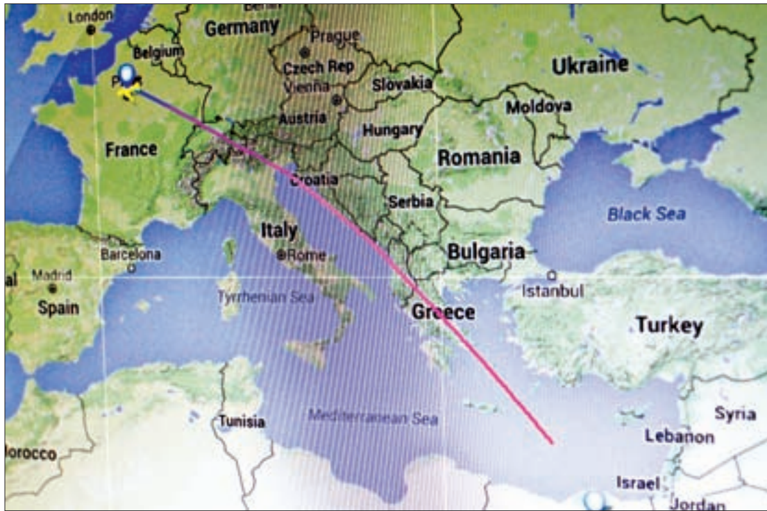
The flight path of EgyptAir flight MS804 from Paris to Cairo is seen on a flight tracking screen on 19 May, 2016.