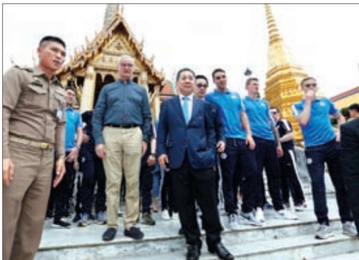
Leicester City soccer club's manager Claudio Ranieri and club owner Vichai Srivaddhanaprabha (R) visit the Emerald Buddha temple in Bangkok, Thailand on 19 May 2016.

BANGKOK — English Premier League champions Leicester City paid a visit to Bangkok's glittering Grand Palace on Thursday and signed a well-wishing book for the country's revered monarch King Bhumibol Adulyadej.