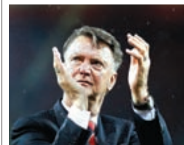
Louis van Gaal.

LONDON — Manchester United manager Louis van Gaal goes into the FA Cup final against Crystal Palace on Saturday facing echoes of the 1990 showpiece between the two sides that proved so pivotal in the career of Alex Ferguson.