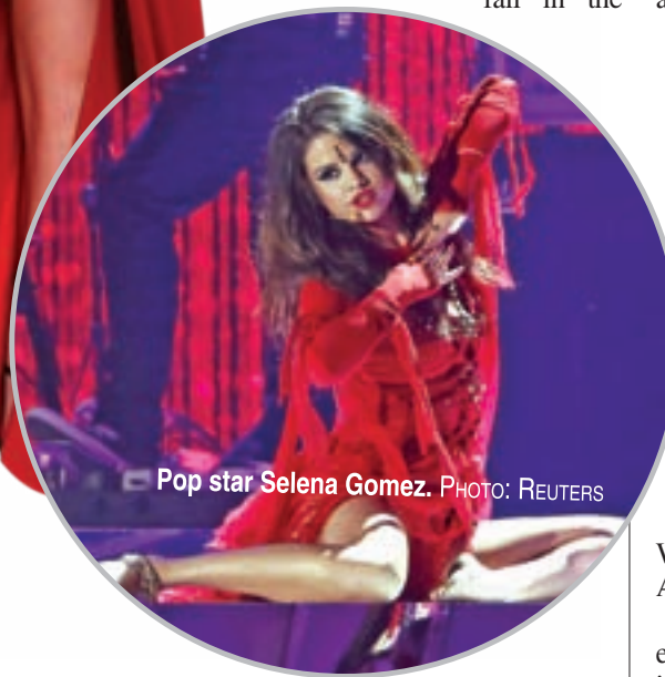
Pop star Selena Gomez.

French's new home is near to his ex-girlfriend Khloe Kardashian's residence.