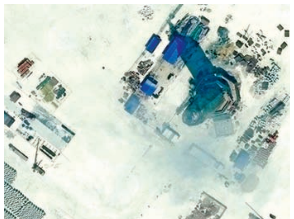
An octagonal tower with a conical feature at its top, located on the northeast side of Subi Reef was nearly complete measuring 40 feet on each side and 90 to 100 feet tall in this Centre for Strategic and International Studies (CSIS) Asia Maritime Transparency Initiative on 8 January 2016 satellite file image released to Reuters on 15 January 2016.

China claims most of the South China Sea, through which $5 trillion in ship-borne trade passes