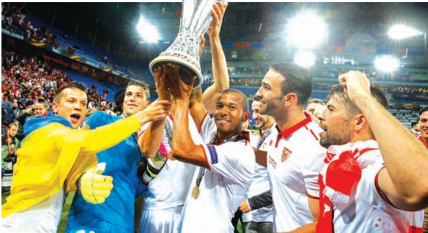
Sevilla's players celebrate with the trophy after their 3-1 victory over Liverpool at St. Jakob-Park, Basel, Switzerland on 18 May.