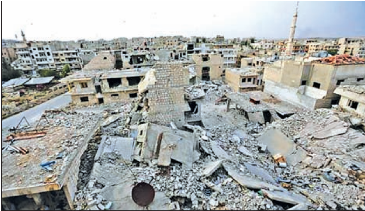
A general view shows damaged buildings in the rebel-controlled area of Maaret al-Numan town in Idlib province, Syria, on 15 May, 2016.

A recent surge in bloodshed in Aleppo, Syria's largest city before the war, wrecked the partial truce sponsored by Washington and Moscow that had allowed UN-brokered peace talks to convene in