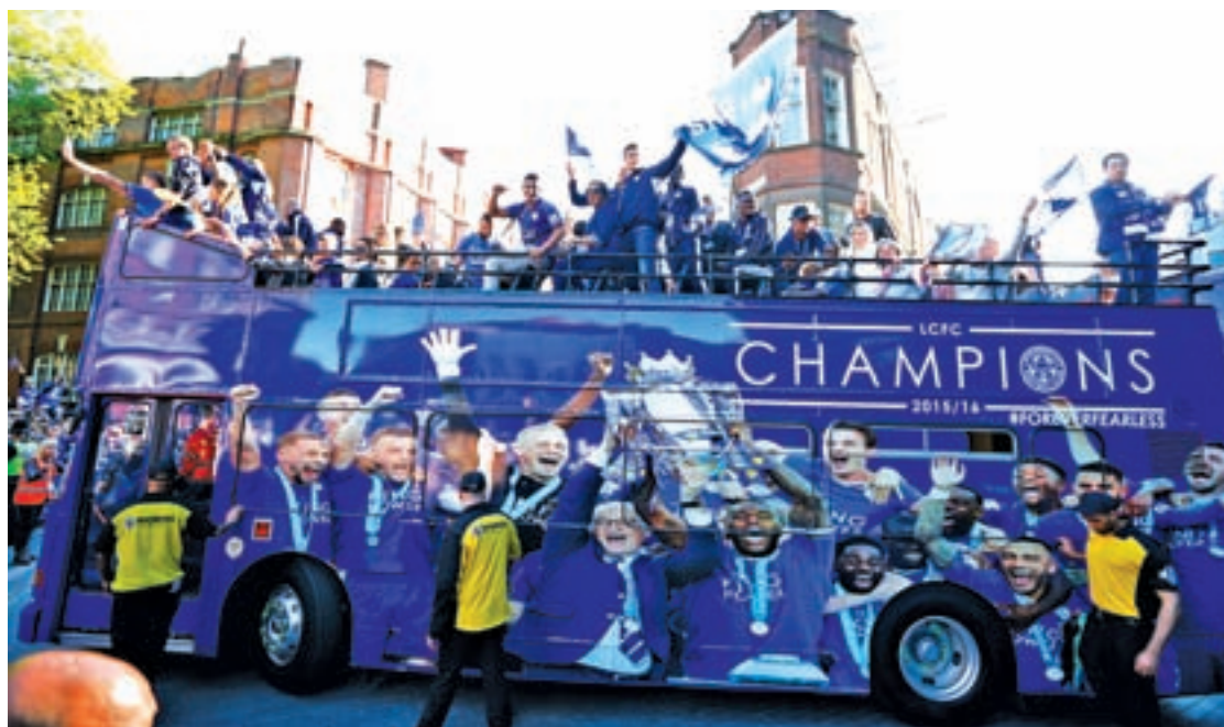
Leicester City celebrate with the trophy on the bus during the parade.

The players were individually introduced to the crowd who cheered every name and the players re-enacted being presented with the trophy — which they