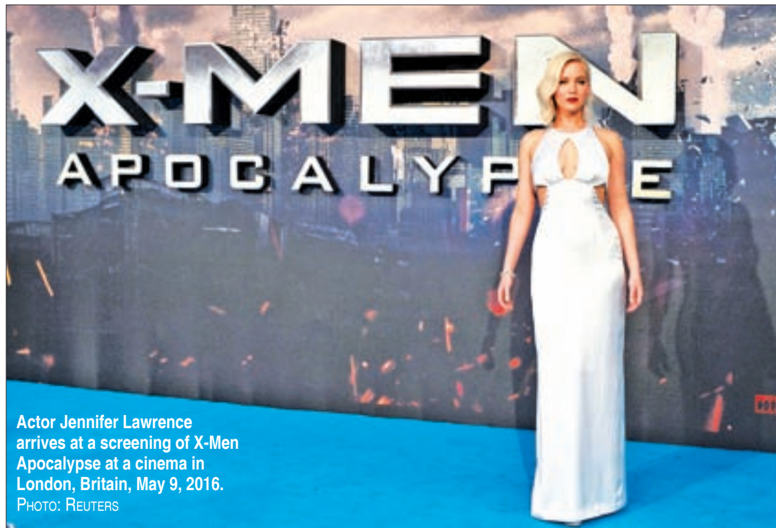
Actor Jennifer Lawrence arrives at a screening of X-Men: Apocalypse at a cinema in London, Britain, May 9, 2016.

LOS ANGELES — Hollywood stars Jennifer Lawrence and James McAvoy reprise their roles as powerful mutants in “X-Men: Apocalypse”, this time joining forces against a new supervillain.