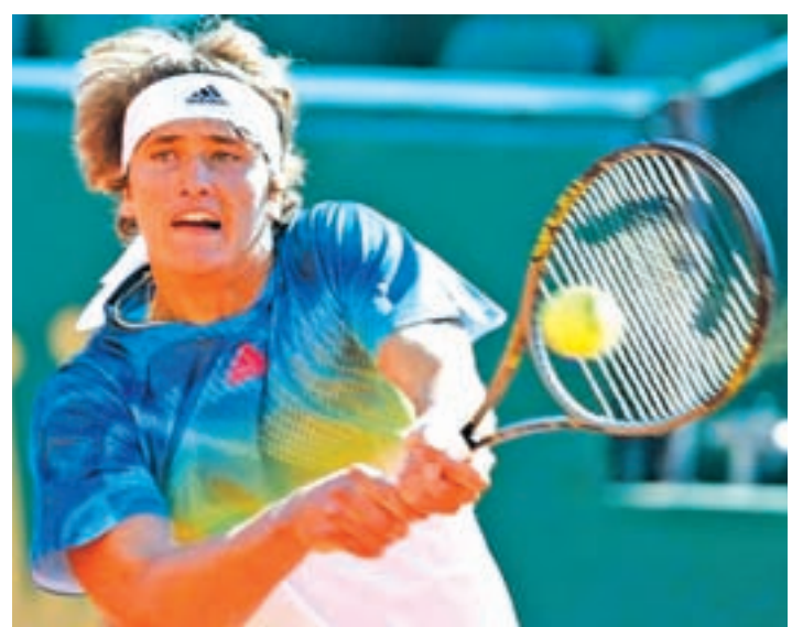
Alexander Zverev of Germany.

Throw teenagers Hyeon Chung (South Korea), Karen Khachanov (Russia) and Quentin Halys (France) into the mix alongside American 18-year-old Taylor Fritz, the youngest player in the top 100, Japan's Yoshihito Nishioka, Britain's Kyle Edmund and Swede Elias Ymer and