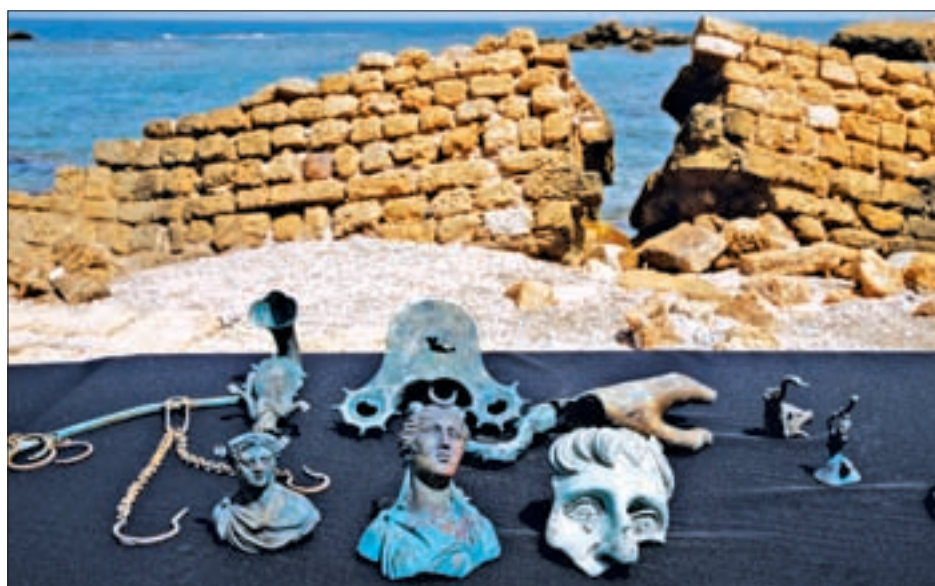
Items, which the Israel Antiquities Authority (IAA) estimate to be around 1600 years old, are displayed after they were recovered from a merchant ship in the ancient harbour of the Caesarea National Park, on 16 May 2016. PHOTO: REUTERS

Last year divers found a haul of 1,000-year-old gold coins inscribed in Arabic on the sea bed off Israel.—Reuters