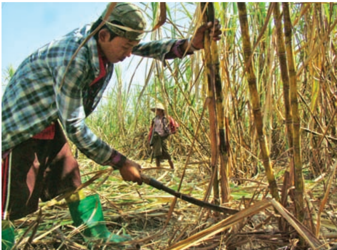
A worker cuts sugarcane to transport to sugar mill near Nay Pyi Taw.

He called for participation of all stakeholders including sugarcane growers and producers in the process of formulating a policy on sugar and sugarcane products. —Aung Thant Khaing