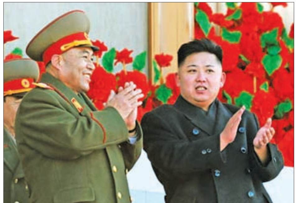
North Korean leader Kim Jong-Un (R) exchanges smiles with Ri Yong-ho during a military parade to mark the birth anniversary of the North's late leader Kim Jong-Il in Pyongyang, in 2012.

The UN Security Council in March imposed tough new sanctions against North Korea in response to its fourth nuclear test in January and the