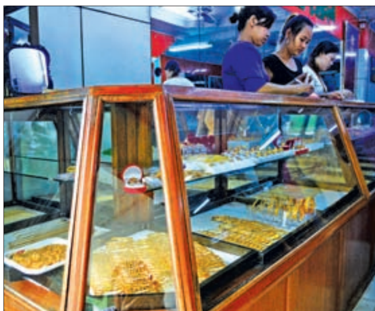
Gold jewelries are displayed at a shop in downtown Yangon.

In regard to the position of the markets yesterday afternoon, a tical of Myanmar gold valued at K792,000; a tical of 15 carat gold fetched K742,000; an ounce of gold on the world market priced US$1,270 while the MMK - USD exchange rate valued K1,170 to US$1.— Myitmakha News Agency