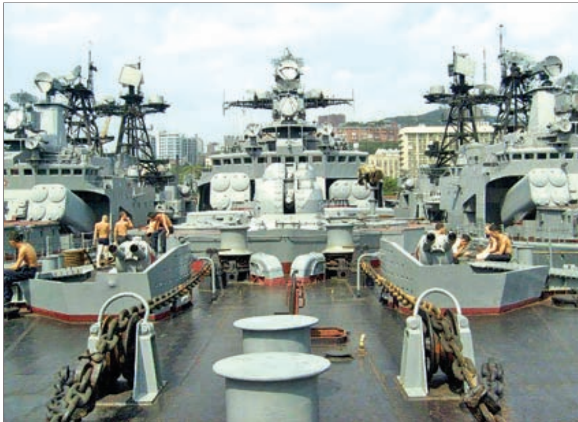
Russian battle ships being seen.

A RUSSIAN naval fleet will arrive at Yangon and stay from 18 to 22 May for a five-day visit. The fleet previously visited Myanmar in November 2013 for the given reason of encouraging friendship between the two na-