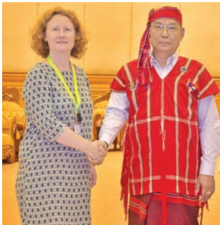
Speaker Mahn Win Khaing Than welcomes Ms. Judith Sargentini, representative from European Parliament.

SPEAKER of Pyidaungsu Hluttaw and Amyotha Hluttaw Mahn Win Khaing Than received Ms. Judith Sargentini, representative from European Parliament, in Nay Pyi Taw yesterday.