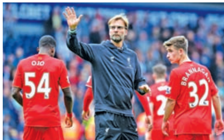
Liverpool's manager Juergen Klopp.

Klopp's team have ended in eighth place in the Premier League, their lowest finish since 2012. —Reuters