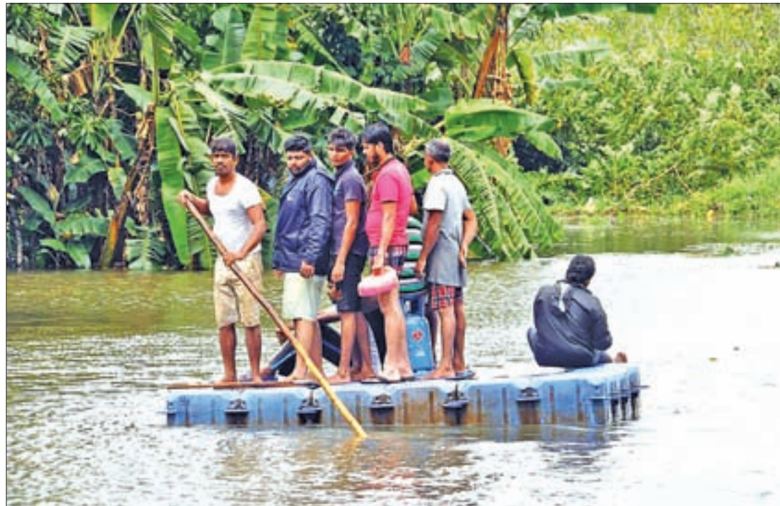
People take boat as the road was cut off from minor floods in Colombo, Sri Lanka, on 16 May, 2016. Several roads in the country have been cut off from minor floods and fallen trees and many schools around the country remained closed on Monday.

nounced Tuesday that those affected by the rains would be compensated and provided with immediate relief.