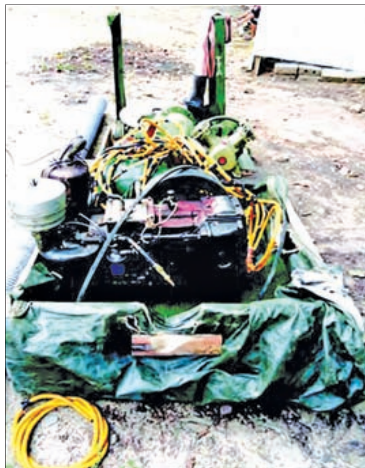
Seized gold mining items being seen. PHOTO: TOWNSHIP (IPRD)

May. A combined investigation team comprising officers and staff from Mong Phyat police station confiscated two rafts, two engines and 22 relevant items used in gold mining.— Township IPRD