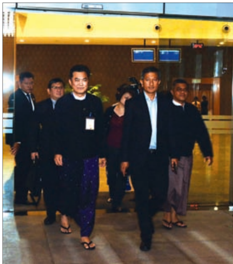
Singapore Minister for Foreign Affairs Dr. Vivian Balakrishnan (Right) arrives Nay Pyi Taw Airport.