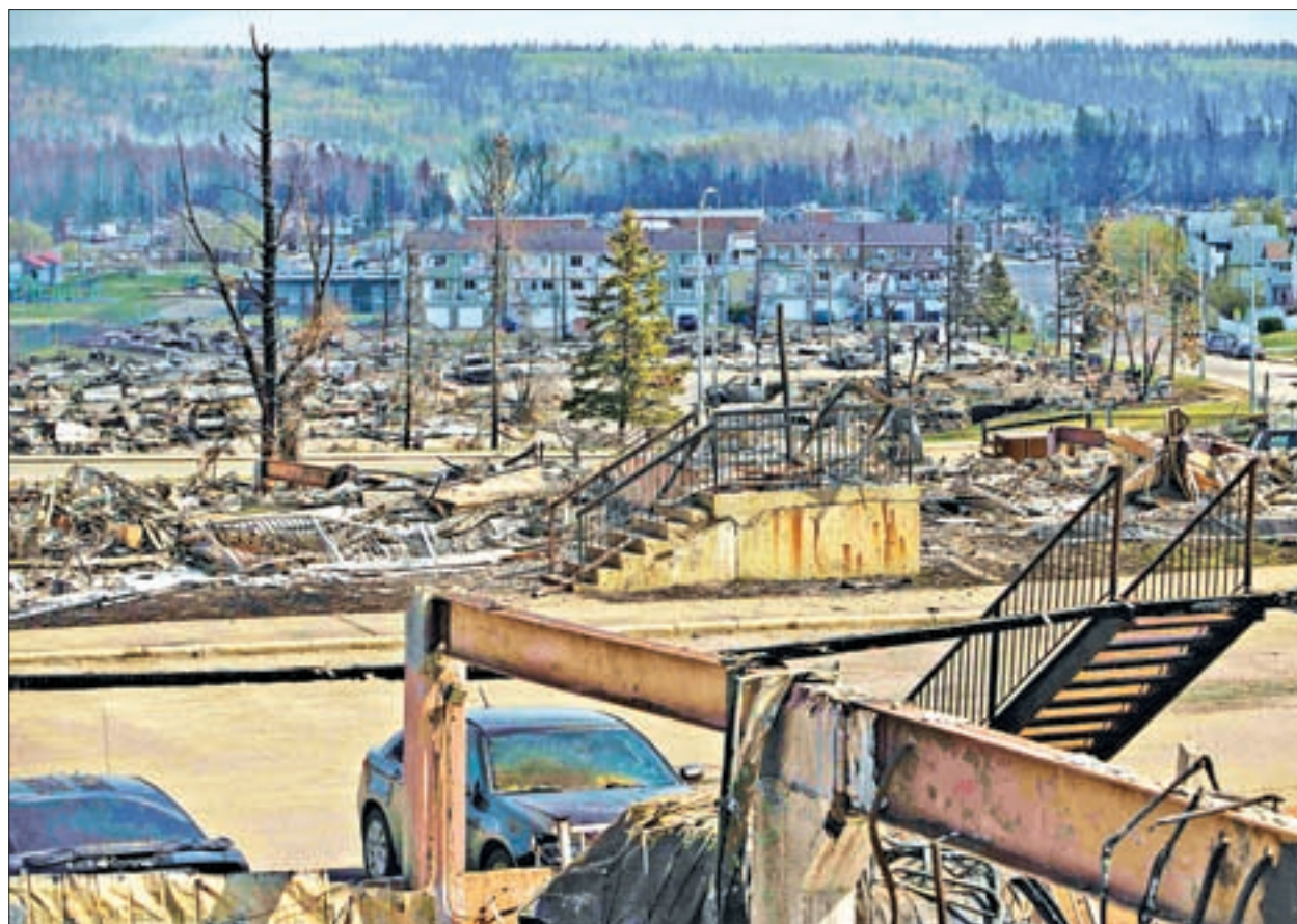
The devastated neighbourhood of Abasand is shown after being ravaged by a wildfire in Fort McMurray, Alberta, Canada, on 13 May 2016.