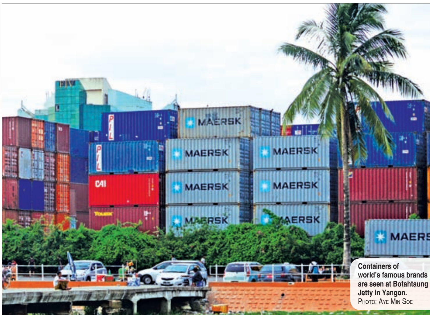
Containers of world's famous brands are seen at Botahtaung Jetty in Yangon.

Rain is expected during the next 24 hours over most areas in Kachin State, upper areas of Sagaing Region, Taninthayi Region, northern and eastern parts of Shan State and Chin State, as well as parts of other regions and states, with an 80-per cent degree of certainty.—GNLM