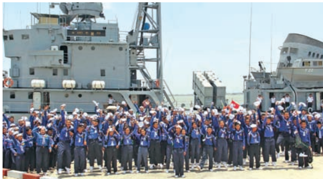
Trainees of Navigation Courses seen gathering.

THE Gathering Ceremony of Trainees from all camps of the Navigation Advanced Course and Navigation Basic Course for youths (group 1 for 2016) was held at the Bayintnaung accommodation camp in Yangon on Monday.