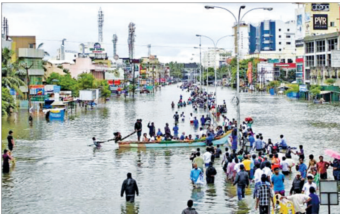
People travel on a boat as they move to safer places through a flooded road in Chennai, India in 2015.

The problem is that many city officials have no clear idea of the range of disaster risks they face and how serious they could be.