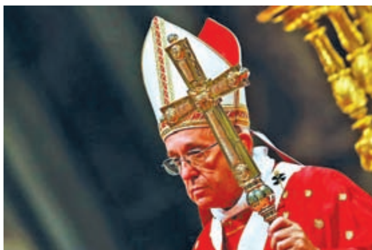
Pope Francis celebrates a mass of Pentecost in Saint Peter's Basilica at the Vatican on 15 May.

"We cannot advance without taking these cultures into account," the pope said.