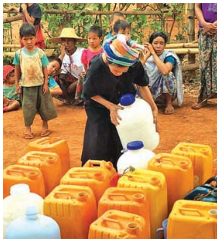
An ethnic woman fills plastic containers with water supplied by KBZ Brighter Future Myanmar foundation.

AS part of its efforts in combating water scarcity problems currently affecting areas across the country, KBZ's Brighter Future Myanmar Foundation has offered communities currently facing drought and/or a scarcity of fresh water to contact the foundation and arrange for fresh potable water to be delivered.