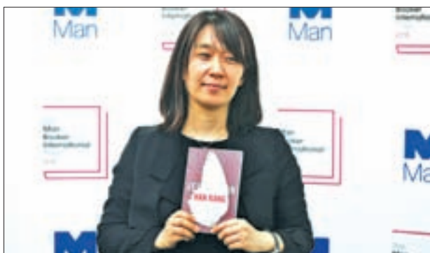
South Korean author Han Kang poses with her novel ‘The Vegetarian’, which is nominated for the Man Booker International Prize, during a media event in London, Britain, on 15 May 2016.

The novel was translated by Deborah Smith, a 28-year-old Briton who only began learning Korean when she was 21. Han and Smith will split the 50,000 pound ($72,000) prize equally, according to the