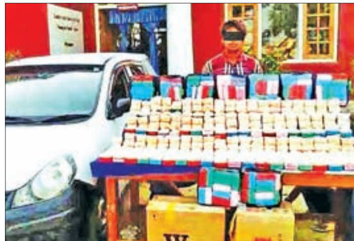
Criminal posing with seizures.