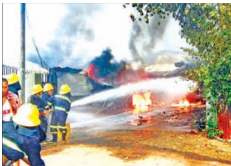
Fire fighters seen extinguishing the blaze.

A FIRE destroyed a car repair station located at the corner of Padamyar and Myadar road in Pynmabin village, Mingaladon township on Monday.