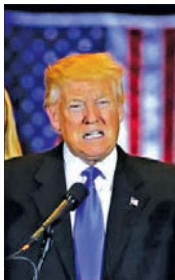
Republican US presidential candidate and businessman Donald Trump.

appeared negative," Lane said on Fox News. "I did not have a negative experience with Donald Trump."