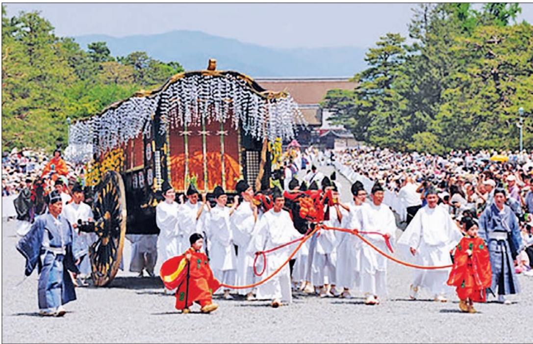
People in ancient Japanese court-style attire participate in the annual Aoi Matsuri, one of the three main festivals of Kyoto, in the western Japan city on 15 May, 2016. Around 500 participants, dressed as nobles of the Heian Period (794-1185), walked with decorated ox carts and horses around an eight kilometre course from Kyoto Imperial Palace to Shimogamo and Kamigamo shrines, during the ancient capital's major festival, which dates back 1,400 years.