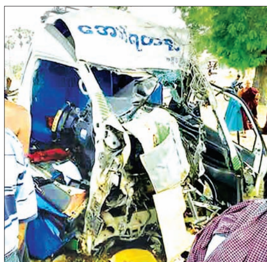
The aftermath of the crash on the Monywa-Ye U road.

The driver is facing charges by local police under Criminal Law. —Myo Win Tun