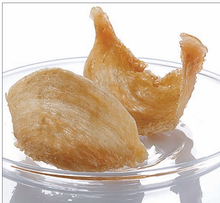
Edible nest swiftlets ( Collocalia fuciphaga ).

"Two types of nests are sold at the market: those from islands and those collected from breeding houses. The edible nest swiftlets naturally make their nests here without the use of imitated voice. The price of nests ranges from K1.6 million to K2 million per viss, depending on the variety and quality of the nest," said U Maung Maung Oo from Kanna Road in Myeik.