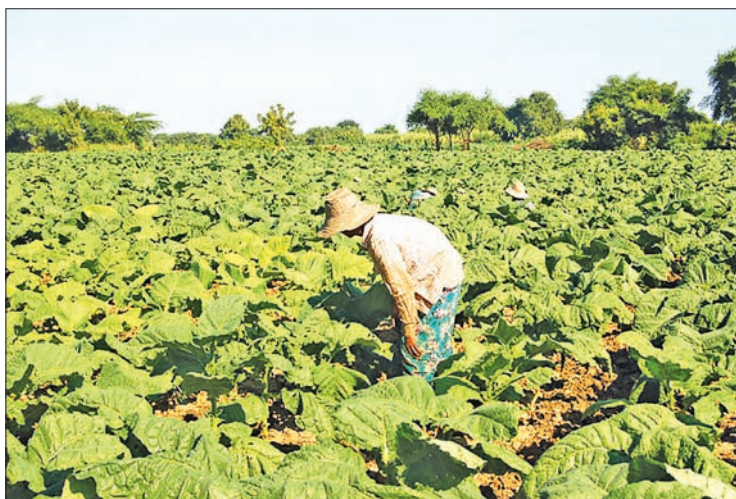
A farmer working on tobacco plantations.

The surplus crops, after setting aside enough quantity for consuming on the farm before the next crop, for alms to the monks and for visiting relatives, were then sold out to the best buyers. With this earning from the soil, rich and poor alike would seek to gather as much good merits as they can. In years of good harvest and better prices families may find a bride for the unmarried son, or hold a big novitiation ceremony by erecting a big pandal and offering meals to comers from all corners for some seven days. Those who could afford more would renovate or build local monasteries and pagodas so that they could claim highly coveted religious titles like in Buddha's times. What an adorable way of life and a simple but noble outlook. And no harm done whatsoever to