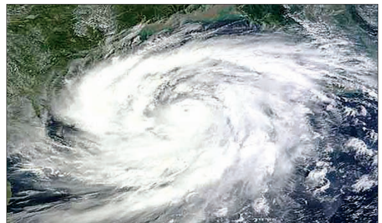
The satellite image of a low pressure.

Yangon will be cloudy today, according to the weather bureau forecast.—GNLM