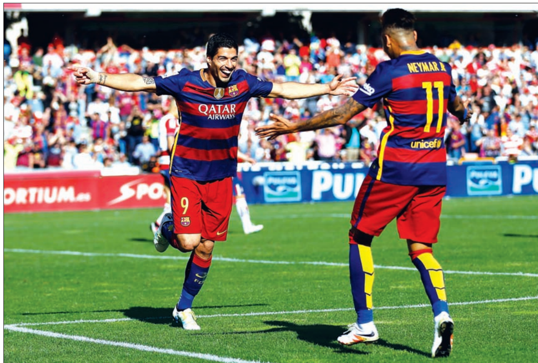
Barcelona's Luis Suarez (L) celebrates his third goal with team mate Neymar during Spanish Liga BBVA at Los Carmenes stadium, Granada, Spain on 14 May 2016.