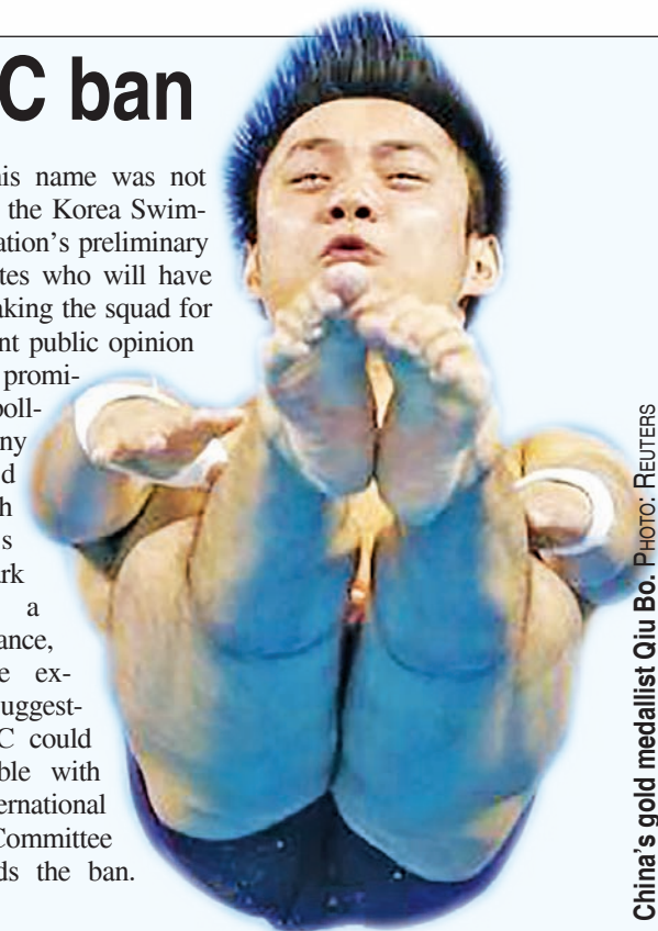
China's gold medalist Qiu Bo.

However, his name was not included on the Korea Swimming Federation's preliminary list of athletes who will have a shot at making the squad for Rio. A recent public opinion survey by a prominent local polling company suggested most South Koreans thought Park deserved a second chance, while some experts have suggested the KOC could be in trouble with the International Olympic Committee if it upholds the ban.—Reuters