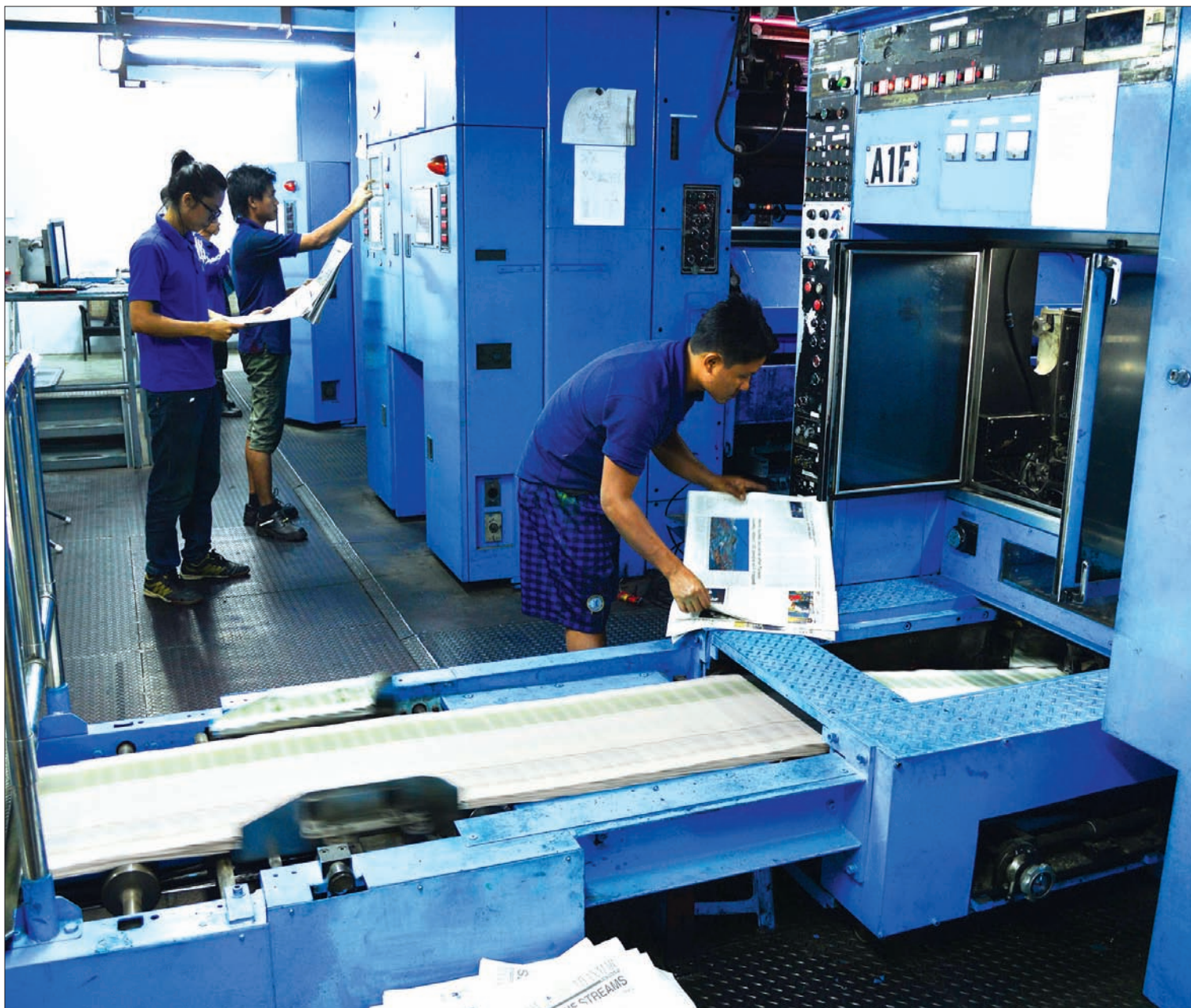
A printing press rolls out dailies at the joint-venture English-language newspaper The Global New Light of Myanmar. The Myanmar government also owns two dailies in Myanmar language and the Myanma Radio and Television broadcasting service.

State media to connect people and government: Dr Pe Myint