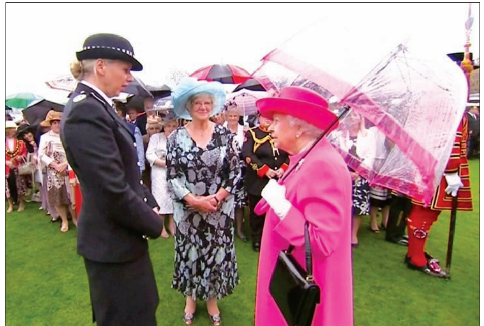
Britain’s Queen Elizabeth speaks to Commander Lucy D’Orsi during a garden party at Buckingham Palace in London, Britain, on 10 May 2016.

The queen, who has been on the throne for 64 years and is the oldest monarch in British history, mingled with crowds during a walkabout near the castle