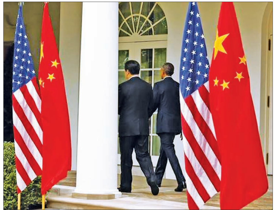
China's President Xi Jinping (L) and US President Barack Obama depart at the end of a joint news conference in the Rose Garden at the White House in Washington in 2015.