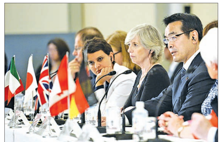
Japan's education minister Hiroshi Hase (R) speaks alongside education ministers from the Group of Seven countries and the European Union at a press conference in Kurashiki, western Japan, on 15 May 2016, as they wrap up a two-day meeting.

OKAYAMA, (Japan) — Education ministers from the Group of Seven industrialised countries agreed Sunday to work together to address global issues including refugees and widening income inequality as they wrapped up a two-day meeting in Okayama Prefecture in western Japan.