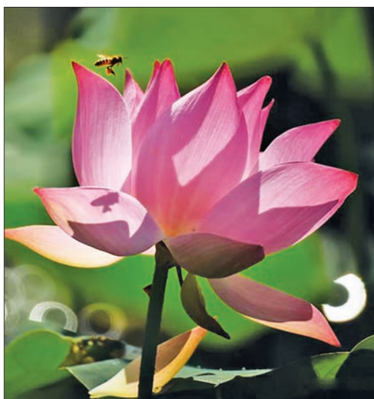
TAIPEI — A bee collects honey on a lotus at a lotus pool in Taipei’s Palace Museum, southeast China’s Taiwan, on 13 May 2016.