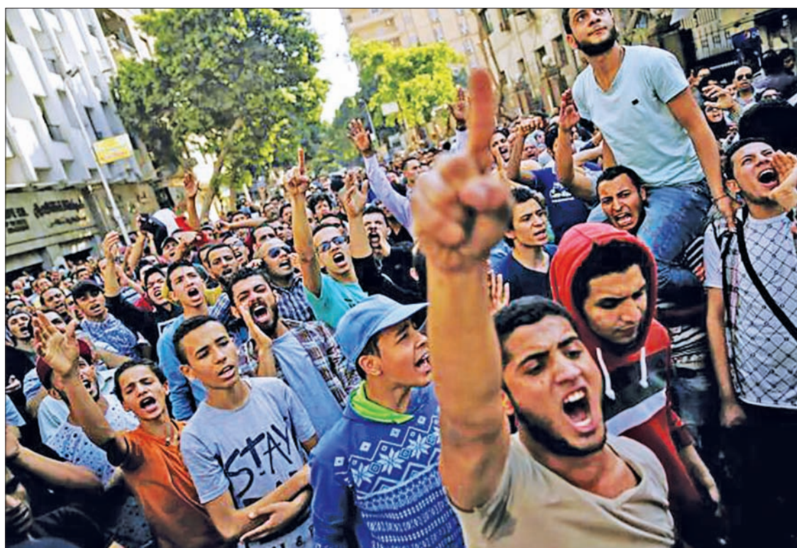
A worker walks atop a tanker wagon to check the freight level at an oil terminal on the outskirts of Kolkata, India in 2013.

on Iran have been lifted, the United States maintains some sanctions and a trade embargo. This means banks cannot use the dollar for any deals with Iran, while US