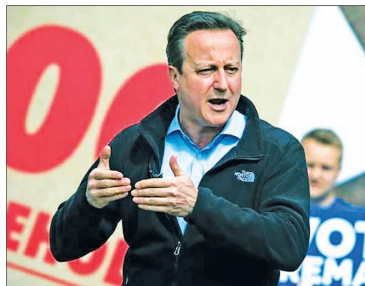
British Prime Minister David Cameron delivers a speech to supporters of the 'Stronger In' campaign event in Witney, Oxfordshire, Britain, on 14 May 2016.

Bank of England Governor Mark Carney warned on Thursday of the risk of a sharp slowdown in Britain's economy, and possibly a short recession, if the country left the EU. The ComRes poll did not ask voters how they intended to vote on 24 June.— Reuters