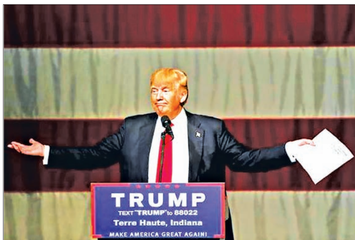
US Republican presidential candidate Donald Trump speaks at a campaign event at the Indiana Theater in Terre Haute, Indiana, US, on 1 May 2016.