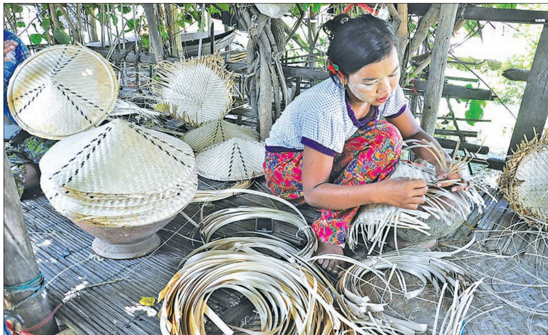
A worker makes a bamboo hats in Mandalay.

with the Department of Social Security must make contribution payments to the department. The contribution of such payments allows for the availability of social