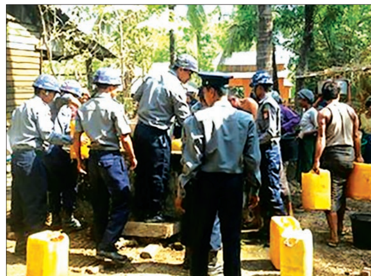
Police officers distribute clean water.

The Myanmar Police Force has donated a total of 346,452 gallons of clean water between 25 April and 14 May, according to the police force. —Myanmar Police Force