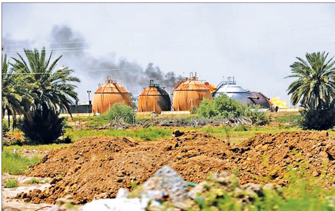
Smoke rises from gas storage tanks after a bomb attack against a state-run cooking gas factory in Taji at Baghdad's northern outskirts, Iraq on 15 May, 2016.

Prime Minister Haider al-Abadi said on Saturday the militants were taking advantage of a political crisis in the country, sparked by his attempt to overhaul its quota-based governing system, to conduct bombings in areas under nominal government control. A US-led coalition backing the Iraqi government in its fight against Islamic State has been training army forces for months at a military base located in Taji.—Reuters