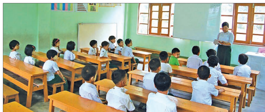
A classroom with good pupil teacher ratio.

According to one education consultant, there are approximately 1.5 million kindergarten students across the nation.—Aung Thant Khaing