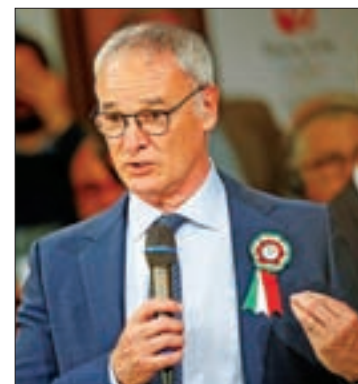
Leicester City manager Claudio Ranieri talks after receiving the Enzo Bearzot award, for the best Italian coach of the season, during a ceremony in Rome, Italy on 9 May 2016.

"It's him who should be thinking about us.