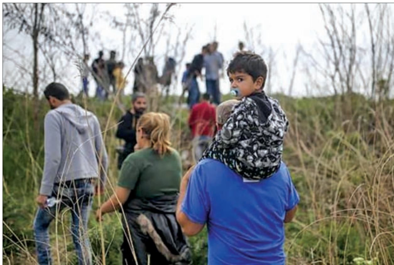
Migrants and refugees walk through a field to block the road during a protest near the Greek-Macedonian border, near the town of Polykastro, Greece, on 2 April 2016.

called upon to develop plans for including refugees and migrants in education, language and skills training and employment opportunities.