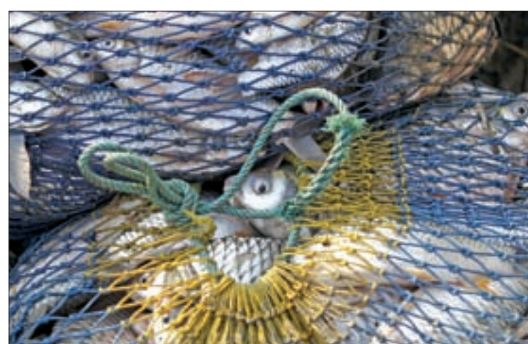
Fish are seen in a net at a fish farm in Yangon.

Myanmar still sits at the top of the list in terms of fish numbers with the highest possession of aquatic resources among the ASEAN partners. However, there is a large gap in fish exports compared to Thailand and Viet Nam as Myanmar suffers from weak