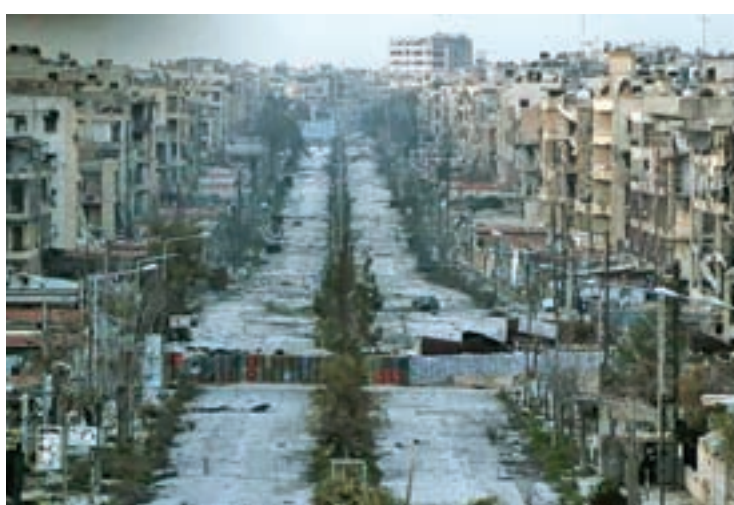
A general view shows a damaged street with sandbags used as barriers in Aleppo's Saif al-Dawla district, Syria in 2015.

“We have decided to reconfirm our commitment to the (ceasefire) in Syria and to intensify efforts to ensure its nation-wide implementation,” they said. “We demand that parties cease any in-