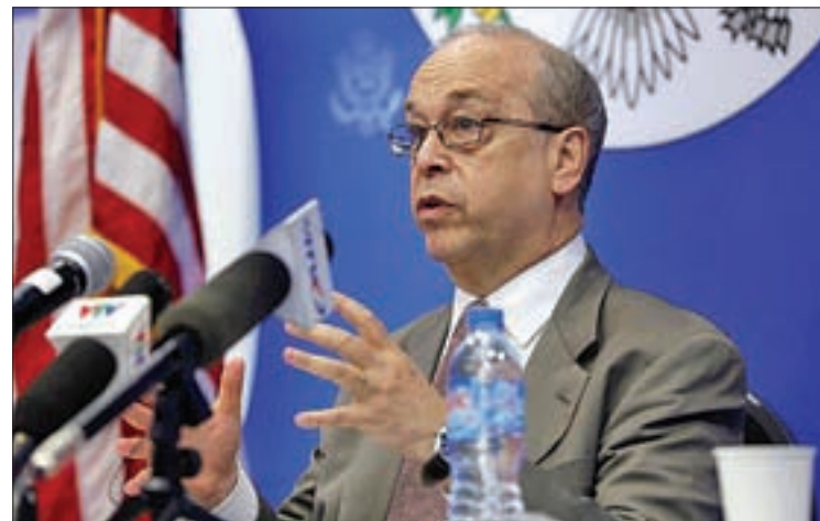
US Assistant Secretary of State for East Asian and Pacific Affairs Daniel Russel speaks at a news conference, as part of his visit to Viet Nam, ahead of a visit by US President Barack Obama later this month, in Hanoi, on 10 May 2016.

Even as Viet Nam seeks warmer relations with the United States, though, US officials are mindful that suspicions linger among Communist Party conservatives that Washington wants to undermine their country's one-party system.—Reuters