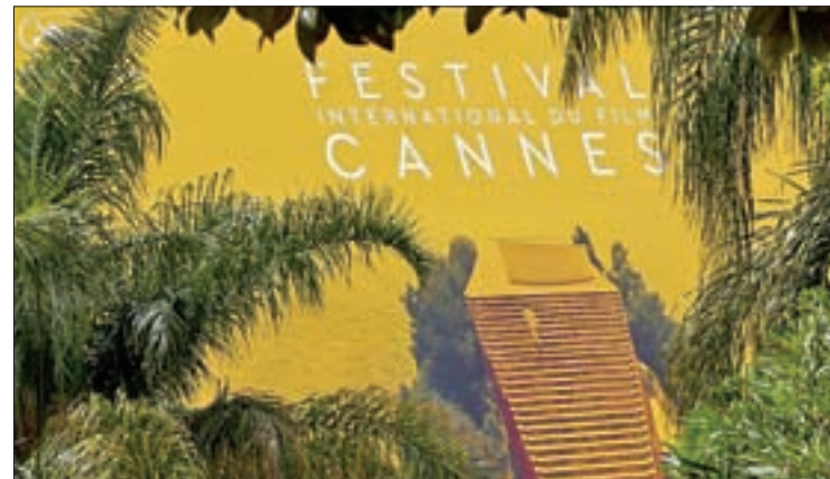
Palm fronds and trees frame a giant canvas of the official poster of the 69th Cannes Film Festival in Cannes, France, 9 May, 2016.

"As we are about to open this festival and as I come here to check the security protocol, we are ... facing a risk that is higher