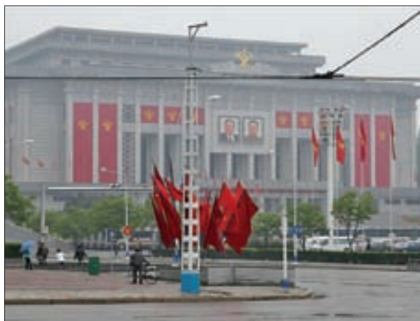
Photo taken on May 6, 2016 shows the April 25 House of Culture, where the 7th Congress of the Workers' Party of Korea (WPK) is held in Pyongyang, capital of the Democratic People's Republic of Korea (DPRK).

SEOUL — South Korea will never recognise Democratic People's Republic of Korea (DPRK) as a nuclear-weapons state, the foreign ministry said on Tuesday.