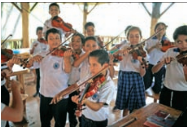
Orchestra members from the Don Bosco Youth and Choir Orchestra participate in a practice in San Salvador, El Salvador on 20 April 2016.

"The levels of violence we have reached is absurd. It's senseless. For me violence is also about having a child stuck at home because it's too dangerous for them to be on the street. And the street means gangs." — Reuters