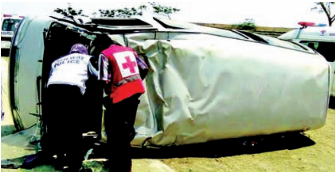
Hi-Ace turns over on Yangon-Mandalay Highway.

A VEHICLE turned over between mileposts 278/1 and 278/2, on the Yangon-Mandalay Highway on Monday leaving nine passengers injured.