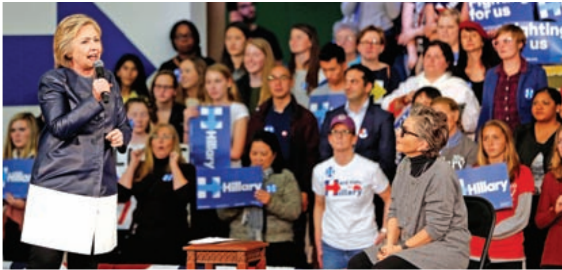
US Democratic presidential candidate Hillary Clinton address the crowd while visiting La Escuelita School in Oakland, California, US, on 6 May, 2016.

WASHINGTON — Bernie Sanders has another chance on Tuesday to slow Hillary Clinton's march to the Democratic presidential nomination as West Virginians vote in their state's primary, a week after Donald Trump became the presumptive Republican nominee.