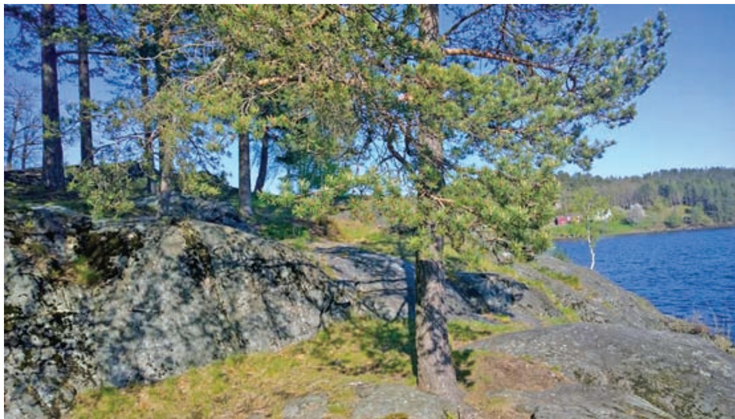
The park which is named after Nobel Laureate State Counsellor Daw Aung San Suu Kyi.