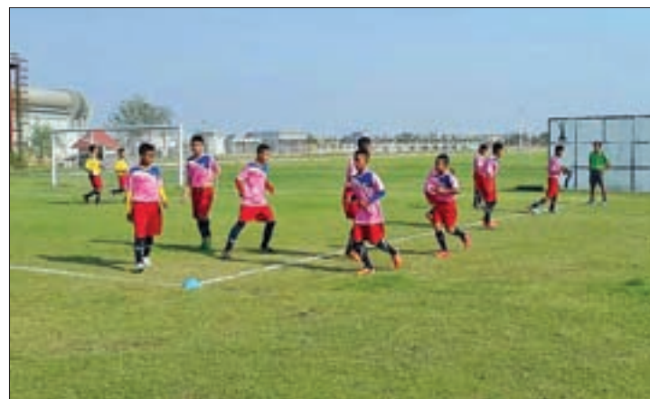
School children receive soccer skills in summer in Yangon.