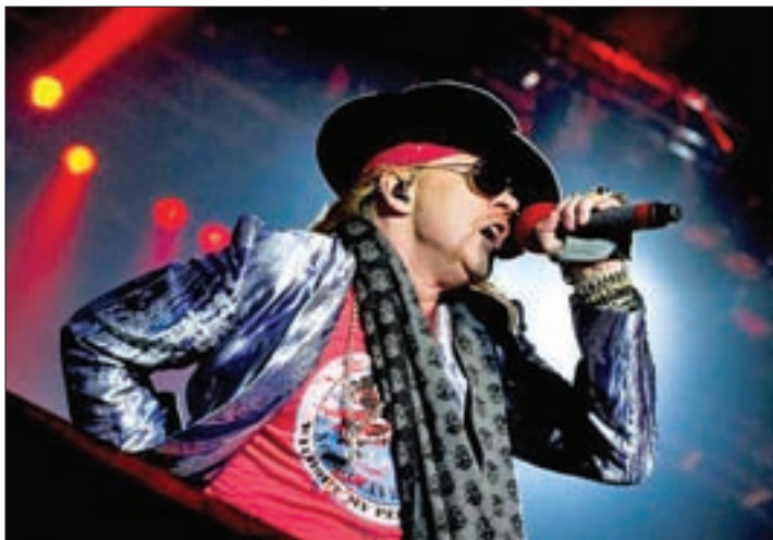
Axl Rose of Guns N' Roses performs during the Sweden Rock Festival 2010 in Solvesborg, Sweden, in 2010.

LISBON — Guns N' Roses front man Axl Rose made his debut with AC/DC while standing in for lead singer Brian Johnson at a concert in Lisbon on Saturday, as a part of the band's world tour.