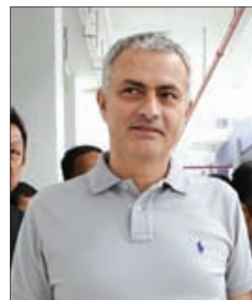
Former Chelsea manager Jose Mourinho.

One of the world's most successful coaches, Mourinho said last month that while he had not signed a contract with anybody, he expects to be back in football in time for the start of next season.