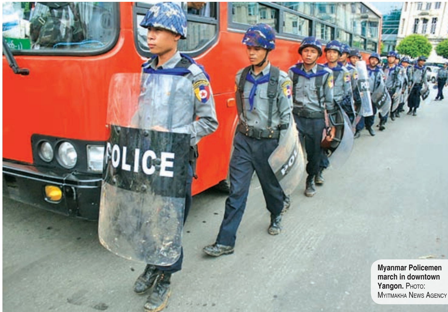
Myanmar Policemen march in downtown Yangon.

Analysis What counts is the heads of departments PAGE 8