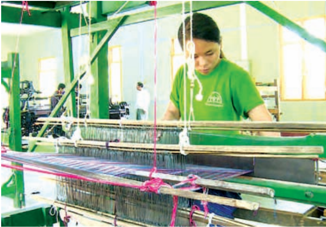
A woman students seen learning how to weave.

WEAVING training courses are being opened at the weaving training school in Loikaw, Kayah state with the objective of creating job opportunities for locals.