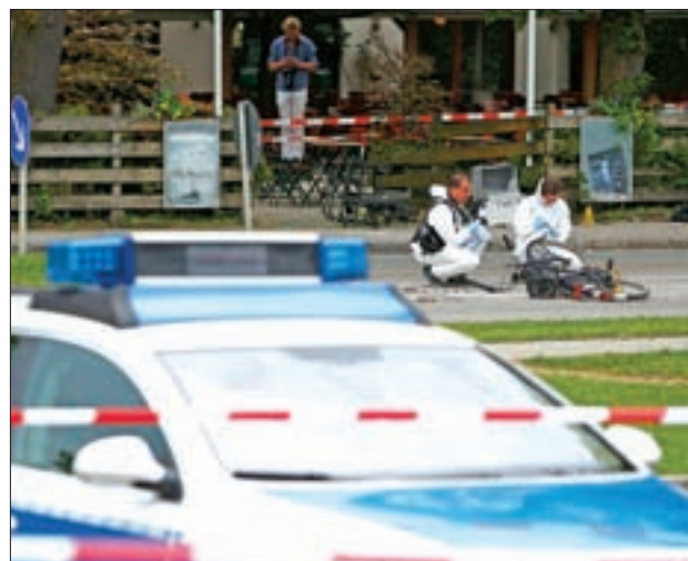
Police officers look for evidences at the train station after an attack in Grafing, southeast of Munich, Germany, on 10 May 2016.

But Imperial Oil said late on Monday it completed a controlled shutdown of its Kearl oil sands mining project, blaming the uncertainties associated with logistics.—Reuters