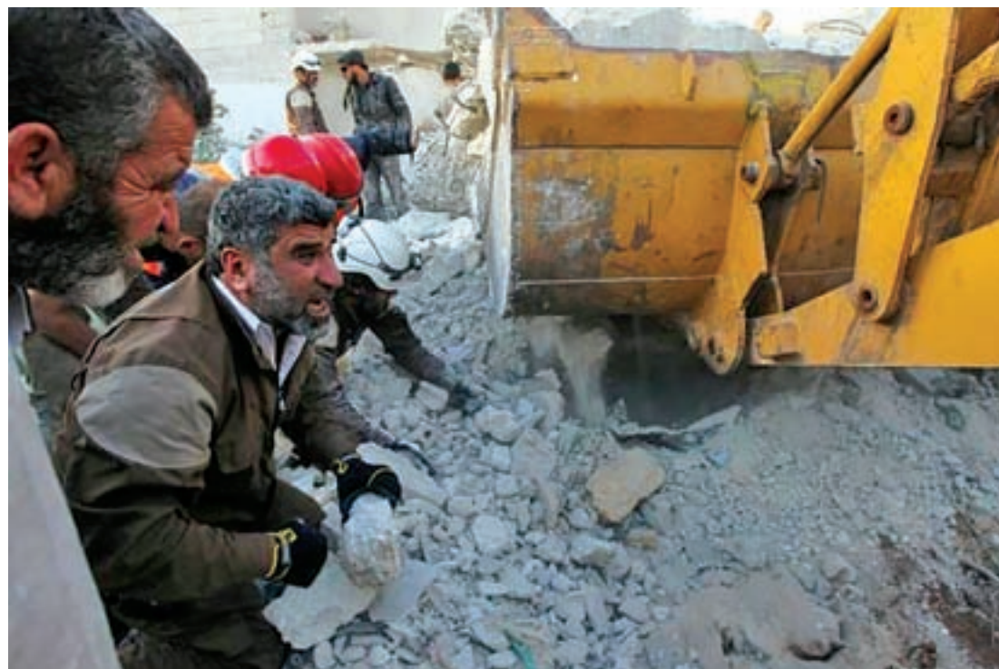
Residents and civil defence members look for survivors at site damaged by an airstrike in Hafsarja, in the insurgent stronghold of Idlib Province, Syria, on 9 May 2016.

BEIRUT — Air strikes on a town in Idlib Province in Syria's northwest killed at least 10 people on Tuesday, monitoring group the Syrian Observatory for Human Rights reported.