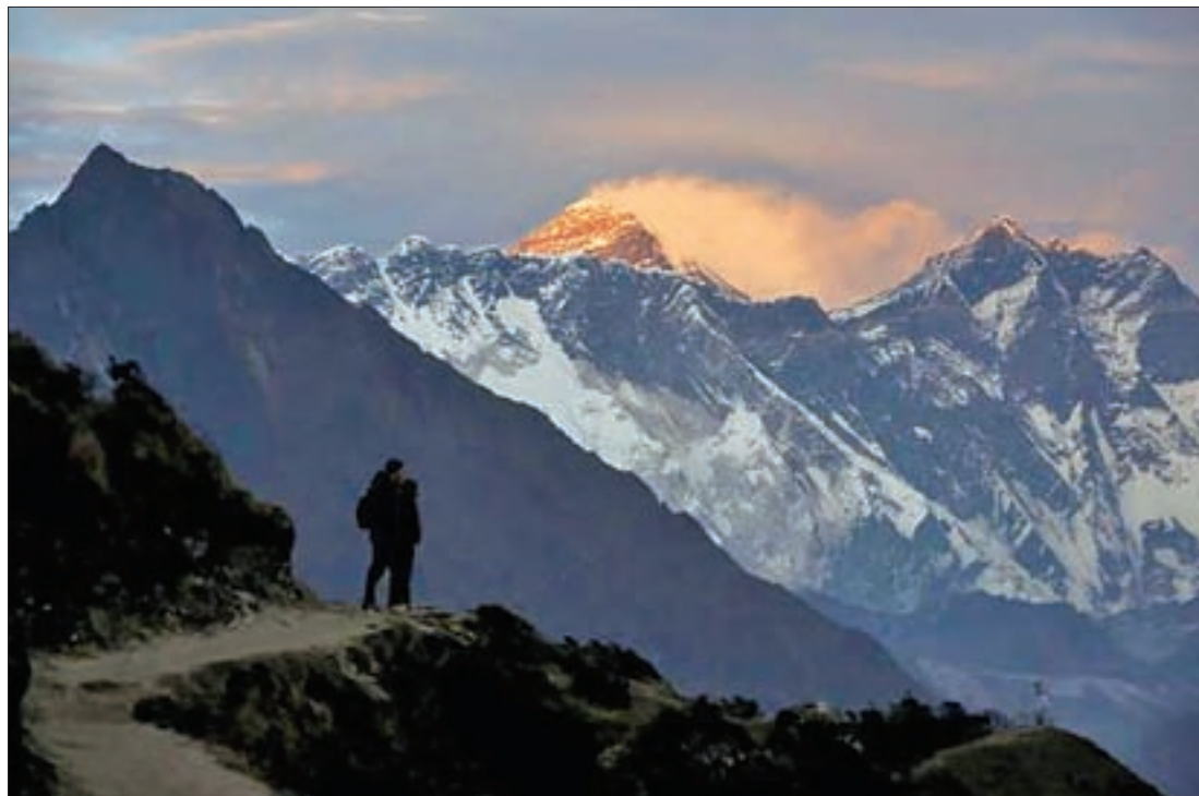
Light illuminates Mount Everest (C) during sunset in Solukhumbu District, also known as the Everest region.

KATHMANDU — Climbers on Mount Everest are on the brink of the first attempts in three years to make the final ascent to the world's tallest peak, after fatal avalanches cut short the 2014 and 2015 campaigns.