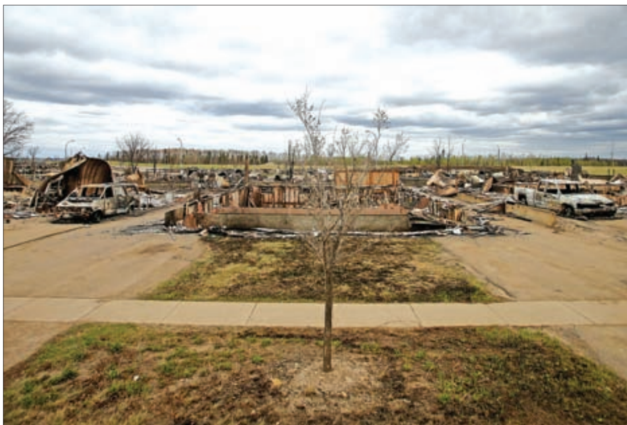
Charred vehicles and homes are pictured in the Beacon Hill neighbourhood of Fort McMurray, Alberta, Canada, on 9 May 2016 after wildfires forced the evacuation of the town.

The fire, expected to grow further on Tuesday, ravaged some 204,000 hectares (504,000 acres) of Alberta. But it also moved far