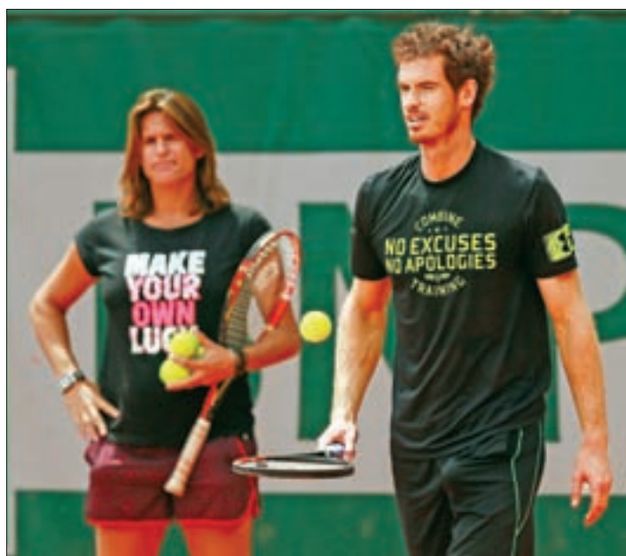
Andy Murray and coach Amelie Mauresmo.

The partnership between the two Wimbledon champions — Murray won the men's singles in 2013 and French former