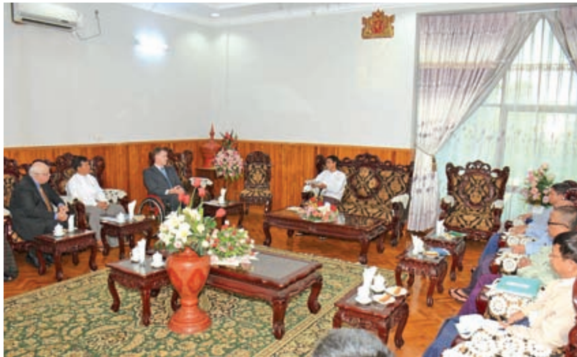
Union Minister Dr Aung Thu meets a mission of the Wildlife Conservation Society in Nay Pyi Taw yesterday.

UNION Minister for Agriculture, Livestock and Irrigation Dr Aung Thu received a mission from the Wildlife Conservation Society (WCS) at his office in Nay Pyi Taw yesterday.