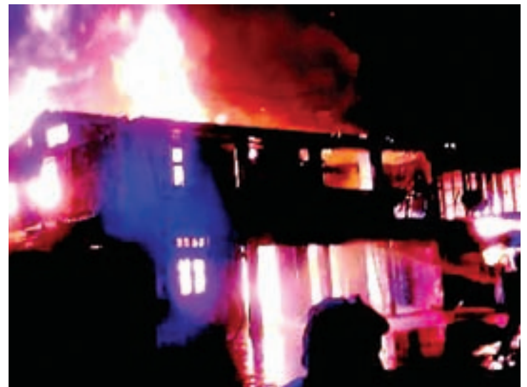
Fire devouring three houses in Pyin Oo Lwin .

Police are still investigating the case.—Thet Naing (Pyin Oo Lwin)