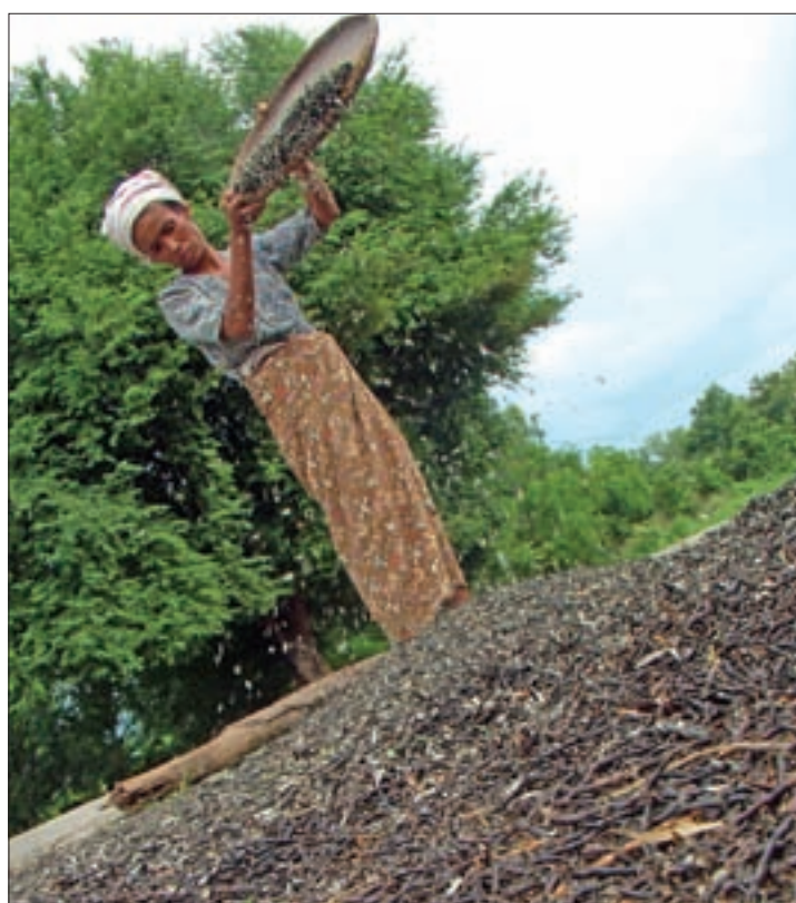
A farmer tosses peas into the wind to remove sand and other impurities before transport.

The price of green grams was only K40,000 per basket in 2015 while the price rose up to over K50,000 per basket in April. The export volume of green grams reached 1,000 baskets and this year it is expected to reach 1,500 baskets.— Chan Chan