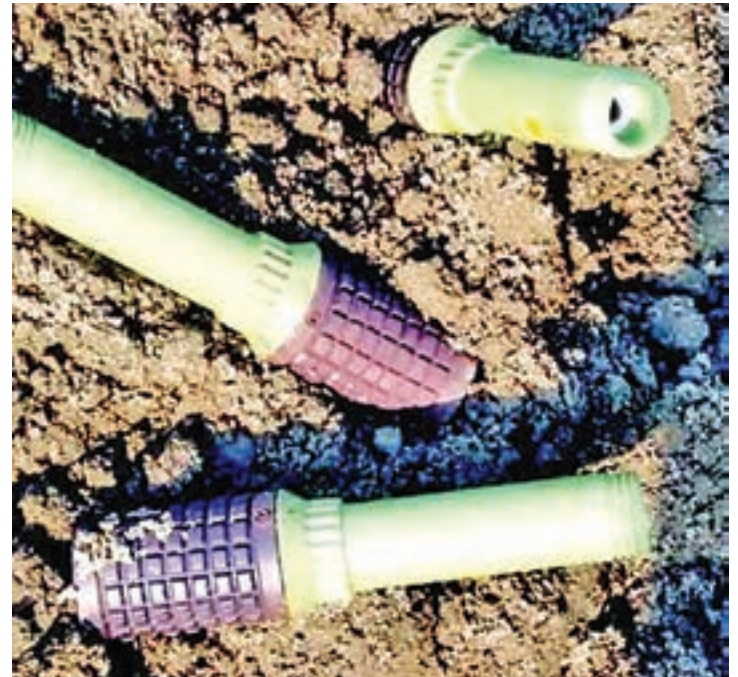
Three hand grenades being seen. PHOTO: 064

One woman was injured by the explosion of landmines in Seikmu village on 8 May.—064