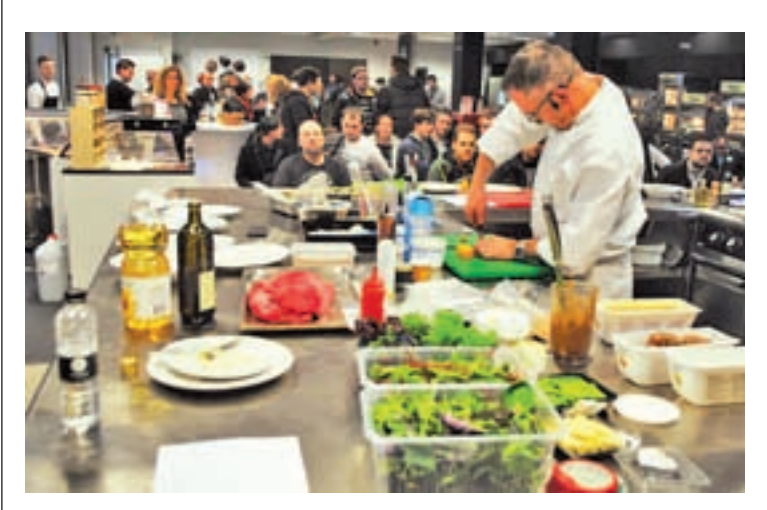
The HORECA Bizmatch fair being seen.

THE 3<sup>rd</sup> HORECA Bizmatch fair is scheduled to take place in both of the major Myanmar commercial cities, Yangon and Mandalay, this month, an organiser said, with the aim of portunity for Thai business enpromoting more business opportunities between Myanmar and Thailand.