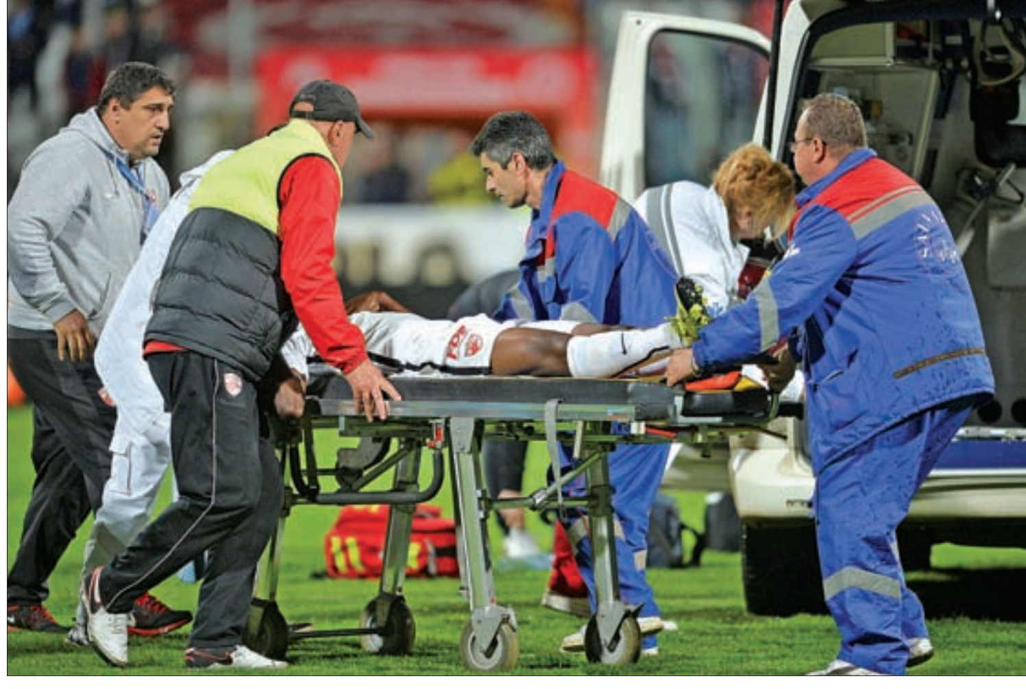
Dinamo Bucharest's Patrick Ekeng is transported to an ambulance after collapsing during a play-off match against Viitorul Constanta in Bucharest, Romania, on 6 May.

"We started resuscitation measures that lasted approxi-