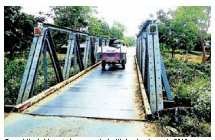
One of the bridges to be renovated with foreign loans in 2016.

NEARLY 80 bridges will be renovated or built anew with foreign loans in 2016, according to the Ministry of Construc-