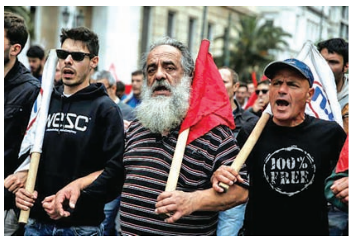
Members of the communist-affiliated PAME union shout slogans during a 48-hour general strike against tax and pension reforms in Athens, Greece, on 6 May 2016.

ATHENS — Greeks went on a 48-hour nationwide strike on Friday to protest against tax and pension reforms, as Prime Minister Alexis Tsipras appealed to fractious lawmakers to approve the overhaul as part of a multi-billion euro bailout.