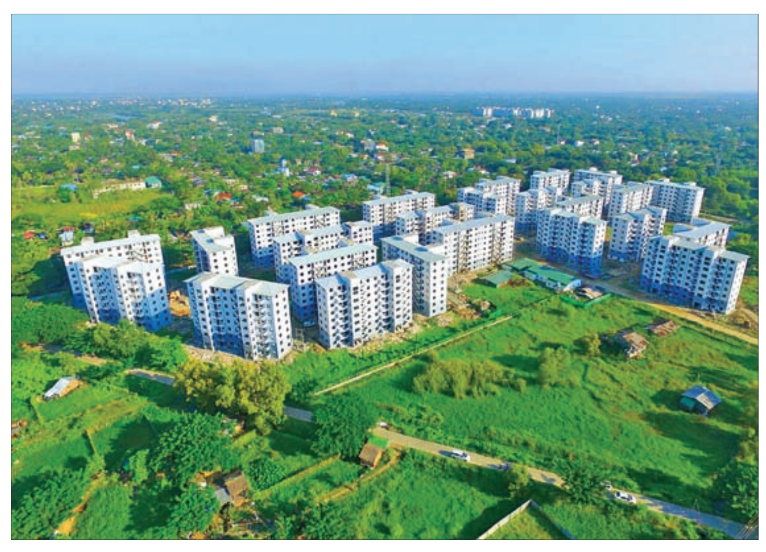
A new housing in Yangon is ready to welcome customers.