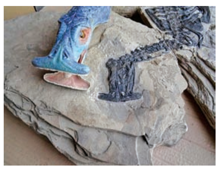
A fossil of Atopodentatus unicus is seen alongside a reconstruction showing what it would have looked like in life is shown in this image released on 6 May.

When thinking of hammerhead creatures, sharks may come to mind. But Atopodentatus' hammerhead feature differed in location and function from the sharks, whose eyes are on the end of lateral extensions on their head.