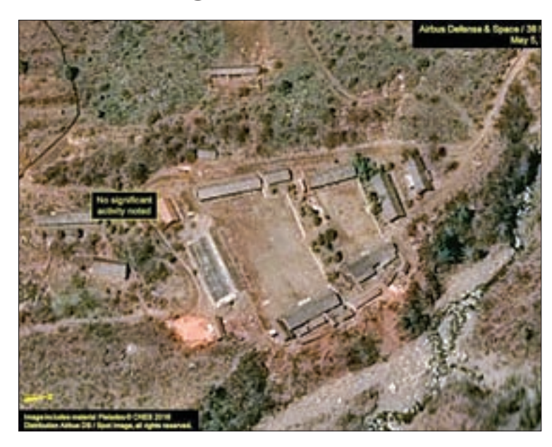
The Punggye-ri test site in North Korea is seen in an image from Airbus Defense and Space and 38 North taken on 5 May 2016 and released on 6 May 2016.

WASHINGTON — North Korea may be preparing to carry out a fifth nuclear test in the near future judging by commercial satellite images of the country's nuclear test site taken on 5 May, a US think tank said on Friday.