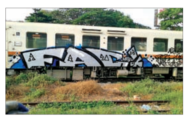
The train coaches being painted graffiti.

TWO teenagers have been arrested for acts of vandalism they purportedly committed on Wednesday and Thursday, according to Yangon railroad po-