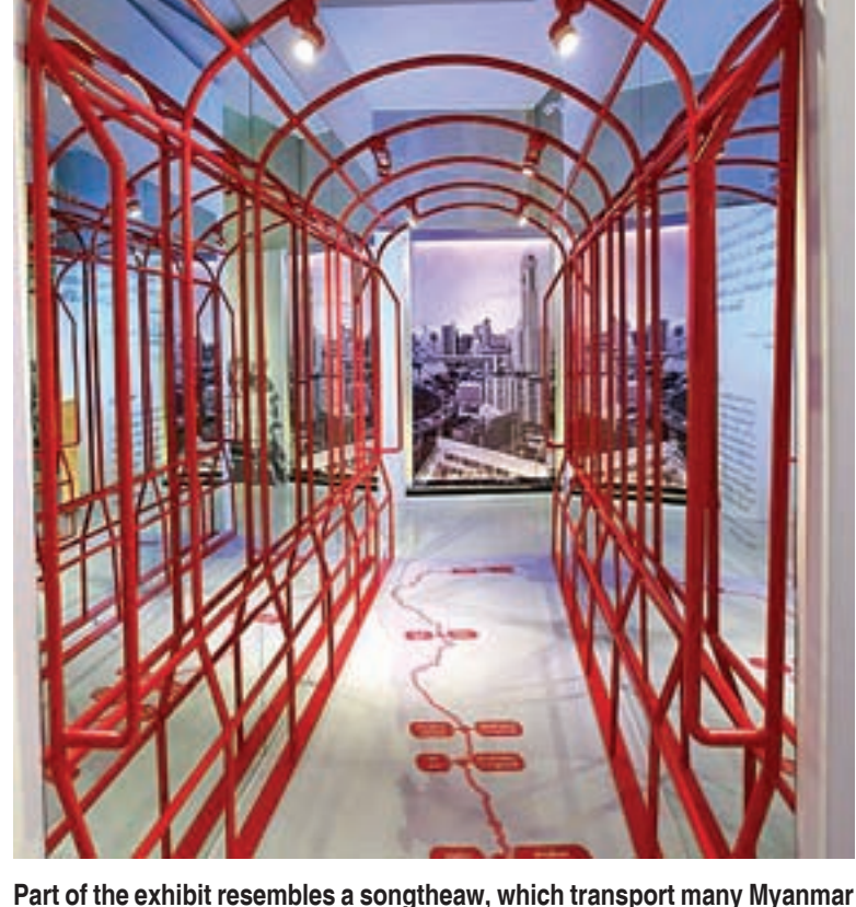
migrants into Thailand.

der diversity is not the only one in the exhibit. A lack of tolerance in Myanmar for people of marginalised gender identities as well as sexual orientations is featured in the exhibit as one of the most prominent pull factors drawing Myanmar people to Thailand.