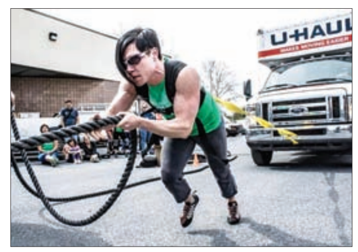
A participant in the May Queen Spring Strongwoman competition pulls a truck in Lancaster, Pennsylvania in 2015.