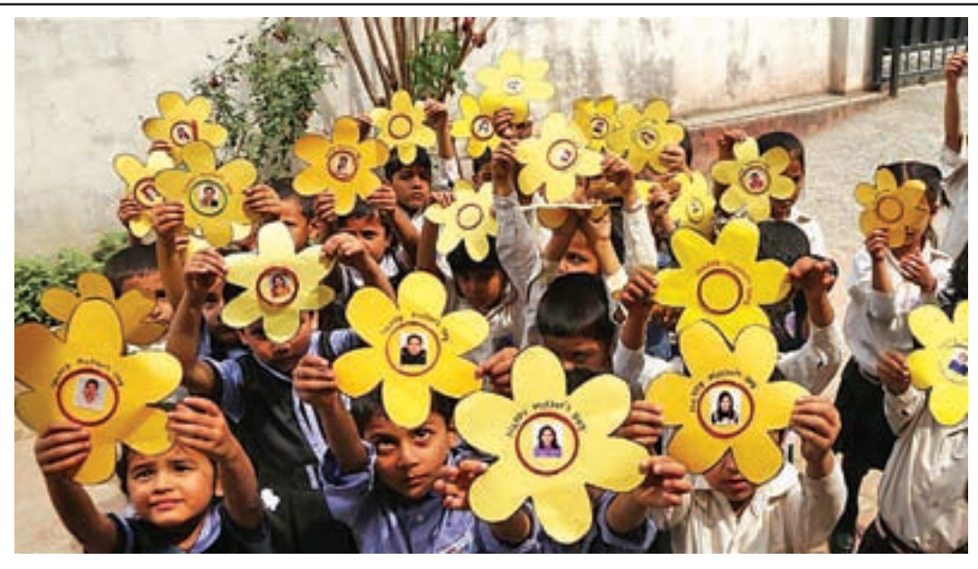
Nepalese school kids show greeting cards prepared for their mothers for the upcoming Mother's Day in Kathmandu, Nepal, on 6 May 2016. A group of Nepalese school kids prepared greeting cards for their mothers ahead of the Mother's Day which falls on 8 May this year.

The 38-year-old government researcher with a PhD from Tufts University has pulled a monster truck and repeatedly flipped a 650-pound tractor tire.