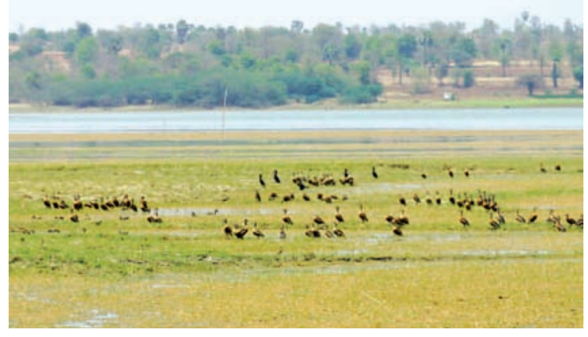
The birds been seen grazing around Mone Taing dam.

In winter, there arrive migratory birds for hibernation in addition to the bird native of Mone Taing— Chan Thar (Meiktila)