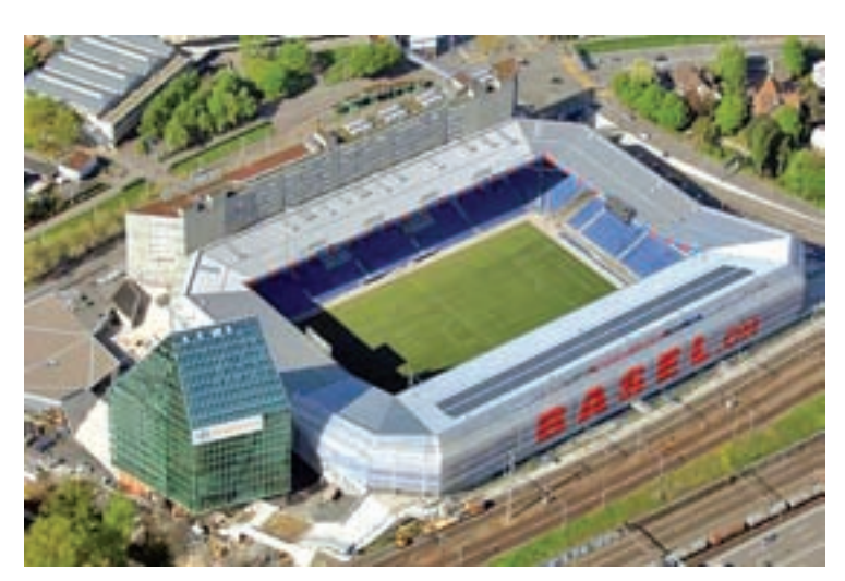
An aerial view of Basel (Basle) St. Jakob-Park soccer stadium in 2008.

ZURICH — UEFA has dismissed complaints that the Europa League final venue in Basel is too small, after fans of finalists Liverpool complained that "a large number" of supporters would miss out.