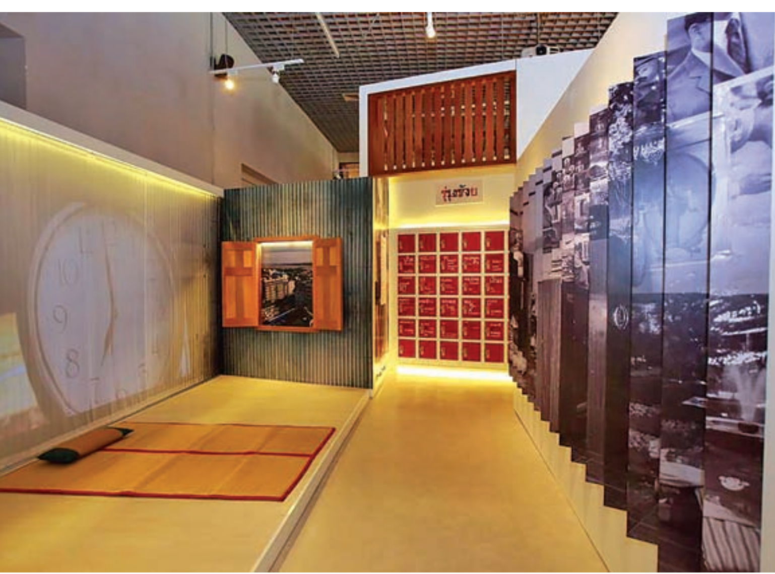
Red lockers contain items from the daily lives of Myanmar migrants in Thailand, including steel lunch boxes and thanaka.