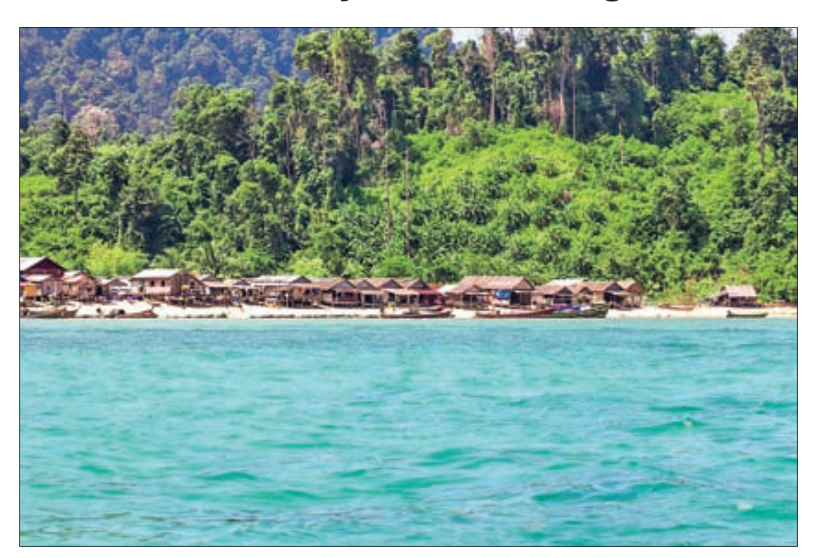
A village in Myeik Archipelago in southern Myanmar.

ELEVEN villages from Myanmar's southern coastal region of Tanintharyi will conduct regional based tourism enterprises, according to the office of the Department of Hotels and Tourism.