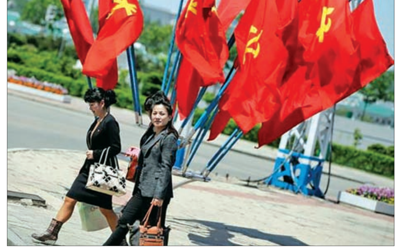
Workers' Party of Korea (WPK) flags decorate an intersection as women cross the street in central Pyongyang, North Korea, on 7 May.

The three laureates — Aaron Ciechanover, Finn Kydland and Richard Roberts - arrived on 29 April for a programme covering mainly academic exchanges at elite North Korean universities in Pyongyang, under the auspices of the Vienna-based International Peace Foundation.