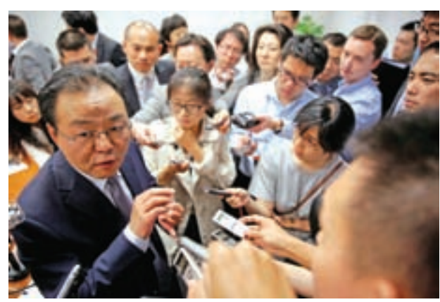
Ouyang Yujing, China's director-general of the Department of Boundary and Ocean Affairs of the Ministry of Foreign Affairs, is surrounded by reporters after his briefing on China's stance on the South China Sea, in Beijing, China, on 6 May 2016.

Ouyang Yujing, director-general of Chinese Foreign Ministry's Department of Boundary and Ocean Affairs, said China took note of