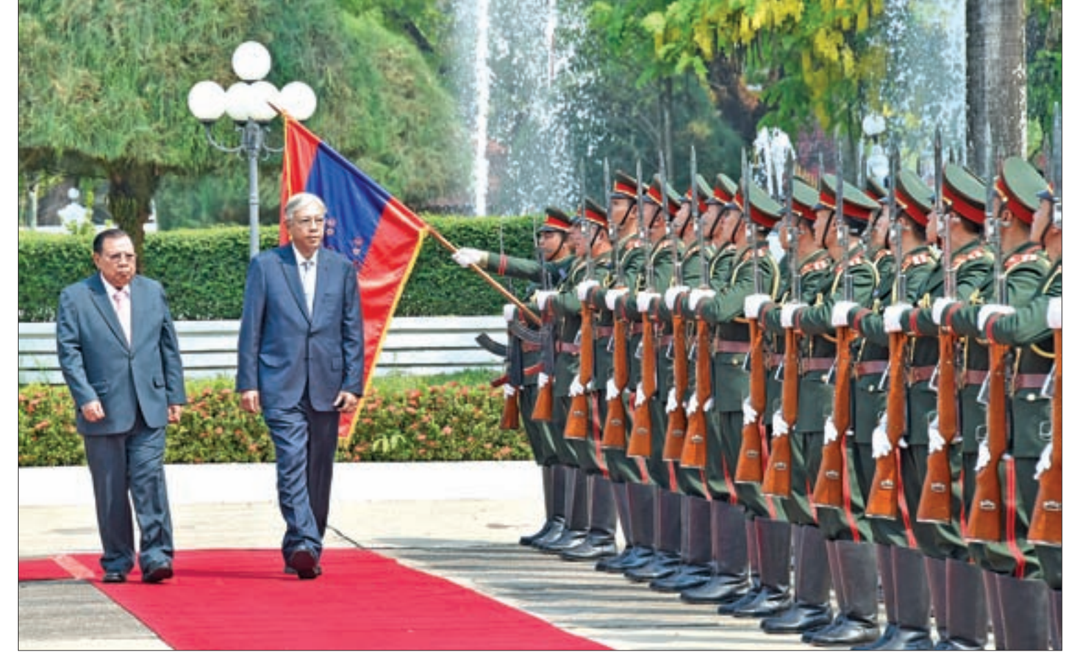
President U Htin Kyaw inspects the Guard of Honour as he arrives Laos.

Under a bilateral trade agreement in 1995 in Yangon and border trade agreement in 2000 in Vientiane, Myanmar-LPDR bilateral trade totaled US$0.401 million for the 2013-2014 FY. Myanmar mainly exports chickpea to Laos and imports electrical equipment, pharmaceutical products and plastic raw materials. (Documentary photos of President U Htin Kyaw's visit to Laos are available at www.globalnewlightofmyan mar.com )— Myanmar News Agency