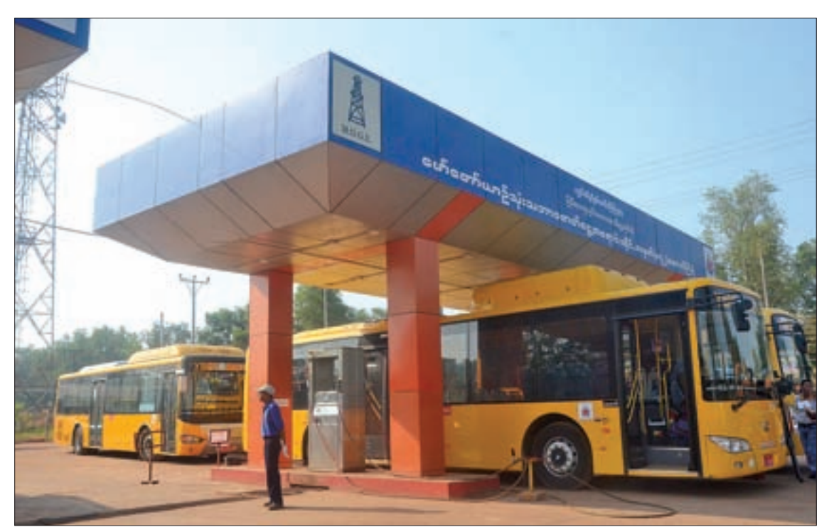
City buses are seen at CNG refilling station in Yangon.

There are 46 gas stations "The distribution of gas will across the country, with 41 in