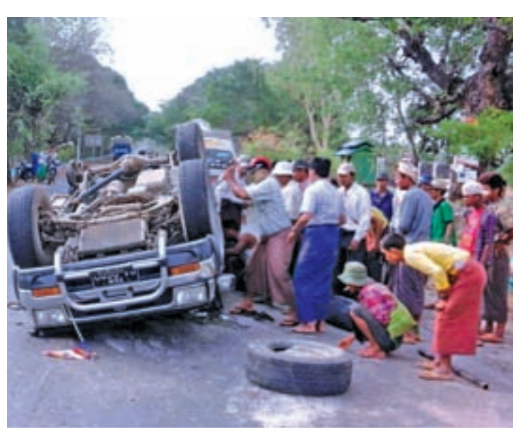
The car seen topsy turvy after accident. PHOTO: 007