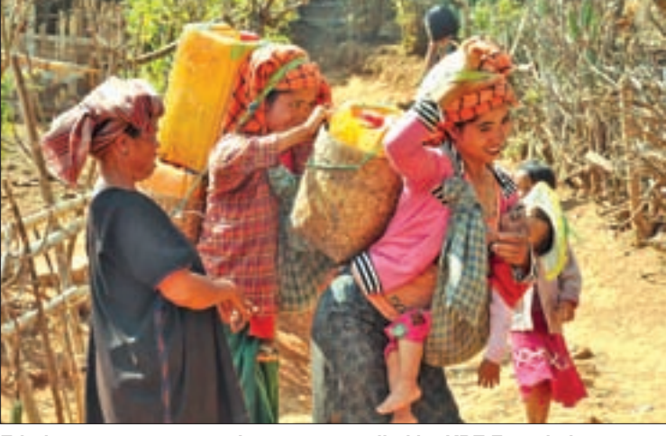
Ethnic women seen carrying water supplied by KBZ Foundation.

Meanwhile, KBZ's Brighter Future Myanmar Foundation is supplying drinking water by water tankers to people facing a scarcity of water induced by El Nino and has drilled 112 tube-wells so far to help alleviate drought.— GNLM