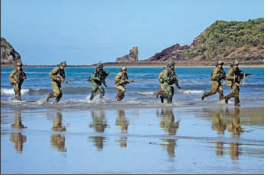
Troops from the Singapore Guards Formation of the Singapore Armed Forces and troops from the Seventh Australian Regiment of the Australian Defence Force land on the beach during a preview of Exercise Trident which is part of Exercise Wallaby at Freshwater Bay in Rockhampton, Queensland, Australia in 2014.

SYDNEY — Australia and Singapore will jointly pore has long sent troops torates critical to the govdevelop military training to Australia for military ernment. The timing of the areas and facilities in Australia, the city-state's foreign ministry said, as part of a deal that expands defence cooperation between the two countries and improves economic ties.