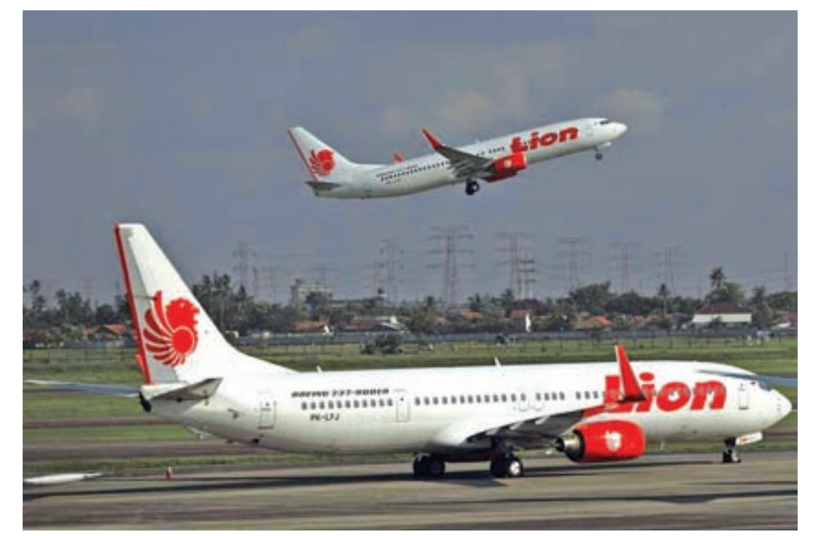
A Thai Lion airplane takes off at Soekarno-Hatta airport in Jakarta.