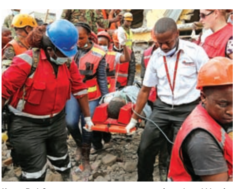
Kenya Red Cross rescuers evacuate a woman from the rubble of a six-storey building that collapsed last Friday after days of heavy rain, in Nairobi, Kenya, on 5 May. PHOTO: REUTERS

Asked what she wanted to tell the Greek government, she said: "Wake up. We are dying."-Reuters