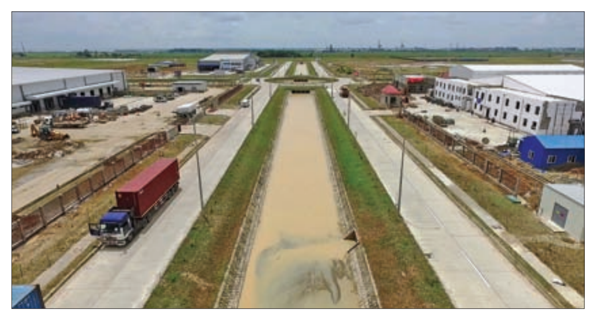
Thilawa Special Economic Zone.