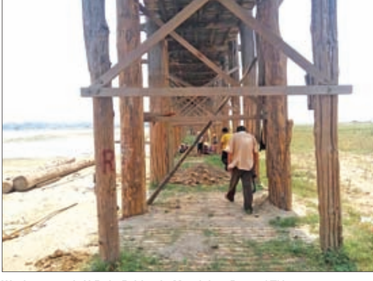
Workers repair U Bein Bridge in Mandalay.

Company proposed to build the museum while the Taungthaman Thitsar company has offered to arrange the acquisition of a plot of land. Renovation and maintenance will be carried out to keep the original style with the help of a carpentry team from Inlay region, it has been learned.