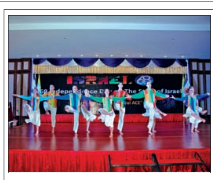
Israeli artistes perform Israeli folk dance at the reception to mark 68th Independence Day of the State of Israel at Hotel Royal ACE in Nay Pyi Taw on 3 May.