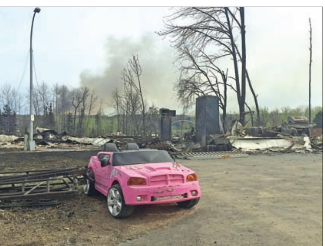
A pink car remains among the ruins of destroyed buildings after wildfires tore through the Waterways area of Fort McMurray, Alberta, Canada, on 5 May.

CNOOC Nexen's Long Lake oil sands facility and Athabasca Oil's Hangingstone project are