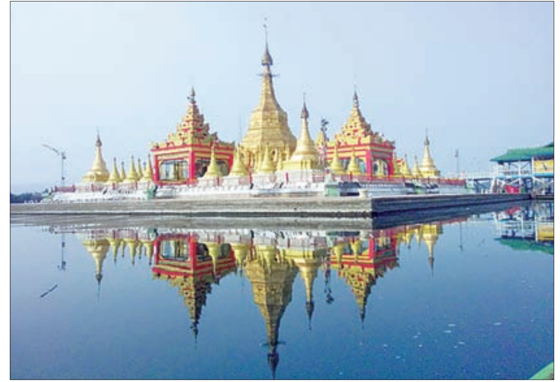
The Intein lake in Kachin State being seen.