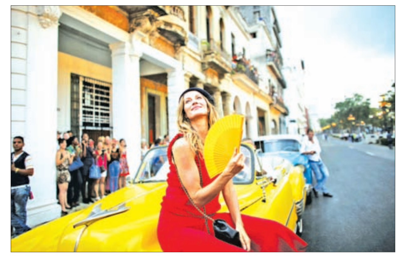
Brazilian top model Gisele Bundchen poses before a fashion show by German designer Karl Lagerfeld as part of his latest inter-seasonal Cruise collection for fashion house Chanel at the Paseo del Prado street in Havana, Cuba, on 3 May 2016.

TOKYO — About 20 per at 81.6 per cent among men in their 20s, 91.5 per cent among women in the same age group and 88.5 per cent among men in their 30s. In comparison, 96.3 per cent of men in their 60s and 97.1 per cent of women in the same age group said they had eaten rice during the past month. Asked what they had eaten during that period in a multiple-choice question, 84.2 per cent said bread, 80.9 per cent said fish, 80.5 per cent said meat, 58.5 per cent said instant noodles, and 14.8 per cent said various local foods. -Kvodo News