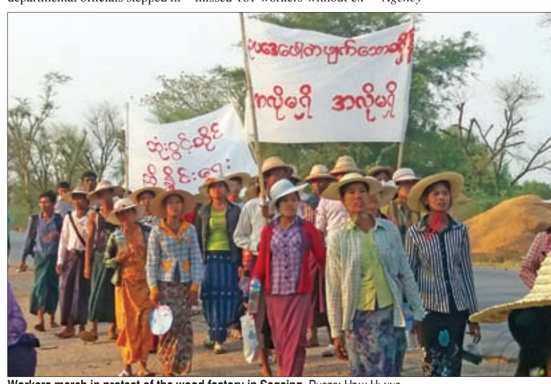
Workers march in protest of the wood factory in Sagaing.

Public donors have supplied 103 villages with as many as 465,555 gallons of water since the start of 2016, while combined efforts between the Department of Rural Development and public groups have seen 1,072,505 gallons of water donated to 196 villages, according to the department.—Myitmakha News Agency