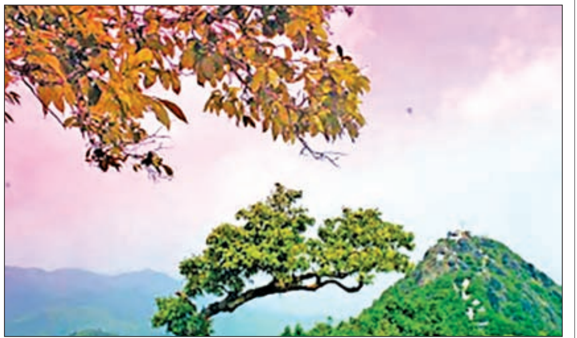
A landscape near Nawbuhtabaw Mountain in Kayin State.

THE Ministry of Hotels and Tourism will implement community-based tourism projects within the first 100 days of the new government's term at designated areas across Myanmar, a ministry spokesperson said.