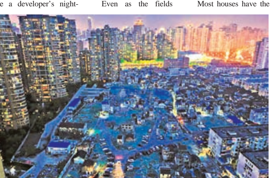
A night view of the old houses surrounded by new apartment buildings at Guangfuli neighbourhood in Shanghai, China, on 10 April.

Chinese character for "tear down" spray painted on them by demolition teams, although the paint has faded as the standoff between the residents and the developer dragged on.