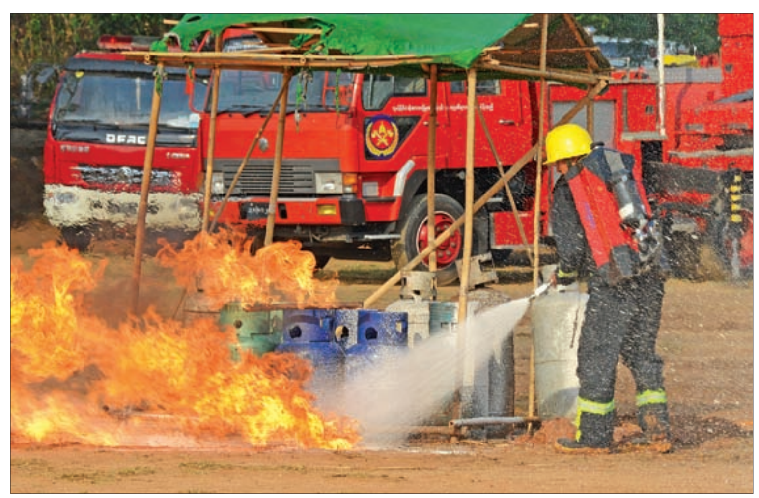
A firefighter demonstrates firefighting skills at the 70th Myanmar Fire Service Day celebration in Nay Pyi Taw.

According to official figures, fire outbreaks across the country during the previous five years cost Myanmar over K23.4 billion (US$20 million) in property loss and damage.--Myanmar News Agency