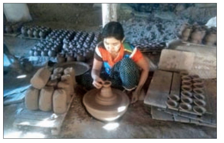
A traditional clay pot business seen in Twantay township. PHOTO : CHAN KO

Traditional Twantay clay pots are in high demand from Yangon.— Chan Ko