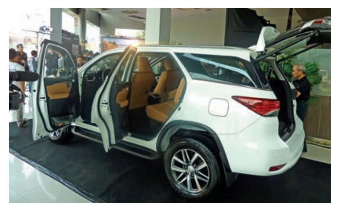
A Toyota Fortuner being displayed during the launching ceremony.