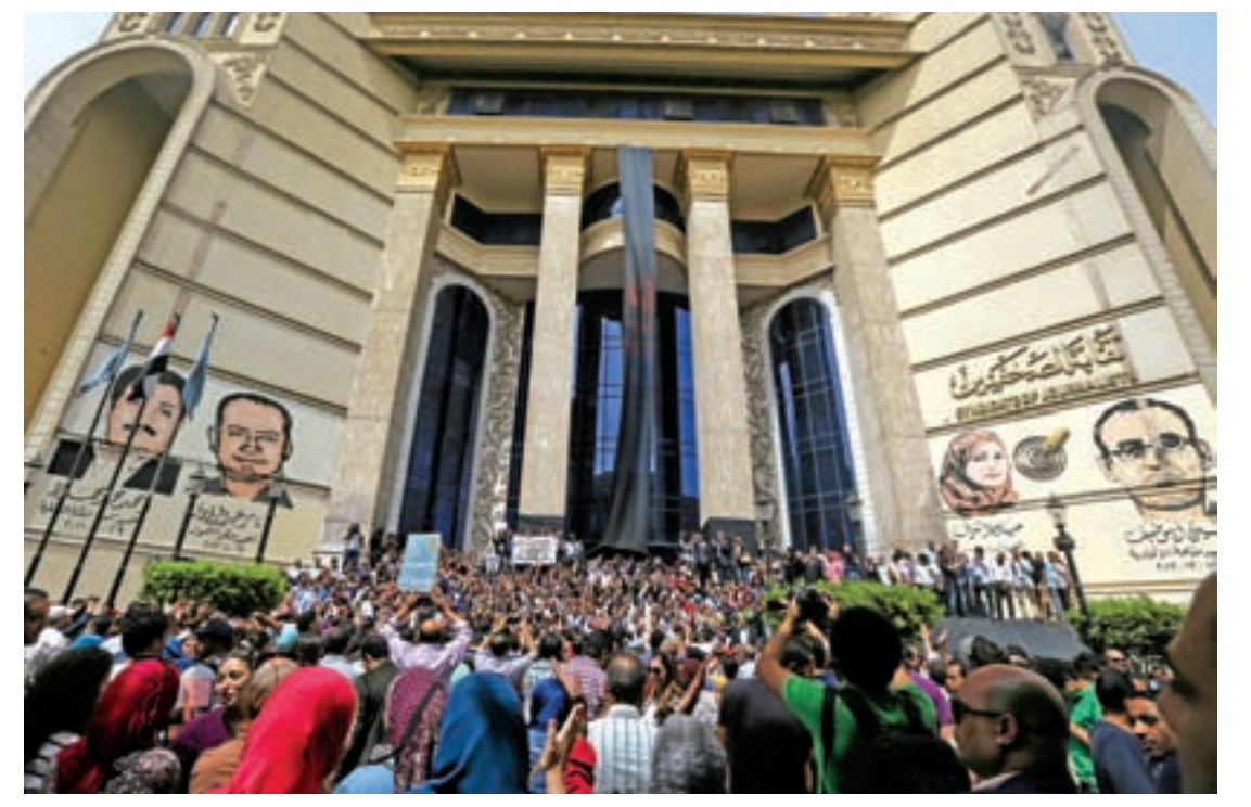
Journalists protest against restriction on the press and to demand the release of detained journalists, in front of the Press Syndicate in Cairo, Egypt on 4 May 2016.