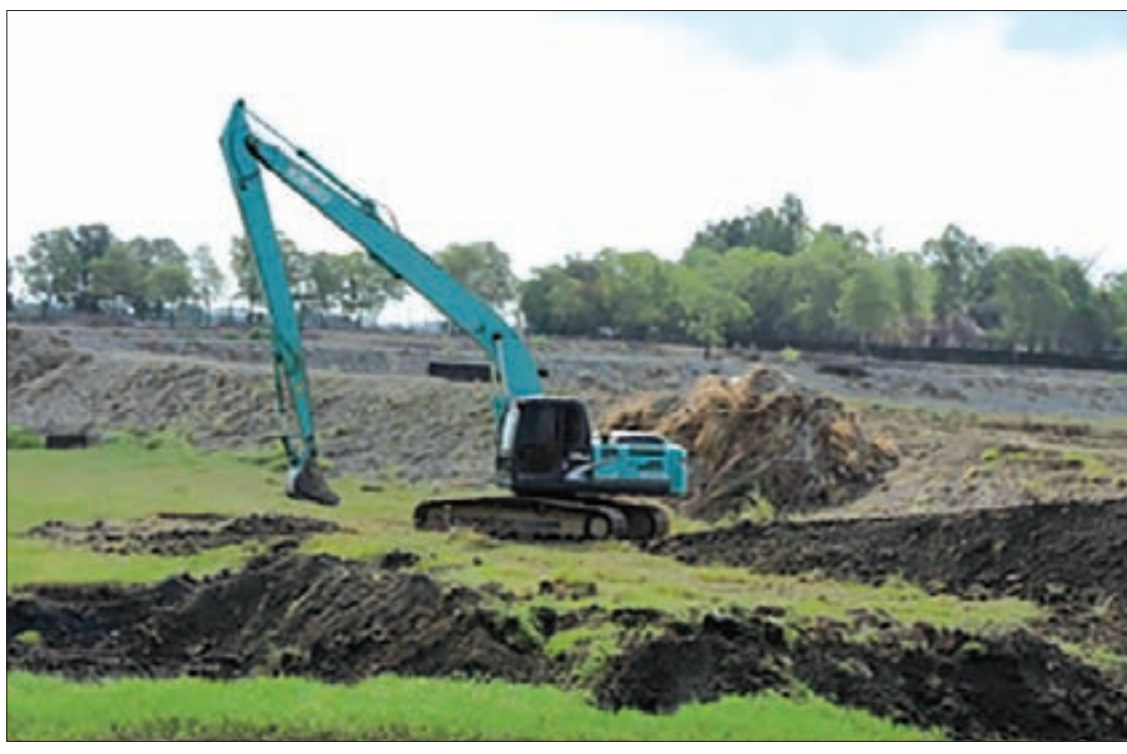
Renovations in progress at Sittwe Lake.

SITTWE Lake is now under heavy renovation by local authorities in cooperation with the Japan International Cooperation Agency, with the aim of distributing drinking water to resi-