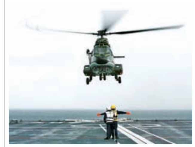
A Republic of Singapore Air Force Super Puma helicopter lands on the Singapore warship RSS Endurance during a search and rescue operation in the Singapore Strait, about 30 km (19 miles) east of the city state in 2003.

Airbus declined comment and Finmeccanica did not respond to questions.— Reuters