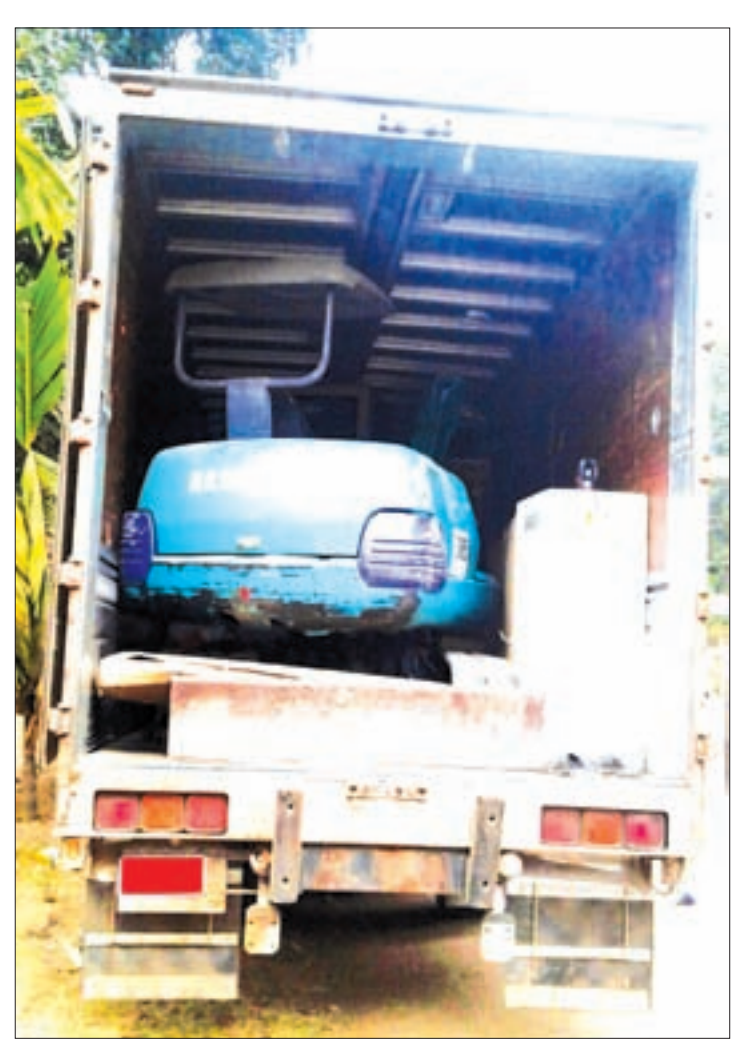
Illegal excavators being seen.

LOCAL police discovered three illegal excavators on a container vehicle in Mupalin village, Kyaikhto township, Mon state on Monday.