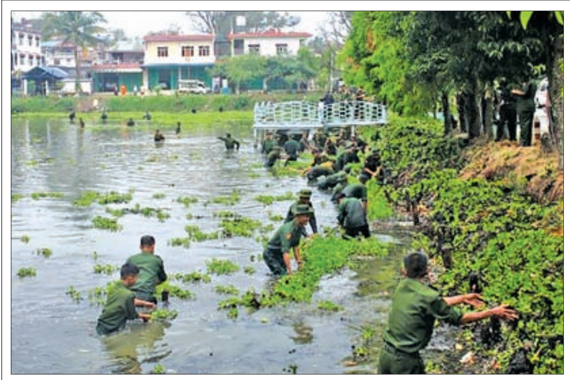
Tatmadawmen, members of Police Force and members of Fire Brigade seen cleaning a Naung Kham lake which was full of water hyacinth plants, garbage, other twining shrub plants in No 3 Ward of KengTung, Shan State (East) on 3 May 2016.