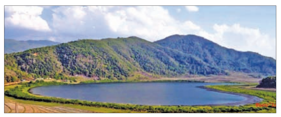
Reed Lake in Chin State has attracted visitors at home and abroad. Photo: MYITMAKHA NEWS AGENCY

The Myanmar tourist industry is gaining momentum, with tourists to the Golden Land reaching 4.7 million during 2015, resulting in revenue of as much as US$2.1 billion. -Myitmakha News Agency