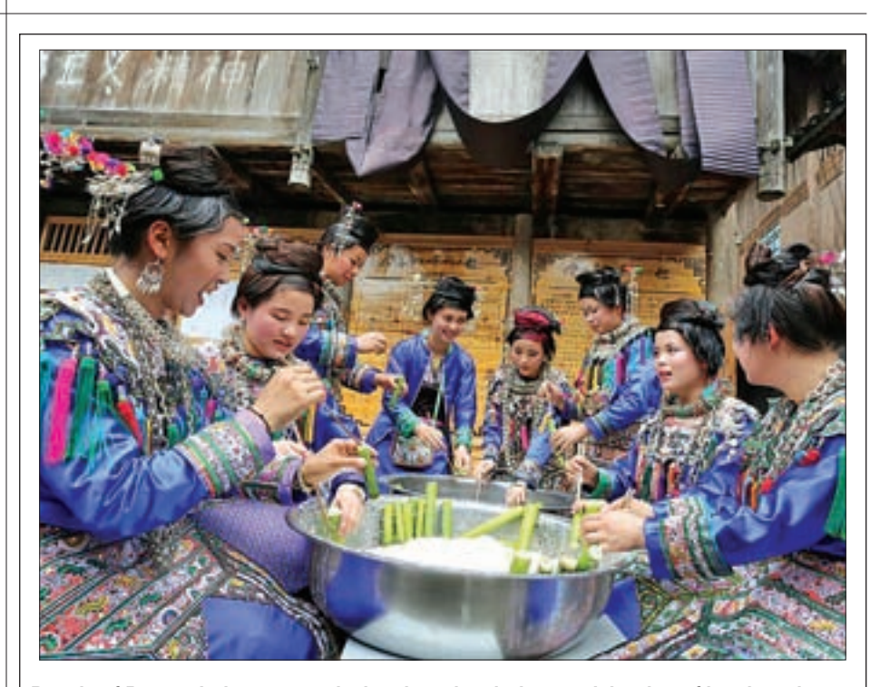
People of Dong ethnic group make bamboo rice during a celebration of bamboo rice festival in the Dong village of Wugong, Rongjiang County, southwest China's Guizhou Province, on 3 May 2016. People of Dong ethnic group eat bamboo rice to celebrate their festival in the habitat.

Myanma Oil and Gas Enterprise Ph . +95 67 - 411097 / 411206