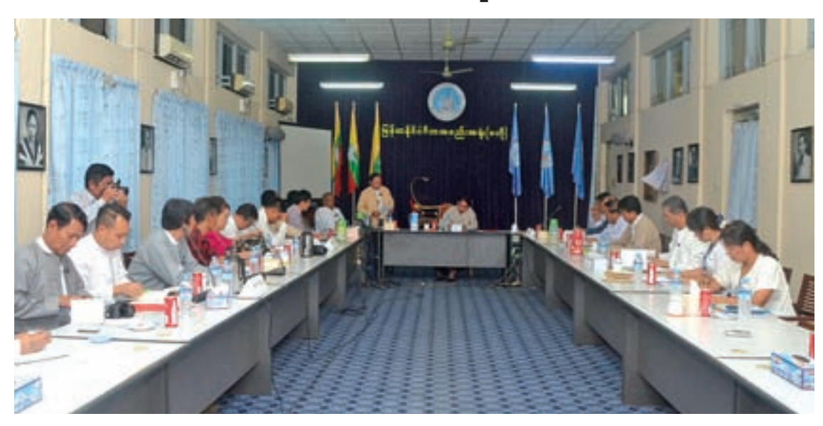
Union Minister Dr Pe Myint and representatives from literature associations discuss development of literature along with freedom of expression in Myanmar.

UNION Minister for Information Dr Pe Myint held talks with representatives from literature associations on the development of Myanmar literary works along with freedom of expression and publication and the holding of literary seminars yesterday.