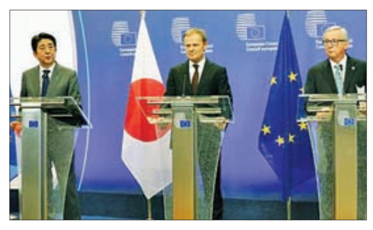
(From L) Japanese Prime Minister Shinzo Abe, European Council President Donald Tusk and European Commission President Jean-Claude Juncker attend a joint press conference in Brussels on 3 May, 2016, after their talks. The leaders agreed to expedite negotiations for a free trade deal and reach a broad agreement by the end of the year.

The Japanese premier said he will seek to hold a bilateral summit between the Asian neighbors in early September, when China will host a summit of Group of 20 major economies,