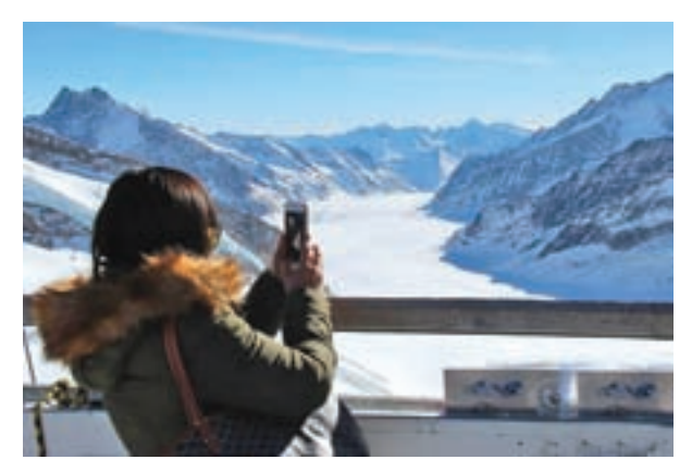
A Chinese tourist takes photos of the Aletsch Glacier at the foot of the Jungfrau on 23 January 2016.

MADRID — Several governments around the world are asking the United Nations World Tourism Organisation (UNWTO) the best way to attract more visitors from China, showing how important China is in the global tourism sector, its Secretary General Taleb Rifai said in an interview with Xinhua.