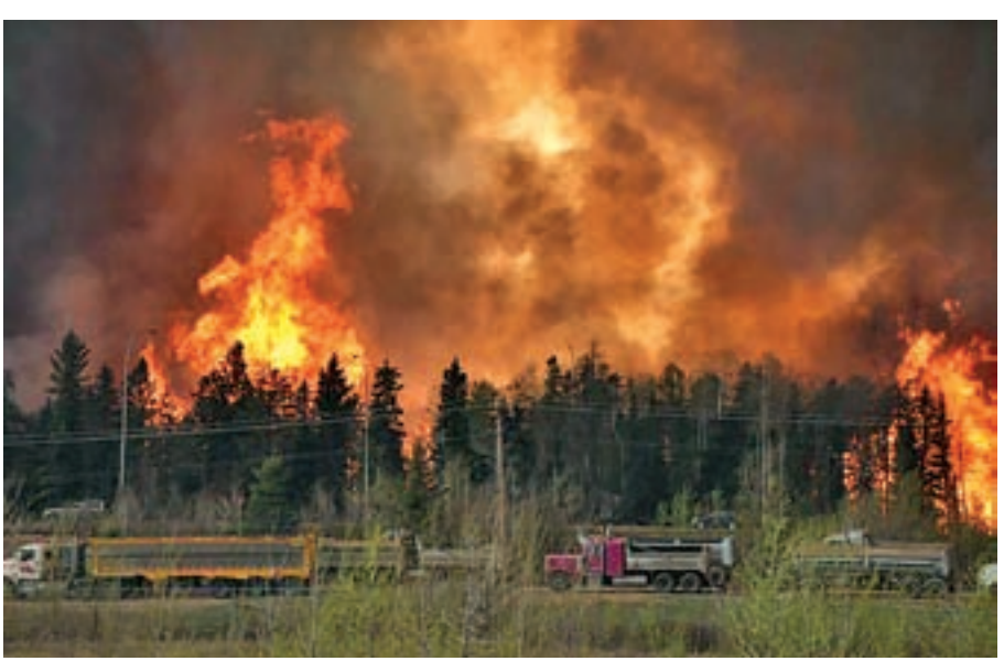
Wildfire is worsening along highway 63 Fort McMurray, Alberta Canada on 3 May 2016.

"This is the biggest evacuation we have seen in the history of the province,"