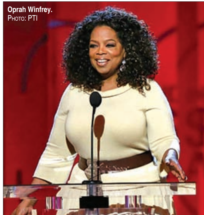
Oprah Winfrey.

The hashtag #MetGala was top trending in the United States on all of Monday with more than 1 million total mentions.—Reuters