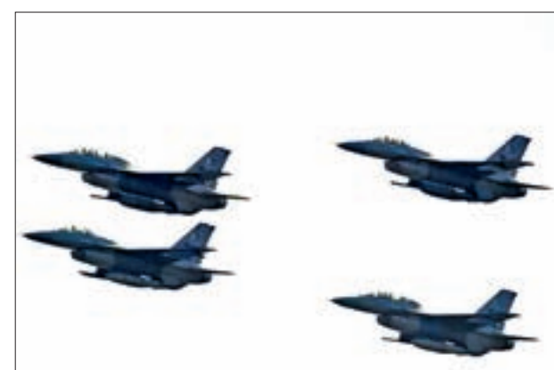
Pakistani F-16 fighter jets fly past during the Pakistan Day military parade in Islamabad, Pakistan, on 23 March 2016.

"Given congressional objections, we have told the Pakistanis that they should