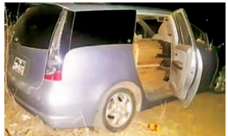
Illegal sawn timber in car.

The police are still investigating the case in order to arrest the owner of the vehicle. — Pein Zaloke Thein Nyunt