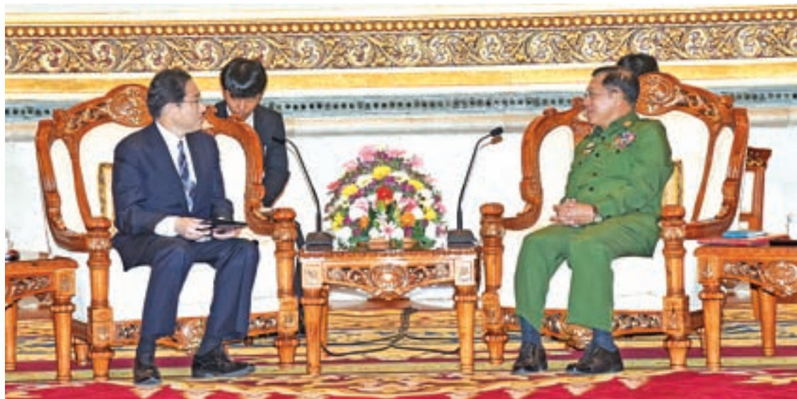
Senior General Min Aung Hlaing receives Japanese Foreign Minister Mr Fumio Kishida.

COMMANDER-in-Chief of Defence Services Senior General Min Aung Hlaing received Japanese Foreign Affairs Minister Mr Fumio Kishida yesterday.