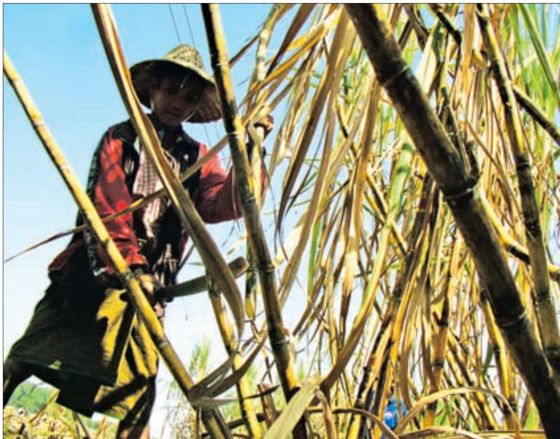
A worker cuts sugar canes on a field near Nyi Pyi Taw.

The Myanmar Sugar Cane and Sugar Related Products Merchant and Manufacturers Association has submitted a proposal to the Ministry of Commerce urging a change of the tax code to bring the taxation rate on sugar imports to be more in line with other ASEAN nations. Local sugar entrepreneurs may suffer from sugar exports if China