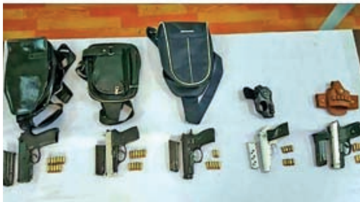
Four Chinese men seen together with arms and ammunition.