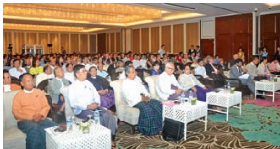
Union Minister for Information Dr Pe Myint seen talking to mark World Press Freedom Day.

UNION Minister for Information Dr Pe Myint informed media members in the country of his readiness to focus on the promotion of Myanmar media freedom in cooperation with print, broadcast and internet media entities at a ceremony to mark World Press Freedom Day in Yangon yesterday.