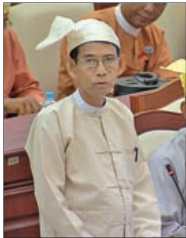
Union Minister for Agriculture, Livestock and Irrigation Dr Aung Thu.