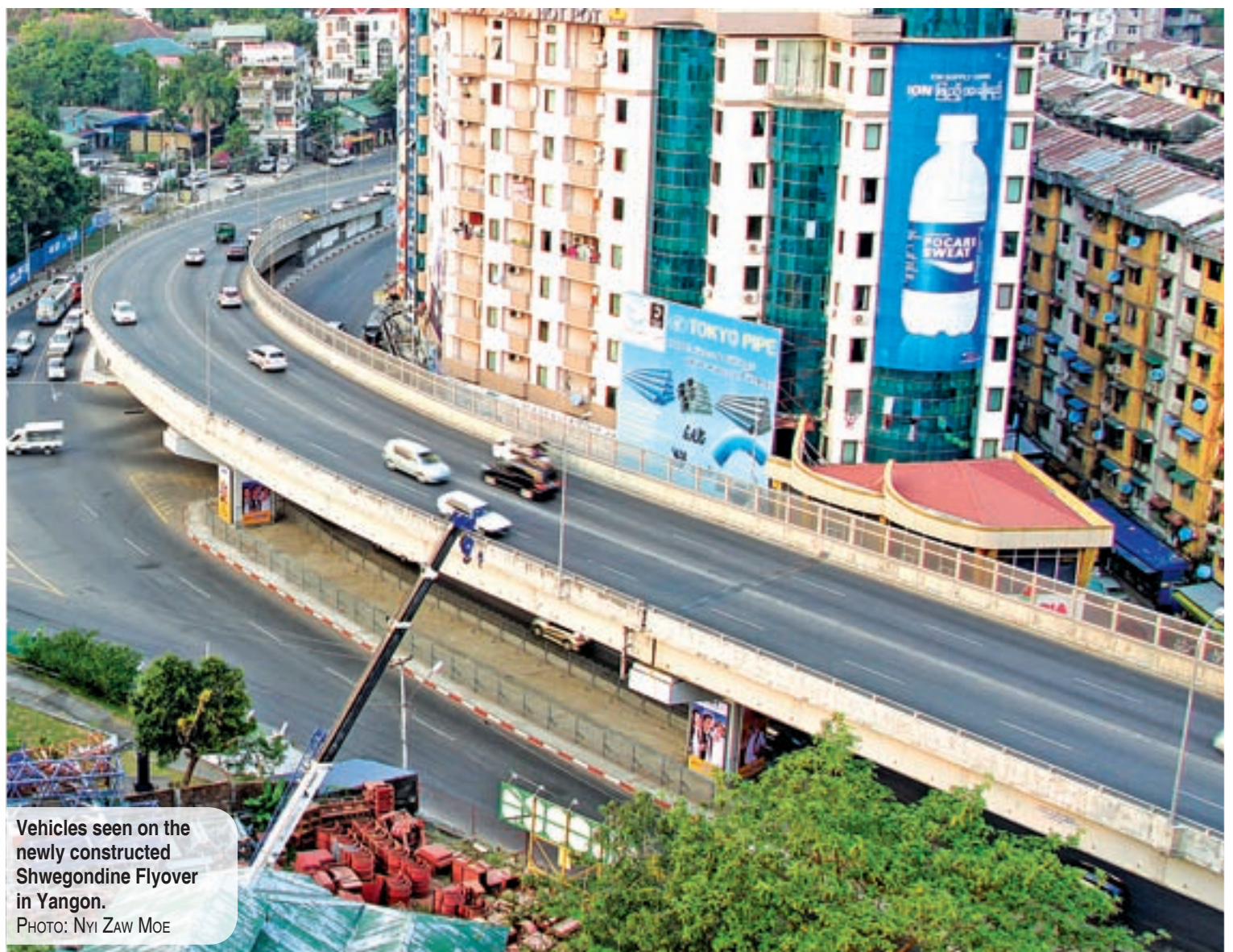
Vehicles seen on the newly constructed Shwegondine Flyover in Yangon.