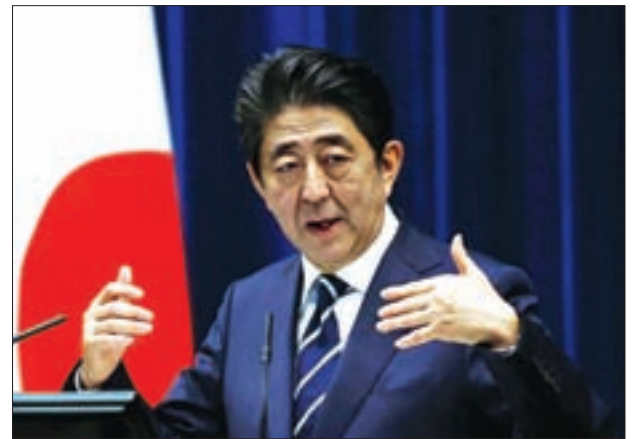
Japan's Prime Minister Shinzo Abe attends a news conference at his official residence in Tokyo, Japan, on 29 March.