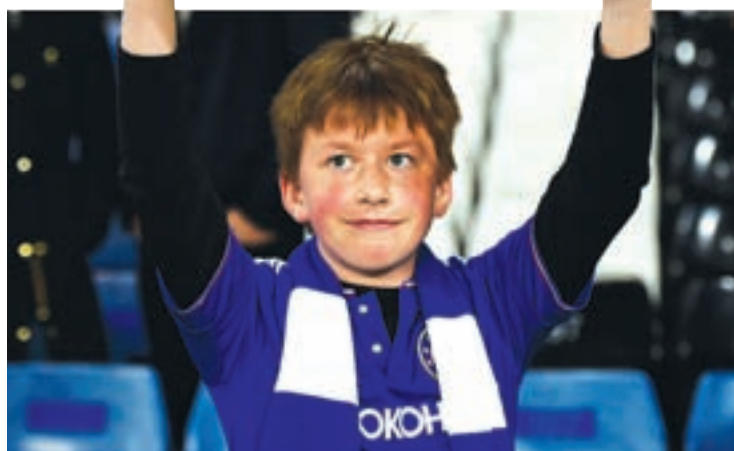
A Chelsea fan displays a banner in reference to Leicester City manager Claudio Ranieri on 2 May.

Gary Cahill gave Chelsea a lifeline just before the hour, however, and substitute Eden