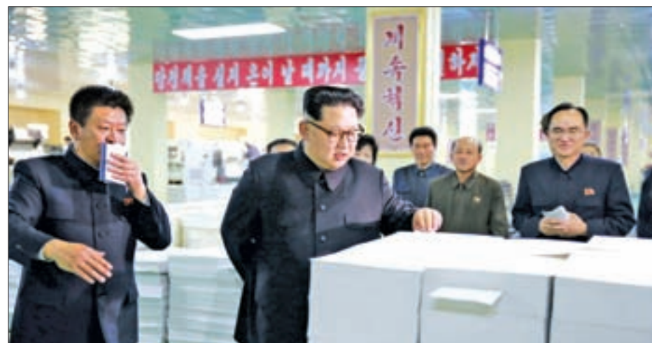
North Korean leader Kim Jong Un gives field guidance during his visit to the newly built Mindulle Notebook Factory in this undated photo released by North Korea's Korean Central News Agency (KCNA) in Pyongyang on 19 April.

SEOUL — North Korea has started welcoming delegates from around the country to its first ruling party congress in 36 years, state media reported on Tuesday, as rival South Korea expressed concern that Pyongyang could conduct a nuclear test before or during the event.