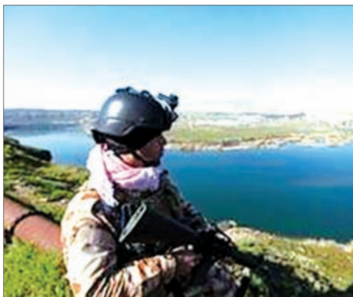
An Iraqi Kurdish Peshmerga stands guard near the Mosul Dam in northern Iraq, on 3 February.

"The battles are ongoing," he said.