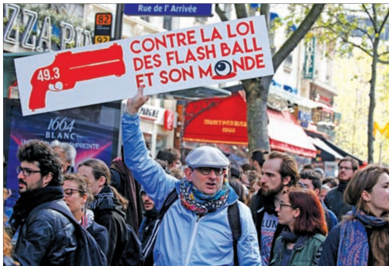
A protestor holds a placard during a demonstration against the French labour law proposal in Paris, France, on 3 May 2016 as the labour reforms law reaches parliament today with 5,000 amendments to be discussed.

ing thousands of formal demands from lawmakers for amendments, could override opposition via a special constitutional clause — known as 49:3 - to force the reform through by decree. It has not indicated it will do so.