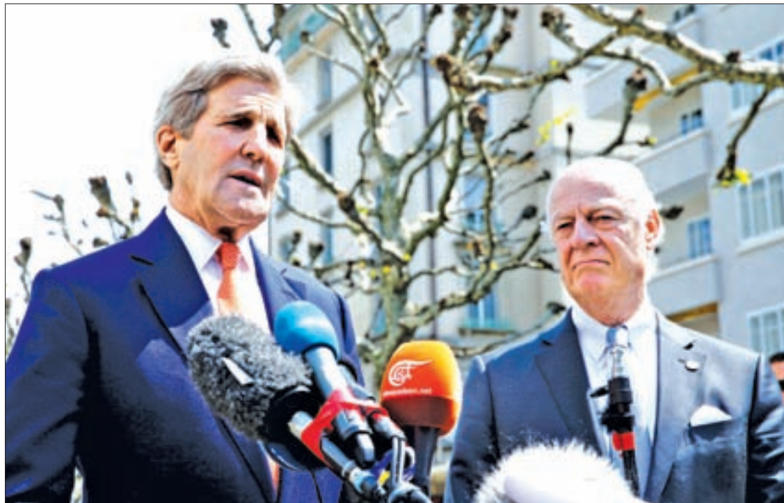
US Secretary of State John Kerry gestures next to United Nations Special Envoy on Syria Staffan de Mistura during a news conference in Geneva, Switzerland, on 2 May.

AMMAN/GENEVA — Washington and Moscow said on Monday they were working hard to extend a truce in Syria to Aleppo, the divided northern city where a sharp escalation of violence in recent weeks has left a ceasefire in tatters and torpedoed peace talks.