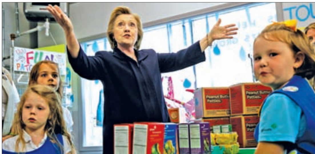
US Democratic presidential candidate Hillary Clinton buys Girl Scouts' cookies during a campaign event in Ashland, Kentucky, United States, on 2 May.

WASHINGTON/CARMEL, (Ind) — US presidential candidate Hillary Clinton met with coal and steel workers in the Appalachian region on Monday in an effort to win over blue-collar voters in a part of the country with strong support for Republican Donald Trump.