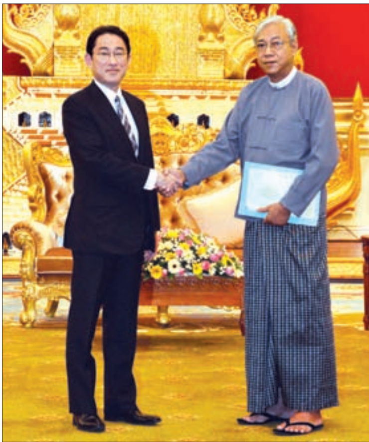
President U Htin Kyaw welcomes Mr Fumio Kishida.

The meeting was also attended by Union ministers U Thant Zin Maung and Dr Myo Thein Gyi, Minister of State for Foreign Affairs U Kyaw Tin and the Japanese ambassador to Myanmar.— Myanmar News Agency