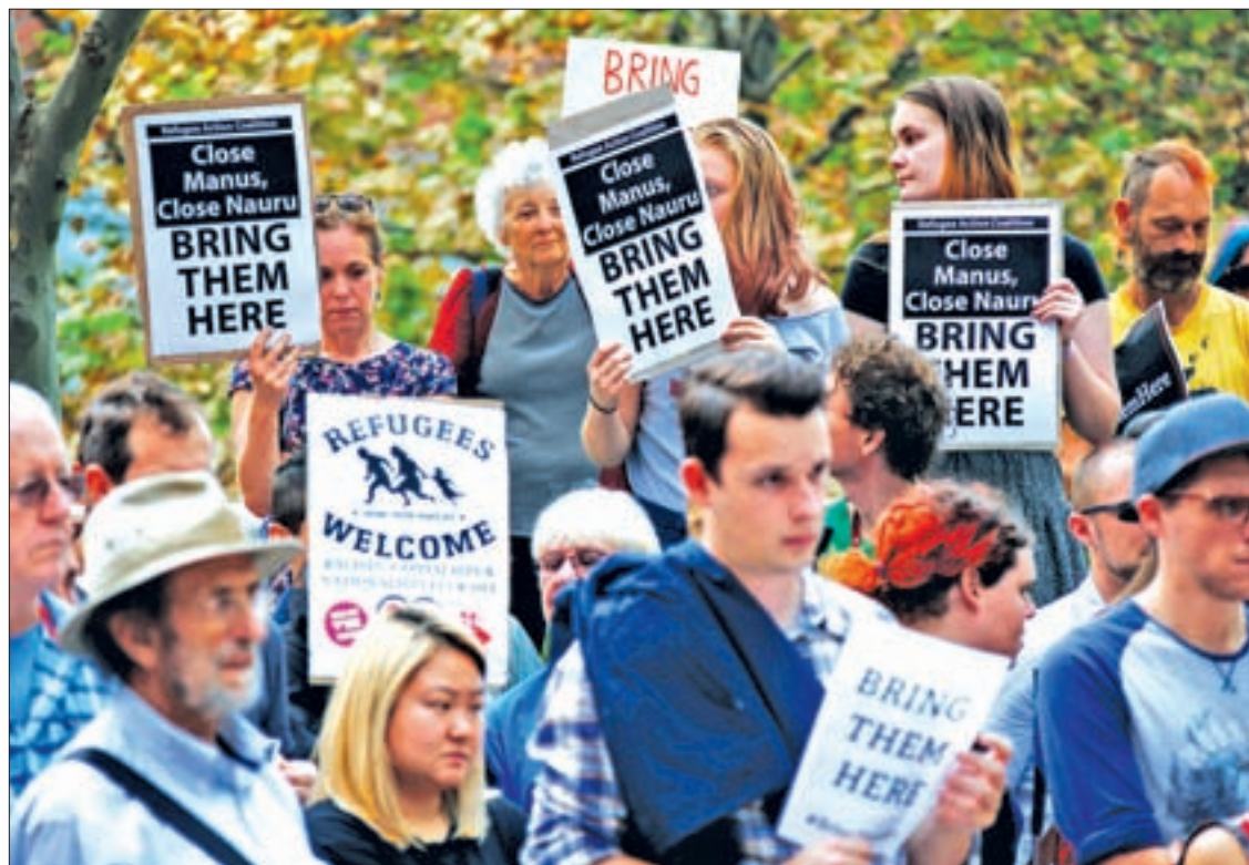
Protesters from the Refugee Action Coalition hold placards during a demonstration outside the offices of the Australian Government Department of Immigration and Border Protection in Sydney, Australia, on 29 April.

On Tuesday, Immigration Minister Peter Dutton acknowl-