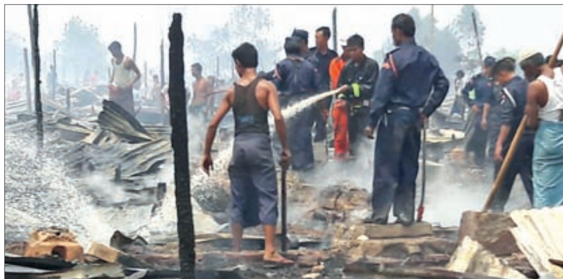
Fire fighters being seen bringing the fire under control.

A FIRE, reportedly beginning in a kitchen at the Baw Du Ba internally displaced persons (IDP) camp-2 in Sittwe destroyed 49