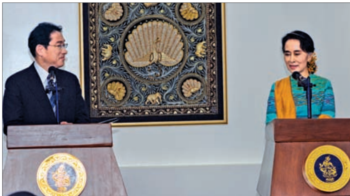
Foreign Minister Daw Aung San Suu Kyi and her Japanese counterpart Mr Fumio Kishida hold the press conference in Nay Pyi Taw yesterday following their meeting.

IT'S natural that the Japanese government maintains a relationship with Myanmar in a manner different from the western governments, State Counsellor Daw Aung San Suu Kyi in her capacity as the foreign minister said in response to a question raised by a Japanese journalist at the press briefing held after a meeting with her Japanese counterpart yesterday.