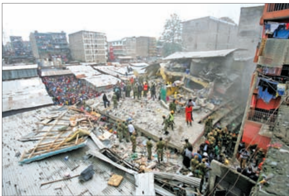
A general view shows rescue workers searching for residents feared trapped in the rubble of a six-storey building that collapsed after days of heavy rain, in Nairobi, Kenya on 30 April.

The collapse of the building was the latest such disaster in a fast expanding