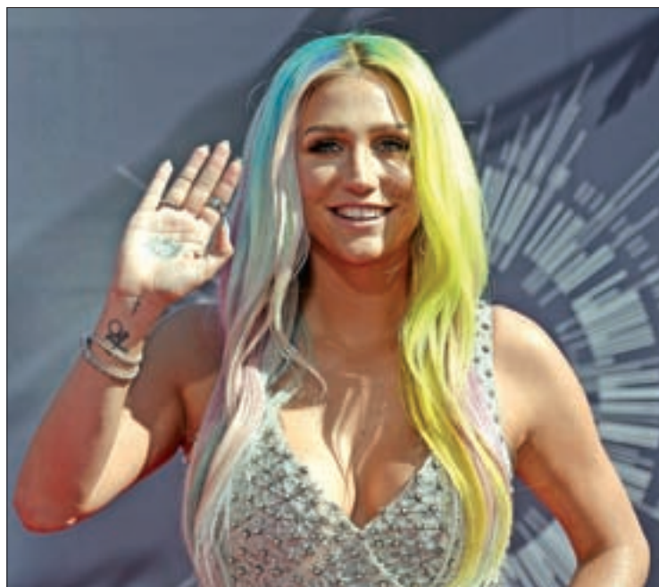
Singer Kesha arrives at the 2014 MTV Music Video Awards in Inglewood, California in 2014.

"True Colours" features Kesha singing lyrics such as "We've escaped our capture, And I have