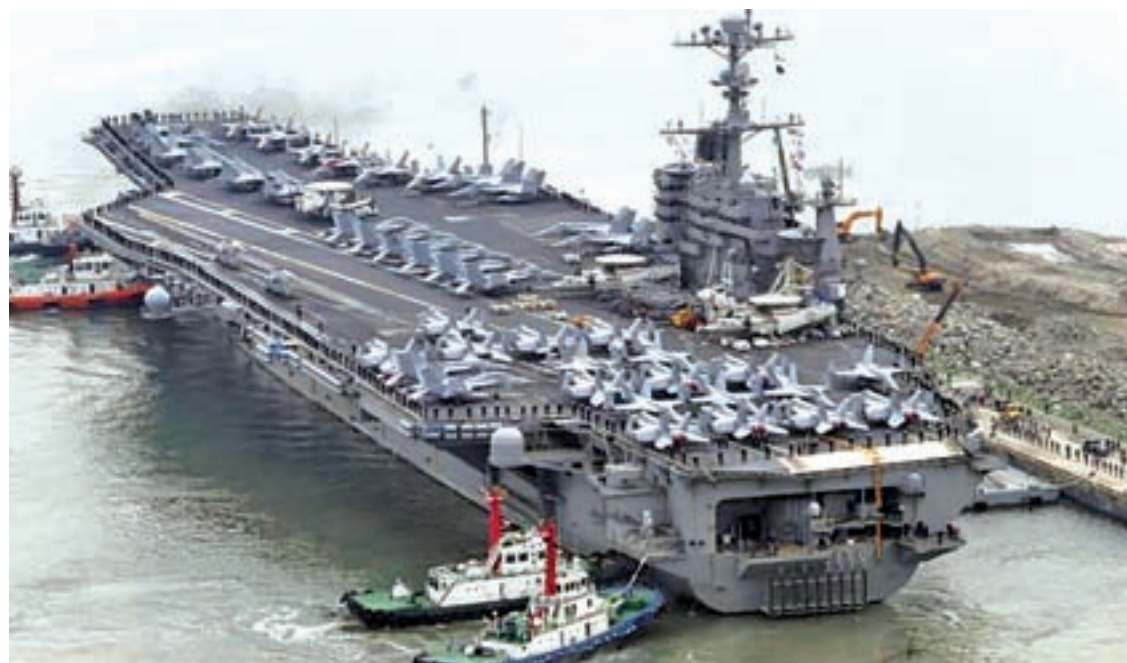
The Nimitz-class aircraft carrier USS John C Stennis arrives to join the annual Key Resolve military exercise conducted by South Korea and the US, at a port in Busan, South Korea, on 13 March.