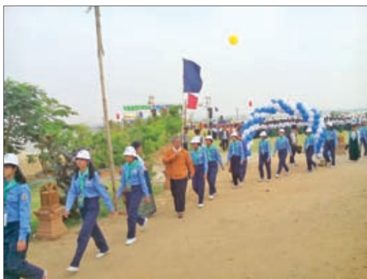
Outstanding students are seen during their excursion tour of Bagan.

They will go camping at Ngwehsaung beach on 2 May, when the excursion will come to a conclusion.— Aung Thant Khaing