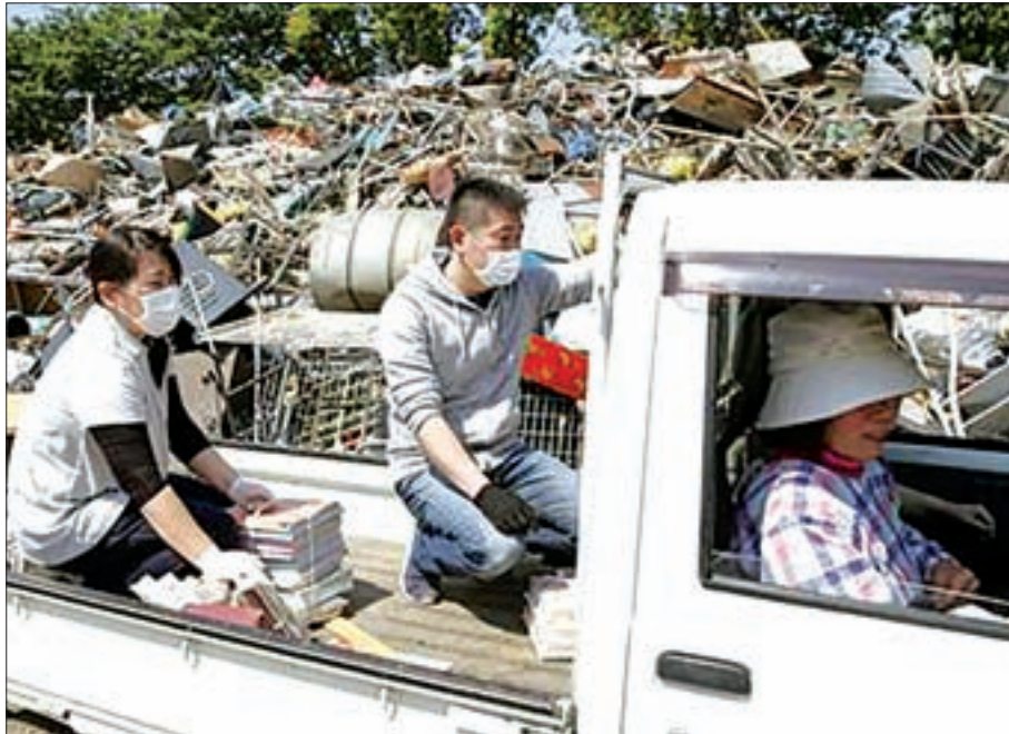
People affected by powerful earthquakes in southwestern Japan bring garbage to a temporary depot in the village of Nishihara on 30 April.

TOKYO — More than 12,000 houses and other buildings are in danger of collapsing in areas of southwestern Japan struck by powerful earthquakes earlier this month, government officials said Saturday.