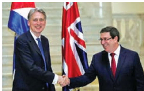
Britain's Foreign Secretary Philip Hammond (L) shakes hands with Cuba's Foreign Minister Bruno Rodriguez Parrilla during their meeting in Havana, on 28 April.

The Foreign Secretary said the government recognised its financial services sector was underdeveloped.