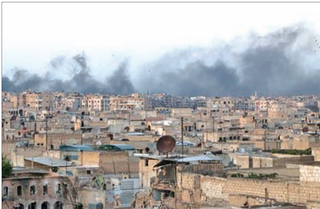
Smoke rises after airstrikes on the rebel-held al-Sakhour neighbourhood of Aleppo, Syria on 29 April.

Damascus described the truces as an attempt to salvage a wider "cessation of hostilities" agreement in place since Febru-