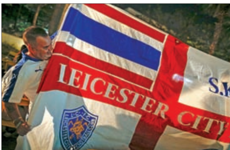
A leicester city fan holds a flag as he celebrates after his team scores against Swansea City while watching the game on a big screen, in Bangkok, Thailand, on 24 April.