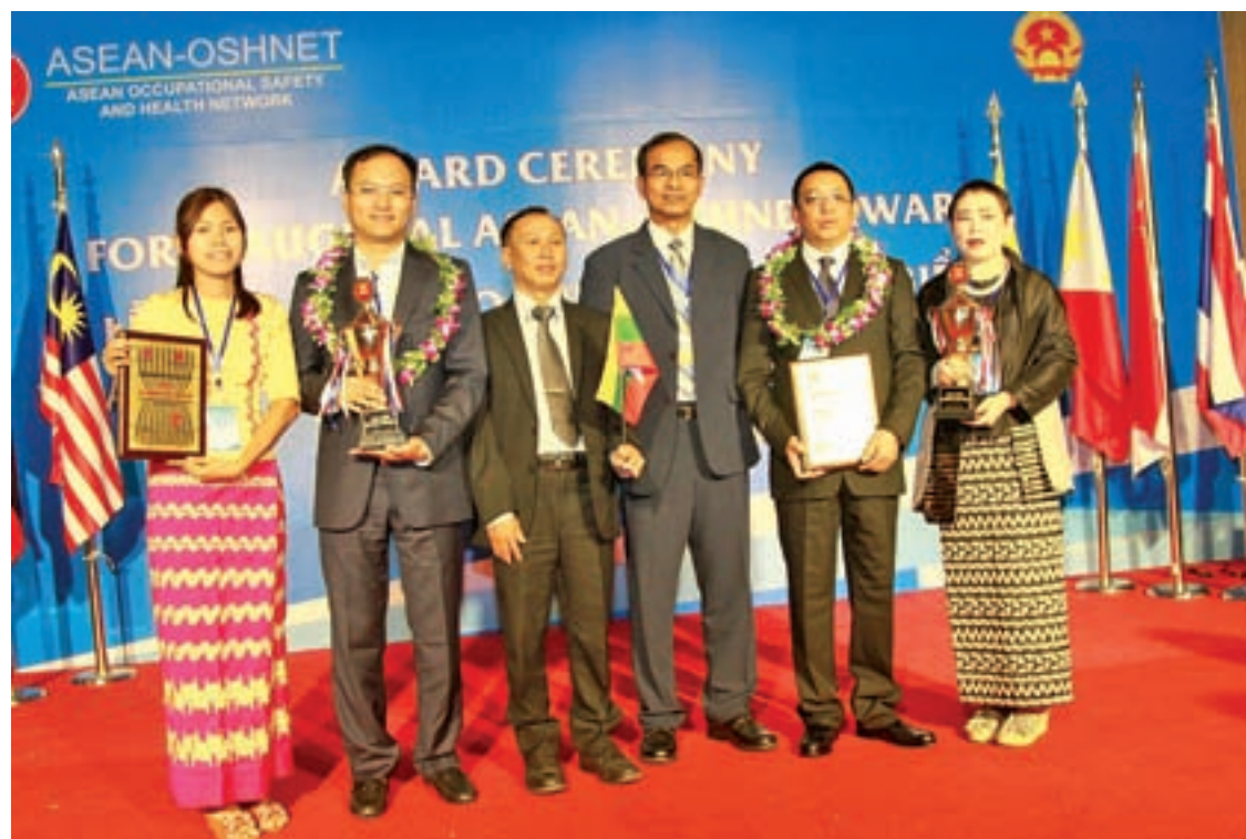
Fame and Toyo Battery posing for a group photo.