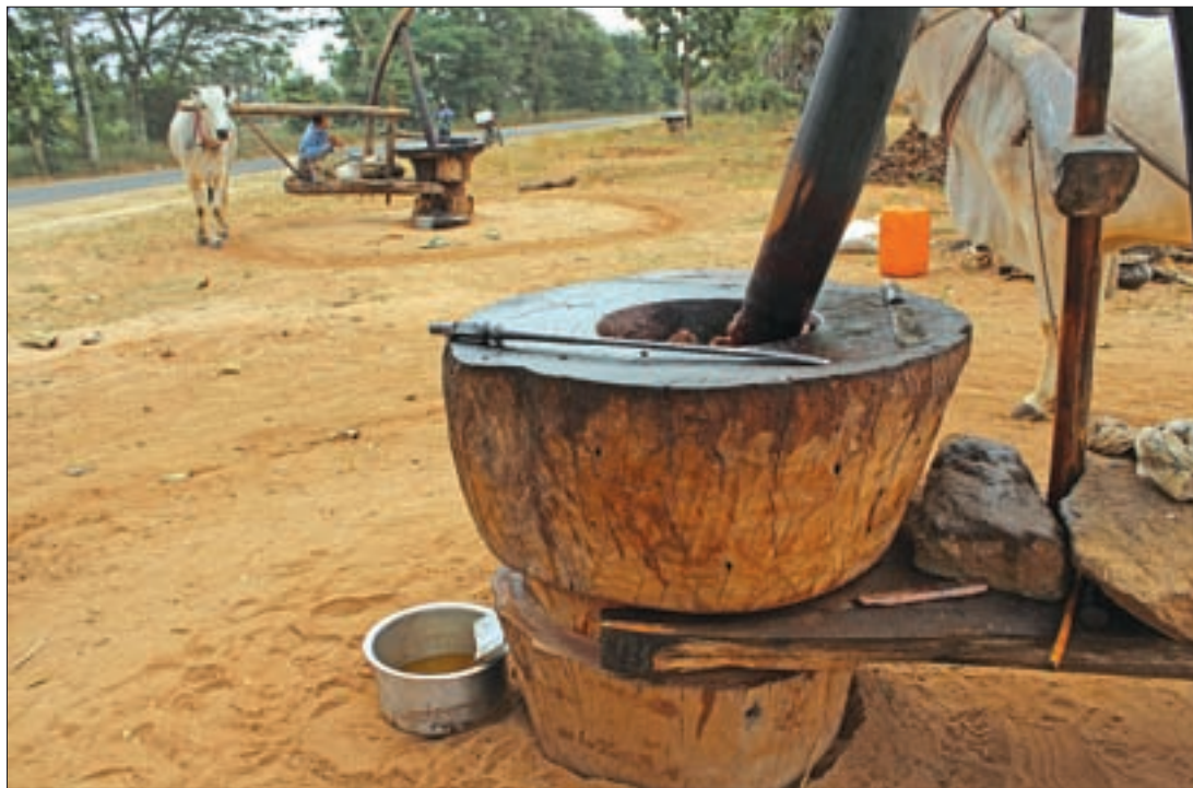
Oil being grinded by an ox drawing grinding machine.