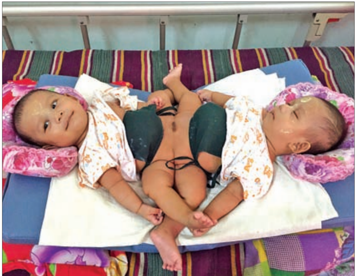
The conjoined twins being seen at Mandalay Children Hospital.

A wellwisher donated K100,000 to the conjoined twins who came from a poor family on Wednesday.