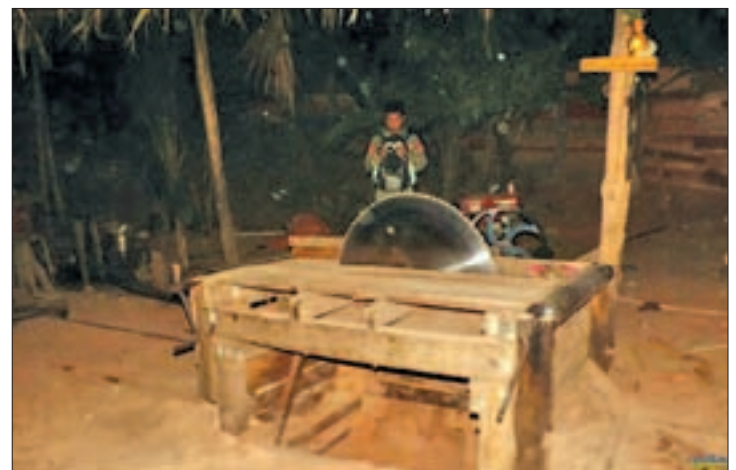
Illegal saw-machinery confiscated in Yinmabin.