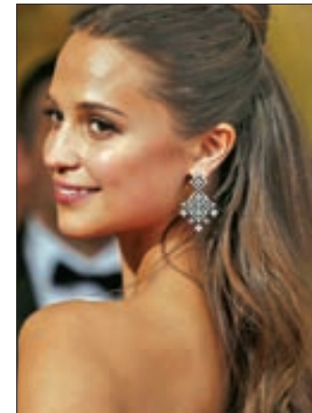
Alicia Vikander.

LOS ANGELES — Swedish Oscar-winning actress Alicia Vikander has scooped the coveted role of Lara Croft in the "Tomb Raider" movie reboot, according to industry reports.