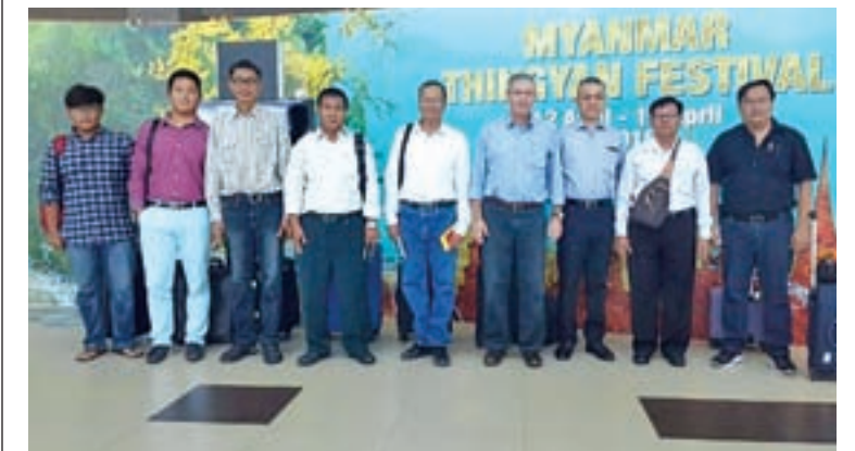
The Myanmar delegation posing for a group photo.