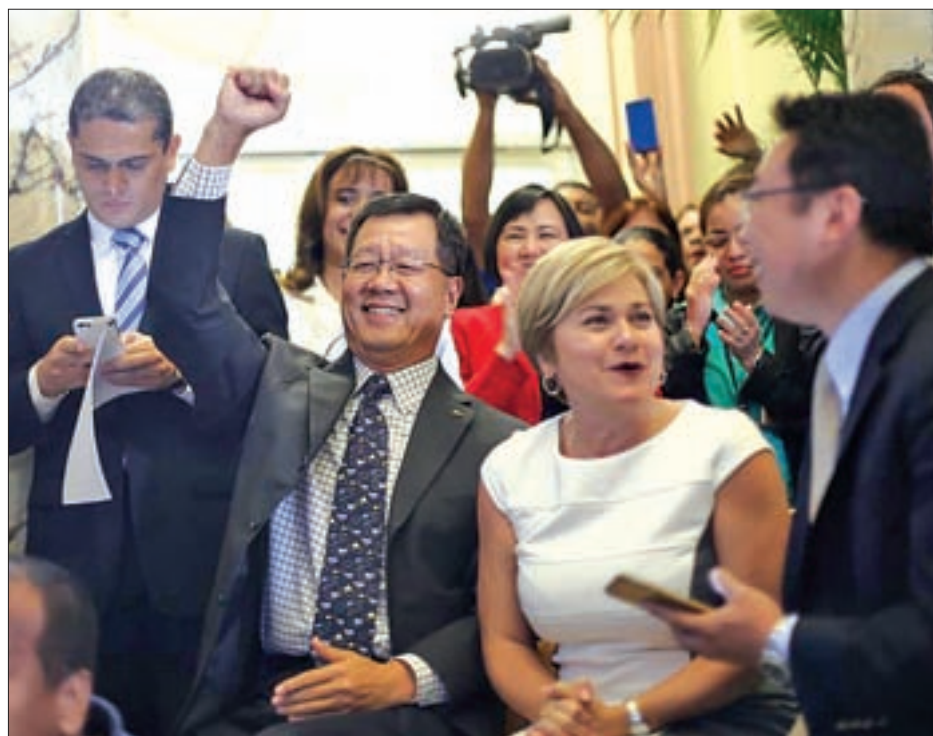
A representative from China COSCO Shipping (L, front) reacts during the draw ceremony in Panama City, capital of Panama, on 29 April 2016.

The Panama Canal announced in March it would invite its top customers to participate in the draw. —Xinhua