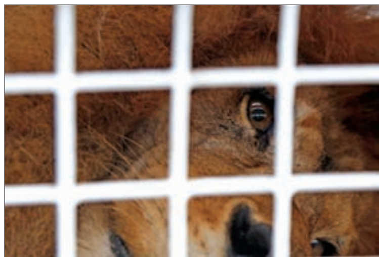
A former circus lion looks out from inside its cage in Callao, Peru, as it is prepared for transportation to a wildlife sanctuary in South Africa, on 29 April 2016.

hell on earth and now they are heading home to paradise. This is the world for which nature intended these animals for,” Jan Creamer, president of Animal Defenders International, said in a statement. “It is the perfect ending to ADI’s operation which has eliminated circus suffering in another country.”