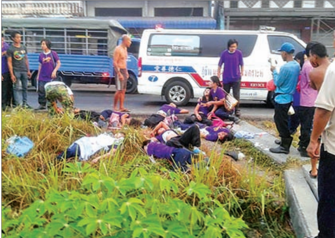
Myanmar migrants seen after a pick-up has run into them in Thailand.

A GROUP of Myanmar migrant female workers were run into by a silver coloured Mitsubishi pick-up in Ranong, Thailand yesterday morning, it has been learned.