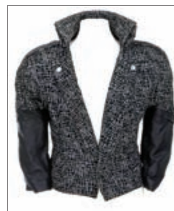
Prince “Purple Rain” jacket is shown in this image released on 29 April 2016.

“Now, all bets are off,” Chanes said, adding that the