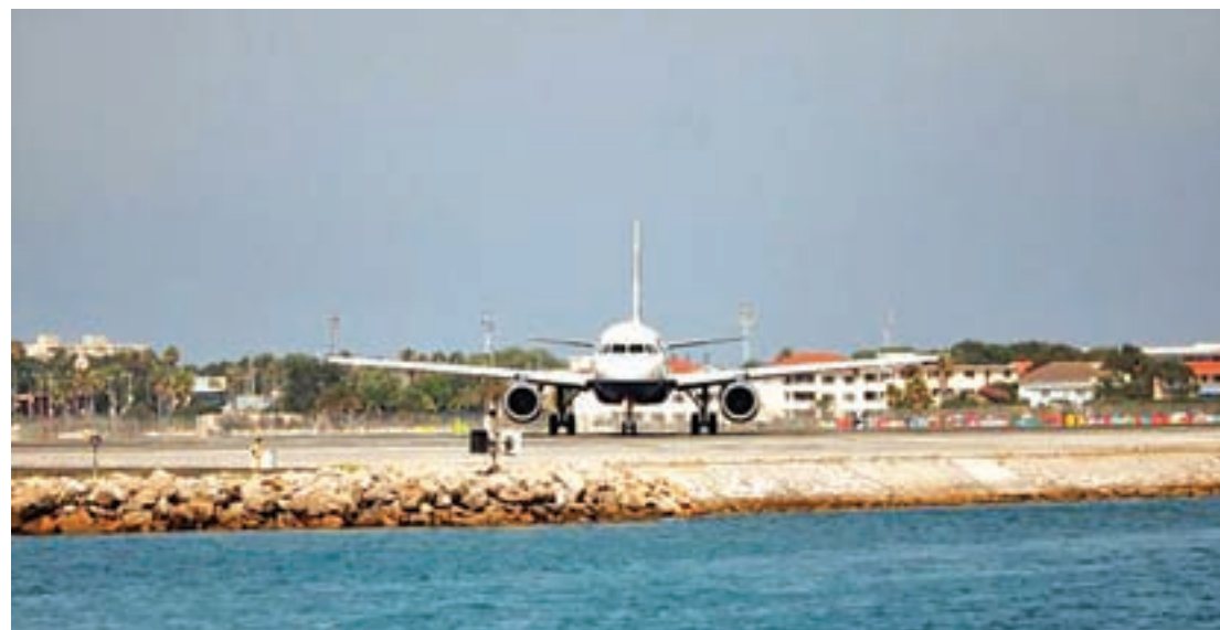
A British Airways plane is seen on the tarmac before taking off at the Gibraltar International airport, in Gibraltar, south of Spain in 2013.

BRUSSELS — Aviation industry leaders want European Union transport ministers to intervene to help settle a dispute between Britain and Spain over Gibraltar's airport which threatens proposals to smooth travel across the bloc.