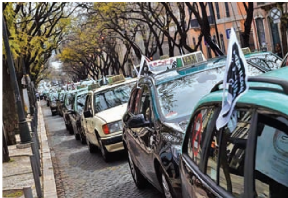
Portuguese taxi drivers line up for a protest against Uber, in Lisbon, Portugal on 29 April, 2016.

ter a manifesto was handed to the government earlier this month, with associations claiming the service is illegal because it doesn't comply with rules which taxi drivers are subject to.