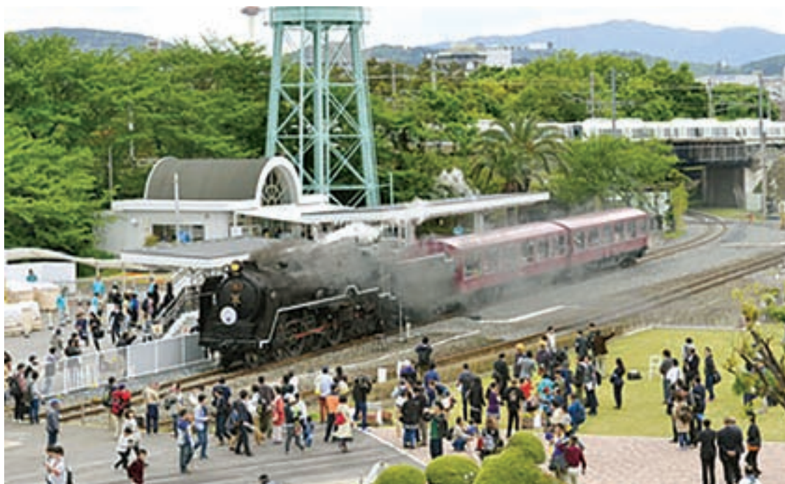
“The SL Steam,” an exhibit where visitors can ride in passenger cars pulled by steam locomotives, is seen at the Kyoto Railway Museum in Kyoto on 29 April 2016, the day of its grand opening. Operated by West Japan Railway Co., the museum is one of Japan’s largest, showcasing a total of 53 trains ranging from steam locomotives to bullet trains.

The admission fee is 1,200 yen for adults, 1,000 yen for senior high school and college students, 500 yen for elementary school and junior high school students, and 200 yen for children aged 3 or older.— Kyodo News