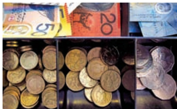
Australian dollar notes and coins can be seen in a cash register at a store in Sydney, Australia, on February.

SYDNEY — Australia on Friday proposed changes to simplify its anti money-laundering and terrorism financing laws, notably extending the regulations to include intermediaries and professions currently not required to report suspicious transactions.