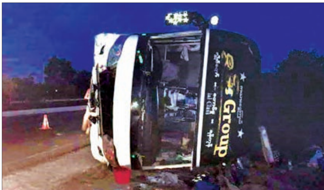
Passenger bus seen overturned.

The bus driver, Nyein Chan, has been charged by police.— Ko Nyi