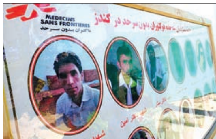
A sign commemorates 14 medical personnel who were killed when an American airstrike destroyed the Medecins Sans Frontieres hospital in Kunduz.

Firefights have been frequently reported recently between the two countries along their shared border and across Karabakh's volatile front line.—Xinhua