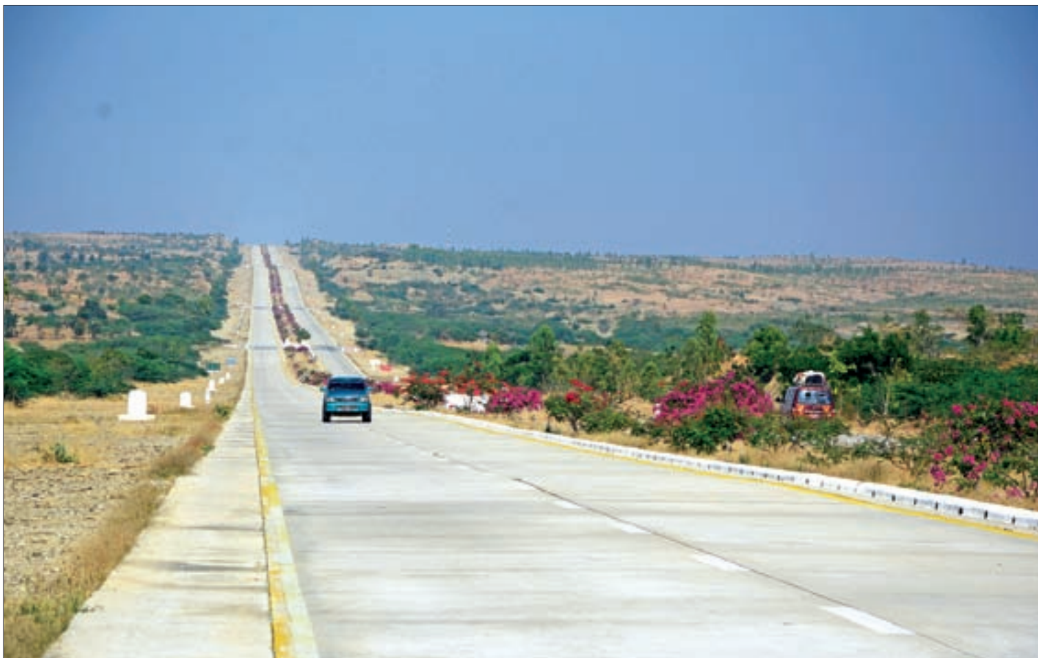
The aim to upgrade the two sections of the Yangon-Mandalay Highway is to reduce traffic accidents on them.

Two sections of YGN-MDY highway to be upgraded as part of 100-day plan