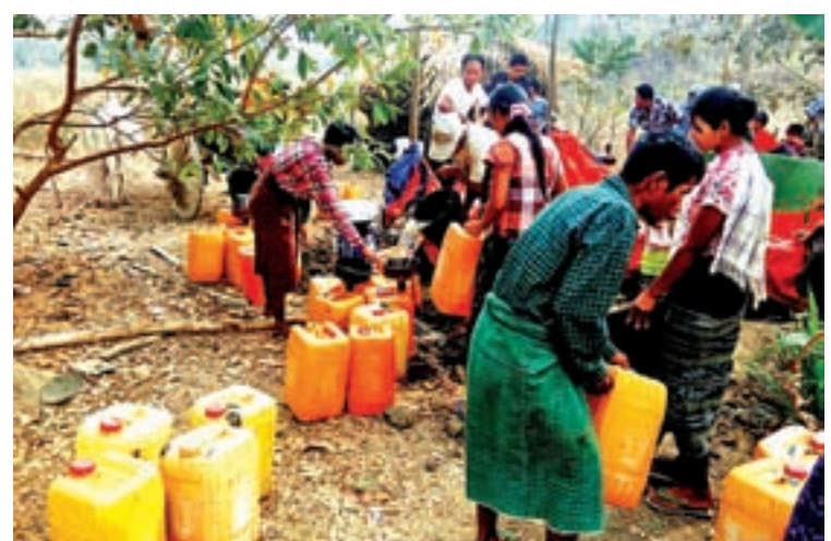
Local people collect water supplied by police and war veterans.

To overcome the challenges of water scarcity in the township, local authorities have formed a committee to supply water to the areas facing drought by joining hands with related departments in the region.— Nyan Toe (Pauk)