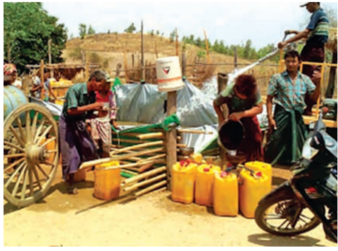
Pauk township authorities distribute drinking water to water-scarce villages.

department has distributed 800 gallons of water to Thetkechaung Village, 8,000 gallons to Thabyay and Sanphonechaung villages and 1,600 gallons to Myaukkapaing Village.—Township IPRD