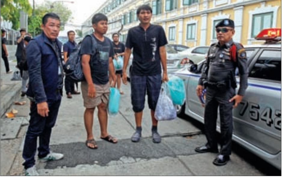
Police officers escorts three of the eight people charged with sedition and computer crimes (2<sup>nd</sup> L ,3<sup>rd</sup> L and back) as they arrive at the military court in Bangkok, Thailand on 29 April.

Under the law, suspects can be detained for up to 12 days, extended seven times, before they are formally