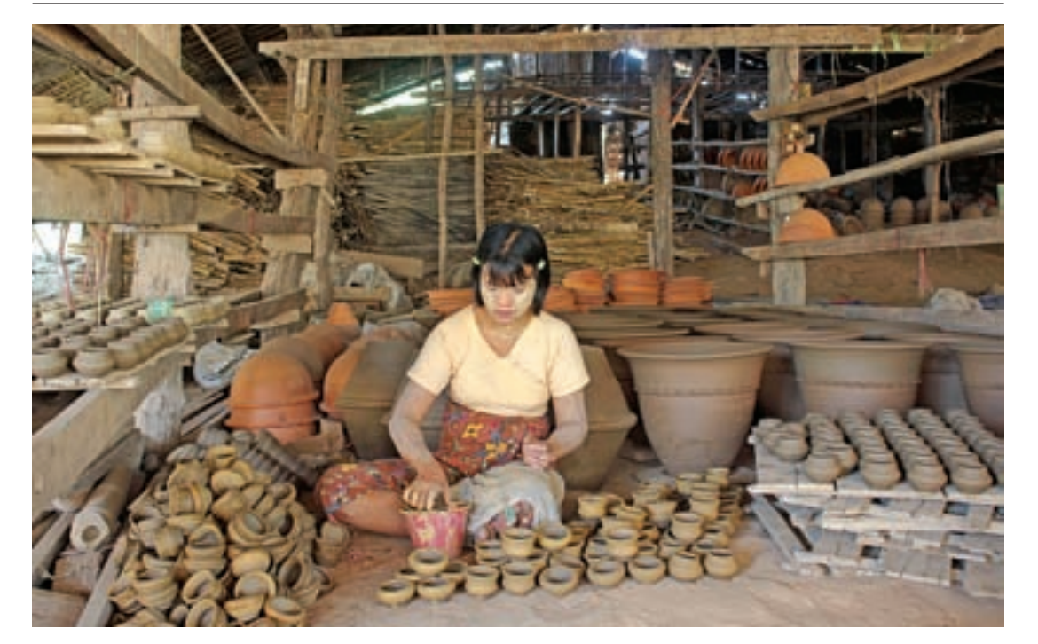
A woman makes small clay toy pots in Twantay.

The six listed companies which have been permitted to sell stocks on the YSX are FMI, Myanmar Thilawa SEZ Holdings, Myanmar Citizens Bank, First Private Bank Limited, Myanmar Agribusiness Public Corporation and the Great Hor Kham Public Company.-Myitmakha News Agency