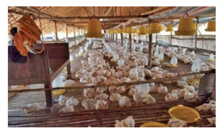
A chicken farm in Nay Pyi Taw.

Record temperatures hit Nay Pyi Taw, reaching 44 degrees Celsius on 29 April. The temperature has been around 30 degrees in previous years .-- Thein Ko Lwin