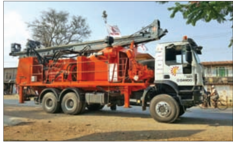
KBZ foundation's new machinery can drill down up to a depth of 1,800ft.

Also present were members of Constitutional Tribunal of the Union U Twal Kyin Paung and U Kyaw Sann as well as other officials.--Myanmar News Agency