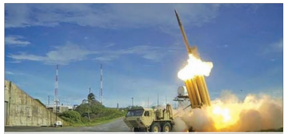
A Terminal High Altitude Area Defence (THAAD) interceptor is launched during a successful intercept test, in this undated handout photo provided by the US Department of Defence, Missile Defence Agency. PHOTO: REUTERS

WASHINGTON — China and Russia urged the United States on Friday not to install a new anti-missile system in South Korea, after Washington said it was in talks with Seoul in the wake of nuclear arms and missile tests by North Korea.