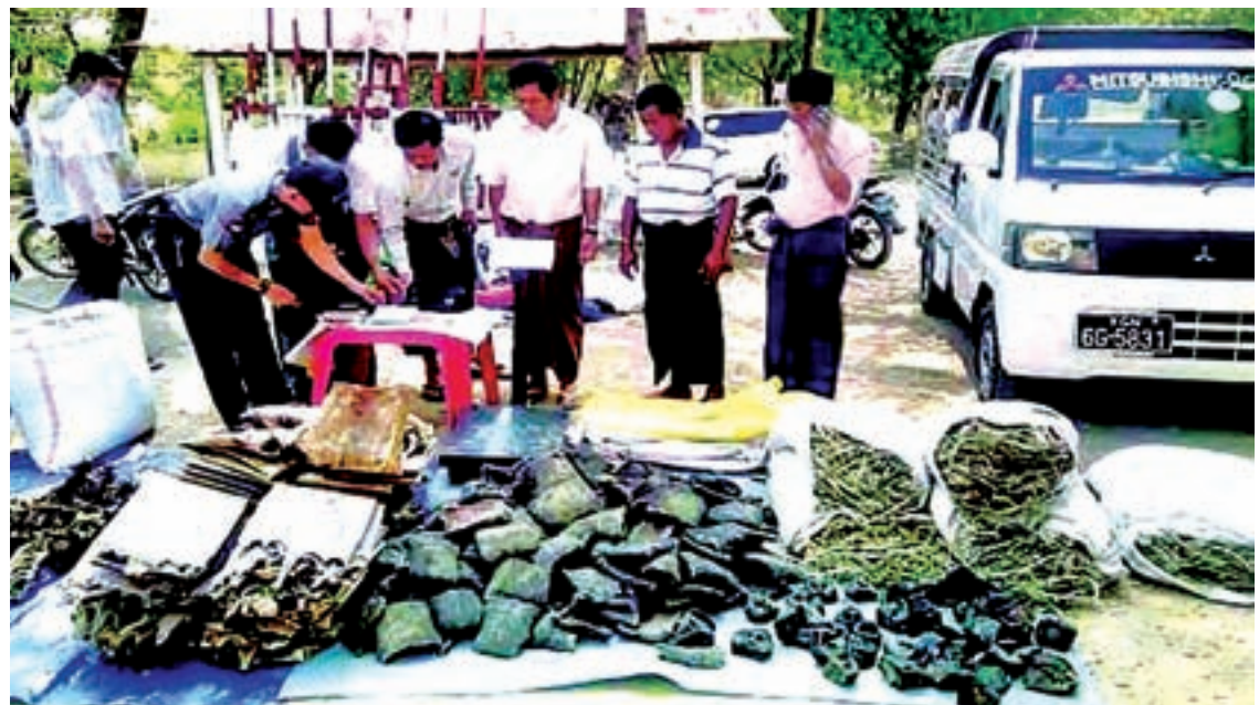
Seized elephant hides and trunks being seen.

LOCAL Authorities seized animal hides and trunks along Minbu- Padan road on Tuesday. Acting on a tip- off, a combined investigation team comprising officers and staff from Magwe police force searched a vehicle