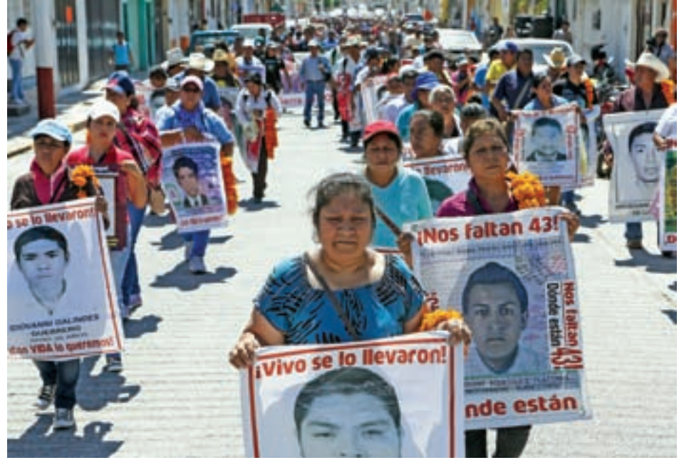
Relatives of the 43 missing students of the Ayotzinapa teacher training college march before receiving the final report on the disappearance of their sons by members of the Inter-American Commission on Human Rights (IACHR) in Tixtla, Guerrero state, Mexico, on 27 April.