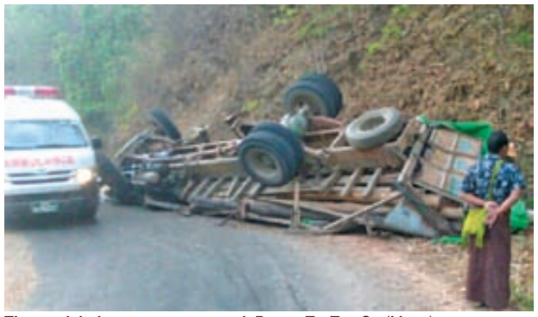
The truck being seen overturned.

SIX men were killed when a truck carrying timber logs overturned in Setottaya township, Minbu on Wednesday.