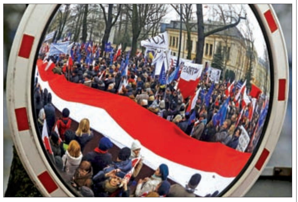
People hold giant Polish national flag as they take part in a march demanding their government to respect the country's constitution in front of the Constitutional Court in Warsaw, Poland, on 12 March.

The new rules have drawn international criticism, including from the European Union and some rating agencies, which say they undermine the state's credibility. The constitutional judges have them-