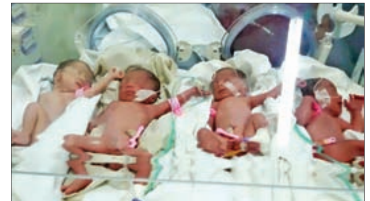
The quadruplets are seen at Mandalay Hospital.

"The most common forms of multiples are twins and triplets.