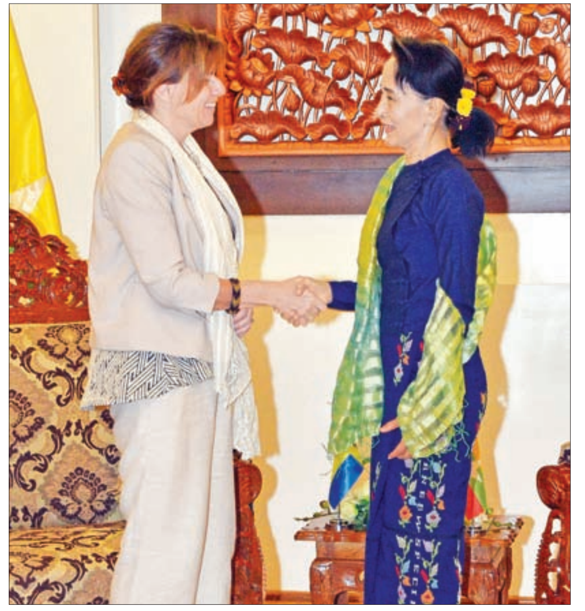
Union Foreign Minister Daw Aung San Suu Kyi shakes hands with Swedish Minister for International Development Cooperation Ms. Isabella Lövi.

Likewise, the Union minister held talks with the US and Mongolian ambassadors to Myanmar regarding the strengthening of bilateral relations and opportunities to enhance cooperation between the two countries as well as matters of common interest and mutual prosperity.— Myanmar News Agency