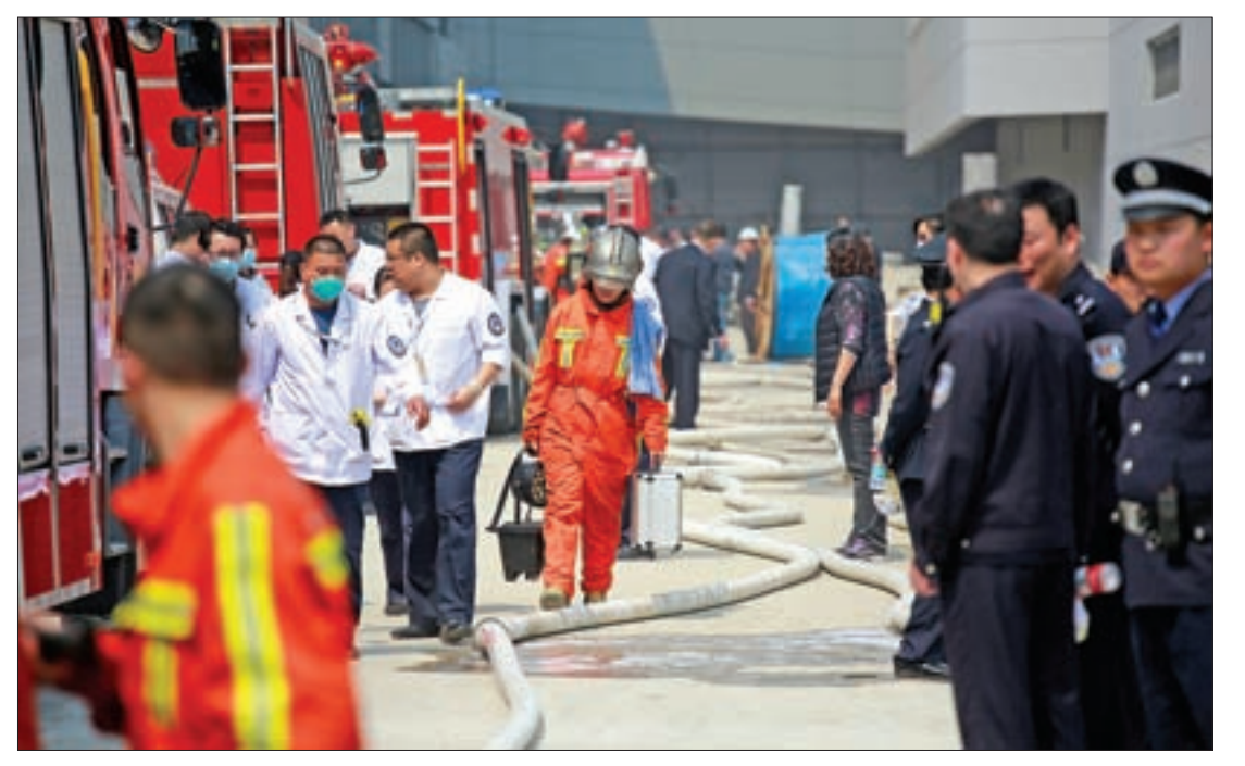
Firefighters and police are seen near the site of a fire at the Shanghai Hongqiao Airport in Shanghai on 29 April 2016.