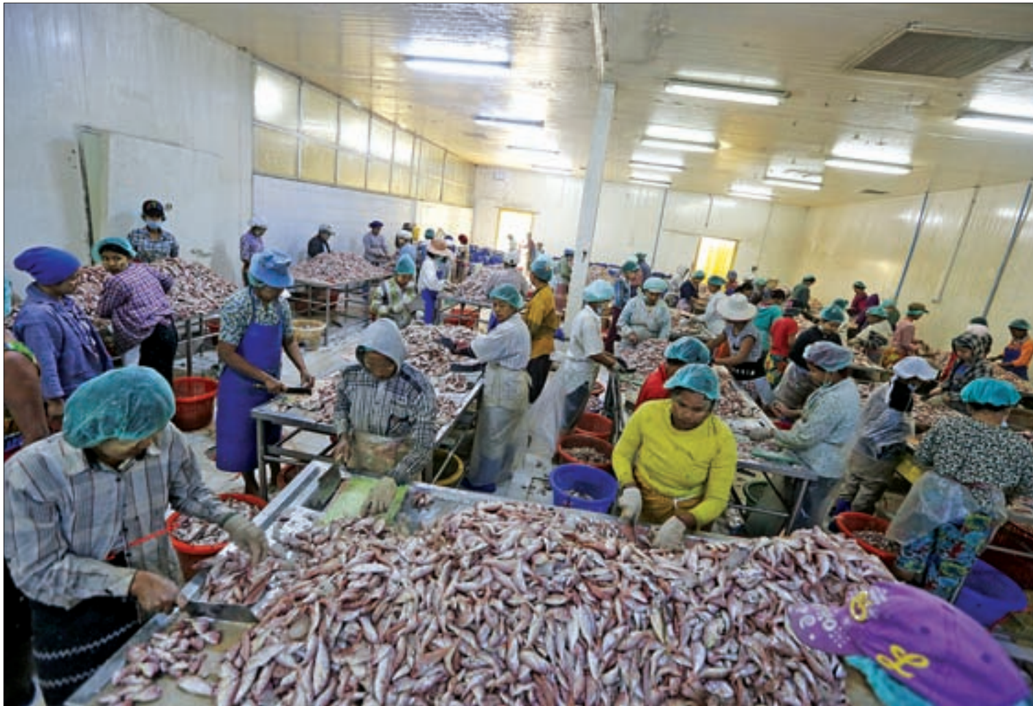
Women workers process fish at a seafood export factory in Hlaingthaya Industrial Zone, Yangon, Myanmar on 19 February, 2016.

THE number of woman workers at minced fish processing plants at the fish markets in Yangon has risen threefold because the jobs allow them to earn better income.