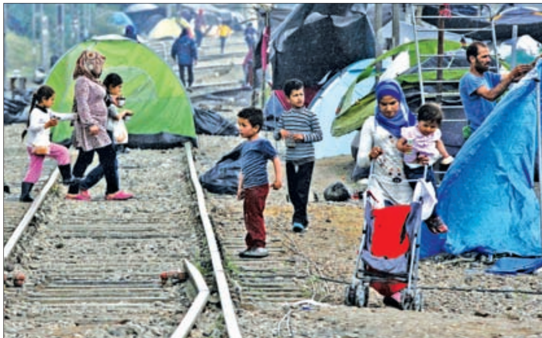
People make their way at a makeshift camp for migrants and refugees at the Greek-Macedonian border near the village of Idomeni, Greece, on 23 April 2016.

IDOMENI, (Greece) — After weeks stranded at a closed border in northern Greece, migrants and refugees are seeking out new, irregular routes to get into Macedonia, clambering through forests and over hills under the cover of darkness.