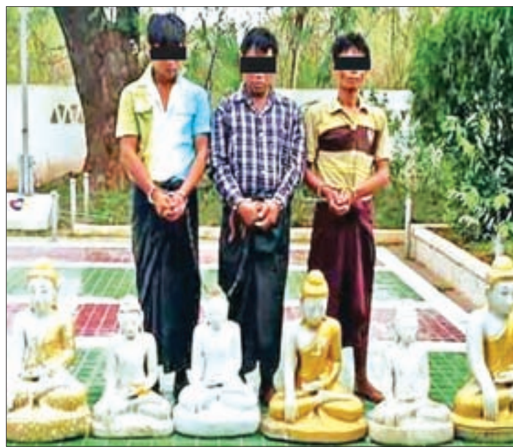
Suspects pose with the stolen Buddha icons.