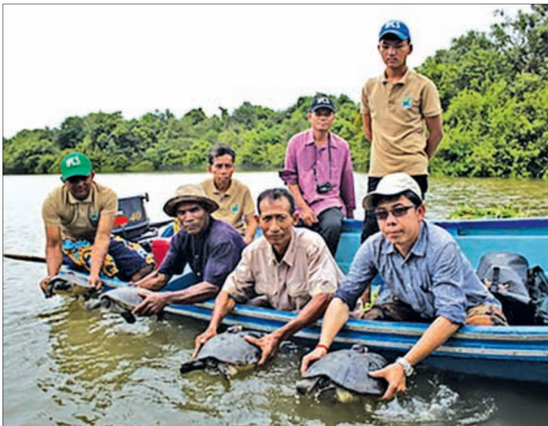
Undated supplied photo shows conservation workers on Cambodia's Sre Ambel River carrying out work to save the endangered Royal Turtle.

"Only one nest has been located this year, compared to four nests last year. This is very worrying and, if it continues, it will be potentially putting the species at high risk of extinction," In Hul added. The Royal Turtle was believed extinct in Cambodia until 2000, when a small population was discovered by the Fisheries Administration and the WCS in the Sre Ambel River, about 150 kilometres southwest of Phnom Penh. In 2001, the two bodies began a community-based pro-