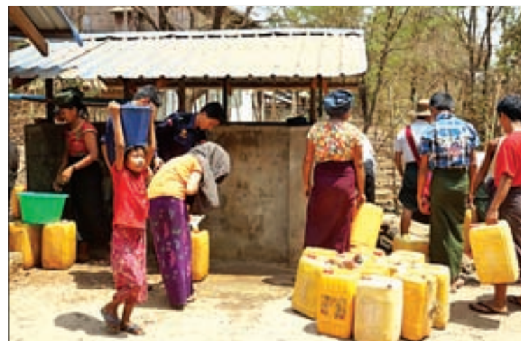
A girl carrying water containers filled with water in a village in Myan Aung Township.

GROUNDWATER resources are facing depletion throughout the country as the effect of El Niño set in across the country.