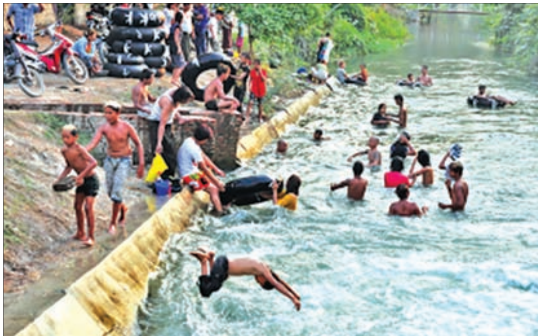
Young people congregate in the canals to cool off.