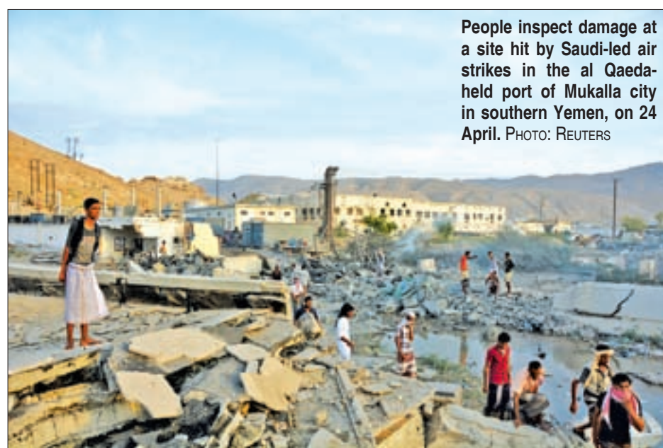
People inspect damage at a site hit by Saudi-led air strikes in the al Qaeda-held port of Mukalla city in southern Yemen, on 24 April.

appear routine. Cole insisted he had no regrets about coming to Iraq, where his chores involve checkpoint duty, helping internally-displaced people, and “prisoners” — a task he declined to detail.—Reuters