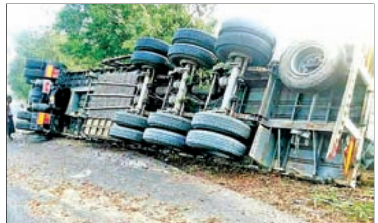
The truck overturned when the driver lost control while driving on the Yangon-Mandalay highway.

A DRIVER was injured Sunday morning when his 20-wheel vehicle skidded off the road and overturned between mile post No 106/5 and No 106/6 on the Yangon-Mandalay road.