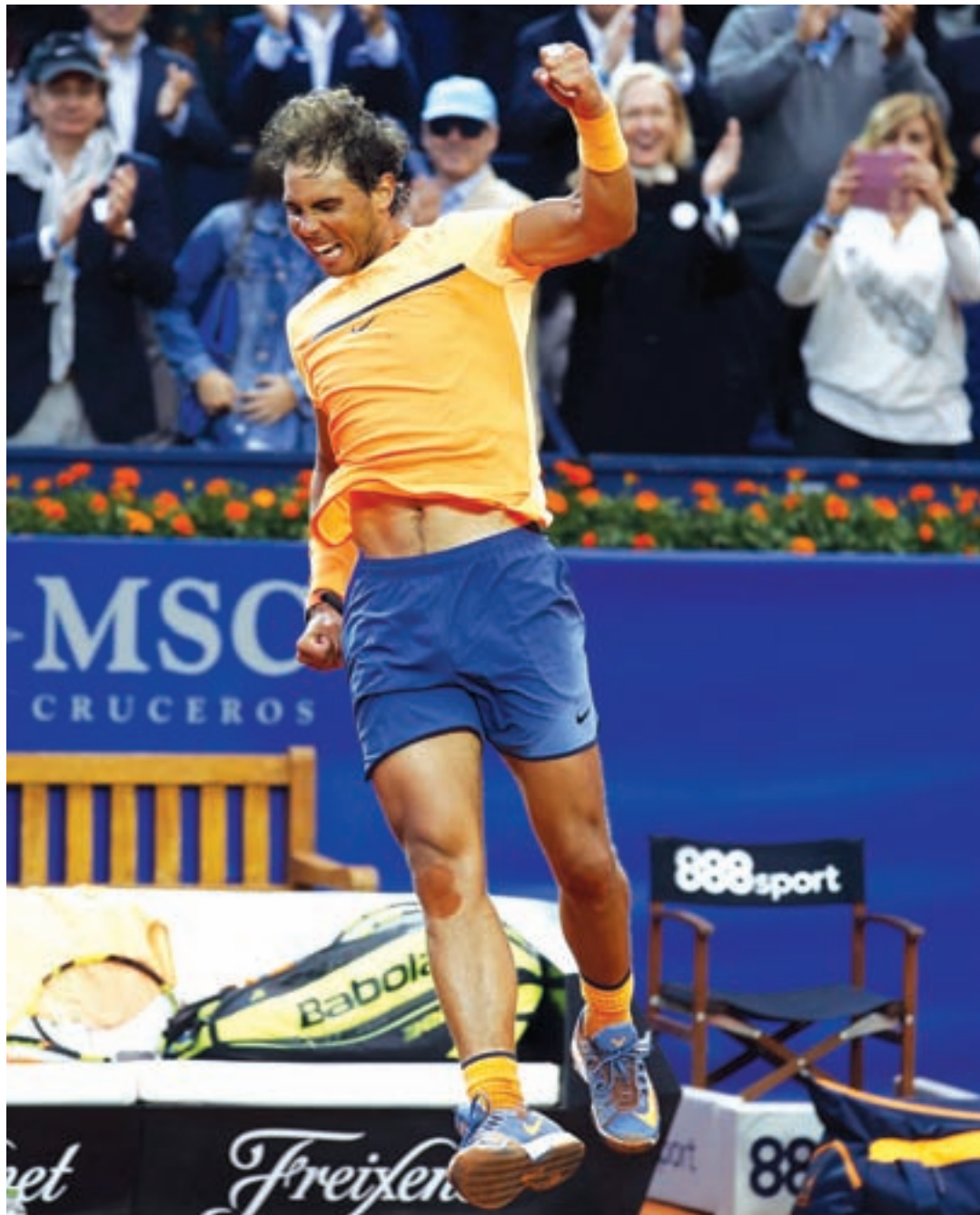
Rafael Nadal of Spain jumps after winning the Barcelona Open tennis tournament against Kei Nishikori of Japan in Barcelona, Spain, on 24 April.

Nadal, who will target a 10 th French Open title next month, had not won back-to-back titles since 2013. He and former Argentine great Vilas have both won 49 claycourt titles and Nadal will be confident of edging ahead when he moves on to Madrid and Rome before Roland Garros.—Reuters