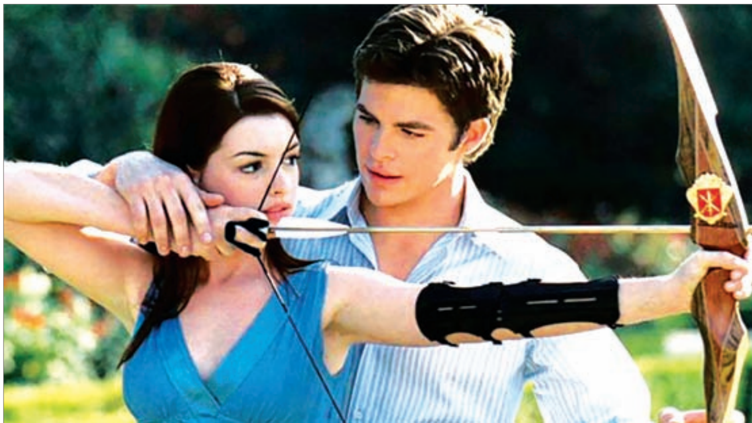
"Princess Diaries" director Garry Marshall has revealed that he has spoken to its star Anne Hathaway and Julie Andrews for another sequel of the franchise.

LOS ANGELES — "Princess Diaries" director Garry Marshall has revealed that he has spoken to its star Anne Hathaway and Julie Andrews for another sequel of the franchise.