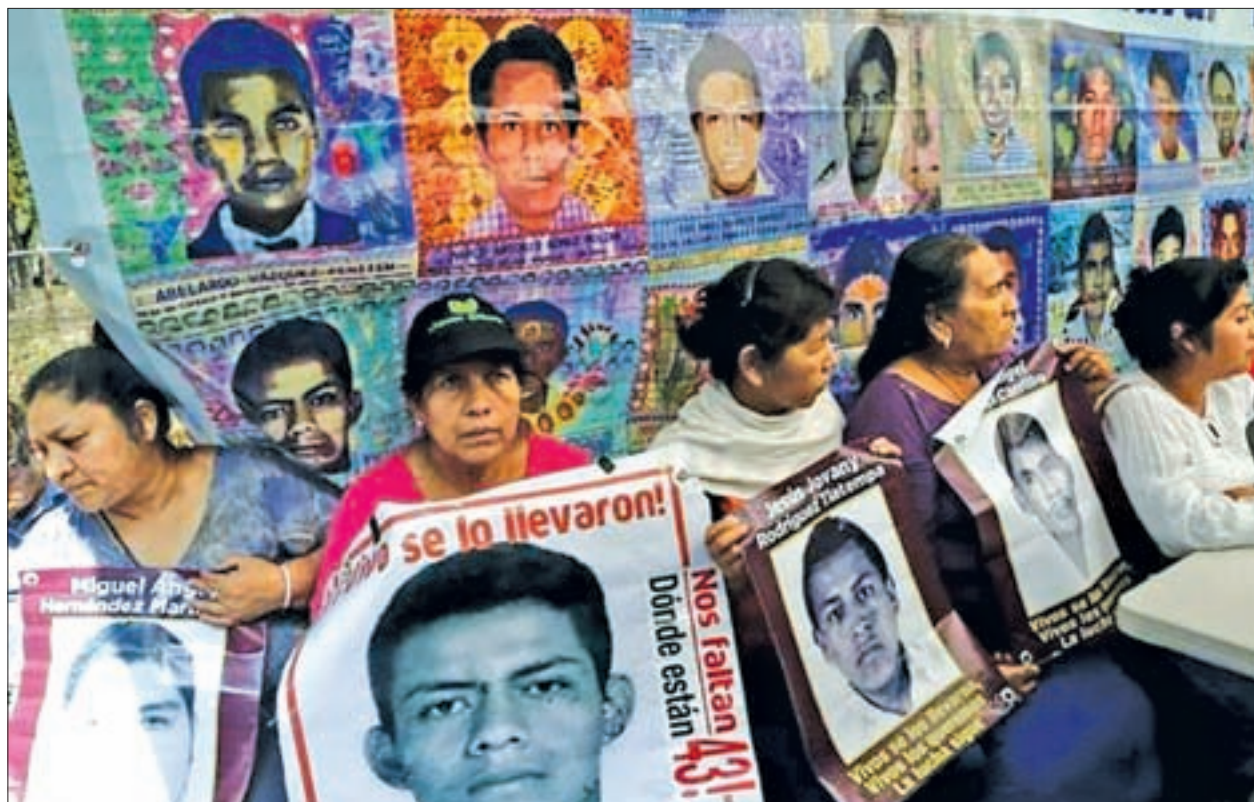
Relatives hold banners with images of some of the 43 missing students of Ayotzinapa College Raul Isidro Burgos as they attend a news conference after meeting with Attorney General Arely Gomez Gonzalez in Mexico City, on 17 March.

As the experts finished their remarks at the news