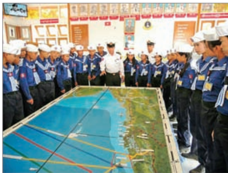
Students learn maritime skills during their summer course.