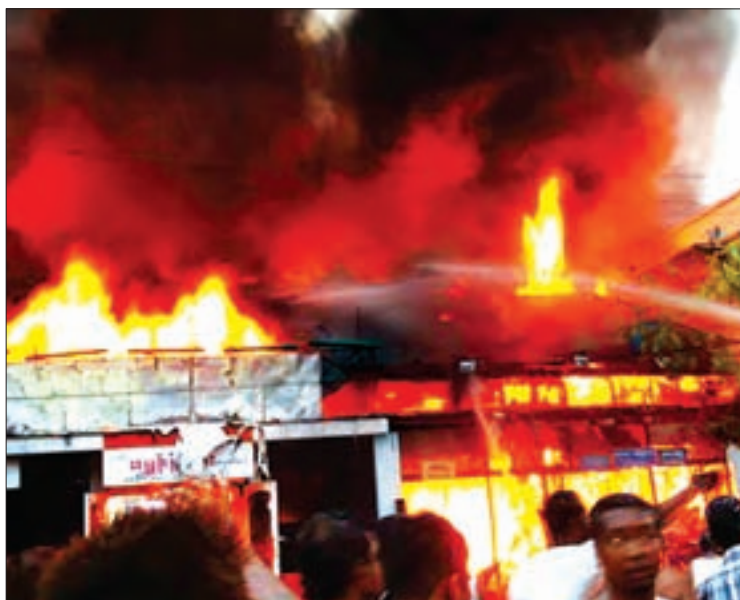
The fire spread from Piti Clinic to several adjacent apartments.

One firefighter was reportedly injured while trying to extinguish the fire. Police are still investigating the owner of the clinic.