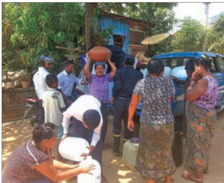
Local people collect water supplied by authorities in Kawthaung.

“But we did use the water tankers to help the people in crisis,” he added.— Kyaw Soe