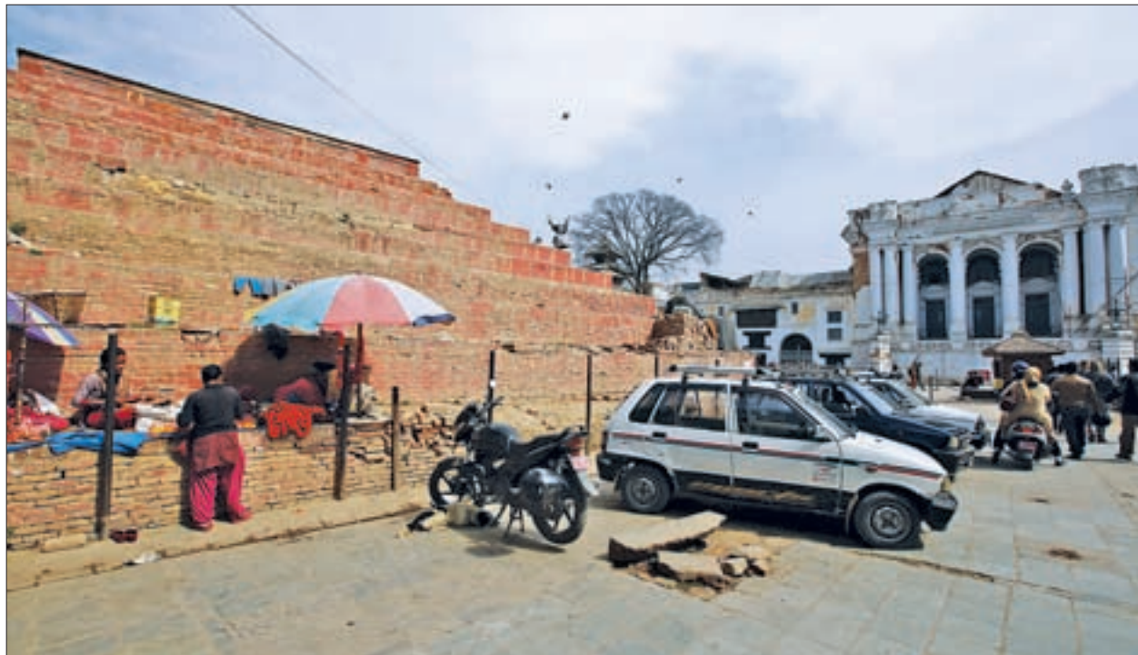
A view of Bashantapur Durbar Square, a UNESCO world heritage site, is pictured after the April 2015 earthquake debris had been cleared in Kathmandu, Nepal, on 16 February.

KATHMANDU — Nepal on Monday officially launched efforts to reconstruct cultural monuments damaged or destroyed by last year's earthquakes, in which 8,961 people died and 753 monuments were lost.