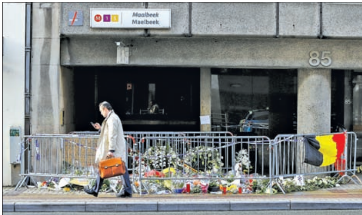
A man walks past a street memorial outside Maelbeek metro station, a week after bomb attacks took place in the metro and at the Belgian international airport of Zaventem, in Brussels, Belgium, on 29 March.