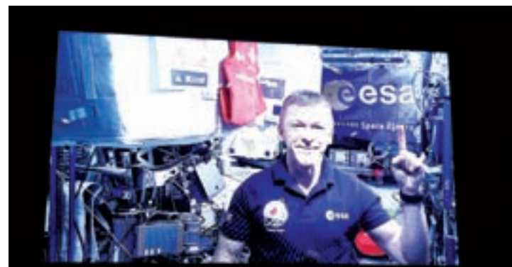
British European Space Agency (ESA) astronaut Tim Peake.

LONDON — British astronaut Tim Peake became the first man to complete a marathon in space on Sunday, running the classic 26.2 mile distance while strapped to a treadmill aboard the International Space Station.