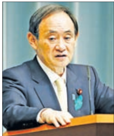
Japanese Chief Cabinet Secretary Yoshihide Suga says at a press conference in Tokyo on 20 April, 2016 that repeated earthquakes centering on Kumamoto and Oita prefectures do not warrant a delay in the planned increase in the consumption tax in April 2017.

TOKYO — Japan's top government spokesman on Wednesday refused to confirm or deny a report from an Australian news outlet which claimed the Australian government has eliminated Japan from the bidding process for the construction of a fleet of navy submarines.