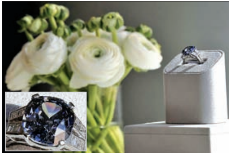
Fancy Deep Blue diamond ring, once owned by child star Shirley Temple, is displayed at Sotheby's in New York on 18 March 2016.

NEW YORK — A 9.54-carat rare blue diamond ring once belonging to the late Shirley Temple, one of Hollywood's most famous child actors, failed to sell at a New York auction on Tuesday, where it had been estimated to fetch between $25 million and $35 million.