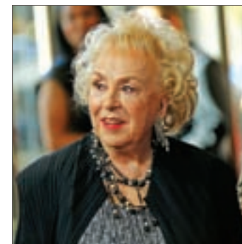
Actress Doris Roberts arrives at the Hollywood Film Awards in Beverly Hills, California on 1 November 2015.

F Gary Gray is helming the project with Charlize Theron and Scott Eastwood set to join the franchise, while Michelle Rodriguez, Jason Statham and Dwayne Johnson are signed on to reprise their roles.— PTI