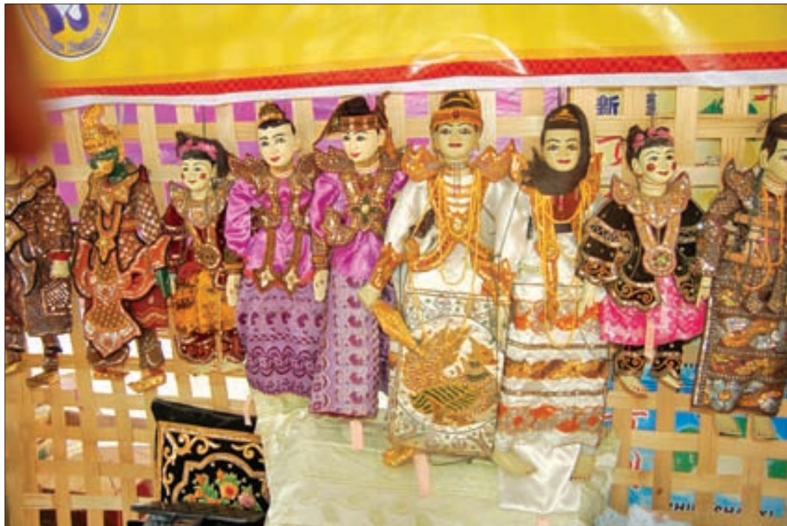
Puppets looking good in their costumes.

THE ASEAN puppetry exchange programme is scheduled to be held in Yangon in May with the aim of sharing traditional such folk arts among the 10 member countries, one of organisers said.