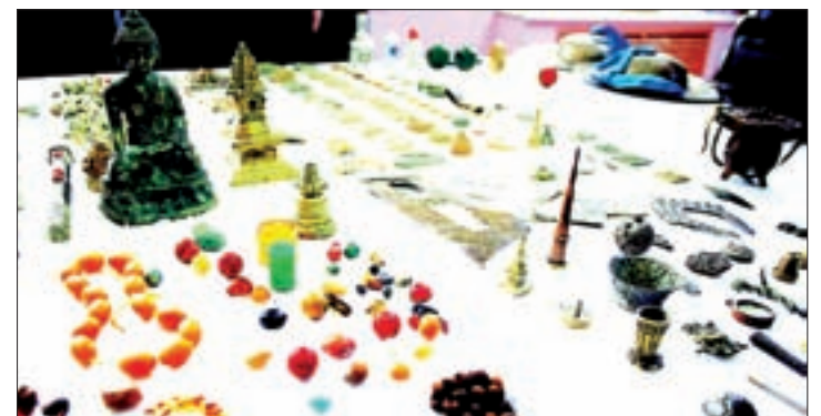
Gems and jewellery are seen at an emporium. PHOTO: 200

MYANMAR needs more emporiums in order to fulfill the technological requirements of manufacturing finished gem products although there are plenty of raw jade and jewelry products available, according to Myanmar Gems and Jewellery Entrepreneurs Association.