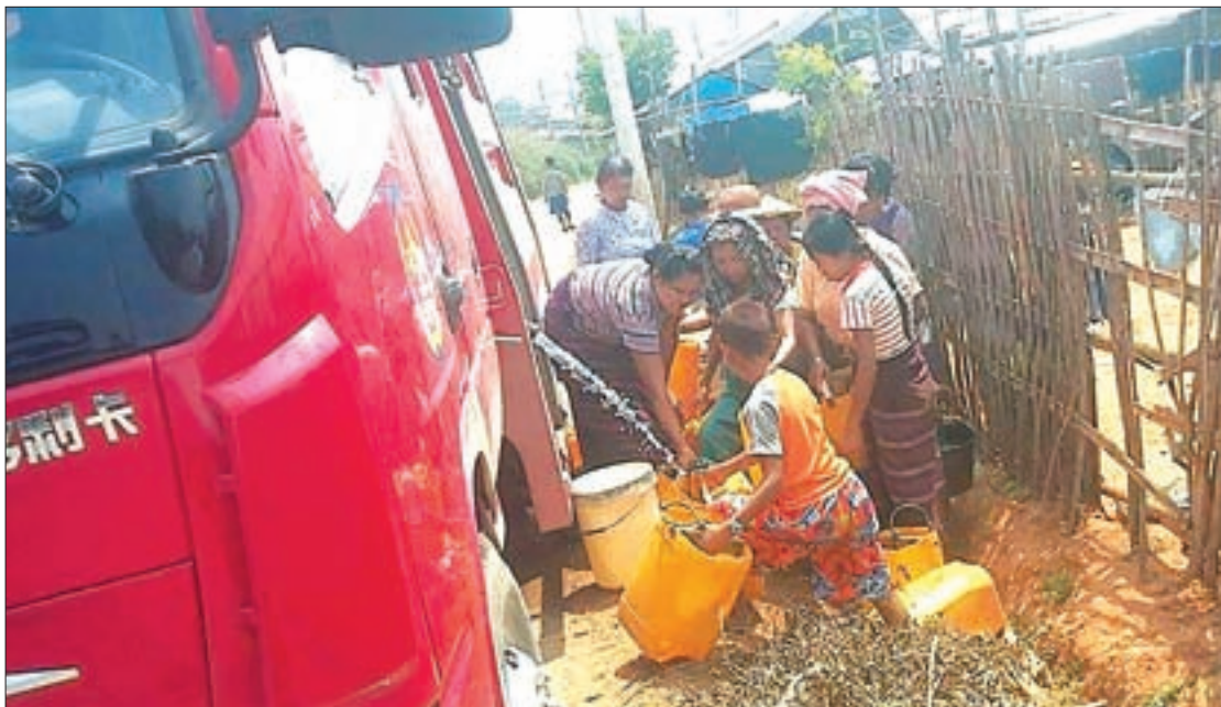
Villagers collect water supplied by a water bowser in Lashio.

THE MINISTRY of Social Welfare, Relief and Resettlement is providing drinking water to villages in those states and regions that are facing water shortages caused by El Niño.