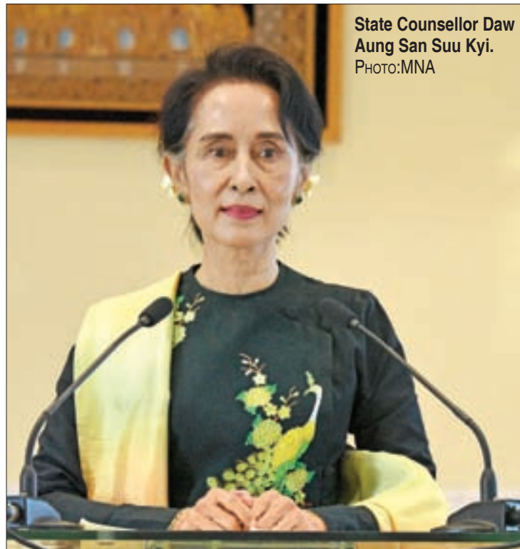
State Counsellor Daw Aung San Suu Kyi.

According to the constitution, the country practices independent, active and non-aligned foreign policy alongside the five principles of peaceful coexistence. These principles include