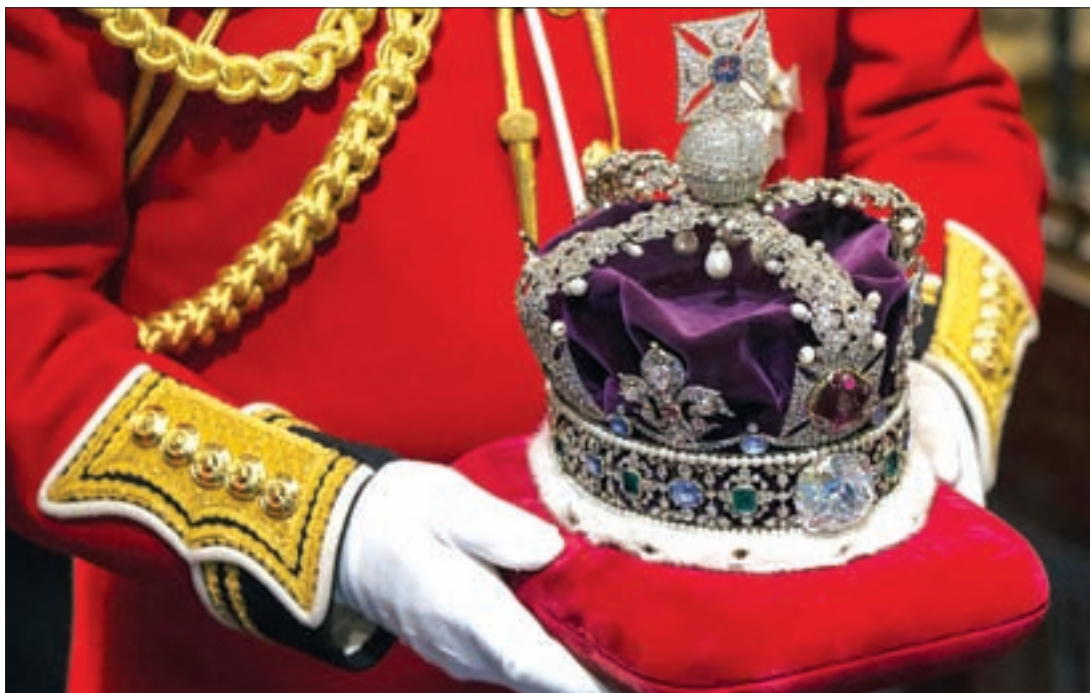
Britain's Queen Elizabeth's crown is carried through the Norman Porch of the Palace of Westminster after the State Opening of Parliament on 4 June 2014 in London, England.

The Koh-i-Noor is set in the crown worn by Queen Elizabeth, the mother of the reigning monarch, at the coronation of her husband George VI in 1937, and was placed on her coffin at her funeral in 2002. The Duchess of Cambridge, who last week visited India with her husband, Prince William, will wear the crown on official occasions when she becomes queen consort. William is second in line to the British throne.—Reuters