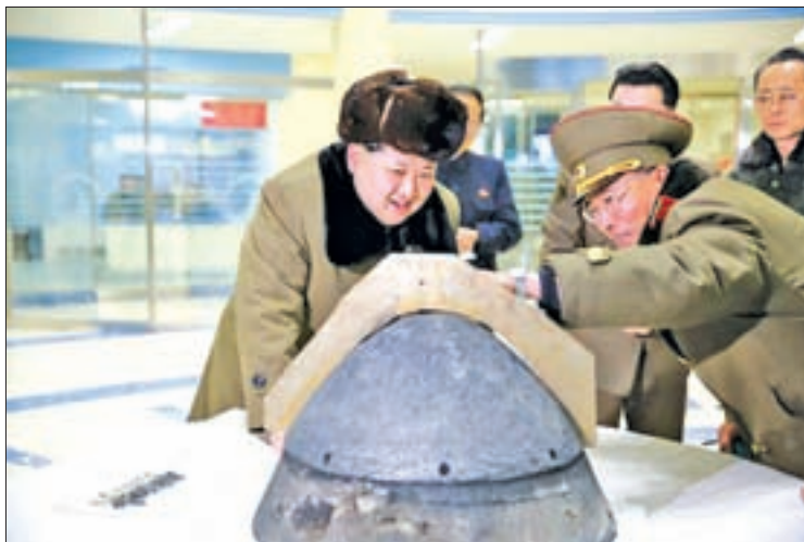
North Korean leader Kim Jong Un looks at a rocket warhead tip after a simulated test of atmospheric re-entry of a ballistic missile.

Estimates of North Korean workers abroad vary widely but a study by the South’s state-run Korea Institute for National Unification put the number as high as 150,000, primarily in China and Russia, sending back as much as $900 million annually. North Koreans are known to work abroad in restaurants and on construction sites, and also as doctors.