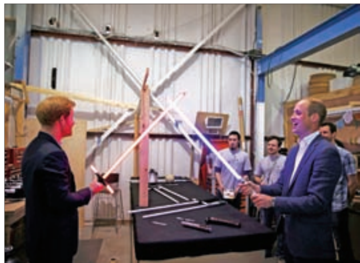
Britain's Prince William (R) tries a light sabre against his brother Prince Harry during a visit to the Star Wars film set at Pinewood Studios near Iwer Heath, west of London, Britain, on 19 April 2016.

"Star Wars: Episode VIII" is due for release in December 2017.— Reuters