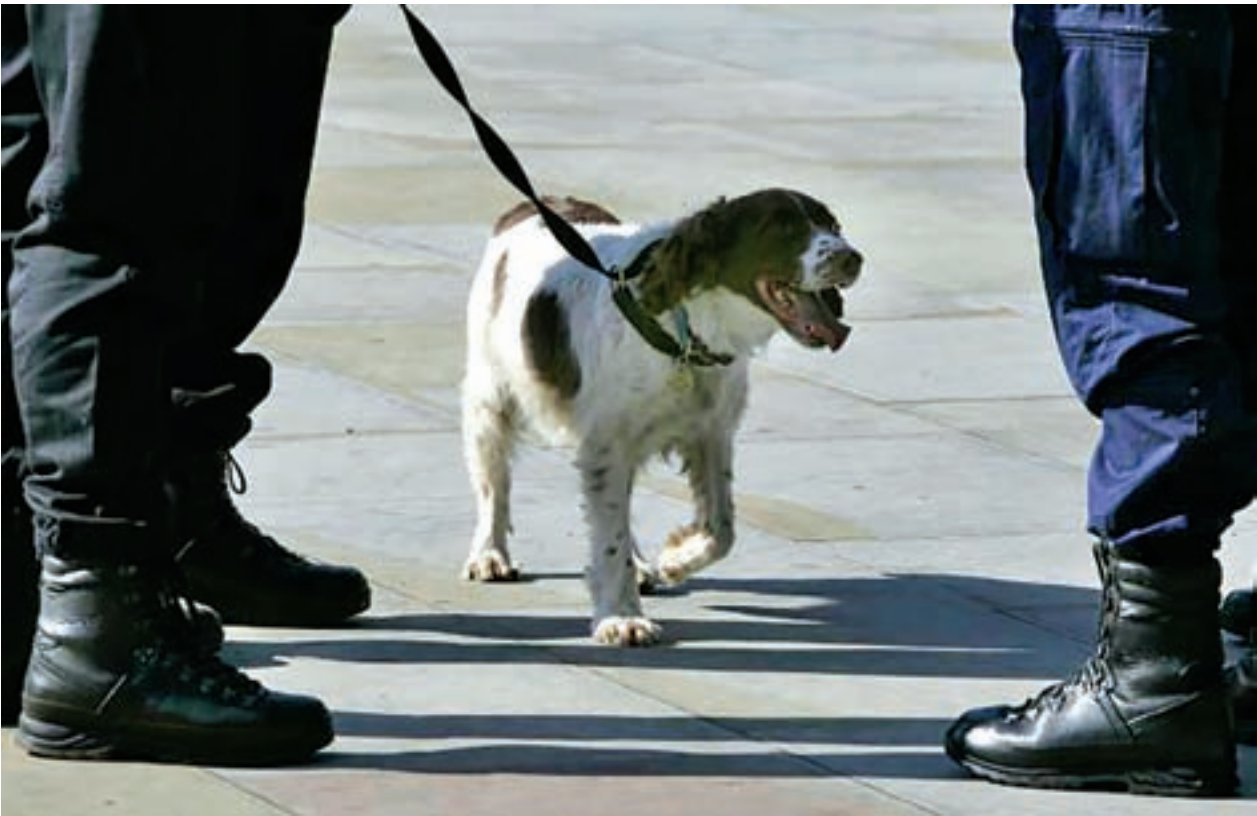
A police dog handler talks with a colleague as his sniffer dog waits outside the GMEX (Greater Manchester Exhibition centre) in Manchester, northern England, on 21 September 2006.

Each dog has its own speciality in detecting goods such as drugs, tobacco, cash and meat being illegally brought into the airport by the 22 million passengers