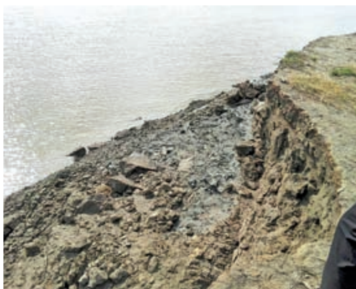
Riverbank erosion in Bago.

"The whole of Shwetisout village has been destroyed. The village of Sarphyu, situated behind Shwetisout village, also lost their farmland to the erod-