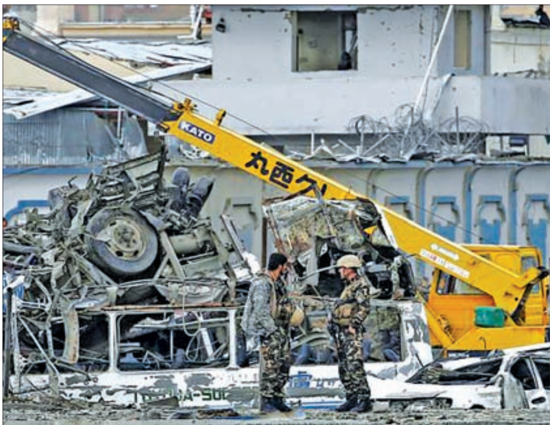
Afghan security forces stand next to damaged vehicles after a blast in Kabul, Afghanistan on 19 April 2016.

The attack underlined concerns raised in a United Nations report this week, which said an increase in urban warfare had caused a spike in civilian casualties during the first three months of the year.