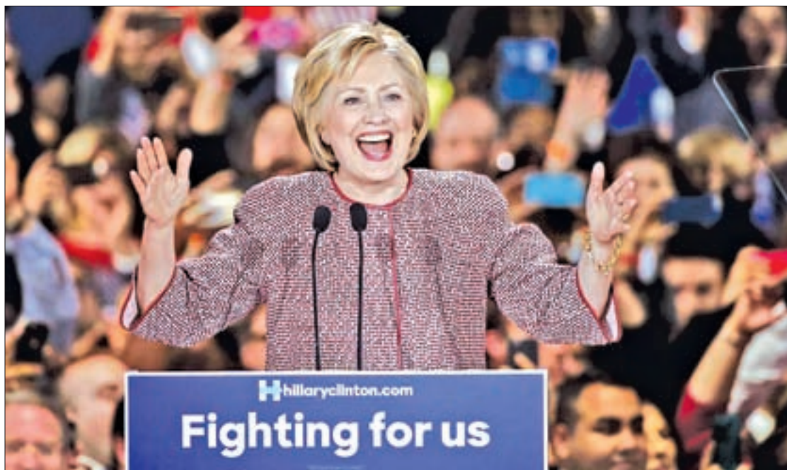
Democratic presidential candidate Hillary Clinton reacts as she arrives onstage at her New York presidential primary night rally in the Manhattan borough of New York City, US, on 19 April, 2016.

NEW YORK — Republican Donald Trump and Democrat Hillary Clinton scored sweeping victories in nominating contests in their home state of New York, and immediately cited them in arguing they are all but unstoppable as their respective parties' presidential nominees.