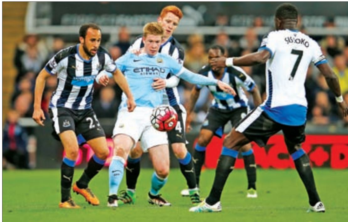
Manchester City's Kevin De Bruyne in action with Newcastle's Jack Colback and Andros Townsend during Barclays Premier League at St James' Park on 19 April 2016.

With four games of their season remaining, they are a point adrift of local rivals Sun-