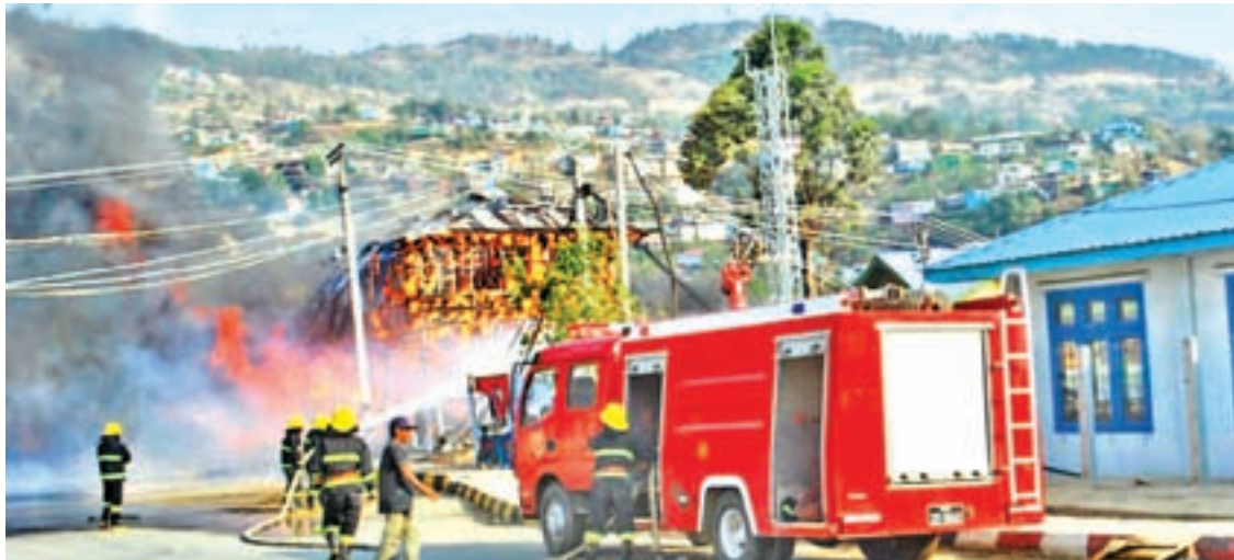
Fire service personnel seen fighting the fire.

A fire has destroyed a house on Bogyoke road, Haka Town, Chin State on April 19. According to the investigation, the fire broke out in a business selling gas cyl-