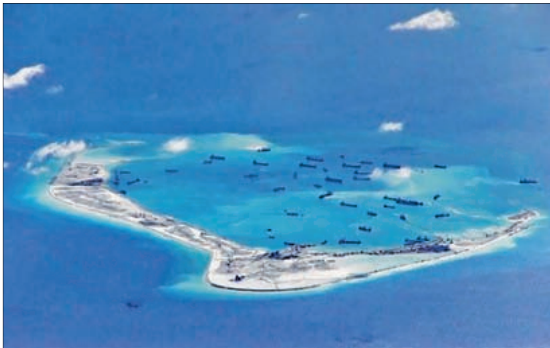
Chinese dredging vessels are purportedly seen in the waters around Mischief Reef in the disputed Spratly Islands in the South China Sea in this still image from video taken by a P-8A Poseidon surveillance aircraft provided by the United States Navy on 21 May, 2015.

THE HAGUE — China expressed anger on Wednesday after a senior British official said a ruling expected within a few months in an international arbitration case the Philippines has brought against China's South China Sea claims must be binding.