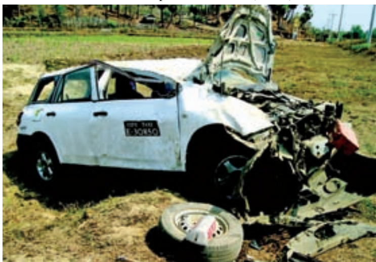
A car being seen damaged after accident.

sengers were all seriously injured in the accident. Four passengers are undergoing medical treatment at Kyauk Chaung Hospital while two passengers were sent to Pathein General Hospital for emergency medical treatment. The police have charged U Thura with reckless driving.— Kyaw Thu Hein (IPRD)