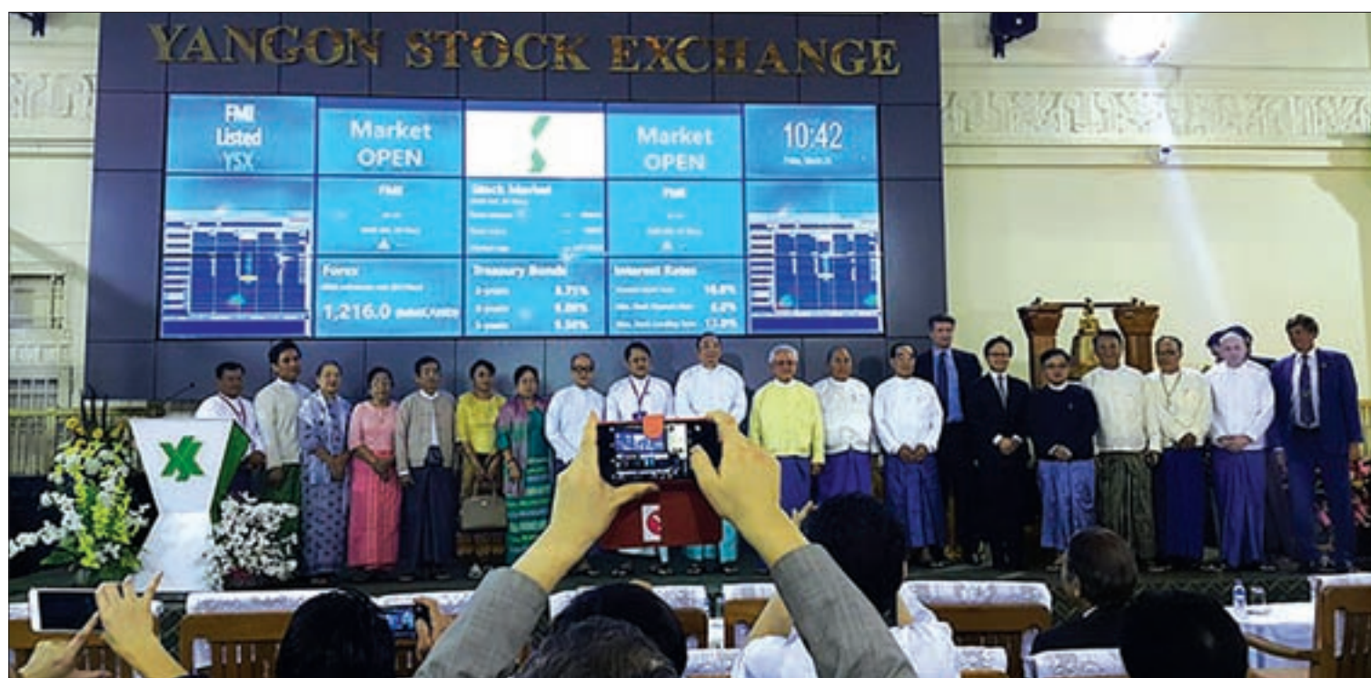
Government officials and business people pose for documentary photos at the opening of the Yangon Stock Exchange in Yangon.

The local real estate sector has declined recently due to the