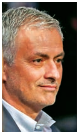
Former Chelsea manager Jose Mourinho.

LONDON — Jose Mourinho's next managerial role has been revealed with the Portuguese leading 'England' against Claudio Ranieri's 'Rest of the World' side as the former Chelsea bosses clash at Old Trafford on 5 June in a charity match for UNICEF.