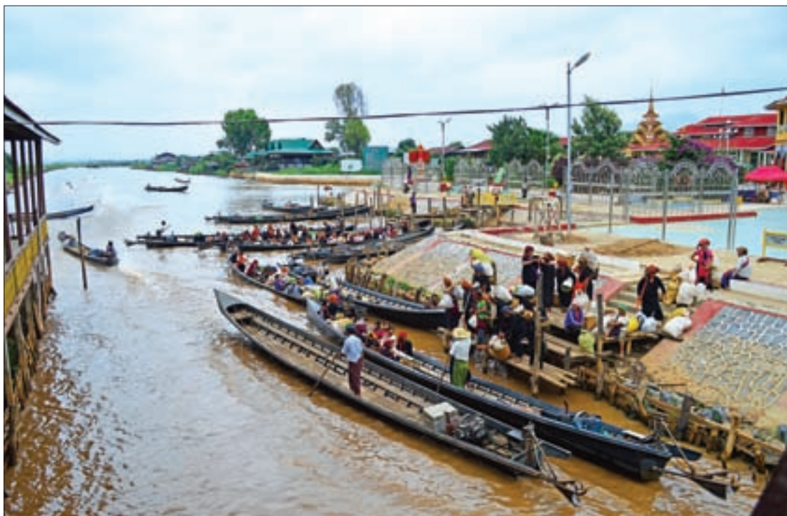
Waterway linking Inle Lake to villages are especially drying up.

Of the 445 households living in Inle Lake, 80 are considered lake dwellers. —200