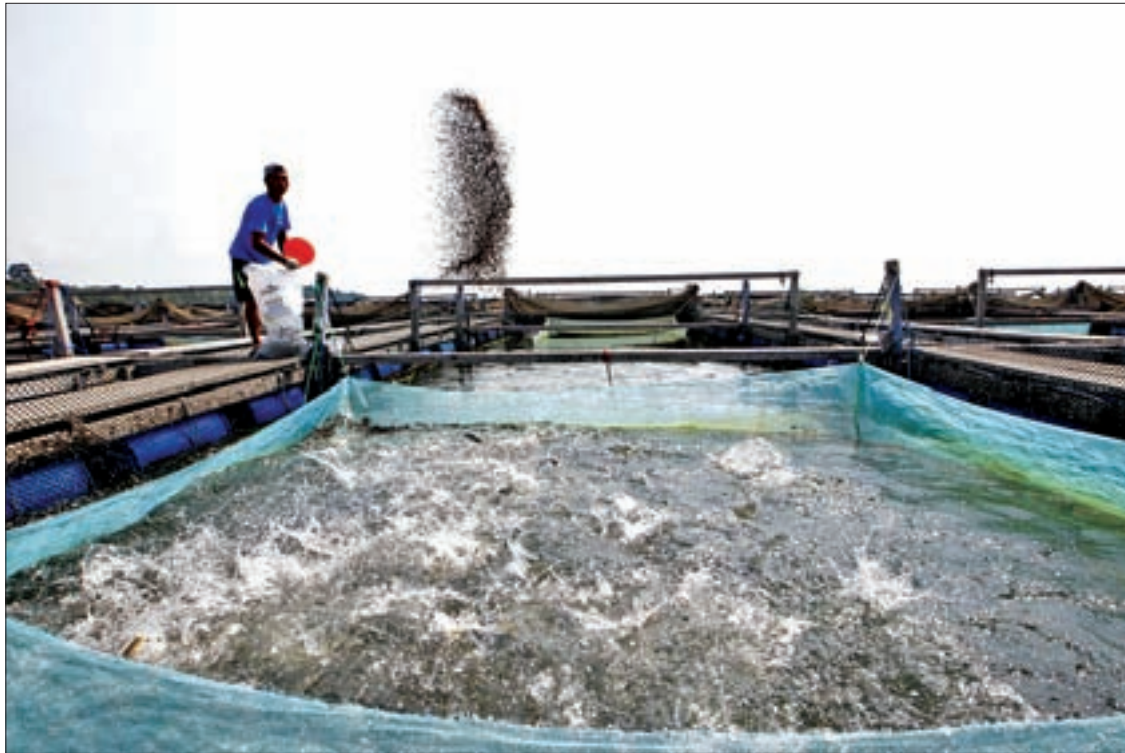
A fish farm worker feeds his stock.

AQUATIC feed will be purchased directly from Viet Nam and resold to local fish and shrimp breeders, according to Myanmar Shrimp Association.