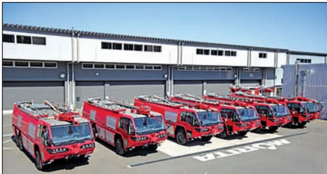
Fire engines being seen.

THE Yangon Region Fire Services Department plans to use K 23 billion (US$22,881,356) to purchase fire facilities the department needs within the 2016-2017 fis-