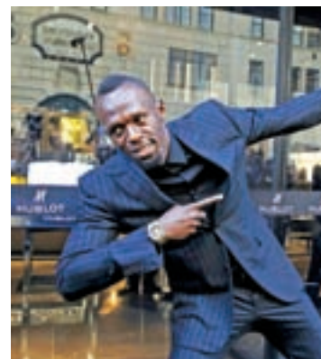
Olympic sprinter Usain Bolt poses during a ribbon cutting ceremony to celebrate the opening of the flagship "Hublot" store on Fifth Avenue in the Manhattan borough of New York, US, on 19 April 2016.

preparations carefully so he can end his Olympic career with a flourish. "I really want to be at my best leading up to the championships. I have two months before (Jamaican) trials and three and a half months before the championships," he said.