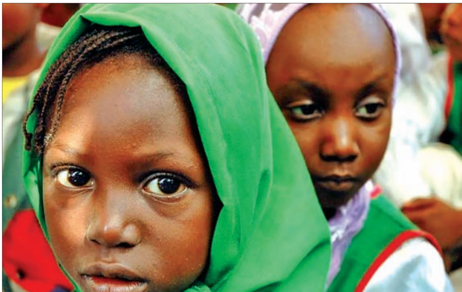
Senegalese AIDS orphans wait for their free "milk and cookie" breakfast provided by Islamic charity Jamra, in the capital Dakar 2005.

UNAIDS said in November that its treatment programme, called 90-90-90, was starting to show results as the nearly 16 million people being treated by June 2015 was double the number in 2010.—Reuters