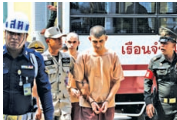
Suspects of last year's Bangkok blast Bilal Mohammed (front) (also known as Adem Karadag) and Yusufu Mieraili are escorted by prison officers as they arrive at the military court in Bangkok, Thailand, on 20 April, 2016.

The two suspects who were arrested — Yusufu Mieraili and Adem Karadag — are Uighur Muslims, a minority