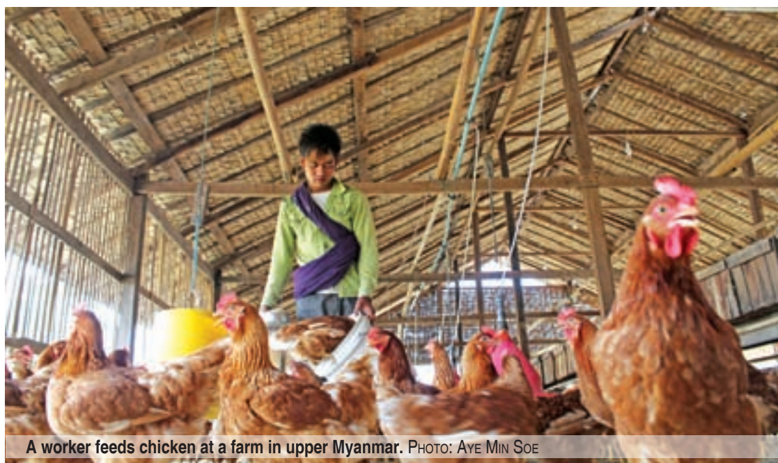
A worker feeds chicken at a farm in upper Myanmar.

The ministry's announcement said that it had been taking measures to control the avian flu outbreak to the infected zone as of