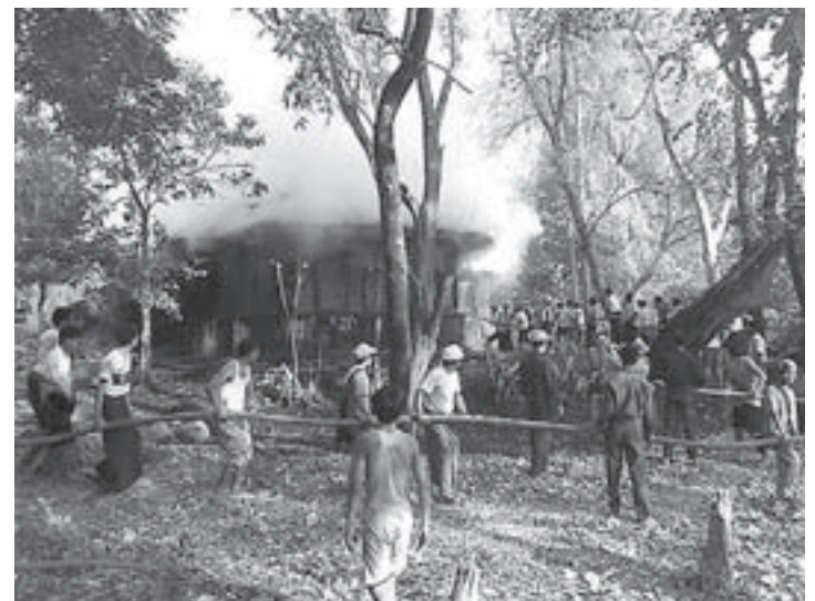
Fire destroys a Yeiktha in Than Daung. PHOTO: 200

The fire quickly got out of control and spread to the resort. The blaze was put out by firemen with the help of local residents within a few minutes of their arrival.— 200