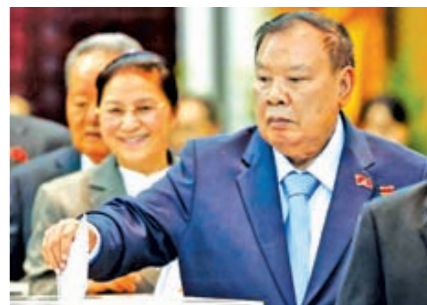
Laos' Vice President Bounnhang Vorachit casts his ballot during the Communist Party Congress in Vientiane on 21 January 2016.

Laos has close political ties to communist Vietnam and mirrors its political system.