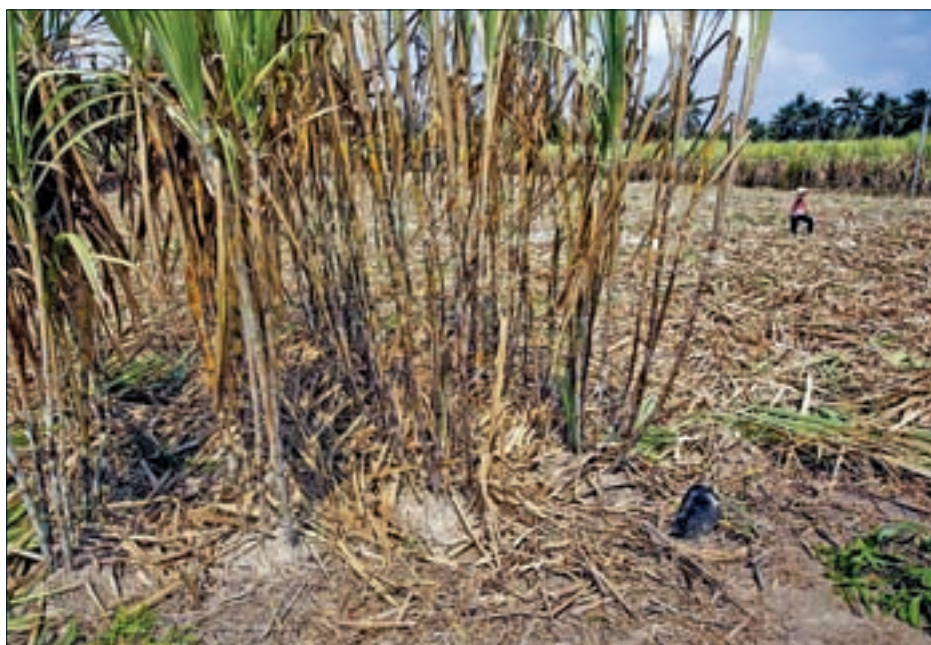
A farmer harvests dried sugarcane on her drought-stricken farm in Soc Trang province in the Mekong Delta, Vietnam March 31, 2016. Picture taken on 31 March.

Low river levels have allowed seawater to penetrate 90 kms (56 miles) inland, ruining vast swathes of cropland in the fertile delta. Viet Nam says the salt