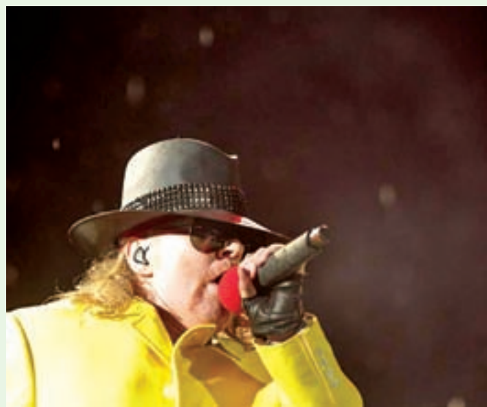
Axl Rose of Guns N' Roses performs at the Rock in Rio Music Festival in Rio de Janeiro in 2011.

The statement said Rose would join the band for a European leg of the tour starting on 7 July in Lisbon and that 10 US dates would be announced soon.—Reuters