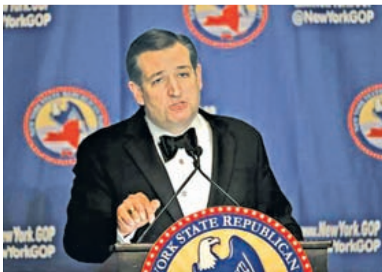
Republican US presidential candidate Ted Cruz speaks at the 2016 New York State Republican Gala in New York City, on 14 April 2016.