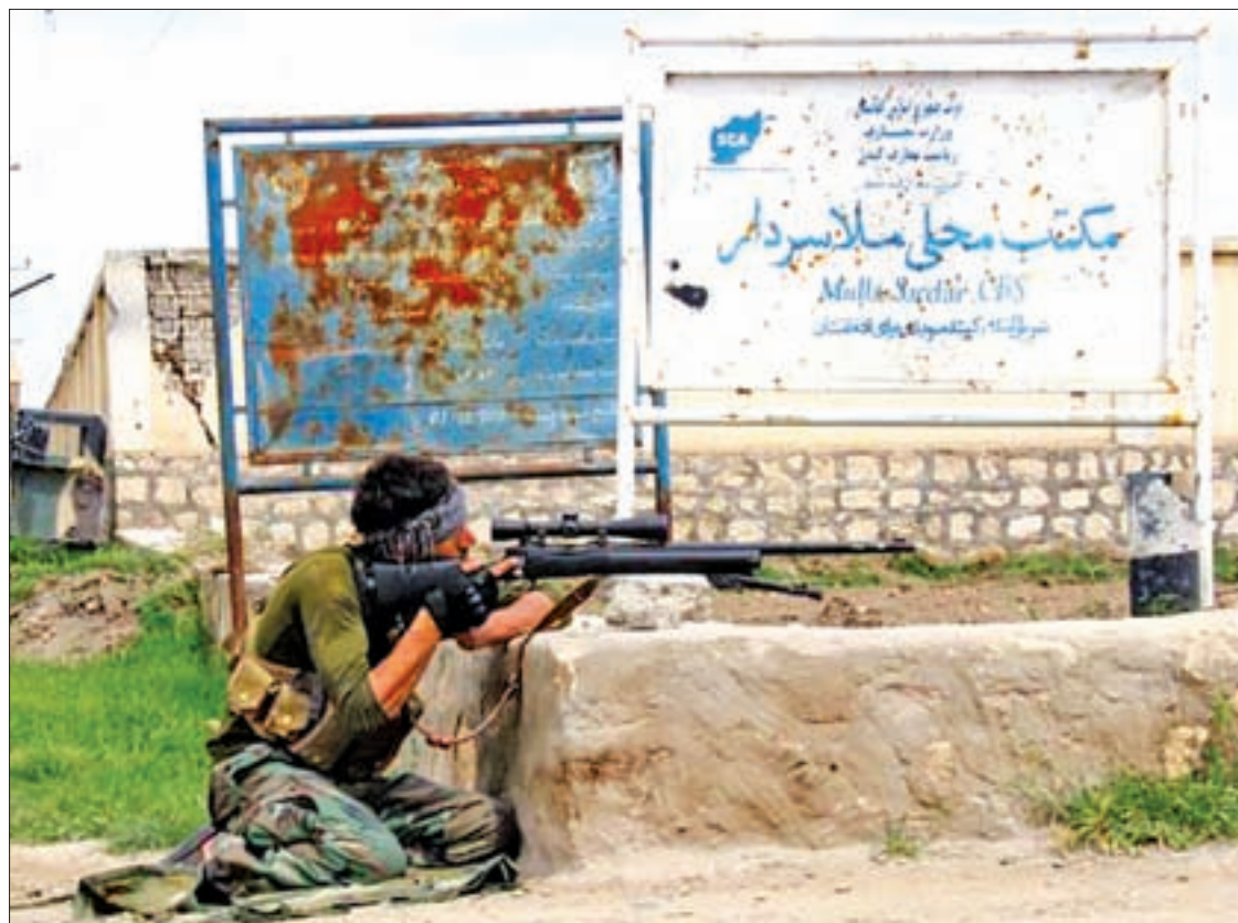
A member of Afghan security force takes his position during a battle with the Taliban on the outskirts of Kunduz Province, Afghanistan, on 16 April, 2016.

In addition, he said a major attack was driven back at Charkh