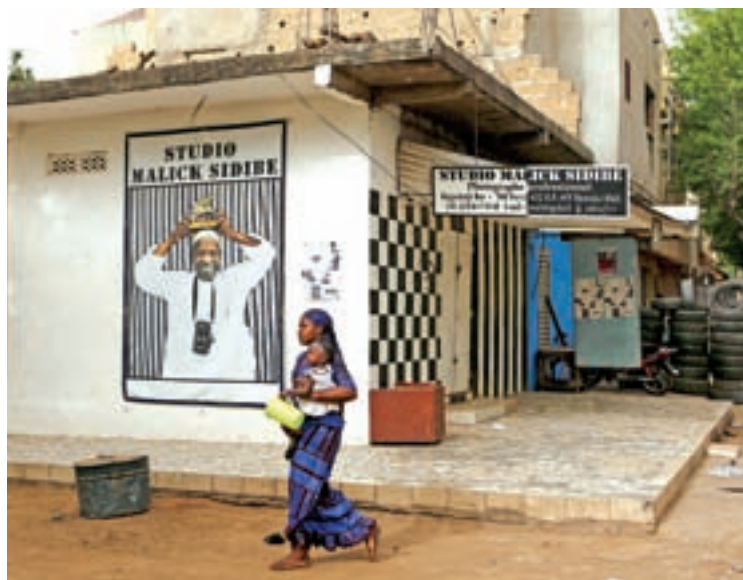
A woman holds her child while walking past the studio of the late, celebrated photographer Malick Sidibe in Bamako, Mali, on 15 April 2016.

In 2007, he became both the first photographer and the first African to win the Venice Biennale's lifetime achievement award. He was also honoured with a Hasselblad Award, a lifetime achievement award from the International Centre of Photography and a World Press Photo prize. —Reuters