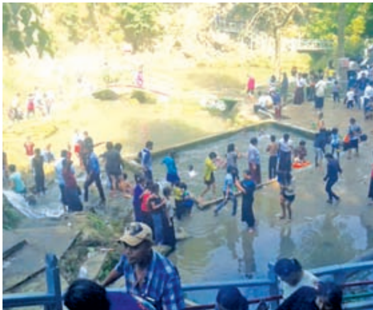
Revelers seen at the Pwe Gauk Waterfall in PyinOoLwin. PHOTO:624

PWE GAUK Waterfall received more visitors during the Thingyan Water Festival than all other sites in Pyin Oo Lwin, a scenic hill town in Mandalay Region, locals say.