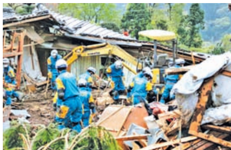
Rescue workers search for survivors in the rubble of a house in the village of Minamiaso, Kumamoto Prefecture, in southwestern Japan, on 17 April, collapsed by a landslide following a magnitude-7.3 quake that struck the region the day before.

"I ordered (relevant ministries) to ensure supplies of food, medicine and water to those who have been evacuated and spent a worrying night at shelters," Abe told reporters at the prime minister's office.