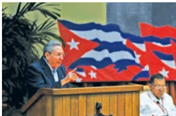
Cuba's President Raul Castro speaks during the opening ceremony of the seventh Cuban Communist Party (PCC) congress in Havana 16 April, 2016. PHOTO: REUTERS

IMF member economies agreed in 2010 to shift 6 per cent of voting rights to developing economies through redistribution of quotas, given the growing clout of these countries in the global economy. Congress approved the reform in December last year. Under the changes, China's expansion of voting rights made it the third-largest fund contributor to the Washington-based lender after the United States and Japan.—Reuters