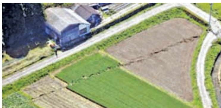
Photo taken from a Kyodo News helicopter on 17 April 2016, shows a fault (from R top to L bottom), that appeared on the surface of the ground in Mashiki, Kumamoto Prefecture, in southwestern Japan, following a magnitude-7.3 quake on 16 April and an M6.5 temblor on 14 April.