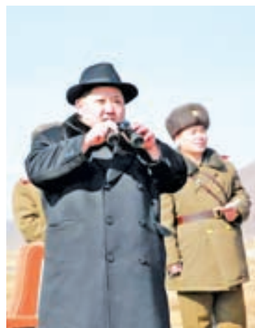
North Korean leader Kim Jong Un inspects a flight drill of fighter pilots from the Korean People's Army's (KPA) Air and Anti-Air Force, in Pyongyang on 21 February 2016.

PYONGYANG — North Korea is likely to conduct its fifth nuclear test in the near future, possibly before its party congress in early May, a media report said on Sunday, citing South Korean government sources based on their reading of activity around the test site.