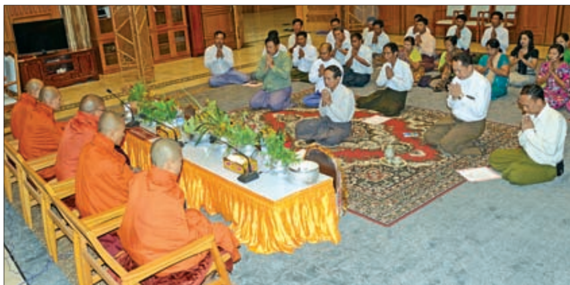
The congregation led by Pyithu Hluttaw Speaker U Win Myint pay respect to the Members of the Sangha as the monks recite Parittas at Pyithu Hluttaw Office.

THE PYITHU HLUTTAW invited members of the Sangha to recite parittas (religious protection verses) at its office in Nay Pyi Taw yesterday evening, the