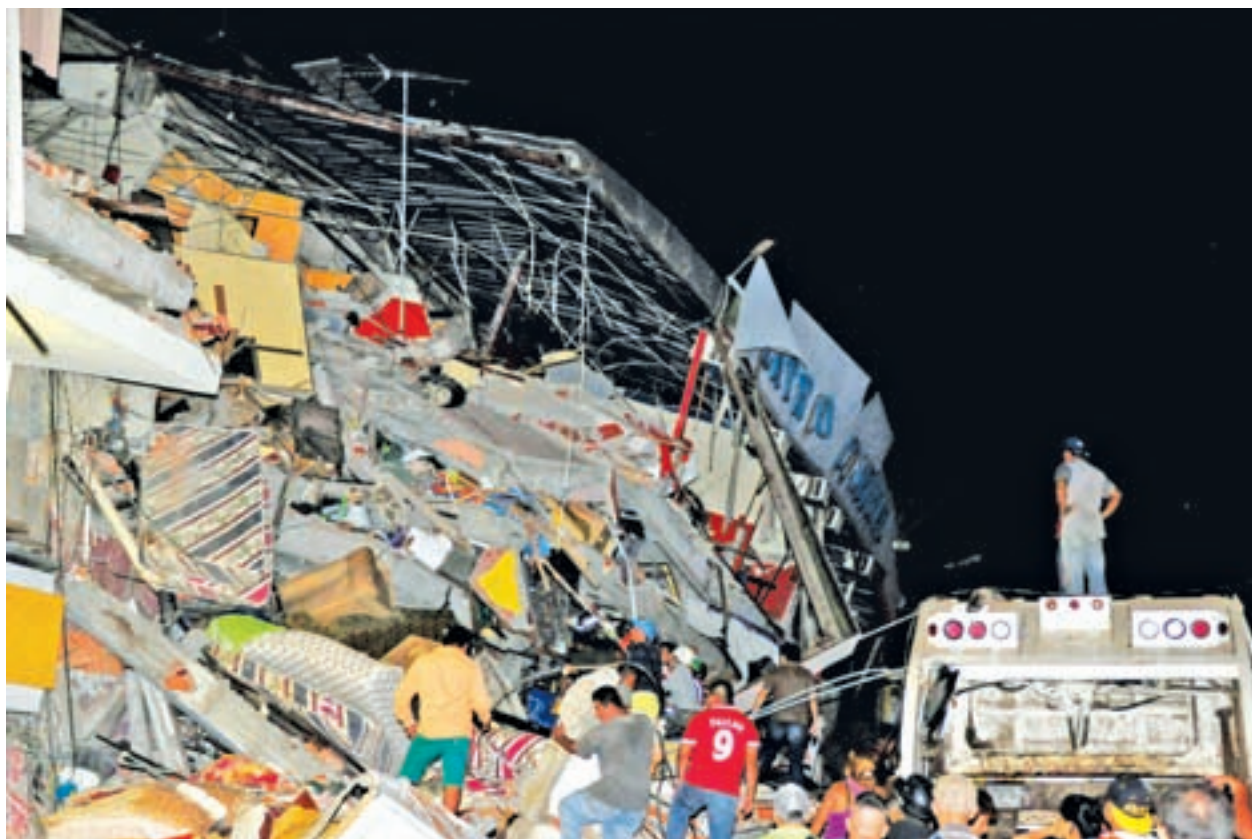
People stand next to the debris of a building after an earthquake struck off the Pacific coast, in Manta, Ecuador, on 16 April 2016.

"Most people are out in the streets with backpacks on, heading for higher ground," he said, speaking in a trembling voice via a WhatsApp phone call. "The streets are cracked. The power is out and