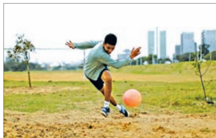
A boy plays soccer in a park in Porto Alegre in 2014.

For the new study the researchers estimated direct cost savings related to these injuries, including visits to healthcare professionals, treatments, surgeries, X-rays, supplies and equip-