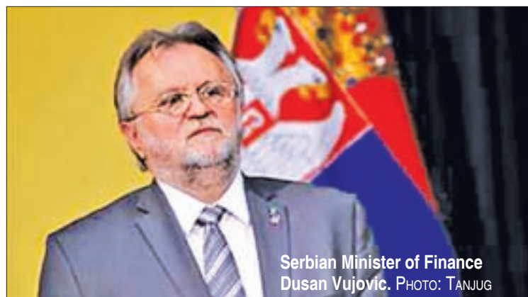
Serbian Minister of Finance Dusan Vujovic.

WASHINGTON — Serbian Minister of Finance Dusan Vujovic said at a roundtable on education in Washington Saturday that reforms in that sector were key to getting other important things moving and was therefore crucial to raise awareness about it.