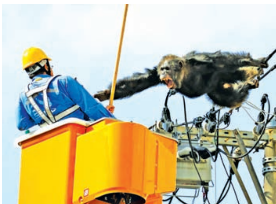
Male chimpanzee Chacha screams after escaping from nearby Yagiyama Zoological Park as a man tries to capture him on the power lines at a residential area in Sendai, northern Japan, in this photo taken by Kyodo, on 14 April, 2016. PHOTO: KYODO NEWS

Chacha has since made a full recovery, local media reported.—Kyodo News