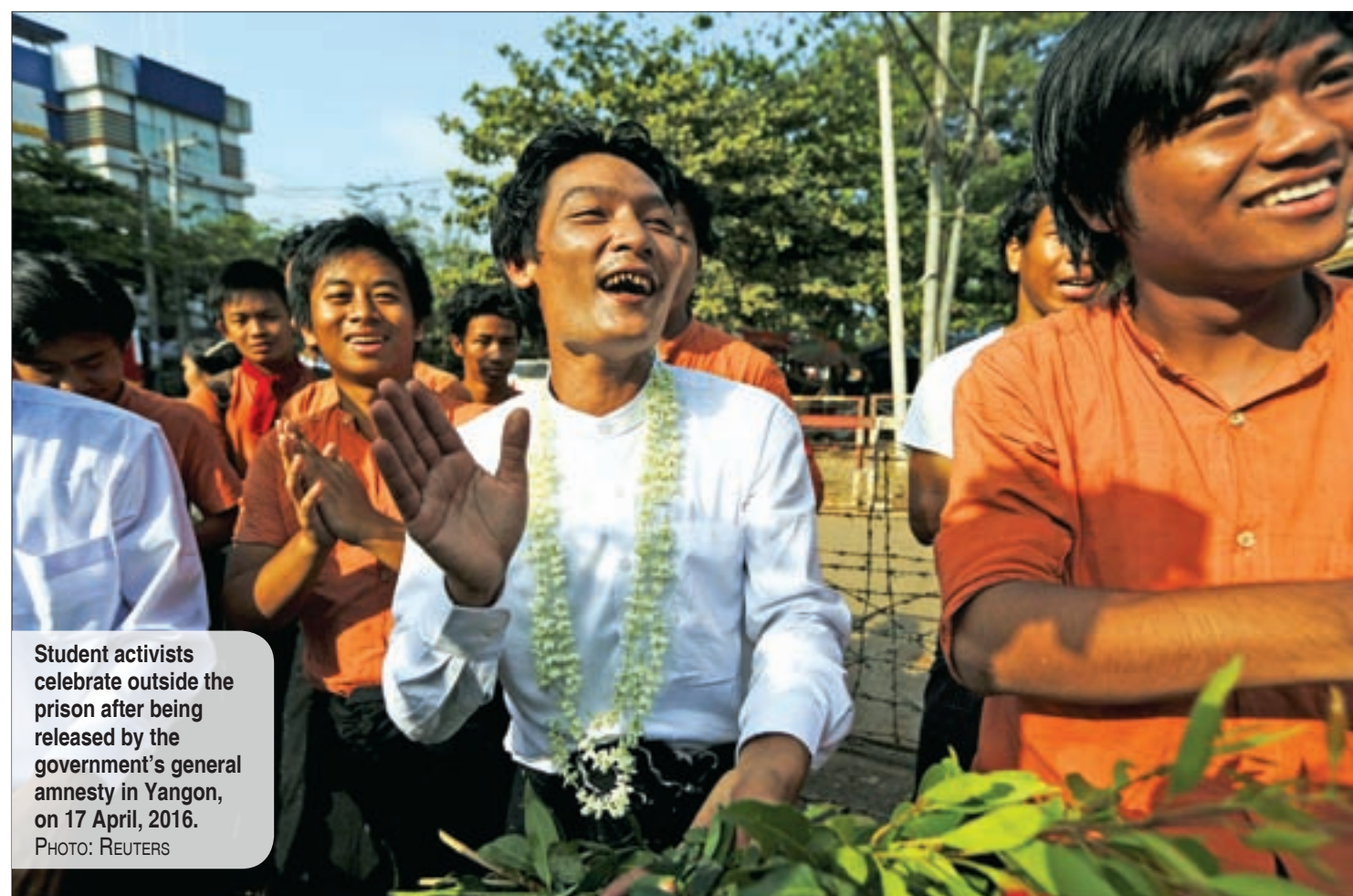
Student activists celebrate outside the prison after being released by the government's general amnesty in Yangon, on 17 April, 2016.