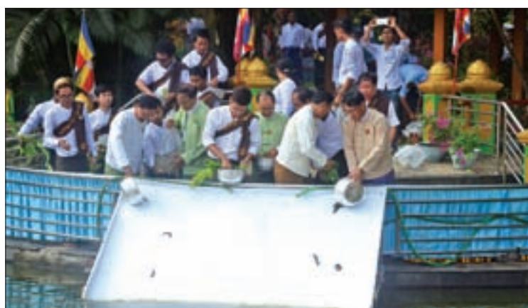
Devotees release fingerlings into a lake in Yangon.

At the Maha Wizaya Pagoda at the foot of Shwedagon Pagoda,