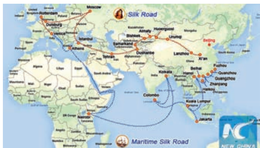
Picture shows the Silk Road Economic Belt and the 21 st Century Maritime Silk Road, collectively known as the Belt and Road initiative.

Flake said there are worries about Chinese investment in some countries. But when looking back at history, people see the simi-