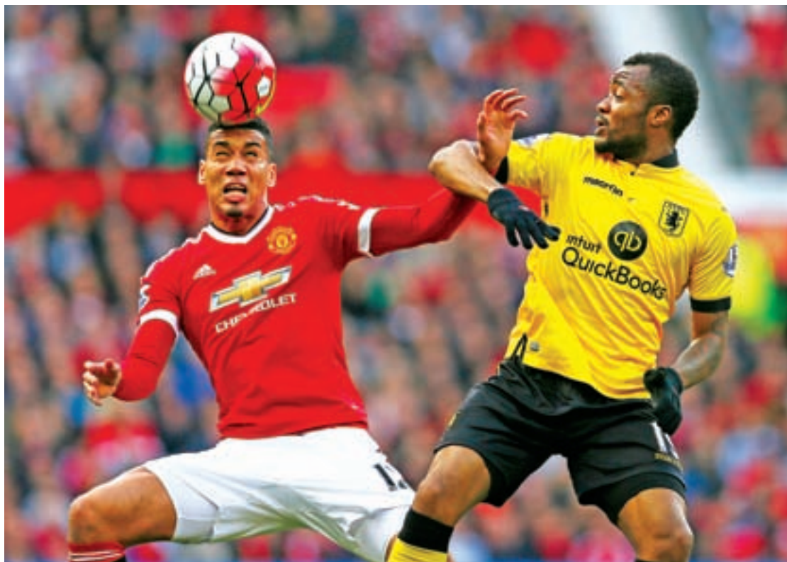
Manchester United's Chris Smalling in action with Aston Villa's Jordan Ayew during Barclays Premier League at Old Trafford on 16 April 2016.

on 31 points, nervously looking over their shoulders.