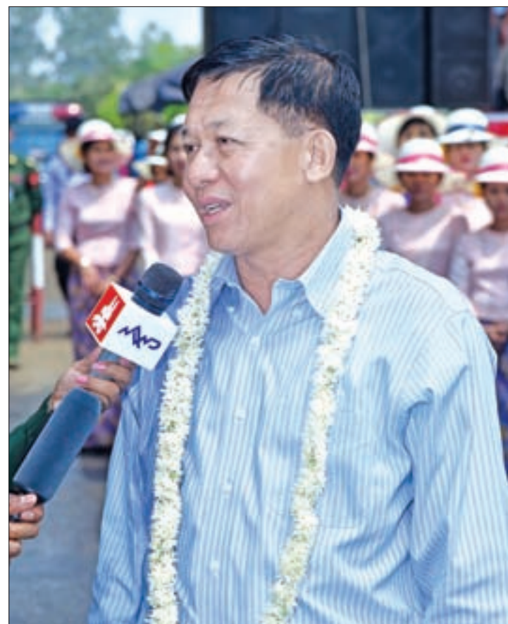
Senior General Min Aung Hlaing.

"We need to maintain the good tradition of unity for national development," the commander-in-chief said, pointing the need to come together to shoulder the responsibility of national development.—Myawady