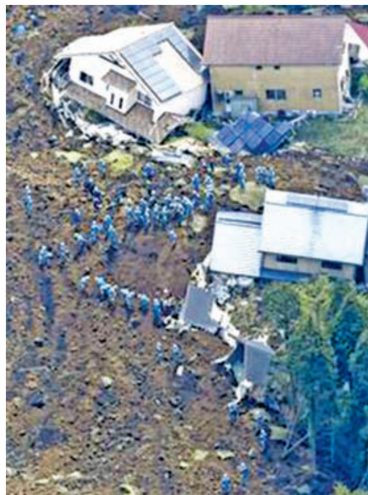
Photo taken from a Kyodo News helicopter on 17 April 2016, shows rescue workers searching for survivors in the village of Minamiaso, Kumamoto Prefecture, in southwestern Japan, in the wake of a massive landslide caused by a magnitude-7.3 quake that struck the area the day before.