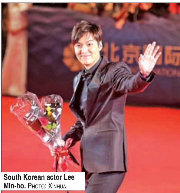
South Korean actor Lee Min-ho.