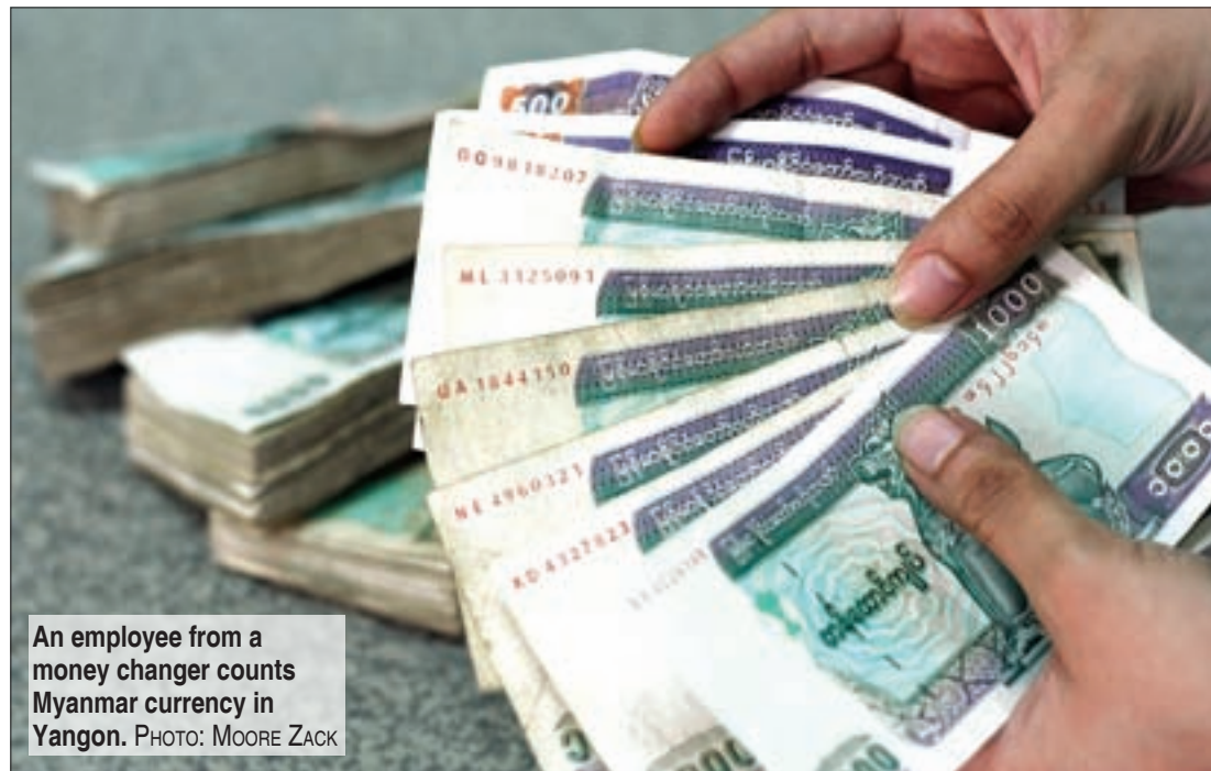
An employee from a money changer counts Myanmar currency in Yangon.