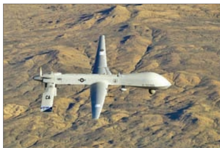
A US Air Force MQ-1 Predator unmanned aerial vehicle assigned to the California Air National Guard's 163rd Reconnaissance Wing flies near the Southern California Logistics Airport in Victorville, California on 7 January 2012 USAF handout photo obtained by Reuters on 6 February 2013.