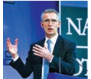
NATO Secretary General Jens Stoltenberg holds a news conference during a NATO defence ministers meeting at the Alliance's headquarters in Brussels, Belgium on 10 February 2016.

Council will discuss the crisis in and around Ukraine and the need to fully implement the Minsk agreements,” NATO said in a statement, referring to the two rounds of peace efforts agreed in the Belarusian capital but which have yet to be implemented.