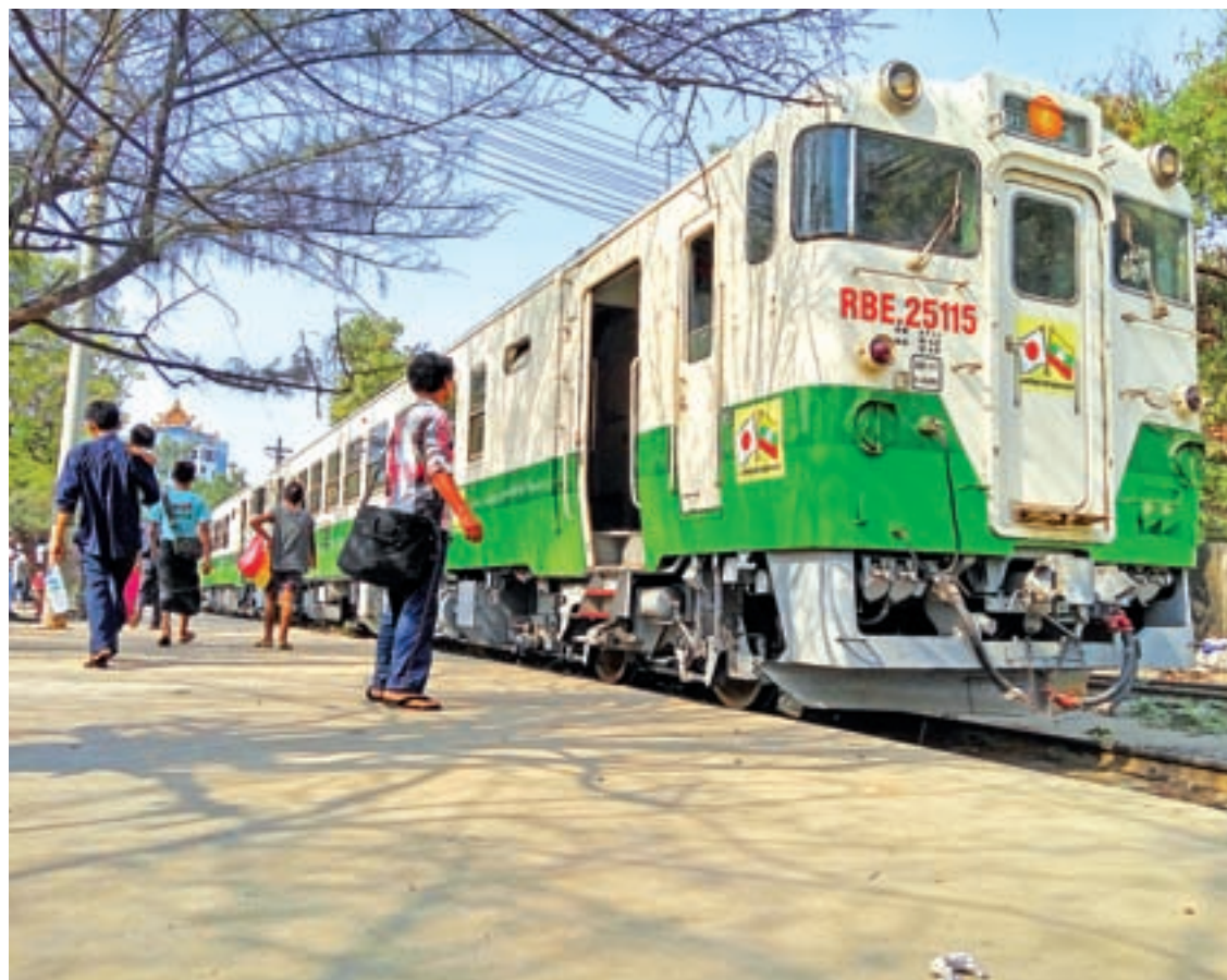
The RBE train is seen in Mandalay Railways Station.