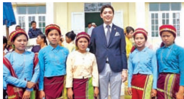
A diplomat seen together with local ethnic women in Lay Eain Su Village in Ngaphe Township at health centre handing over ceremony.

The Government of Japan has assisted 774 various grassroots projects in Myanmar under the GGP scheme since 1993: the number consisting of 367 education projects, 195 healthcare projects, 138 public welfare and environment projects, 38 infrastructure projects and 35 other projects.—GNLM