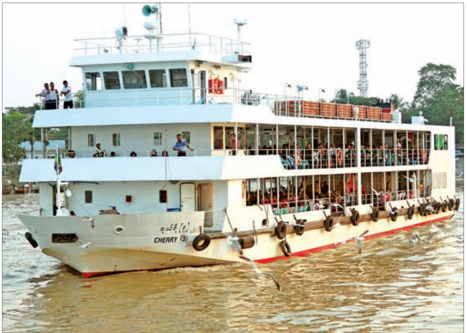
A ferry called “Cherry (3)” shuttles in the Yangon River.

The number of navigable transportation service routes operated by IWT has been decreasing as the ministry's decades-old ships experience delays and higher running costs and cannot compete with modern ships run by private entrepreneurs, according to the ministry.