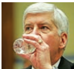
Michigan Governor Rick Snyder drinks some water as he testifies before a House Oversight and government Reform hearing on “Examining Federal Administration of the Safe Drinking Water Act in Flint, Michigan, Part III” on Capitol Hill in Washington on 17 March.

He said local and state officials need to have a simple message for residents in the city of 100,000 people to take that approach.