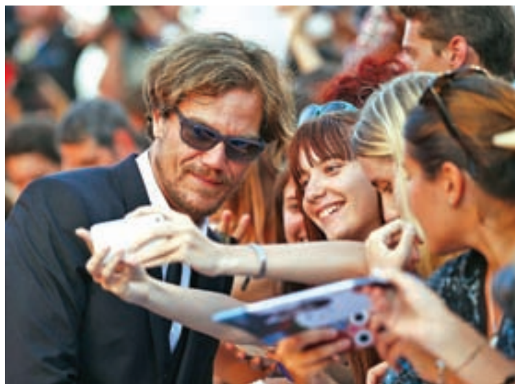
Michael Shannon himself poses with a fan.

LONDON — Actor Michael Shannon says the Oscars are just like the world’s most exclusive prom now.