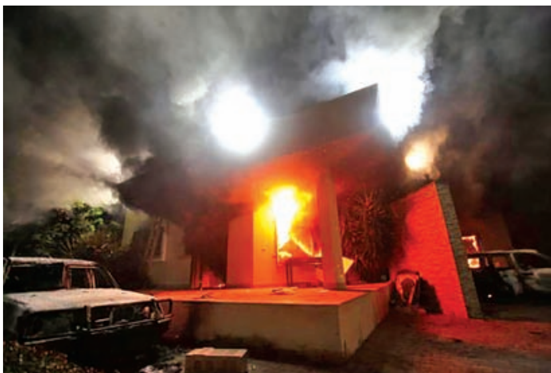
The US Consulate in Benghazi is seen in flames during a protest by an armed group said to have been protesting a film being produced in the United States in September 2012.

Sisi went on to become elected president on promises of stability but cracks are beginning to appear in what was once the cult-like adulation he enjoyed among many Egyptians, with TV talk show hosts increasingly critical of government officials.— Reuters