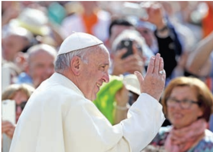
Pope Francis arrives to lead the weekly audience in Saint Peter's Square at the Vatican on 6 April, 2016.

Under current Church teaching they cannot receive communion unless they abstain from sex with