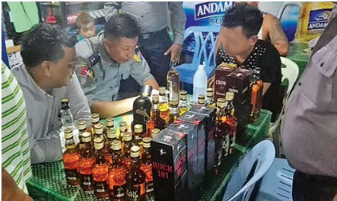
Officials inspecting a restaurant.

Moreover, officials of the police force met with grocers and gave an education talk on avoiding the crime and urged them not to sell unlicensed alcoholic beverages.— Kyaw Soe (Kawthaung—IPRD)