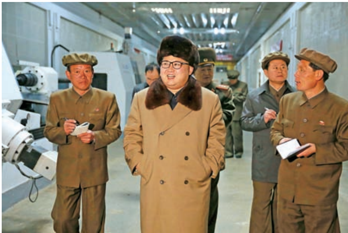
North Korean leader Kim Jong Un gives field guidance during a visit to the Tonghungsan Machine Plant under the Ryongsong Machine Complex in this undated photo released by North Korea’s Korean Central News Agency (KCNA), on 2 April.