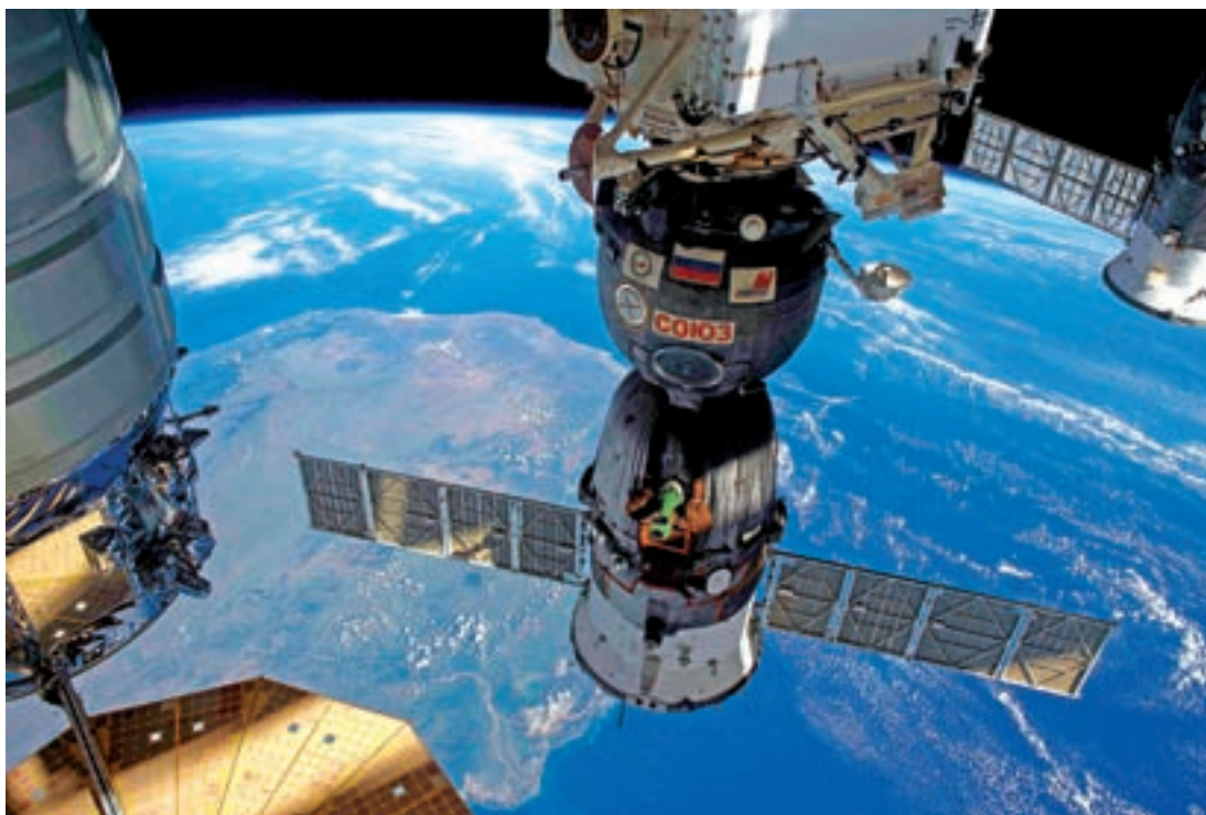
A NASA image shows the International Space Station as it flew over Madagascar, showing three of the five spacecraft docked to the station in this photo taken by the Expedition 47 Flight Engineer Tim Peake of ESA on 6 April 2016 and released on 8 April 2016.