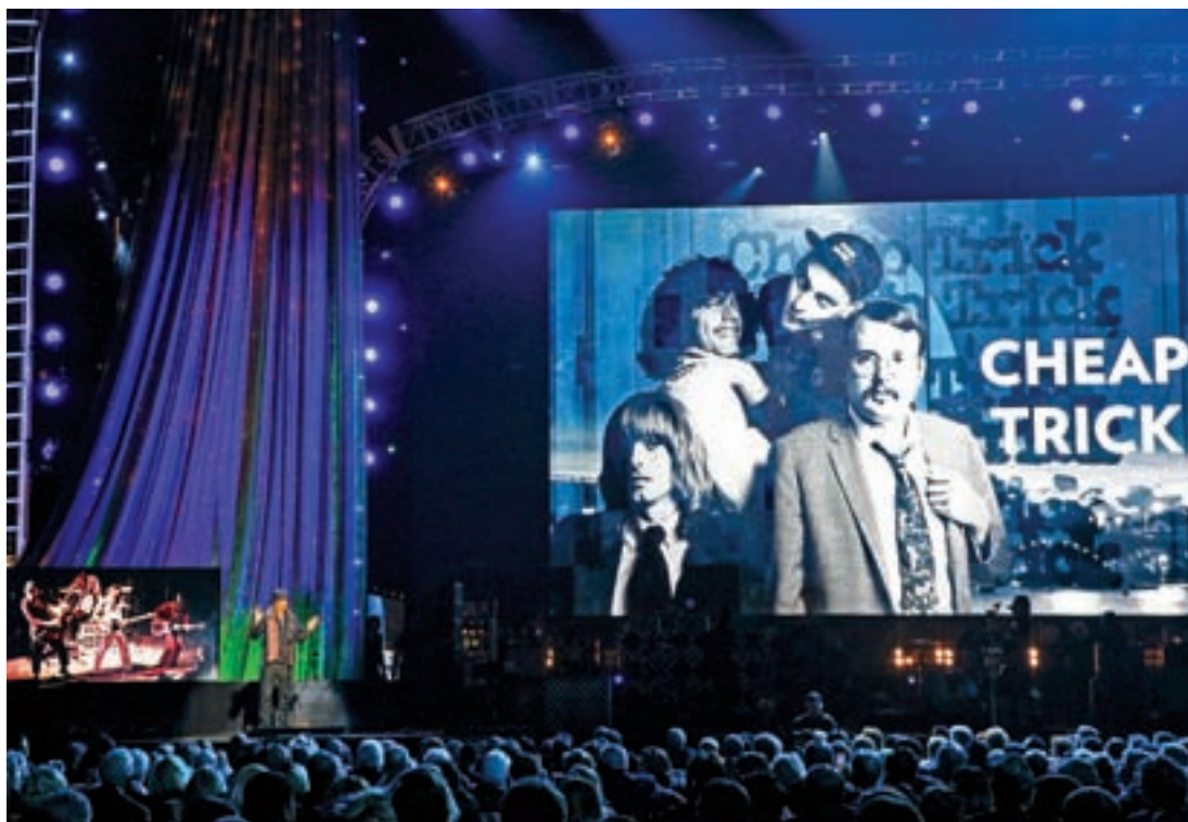
Kid Rock inducts rock band Cheap Trick at the 31st annual Rock and Roll Hall of Fame Induction Ceremony at the Barclays Centre in Brooklyn, New York, on 8 April.

“My great friend Ludacris and I have also shared songs together on the Billboard chart. I look forward to sharing the stage with him on this special night. It will definitely be a night to remember!” Ciara added.— PTI