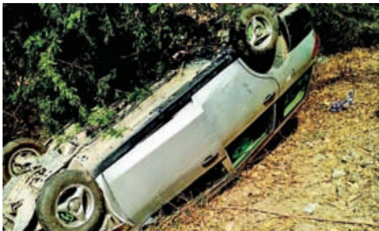
AD van overturning on Mandalay- Myinmu-Monywa road.