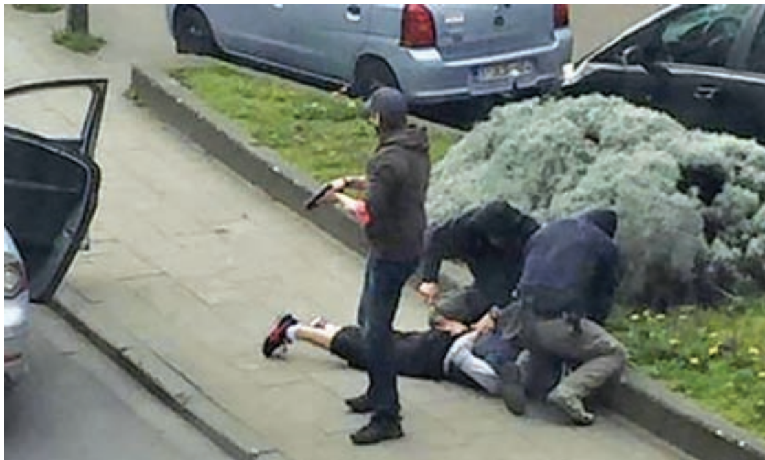
Police officers detain a suspect during a raid in which fugitive Mohamed Abrini was arrested in Anderlecht, near Brussels, Belgium, on 8 April.

BRUSSELS — Belgian police detained two key suspects on Friday in the Islamic State attacks on Paris and Brussels as operations go on to track down militants who have fought with or take direction from leaders in Syria.