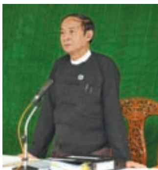
Pyithu Hluttaw Speaker U Win Myint.

He also urged the MPs to digest the constitution and learn it hard as well as parliamentary laws, rules and regulations and financial procedures. He called on all members to strive to perform their duties diligently and to use their rights correctly in order to bring success to future work.—Myanmar News Agency