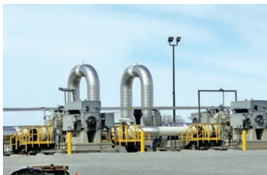
A TransCanada Keystone Pipeline pump station operates outside Steele City, Nebraska in 2014.

In an e-mailed statement to media on Friday, the company said it identified a small leak near its Freeman pump station in Hutchinson County, South Dakota.