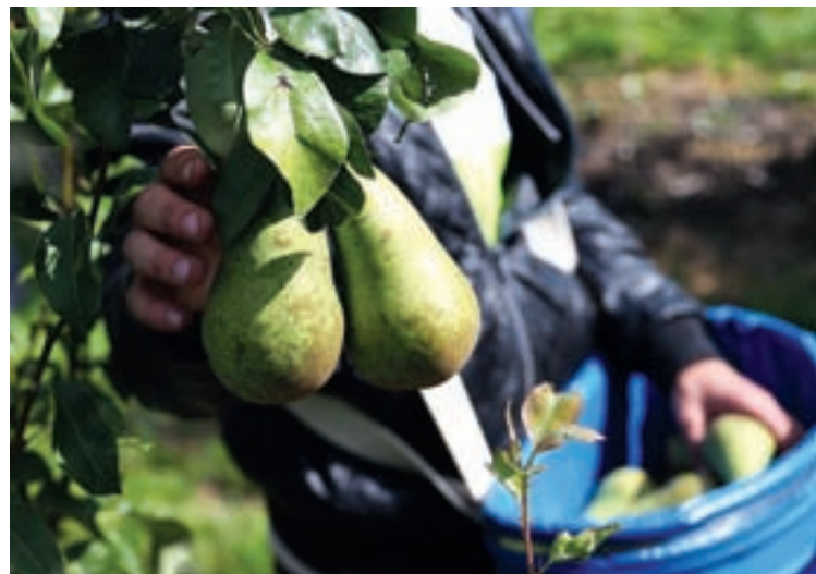
Pears, which are commercially grown in Washington, California, and Oregon, provide vitamin C and necessary fiber all for a mere 100 calories.

One medium pear provides 24 per cent of daily fibre needs, researchers said. They are sodium-free, cholesterol-free, fat-free, and contain 190 mg of potassium.— PTI