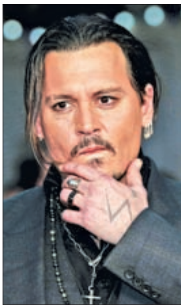
Actor Johnny Depp.

Depp, 52, wants to make Beetlejuice similar to his Guy Lapointe character that he's played for Kevin Smith in both Tusk and Yoga Hosers, while adding a cockney accent.—PTI