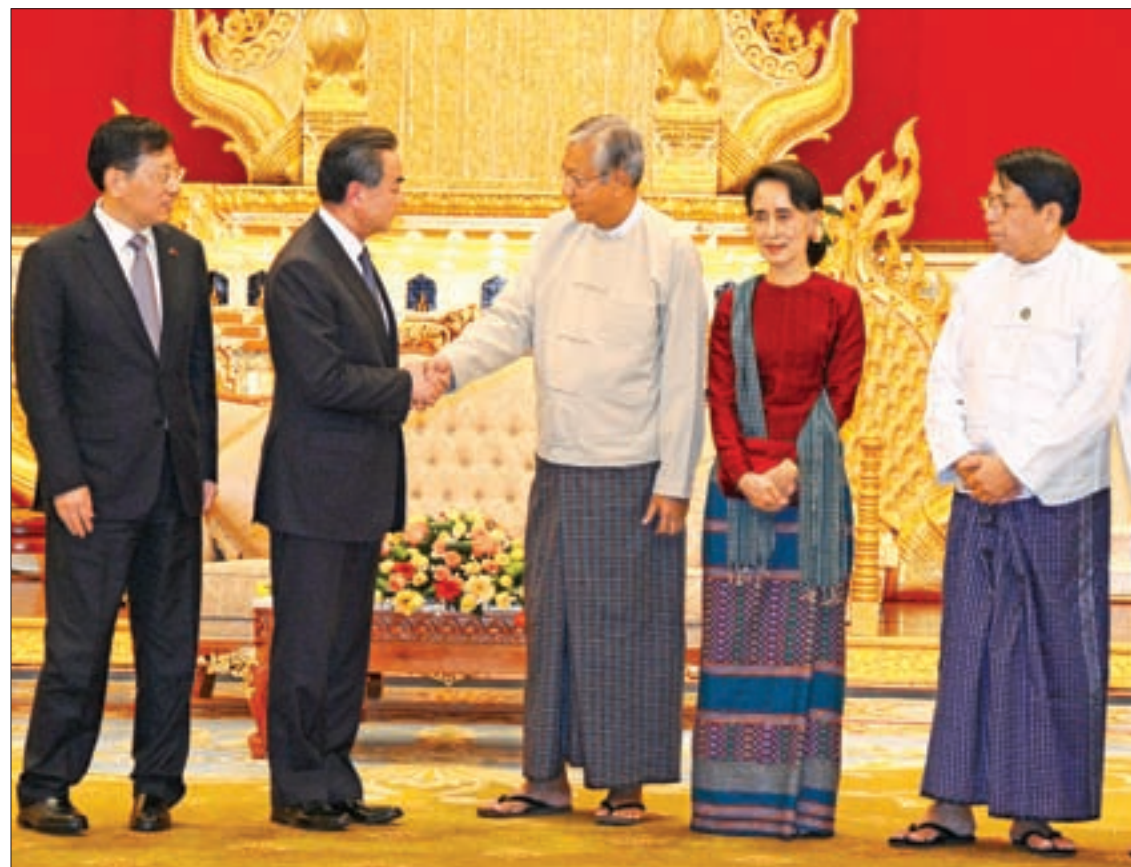
President U Htin Kyaw welcomes Chinese Foreign Minister Mr Wang Yi.