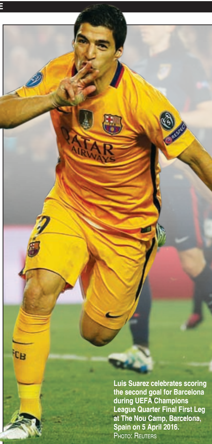
Luis Suarez celebrates scoring the second goal for Barcelona during UEFA Champions League Quarter Final First Leg at The Nou Camp, Barcelona, Spain on 5 April 2016.

He was sent off in an FA Cup tie against Blackburn Rovers in February for denying a clear goal-scoring opportunity, a decision that was also subsequently overturned.—Reuters