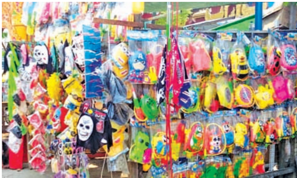
Thingyan products are waiting for the buyers.

THE sale of water-throwing materials and Thingyan-related goods have met with luke warm sales at the Mandalay Zaycho market this year as Thingyan Festival grows near.