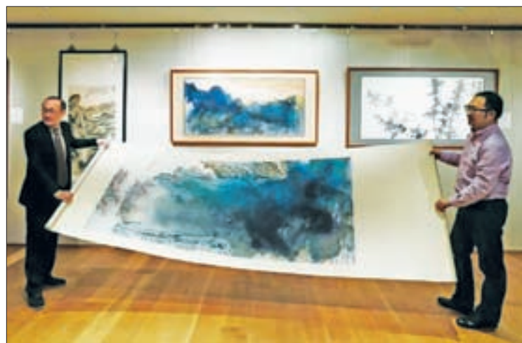
An inkbrush painting by late Chinese artist Zhang Daqian called "Peach Blossom Spring" is rolled during a preview at Sotheby's in Hong Kong, China, on 10 March 2016.

Ching said the market was showing signs of recovery.