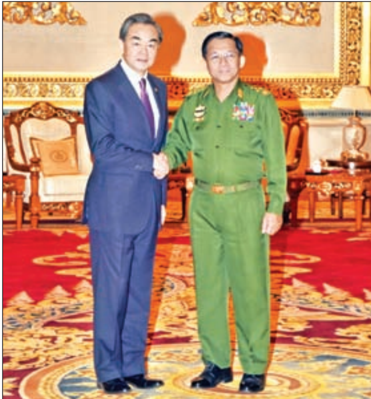
Senior General Min Aung Hlaing shakes hands with Chinese Foreign Minister Mr. Wang Yi.

COMMANDER-in-Chief of Defense Services Senior General Min Aung Hlaing met Chinese Foreign Minister Mr. Wang Yi at Zeyarthiri Beikman in Nay Pyi Taw yesterday.