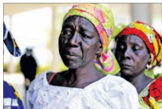
Parents of the Chibok girls weep during their meeting with President Muhammadu Buhari at the presidential villa in Abuja, Nigeria, on 14 January 2016.

hoping the event would again garner attention for the girls who have not been seen since the night of their abduction despite calls to find them from celebrities and politicians including US first lady Michelle Obama.