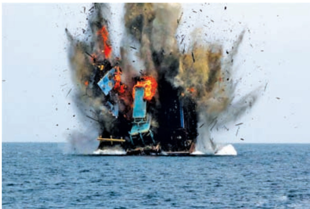
Flame and smoke are seen from destroyed Malaysian vessels off the coast of Kuala Langsa in Aceh, Indonesia, on 5 April 2016. Indonesian authorities sank 23 foreign fishing boats on Tuesday, saying they were "operating illegally in the archipelago's vast waters in continuation efforts for anti-poaching."