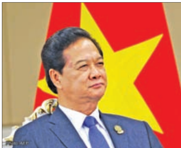
Vietnamese Prime Minister Nguyen Tan Dung.

HANOI — Vietnamese Prime Minister Nguyen Tan Dung was relieved from duty on Wednesday afternoon at the ongoing 11 th session of the 13 th National Assembly (NA) of Vietnam in capital Hanoi.