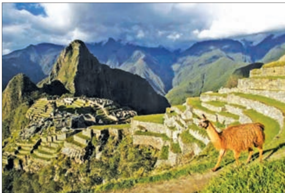
A llama is seen near the Inca citadel of Machu Picchu in Cusco, Peru, in 2014.

Other sites under threat include the Everglades in the United States, Ecuador's Galapagos islands or Russia's Kamchatka volcanoes, it said. Of those, only