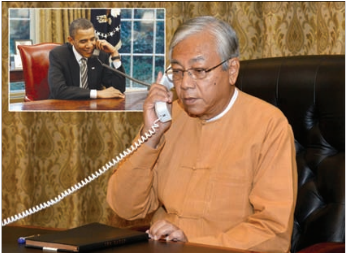
President U Htin Kyaw talks to US President Mr Obama over the phone.

He said: "I'm confident President [Obama] and the United States will continue to provide assistance to us. We want US investment in Myanmar, and we'd like to cooperate in various sectors with USAID. With the support of you and our other friends, I believe Myanmar will achieve its goals soon."— Myanmar News Agency