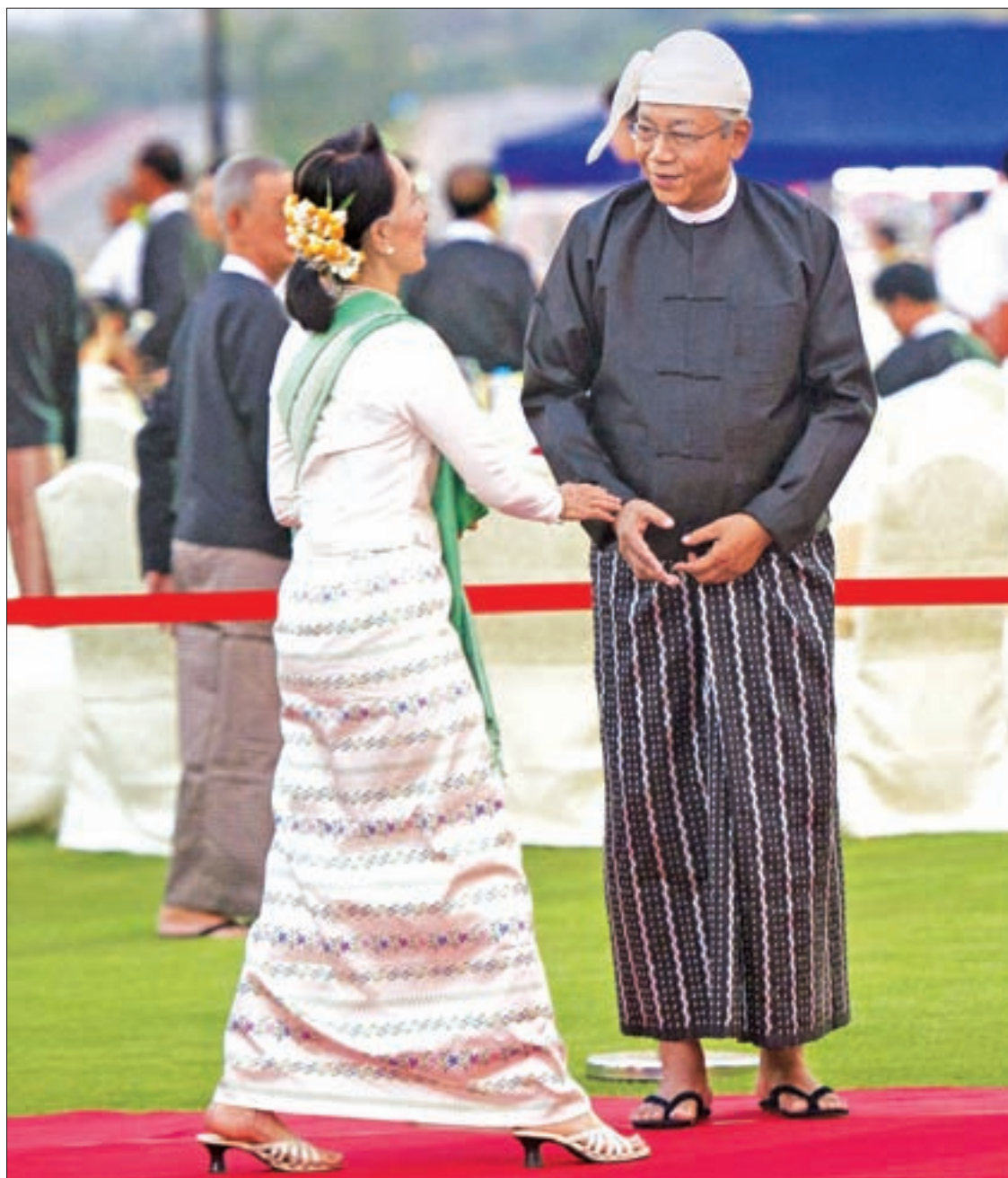
President U Htin Kyaw welcomes Daw Aung San Suu Kyi at the dinner reception on 30 March 2016.

The bill includes five chapters and eight articles. The bill, reviewed by The Global New Light of Myanmar , guarantees Daw Aung San Suu Kyi's right to contact government ministries, departments,