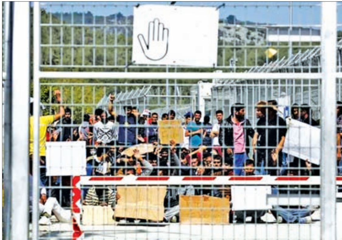
Migrants who will be returned to Turkey demonstrate inside the Moria registration centre on the Greek island of Lesbos, on 5 April, 2016.

ATHENS — Arrivals in Greece of migrants crossing by sea from Turkey fell sharply on Wednesday, three days after an agreement came into force to seal off a route used by hundreds of thousands of people fleeing conflict in the past year.