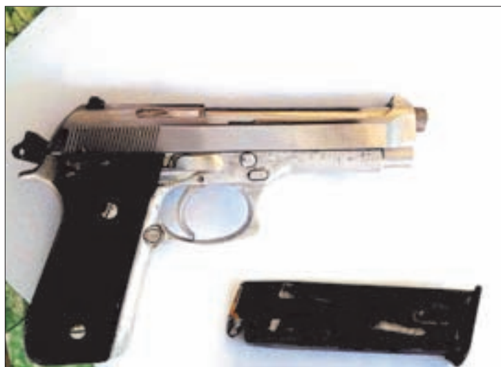
Involuntary shooting of gun injures one

A MAN was seriously injured by an accidental shooting with a pistol on Tuesday in Tachilek. According to an investigation one Maung Shwe showed U Tin Tun a 9mm pistol which he claimed he received in Par Hset ward, Lun Kyine village while Maung Shwe, 22, U Tin Tun, 54, and four other men who were collecting rubbish using a six wheel truck. U Tin Tun was admiring the weapon when he accidentally fired off a round. The single bullet penetrated Maung Shwe’s chest. Maung Shwe was immediately sent to the local hospital and is currently receiving medical treatment. Police from Tachilek have filed charges against U Tin Tun. — Myint Moeh (Tachilek)