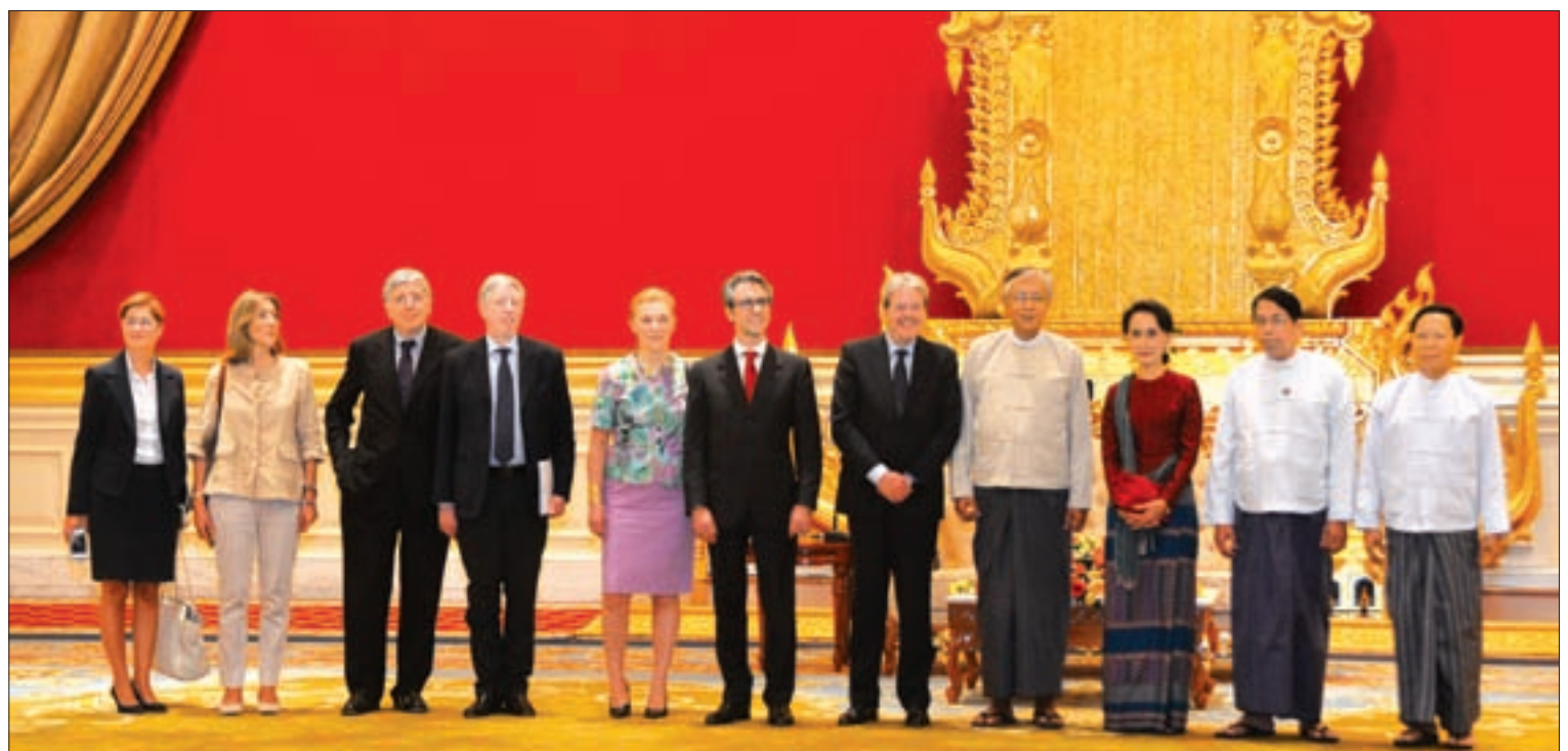
President U Htin Kyaw and Italy's Foreign Minister Mr Paolo Gentiloni Silveri pose for documentary photos.