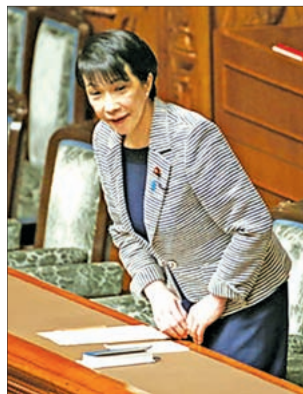
Japanese Internal Affairs and Communications Minister Sanae Takaichi bows during a House of Councillors plenary session in Tokyo on 6 April 2016, after the upper house enacted a law that allows voters to cast their ballots for national and local elections at polling stations to be set up at train stations and commercial complexes such as shopping malls. The legislation is expected to take effect 19 June meaning that it will apply to the upper house election in the summer.

In some municipalities, people can already cast votes before an elec-