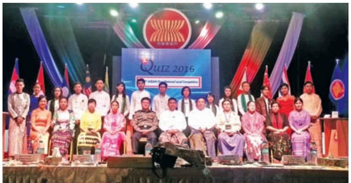
Winners of 7 th ASEAN Quiz national contest pose for group photo.

THE seventh ASEAN Quiz national competition was held at MRTV under the Ministry of Information in Yangon yesterday.