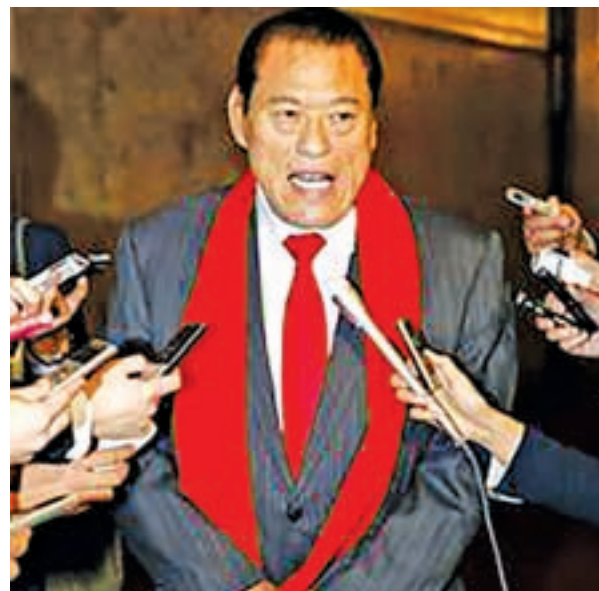
Professional wrestler-turned-lawmaker Antonio Inoki tells reporters in Tokyo on 6 April, 2016 that he will forgo his planned visit to North Korea after a senior Diet member asked him to refrain from traveling to the reclusive country.

TOKYO — Professional wrestler-turned-lawmaker Antonio Inoki told reporters Wednesday he will forgo his planned four-day visit to North Korea after a senior Diet member asked him to refrain from traveling to the reclusive country.