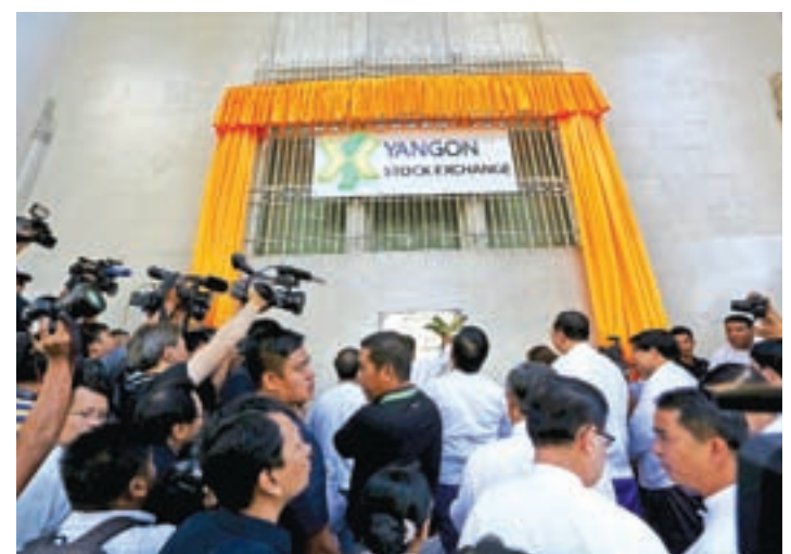
Yangon Stock Exchange center opened by government officials in Yangon, on 9 December 2015.

Share trading at the stock market takes place two at 11am and 1pm every weekday.