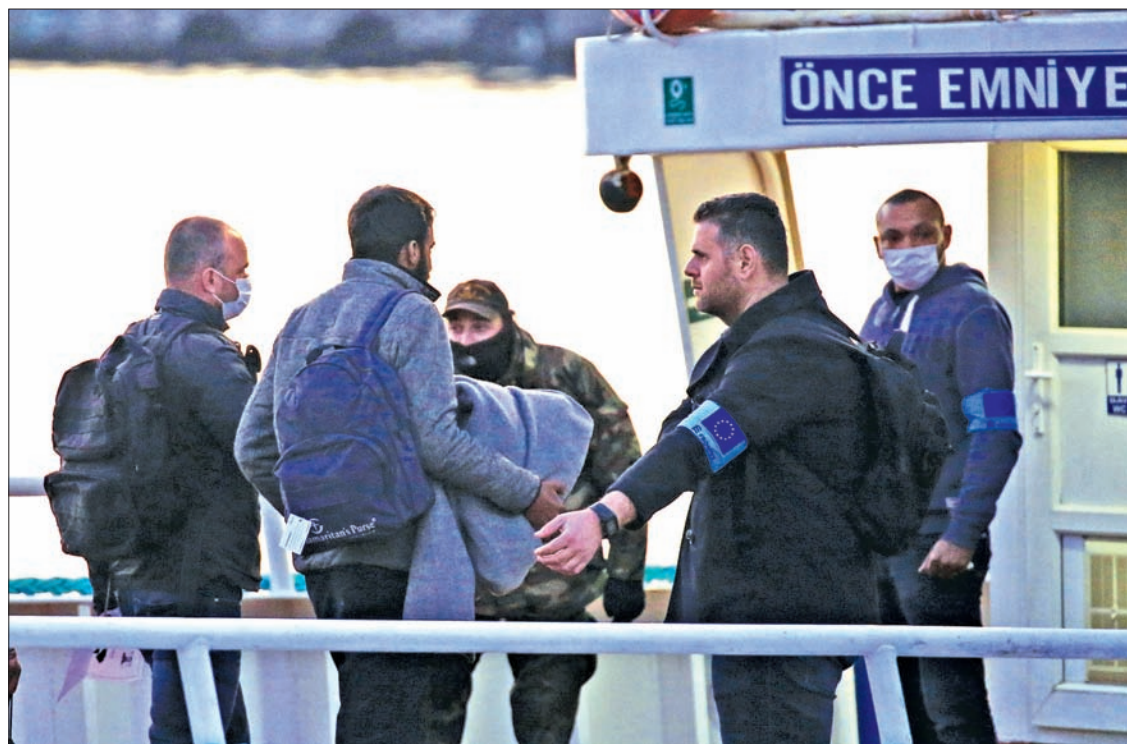
Frontex officers (R) guide migrants boarding a Turkish-flagged passenger boat to be returned to Turkey, on the Greek island of Lesbos, on 4 April.

DIKILI — Migrants sent back from the Greek island of Lesbos began arriving in Turkey on Monday under a disputed European Union scheme aimed at closing the main route by which a million people poured across the Aegean Sea to Greece in the last year.