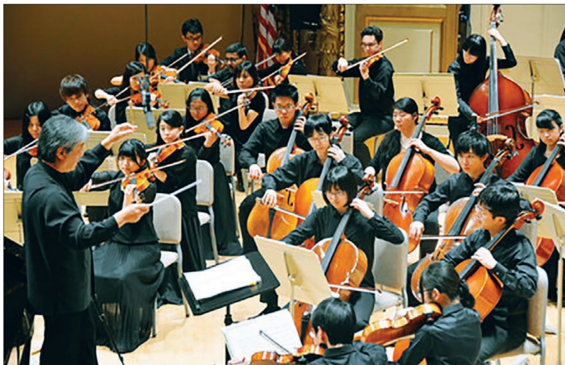
An orchestra composed of teenagers from the northeastern Japanese prefecture of Fukushima, perform during a concert at Boston Symphony Hall in the capital city of Massachusetts on 3 April.

With violins, cellos, contrabasses and more, the young people whose lives were forever changed on 11 March, 2011, constructed the piece as if it was made from layer upon layer of their sadness. "We're playing it so as to bring forth thoughts of the disaster," said 15-year-old vi-