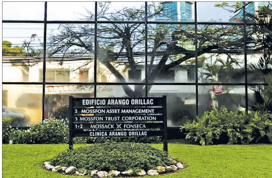
A company list showing the Mossack Fonseca law firm is pictured on a sign at the Arango Orillac Building in Panama City on 3 April.

Kremlin spokesman Dmitry Peskov did not immediately respond to a request for comment from Reuters on Monday.