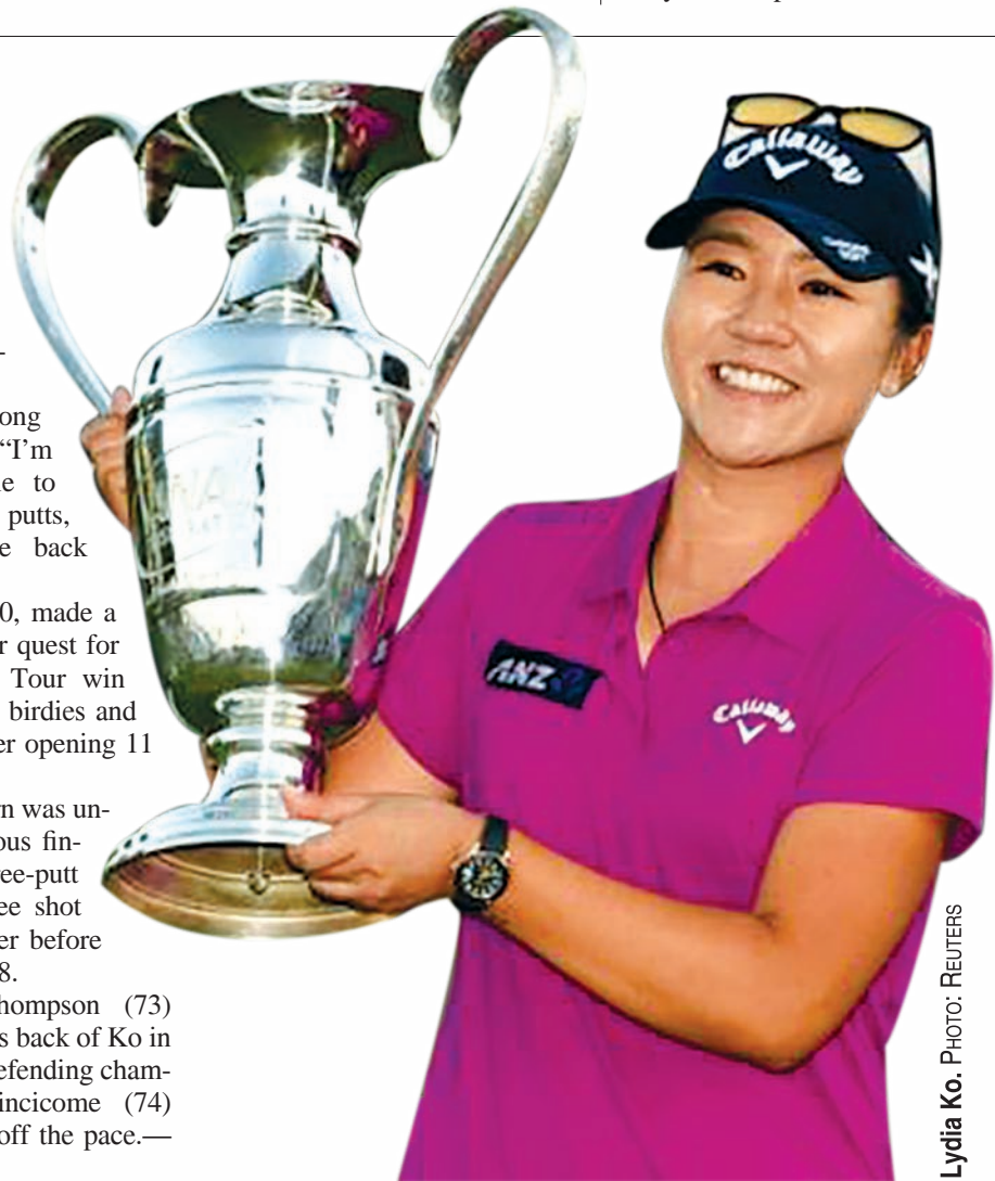
Lydia Ko.

American Thompson (73) finished three shots back of Ko in fifth place while defending champion Brittany Lincicome (74) finished 10 shots off the pace. —Reuters