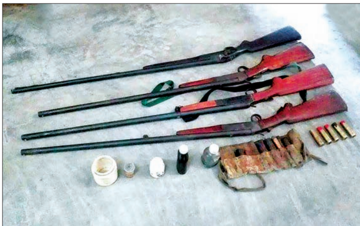
Four arms and ammunition seized.