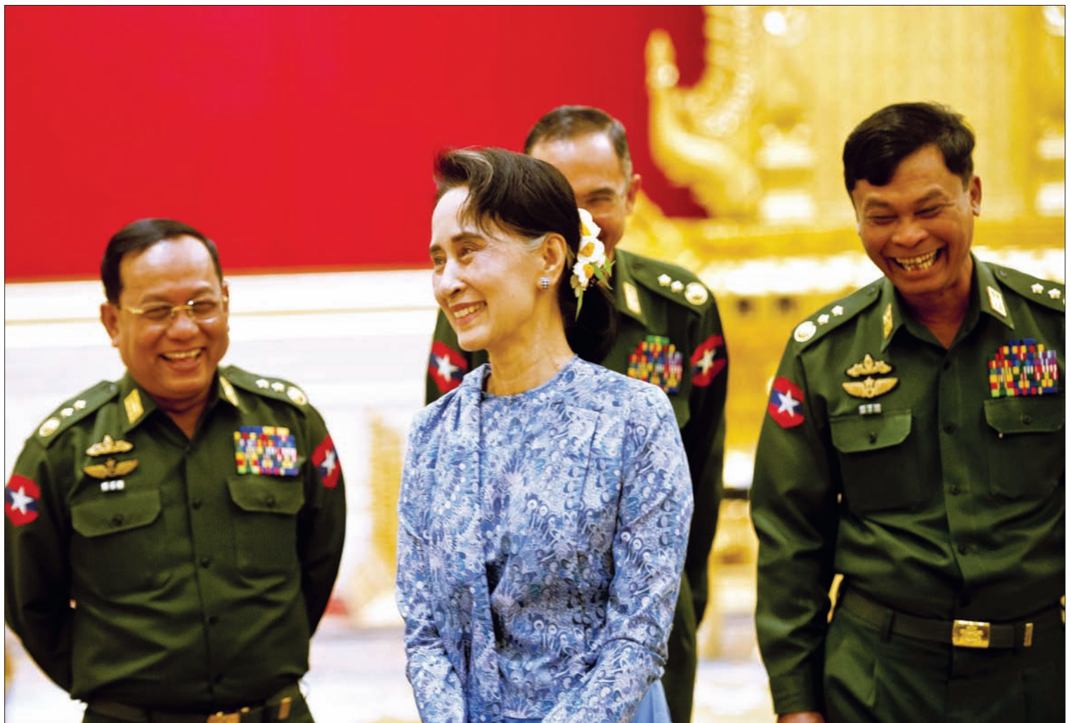
Daw Aung San Suu Kyi smiles with army members during the handover ceremony of Presidency in Nay Pyi Taw on 30 March.

"The bill was drawn up with the aim of ensuring a multi-party