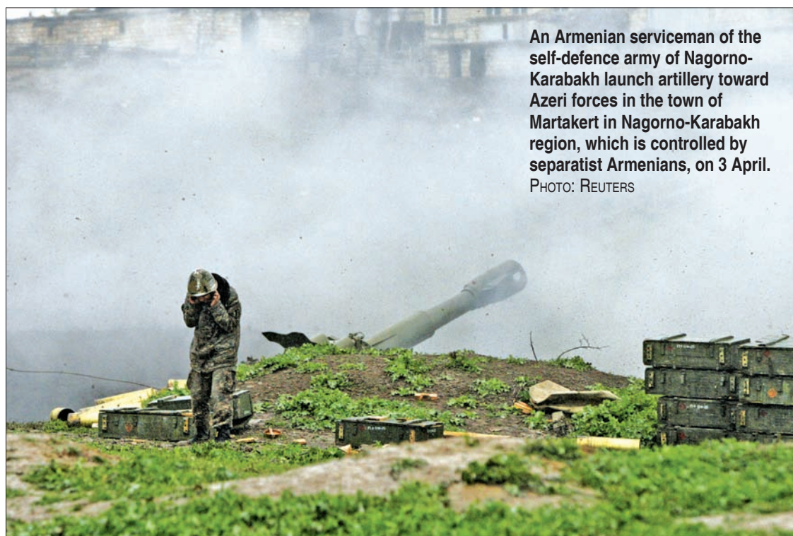
An Armenian serviceman of the self-defence army of Nagorno-Karabakh launch artillery toward Azeri forces in the town of Martakert in Nagorno-Karabakh region, which is controlled by separatist Armenians, on 3 April.

A fragile "cessation of hostilities" truce has held in Syria for over a month as the various parties to the conflict try to negotiate an end to Syria's civil war.—Reuters