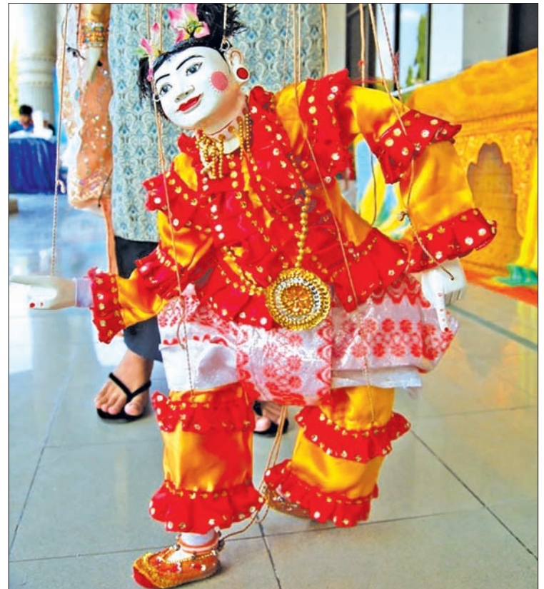
A Myanmar traditional marionette.