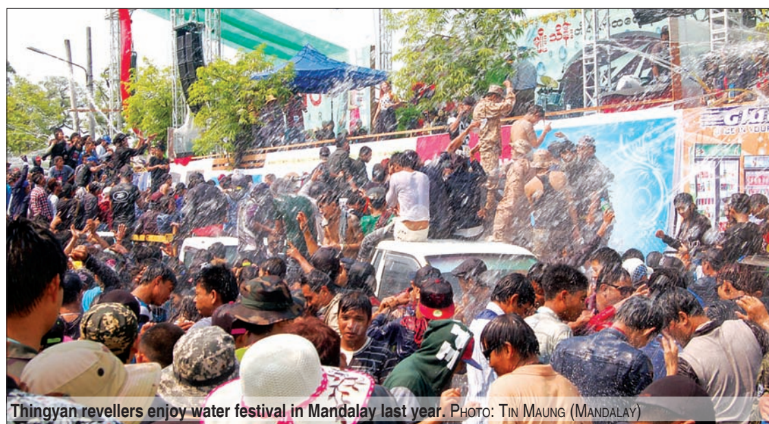
Thingyan revellers enjoy water festival in Mandalay last year.

A TOTAL of 150 water pumps, 75 each for the pavilions set up at the west and north sides of the Mandalay Palace moat, will be allowed during 2016 Maha Thingyan Festival, announced the Mandalay City Development Committee.