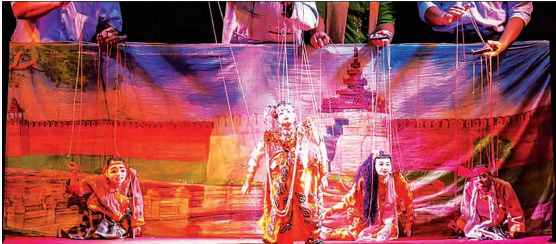
A Myanmar puppet performance in Mandalay.

During the festival, marionette troupes based in Yangon, Indonesia, Mandalay and Thai performed with a Myanmar traditional orchestra. Students entertained the public with Myanmar indigenous puppetry and modern marionettes created by U Ye Dway.— Tin Maung(Mandalay)