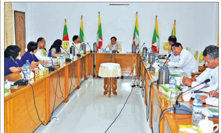
Union Minister for Health Dr Myint Htway holds talk with officials from FDA and the Sports and Physical Education Department.

In meeting with staff of the Sports and Physical Education Department, the minister stressed the need to ensure the fitness of the entire people through community-based and school-based education programmes. He also called for sports lessons to be included in school curricula.— Myanmar News Agency