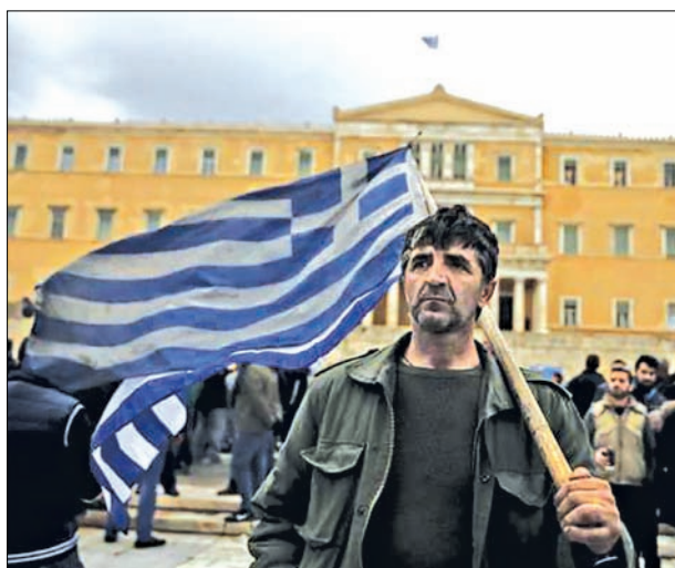
A farmer carries a Greek flag in front of the parliament during a protest against planned pension reforms in Athens, Greece, on 12 February.

EU/IMF lenders are due to resume talks on Greece’s fiscal and reform progress in Athens on Monday, aiming to conclude a bailout review that