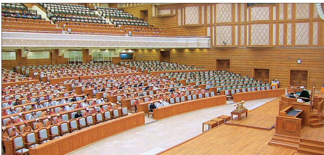
Pyidaungsu Hluttaw is convened in Nay Pyi Taw.

Union Parliament Speaker Mahn Win Khaing Than invited MPs to discuss the president's proposals today if they wish to object to the nominations. —GNLM