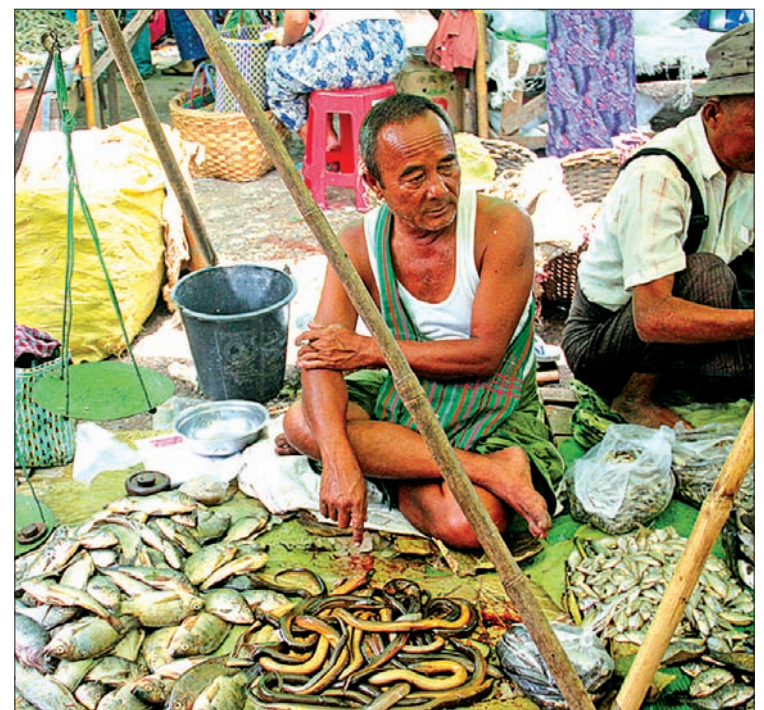
A vendor sells fresh eels and fish at a market in Kalaw, southern Shan State.

Local consumers prefer eels to long-finned eels.—200