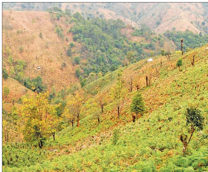
Tea leaves plantation in Shan State.

It has raised worries among tea plantation owners as tea pickers from villages in Mandalay, Magwe and Sagaing Regions have not arrived yet.