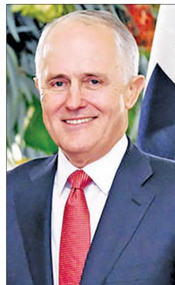
Australian Prime Minister Malcolm Turnbull.

An announcement on a possible double dissolution election is expected by 11 May.—Kyodo News