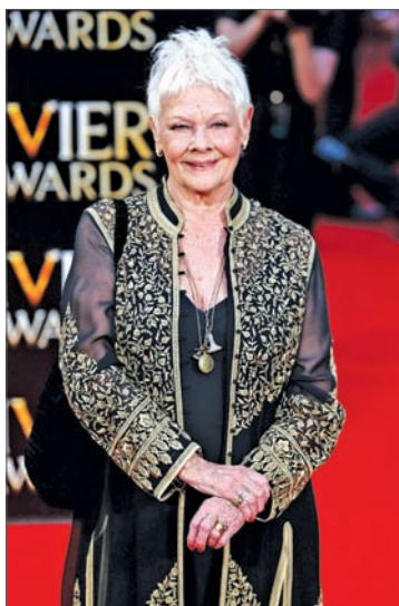
British actress Judi Dench.

“I love this industry so much and to be given an award is fantas-