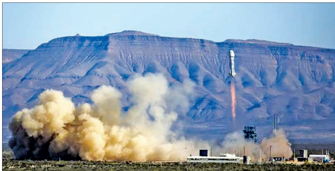
The New Shepard rocket and capsule blasts off in this handout photo provided by Blue Origin, from a launch site in West Texas, on 2 April. PHOTO: REUTERS

The New Shepard rose through clear skies to an apogee of 339,138 feet (103,369 meters), the company said. The engine that powers the pocket restarted at 3,635 feet (1,108 meters) above ground level "and ramped fast for a successful landing," the company said.—Reuters