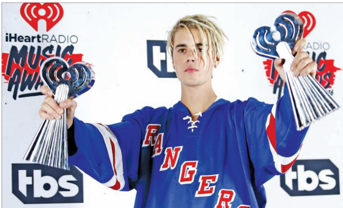
Artist Justin Bieber poses with his Dance Song of The Year Award for “Where Are U Now” and Male Artist of the Year Award backstage at the 2016 iHeartRadio Music Awards in Inglewood, California, on 3 April.

“Hello” from “25” became song of the year, defeating “Can’t Feel My Face” (The Weeknd), “Shut Up and Dance” (Walk The Moon) and “Uptown Funk” by Mark Ronson featuring Bruno Mars.