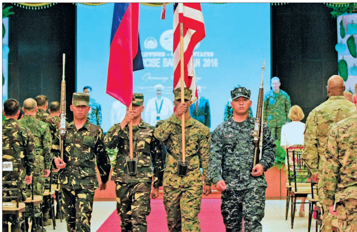
Soldiers carry a Philippine and US flags during the exit of colours, as part of the opening ceremony of the 2016 Balikatan military exercises at the Armed Forces of the Philippines (AFP) headquarters in Camp Aguinaldo, Quezon city, metro Manila on 4 April.

Ash Carter, will be the first US defence secretary to observe the exercises when he arrives next week,